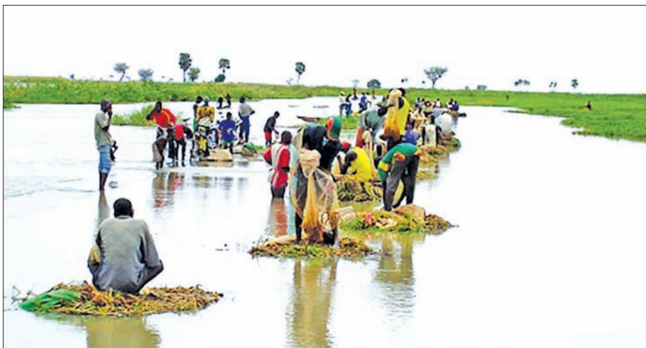
Many Cameroonians who rely on the Logone River for their survival have been forced to flee inland, as rising waters, storms and flooding destroy their homes and fishing boats.

"At least half of the homes in this village [Glaou Bardai] have been taken by