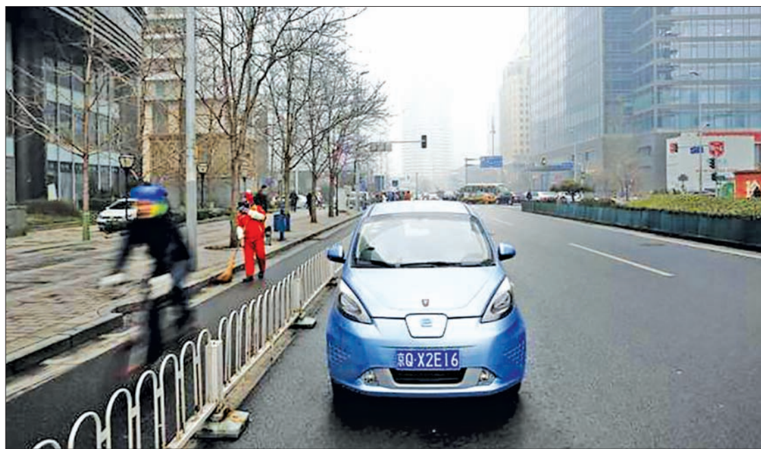
A Roewe E50 electric car is parked next to a street as a bicycle travels past, amid heavy smog, after the city issued its first ever 'red alert' for air pollution in Beijing, on 9 December.

BEIJING — The heavy smog shrouding Beijing is proving to be a boon for China's nascent electric car market, with some dealers saying inquiries about all-electric models are up by almost a tenth.