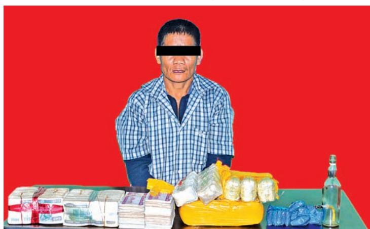
Yabba pills seized by police in Lashio on 6 December.

POLICE have recently seized Yabba pills (synthetic amphetamine based stimulants) and cash in Lashio and Loilin in Shan State and Thakayta Township in Yangon Region.