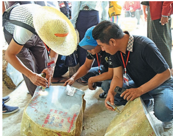
Merchants evaluate jade stones at Myanmar Jade Fair at the Maniyadana Emporium in Nay Pyi Taw.

A total of 1750 jade lots and 1576 jade lots will be sold through tender system on 12 and 13 December.— Myanma News Agency