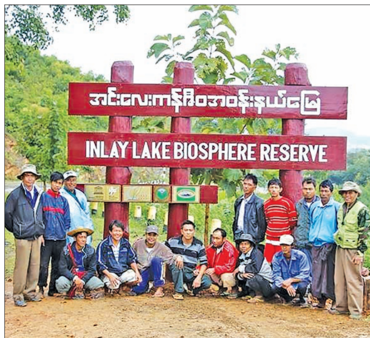
Environmentalists pose for photo at Inle Lake Biosphere Reserve in Nyaungshwe Township.