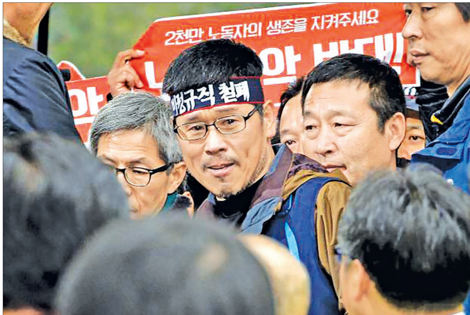
Han Sang-gyun, the head of the Korean Confederation of Trade Unions (KCTU), reacts before surrendering voluntarily to the police at Jogye temple in Seoul, South Korea, on 10 December.

SEOUL — The head of one of South Korea's two main labour groups turned himself over to police yesterday after holing up inside a Buddhist temple for nearly four weeks to evade arrest for organising a violent anti-government protest last month.