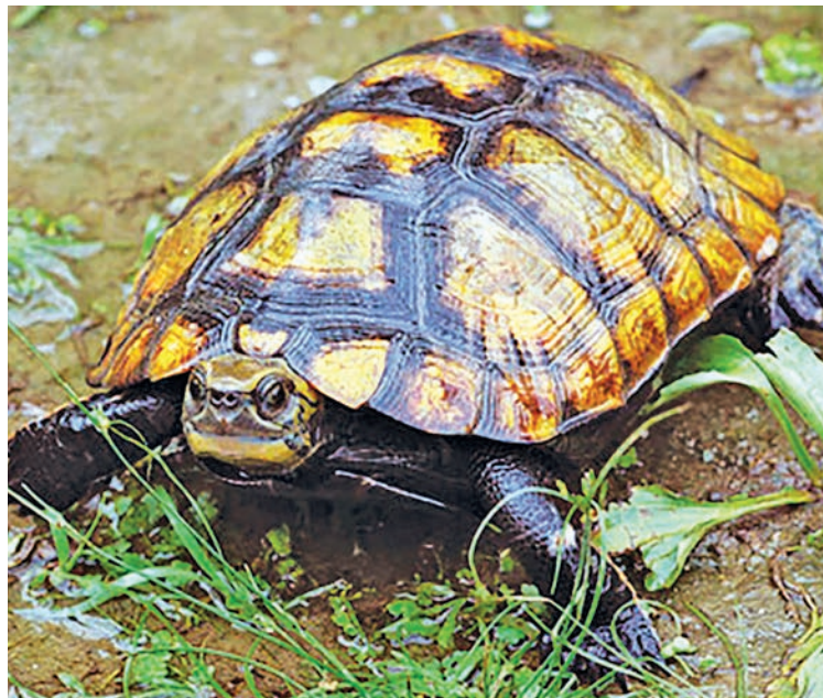
"Nihon ishigame" a Japanese pond turtle.

TOKYO — Exports of Japanese pond turtles have been increasing sharply since early this year, prompting the government to impose partial restrictions to conserve the species.