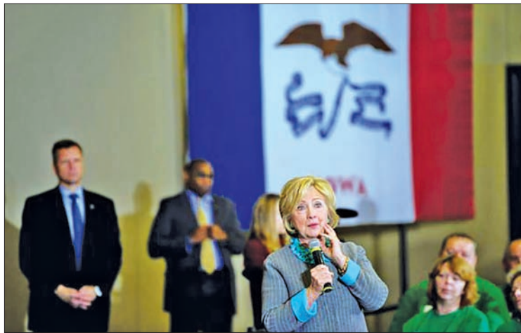
US Democratic presidential candidate Hillary Clinton speaks during a town hall in Waterloo, Iowa on 9 December.

WATERLOO — US Democratic presidential candidate Hillary Clinton detailed plans on Wednesday to crack down on companies that shift profits overseas, a practice known as earnings stripping.