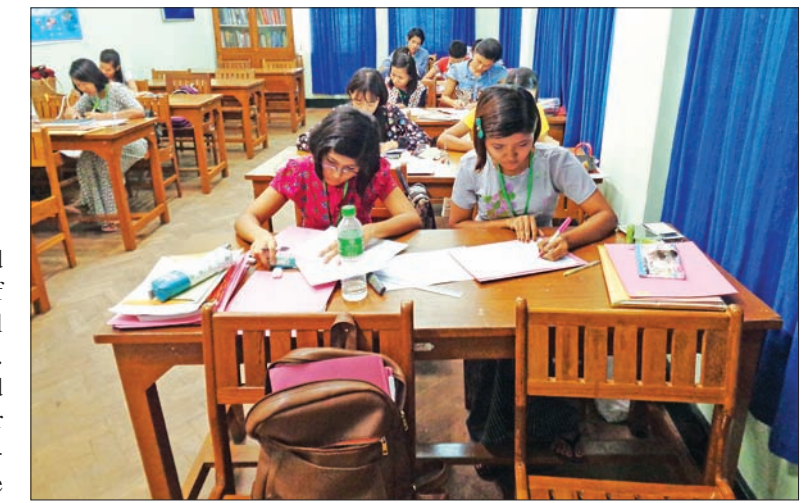
Students at CVT's learning centre.

Although primary schooling itself is free of charge in Myanmar, the associated costs of daily