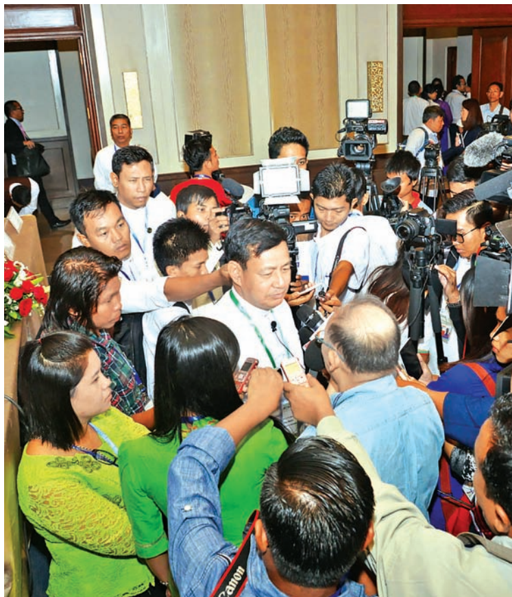
Union Minister U Ye Htut being interviewed by journalists at media conference.