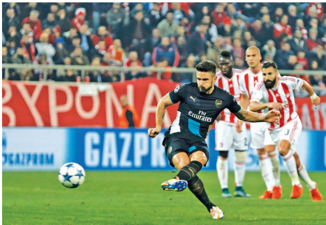
Olivier Giroud shoots to score a penalty kick goal for Arsenal during UEFA Champions League Group Stage, Group F at Georgios Karaiskakis Stadium, Piraeus, Greece, on 9 December.

the team as we had to be right on the mental and tactical side."