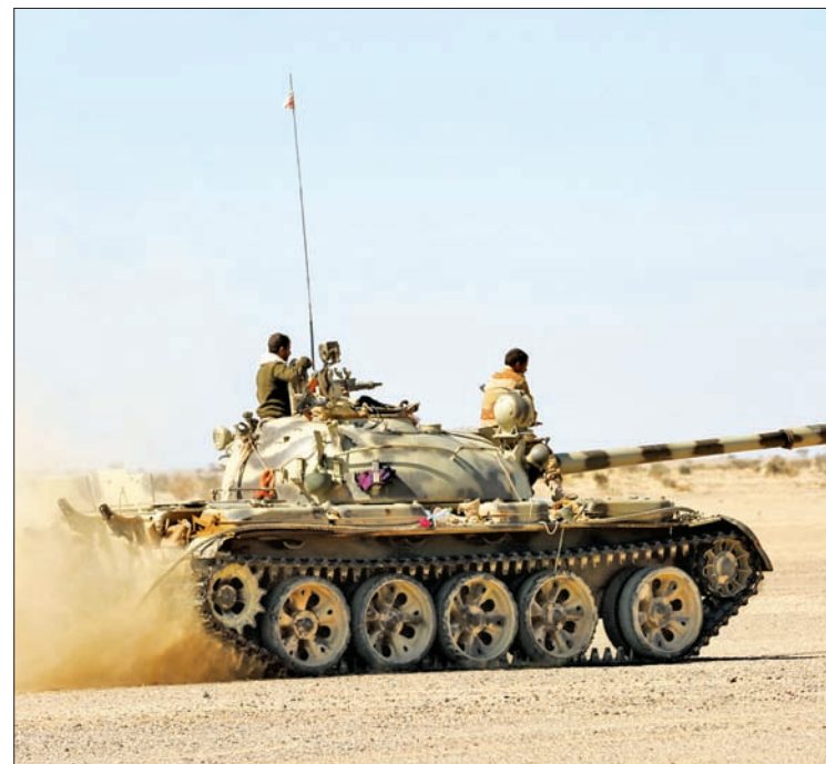
A tank operated by government army moves to shell Houthi positions in al-Labanat area between Yemen's northern provinces of al-Jawf and Marib, on 5 December.

Hadi's embattled government is based in Aden but has struggled to impose its authority there since its forces, backed by Gulf Arab troops, expelled the Houthi fighters from the city. — Reuters