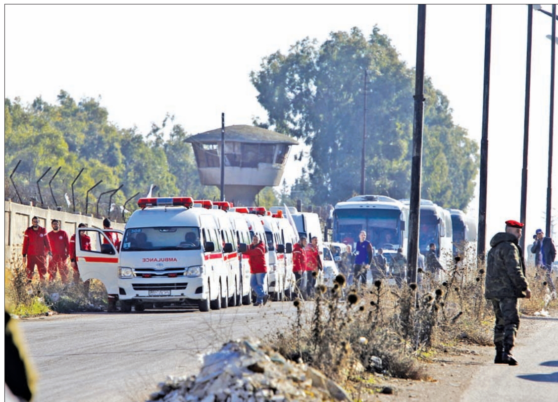
Syrian Red Crescent units wait in the district of Waer during a truce between the government and rebel fighters, in Homs, on 9 December.

Neither Israeli nor Egyptian officials would comment on the identity of the Egyptian prisoners.—Reuters