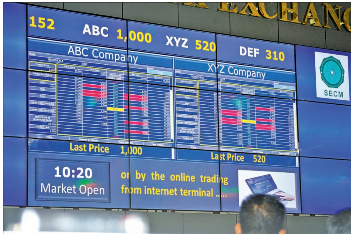
Yangon Stock Exchange opened on Wednesday at the corner of Merchant Street and Sule Pagoda Road in downtown Yangon.

Stock exchange course providers will be scrutinised by SECM to ensure they adhere to a set of prescribed