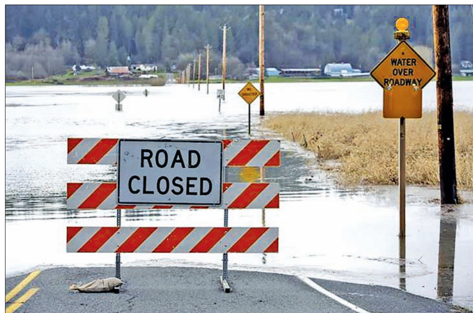
A road closed sign is pictured as flood waters of the Snoqualmie River cover NE 80th Street during a storm in Carnation, Washington on 9 December.

National Weather Service meteorologist Gerald Macke said he could not definitively say whether the parade of storms was linked to