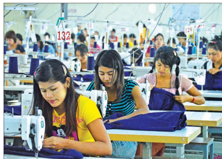
Garment factory workers in an industrial zone in Yangon.

UK-based Oxfam is a global confederation of 17 organisations and works in more than 90 countries to address issues such as poverty alleviation. Its report was produced in cooperation with labour groups in Myanmar.