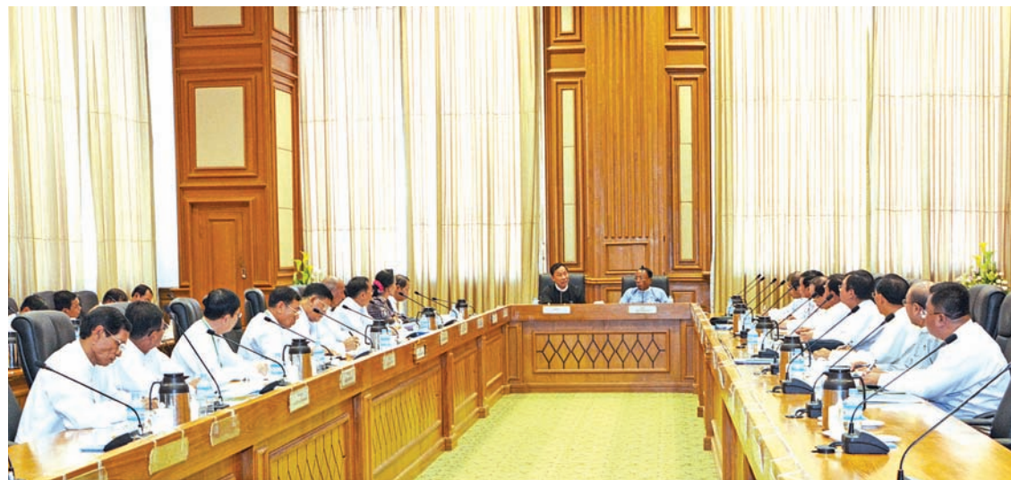
Pyidaungsu Hluttaw Speaker Thura U Shwe Mann presides over meeting of Myanmar Parliamentary Union.

THE meeting of the Myanmar Parliamentary Union was held at the Hluttaw Building in Nay Pyi Taw on Thursday.