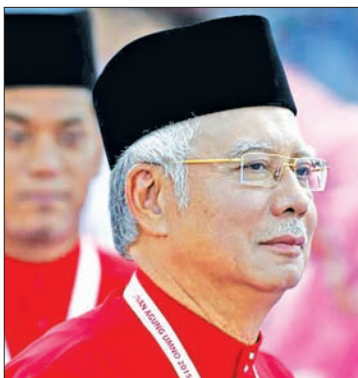
Malaysia's Prime Minister Najib.

The scandals have shaken investors in Southeast Asia's third-biggest economy and rocked public confidence in the coalition