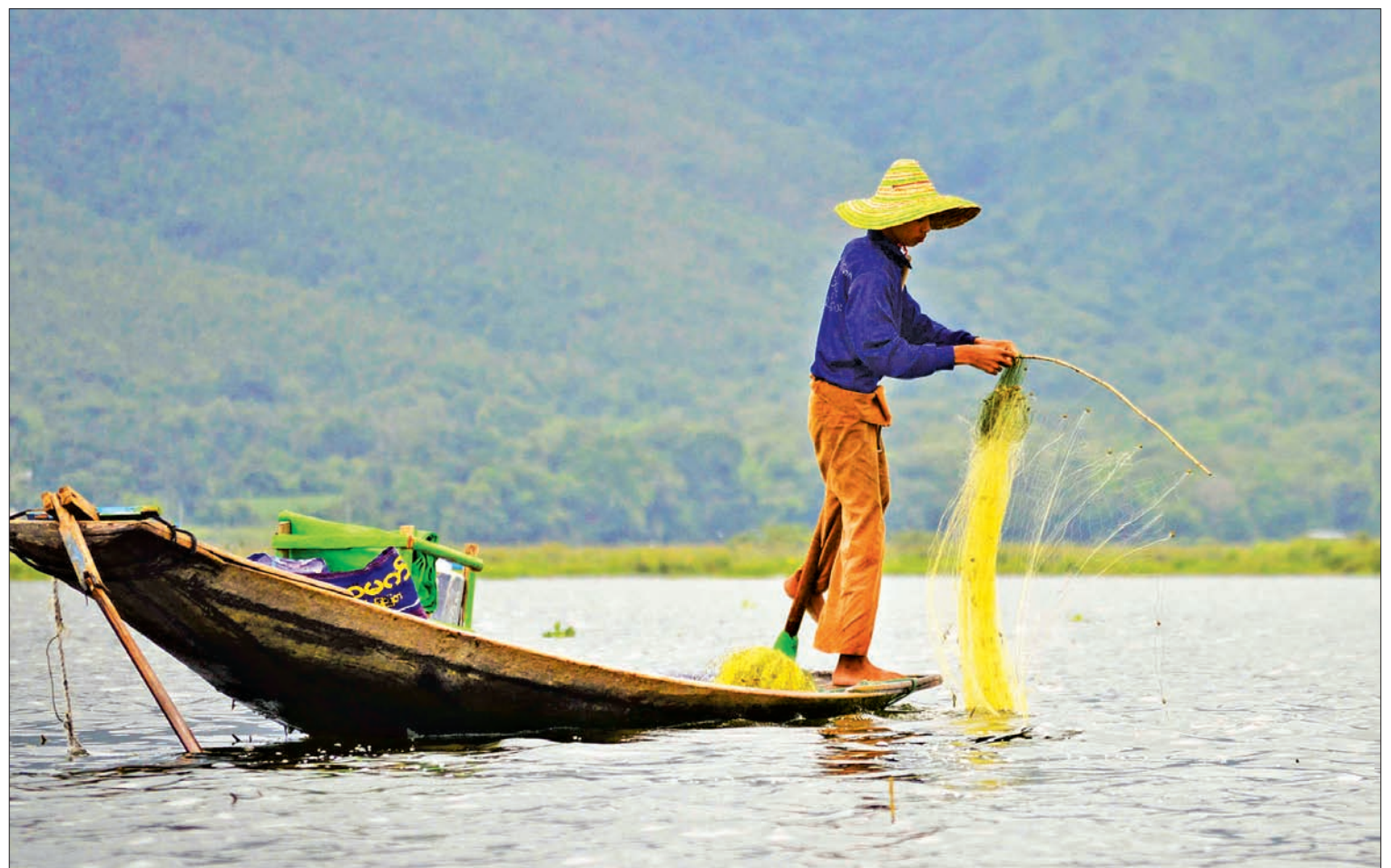
A fisherman prepares his fishing net while rowing with his leg on Inle Lake, which has been named Myanmar's first UNESCO Biosphere Reserve, in Nyaungshwe Township, Shan State.