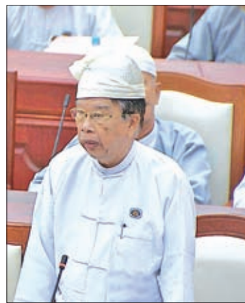
U Myint Swe.