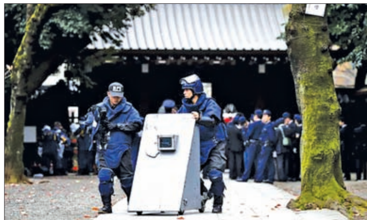
Members of a police bomb disposal squad move a blast protection device near the site of an explosion at the Yasukuni shrine in Tokyo, on 23 November.

TOKYO — A South Korean man was arrested yesterday in connection with a blast last month at Tokyo’s Yasukuni Shrine for war dead, an official at Tokyo’s Metropolitan Police Department said.