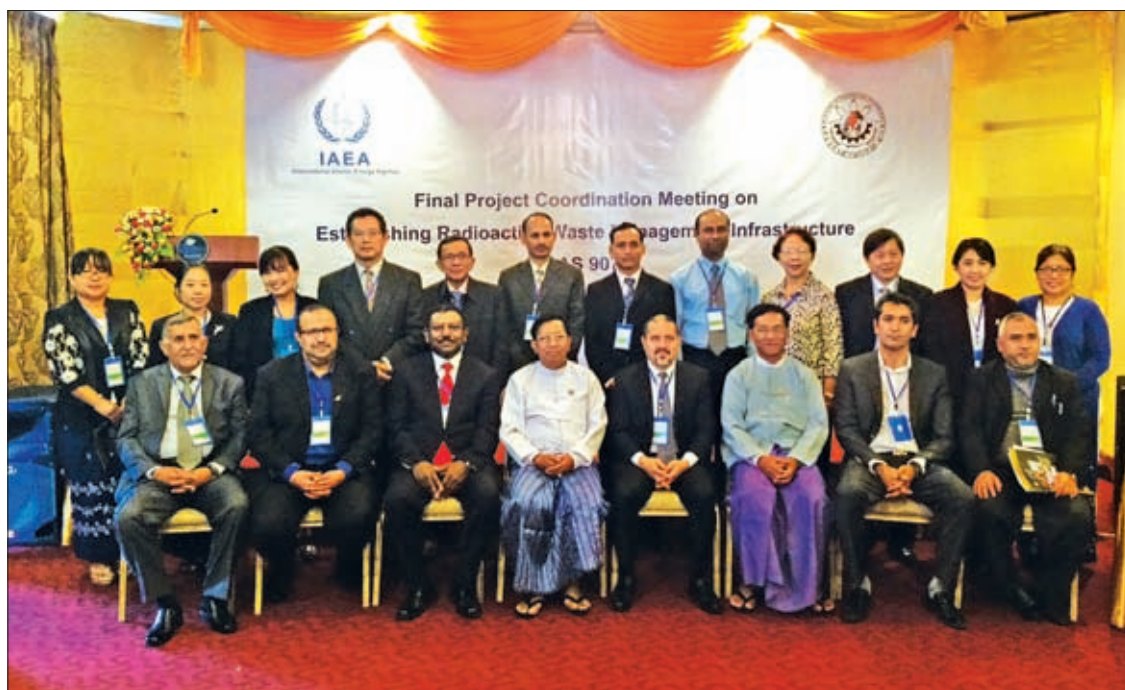
Deputy Minister for Science and Technology Dr Aung Kyaw Myat and dignitaries pose for photo at opening of a Meeting on Establishing Radioactive Waste Management Infrastructure.

THE Ministry of Science and Technology and IAEA are jointly holding a meeting on Establishing Radioactive Waste Management infrastructure in Nay Pyi Taw.