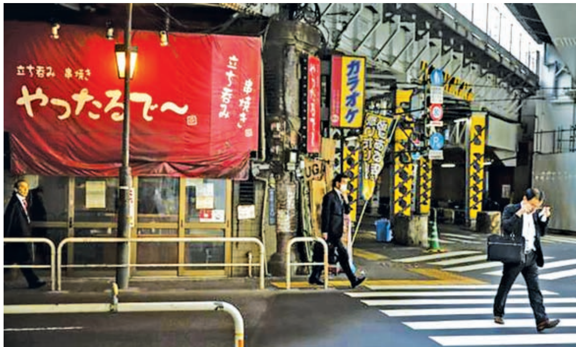
Office workers walk along a street at the fringes of a business district in Tokyo, on 30 October.

By 2040, the greying of the population could shrink the number of working-age adults by more than 15 percent in South Korea and more than 10 percent in China, Thailand and