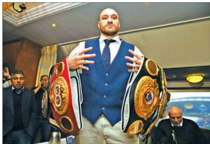
Tyson Fury poses with his belts. PHOTO: REUTERS

The win earned Fury three versions of the heavyweight crown — the WBA, WBO and IBF — with American Deontay Wilder holding the WBC belt.—Reuters