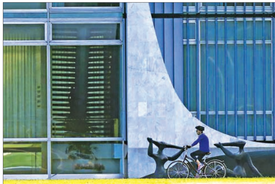
Brazil's President Dilma Rousseff rides her bicycle outside the Alvorada Palace in Brasilia, Brazil, on 8 December.

Rousseff's supporters in Congress appealed to the Supreme Court in protest of the voting procedure. Several newspapers reported near midnight local time that a Supreme Court justice had suspended im-