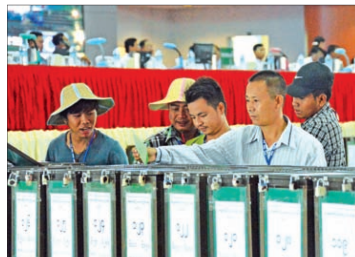
Jade merchants put tender tickets in the boxes.

OUT of 152 raw jade lots displayed at sales of raw and cut jade in Nay Pyi Taw yesterday, 75 lots with a total combined value of K 1.6 billion were sold out through the tender system.