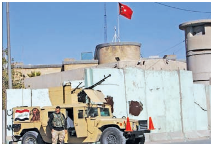
Iraqi security forces stand guard with their military vehicle outside the Turkish embassy in Baghdad, on 8 December.

UNITED NATIONS— Iraq's ambassador to the United Nations on Tuesday appeared to play down a dispute between Baghdad and Ankara over the deployment of Turkish troops in northern Iraq, saying bilateral talks between the neighbouring states to end the row were proceeding favourably.