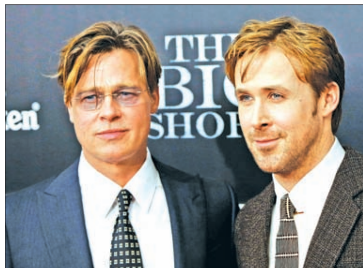
Cast members Brad Pitt and Ryan Gosling pose on the red carpet at the premiere of ‘The Big Short’ in New York on 23 November.

“It doesn’t mean they are not beautiful, they’re not human beings, or that they shouldn’t be able to use the bathroom when they go to the mall.”— Reuters