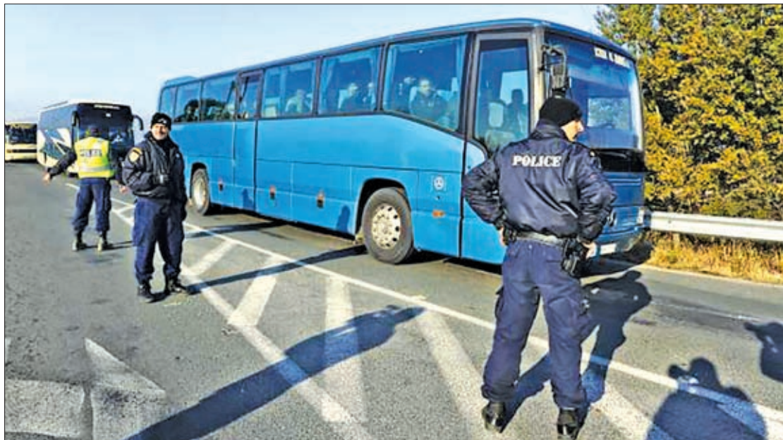
Greek police officers direct buses carrying hundreds of migrants, who were stranded on the Greek-Macedonian border and blocked rail traffic, after a police operation near the village of Idomeni, Greece, on 9 December.

IDOMENI — Greek police yesterday loaded hundreds of migrants who have been stranded for three weeks at the Macedonian border onto buses bound for Athens, a police official and a Reuters witness said, ending their hopes of reaching northern Europe.