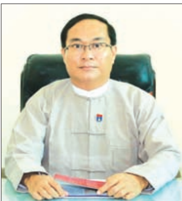
Director-General U Min Htut hints at the introduction of VAT system.

The government has seen an increase in revenue, receiving more than K1,500 billion in the 2012-2013 FY to more than K2,700 billion in the 2013-2014 FY, more than K3,580 billion in the 2012-2015 FY and more than K 4,410 billion in the 2014-2015 FY. The government has set a