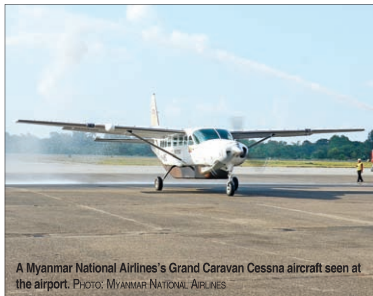
A Myanmar National Airlines's Grand Caravan Cessna aircraft seen at the airport.

Yangon Region chief minister attends human rights event PAGE 9