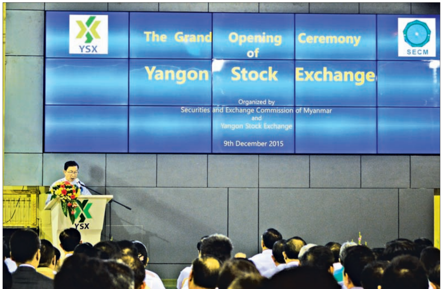
Myanmar's first-ever stock exchange market is launched yesterday at the Yangon Stock Exchange building in downtown Yangon.

According to the deputy minister, Kanbawza Bank Ltd, which is among 10 securities companies selected to act as players in the