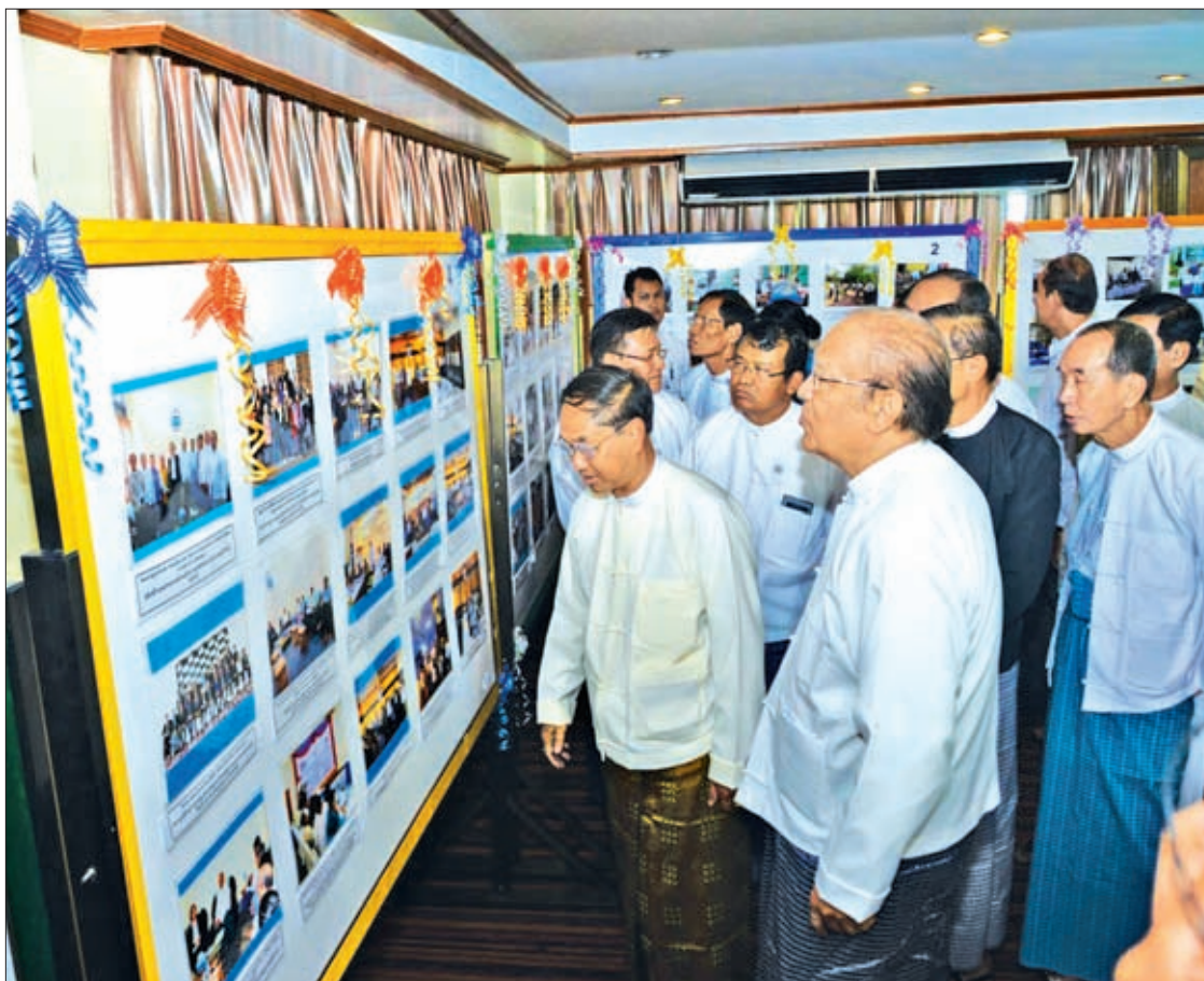
Yangon Region Chief Minister U Myint Swe and dignitaries visit booth set up to mark International Human Rights Day in Yangon.

After the ceremony the chief minister presented prizes to winners of essay competitions commemorating the event.— Myanma News Agency