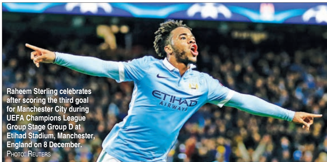
Raheem Sterling celebrates after scoring the third goal for Manchester City during UEFA Champions League Group Stage Group D at Etihad Stadium, Manchester, England on 8 December.

Gladbach, in confident mood after inflicting Bayern Munich's first Bundesliga defeat of the season at the weekend, then took command with their slick-passing style and were 2-1 up by halftime.