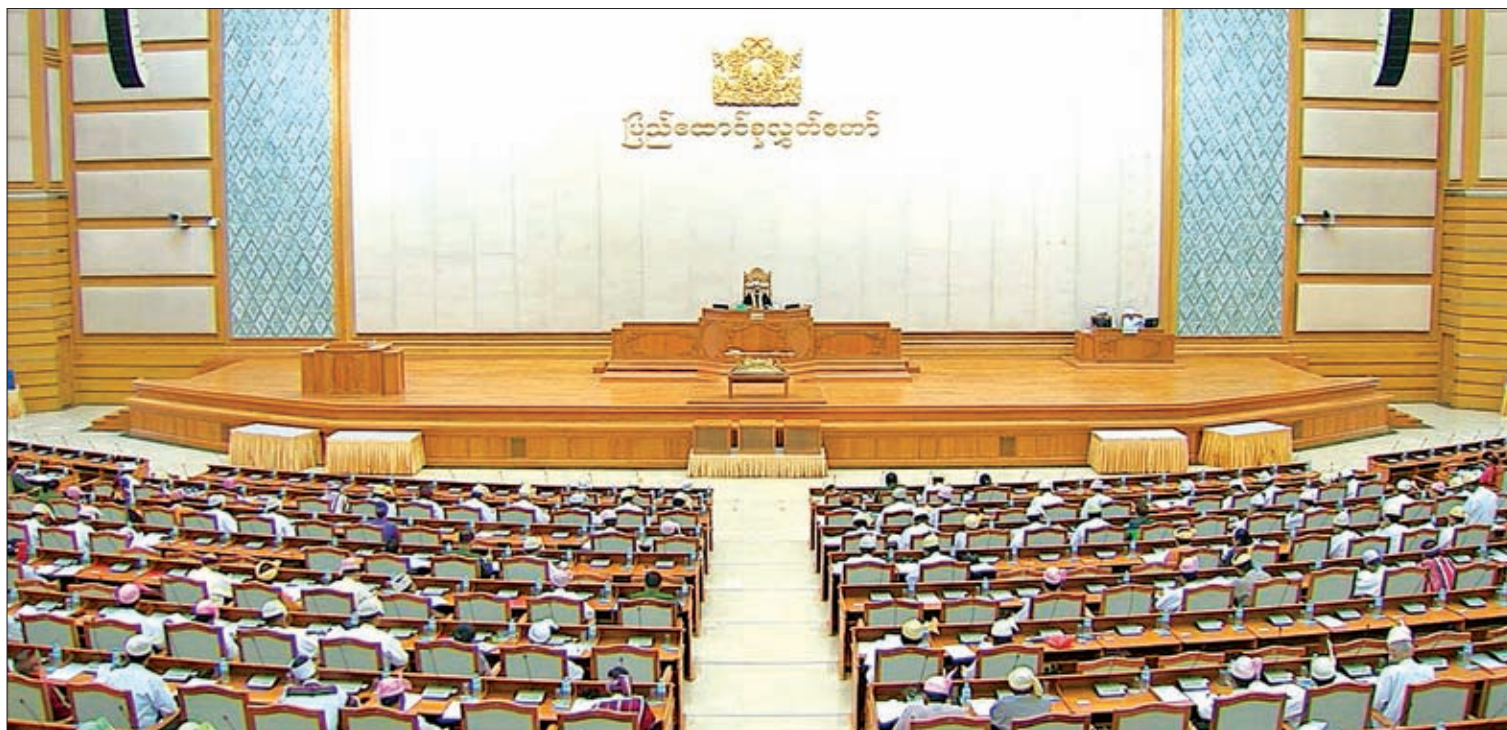
Pyidaungsu Hluttaw being convened in Nay Pyi Taw.

The Union supplementary budget amendment bill of 2015-16 received parliamentary approval, following a clause-by-clause discussion. — Myanmar News Agency