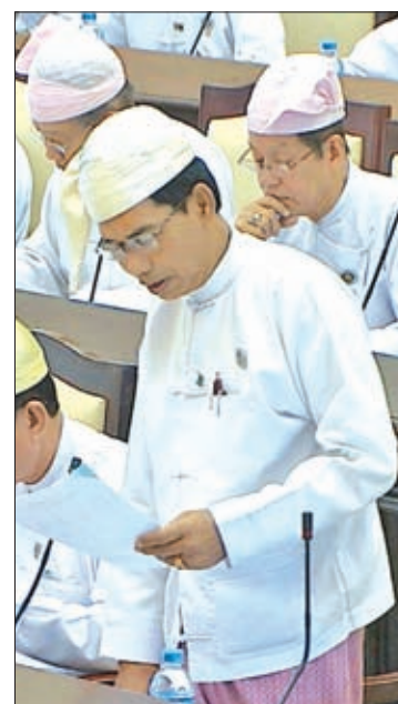
U Khin Maung Yi.

The Amyotha Hluttaw speaker sought parliamentary approval of the Myanmar Veterinary Council amendment bill, following the clause-by-clause amendment by the chairman of the Bill Committee. — Myanmar News Agency