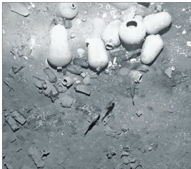
Artifacts found in the wreckage of Spanish galleon San Jose are seen in this undated handout photo provided by the Colombian Ministry of Culture on 5 December, 2015.

BOGOTA — The 307-year-old remains of a sunken Spanish galleon found off Colombia's Caribbean coast are the heritage of Colombians, President Juan Manuel Santos said on Tuesday, after Spanish officials expressed interest in the artifacts.