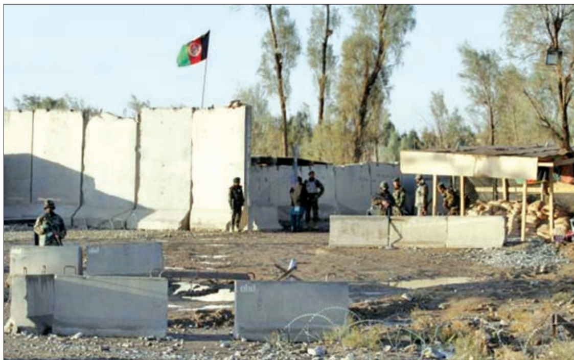
Afghan security forces stand guard at the entrance gate of Kandahar Airport where, the Taliban attacked on late Tuesday, in Kandahar, Afghanistan, on 9 December.

The raid in one of the Taliban’s traditional strongholds coincided with the start of the Heart of Asia regional security conference in Islamabad, where Afghan Presi-