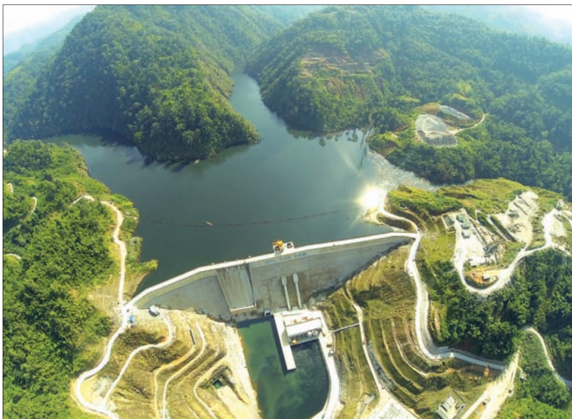
The aerial view of Upper Paunglaung hydroelectric power project in Nay Pyi Taw council area, Pyinmana township.

THE Ministry of Electric Power yesterday launched a hydropower station at the Upper Paunglaung hydroelectric power project in Nay Pyi Taw council area, Pyinmana township. President U Thein Sein officially opened the station.