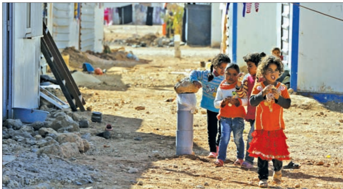
Syrian refugee children play near their families residence at Al Zaatari refugee camp, in the Jordanian city of Mafraq, near the border with Syria, on 29 November.

an relief officials attributed the sudden rise in refugees at the border to Russian bombing of IS-controlled areas in eastern Homs, such as Palmyra, as well as in Raqqa Province and city.