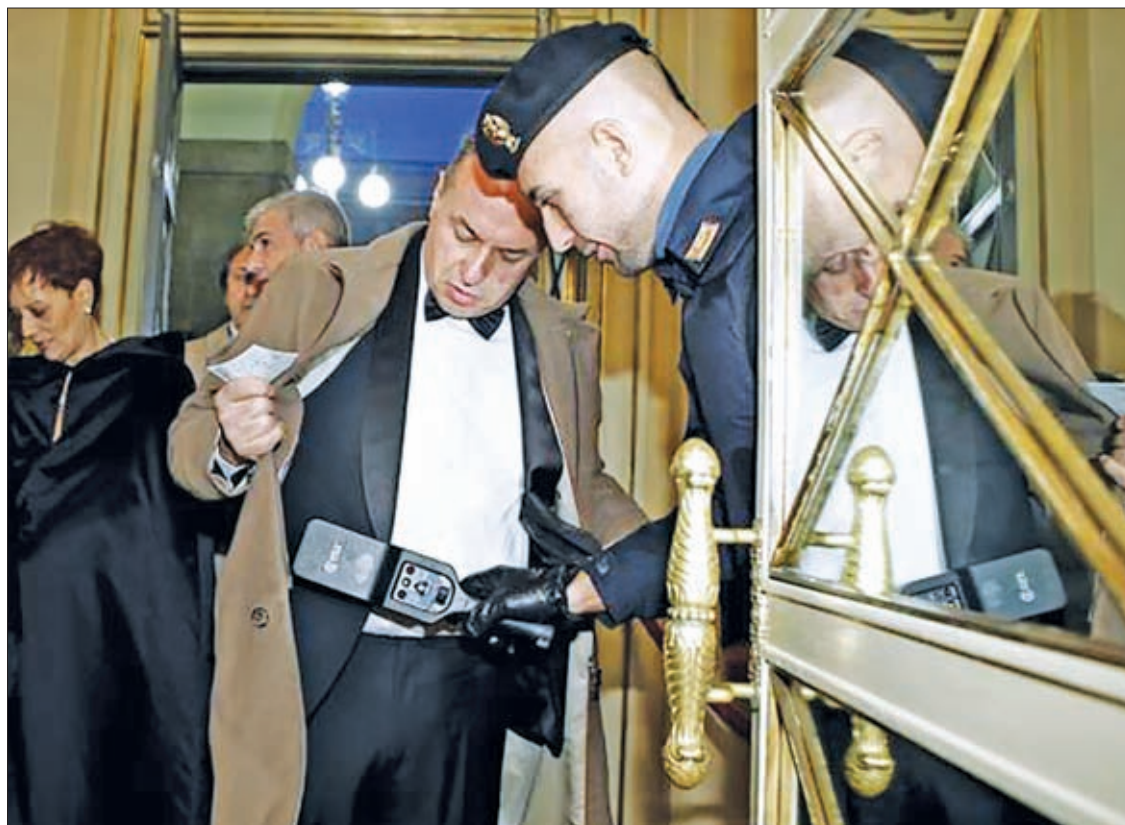
Italian police officers conduct a security check inside Milan's La Scala opera house before the opening of the 2015-16 opera season with Verdi's Joan of Arc, on 7 December, 2015.