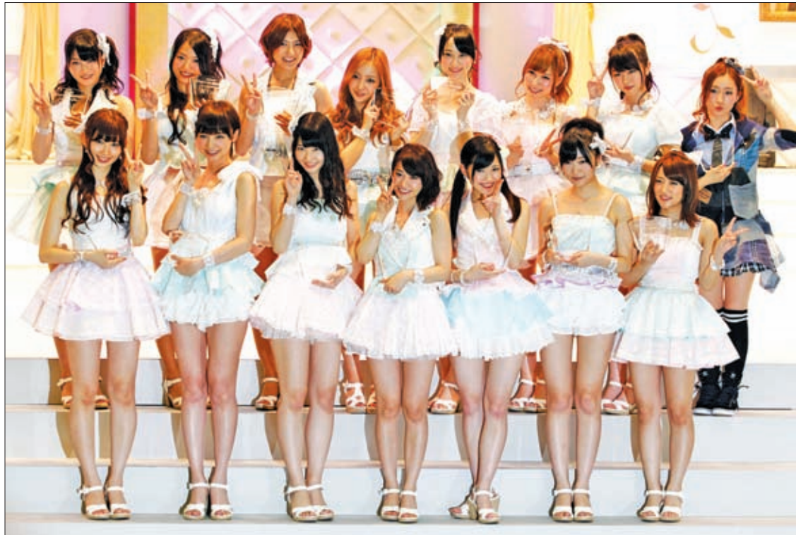
Members of the Japanese all-girl pop group AKB48.

TOKYO — The Japanese all-girl pop group AKB48 marked its 10 th anniversary Tuesday with a concert at its home theater, where at their initial performance in 2005 they only had an audience of seven people, celebrating with fans the long way they have come after debuting under the concept of “idols you can go meet.”