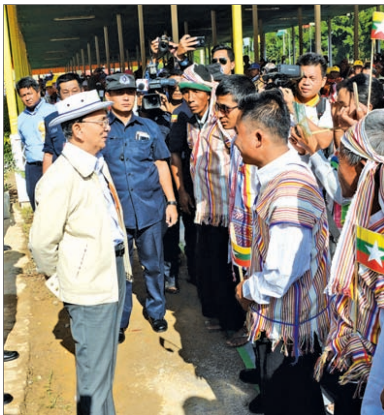
President U Thein Sein cordially greets local people who attend opening of a hydropower station at the Upper Paunglaung hydroelectric power project.