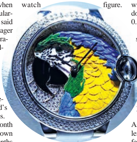
The "Ballon Bleu" watch model by Cartier is pictured during an exhibition in Geneva, Switzerland.

privately owned and at LVMH, watch and jewelry sales rose 10 percent during the first nine months but it does not give a separate watch figure.