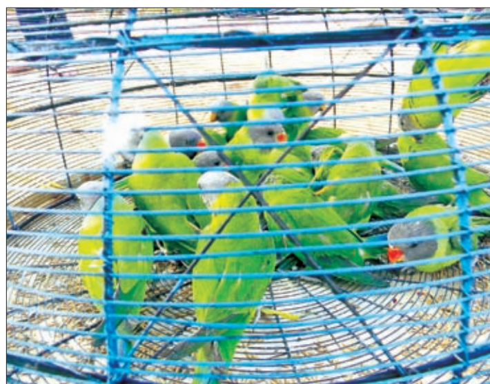
Parrots are seen at a recreation place in PyinOoLwin.

FARMERS in Shan State (North) have begun earning extra income by capturing and selling parrots as part of the celebrations of the rice harvest season.