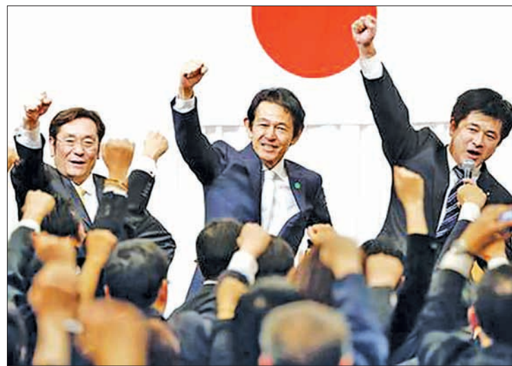
Yorihiisa Matsuno (C) and other officials of the opposition Japan Innovation Party raise their fists at an extraordinary party convention in Tokyo on 6 December 2015, after Matsuno was re-elected as party leader.

Matsuno, who previously belonged to the DPJ, is set to hold talks with DPJ leader Katsuya Okada on Monday, with a view to agreeing on forming a parliamentary group by the end of this year to bolster their cooperation in challenging the ruling Liberal Democratic Party led by Prime Minister Shinzo Abe in the upper house election.