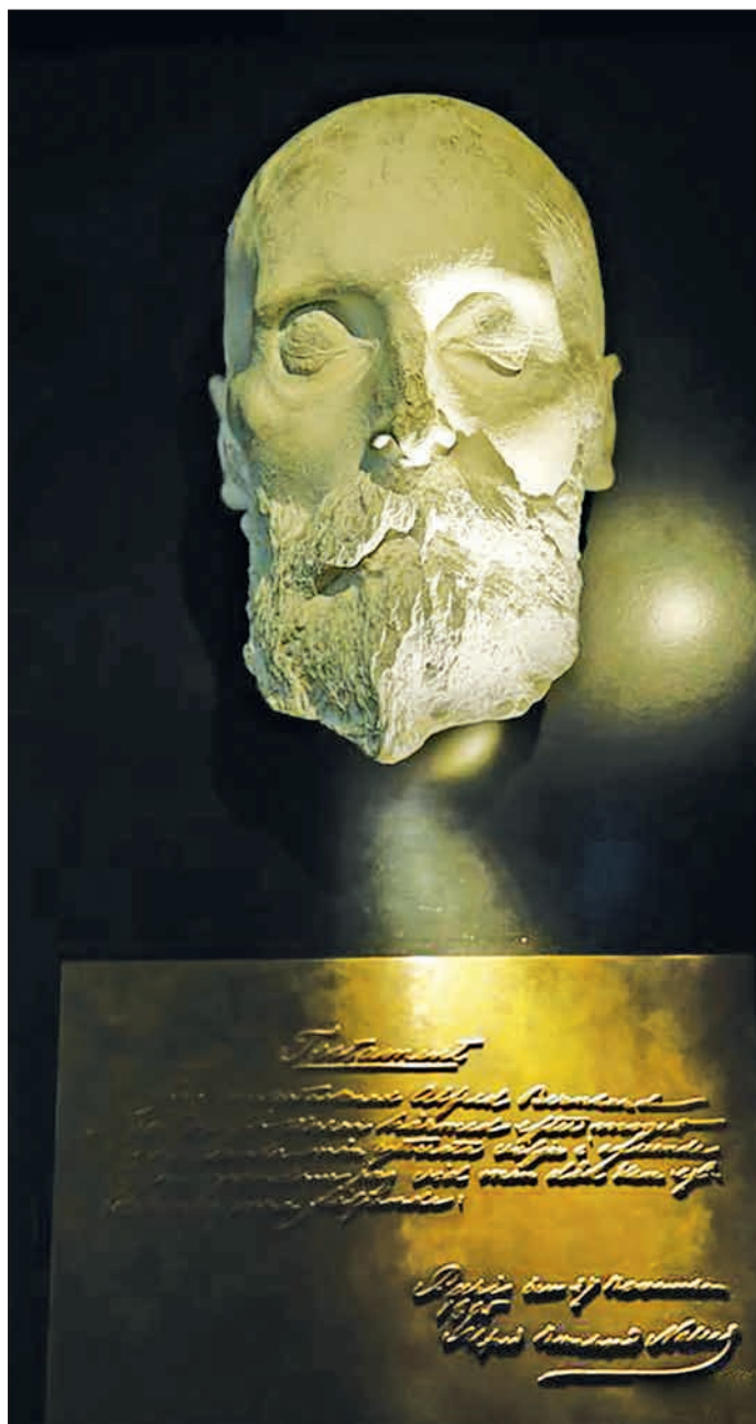
A statue of Alfred Nobel at Nobel museum in downtown Stockholm, capital of Sweden. The 2015 Nobel Prize awarding ceremony will be held here on 10 December 2015.