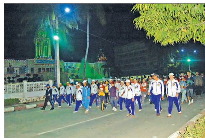
Mass walk of people participating in December sports months.

More than 13,380 people participated in the activity which would be held every Saturday in December. After the mass walk, the participants did physical exercises collectively.—Tin Maung (Mandalay)