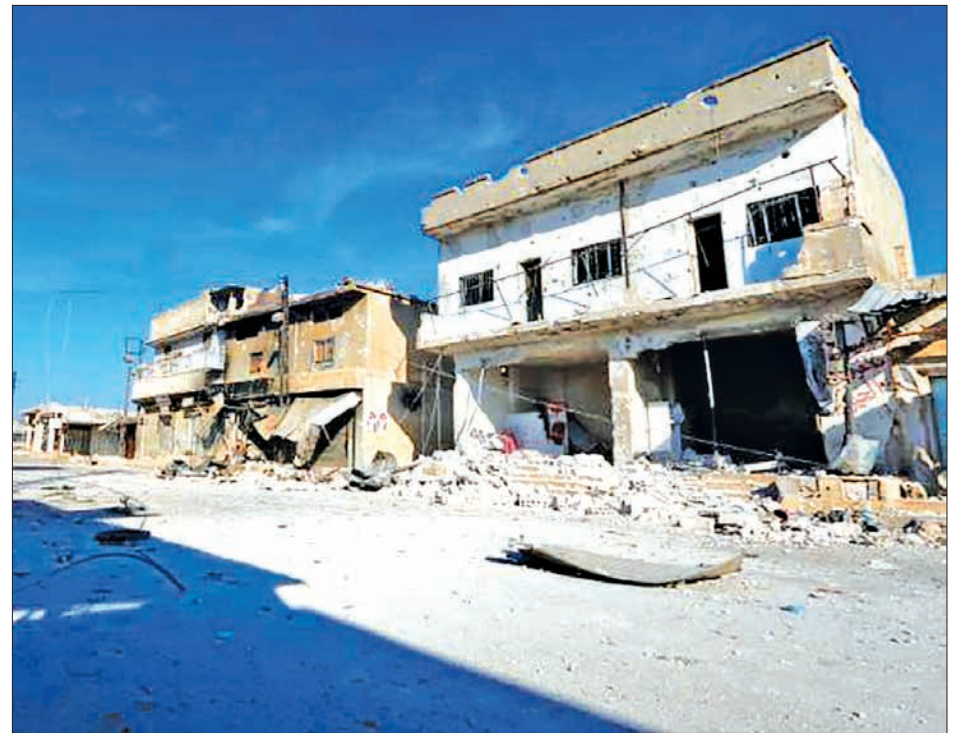
A general view shows a deserted street in the rebel-controlled area where forces loyal to Syria's President Bashar al-Assad carry out offensives to take control of the town of Kafr Nabudah, in Hama Province, Syria, on 11 October 2015.

"There is no benefit to tensions mounting up in the region. We must not take the side of either party, and have a duty to reduce tensions between these two countries," he said.—Reuters