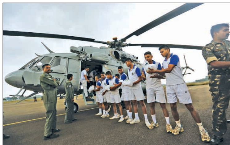
Indian soldiers load food items onto an Indian Air Force (IAF) chopper for an air-drop in flood affected areas at Tambaram air force station in Chennai, India, on 4 December 2015.

CHENNAI — One of India’s most powerful politicians, a former movie star called “Amma” or “Mother” by her followers, is being heckled and abused for going missing in action after floods swept the capital of the southern state of Tamil Nadu, which she rules.