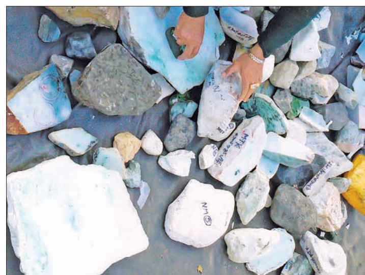
An officer inspects illegal jade stones seized from a car.