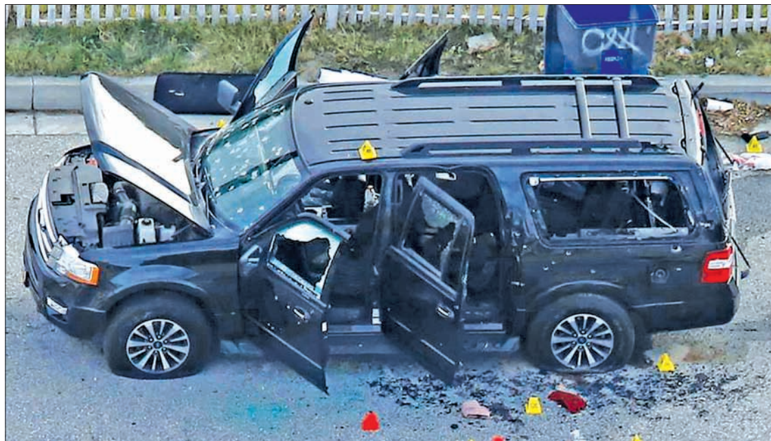
The remains of a SUV involved in the Wednesday attack is shown in San Bernardino, California, on 3 December 2015.