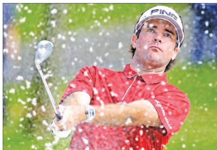
Bubba Watson during the second round of the WGC-HSBC Champions golf tournament in Shanghai, China, on 6 November.

In the field as an alternate after Australian Jason Day with-