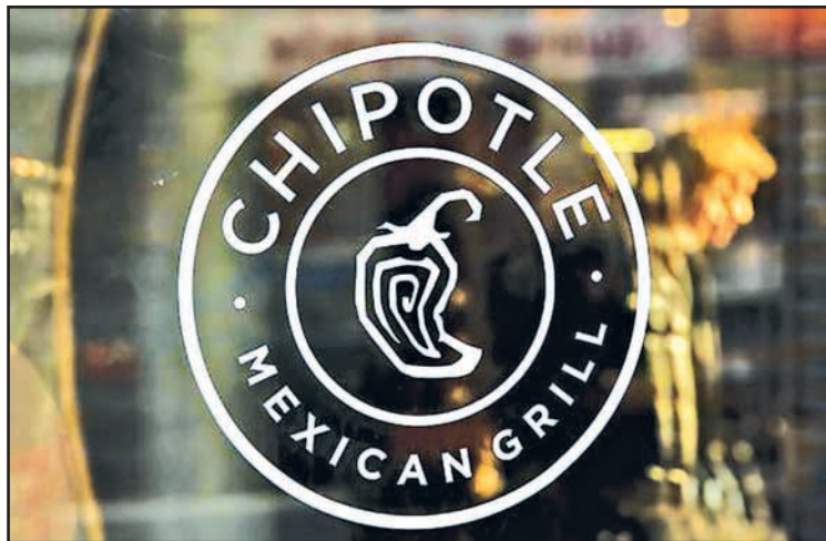
A logo of Chipotle Mexican Grill is seen on a store entrance in Manhattan, New York on 23 November 2015.

An estimated 48 million Americans get sick each year from foodborne diseases. Of these, 128,000 are hospitalised and 3,000 die, according to the CDC. Only about 40 percent of reported foodborne disease outbreaks from 2002 to 2011 were solved, according to the watchdog group Centre for Science in the Public Interest.—Reuters