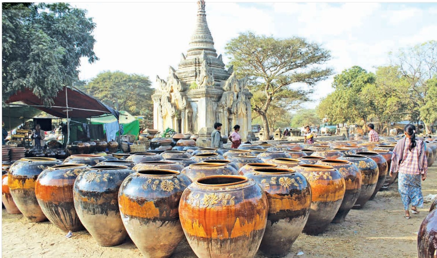
Glazed ware sold at pagoda festival in Bagan.

Famous ceramic pots from Shwebo Township, Sagaing Region, were also sold at the festival. The prices of large pots varied from K17,000 to K19,000. Small-