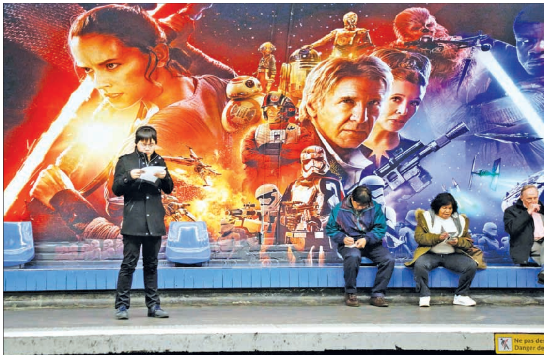
People wait into a metro station decorated with Star Wars characters to promote the upcoming film 'Star Wars: The Force Awakens' in Paris, France, on 1 December 2015.

Lucas bowed out of "Star Wars" after he sold his film studio