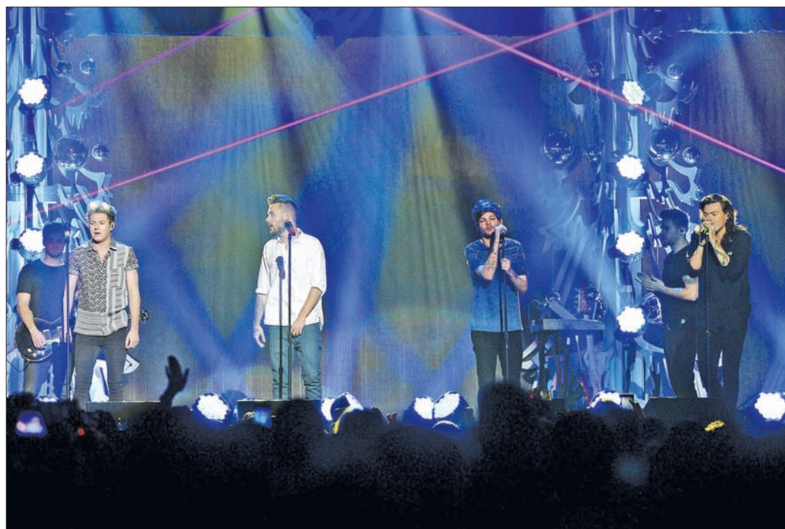
Harry Styles, Louis Tomlinson, Liam Payne, and Niall Horan of the band "One Direction" perform during the KIIS FM's iHeartRadio Jingle Ball 2015 concert at Staples Centre in Los Angeles.

LOS ANGELES — One Direction performed their last concert in the US before going on an extended hiatus and the boy band got emotional as they took their final bow in front of their fans here.