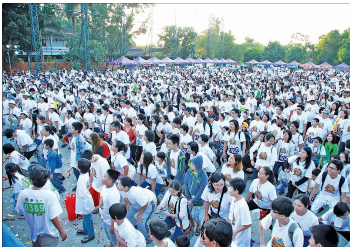
People participating at first 3D Walk at People's Park one Saturday.

The registration fees were donated to Yankin Children Hospital at the event. "Last year we donated all the proceeds we collected from the event to charity and we have done the same this year. The registration fee for this year was 2,500 Kyats for one form and each form accommodated registration spot for 2-3 people since this is a group and family activity. From that, we were able to raise a total of