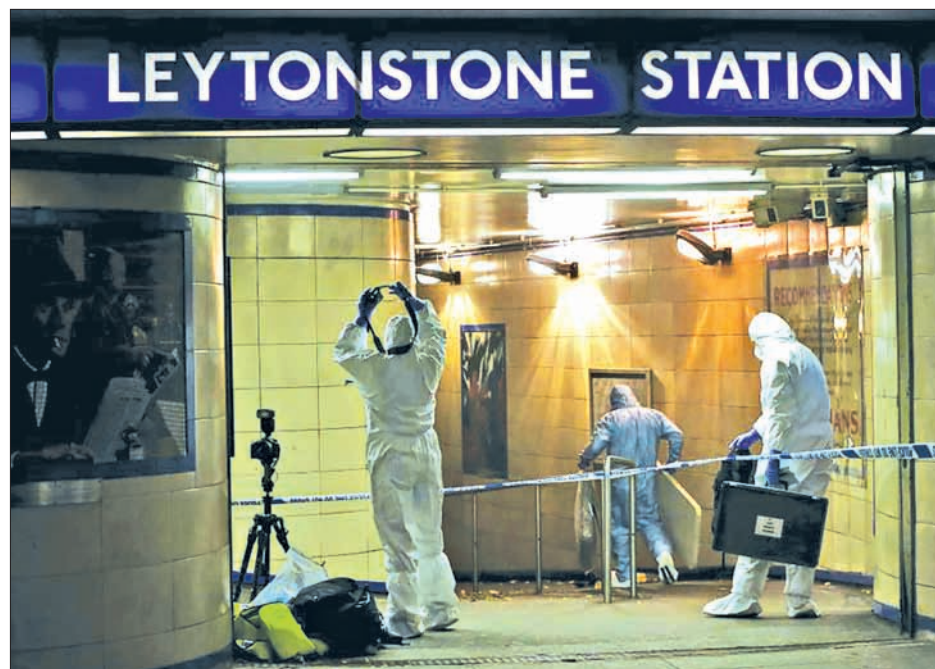
Police officers investigate a crime scene at Leytonstone underground station in east London, Britain on 5 December 2015.

British warplanes first bombed oil fields controlled by Islamic State on Thursday.—Reuters