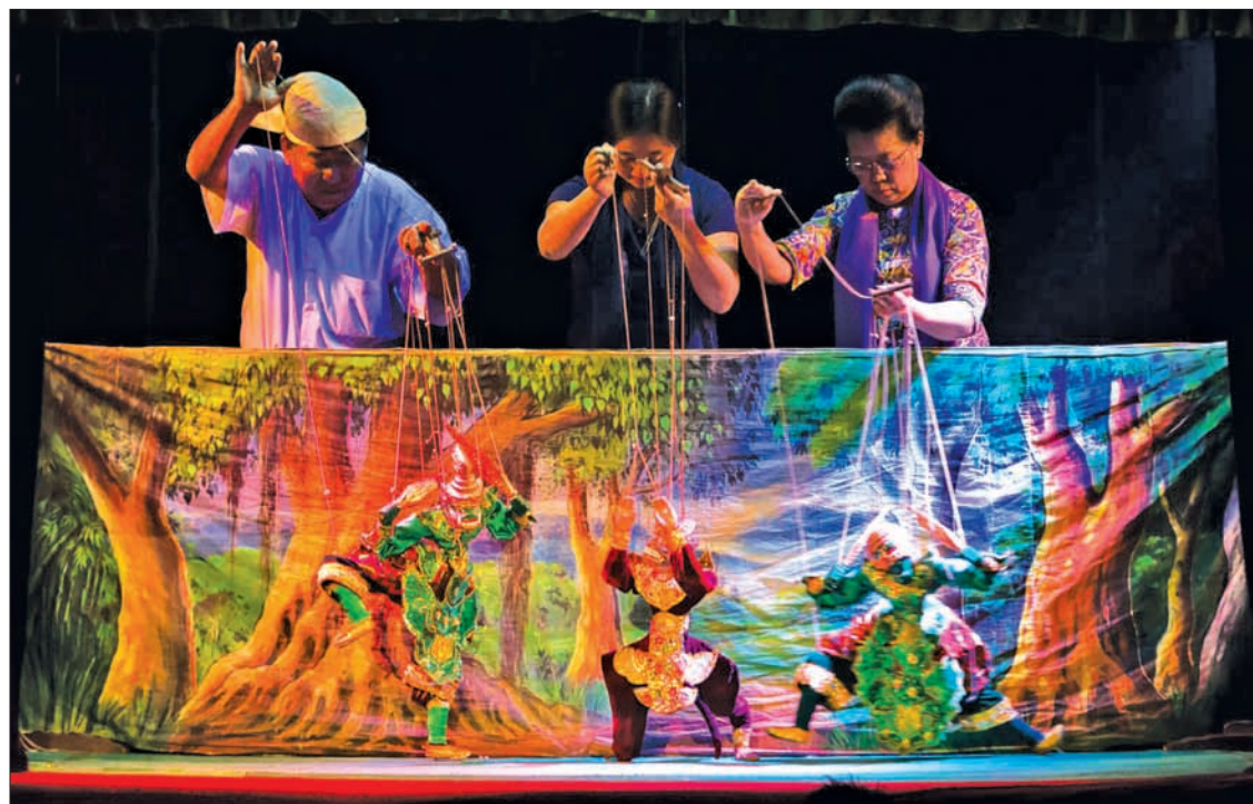
Myanmar puppeteers stage a puppet show at Mandalay Marionette Theatre.

Myanmar Marionette Organisation seeks to popularise Myanmar folk arts