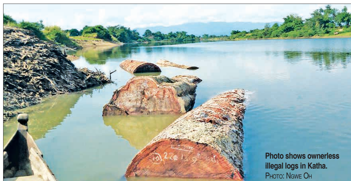
Photo shows ownerless illegal logs in Katha.