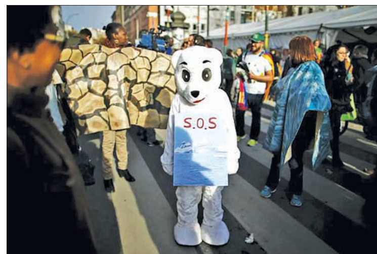
Environmentalists demonstrate during a street parade as part of the 'Global Village of Alternatives' events held in Montreuil, near Paris, France, on 5 December 2015 as the World Climate Change Conference 2015 (COP21) continues at Le Bourget near the French capital.