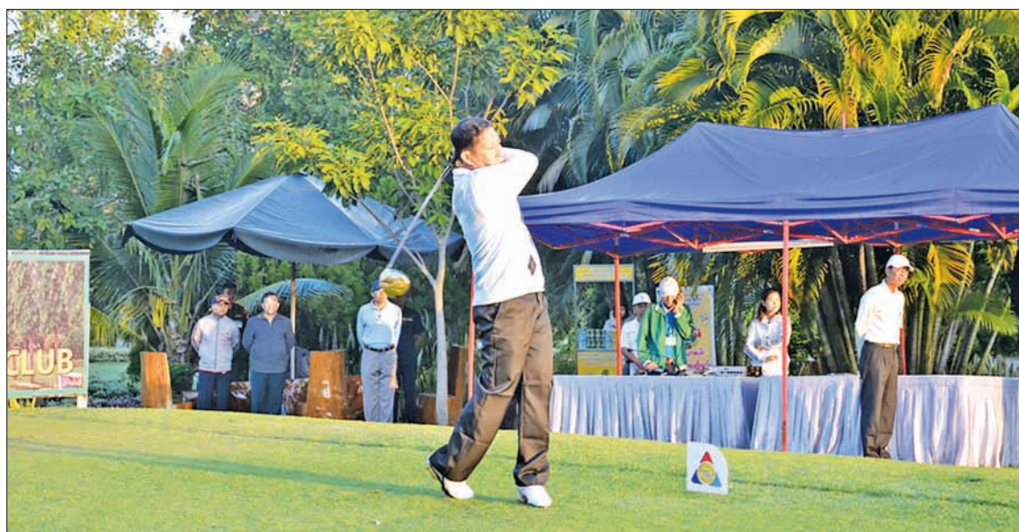
Vice-Senior General Soe Win takes part in final of Myanmar Golf Tour 2015.

ON behalf of Commander-in-Chief of Defence Services Senior General Min Aung Hlaing, Deputy Commander-in-Chief Defence Services and Commander-in-Chief (Army) Vice-Senior General Soe Win took part in a final event of Myanmar