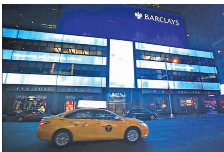
The Barclays logo is brightly lit on their building in Times Square, Manhattan, New York in the early hours of 18 January.

The same month, Switzerland’s Credit Suisse (CSGN.VX) announced a big restructuring plan under new CEO Tidjane Thiam.—Reuters