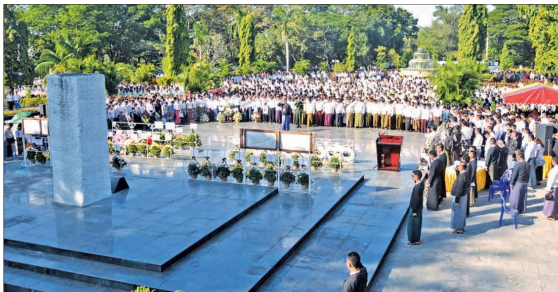
People pay tribute at memorial for fallen soldiers near mausoleum of national heroes.

mony. This public-initiated event was first organised on the first Sunday of December last year, and this year's event was the second one.