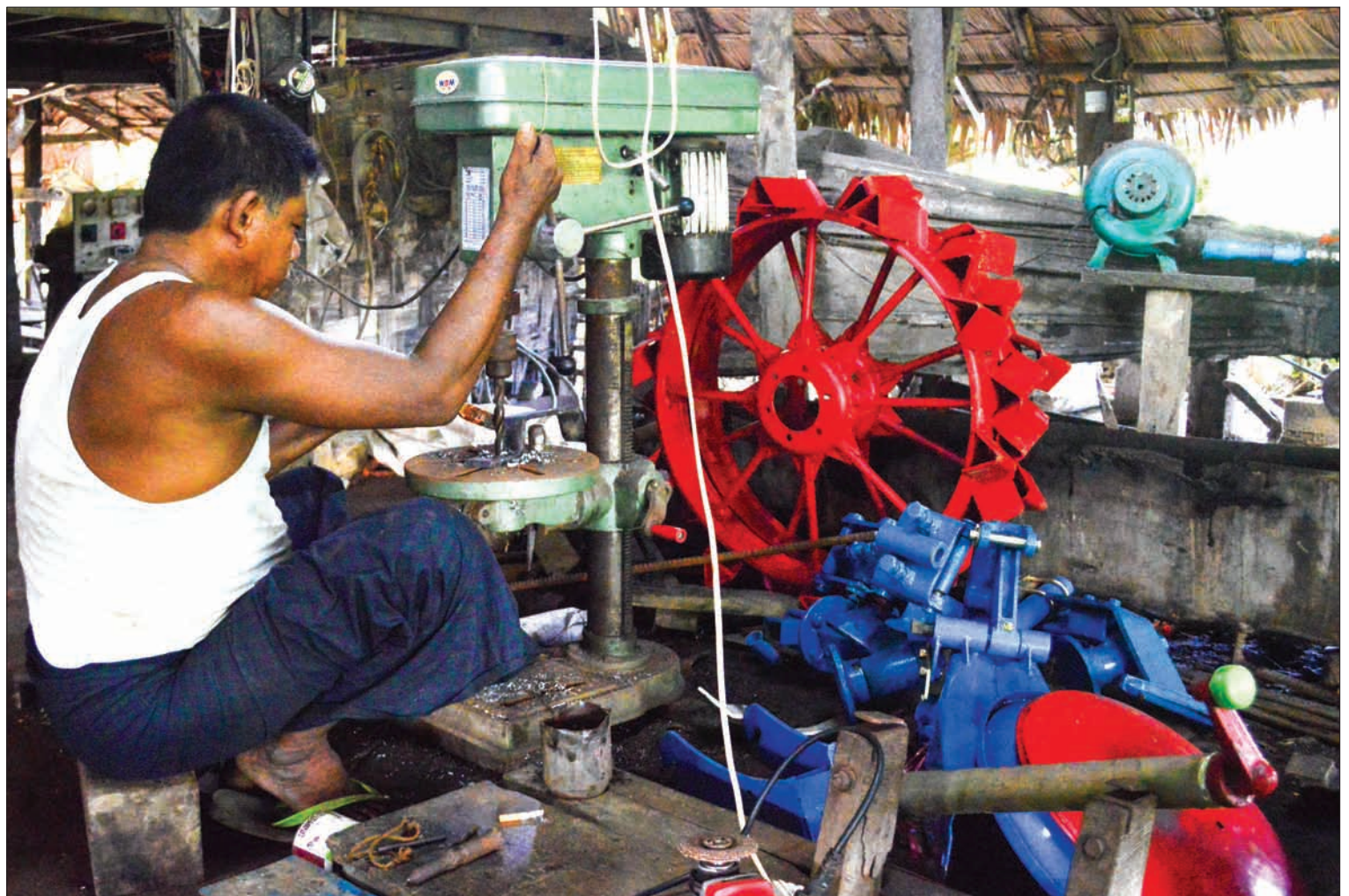
SMEs in Myanmar are still struggling with the lack of skilled labour and funds.

Small enterprises with no immovable properties have reported