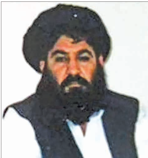
Mullah Akhtar Mohammad Mansour, Taliban militants' new leader.

The statement followed days of uncertainty over the fate of the Taliban leader, after multiple reports said he had been badly wounded in the shootout at the home of another commander in Quetta, western Pakistan, late on Tuesday.