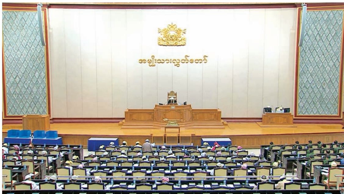
Amyotha Hluttaw is being convened in Nay Pyi Taw.

THE Amyotha Hluttaw yesterday approved five bills submitted by the Pyithu Hluttaw with comments after MPs discussed them clause by clause.