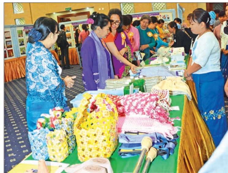
Union Minister Daw Myat Myat Ohn Khin visits booth opened to mark The International Day of Persons with Disabilities for 2015.

The SWRR Ministry has upgraded eight schools for the persons with disabilities to model ones and funded K 57.723 million to 10 homes for the deaf and blind in the 2015-2016 fiscal year.— Myanmar News Agency