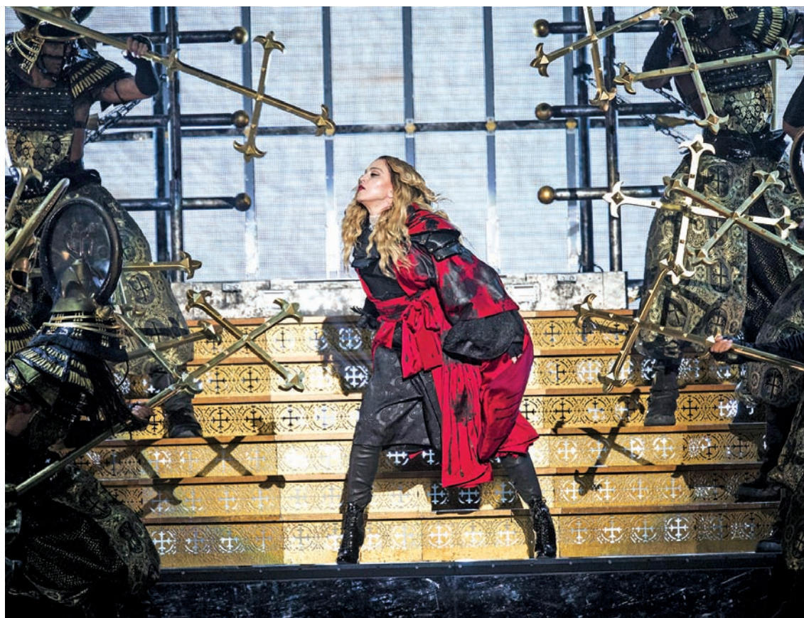
Madonna performs during a concert in Herring, on 16 November.

LONDON — Pop star Madonna performed to thousands of fans in London on Tuesday night on the first of two nights of her "Rebel Heart" tour in the British capital.