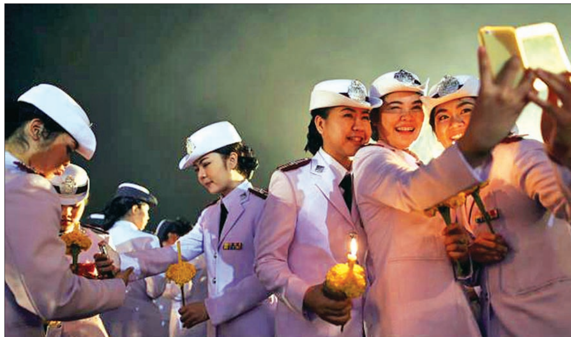
Military cadets take pictures of themselves during a ceremony celebrating the birthday of Thailand's King Bhumibol Adulyadej outside the Grand Palace in Bangkok, Thailand on 5 December 2014.

LONDON — People in London smile the least in their selfies while Moscow's selfie takers are predominantly women dressed to the nines, says a researcher involved in setting up a London