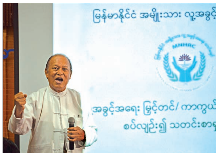
U Win Mra, chairman of Myanmar National Human Rights Commission, highlights the importance of working together with the media to promote human rights in Myanmar during a press conference in Yangon yesterday.

THE chairman of the Myanmar National Human Rights Commission called on the country's media to help achieve the realisation of human rights for all citizens at a press conference held yesterday.