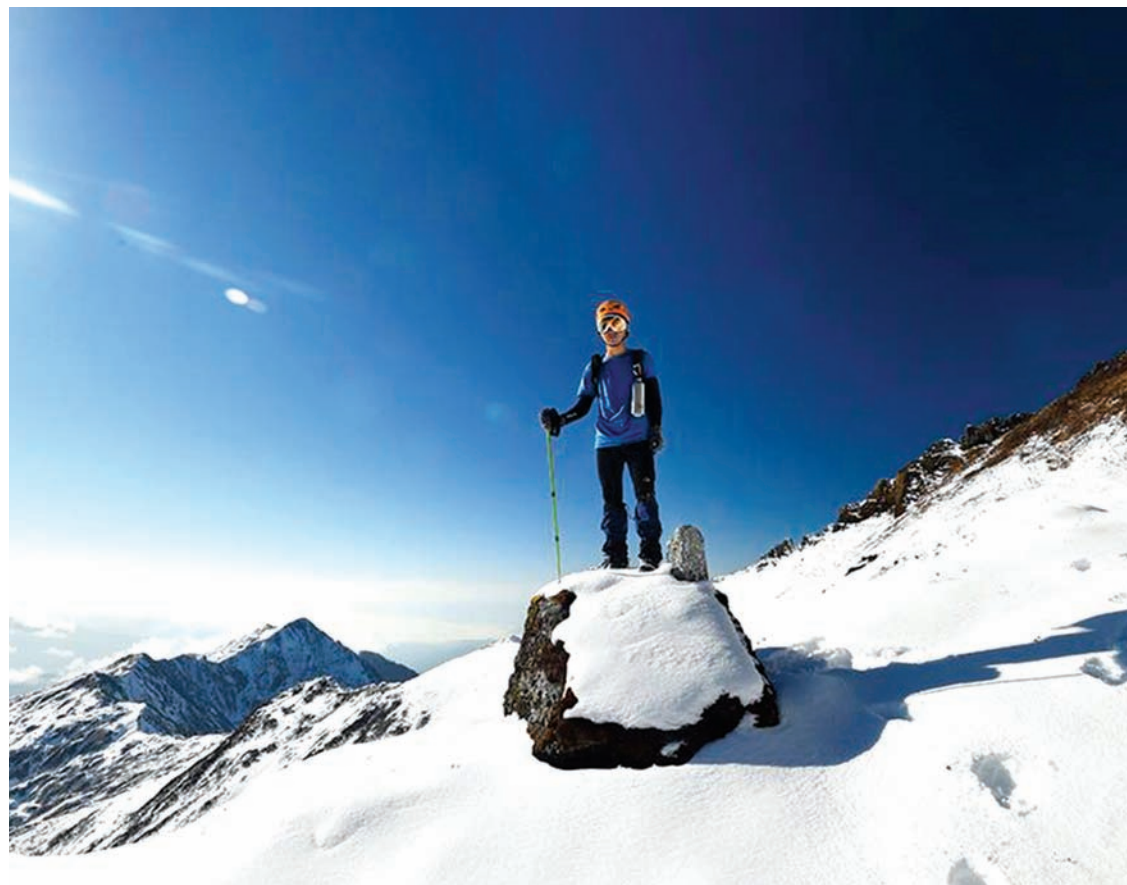
Photographer Kyaw Tha stands on Madwel mountain in Kachin State – one of four peaks he climbed this year.

Mount Hkakabo Razi is located in northern Myanmar and few have successfully reached its summit