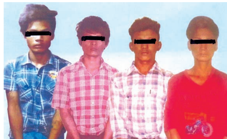
Four suspects believed to be involved in pickpocketing.

The suspects will face charges of Robbery with Hurt under Section 302 and 394 of the criminal code.— GNLM