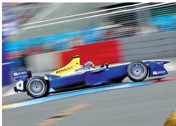
E.dams-Renault driver Nicolas Prost of France competes in the Formula E Championship race in Beijing.

they were locked out of their paddock hospitality in Japan due to unpaid bills. — Reuters