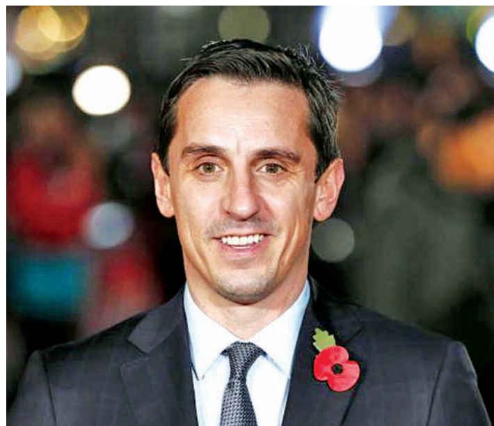
Former Manchester United player Gary Neville.

LONDON — Former Manchester United manager Alex Ferguson has said his old skipper Gary Neville has the leadership skills to be a success as manager of Spanish side Valencia.