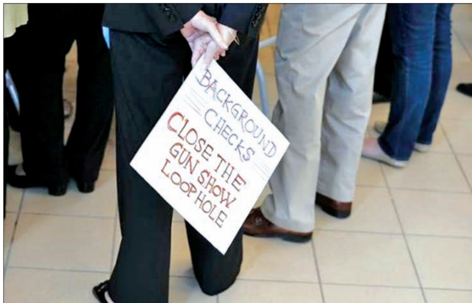
An audience member holds a hand lettered sign calling for further gun control at a campaign stop with US Democratic presidential candidate Hillary Clinton in Nashua, New Hampshire on 16 October.