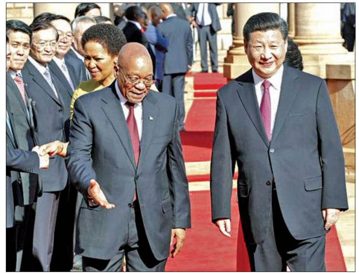
Chinese President Xi Jinping walks with South African President Jacob Zuma upon his arrival at the Union Buildings in Pretoria, on 2 December.

“China will implement ten cooperation plans with Africa in the next three years,” Xi