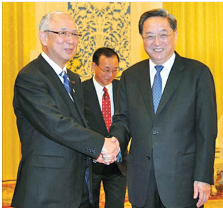
Yoshihisa Inoue (L), secretary general of Japan’s Komeito party, and Yu Zhengsheng, ranked fourth in China’s Communist Party leadership, shake hands before their talks at the Great Hall of the People in Beijing, on 4 December.

BEIJING — Senior lawmakers from Japan’s ruling coalition parties met yesterday with one of China’s seven most politically powerful men at a time when efforts of both countries to improve bilateral relations have gained momentum.