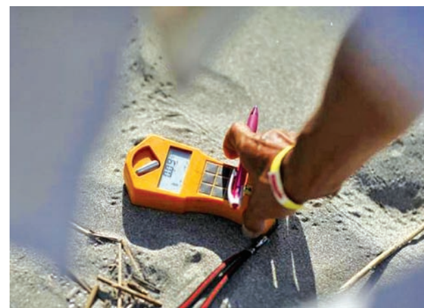
79-year-old Shouhei Nomura checks radiation levels close to the protesters' campsite near Kyushu Electric Power's Sendai nuclear power station in Satsumasendai, Kagoshima prefecture, Japan on 8 August.

In March 2011, a massive earthquake triggered a tsunami that struck the Fukushima nuclear plant, 130 miles (209 km) north-east of Tokyo, causing tri-