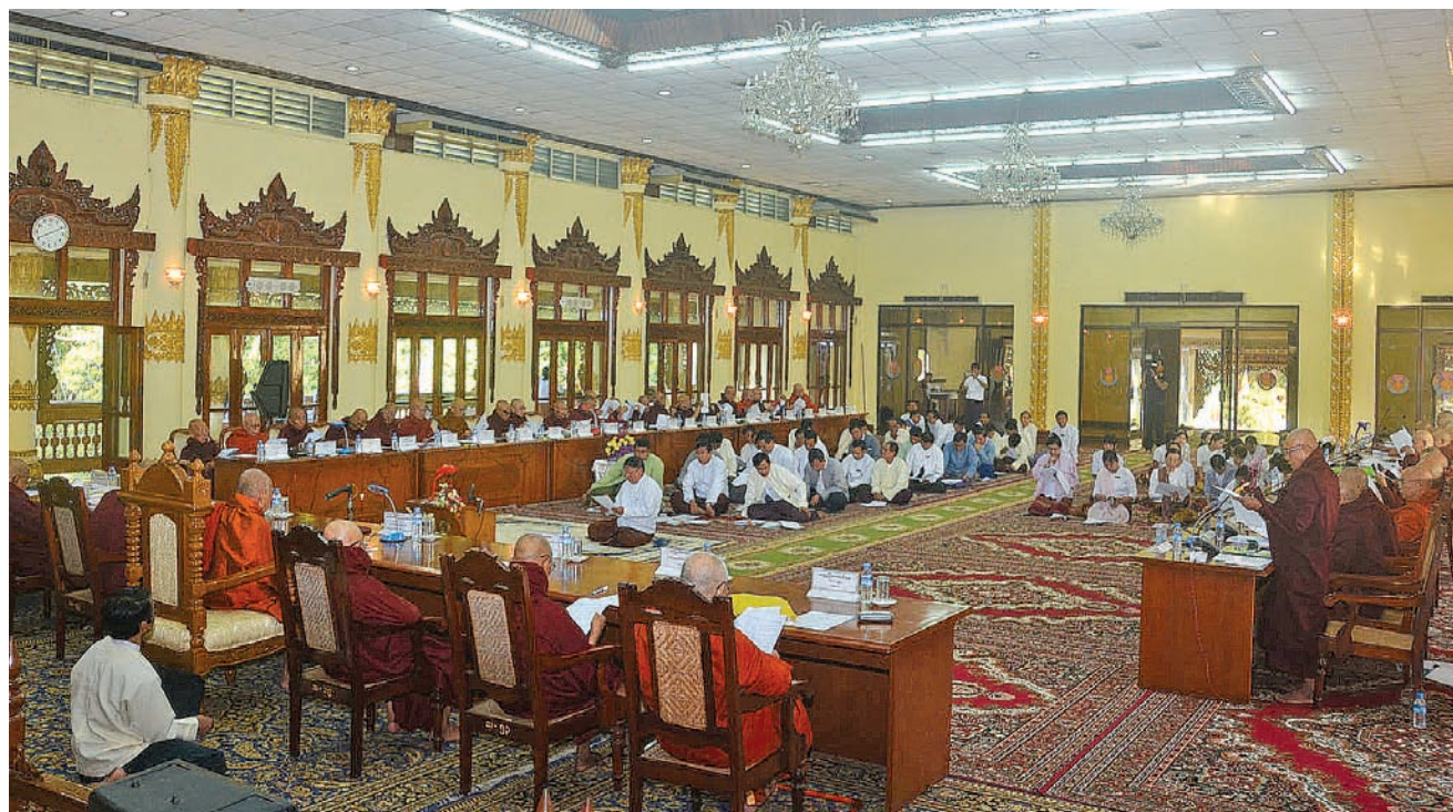
The 47-member plenary meeting of the State Sangha Maha Nayaka Committee is held in Yangon.