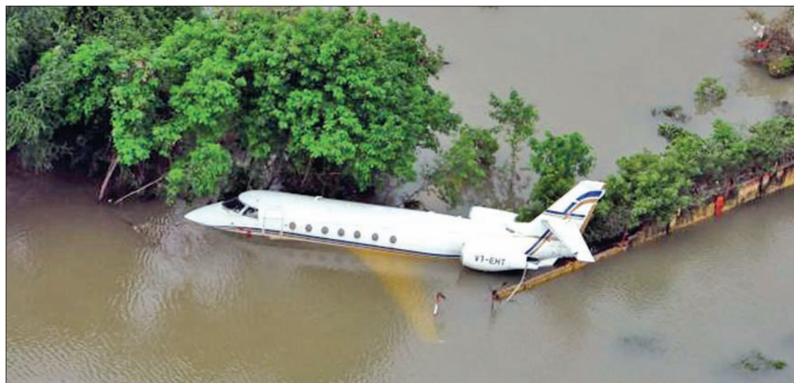
An aerial view of a partially submerged airplane is pictured in a flood affected area in Chennai, India on 3 December.

food to residents stranded on rooftops and the defence ministry doubled to 4,000 the number of soldiers deployed to help the rescue effort.