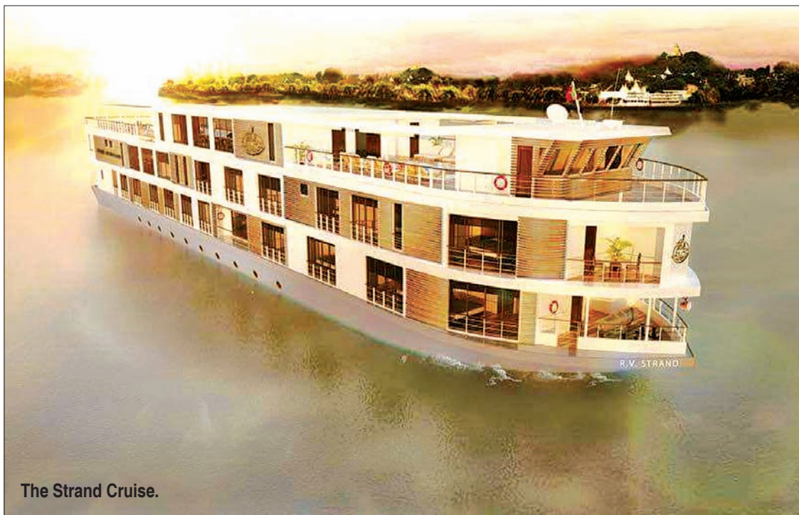
The Strand Cruise.

During Myanmar’s low travel season, the strand cruise’s three-night itinerary between Mandalay and Bagan will cost US$1,782 per head for a double room. For more information, visit www.thestrandcruise.com