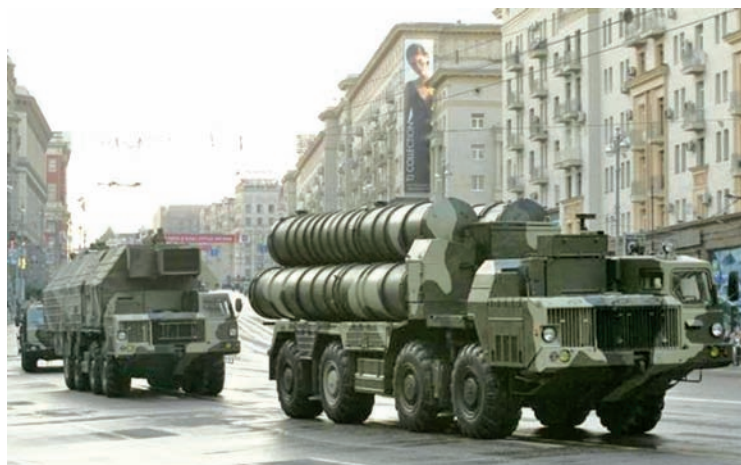
Russian S-300 anti-missile rocket system move along a central street during a rehearsal for a military parade in Moscow.

Israel has bombed Syrian targets on occasion and is loath to run up against the Russians. Israeli Prime Minister Benjamin Netanyahu has met President Vladimir Putin at least twice in recent weeks to discuss coordination and try to avoid accidents.—Reuters