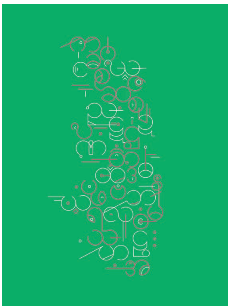
A creative interpretation of the Myanmar alphabet.