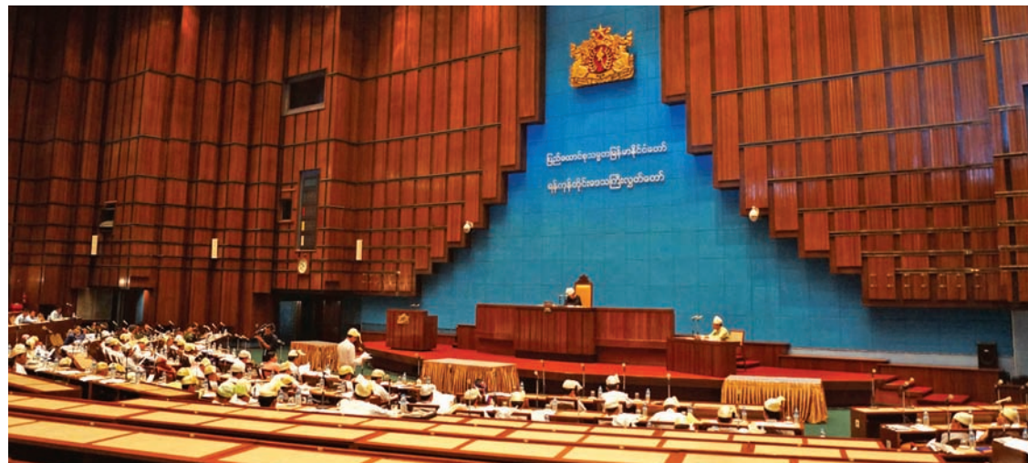
Yangon Region Parliament continues its special session.

YANGON Region Parliament continued its special session yesterday, with region-level departmental officials responding to six questions raised by MPs.