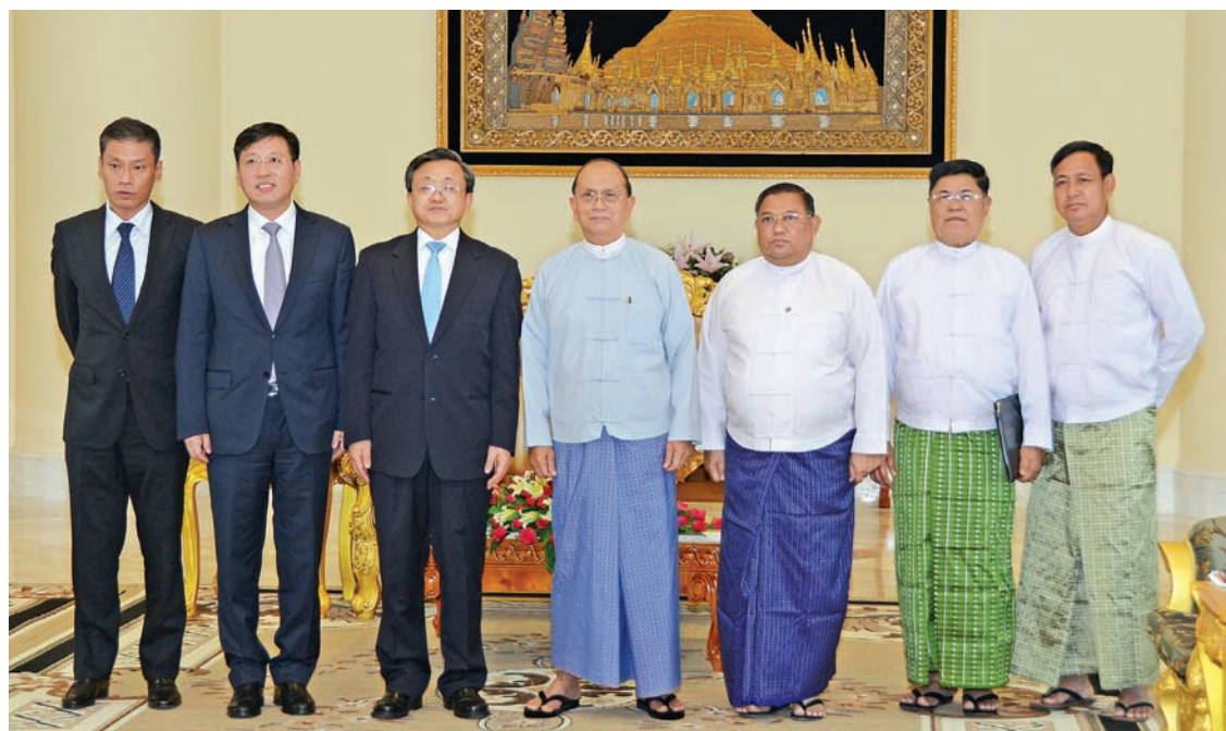
President U Thein Sein meets with a Chinese delegation led by Mr Liu Zhenmin, Vice Foreign Minister.

PRESIDENT U Thein Sein met with a Chinese delegation led by Mr Liu Zhenmin, Vice Foreign Minister, Ministry of Foreign Affairs of the People's Republic of China, at the Presidential Palace in Nay Pyi Taw yesterday.