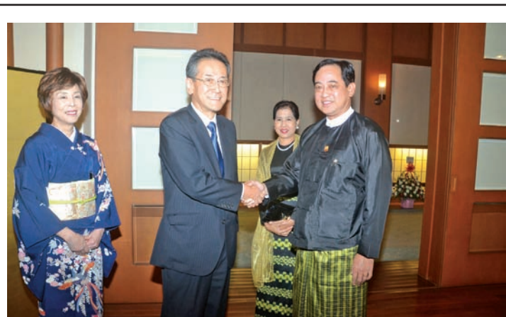
U Zeyar Aung, Union Minister for Energy, is being welcomed by Japanese Ambassador to Myanmar Mr Tateshi Higuchi on his arrival at a reception to mark the Japan Emperor's Birthday in Yangon on 4 December, 2015.

The workshop attracted delegations from Myanmar, Brunei, Cambodia, Laos, Malaysia, Indonesia and Thailand.— Myanmar News Agency