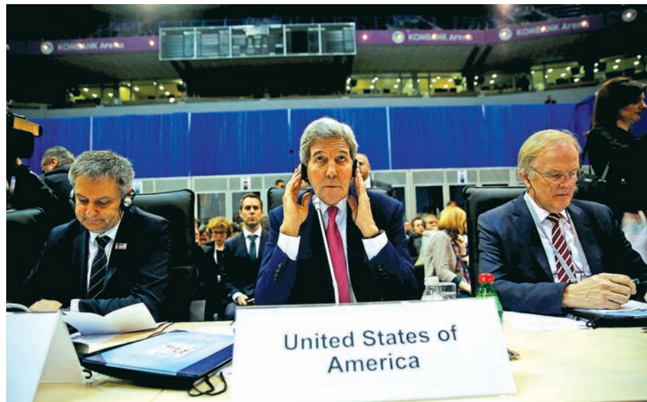
US Secretary of State John Kerry takes his seat to participate in the OSCE Ministerial Council meeting in Belgrade, Serbia, on 3 December.

BELGRADE — Syrian and other Arab ground forces must be found to take on Islamic State, US Secretary of State John Kerry said on Thursday, saying the militant group would not be defeated by air strikes alone.