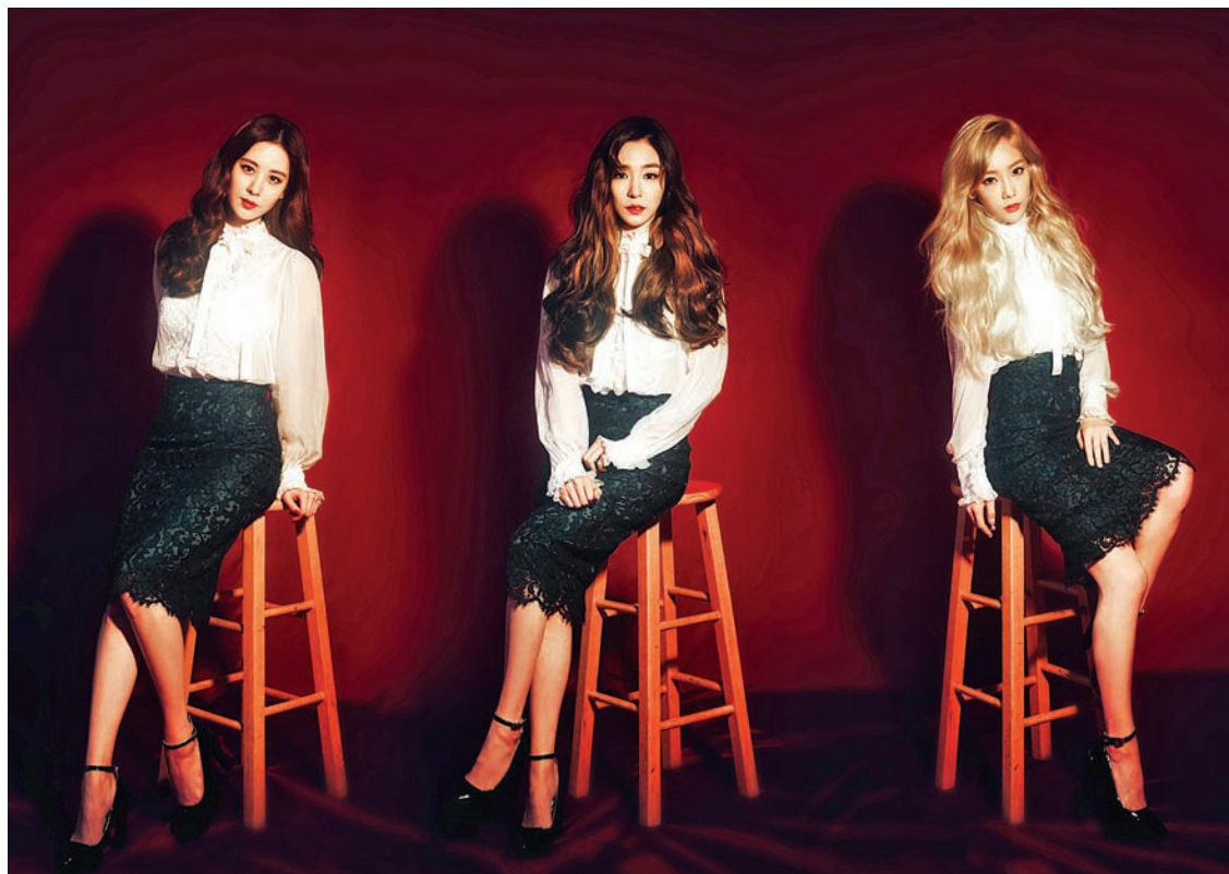
South Korean trio TaeTiSeo.

BEIJING — South Korean group TTS launched a new Christmas album at midnight local time.