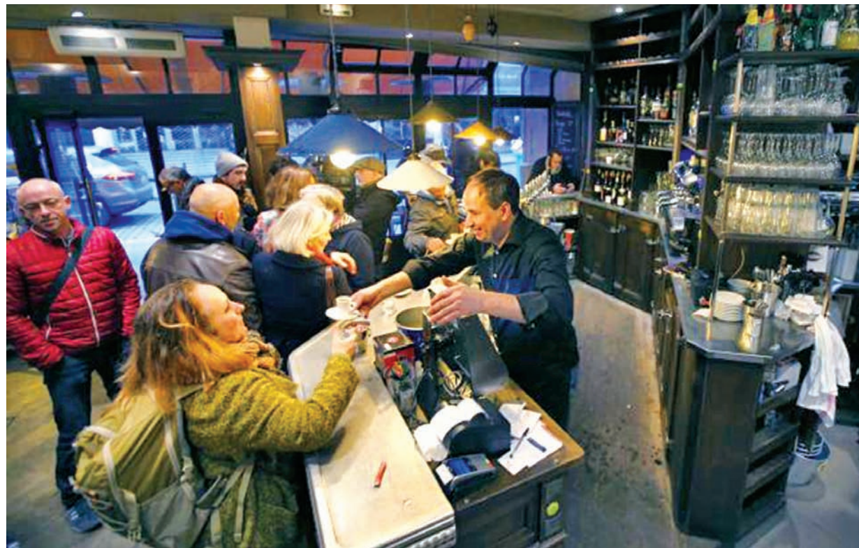
Customers stand at the counter inside 'A La Bonne Biere' cafe in Paris, on 4 December.

Hotel revenues in the Paris region fell by 50 percent in the week after the attacks, according to the Chamber of Commerce business association.—Reuters