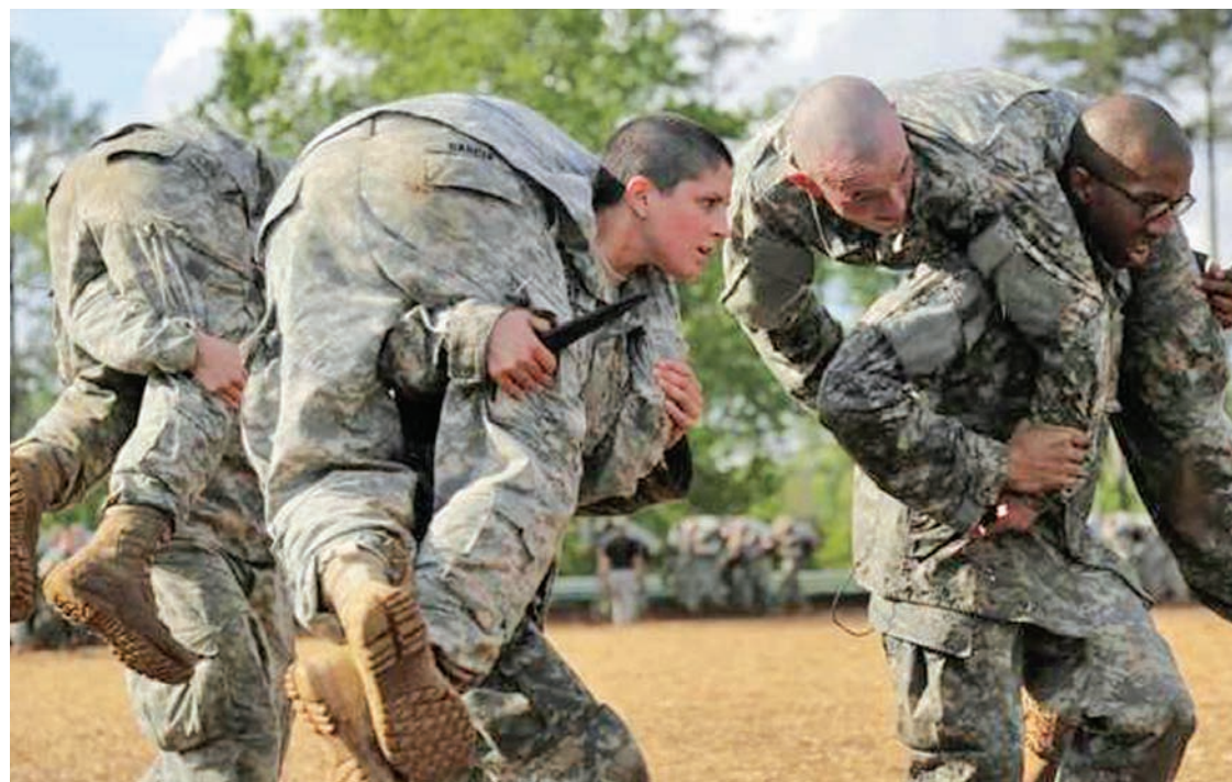
Then US Army First Lieutenant Kirsten Griest (C) and fellow soldiers participate in combat training during the Ranger Course on Fort Benning, Georgia, on 20 April 2015.

Carter said the opening to women would take place following a 30-day review period, after which they would be integrated into the new roles in a “deliberate and methodical manner” as positions come open. The waiting pe-