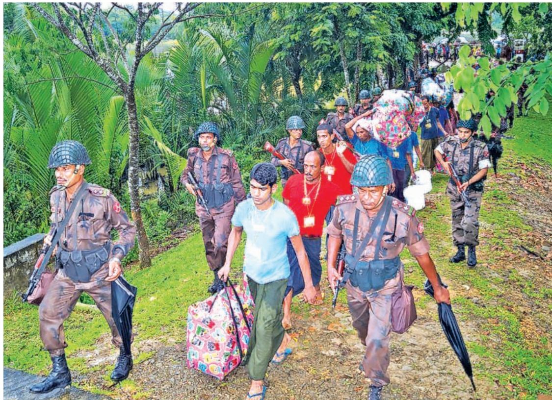
Myanmar has repatriated a total of 777 verified Bangladeshi 'boat people' to Bangladesh in seven batches.

Myanmar Delegation was composed of officials from Ministry of Defence, Ministry of Home Affairs, Ministry of Foreign Affairs, Ministry of Immigration and Population