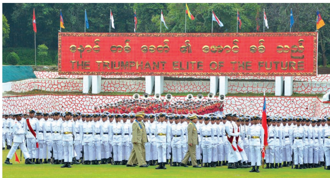
Commander-in-Chief of Defence Services Senior General Min Aung Hlaing inspects parade of 57th Intake of Defence Services Academy.

AS a citizen who desires stability and development of the country, cadets should combine the lesson taught by the military academy with a sound sense of justice, moral principles, appropriate cooperation, good citizenship and a desire to protect the people, said the Commander-in-Chief of Defence Services Senior General Min Aung Hlaing at the graduation ceremony of the 57th Intake of Defence Services Academy in Pyin Oo Lwin on Friday.