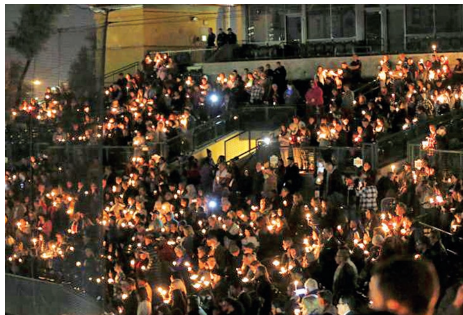
Attendees reflect on the tragedy of Wednesday's attack during a candlelight vigil in San Bernardino, California on 3 December.

Officials from President Barack Obama to