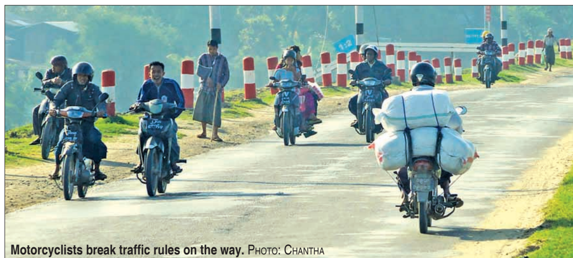
Motorcyclists break traffic rules on the way.

If government emblems are displayed on a private vehicle or if a civilian uses government papers, the driver and owner will be fined K300,000 or sentenced to a six-month jail term, or both, according to the law. Taking action against unruly cars around the town's busy market and around the township have satisfied the townspeople, according to a local resident.— Chantha