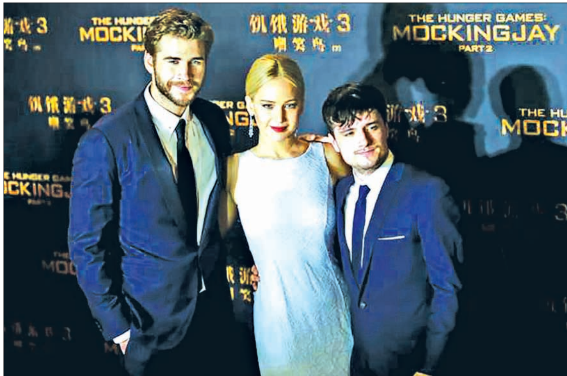
Cast members Liam Hemsworth, Jennifer Lawrence and Josh Hutcherson (L-R) pose at a red carpet event for the China premiere of "The Hunger Games: Mockingjay - Part 2" in Beijing, China.

LOS ANGELES — Moviegoers said goodbye to Katniss Everdeen and welcomed back Rocky Balboa, a series of farewells and reunions that powered Thanksgiving box office receipts above last year's holiday.