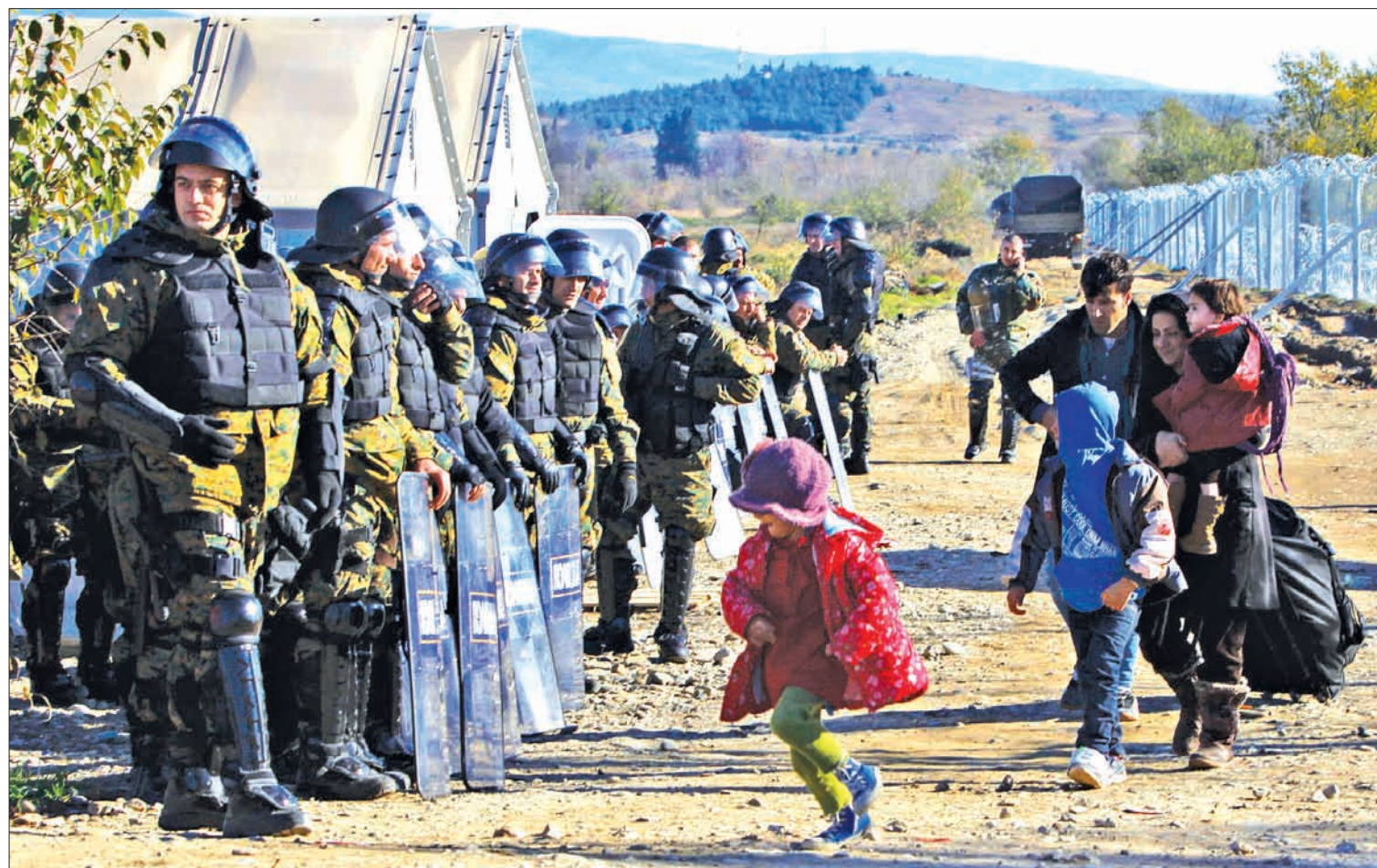
Migrants walks past Macedonian police after crossing the Macedonian-Greek border near Gevgelija, Macedonia on 30 November.

BRUSSELS — Turkey promised to help stem the flow of migrants to Europe in return for cash, visas and renewed talks on joining the EU in a deal struck on Sunday that the Turkish prime minister called a “new beginning” for the uneasy neighbours.