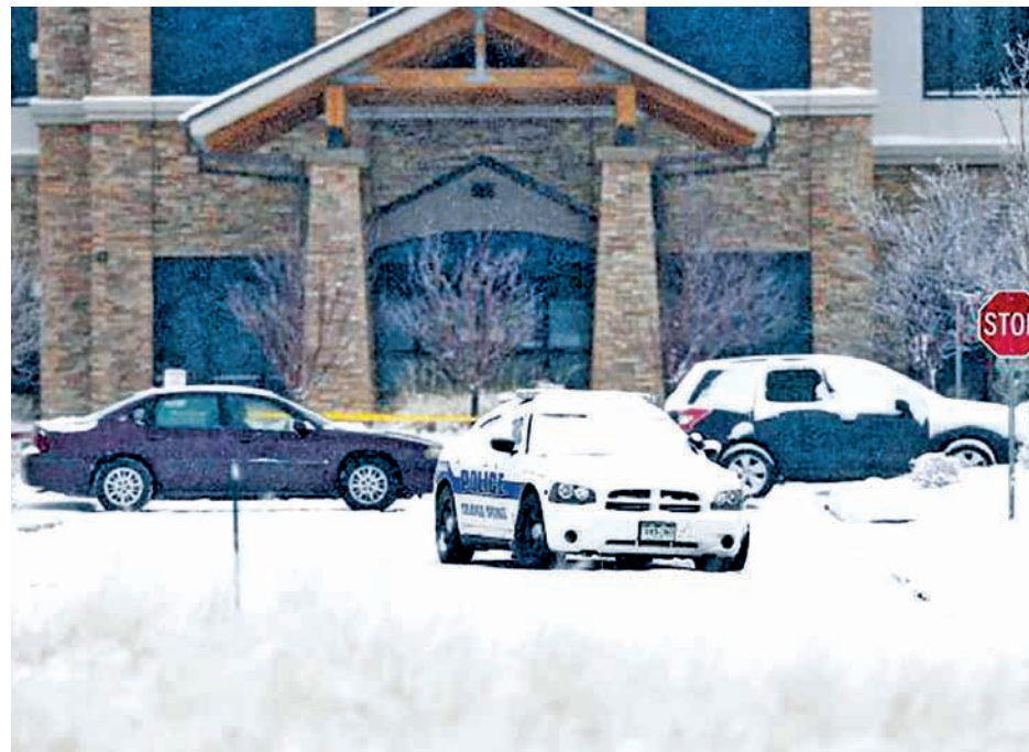
A Colorado Springs Police car is seen sitting in the snow outside the Planned Parenthood clinic in Colorado Springs, Colorado on 28 November.