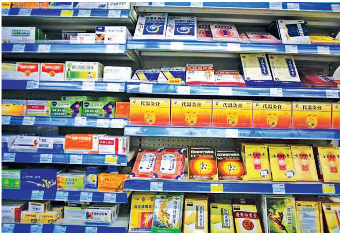
Shelves displaying medicines are seen at a pharmacy in Shanghai, China.

Greater local competition is also evident in other areas, helping the top 10 Chinese drugmakers grow sales 12 percent on average this year, according to IMS Consulting — twice the rate of multinationals, which suffered a setback from a bribery scandal at