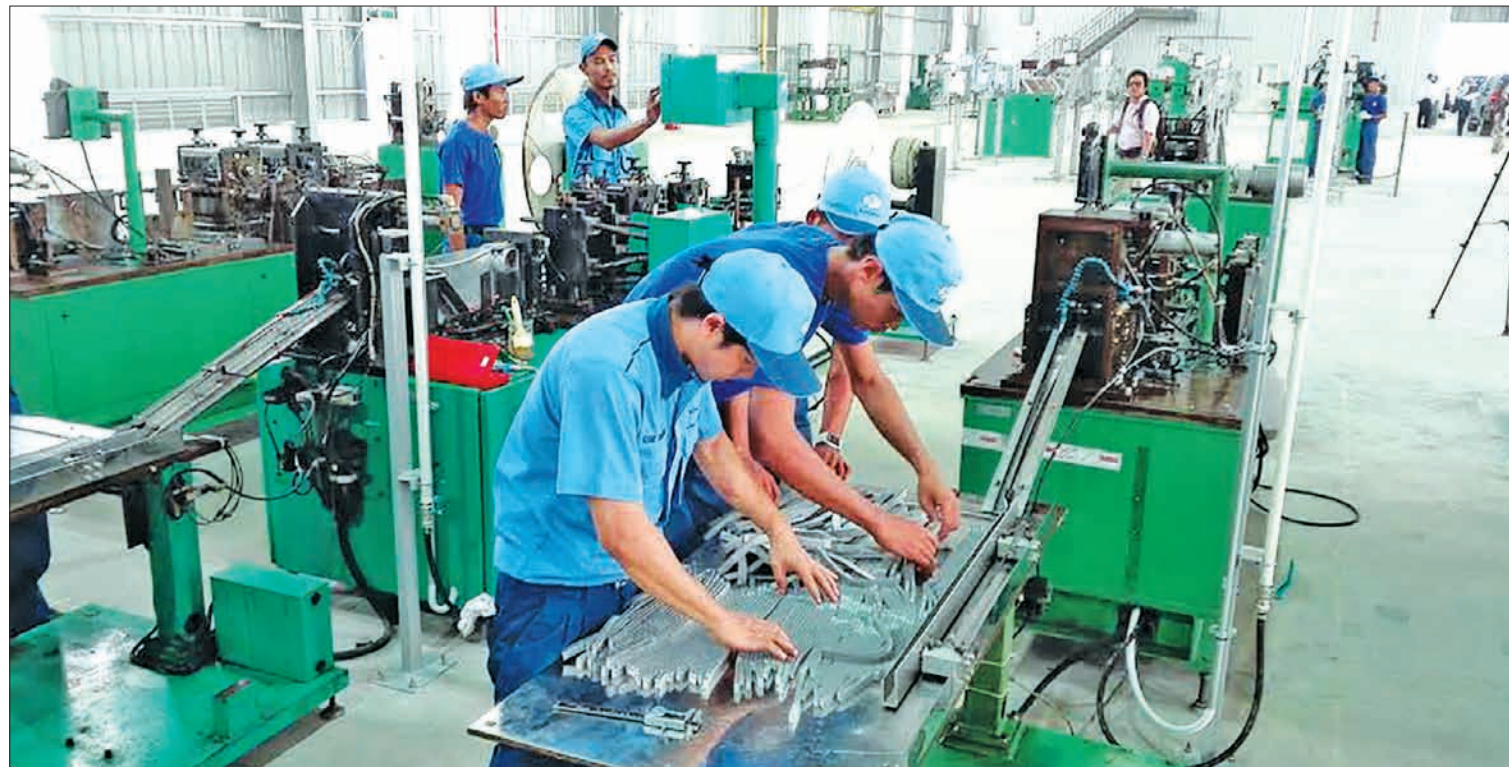
Skilled workers seen in manufacturing machinery products.

THE Myanmar Construction Entrepreneurs Association (MCEA) and Korean Overseas Construction Association plan to cooperate and implement local construction and development projects starting in mid-December, according to an MCEA spokesman.