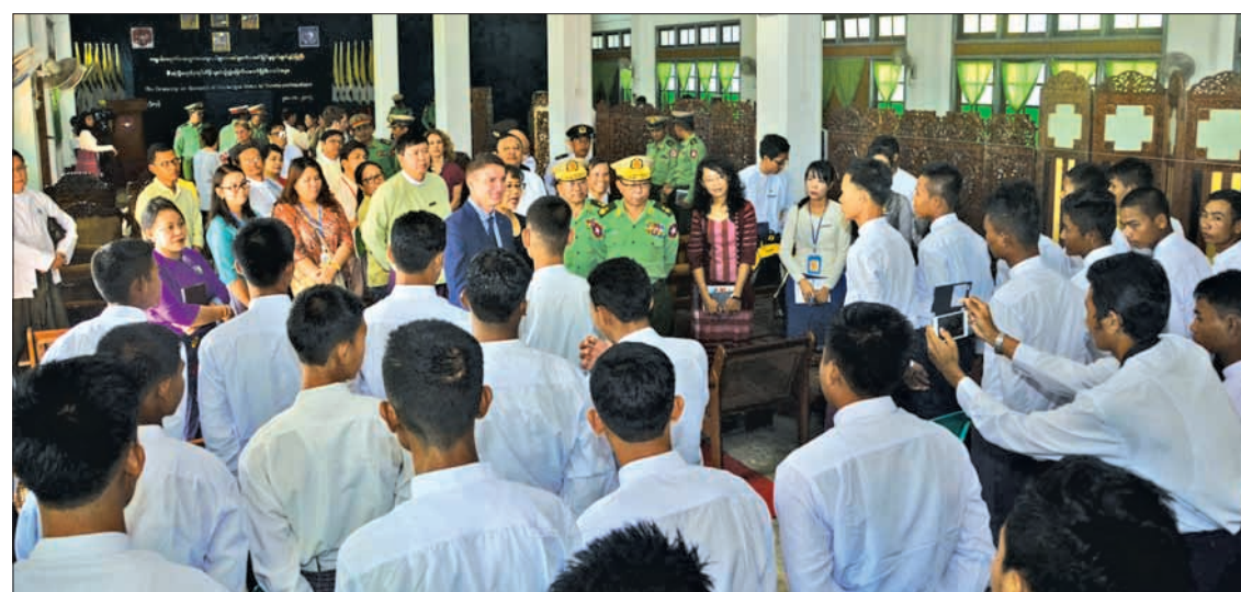
Senior military officers and officials of UN agencies meet child soldiers.