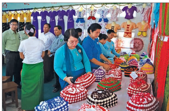
WAO officials view works of vocational trainees.

DOMESTIC Science Course No. 55 and Advance Tailoring Course No. 41 concluded at the Women's Vocational Training School in Myawady on 27 November.