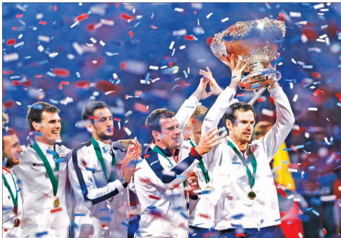
Great Britain's Andy Murray celebrates with the trophy after winning the Davis Cup.

Murray then saluted the 'Barmy Army', who roared his every winner over a weekend that rubber-stamped his place in the chronicles of British sporting greatness, if any had doubted it after he ended a 77-year wait for