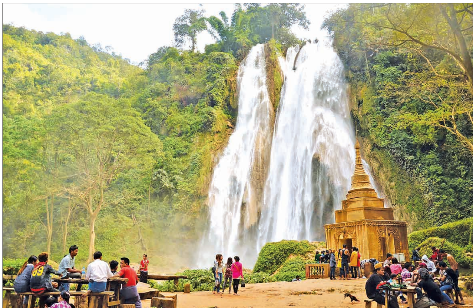
Dattawgyaing Waterfall in Pyin Oo Lwin.

The waterfall receives most of its visitors during the summer months of April and May.— Chantha