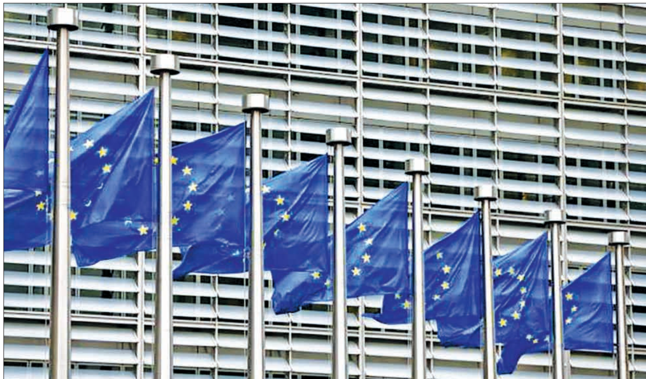
European Union flags flutter outside the EU Commission headquarters in Brussels, Belgium, on 28 October.

VIENNA — The European Union and United States should reach agreement next month on a new framework to replace the Safe Harbour pact enabling data transfers from Europe to the United States, European Justice Commissioner Vera Jourova told a newspaper.