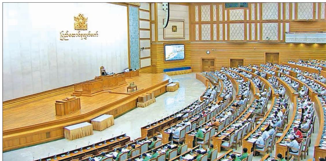
Pyidaungsu Hluttaw continues discussions on amendments of bills.

THE Pyidaungsu Hluttaw session on Monday accepted three bills to be presumed approved. The Hluttaw also discussed three international agreements to be signed by the Myanmar government, the report on the implementation of national planning in the second half of the 2014-15 fiscal year and the