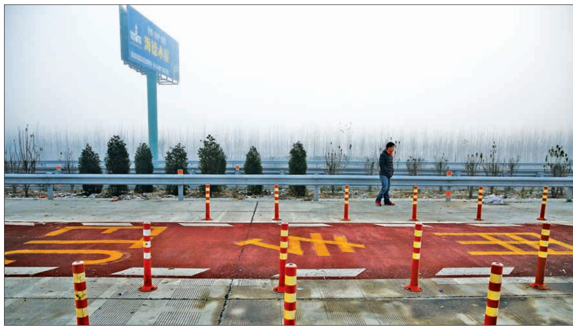
A man walks in front of toll gate on a highway between Beijing and Hebei Province, China, which is closed due to smog on an extremely polluted day on 30 November 2015.

The Thomson Reuters Foundation could not immediately find a working telephone number or email address for Wor Wattana.— Reuters