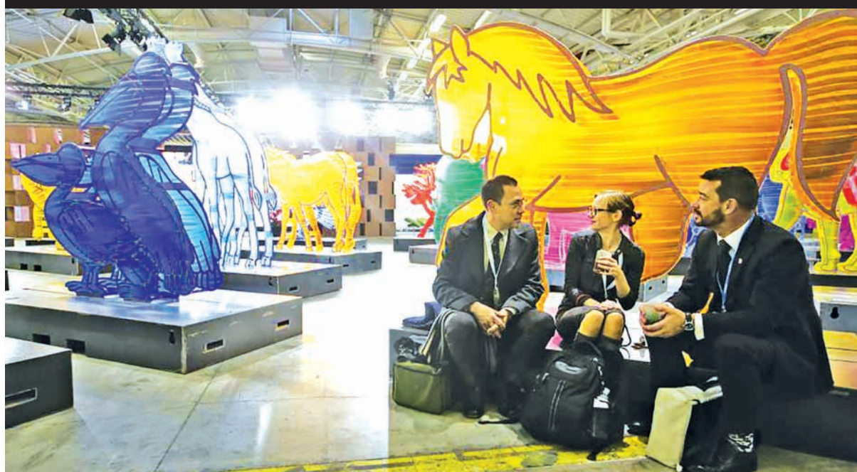
Delegates take a break during the opening day of the World Climate Change Conference 2015 (COP21) at Le Bourget, near Paris, France, on 30 November.