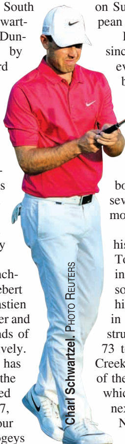
Charl Schwartzel.

Two more Frenchmen, Benjamin Hebert and tour rookie Sebastien Gros, finished 10 under and nine under after rounds of 72 and 73 respectively. Schwartzel, who has slumped to 50 in the world rankings, opened with rounds of 66, 67, 70 and he mixed four birdies with two bogeys