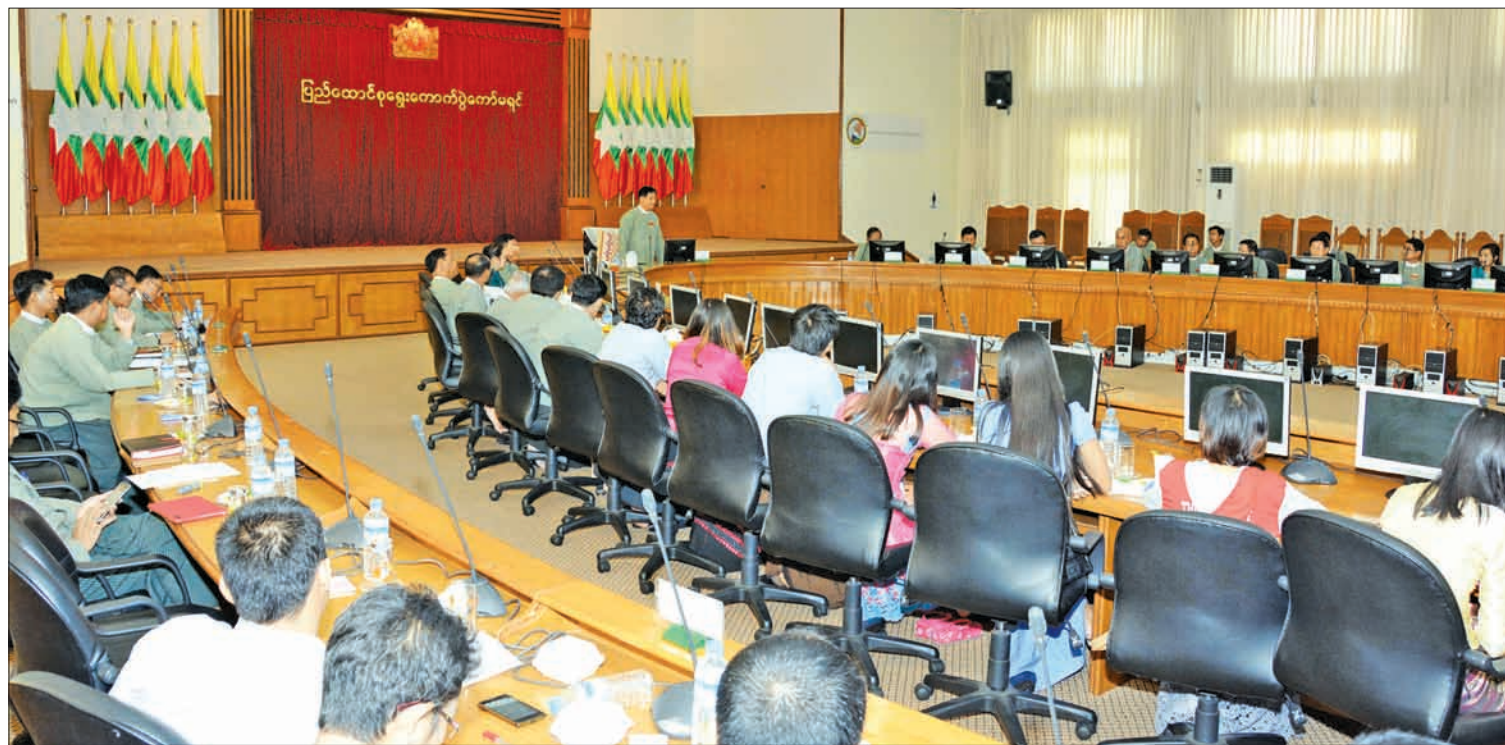
Chairman of Union Election Commission U Tin Aye meets trainees of Myanmar Egress.

THE party that won the election becomes the ruling party which will carry out development of the country under its principles, said Chairman of the Union Election Commission U Tin Aye at a meeting with the 30 trainees from Myanmar Egress at the UEC office in Nay Pyi Taw on 20 November.