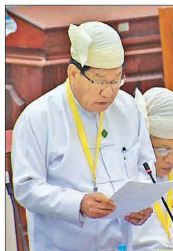
Deputy Minister for Agriculture and Irrigation U Khin Zaw.

The Ministry of Transport submitted a bill amending the Comprehensive Transport Law. The Hluttaw approved a bill amending the Veterinary Education Council Law. —Myanmar News Agency