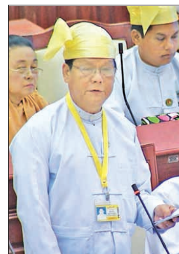
Deputy Minister for Livestock, Fisheries and Rural Development U Khin Maung Aye.