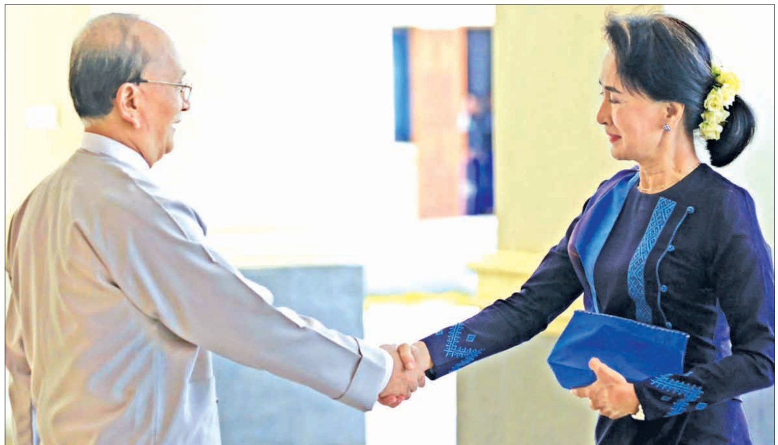
President U Thein Sein welcomes Daw Aung San Suu Kyi as she arrives for 48-party talks on 12 January 2015.

The statement said arrangements have been made to hold a meeting with the Commander-in-Chief of Defence Services Senior General Min Aung Hlaing and Daw Aung San Suu Kyi, the chairperson of the National League for Democracy, on the afternoon of 2 December at the command-