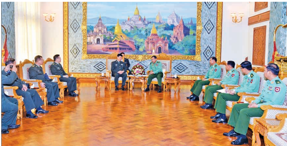
Vice-Senior General Soe Win receives Major General Yang Guangyue, Commander of the Yunnan Provincial Military Area.

tween Myanmar's and China's armed forces in the post-election period. They also discussed the ongoing internal peace process since the signing of the Nationwide Ceasefire Agreement, cooperation between the two countries in promoting peace and stability, the development of border areas and the exchange of information for anti-drug operations and illegal trade prevention.— Myawady