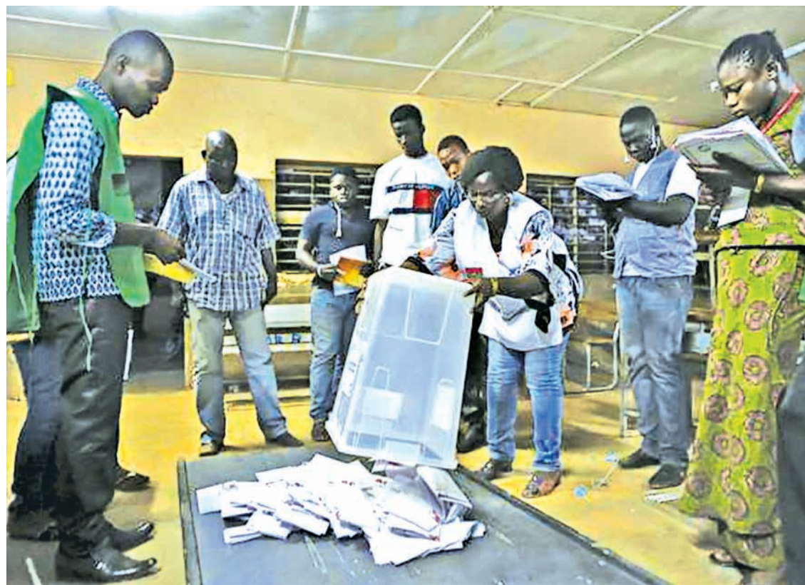
Electoral officials count ballots during the presidential and legislative election in Ouagadougou, Burkina Faso, on 29 November.

Compaore seized power in a coup, ruled for 27 years and won four elections, all of which were criticised as unfair.—Reuters