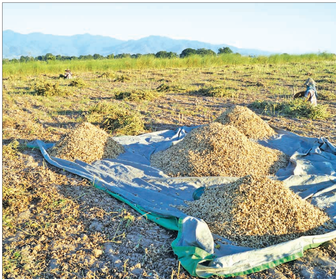
Harvested peanuts on farmland in Tatkon.

MONSOON peanuts planted three months ago were harvested in Tatkon Township, Nay Pyi Taw, recently.