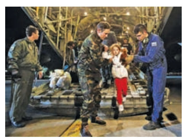
A man (C) and his daughter (2<sup>nd</sup> L), both rescued from the Norman Atlantic ferry, disembark from a Greek Airforce C-130 military cargo aircraft at the Elefsina military airport near Athens on 29 Dec, 2014.

Rome / Athens, 30 Dec - Rescue teams evacuated more than 400 people from a car ferry that caught fire off Greece's Adriatic coast in a 36-hour operation on roiling seas, but 10 people were killed in the disaster.