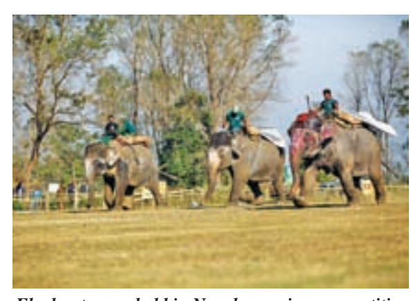
Elephants race held in Nepals race in a competition during the 11th Elephant Festival at Sauraha in Chitwan, Nepal, on 29 Dec, 2014.—XINHUA