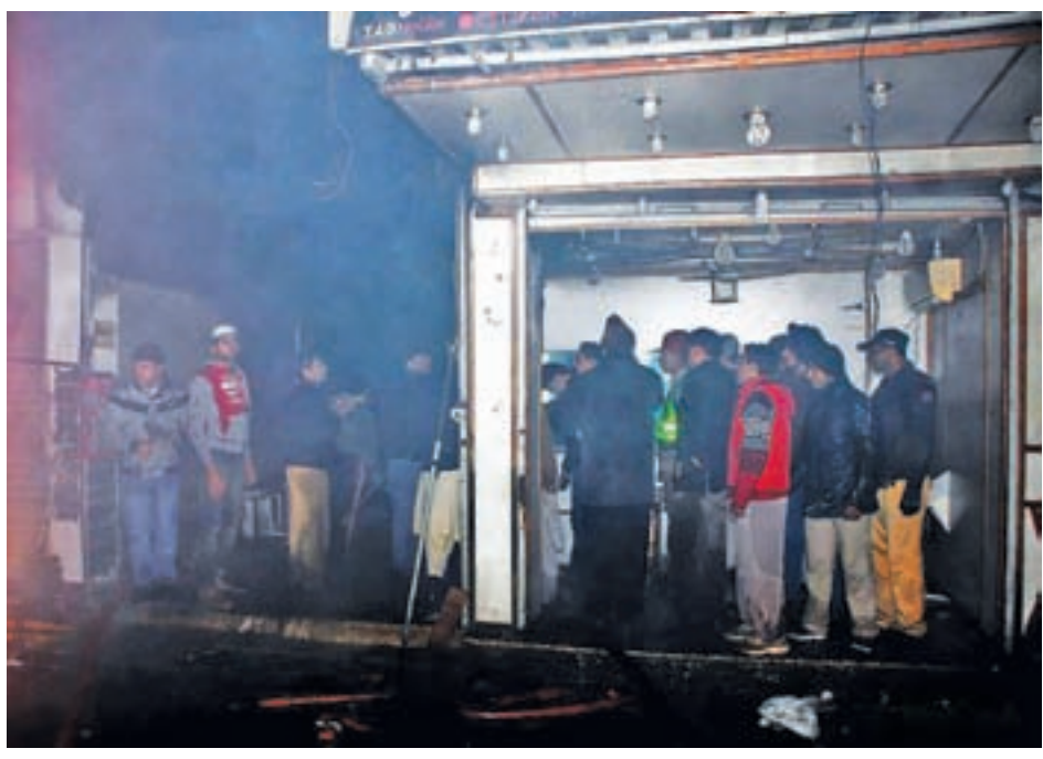
Pakistani security officials and rescue workers gather outside of a four-story shopping plaza where a fire broke out in eastern Pakistan's Lahore on 29 Dec, 2014. At least 13 people were killed when fire erupted in a four-story shopping plaza in Pakistan's east city of Lahore on Monday night, officials said.

The fire erupted due to short circuit in the plaza located in the Anar Kali market of Lahore, the capital city of Punjab Province.