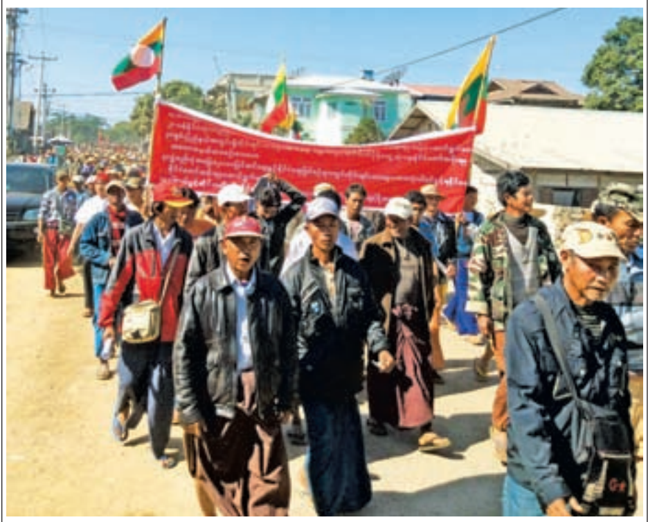
Local people join protests with five demands including opposing a six-party talks in Nawngkhio Township.—MNA

Nay Pyi Taw, 30 Dec peacefully for two hours in Nawngkhio on 27 December, making five demands including opposing a six-party talks.