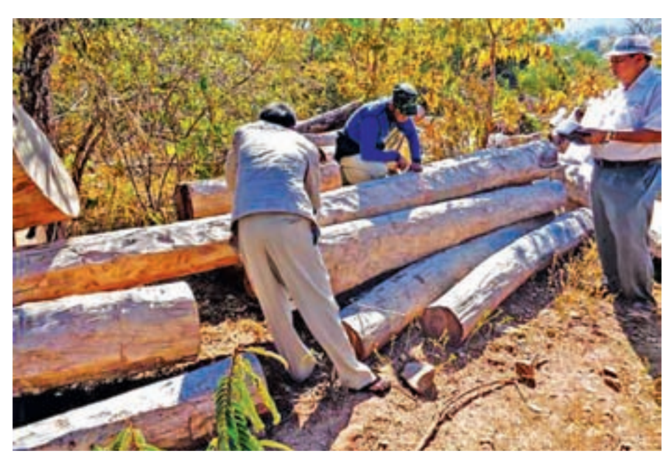
Forestry officers measure logs seized in Wamsalaung village, Langkho District in Shan State.

U Zaw Min said that the Ministry of Forest and Mining of Shan State informed the Shan State Forest Department of illegal logging near Wansalaung village in the Langkho district by phone at about 2 p.m. on 23 December. According to the information, a group of foresters led by