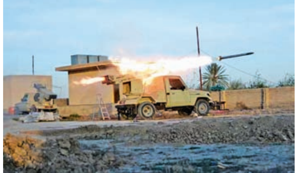
A vehicle belonging to Shi'ite fighters fires a multiple rocket launcher during clashes with the Islamic State on at the outskirt of Balad, north of Baghdad on 26 Dec, 2014.

on 27 January, according to Mekdad. On the following days, Syrian government officials will hold talks with the opposition members. The Syrian government and the pro-western opposition group National Coalition for Syrian Revolutionary and Opposition Forces, which operates outside Syria, were engaged in talks in Geneva in January and February, but failed to stop the violence. In Geneva, the government called for a halt to violence from terrorism, while the coalition prioritized setting up a transition government. Russia, which has stood behind President al-Assad, is urging opposition groups in Syria to take part in the upcoming talks.—Kyodo News