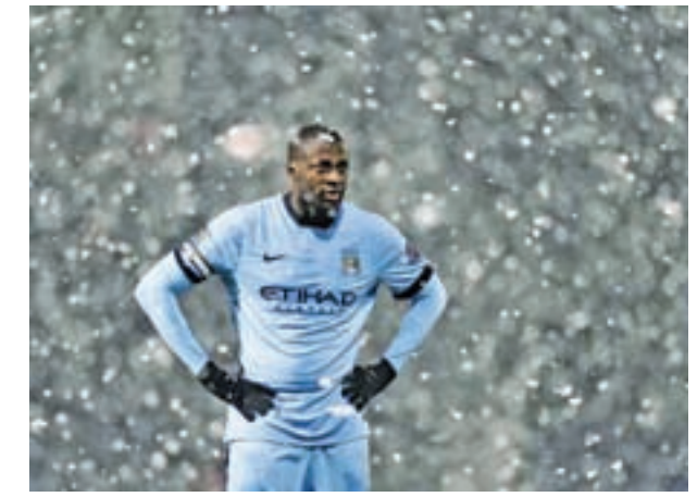
Manchester City's Yaya Toure stands in the snow during the English Premier League soccer match between Manchester City and West Bromwich Albion at The Hawthorns in West Bromwich, central England on 26 Dec, 2014.