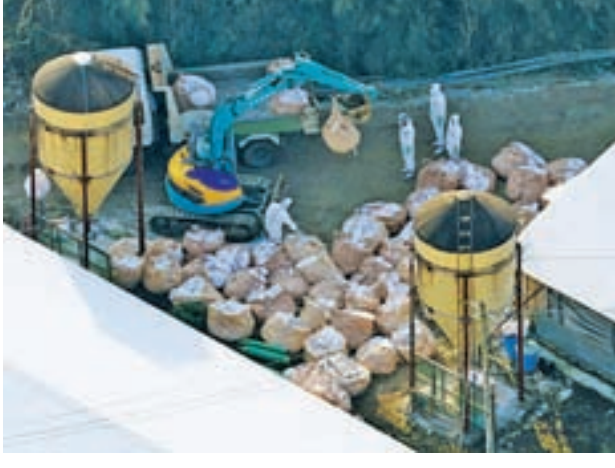
Local officials of the southwestern Japan prefecture of Miyazaki prepare to bury all of the 42,000 chickens culled in the early morning on 29 Dec, 2014, at a farm where a highly pathogenic bird flu virus was detected.

In Yamaguchi Prefecture, western Japan, the prefectural government announced early on Tuesday morning that a genetic test confirmed the virus at a farm in Nagato city, about 275 kilometers north of Miyazaki city, after a