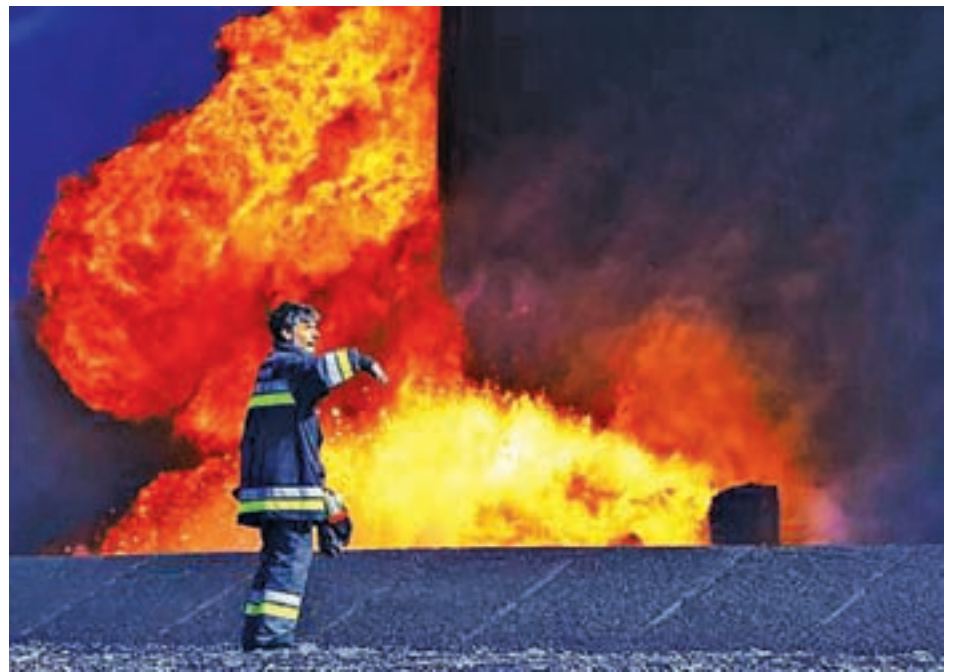
A firefighter stands near the fire of a storage oil tank at the port of Es Sider in Ras Lanuf on 29 Dec, 2014.

TRIPOLI, 30 Dec — Libya's recognized government has contracted a US firefighter firm to help extinguish fires at storage tanks at the Es Sider oil port, a spokesman said on Monday.