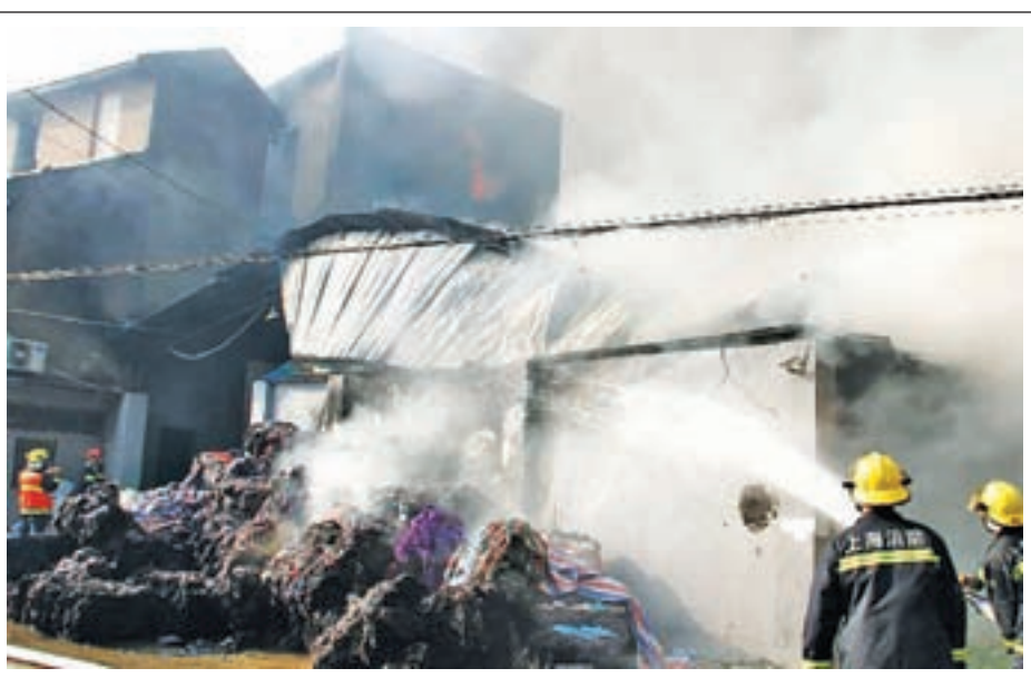
Firemen spray water to douse a fire that engulfed a factory in the Jinshan District in Shanghai, east China, on 29 Dec, 2014. No casualties were reported after the fire.