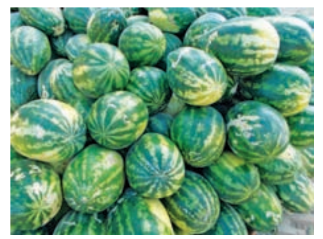
Local growers face declining prices of watermelon in Natogyi-Myingyan market.