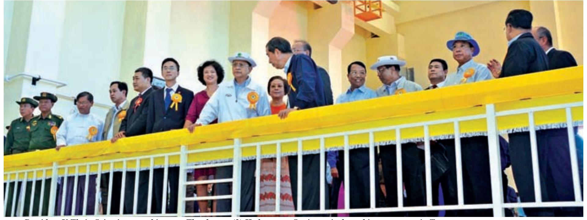
President U Thein Sein views machinery at Thaukyegat (2) Hydropower Station at its launching ceremony in Toungoo, Bago Region.—MNA

Nay Pyi Taw, 30 Dec— President U Thein Sein attended opening ceremony of second Thaukyegat hydropower plant in Toungoo Township, Bago region, Tuesday.