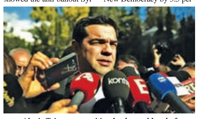
Alexis Tsipras, opposition leader and head of radical leftist Syriza party, talks to reporters outside the parliament building after the last round of a presidential vote in Athens on 29 Dec, 2014.

A poll by the same pollster published last week showed Syriza was leading New Democracy by 3.5 per-