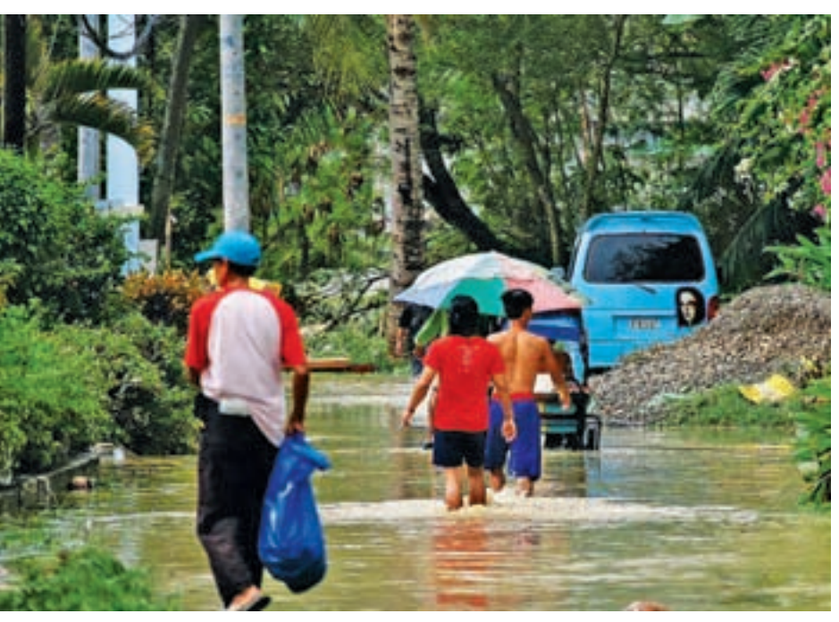
Residents walk in flood brought by Tropical Storm Jangmi in Cebu Province, the Philippines, on 30 Dec, 2014. At least six people died in flood-triggered incidents and another one was reportedly missing as Tropical Storm Jangmi (local name Seniang) hit central Philippines, government sources said on Tuesday.