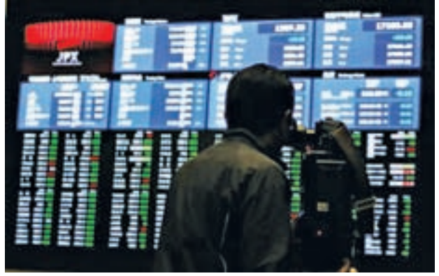
A cameraman films a stock quotation board at the Tokyo Stock Exchange in Tokyo on 15 Dec, 2014.

Токуо, 30 Dec Asian shares extended losses on Tuesday, as a sharp selloff in commodities overnight and political uncertainty in Greece made investors less willing to take risks in the final trading days of 2014.