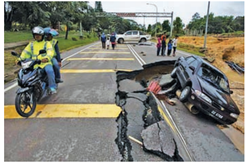
People ride past a road damaged by flooding at Kuala Krai in Kelantan on 30 Dec, 2014.

Most criticism was directed at Prime Minister Najib Razak for his absence as the disaster unfolded