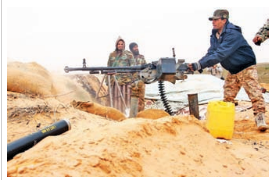
A Libya Dawn fighter aims his weapon during clashes with pro-government forces near Wetia airbase, Libya, on 29 Dec, 2014. Clashes continued between Libya Dawn fighters and pro-government forces on Monday near Wetia airbase, some 170 kilometres southwest of the capital Tripoli.

The rural areas north of Baghdad between Iraq's capital and Samarra, a shrine city for Shi'ites, has many Islamic State strongholds.