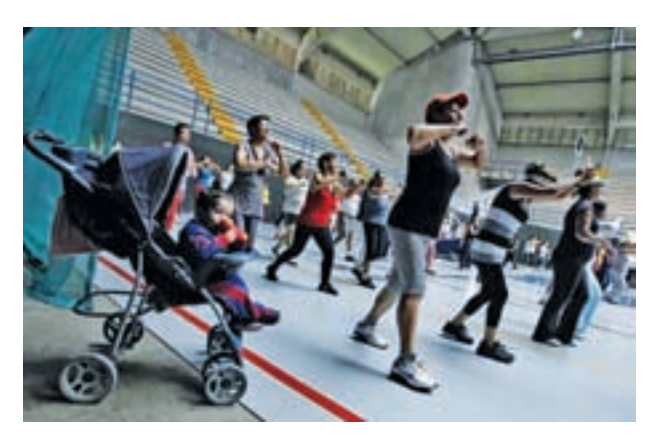
A child waits in his pram while his mother participates in an aerobics class at the gymnasium of a sports centre in Cartago, east of San Jose on 10 July, 2012.

New York, 30 Dec People seeking to get or stay fit in 2015 might do better to start today rather than rely on a New Year's resolution to shape up tomorrow, fitness experts say.