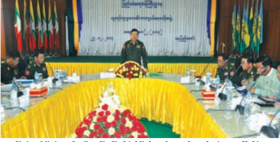
Union Minister Lt-Gen Ko Ko highlights plans of combating trafficking in persons.

The union minister who is also chairman of the central committee stressed the need to uplift capacity of community watch group members for prevention of trafficking in persons. He said that the legal affairs and prosecution working group are to draw the 2005 Anti-Human Trafficking Law together with local and foreign experts. He revealed that Australia-Asia Program