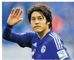
Schalke 04's Atsuto Uchida of Japan

The 26-year-old Uchida has played 72 times for the Blue Samurai, including matches at the World Cup in Brazil earlier this year and the Asian Cup tri-