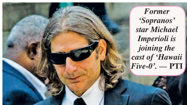
Former 'Sopranos' star Michael Imperioli is joining the cast of 'Hawaii Five-0'.