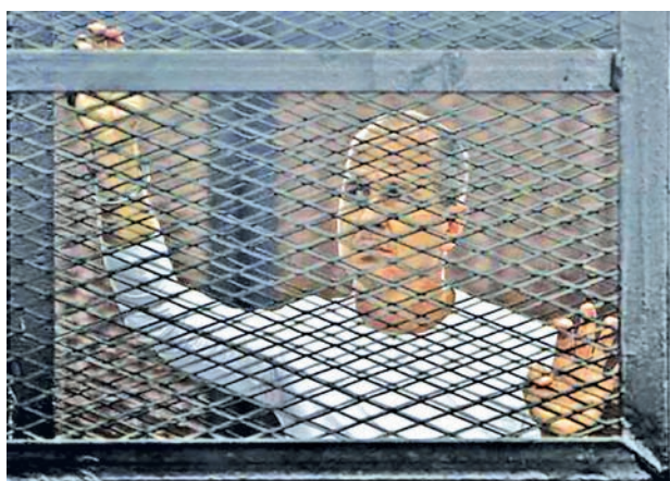
Al Jazeera journalist Peter Greste of Australia stands in a metal cage during his trial in a court in Cairo on 24 March, 2014.

Bishop last week raised the possibility Greste could be freed before an appeal hearing set