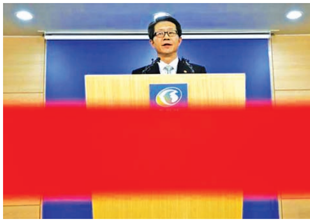
South Korea's Unification Minister Ryoo Kihl-jae releases a government statement during a news conference at the unification ministry in Seoul on 26 April, 2013.

"I don't think we will have any particular agenda, but our position is to discuss everything that South and North have mutual