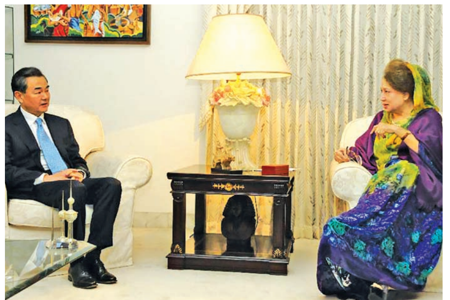
Chinese Foreign Minister Wang Yi (L) meets with Bangladesh's former prime minister and Bangladesh Nationalist Party (BNP) chairperson Khaleda Zia in Dhaka, Bangladesh, on 28 Dec, 2014.—XINHUA