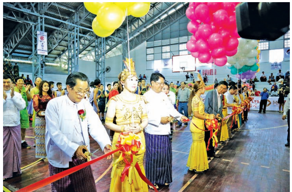
Union Minister U Tint Hsan, Chinese Ambassador Mr Yang Houlan and Chairman of Chinese Merchants Association of Myanmar U Myint Shwe formally open Myanmar-China friendship basketball tournament.

Enthusiasts may watch the matches at Aung San Gymnasium as of 1 pm daily.—MNA