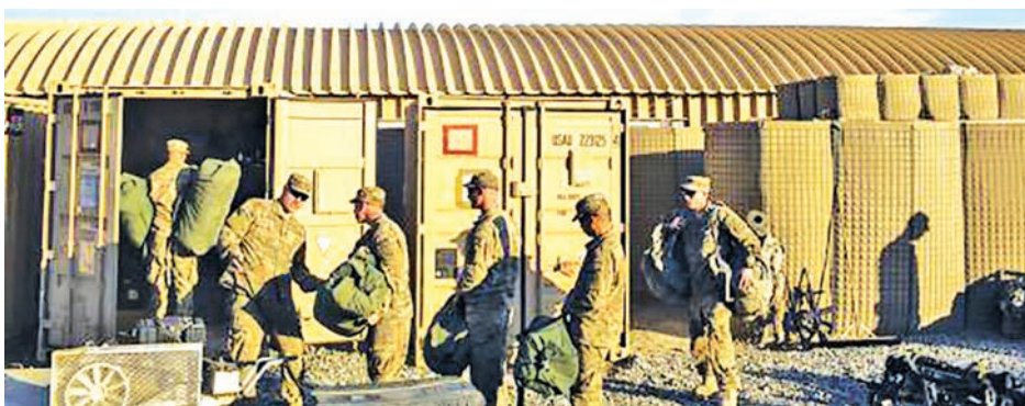
US soldiers from D Troop of the 3 rd Cavalry Regiment load bags into a container in preparation for leaving Afghanistan at forward operating base Gamberi in the Laghman Province on 28 Dec, 2014.