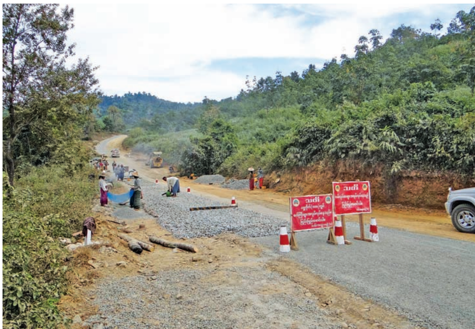
Skilled workers and engineers of Road Construction Project Special Group-8 construct road section.—MNA

On 28 December, the union minister met engineers and staff at the hall of Road Construction Project Special Group-8 in An. He also inspected upgrading of Minbu-An road section, construction of the retaining wall at Para Creek Bridge, Padan-Ngaphe-Sedok-tara-Saw road and Panhtein and Inn Bridges.—MNA