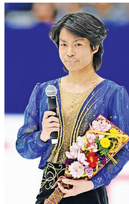
Sochi Olympian and world silver medalist Tatsuki Machida announces his retirement from competitive figure skating following the Japan national championships at Nagano Big Hat in the central Japanese city of Nagano on 28 Dec 2014.

Machida, who finished fifth at this year's Sochi Games, followed that up with the men's silver medal at the worlds in