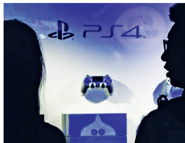
Visitors look at Sony Corp's PlayStation 4 game consoles and control pads displayed at a booth during the Tokyo Game Show 2014 in Makuhari, east of Tokyo on 18 Sept, 2014.

In late November, Sony Pictures' computer system was taken down by hackers protesting the film, "The Interview," which depicted the assassination of North Korean leader Kim Jong Un. US President Barack Obama has blamed the North Ko-