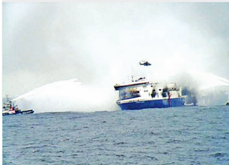
A rescue helicopter flies over the burning car ferry Norman Atlantic as fire fighting tug boats douse the vessel in south Adriatic sea on 28 Dec, 2014.