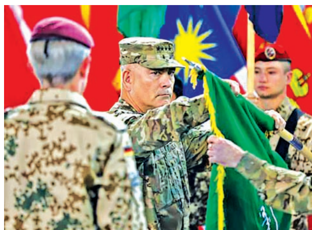
US General John Campbell (C), commander of NATO-led International Security Assistance Force (ISAF), folds the flag of the ISAF during the change of mission ceremony in Kabul, on 28 Dec, 2014.

“Today marks an end of an era and the beginning of a new one,” said US General John Campbell, commander of the International Security Assistance Force (ISAF), at the ceremony marking the end of the mission held at the ISAF headquarters in