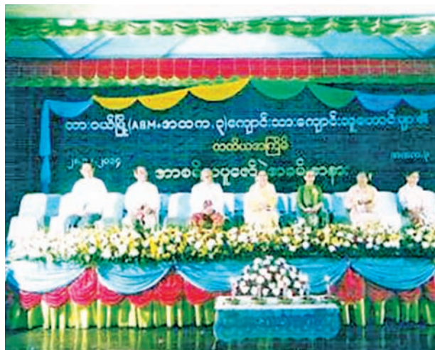
Dawei BEHS Branch and Maungmeshaung Village's BEHS Branch in Dawei Township.

At the ceremony, students paid respects to 94 retired teachers. Similar ceremonies took place at