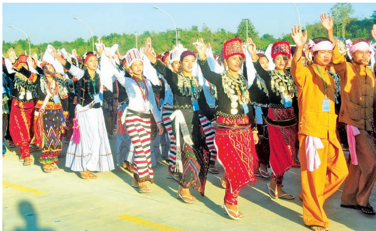
National races participate in rehearsal for 67 th Anniversary Independence Day's Grand Military Review ceremony.