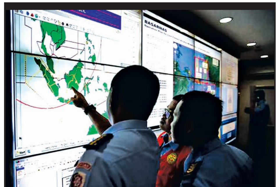
Military and rescue authorities monitor progress in the search for AirAsia Flight QZ8501 in the Mission Control Centre inside the National Search and Rescue Agency in Jakarta on 29 Dec, 2014.

By nationality, 149 of the passengers are Indonesian, with the six others being a Singaporean, a Malaysian, a Briton and