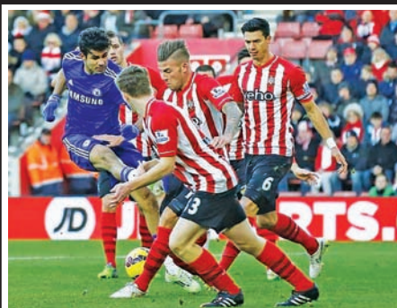
Diego Costa of Chelsea tries to shoot through a crowd of Southampton defenders during their English Premier League soccer match at St Mary's Stadium in Southampton, southern England, on 28 Dec, 2014.

were not awarded a penalty when Fabregas went down in the area but was booked for diving.