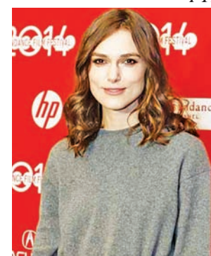
Keira Knightley says she was once mistaken for Anne Hathaway recently in Canada.