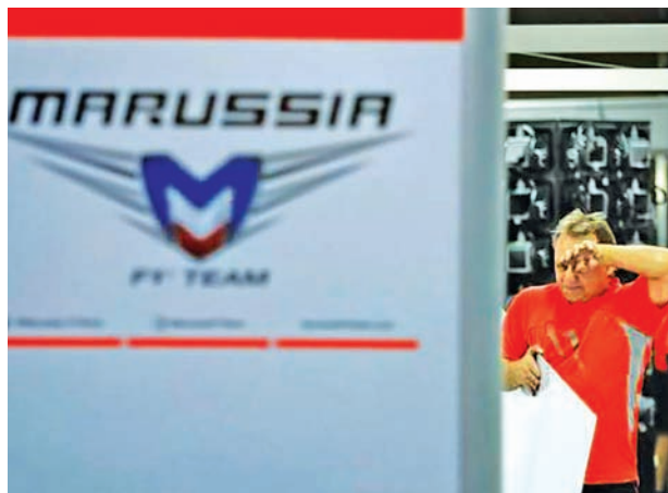
A pit crew of Marussia, which Formula One driver Jules Bianchi of France belongs to, wipes his face as he cleans up the pit after the Japanese F1 Grand Prix at the Suzuka Circuit on 5 Oct, 2014.

Much of the team's kit has been auctioned off al-