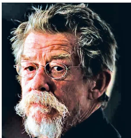
Veteran British actor John Hurt is set to receive a knighthood from Queen Elizabeth II in 2015.