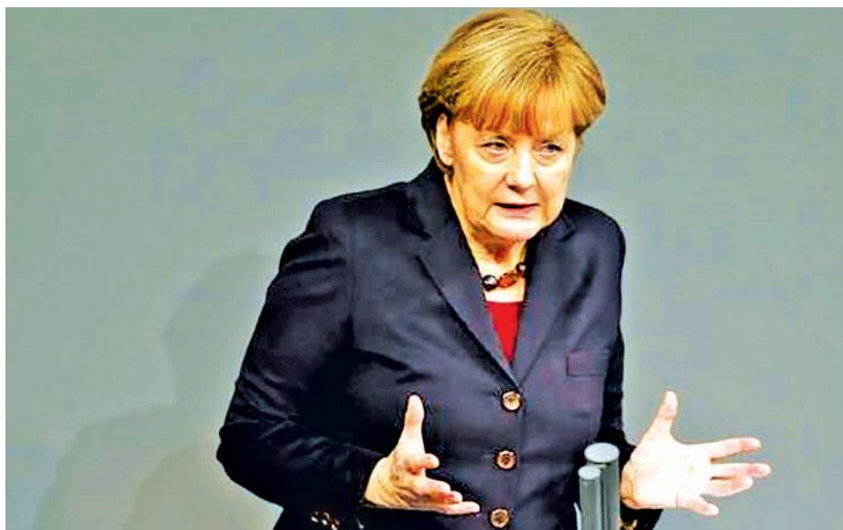
German Chancellor Angela Merkel holds a speech during a session at the lower house of parliament Bundestag in Berlin, on 18 Dec, 2014.