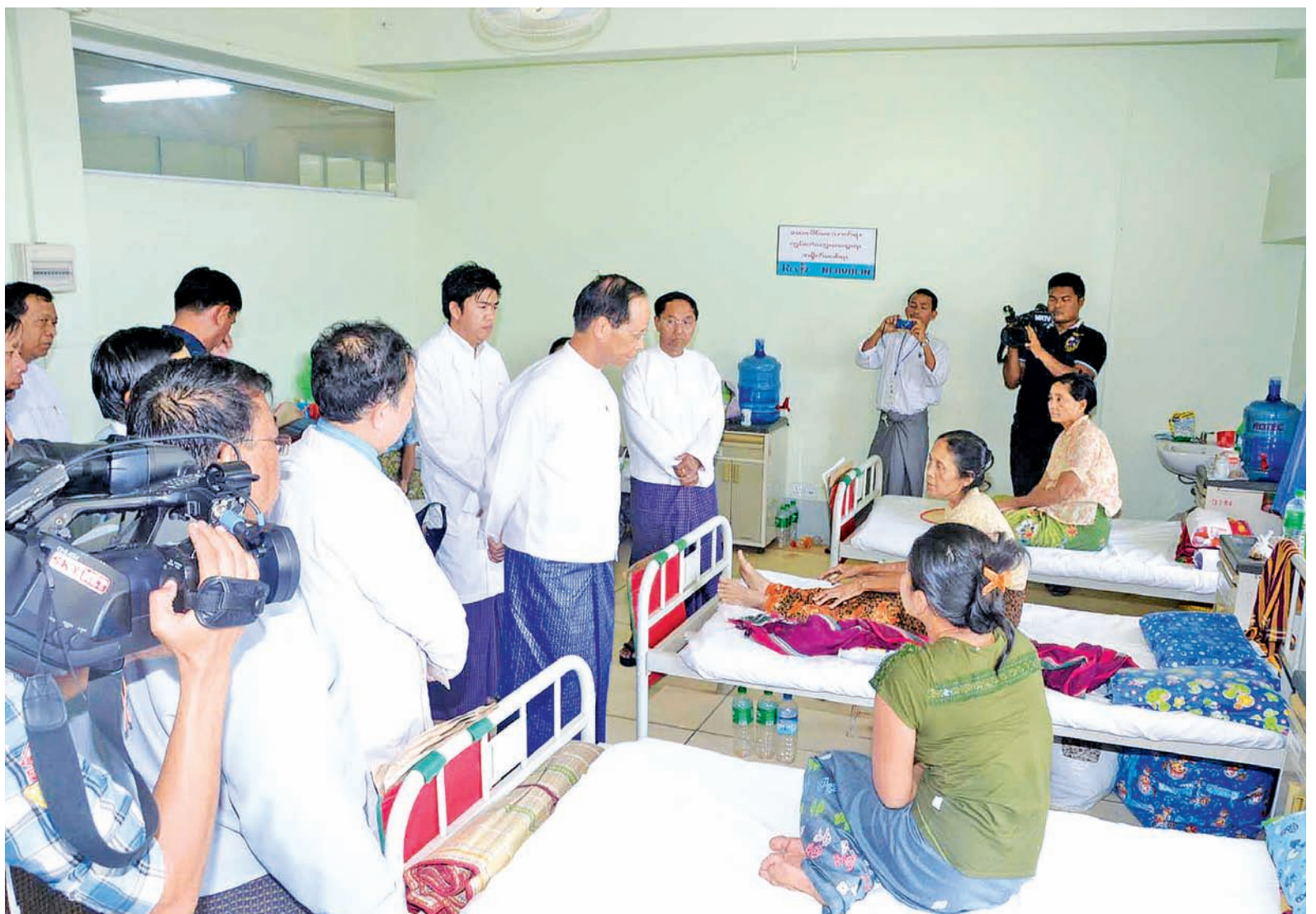
Vice President Dr. Sai Mauk Kham comforts patients at Renal and Kidney ward at 500-bed specialist hospital in Yangon.

The vice president then looked around upgrading and renovation works at the 1,500-bed Yangon General Hospital.