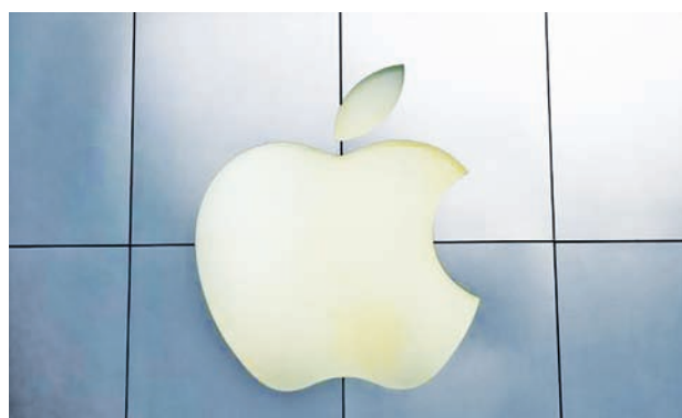
The Apple logo is pictured at its flagship retail store in San Francisco, California on 27 Jan, 2014.

the movie online via Google Inc's YouTube and Google Play, Microsoft Corp's Xbox gaming console and a Sony dedicated website first made the movie available last week after large movie theatre chains refused to screen the comedy following threats of violence from hackers who opposed the film.