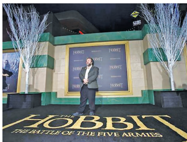
Writer, producer and director Peter Jackson poses at the premiere of "The Hobbit: The Battle of the Five Armies" at Dolby theatre in Hollywood, California on 9 Dec, 2014.

"Into The Woods," the adaptation of Stephen