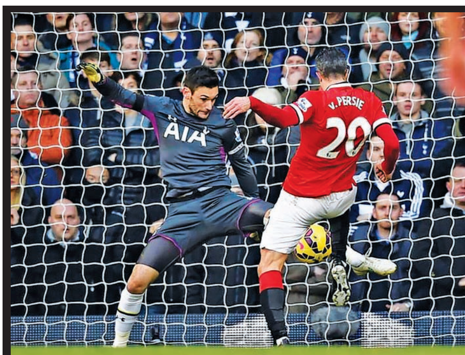
Manchester United's Robin van Persie (R) fails to score past Tottenham Hotspur's Hugo Lloris (L) during their English Premier League soccer match at White Hart Lane in London on 28 Dec, 2014.

Jose Mourinho's team remained three points clear at the top.