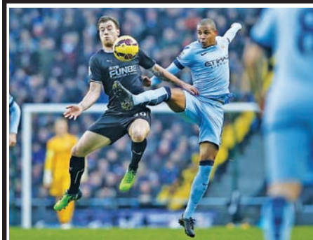
Manchester City's Fernando (R) challenges Burnley's Ashley Barnes during their English Premier League soccer match at the Etihad Stadium in Manchester, northern England on 28 Dec, 2014.