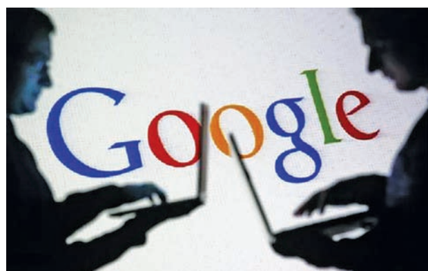
People are silhouetted as they pose with laptops in front of a screen projected with a Google logo, in this picture illustration taken in Zenica on 29 Oct, 2014.

BEIJING, 29 Dec — Google Inc's Gmail was blocked in China after months of disruptions to the world's biggest email service, with an anti-censor-