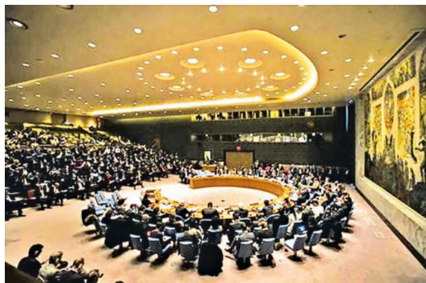
The United Nations Security Council meets on the crisis in Ukraine, at UN Headquarters in New York, on 13 March, 2014.

MEXICO CITY, 29 Dec — Mexico on Sunday called for an overhaul of the United Nations Security Council, envisaging more member countries across a wider geographical swathe, as the government steps up efforts to raise its profile on the global stage.