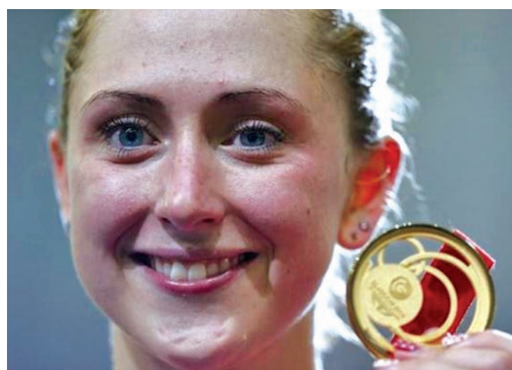
England's Laura Trott holds her gold medal after winning the women's 25km points race finals cycling race at the 2014 Commonwealth Games in Glasgow, Scotland, on 27 July, 2014.

one. I've had the most amazing couple of days thanks to @JasonKenny107 and the whole family #engaged", Trott write on Twitter on Thursday.