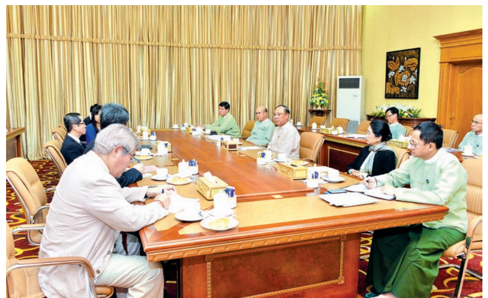
Union Minister U Win Tun holds talks with Vice Mayor of Sapporo City Mr Noriaka Ikushima and party of Japan.

They discussed exchange of animals between Sapporo Maruyama zoological gardens of Japan and Yangon zoological gardens in commemoration of the 60 th anniversary of Myanmar-Japan diplomatic relations, technical assistance to be provided by Sapporo Maruyama Zoo to Yangon Zoo, establishment of elephant sanctuaries, care of domesticated elephants, drawing