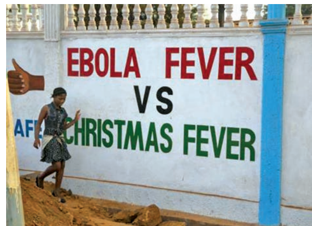
A girl walks past a sign in Freetown on 21 Dec, 2014.