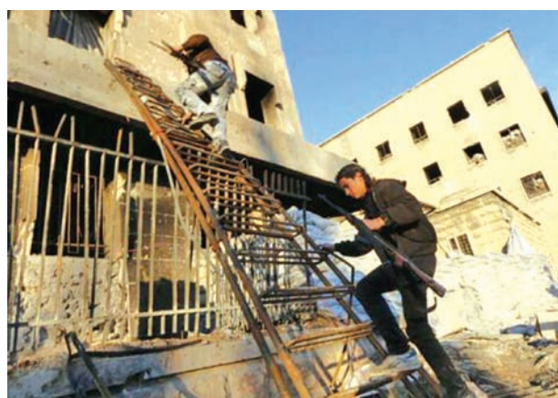
Rebel fighters climb a ladder to the justice palace near Aleppo's historic citadel controlled by forces loyal to Syria's President Bashar al-Assad on 23 Dec, 2014.