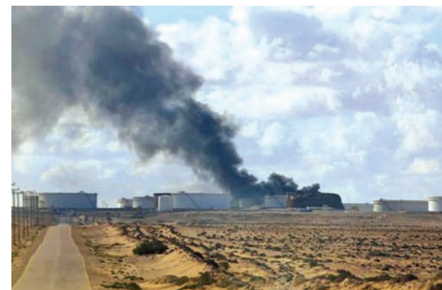
Black smoke billows out of a storage oil tank in the port of Es Sider in Ras Lanuf on 25 Dec, 2014.