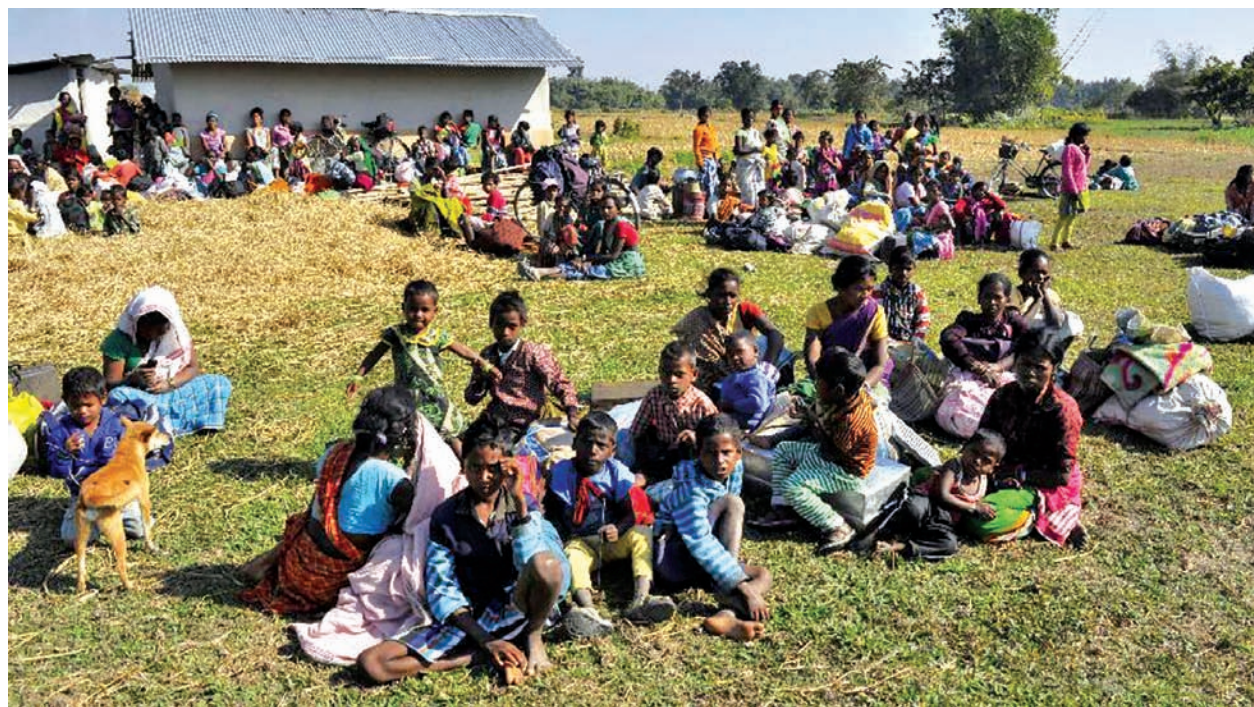
Tribal people, who fled from their villages after an attack by indigenous separatist groups, take refuge at a school in Sonitpur District of Indian eastern state of Assam, on 24 Dec, 2014.

NEW DELHI, 26 Dec — The Indian Army on Friday said that it would intensify its operations against Bodo militants, who killed over 80 people in the northeastern state of Assam on Tuesday.