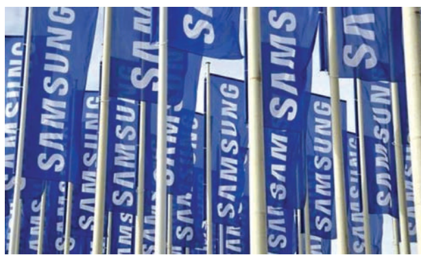
Samsung flags are set up at the main entrance to the Berlin fair ground before the IFA consumer electronics fair in Berlin, on 28 Aug, 2012.

The company announced and then scrapped plans for a Tizen phone launch in Russia during the third quarter, citing the