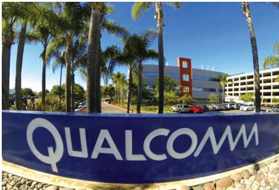
A Qualcomm sign is pictured in front of one of its many buildings in San Diego, California on 5 Nov, 2014.

BEIJING, 26 Dec — The Chinese government said on Friday that it will soon settle its antitrust investigation of US mobile chipmaker Qualcomm Inc (QCOM.O).