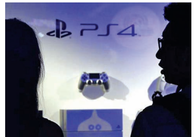
Visitors looks at Sony Corp's PlayStation 4 game consoles and control pads displayed at a booth during the Tokyo Game Show 2014 in Makuhari, east of Tokyo on 18 Sept, 2014.

Spokespeople at Sony and Microsoft did not immediately respond for comment.