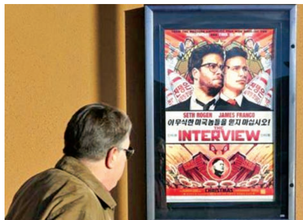
A man walks by the poster for the film "The Interview" outside the Alamo Drafthouse theater in Littleton, Colorado on 23 Dec, 2014.

"With that in mind, we reached out to Google, Microsoft and other partners last Wednesday, 17 December, when it became clear our initial release plans were not possible. We are pleased we can now join with our