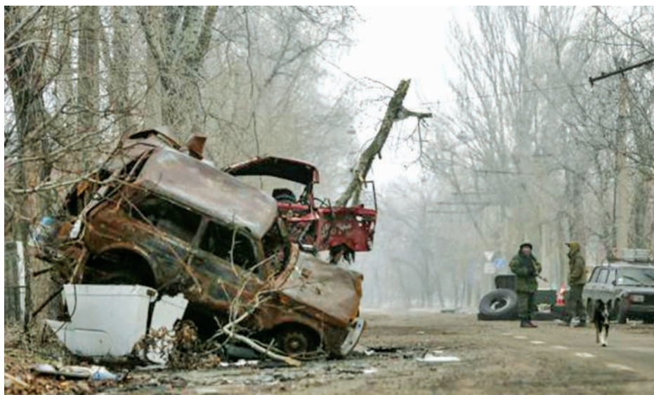
Rebels stand guard next to cars damaged during fighting between rebels and Ukrainian government forces near Donetsk Sergey Prokofiev International Airport, eastern Ukraine, on 16 Dec, 2014.

The pro-Western government in Kiev accuses Russia of orchestrating the rebellion in Ukraine's east, a charge denied by