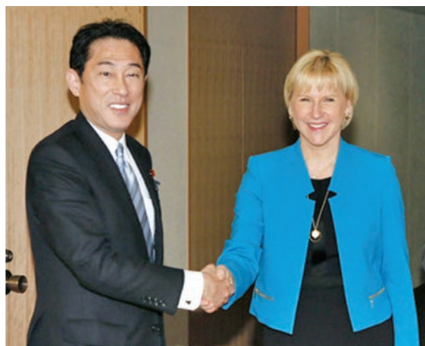
Visiting Swedish Foreign Minister Margot Wallstrom (R) and Japanese Foreign Minister Fumio Kishida shake hands at the Foreign Ministry in Tokyo on 24 Dec, 2014, prior to their talks.