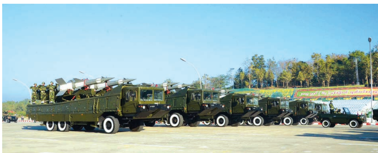
Missile carriers taking part in rehearsal for 67 th Anniversary Independence Day's Grand Military Review Parade.(News on page 1)

Mya Ayeya Sports Festival will be held from 24 to 27 December with 17 sports events.