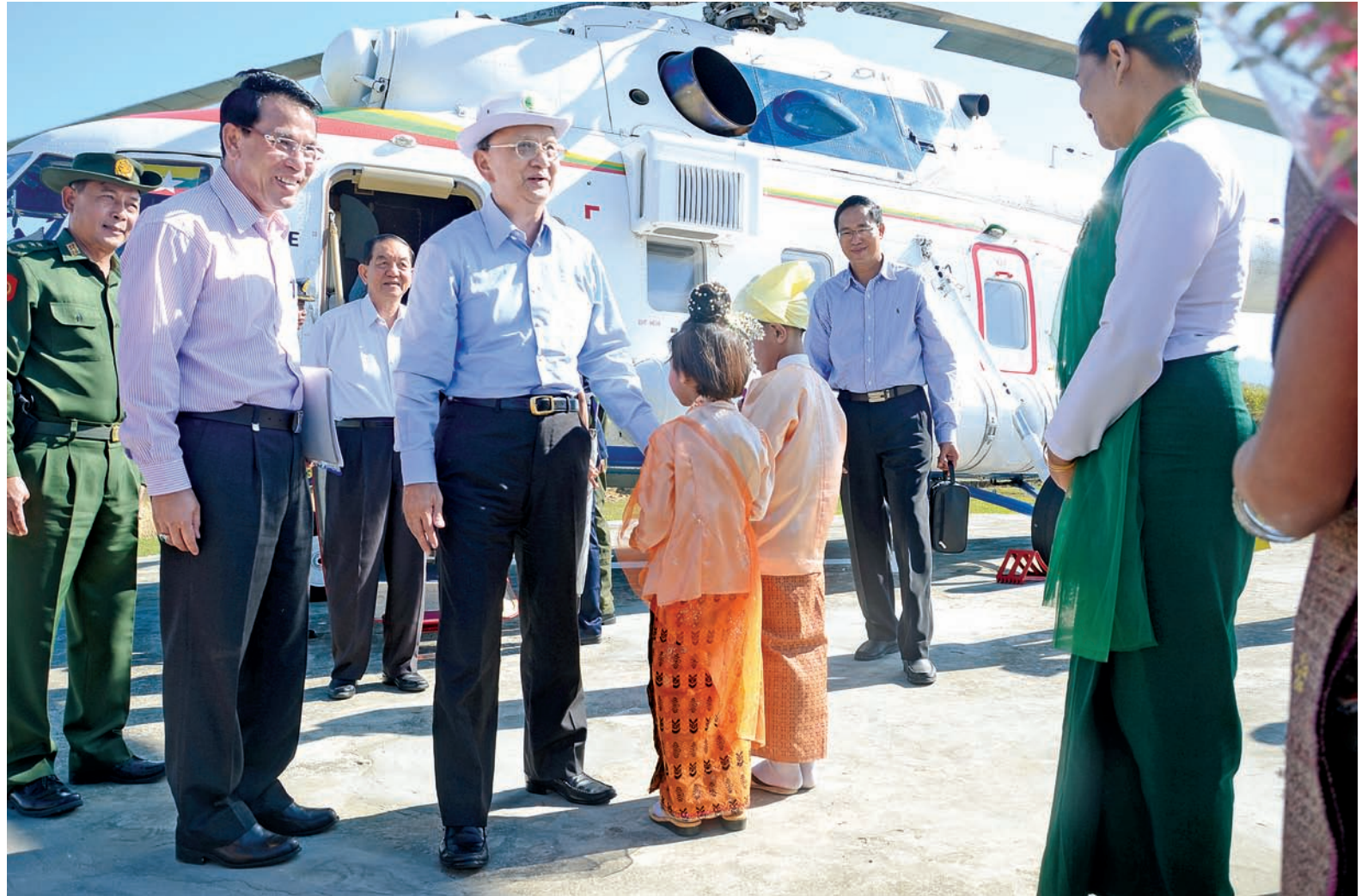
President U Thein Sein being welcomed by locals in Kyauktaw, Rakhine State.

At the U Uttama Hall in Sittway, he met with members of the local government, parliamentari-