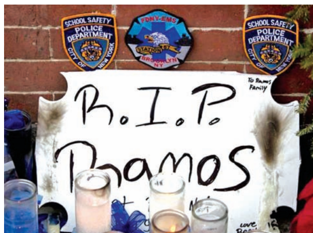
A sign of support is left at the makeshift memorial at the site where two police officers were shot in the head in the Brooklyn borough of New York on 22 Dec, 2014.