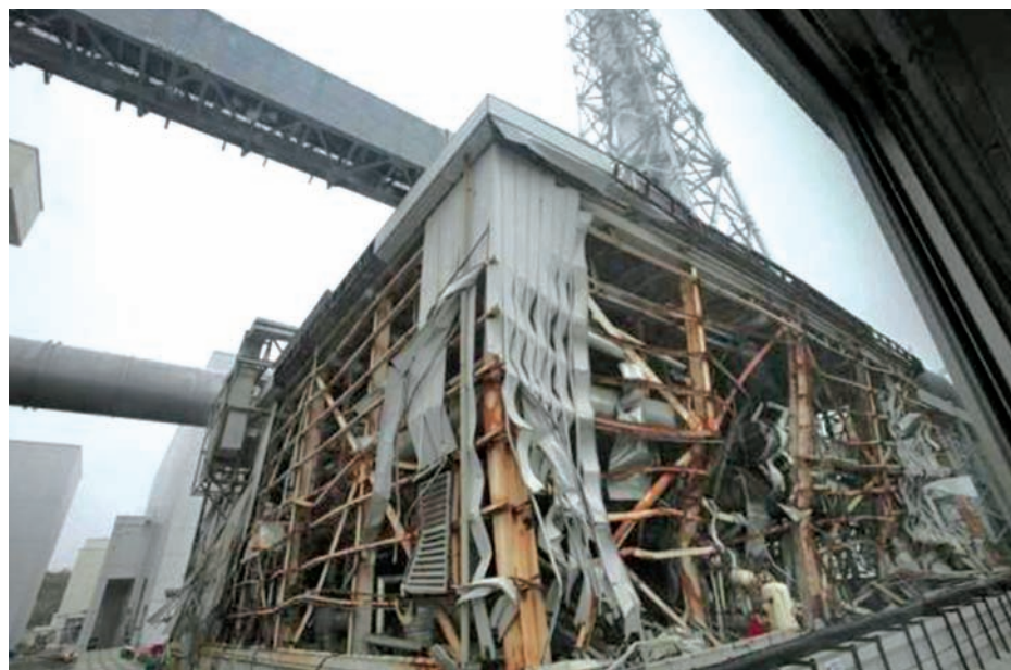
A general view of a building of Tokyo Electric Power Company's (TEPCO) tsunami-crippled Fukushima Daiichi nuclear power plant is seen from a bus during a media tour at the plant in Fukushima prefecture on 12 June, 2013.

Prosecutors last year declined to charge more than 30 Tepco and government officials who had