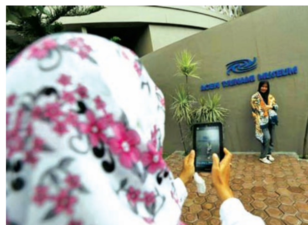
A woman takes pictures of her daughter in front of the Aceh Tsunami Museum in Banda Aceh, on 25 Dec, 2014.