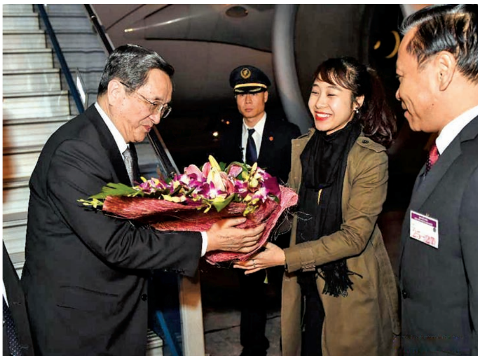
Yu Zhengsheng (1 st L), a member of the Standing Committee of the Political Bureau of the Communist Party of China (CPC) Central Committee and chairman of the National Committee of the Chinese People's Political Consultative Conference (CPPCC), arrives in Hanoi, Vietnam, on 25 Dec, 2014, for an official visit.

Yu is visiting Hanoi from Thursday to Saturday at the invitation of the CPV Central Committee and the Fatherland Front of Vietnam.—Xinhua