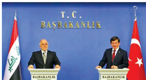
Iraqi Prime Minister Haider al-Abadi and Turkey's Prime Minister Ahmet Davutoglu (R) addresses the media in Ankara 25 Dec, 2014.

ANKARA, 26 Dec — Turkey and Iraq, both worried by the advance of Islamic State, pledged on Thursday to work towards greater military cooperation in their fight against the ultra radical Sunni militants.