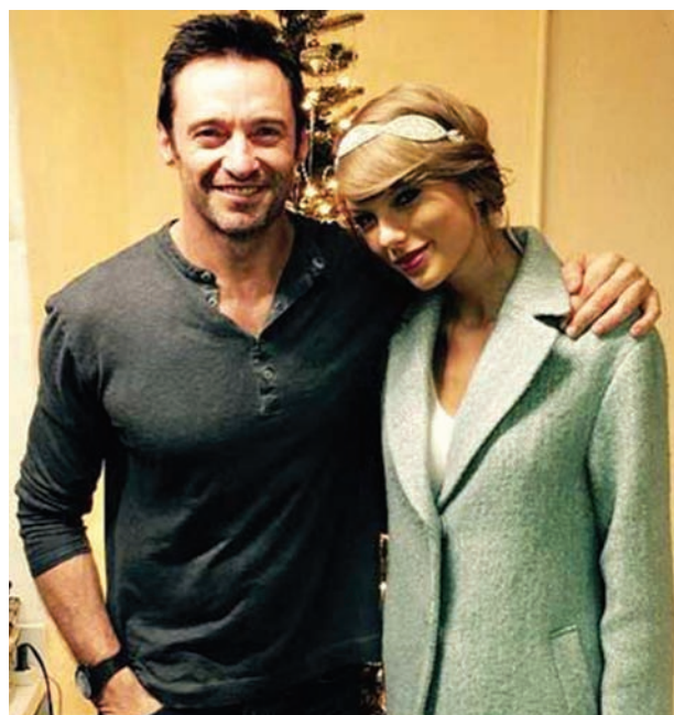
Singer Taylor Swift has dropped USD 6,000 to win Hugh Jackman’s shirt in an auction.

Jackman, 46, also auctioned another T-shirt, which he was wearing during his performance, for the charity and raised an additional USD 6,000 from another audience member and threw in USD 6,000 himself. One of the audience even offered USD 2,000