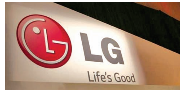
The LG company logo is seen following an event during the annual Consumer Electronics Show (CES) in Las Vegas, Nevada on 6 Jan, 2014.