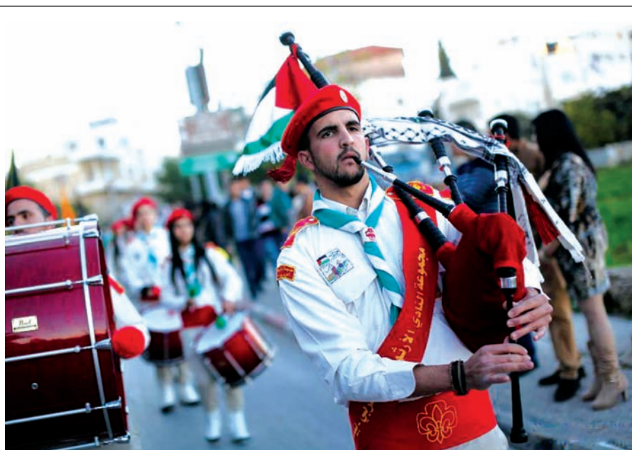
Palestinian scouts perform during the Annual Candle Lighting ceremony on the Christmas Day in the West bank city of Beit Sahour near Bethlehem on 25 Dec, 2014.