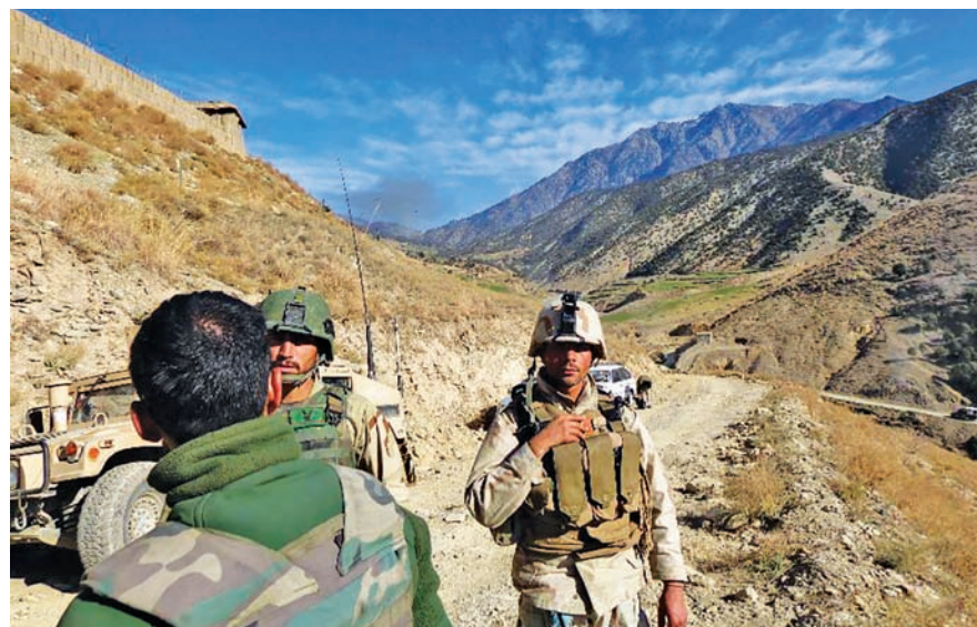
Afghan security forces keep watch during their operation in Dangam District of Kunar Province in eastern Afghanistan, on 22 Dec, 2014. The Afghan army has waged an offensive in Dangam District of eastern Kunar Province, which has been the scene of fierce clashes within the past 10 days, an army source said on Monday. — XINHUA