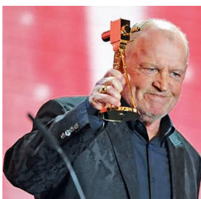
British singer Joe Cocker speaks after receiving the trophy for Category 'lifetime achievement award music' during the 48th Golden Camera award ceremony in Berlin, on 2 Feb, 2013.

The Sheffield-born Cocker's rocky but ultimately successful career took him from working-class pubs in Northern England to the