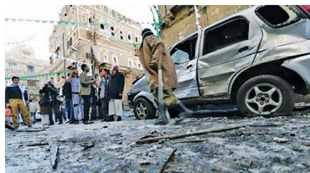
People gather at the site of a bomb explosion in Sanaa on 23 Dec, 2014.

Yemen has been in turmoil since mass protests in 2011 forced long-ruling President Ali Abdullah Saleh to step down. But tensions have increased after the Houthi takeover of Sanaa in September.— Reuters