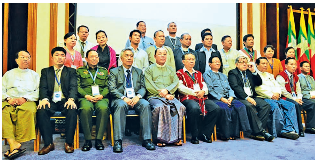
UPWC and NCCT officials pose for documentary photos after conclusion of a nationwide ceasefire accord coordination meeting prior to the seventh round of peace meetings set to take place in mid-January.