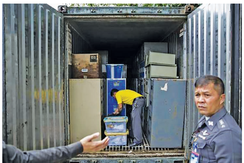
Boxes with personal possessions of 2004 tsunami victims are put back into a container outside a police station in Takua Pa, in Phang Nga Province on 19 Dec, 2014.