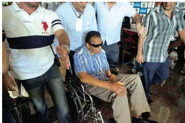
Former boxer Muhammad Ali of the US sits in a wheelchair as he is taken to a photo session with attendees of the 50th Convention of the World Boxing Council in Cancun on 4 Dec, 2012.

LOUISVILLE, (Kentucky), 23 Dec — The condition of Muhammad Ali has "vastly improved" since he was admitted to the hospital over the weekend with a mild case of pneumonia and doctors hope to discharge the boxing legend soon, a spokesman said on Monday.