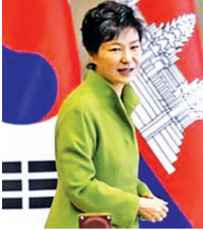
South Korean President Park Geun-hye

SEOUL, 23 Dec — A recent series of leaks of data from South Korea's nuclear operator was a "grave situation" that was unacceptable as a matter of national security, President Park Geun-hye said on Tuesday.