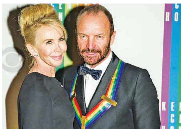
Musician Sting and his wife Trudie Styler arrive for the Kennedy Centre Honours in Washington on 7 Dec, 2014.

NEW YORK, 23 Dec — Grammy-winning rock star Sting has boosted ticket sales of his Broadway musical "The Last Ship" and won praise for his performance as a foreman in the show based on his childhood in a shipbuilding town in northeast England. "The Last Ship," the first Broadway musical written by Sting, opened on 26 October to mixed reviews, win-