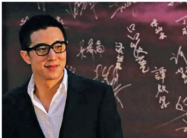
Hong Kong actor Jaycee Chan arrives at the Hong Kong Film Awards in this 19 April, 2009 file photo.