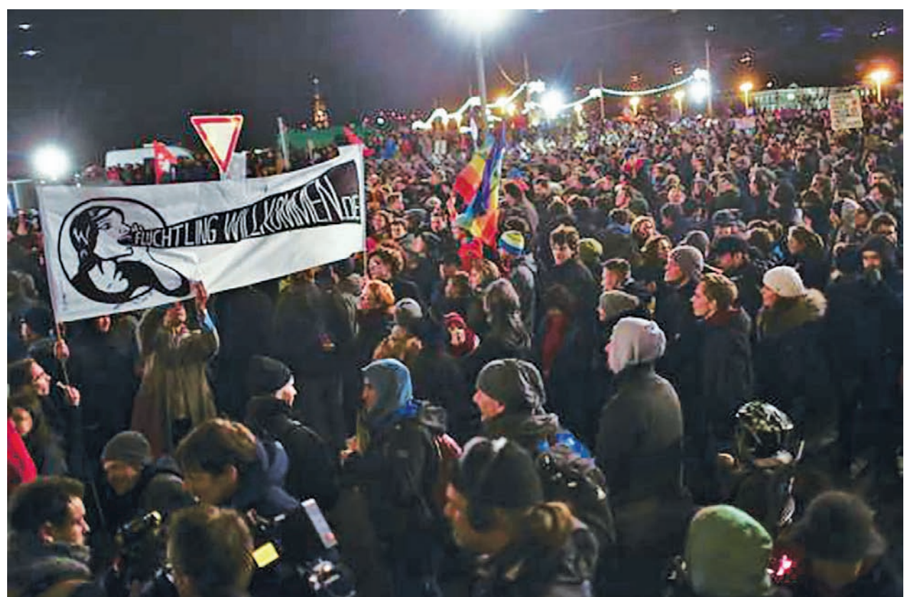
Participants of an alternative rally hold a banner reading 'Refugee welcome.de' as they protest against a demonstration called by anti-immigration group PEGIDA, a German abbreviation for "Patriotic Europeans against the Islamization of the West", in Dresden on 22 Dec, 2014.

Instead of their usual marches through the nighttime streets, the rally remained at the crowd sang Christmas classics