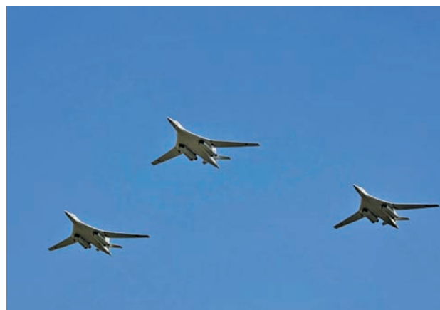
Long-range aviation units are currently amid a massive modernization of the aircraft and engines of all types.