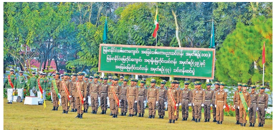
Trainees at graduation parade of basic forestry and land survey courses.—MNA

So far, Myanmar Forestry School has turned out 5,864 forestry staff since 1898. The land survey training school has also produced 11,970 officers and staff since 1947.—MNA