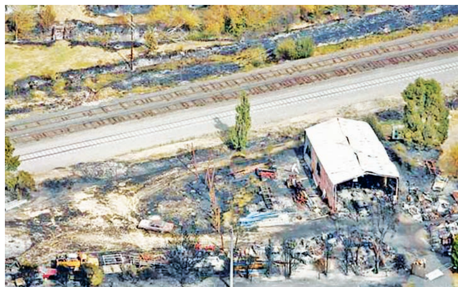
The remains of a house destroyed by bushfires is seen in the town of Kinglake, about 46 kms (29 miles) north east of Melbourne on 8 Feb, 2009.

A$378.6 million, with Utility Services paying A$12.5 million and the Victorian