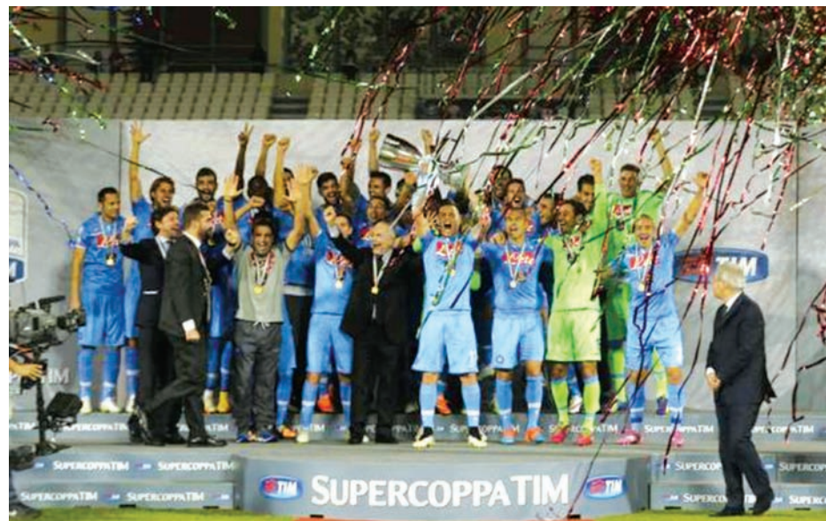
Napoli’s players celebrate with the trophy after winning their Italian Super Cup match against Juventus at Al-Sadd Stadium, in Doha, on 22 Dec, 2014.

In a thrilling penalty shootout that saw both keepers produce a string of stunning saves, Buffon made three saves but his acrobatic efforts were not enough as Juve missed four spot kicks. The shootout started ominously for both