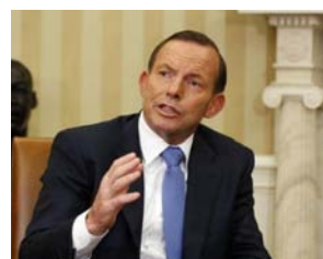
Australian Prime Minister Tony Abbott

rity agencies today indicated that there has been a heightened level of terrorist chatter in the aftermath of the Martin Place siege," Abbott told reporters in Sydney. "That's why it's important that people remain alert."