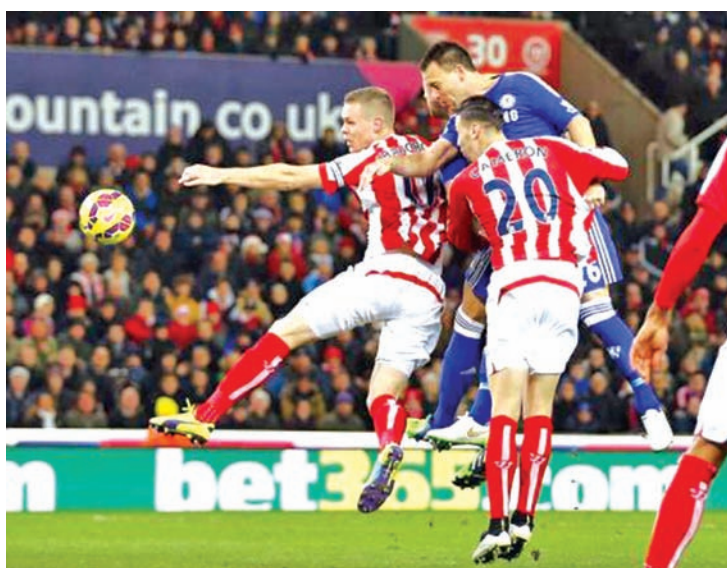
Chelsea’s John Terry (R in blue) heads the opening goal during their English Premier League soccer match against Stoke City at the Britannia Stadium in Stoke-on-Trent, northern England on 22 Dec, 2014.

“These victories mean more than three points, to win and get three points the players need the right spirit and mentality, to win here they must be a really very good team with the capacity to adapt to Stoke’s style of play,” Chelsea manager Jose Mourinho told the BBC. Chelsea, who host West Ham United on Friday, have 42 points from 17 games with Manchester City, who visit West Brom the same day, on 39 and Manchester United on 32. “Now