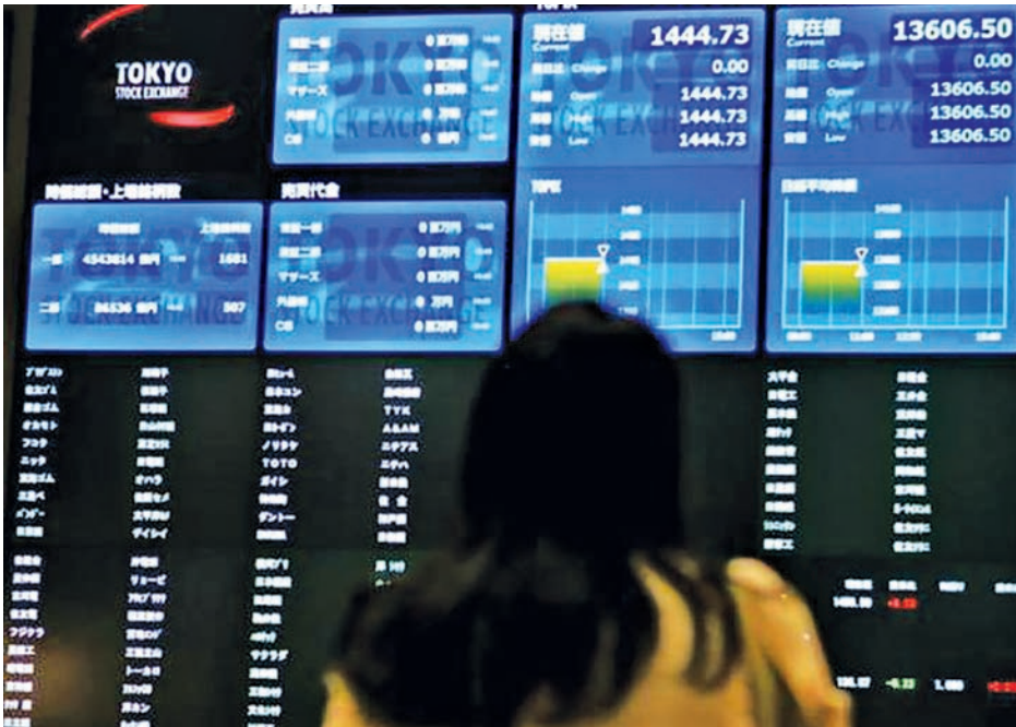
A woman looks up at a Tokyo Stock Exchange in Tokyo on 1 Nov, 2005.

SYDNEY, 23 Dec — A holiday hush settled over Asian markets on Tuesday after Wall Street closed at historic highs while oil prices recouped just a little of the losses suffered when Saudi Arabia quashed all thought of curbing supply.