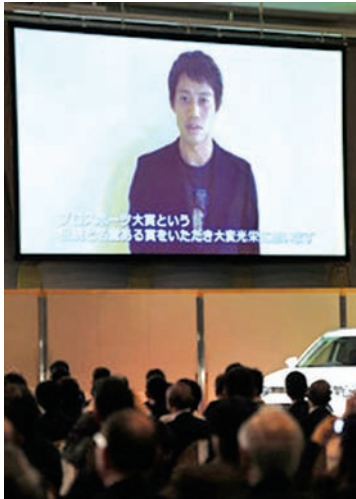
Professional tennis player Kei Nishikori appears in a video message at the Japan Pro Sports Awards in Tokyo on 22 Dec, 2014, after being named winner of the grand prize.

TOKYO, 23 Dec — Kei Nishikori, who took the tennis world by storm this year, when he reached the finals of the US Open and competed at the season-ending Tour Finals, was named the winner of the grand prize at the Japan Pro Sports Awards on Monday.