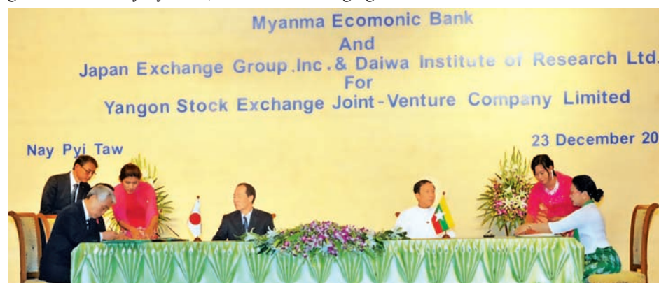
Union Minister U Win Shein attends signing ceremony of agreement on establishment of Yangon Stock Exchange.—MNA