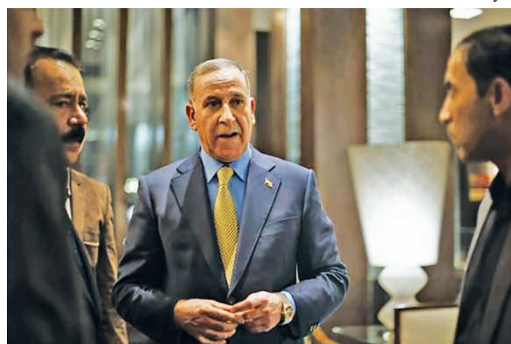
Iraqi Defence Minister Khaled al-Obeidi speaks to the media in Amman on 22 Dec, 2014.