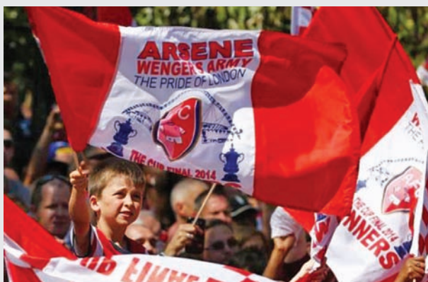
A young Arsenal fan waves his flag as he watches a victory parade after Arsenal won the FA Cup final soccer match against Hull City at Wembley Stadium on Saturday, in London on 18 May, 2014.

against it after Terry timed his run to perfection and beat Asmir Begovic with a powerful header for his first league goal in over a year. Mark Hughes’s side tried to harry and hustle Chelsea but the superior class of the leaders always shone through. Courtois, back after a muscular injury, was rarely troubled although the Belgian needed to produce a fine save midway through the first half from Steven N’Zonzi’s deflected strike. Top scorer Diego Costa should have increased Chelsea’s lead when Stoke tried and failed to catch him offside, the Spaniard timing his run perfectly — only to the skew his shot wide. Fabregas might have been awarded a penalty when he appeared to be clipped by Ryan Shawcross soon after halftime but Stoke escaped. Charlie Adam drilled wide from edge of box following neat approach play from Stoke but Chelsea soaked up the pressure and made the points safe when Eden Hazard, who needed lengthy treatment in stoppage time, fed Fabregas and the Spaniard beat Begovic.—Reuters