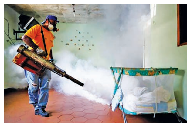
A worker from the municipality of Sucre carries out fumigation to help control the spread of Chikungunya and dengue fever, which are caused by viruses carried by mosquitoes, in the Petare slum district of Caracas on 22 Sept, 2014.