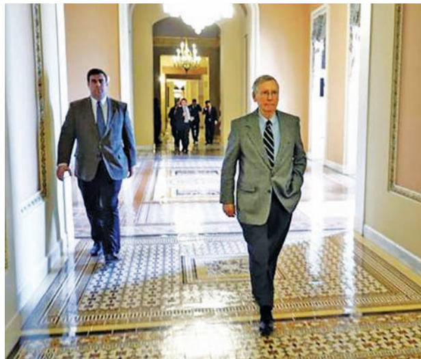
US Senate Minority Leader Mitch McConnell (R-KY) walks to the Senate floor during a long series of votes, many on procedural matters or to confirm members of the Obama administration, at the US Capitol in Washington on 13 Dec, 2014.

WASHINGTON, 23 Dec — Senate Republican leader Mitch McConnell said on Monday he opposed US President Barack Obama's plans to normalize relations with Cuba, and spoke of steps lawmakers might take to rein in the new policy.