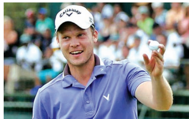
Danny Willett of England celebrates winning the Nedbank Challenge at Sun City on 7 Dec, 2014.

There will be further opportunities for players to qualify for the April 9-12 Masters, including an updated top-50 world ranking heading into the week of the tournament.