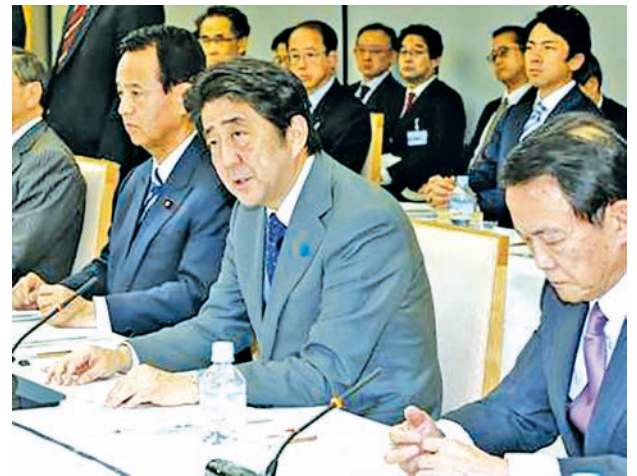
Japanese Prime Minister Shinzo Abe (C) attends a meeting of the Council on Economic and Fiscal Policy on 22 Dec, 2014, in Tokyo.

The basic outline is scheduled to be endorsed by the Cabinet Saturday and will be reflected in the fiscal 2015 budget that will be crafted next month. The government vowed in the outline it will "absolutely" implement a consumption tax hike to 10 percent in April 2017, which was postponed by 18 months amid an economic slowdown in the wake of the 1 April tax increase to 8 percent from 5 percent. It also committed to mapping out a concrete strategy by next summer to attain its fiscal reform goal in fiscal