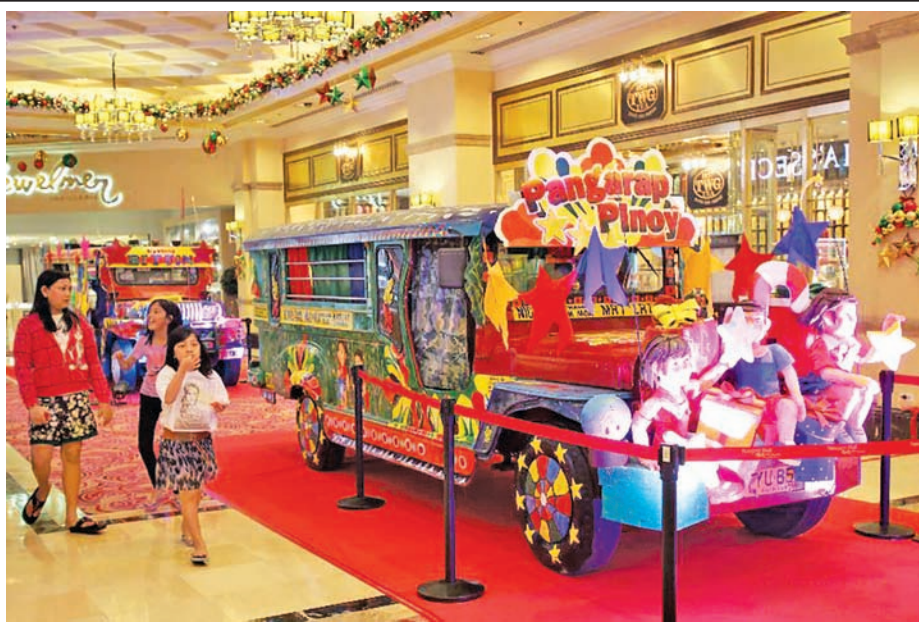
People walk past a colourful jeepney during the Jeepney Design Challenge inside a mall in Pasay City, the Philippines, on 22 Dec, 2014. The Jeepney Design Challenge showcases 14 colourfully-designed jeepneys from various regions all over the country.