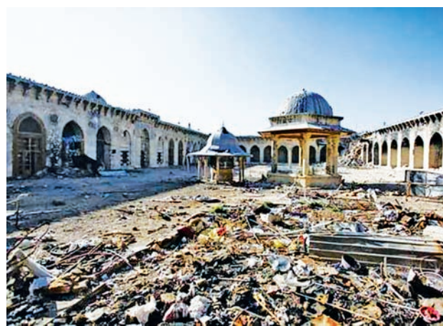
A general view of damage in the Umayyad mosque of Old Aleppo, on 15 Dec, 2013.