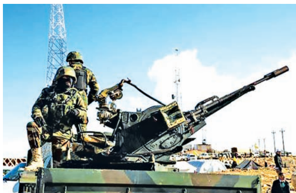
Members of Kurdish security forces ride in a vehicle at Mount Sinjar, in the town of Sinjar, on 21 Dec, 2014.