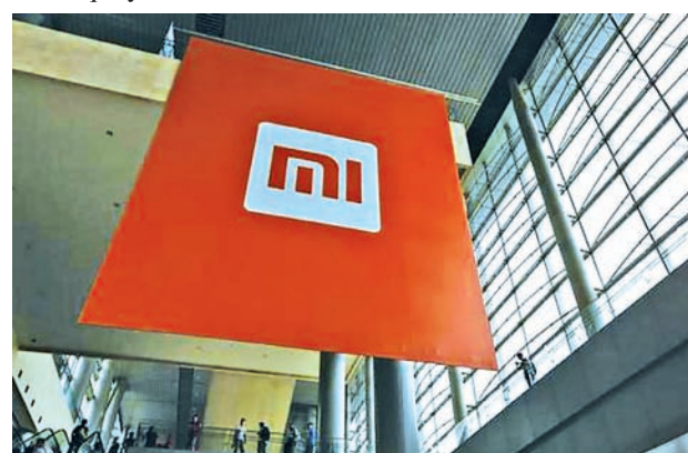
People stand near a logo of Xiaomi ahead of the launching ceremony of Xiaomi Phone 4, in Beijing, on 22 July, 2014.