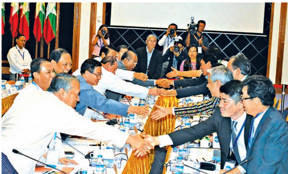
UPWC and NCCT officials exchange handshakes with each other before the start of NCA coordination meeting prior to the seventh round of peace meetings, which are expected to be held in January.