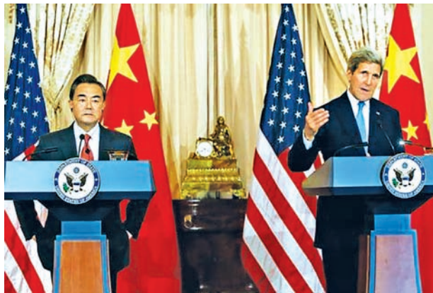
US Secretary of State John Kerry (R) delivers remarks as China’s Foreign Minister Wang Yi (L) looks on, before their meeting at the State Department in Washington on 1 Oct, 2014.

“It’s our judgment that the control system itself is designed in such a way and there is no risk whatsoever,” Chung Yang-ho, deputy energy minister, told