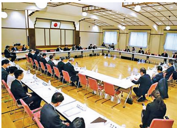
Photo taken on 22 Dec, 2014, at Japan’s education ministry in Tokyo shows a general meeting of the Central Council for Education. The panel proposed a new university entrance test system, under which “evaluation” tests would be conducted multiple times a year so applicants can use the best results for their college entrance.—KYODO NEWS

The advisory body also called for the separate introduction of new tests to assess high school students’ basic academic skills in the 2019 academic year starting on 1 April, 2019.—Kyodo News