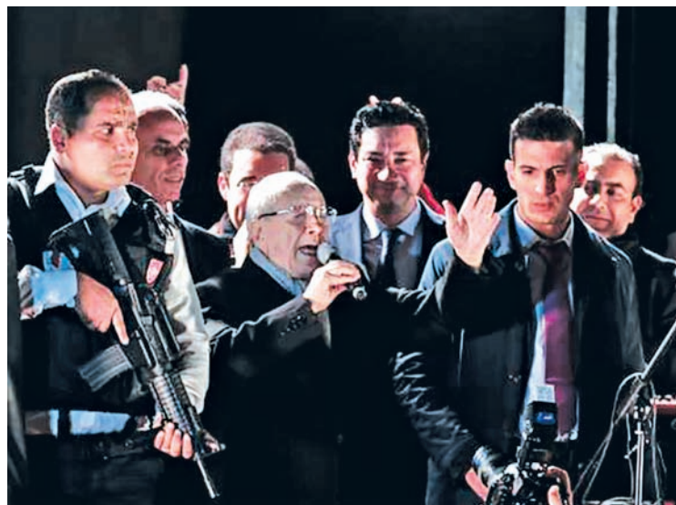
Beji Caid Essebsi (C), Nidaa Tounes party leader, gestures outside the party headquarters in Tunis on 21 Dec, 2014.