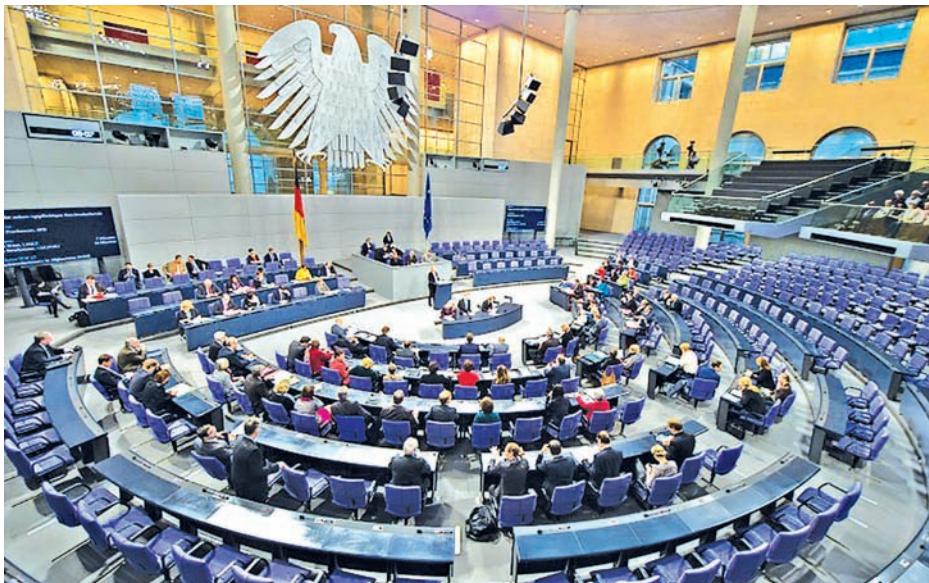
The sanctions are not an end in itself, deputy chairman of the faction of the Social Democratic Party of Germany in parliament Rolf Muetzenich says.

“If the next few weeks see the regime of ceasefire established in eastern Ukraine, the Minsk agreements implemented and the atmosphere become reliable from the viewpoint of politics and security, sanctions should be gradually revised and canceled,” Muetzenich was quoted by the Berliner Zeitung daily