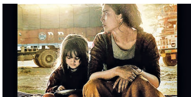
India's official entry 'Liar's Dice' is out of Oscars race after it failed to make the cut in the Academy's shortlist in the best foreign film category.

Pawel Pawlikowski's black-and-white Polish drama 'Ida', which won the Best European Film prize at the European Film Awards in Riga, is in the list while the Academy selected 'The Libertine' from Venezuela by Alberto Arvelo.