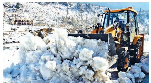
Photo taken on 21 Dec, 2014 shows a bulldozer clearing snow after a heavy snowfall blocked the traffic in the busy Manali highway in Himachal Pradesh, India.

The meteorological department has forecast moderate to dense fog on