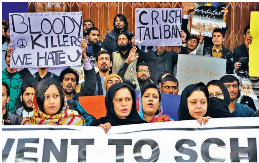
Pakistani activists participate in a rally for the victims of the Peshawar school massacre, in southwest Pakistan’s Quetta on 21 Dec, 2014. At least 141 people, mostly children, were killed by Taleban terrorists who attacked the army-run school in Pakistan’s northwestern provincial capital of Peshawar on 16 December.

while the minimum is likely to settle around 5 degrees in the city.—Xinhua