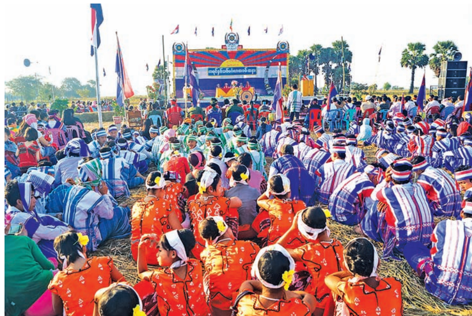
Kayin nationals attend Kayin New Year Day festival in Thaton, Mon State.