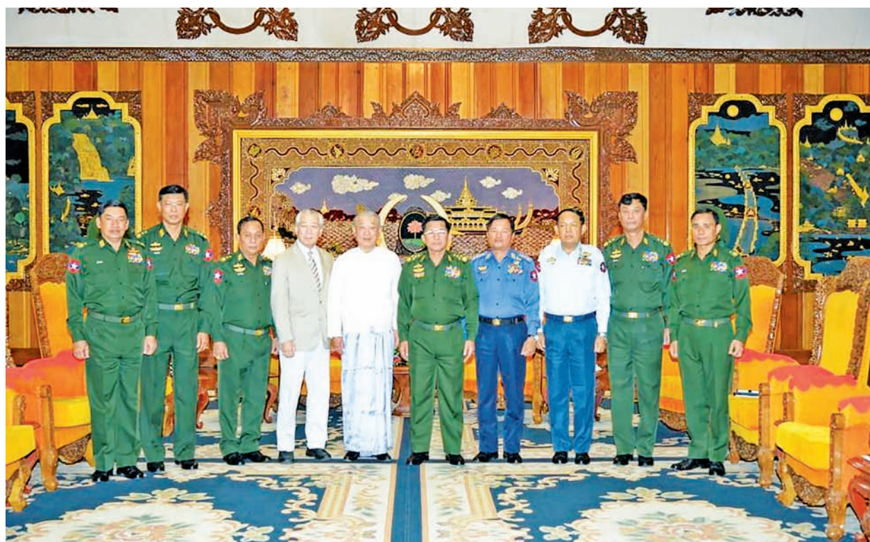
Senior General Min Aung Hlaing poses for documentary photo with Chairman of Nippon Foundation Yohei Sasakawa.