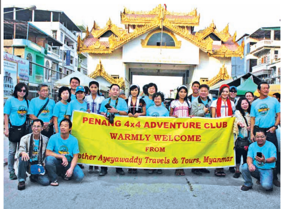
Under the arrangement of Mother Ayeyawaddy Travels & Tours Co Ltd, Malaysian tourists arrive at entrance to Myanmar in Myawady, border town of Kayin State.