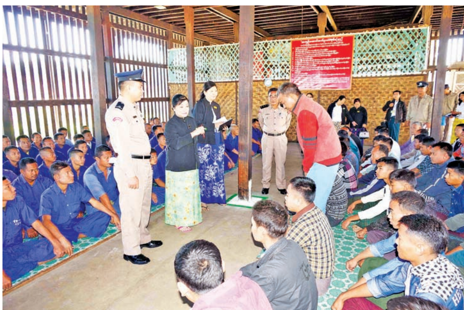
Judge of Mandalay Region High Court Daw Khin Thin Wai meets inmates at Myingyan Jail.

MYINGYAN, 22 Dec — Judge of Mandalay Region High Court Daw Khin Thin Wai inspected Myingyan Jail and police station in Myingyan, Mandalay Region, on 19 December.