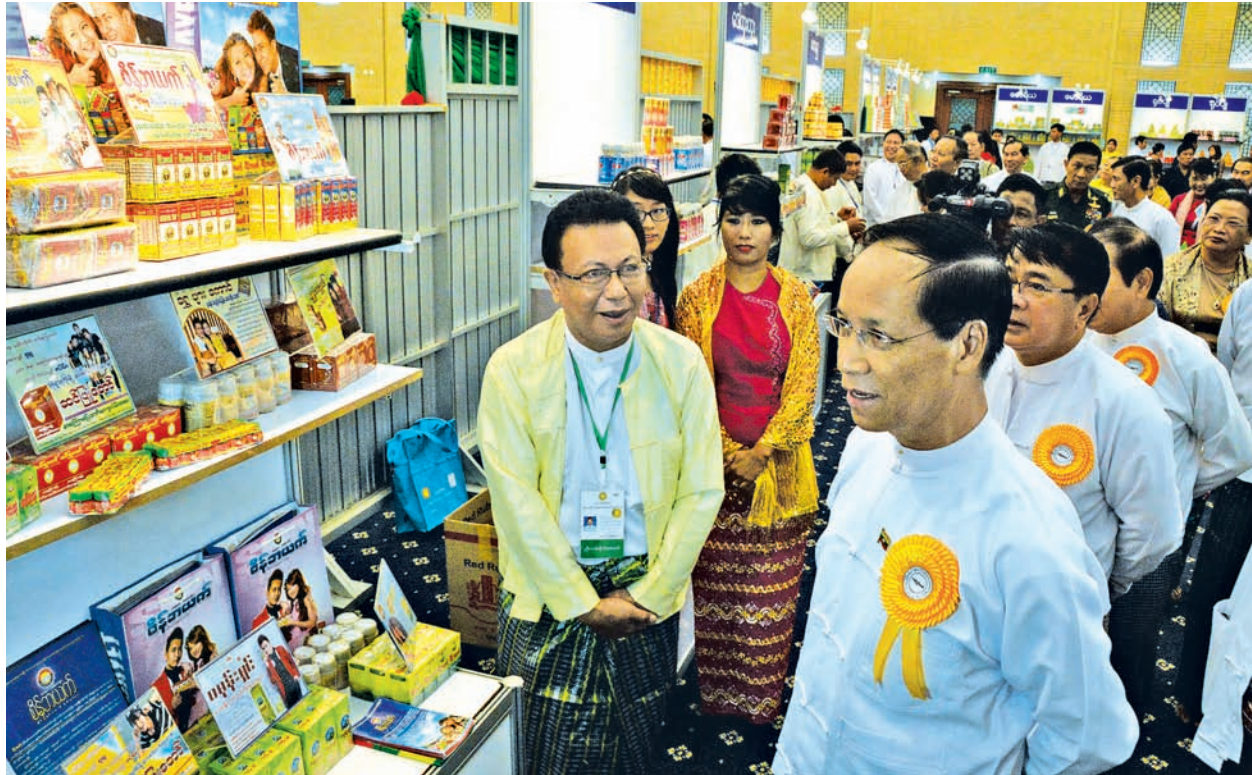
Vice President Dr Sai Mauk Kham visits booths of traditional medicine at 15 th Conference of Myanmar Traditional Medicine Practitioners.

Then, the vice president said that rural residents, who make up 70 per cent of the population, rely