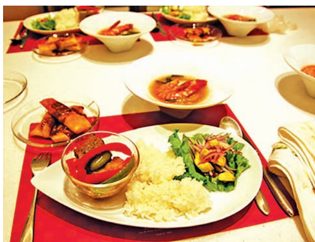
Photo taken on 5 Dec, 2014, shows the two main dishes and a snack that were taught during a Filipino cooking class at an ABC Cooking Studio in Minato Ward, Tokyo.

In the cooking programme, students were taught to prepare two main dishes — “pork adobo,” which is meat marinated and simmered in vinegar, soy sauce and garlic, “sinigang na hipon,” a soup known for its sour taste and cooked with shrimp and vegetables — and “turon,” a popular Filipino snack made up of a banana in a deep-fried spring roll wrapper and covered with caramel sauce.