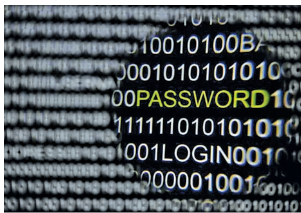
A magnifying glass is held in front of a computer screen in this picture illustration taken in Berlin on 21 May, 2013.

“We found continued activity from Chinese specific actors that have used the Afghan government