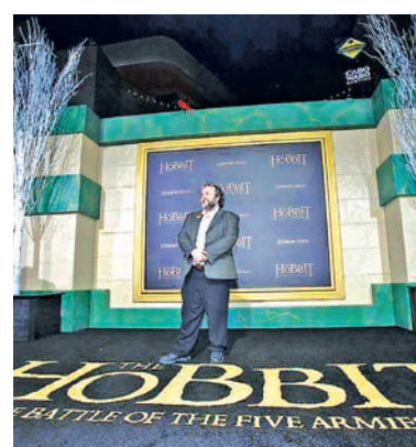
Writer, producer and director Peter Jackson poses at the premiere of "The Hobbit: The Battle of the Five Armies" at Dolby theatre in Hollywood, California on 9 Dec, 2014. The movie opens in the US on 17 December.