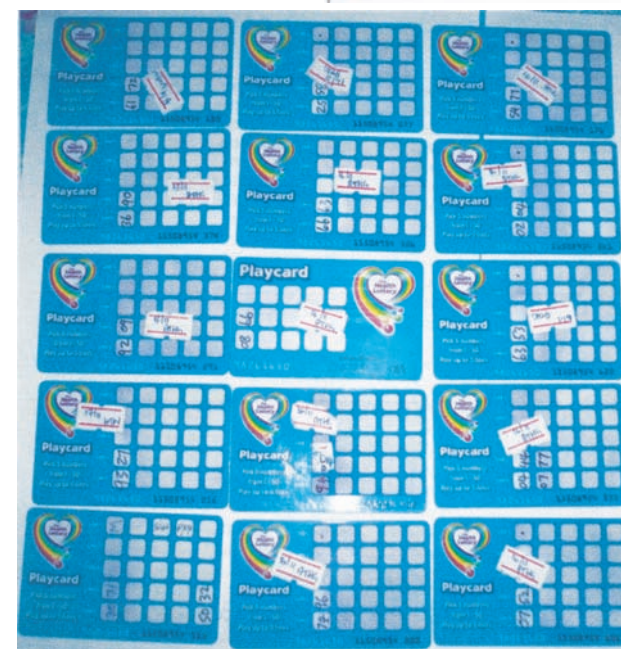
Fake ATM cards used in taking out money from ATMs.—MNA