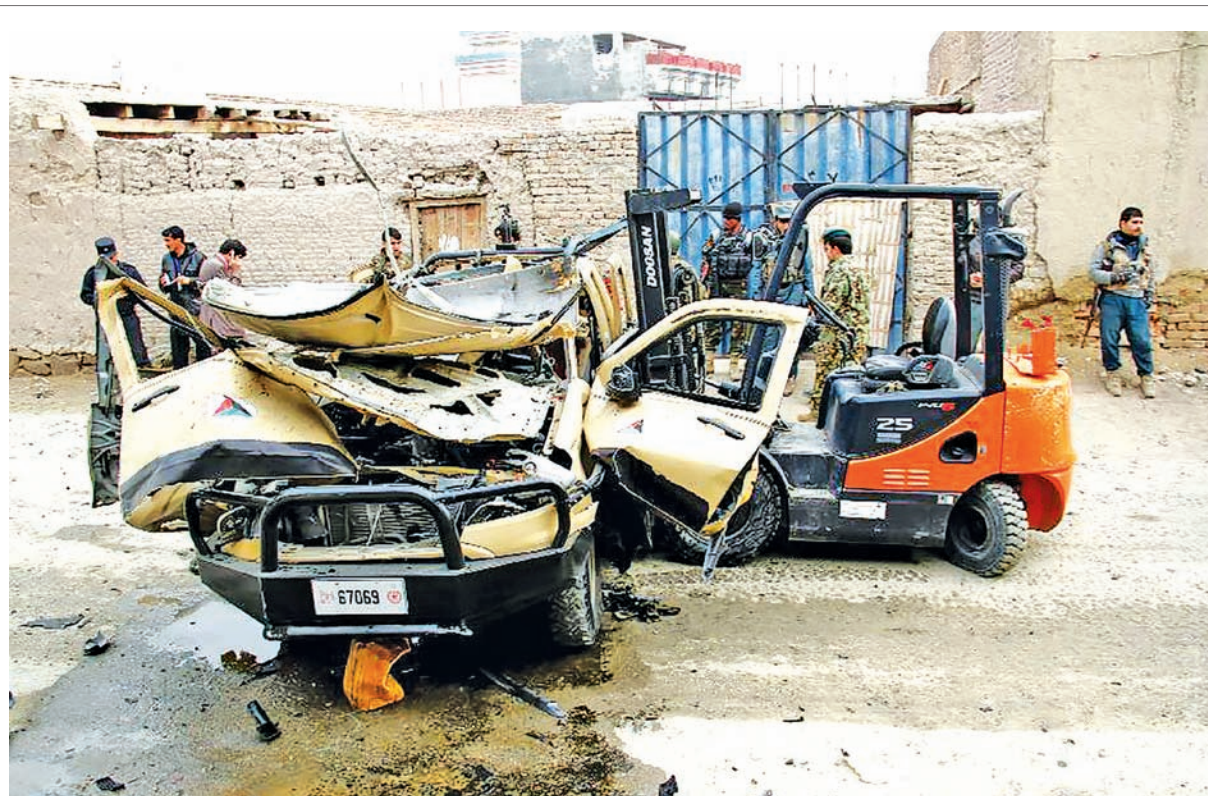
Afghan security forces transfer a destroyed military vehicle following a blast in east Afghanistan on 21 Dec, 2014. Earlier on Sunday, one soldier and a civilian were killed and five people wounded in two separate IED blasts in Jalalabad city, the provincial capital of Nangarhar Province, police said.