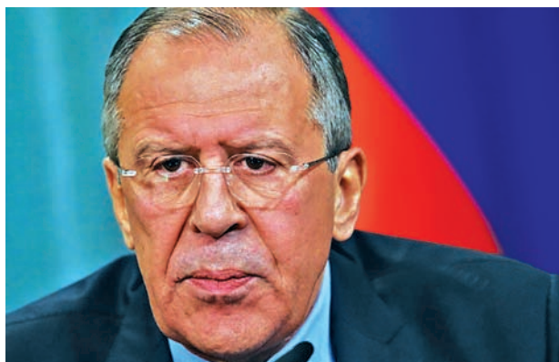
Russian Foreign Minister Sergey Lavrov

The meeting between Lavrov and Erekat will be held against the backdrop of submission to the UN Security Council by Jordan of a draft resolution that gives 12 months to the comprehensive settlement