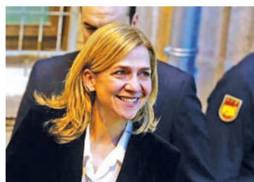
Spain's Princess Cristina de Borbon

MADRID, 22 Dec — Cristina de Borbon, sister of Spain's King Felipe VI, has been ordered to stand trial on charges of tax fraud, the High Court of the Balearic Islands said on Monday, prolonging the embarrassment of the royal family which has sought to distance itself from a corruption probe.