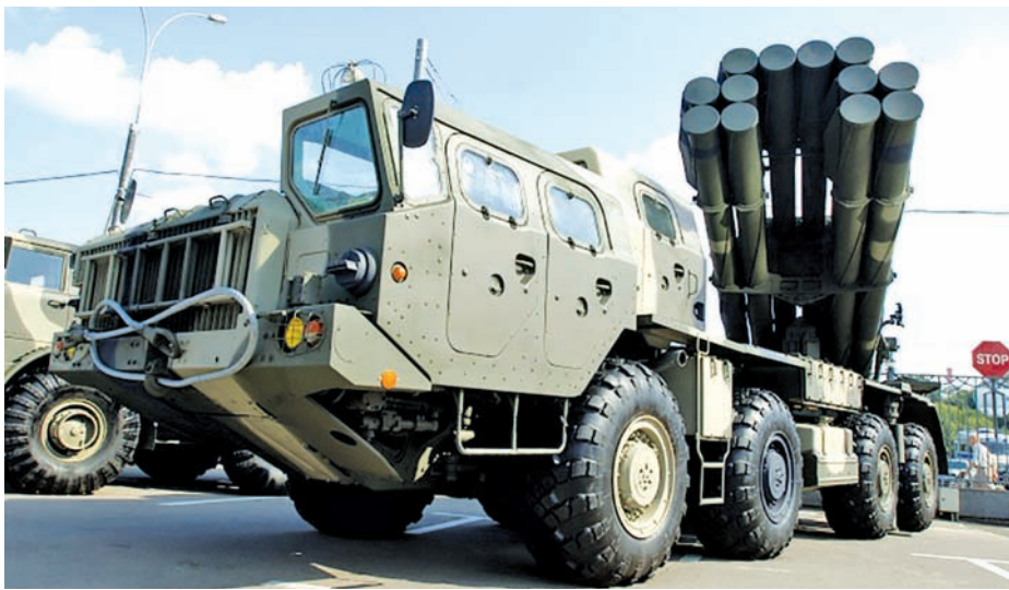
Last year arms sales by Russian-based companies increased by 20%, to $32 billion.

This list included 10 Russian companies, one company more than in 2012. According to