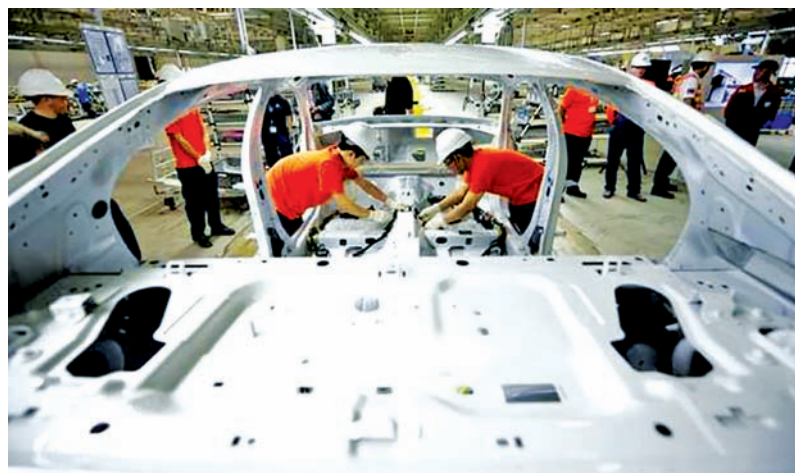
Workers assemble parts of a Volvo car at an assembly line of the new Volvo automobile manufacturing plant in Chengdu, Sichuan Province, on 5 June, 2013.

"The plan is to have all our car lines in all our markets offered digitally," Volvo sales chief Alain Visser said in an interview. Few manufacturers have tried selling directly online. A notable exception is Tesla, whose electric car sales have