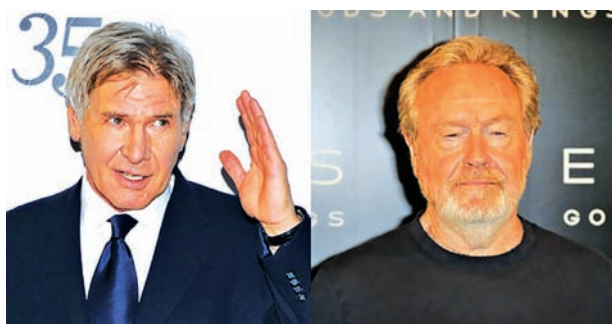
Ridley Scott, says Harrison Ford is absolutely on board for the film.

LOS ANGELES, 15 Dec — Ridley Scott, who directed the 1982 sci-fi classic 'Blade Runner', says Harrison Ford is absolutely on board for the film. Ford, 72, will reprise his role of Rick Deckard for the sequel, said the Hollywood Reporter .