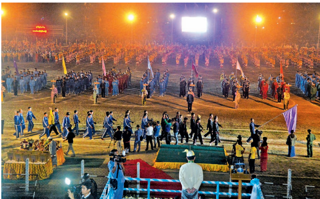
Sports and cultural troupes at the ceremony to mark 40 th Anniversary of the Rakhine State Day in Waithali Sports Grounds in Sittway, Rakhine State.