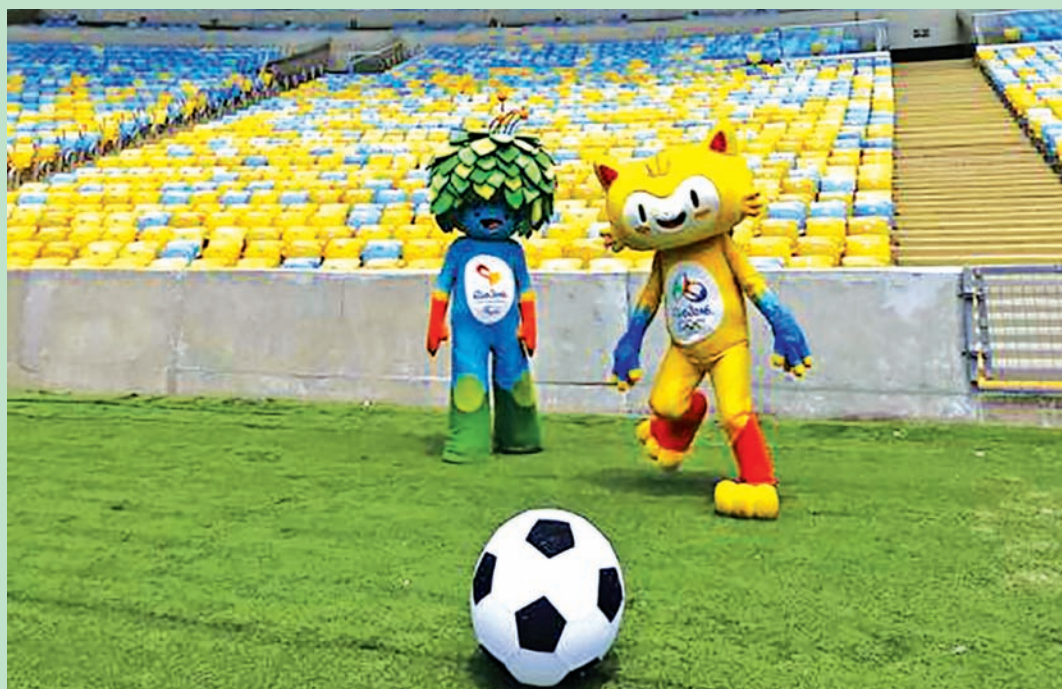
The mascots of the Rio 2016 Olympic (R) and Paralympic Games are pictured during a visit at the Maracana Stadium in Rio de Janeiro on 4 Dec, 2014.

known more commonly as 'Tom'. The Paralympic mascot is named after Vinicius de Moraes. The pair were instrumental in the development of bossa nova music and wrote dozens of songs together, most famously the tale of a young girl who passed their bar each day as she walked to Ipanema beach. The announcement came 600 days before the start of the games, the first ever to be held in South America.—Reuters