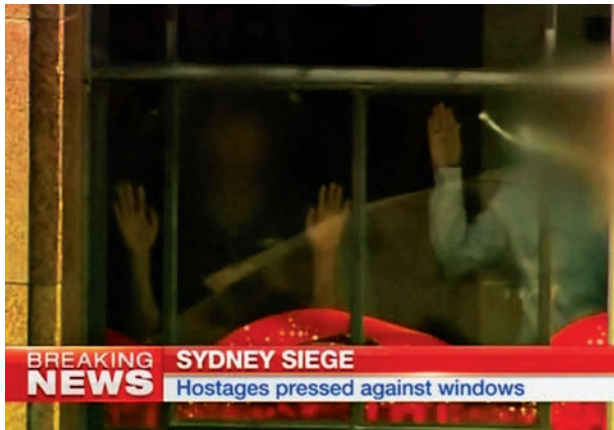
Hands are pressed up against the window of the Lindt cafe, where hostages are being held, in this still image taken from video from Australia's Seven Network on 15 Dec, 2014.

SYDNEY, 15 Dec — Australian police locked down the center of the country's biggest city on Monday after an armed assailant walked into a downtown Sydney cafe, took hostages and forced them to display an Islamic flag, igniting fears of a jihadist attack.