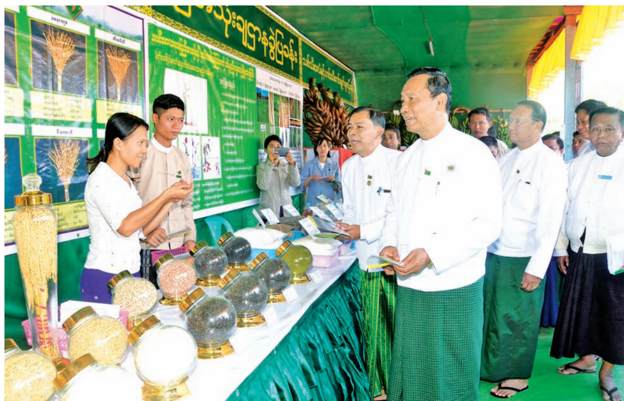
Speaker Thura U Shwe Mann visits booth of quality seeds of crops at Land Utilization Booth in Pathein.—MNA

made the concluding remarks at the conference, urging the implementation of them with the coordina-