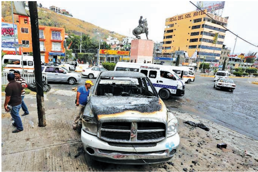
Photo taken on 14 Dec, 2014 shows a damaged vehicle remains after a clash between teachers of the State Coordinator of Education Workers of Guerrero and agents of the Federal Police in Chilpancingo, Guerrero state, Mexico. At least nine people were injured during the clash.