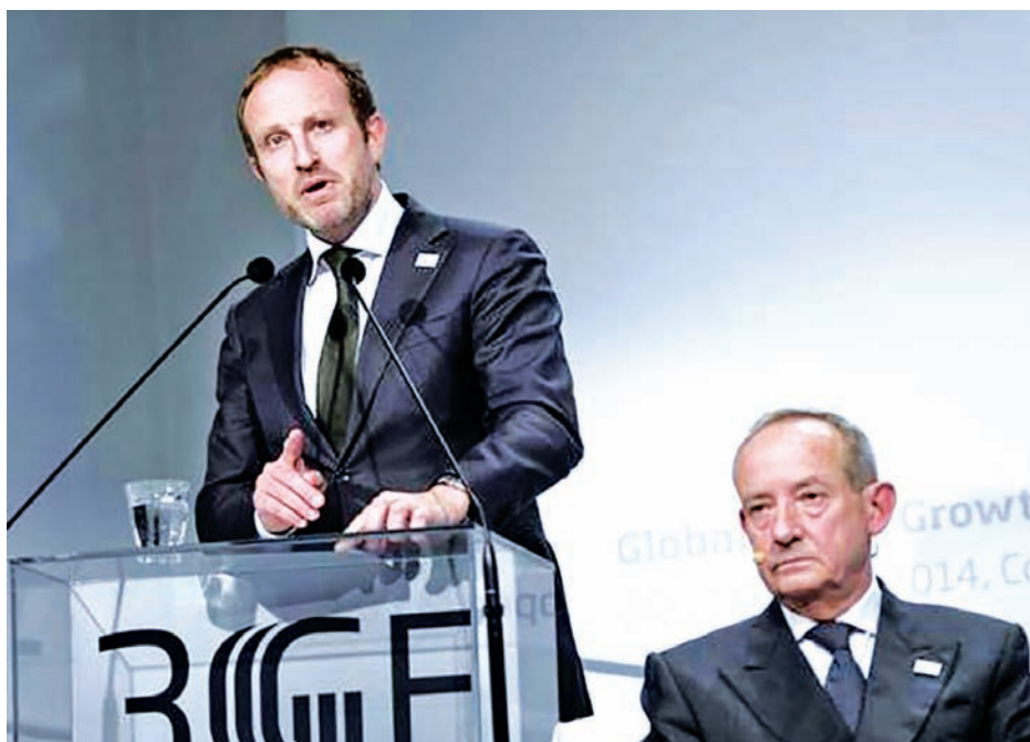
Danish Minister for Foreign Affairs Martin Lidegaard (L) speaks next to Director General of the Global Green Growth Institute Yvo de Boer at the Global Green Growth Forum in Copenhagen, on 21 Oct, 2014.

The government said the project aims to define the outer limits of Denmark's continental shelf and thereby the Kingdom of Denmark. The area is as large as France and Germany put together and