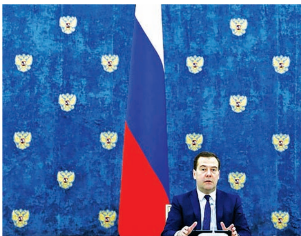
Russian Prime Minister Dmitry Medvedev.

Moscow, 15 Dec — The Ukrainian authorities failed to work out the plan for their country's development better than anti-Russian rhetoric, however Moscow will not yield to provocations, Russian Prime Minister Dmitry Medvedev said. In his article titled "Russia and Ukraine: Life by New Rules" published by Nezavisimaya Gazeta daily on Monday, Medvedev wrote that Russia, would on the contrary continue supporting people in the neighbouring country considering the fact