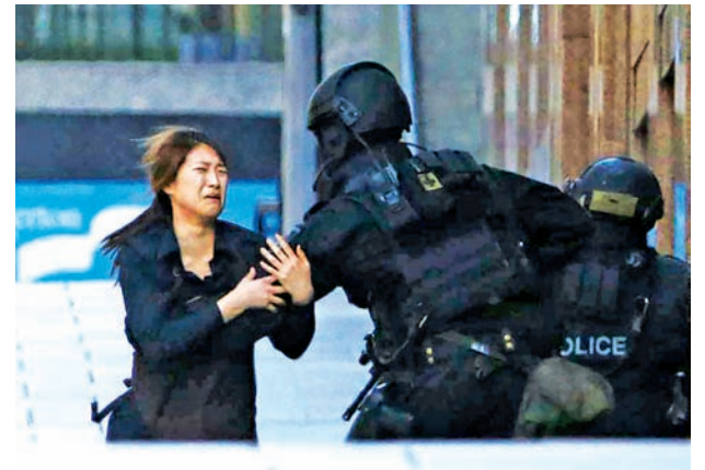
A hostage runs towards a police officer outside Lindt cafe, where other hostages are being held, in Martin Place in central Sydney on 15 Dec, 2014.