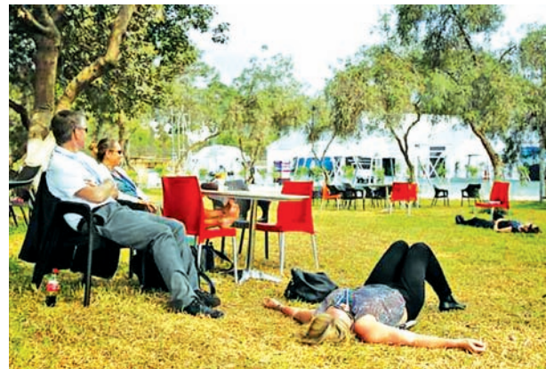
Delegates rest during a break of the plenary session at the UN Climate Change Conference COP 20 in Lima on 13 Dec, 2014.

“The US-China announcement hinted at a fundamental shift putting developed and developing