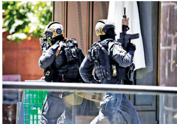
A police officer runs across Martin Place near Lindt cafe, where hostages are being held, in central Sydney on 15 Dec, 2014.