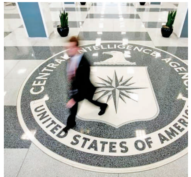
The lobby of the CIA Headquarters Building in McLean, Virginia, on 14 Aug. 2008.

WASHINGTON, 15 Dec — As former Vice President Dick Cheney argued on Sunday that the CIA's aggressive interrogation of terrorism suspects did not amount to torture, the man who provided the legal rationale for the programme said that in some cases it had perhaps gone too far.