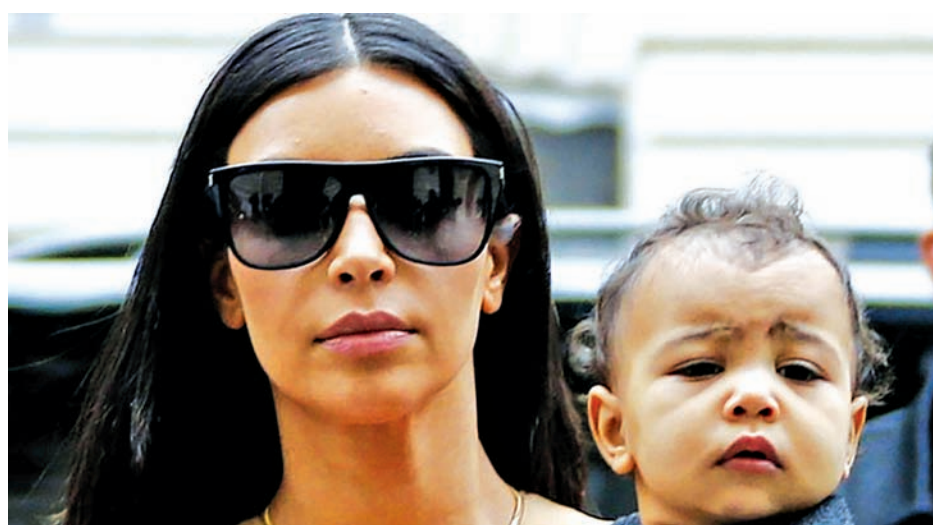
The couple's 17-month-old daughter has her own two-person styling team.

LONDON, 15 Dec — Reality TV star Kim Kardashian and her rapper husband Kanye West reportedly spend USD 10,000 a month on beautician and designers for their daughter North.