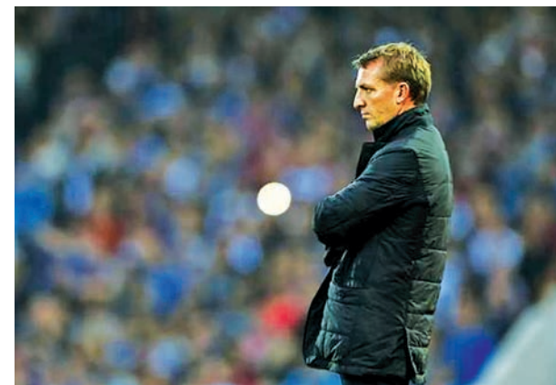
Liverpool manager Brendan Rodgers

They lack a commanding goalkeeper, a defensive leader and are bereft of a forward capable of providing the goals of the departed Luis Suarez or the injured Daniel Sturridge.