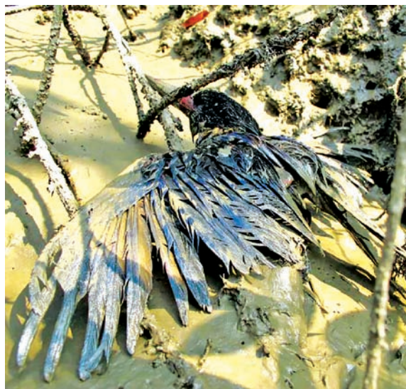
A bird is trapped in oil on the Shela River after an oil-tanker capsized near Sundarbans mangrove forest in Bangladesh, on 14 Dec, 2014. An Irrawaddy dolphin's body has been discovered floating in the Shela River five days after a massive spill on the world's largest mangrove forest river.

DHAKA, 15 Dec — An Irrawaddy dolphin's body has been discovered floating in the Shela River five days after a massive spill on the world's largest man-