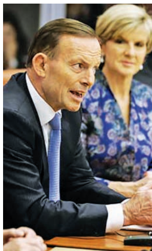
Australia's Prime Minister Tony Abbott (C)

SYDNEY, 15 Dec — Australian Prime Minister