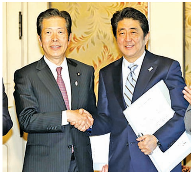
Japanese Prime Minister Shinzo Abe (R) shakes hands with Komeito leader Natsuo Yamaguchi in Tokyo on 15 Dec, 2014, after their ruling coalition retained a two-thirds majority in the lower house. During their meeting, they signed a policy agreement, which includes the promotion of "Abenomics."