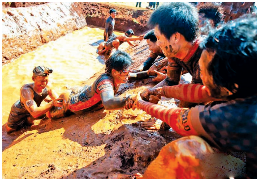
Participants compete in mud race for charity in southern Thai city, on 14 Dec, 2014.—XINHUA

The trial court in Olonapo City handling the case is expected to issue an arrest warrant within the week, as well as an order to put Pemberton in jail.—Reuters