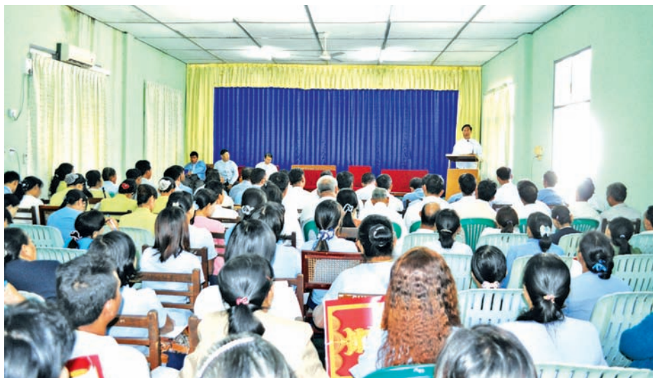
Union Minister U Ohn Myint speaking at opening of rural development programme course.

He also said that the training course is aimed at helping the country graduate from the Least Developed Countries, improve per capita income, enhance socioeconomic development and boost agricultural and livestock production.