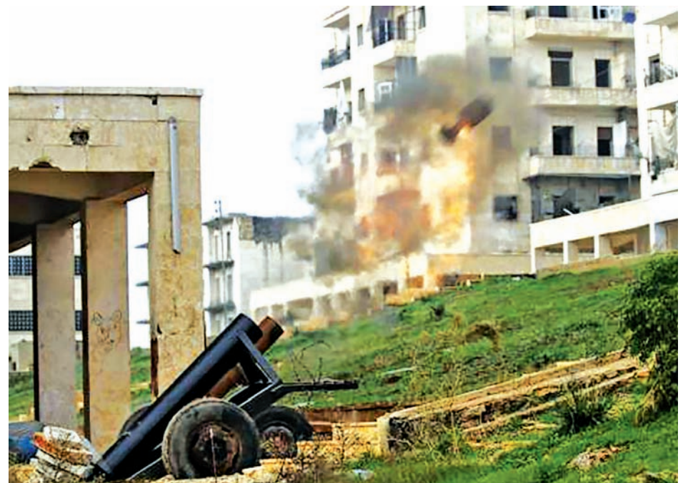
A locally made shell is launched by rebel fighters towards forces loyal to Syria's President Bashar al-Assad at the frontline in al-Breij district of Aleppo on 10 Dec, 2014.

Western diplomats have voiced concerns about the ceasefire plan, saying it could be used by the government to take full control of the city and force rebels to surrender, as it did through a previous initiative in the central city of Homs, and then direct its forces elsewhere. The UN's de Mistura has defended the plan, saying that opposition forces backed the idea and has warned the fall of the city could create an additional 400,000 refugees. — Reuters