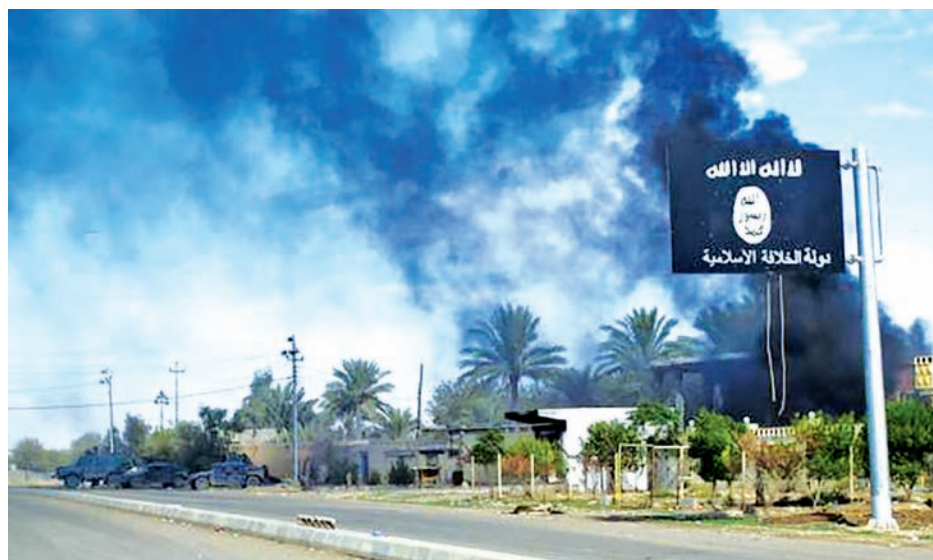
Smoke raises behind an Islamic State flag after Iraqi security forces and Shi'ite fighters took control of Saadiya in Diyala Province from Islamist State militants, on 24 Nov, 2014.

Chinese members of the East Turkestan Islamic Movement (ETIM) are travelling to Syria via Turkey to join the Islamic State, also