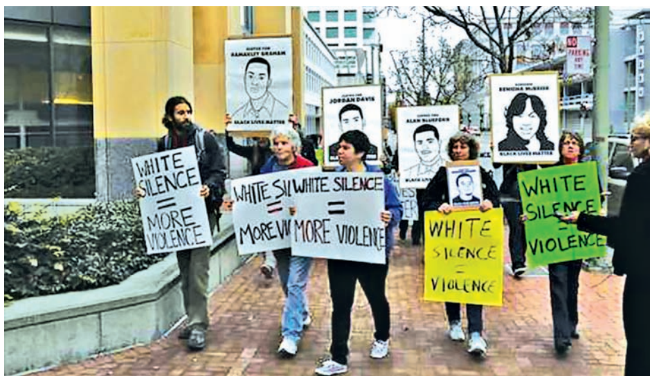
Demonstrators converge on the Federal Courthouse during a protest in Oakland, California on 10 Dec, 2014.

BERKELEY, (Calif) / NWE YORK, 11 Dec — Students at medical schools around the United States staged “die-ins” to protest the chokehold death by police of an unarmed black man, and New York activists demanded the city take action after a grand jury declined to indict the officer involved.