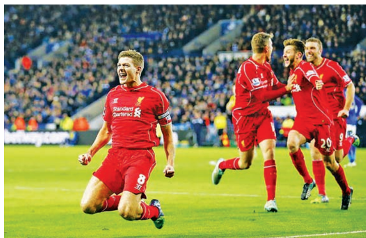
Liverpool's Steven Gerrard (L) celebrates after scoring his team's second goal during their English Premier League soccer match against Leicester City at the King Power Stadium in Leicester, central England on 2 Dec, 2014.

The Anfield club have struggled to recapture the form that