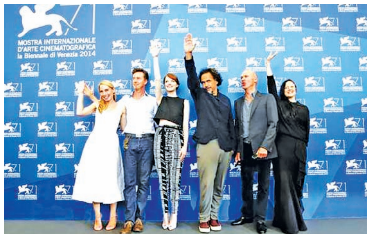
Director Alejandro Inarritu (3 rd R) poses with actors Amy Ryan (L), Edward Norton (2 nd L), Emma Stone (3 rd L), Michael Keaton (2 nd R) and Andrea Riseborough (R) during the photo call for the movie "Birdman or (The unexpected virtue of ignorance)" at the 71 st Venice Film Festival on 27 Aug, 2014.