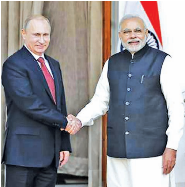
Russian President Vladimir Putin (L) shakes hands with India's Prime Minister Narendra Modi during a photo opportunity ahead of their meeting at Hyderabad House in New Delhi on 11 Dec, 2014.

Yet Moscow's eye has wandered too since its Soviet-era romance with