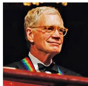
Late-night TV talk show host David Letterman is pictured on the balcony at the 2012 Kennedy Centre Honours at the Kennedy Centre in Washington on 2 Dec, 2012.

LOS ANGELES, 11 Dec — Late night US talk show host David Letterman will anchor his final broadcast on 20 May before retiring and handing the reins of