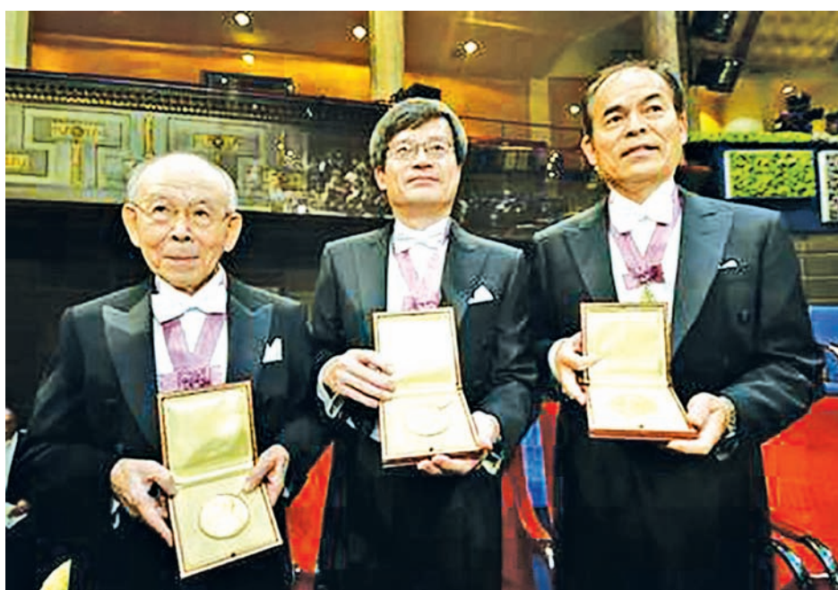
(From L) Isamu Akasaki, a professor at Meijo University in Nagoya, Hiroshi Amano, a professor at Nagoya University, and Shuji Nakamura, a professor at the University of California, Santa Barbara, who won the 2014 Nobel Prize in Physics, pose for photos with their medals after the award ceremony at the Stockholm Concert Hall in the Swedish capital on 10 Dec, 2014.

In introductory comments before the award was conferred, a Nobel selection committee noted that the three "succeeded where all others had given up." "After several years of hard work ... with great persistence, skills and perhaps a bit of luck, they were able to produce fine gallium nitride crystals and give them the properties needed for efficient light emission," the committee said, adding that they performed more than 2,000