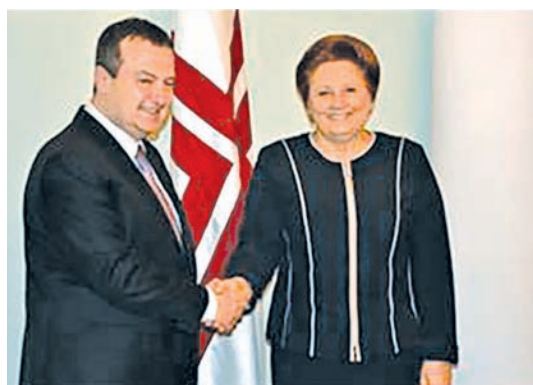
Serbian counterpart Ivica Dacic and Latvia's Prime Minister Laimdota Straujuma.

RIGA, 11 Dec — Latvia will try to ensure that some chapters in Serbia's EU accession talks are opened during its EU Presidency, starting on 1 January, Latvian Foreign Minister Edgars Rinkevics said on Wednesday after a meeting with his Serbian counterpart Ivica Dacic.