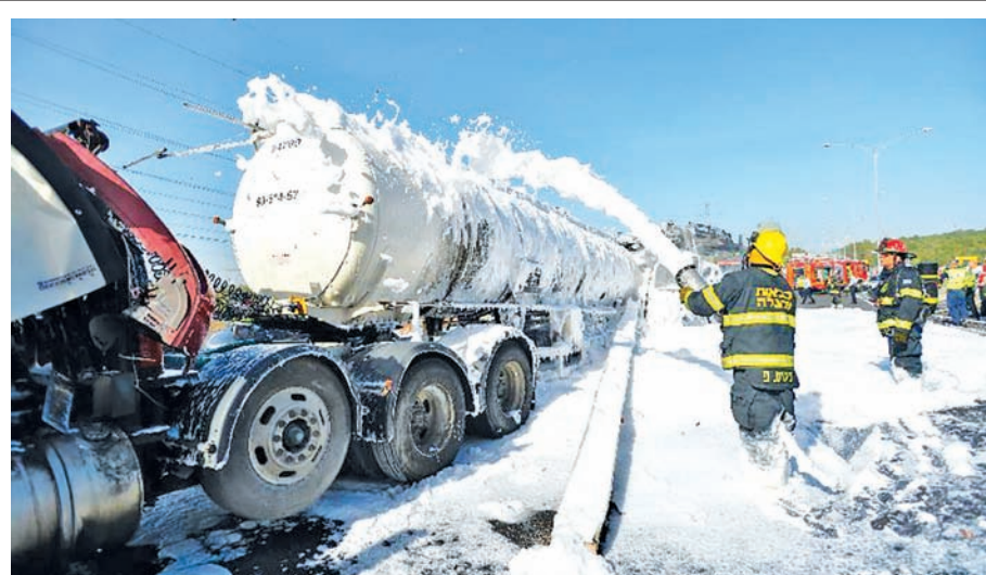
Firefighters work on the scene where a man was killed during explosions from a gas tanker truck which caught fire on the Jerusalem-Tel Aviv Highway, after an accident in which it hit a car-carrier trailer, near the Ben Shemen junction, on 10 Dec, 2014. A gas tanker truck exploded outside Jerusalem on Wednesday after colliding with a vehicle, killing one person, the Israeli police said. According to the police, the gas truck flipped over after colliding with a car-carrier trailer in the Jerusalem-Tel Aviv Highway, causing the gas-laden truck to burst into flames.

“South Korea is our most important neighbouring country,” Deputy Chief Cabinet Secretary Hiroshige Seko said. “It is extremely important for both Japan and South Korea to cooperate toward regional peace, stability and prosperity. We will try to update the United States on our efforts.”—Kyodo News