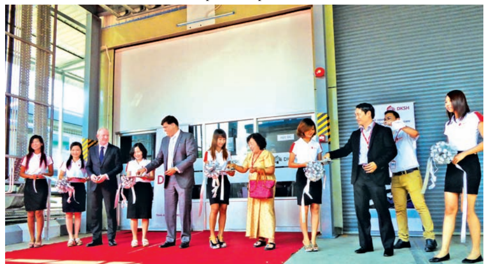
Director Daw Theingi Zin of FDA (middle) together with officials from DKSH, a market expansion services provider, are seen at opening ceremony of healthcare distribution centre in Hlinethaya Industrial Zone in Yangon.