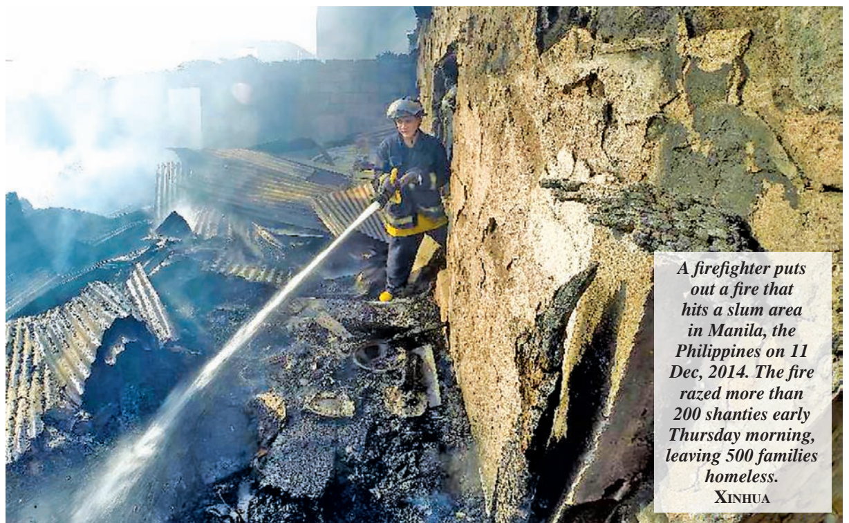
A firefighter puts out a fire that hits a slum area in Manila, the Philippines on 11 Dec, 2014. The fire razed more than 200 shanties early Thursday morning, leaving 500 families homeless.