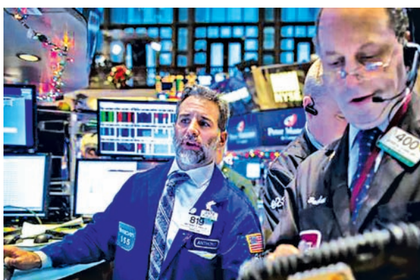
Traders work on the floor of the New York Stock Exchange on 10 Dec, 2014.

The volatile Shanghai Composite Index shed earlier gains and fell 0.8 percent after regulators announced a flood of IPO approvals, which could signal authorities are growing increasingly concerned over the China markets' massive rally in the last two weeks.