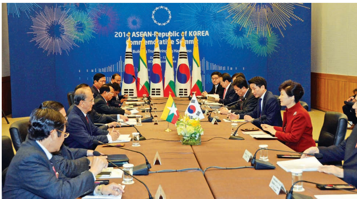
President U Thein Sein meets ROK President Park Geun-hye.

President Park accepted her Myanmar counter-