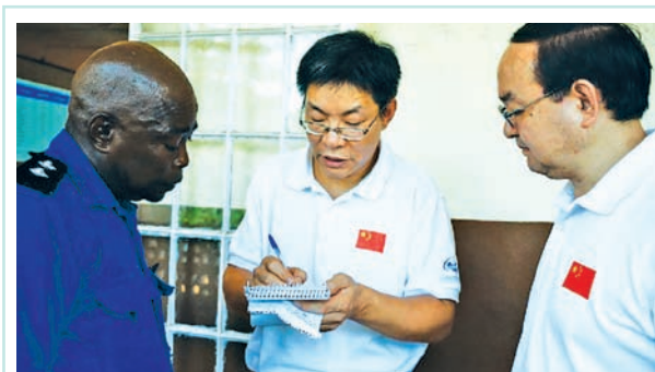
A policeman (L) asks questions on how to protect themselves from Ebola disease after a training given by Chinese public health experts at the Police Club in Freetown, capital of Sierra Leone, on 10 Dec 2014. Chinese public health trainers arrived in Freetown on 10 November to give lessons to 500 local policemen in the next few days.