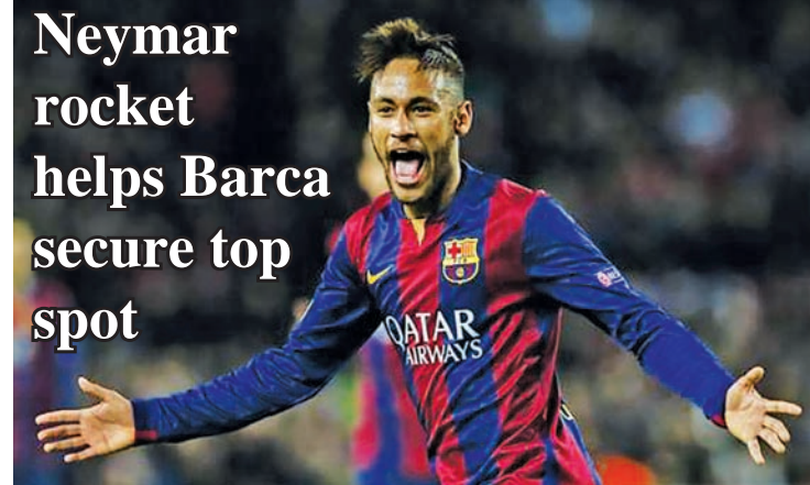
Barcelona's Neymar celebrates after scoring a goal against Paris St Germain during their Champions League Group F soccer match at the Nou Camp stadium in Barcelona on 10 Dec, 2014.

BARCELONA, 11 Dec — Neymar scored a spectacular goal as Barcelona came from behind to beat Paris St Germain 3-1 in their Champions League showdown for top spot in Group F on Wednesday. Former Barcelona striker Zlatan Ibrahimovic put the French side ahead after 15 minutes with their first threat on goal but Lionel Messi restored parity as he maintained his remarkable scoring form with his eighth goal in Europe this season.