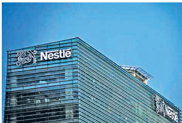
The logo of Nestle is seen on the company building in Mexico City, on 24 Jan, 2014.