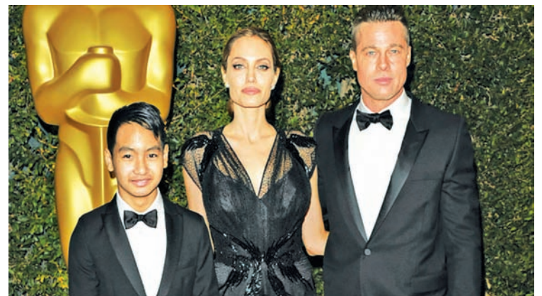
Angelina Jolie: My son Maddox became a teenager. That was a marker in my year.