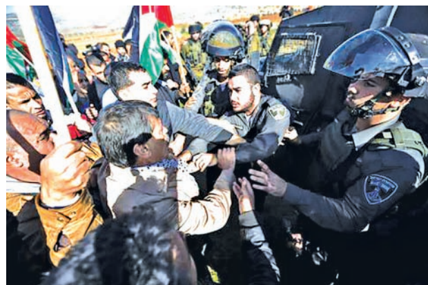
Palestinian minister Ziad Abu Ein (C) scuffles with an Israeli border policeman near the West Bank city of Ramallah on 10 Dec, 2014.

RAMALLAH, 11 Dec — Israeli and Palestinian officials issued conflicting accounts on Thursday over the results of an autopsy on a Palestinian minister who died after