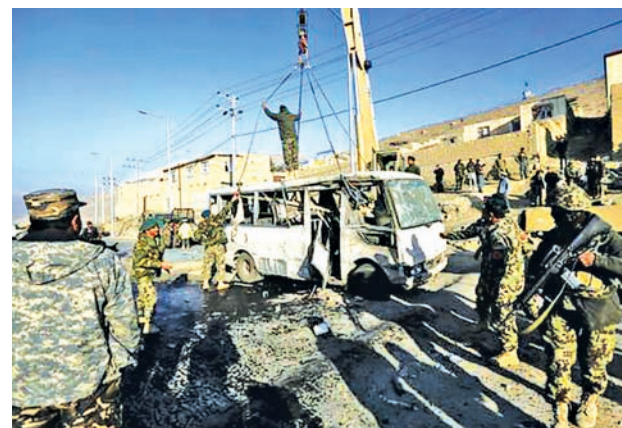
Afghan National Army soldiers (ANA) inspect the site of a suicide attack in Kabul on 11 Dec, 2014.

KABUL, 11 Dec — A suicide bomber targeted a bus carrying Afghan army personnel, killing six soldiers and wounding 11 on Thursday on the outskirts of the capital, Kabul, the Defence Ministry.