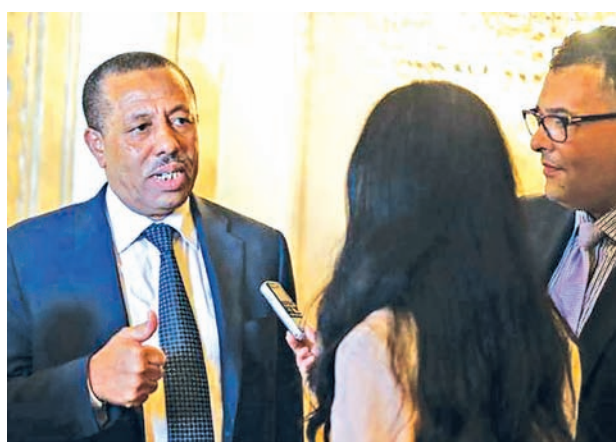
Libya's Prime Minister Abdullah al-Thinni speaks to reporters in Abu Dhabi on 10 Sept, 2014.

Prime Minister Abdullah al-Thinni has been