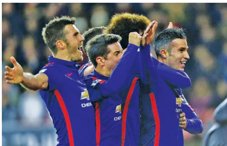
Manchester United's Robin van Persie (R) celebrates after scoring his team's second goal during their English Premier League soccer match against Southampton at St Mary's Stadium in Southampton, southern England on 8 Dec, 2014.

LONDON, 11 Dec — Manchester United will bid for a sixth straight Premier League victory to heap more misery on Brendan Rodgers and his beleaguered Liverpool side when the bitter rivals meet at Old Trafford on Sunday.