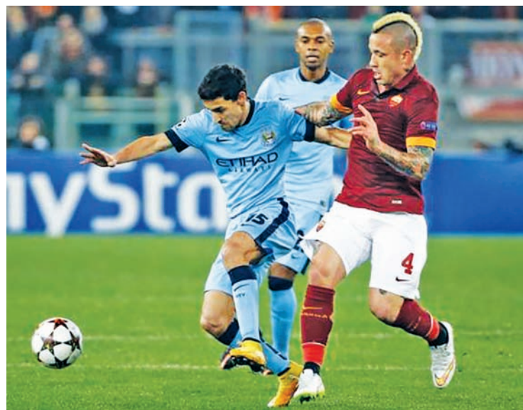
AS Roma's Radja Nainggolan (R) challenges Manchester City's Jesus Navas during their Champions League group E soccer match at the Olympic stadium in Rome on 10 Dec, 2014.