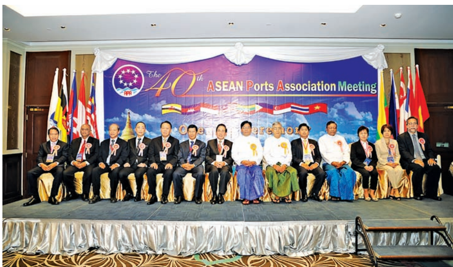
Union Minister U Nyan Tun Aung poses for documentary photo with delegates from ASEAN countries at 40 th ASEAN Ports Association Meeting.—MNA

Myanmar joined as member of the Phase II of the Project “Sustainable Port Development (SPD) in ASEAN Region”.—MNA