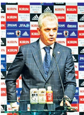
Japan coach Javier Aguirre attends a Press conference in Tokyo on 10 Dec, 2014, at which he announced next year's fixtures for both the men's and women's national sides, and set the bar high for himself by targeting the top 15 in the 2015 world rankings.