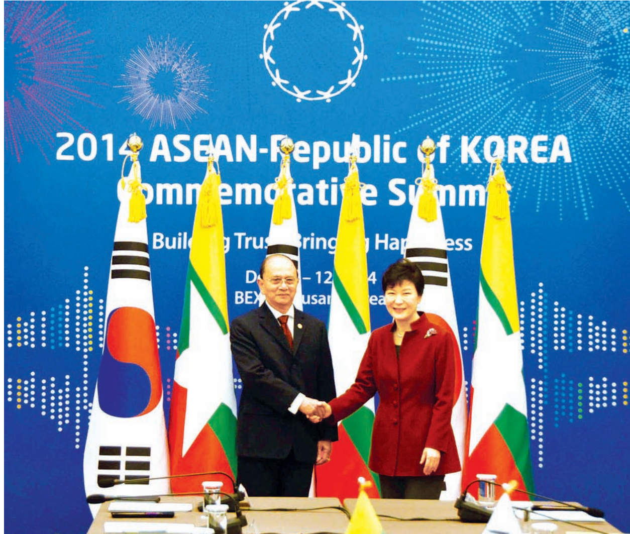
President U Thein Sein cordially greets South Korea's President Park Geun-hye at 25th ASEAN-Republic of Korea Commemorative Summit.

ASEAN, if considered as a single economy, ranks as the seventh largest in the world in terms of its 10 members' combined GDP, which has hit $2.5 trillion. The Myanmar president saw an upward growth trend, with the likelihood