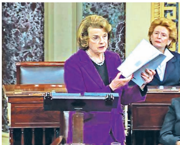
Senate Intelligence Committee Chairwoman Dianne Feinstein (D-CA) (L) discusses a newly released Intelligence Committee report on the CIA's anti-terrorism tactics, in a speech on the floor of the US Senate, in this still image taken from video, on Capitol Hill in Washington on 9 Dec, 2014.

The CIA outsourced more than 80 percent of its