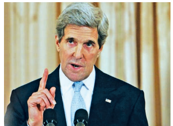
US Secretary of State John Kerry

Israel accepts the "two-state solution" of an independent and democratic Palestinian state along-