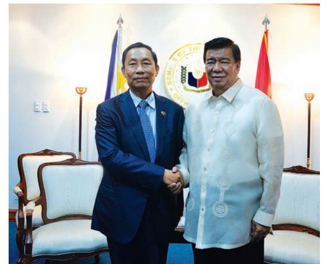
Speaker Thura U Shwe Mann cordially greets Mr Franklin Drilon, President of the Senate of the Philippines.