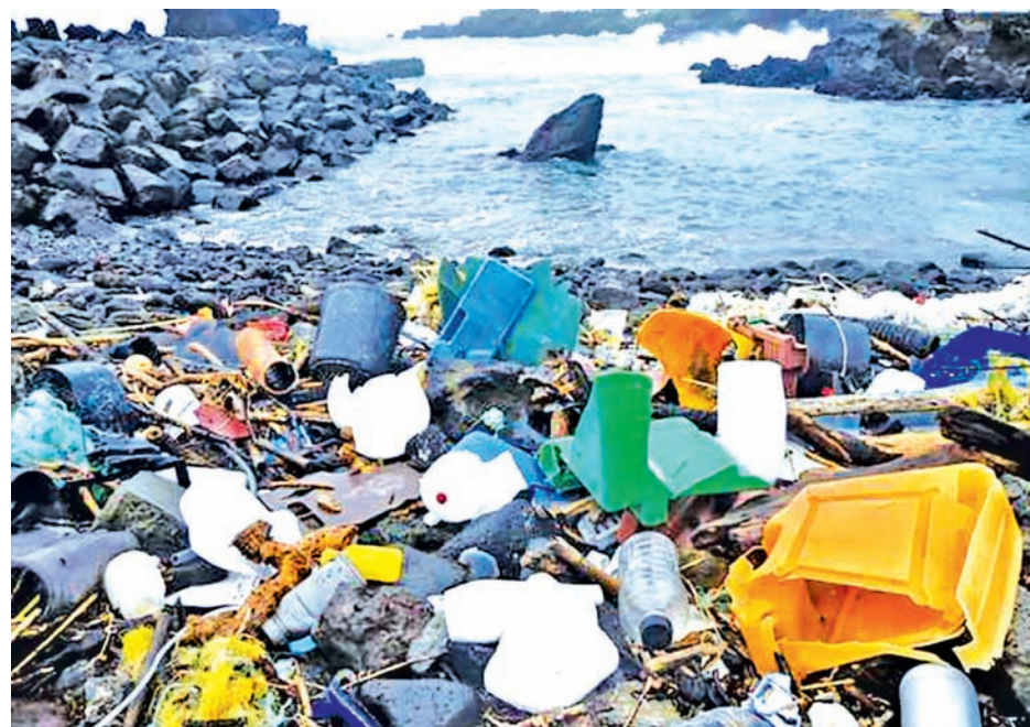
A beach in the Azores is pictured littered with plastic garbage, in this undated handout photo obtained by Reuters on 9 Dec, 2014. —REUTERS