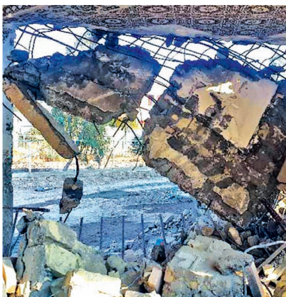
Photo taken on 7 Dec, 2014 shows rubble of a damaged mosque after Iraqi Air Force's bombing in Islamic State militant seized city of Fallujah, 50 km west of Baghdad, Iraq. At least three civilians were injured during the bombing.

The Taleban has intensified attacks over the past couple of months as the NATO-led forces are withdrawing from the country. The war-torn country is due to take over the responsibility for its own security from the NATO troops by the end of this month.— Xinhua