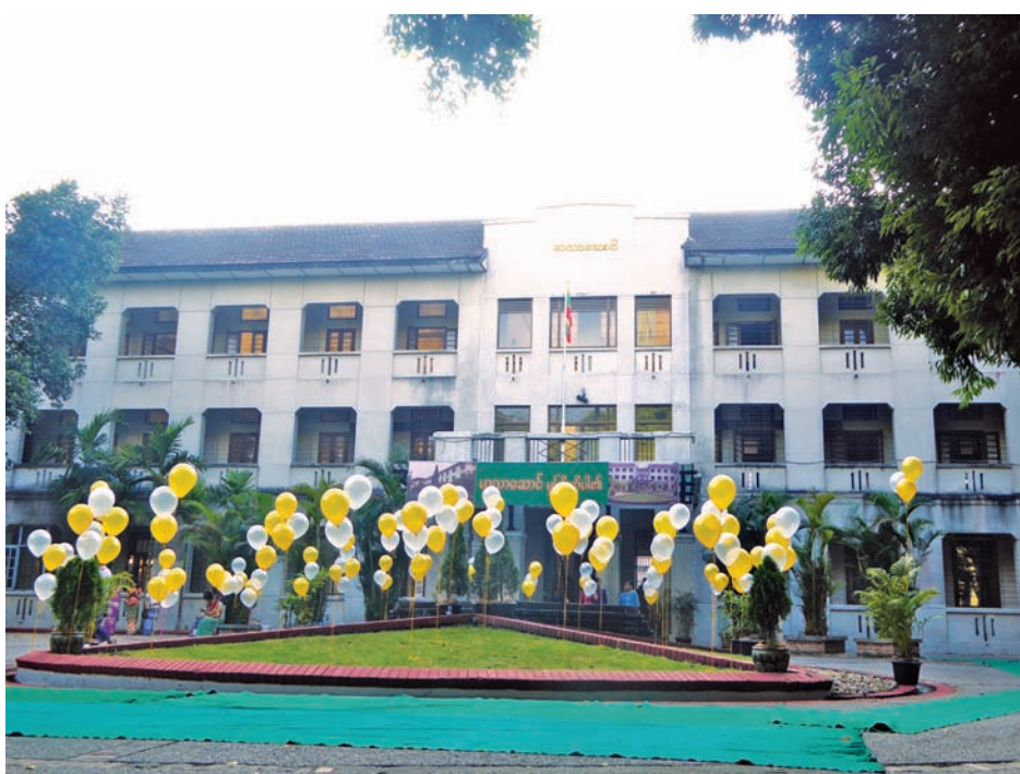
Malar Hostel of Yangon University of Economics.

NAY PYI TAW, 8 Dec —The Medical Science Department under the Ministry of Health issued an announcement on Monday that the first year courses for 2014-15 academic year of universities of medicine and other medical-related universities will be opened on 22 December. The respective universities will admit enrolment of students as of 16 December and will announce the entrance list of students.—MNA