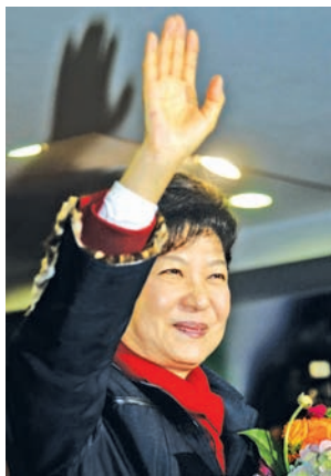
President Park Geun-hye

SEOUL, 8 Dec — President Park Geun-hye said on Monday that South Korea is working to realize a trilateral summit with Japan and China and establish a framework of trust in East Asia that has been undermined by frictions between Japan and its two Asian neighbours.