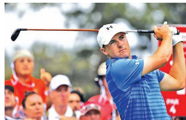
Jordan Spieth of the US hits his tee shot on the 17 th hole during the final round of the Australian Open golf tournament at The Australian Golf Club in Sydney, on 30 Nov, 2014.