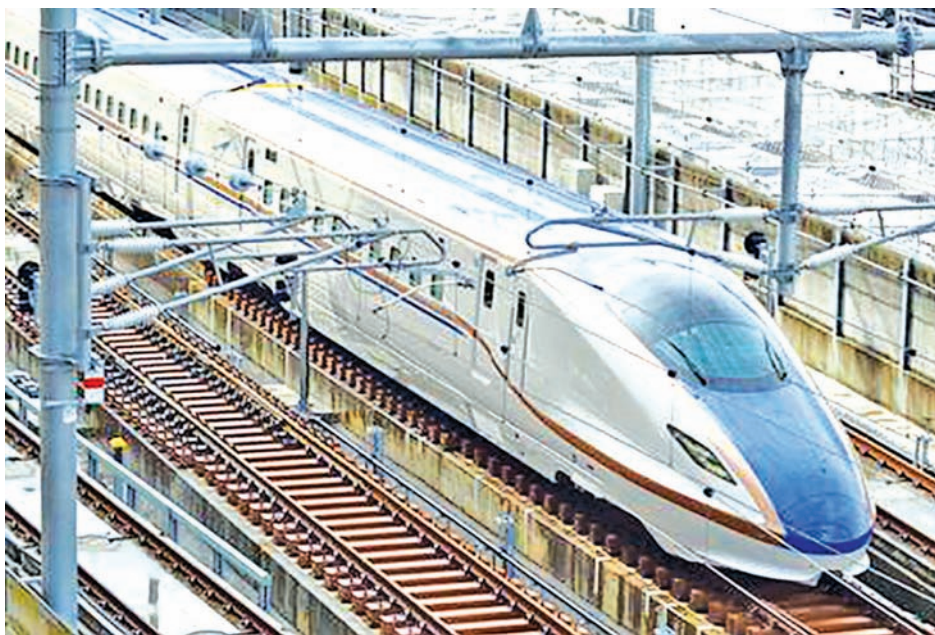
A shinkansen bullet train leaves JR Kanazawa station in Kanazawa on the Sea of Japan coast on 8 Dec, 2014, as test runs started for train cars to be used from next March for the Hokuriku Shinkansen Line service linking Tokyo with Kanazawa.