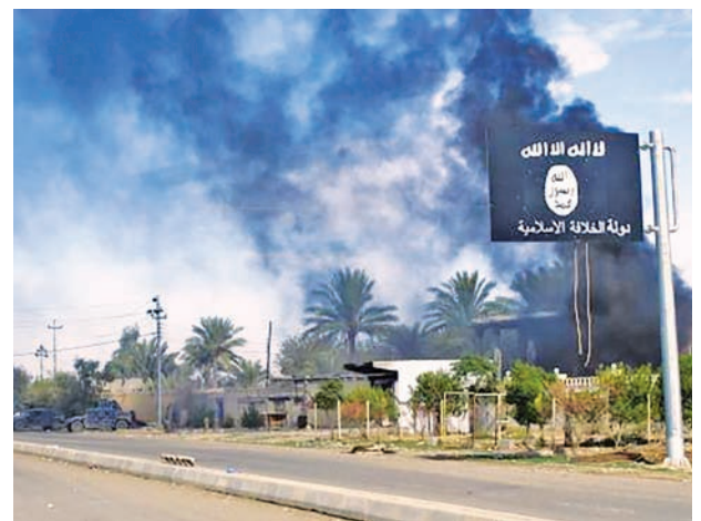
Smoke raises behind an Islamic State flag after Iraqi security forces and Shiite fighters took control of Saadiya in Diyala province from Islamist State militants, on 24 Nov, 2014.—REUTERS

The number is tiny compared with the thousands of recruits who have left European countries to join IS, with IS's influence in South Asia still embryonic.— Reuters