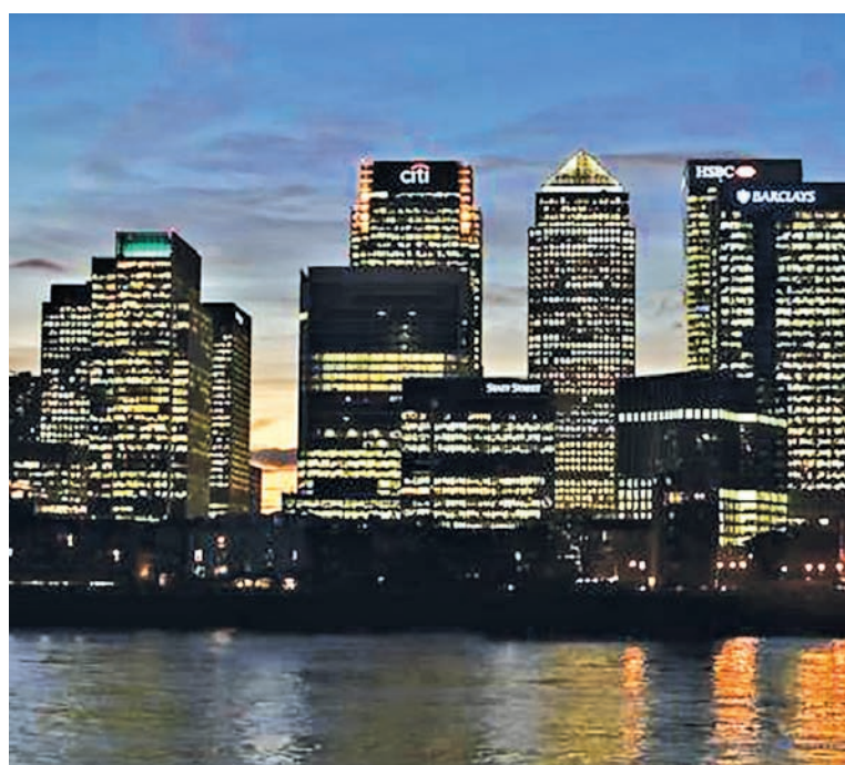
The Canary Wharf financial district is seen at dusk in east London on 7 Nov, 2014.