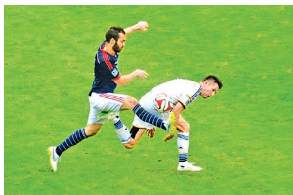
Los Angeles Galaxy forward Robbie Keane (7) battles for the ball with New England Revolution defender AJ Soares (5) in the second half during the 2014 MLS Cup final at StubHub Center.

Soccer title with a 2-1 victory over the New England Revolution in Sunday's championship-deciding MLS Cup.