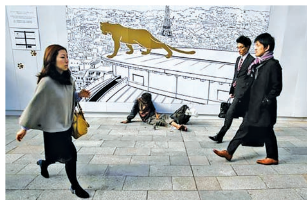
A man takes a nap along a street next to his belongings as pedestrians walk past at Tokyo's Ginza shopping district on 16 Nov, 2014.

TOKYO, 8 Dec — Japan's economy shrank more than initially reported in the third quarter on declines in business investment, data showed on Monday, surprising markets and backing premier Shinzo Abe's recent decision to delay a second sales tax hike.