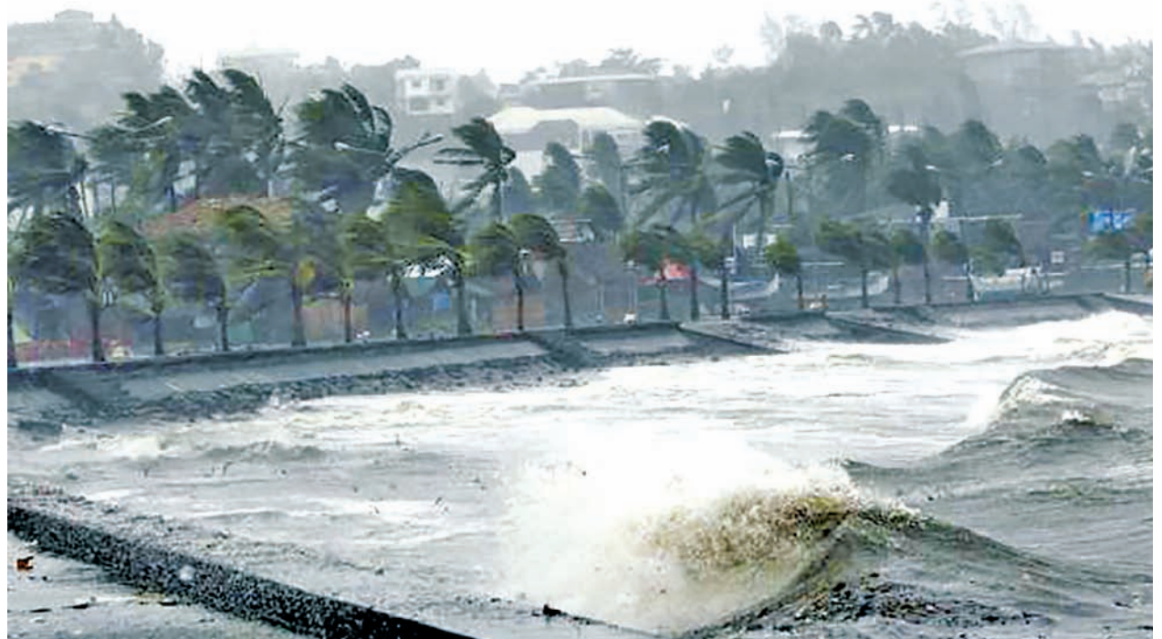
Strong winds and waves brought by Typhoon Hagupit pound the seawall in Legazpi City, Albay Province southern Luzon on 7 Dec, 2014.