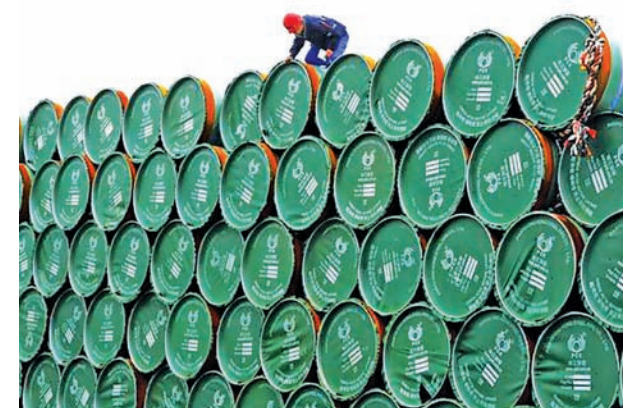
A worker stands on buckets of steel pipes which are waiting to be loaded onto a cargo ship, at a port in Lianyungang, Jiangsu province on 1 Nov, 2014.

Analysts see more policy support in coming months if the economy continues to stumble, with many expecting both more rate cuts and reductions in banks' reserve requirement ratios (RRR). Hopes of more stimulus have pushed China's benchmark stock indexes CSI300 to their highest in more than three years.—Reuters