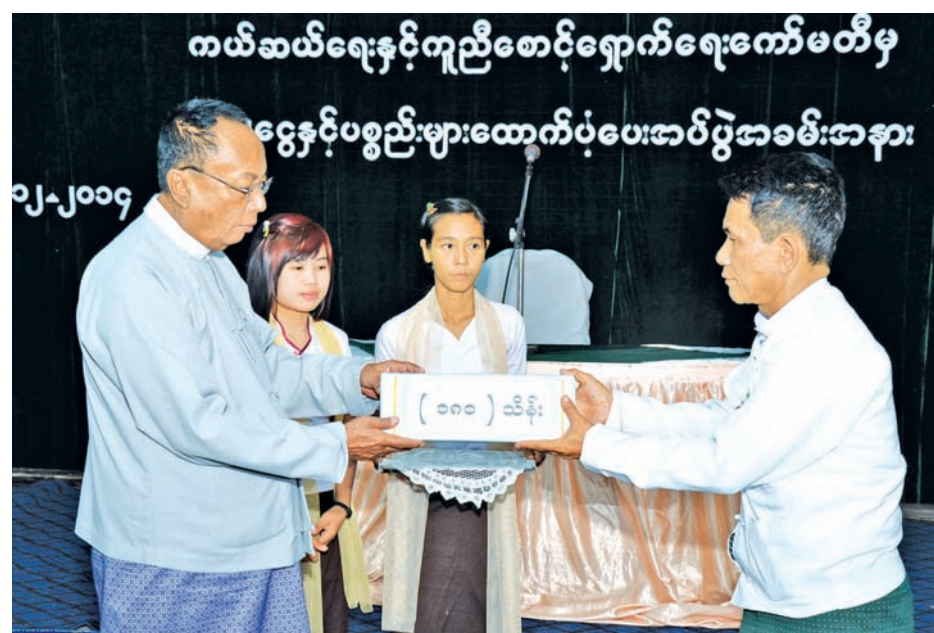
Speaker U Khin Aung Myint presents K18 million to philanthropic organizations' fund in Yamethin Township through an official.

Under the leadership of Amyotha Hluttaw Speaker U Khin Aung Myint, medical