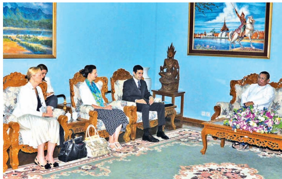
Union Minister for Foreign Affairs U Wunna Maung Lwin holds talks with Mr Gyan Chandra Acharya, U.N. Under-Secretary-General and High Representative for Least Developed Countries, Landlocked Developing Countries, and Small Island Developing States (UN-OHRLS).—MNA

Chief Minister of Rakhine State U Maung Maung Ohn explained the purpose of conducting the vocational courses and gave cash assistance to philanthropic schools in Maungtaung, Kyauktaw and Buthidaung townships. About 200 trainees attended the 12-week course. The ministry provided one sewing machine each to all trainees to support their livelihoods.—MNA