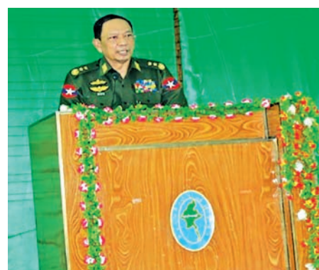
Union Minister Lt-Gen Thet Naing Win speaking at concluding ceremony of tailoring course.—MNA

NAY PYI TAW, 8 Dec — An advanced tailoring course, conducted by Education and Training Department under the Ministry of Border Affairs, concluded in Sittway, capital of Rakhine State, on Sunday.