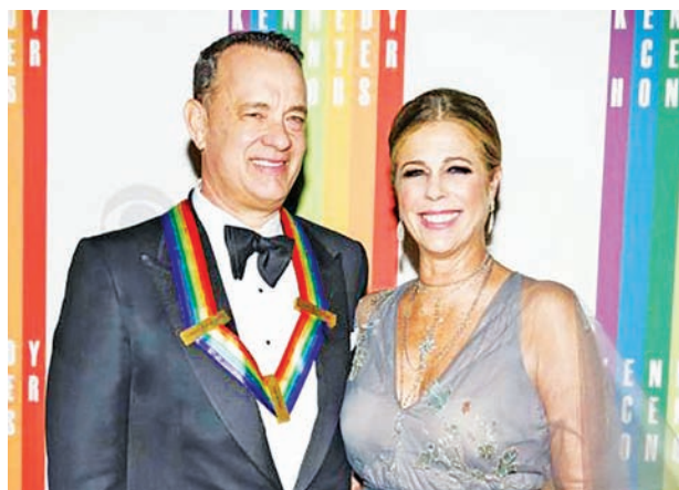
Actor Tom Hanks and his wife Rita Wilson arrive for the Kennedy Center Honours in Washington, on 7 Dec, 2014.

WASHINGTON, 8 Dec — Hollywood stars, ballet dancers, and soul singers on Sunday celebrated Kennedy Center Honours winners actor Tom Hanks, singer-song-