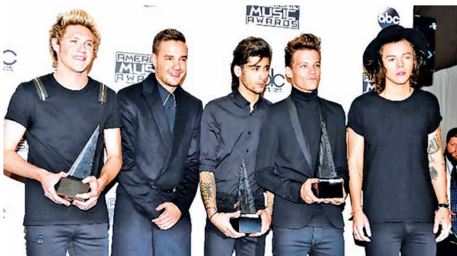
Irish pop rock band The Script frontman Danny O'Donoghue says he does not want the popular music group One Direction to split.

LONDON, 8 Dec — Irish pop rock band The Script frontman Danny O'Donoghue says he does not want the popular music group One Direction to split.