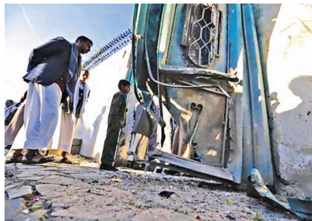
People inspect damage caused by the explosion of a bomb planted at the gate of a house belonging to a Shi'ite Houthi man in Sanaa on 8 Dec, 2014.

Yemen has been in political turmoil since 2011. Neighbouring Saudi Arabia and Western powers fear the instability could pose a threat to oil supplies and facilitate al-Qaeda's