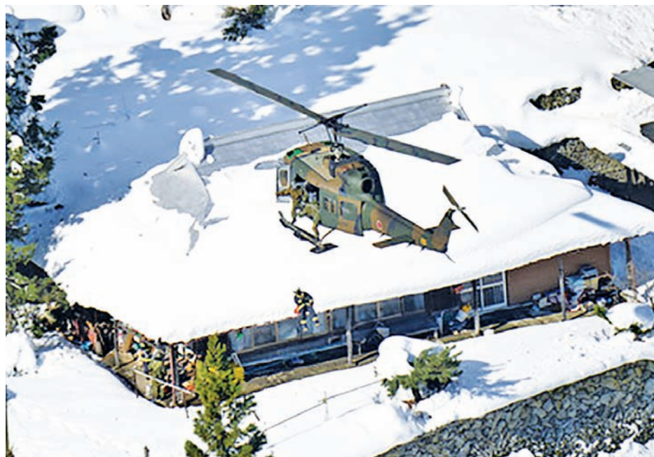
Photo taken from a Kyodo News helicopter on 8 Dec, 2014, shows a Self-Defence Forces helicopter hovering above a community in the western Japanese town of Tsurugi, which was isolated following heavy snow, so rescue workers could confirm the safety of residents. The heavy snow has left six people dead and hundreds affected by disruptions to transport.

TOKYO, 8 Dec — Heavy snow blanketed wide areas of Japan on Monday, leaving at least six people dead and hundreds affected by disruptions to transport, local authorities said.