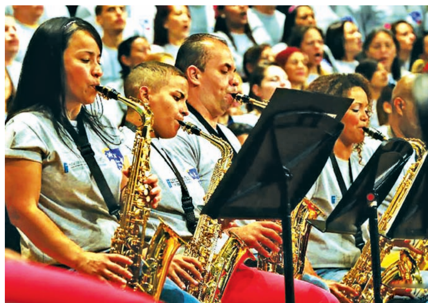
Members of the Penitentiary Symphonic Orchestra take part in a Christmas concert for the Peace, in the Teresa Carreno Theater, in Caracas, Venezuela, on 7 Dec, 2014.