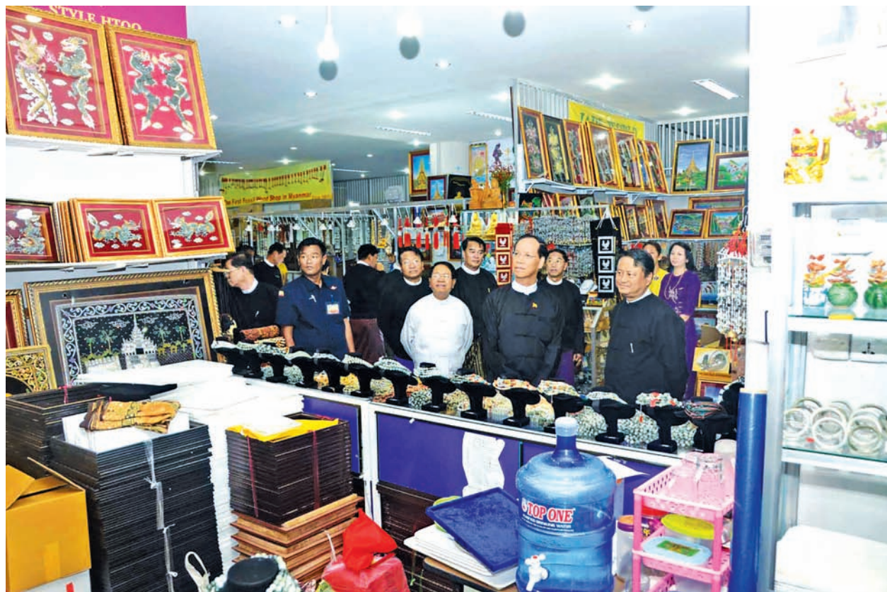
Vice President Dr Sai Mauk Kham views Myanmar handicrafts and sculptures at Cooperative Business Centre.

The sculpture competition has been held every