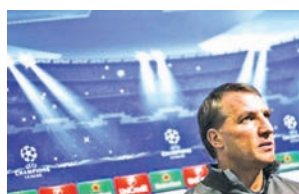
Liverpool's manager Brendan Rodgers

LONDON, 8 Dec — Liverpool have reached last chance saloon in the Champions League and only victory against Swiss champions FC Basel on Tuesday will spare them being left out in the cold. Third in Group B, level on four points with Bulgarian side Ludogorets, Liverpool are two points behind Basel and 11 points adrift of unbeaten group winners Real Madrid and have no more wriggle room after a disappointing campaign so far. After a four-year absence Liverpool's return to a tournament in which they have such a rich history has been an anti-climax but a first victory since September would see them snatch a last 16 spot at the expense of the Swiss side. Basel, who beat Liverpool 1-0 in October, need just a draw. While Liverpool would have hoped to have performed better — their only win so far was a narrow one against Ludogorets at home — the stage is set for one of Anfield's special nights. "We will get great support and there will be energy," Rodgers, whose side suffered a disappointing 0-0 draw at home to Sunderland on Saturday, told the Liverpool Echo.