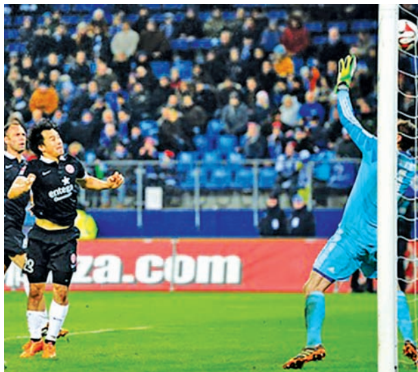
Japan's Shinji Okazaki of Mainz (3 rd from L) scores during the second half of a game against Hamburg SV in Hamburg, Germany, on 7 Dec, 2014. It was his eighth goal of the Bundesliga season. Hamburg SV won 2-1.

HAMBURG, Germany, 8 Dec — Japan striker Shinji Okazaki scored his eighth goal of the Bundesliga season in Mainz's 2-1 defeat away to Hamburg SV on Sunday.