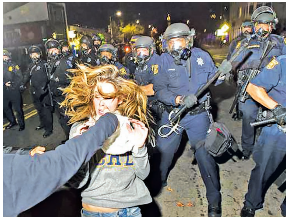
A protester flees as police officers try to disperse a crowd comprised largely of student demonstrators during a protest against police violence in the US, in Berkeley, California early on 7 Dec, 2014.