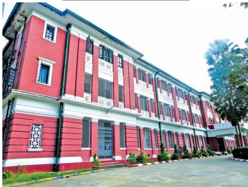
Already-reopened Thiri Hostel on the campus of Yangon University.