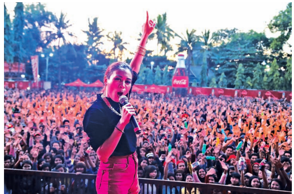
A vocalist presents songs to audience.

This was the last stop of the Coca-Cola Happiness Journey for 2014. For the latest information on Coca-Cola Myanmar activities, please visit www.facebook.com/CocaCola-Myanmar .