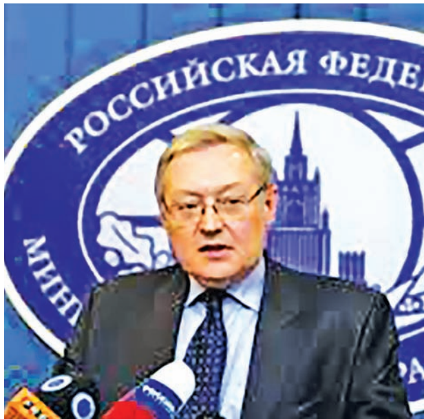
Deputy Russian Foreign Minister Sergey Ryabkov.

The "reset" of relations with Moscow has limited the possibilities of the United States to interfere into Russia's internal affairs, Ryabkov noted.