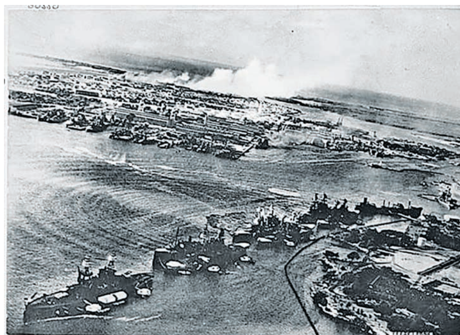
This captured Japanese photograph shows the attack on Pearl Harbour, Hawaii on 7 Dec, 1941. In the distance, the smoke rises from Hickam Field.