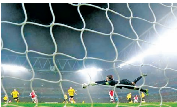
Arsenal's Alexis Sanchez scores a goal past Borussia Dortmund's goalkeeper Roman Weidenfeller (C) during their Champions League group D soccer match in London on 26 Nov, 2014.

The situation is simpler in Group B where Liverpool must beat Basel to follow