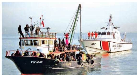
A fishing boat carried illegal migrants is seen near Mersin province of Turkey, on 7 Dec, 2014. The coast guard and police arrested 361 illegal migrants, including Iraqis and Syrians, in two separate operations. The illegal migrants was on their way to Europe by fishing boat, according to Turkey's Daily News on 7 Dec.—XINHUA