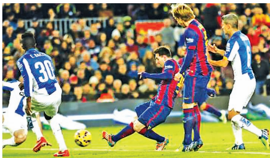
Barcelona's Lionel Messi (3rd R) scores his second goal against Espanyol during their Spanish first division soccer match at Nou Camp stadium in Barcelona on 7 Dec, 2014.

Espanyol were in disarray and Gerard Pique was allowed a free header from a corner to add to the lead after 53 minutes. Substitute Pedro latched onto a long ball from Jordi Alba to grab another and, with nine minutes remaining, he set up Messi for a brilliantly executed third. "Until the first goal the game was at a slow tempo which is what we are used to as rivals just pack the defence," Barca coach Luis Enrique told a news conference. "When we conceded, the doubts came and we couldn't find an end product to our play. The key came with the goal before the break and then after that it was all a lot easier."