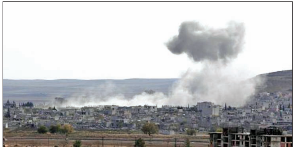
An explosion following an air strike is seen in western Kobani neighbourhood, on 23 Nov, 2014.