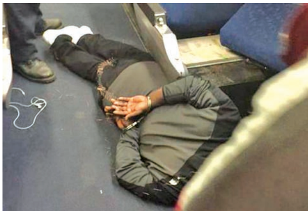
A man is seen in custody aboard an Amtrak train following a stabbing incident in Niles, Michigan on 5 Dec, 2014.

NILES, (Michigan) 6 Dec — Police took a suspect into custody in Michigan on Friday after four people were stabbed aboard an Amtrak train in the town of Niles, a police dispatcher said.