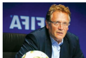
FIFA secretary general Jerome Valcke addresses a news conference after a meeting of the FIFA executive committee in Zurich on 26 Sept, 2014.