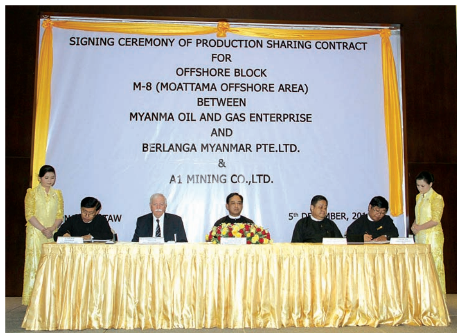
Union Minister for Energy U Zeyar Aung attends signing ceremony of M-8 Mottama offshore area between MOGE and oil companies.

NAY PYI TAW, 6 Dec — Myanmar Oil and Gas Enterprise under the Ministry of Energy and Berlanga Myanmar Pte Ltd that registered in Singapore and