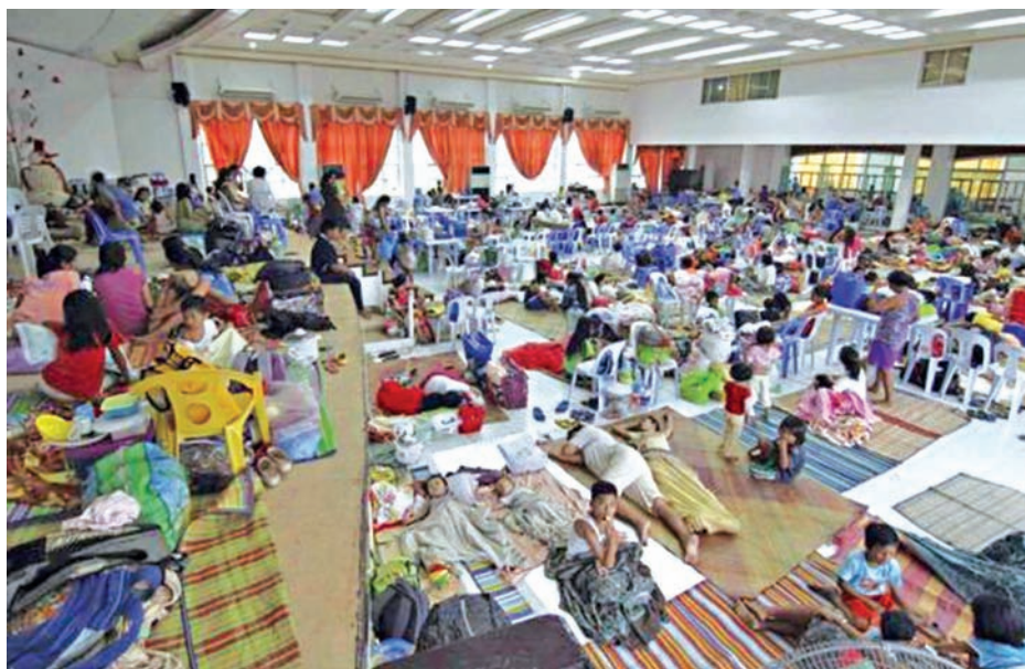
People take shelter inside a evacuation centre after evacuating from their homes due to super-typhoon Hagupit in Surigao city, southern Philippines on 5 Dec, 2014.