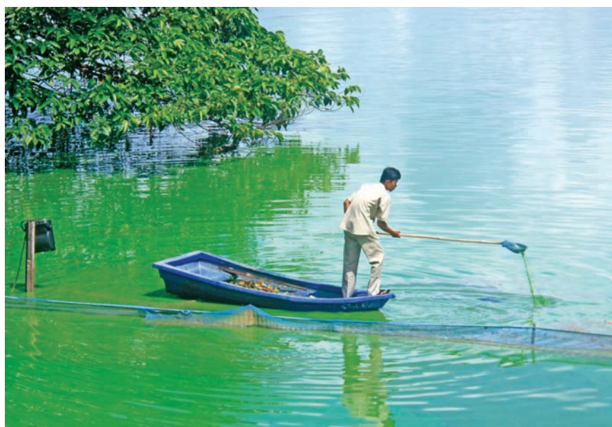
A volunteer collects garbage to prevent water pollution in Kandawgyi Lake in Yangon as part of environmental conservation.

connectivity between the two countries in cooperation with NHK, Japan International Broadcasting Inc., Myanmar National Television and Japanese companies in Myanmar.—GNLM