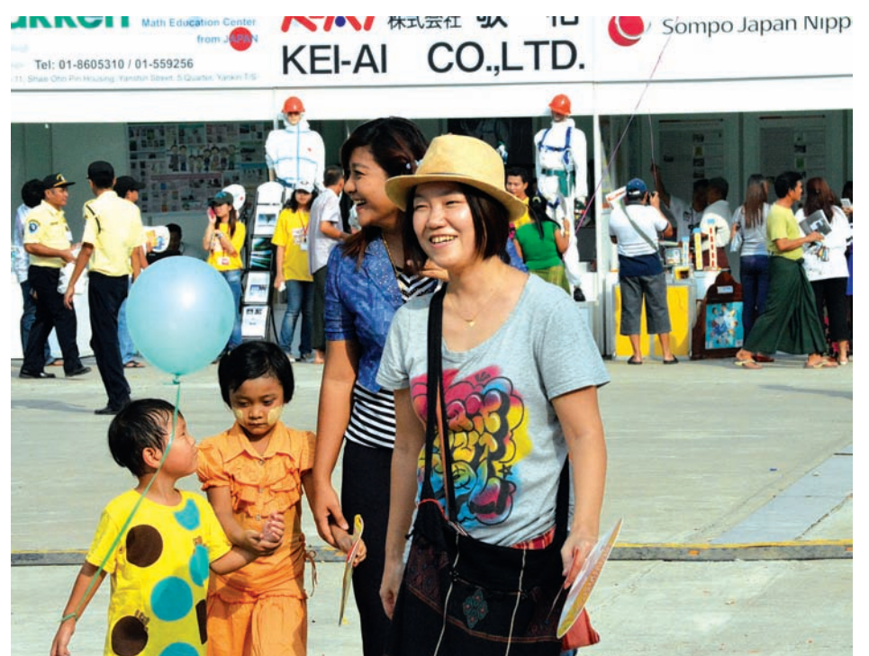
Families enjoy the food and activities on offer at the inaugural Japan Myanmar Pwe Taw, which opened on Saturday at Shwe Htut Tin Ground in Yangon.