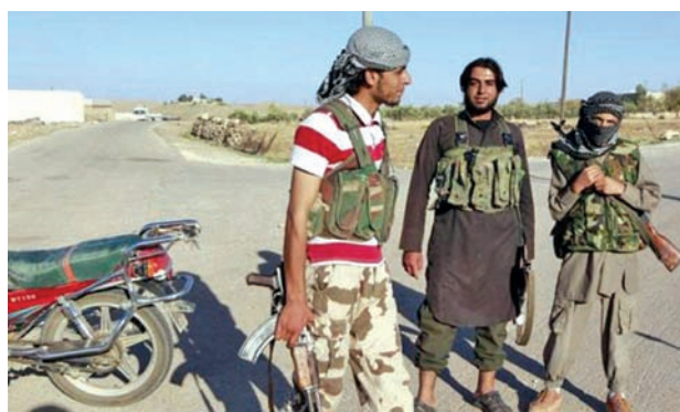
Islamic State fighters stand along a street in the countryside of the Syrian Kurdish town of Kobani, after taking control of the area on 7 Oct, 2014.