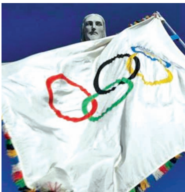
The Olympic Flag flies in front of "Christ the Redeemer" statue during a blessing ceremony in Rio de Janeiro on 19 Aug, 2012.

"We are in that same phase as we were in London (2012), as we are in all Games. With less than two years to go it's all