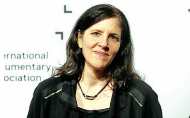
Director Laura Poitras of the best feature award nominee "Citizenfour" poses at the International Documentary Association's 2014 IDA Documentary Awards in Los Angeles on 5 Dec, 2014.

LOS ANGELES, 6 Dec — "CitizenFour," filmmaker Laura Poitras's documentary about National Security Agency whistleblower Edward Snowden, was given the top award for best