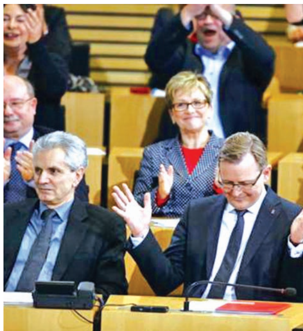
Bodo Ramelow of the Left party (Die Linke) reacts as it is announced he is to become the new Thuringia state premier, in parliament in Erfurt on 5 Dec, 2014.

Merkel, who had warned against a Left-led