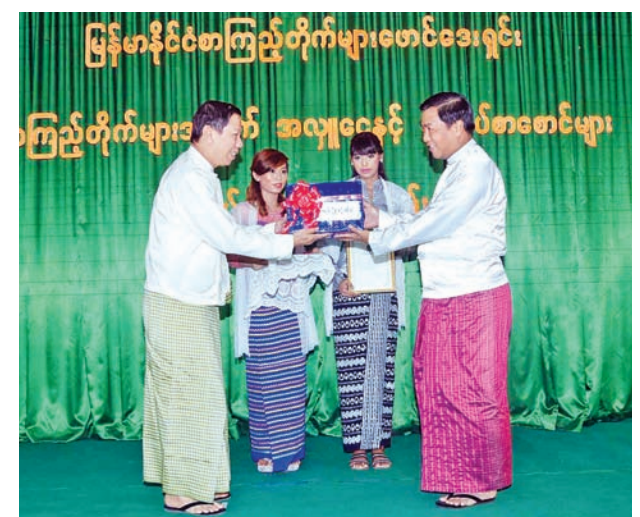
Deputy Minister for Information U Pike Htway accepts cash donation from wellwisher for Myanmar Libraries Foundation.

The foundation has donated K6.48 million to the fund for development