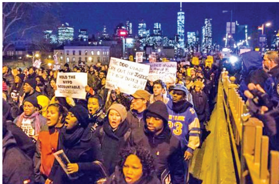
The Lower Manhattan skyline, including One World Trade Centre, is seen in the background as protesters, demanding justice for Eric Garner, enter Brooklyn off the Brooklyn Bridge in New York on 4 Dec, 2014.