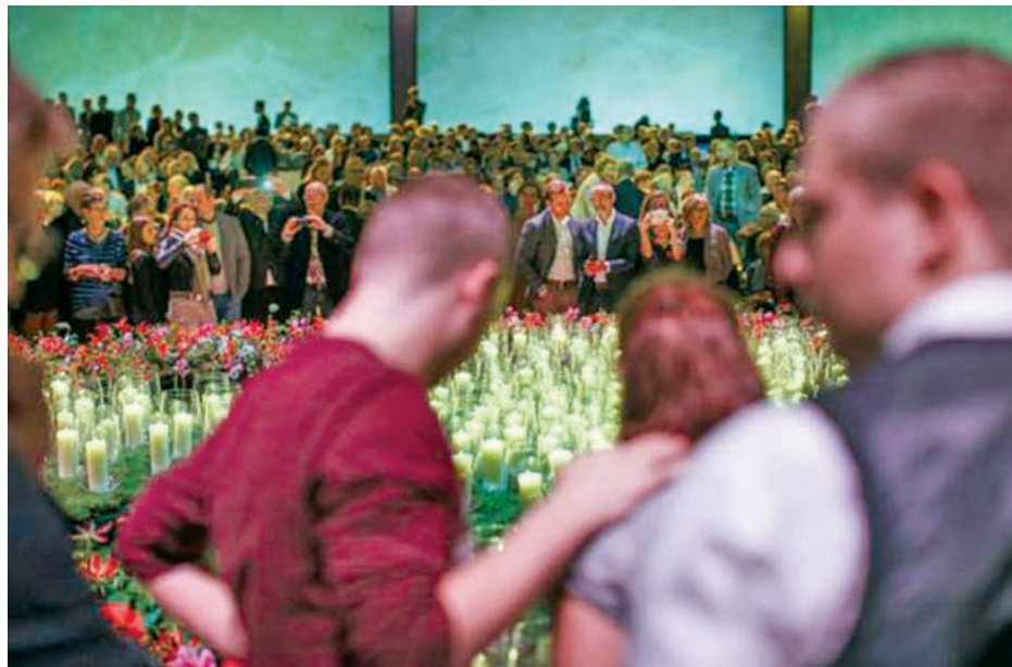
Unidentified relatives and friends of the victims of Malaysian Airlines MH17 attend a national memorial at the RAI convention centre in Amsterdam on 10 Nov, 2014.

Malaysia Airlines flight MH17 was downed on 17 July over eastern Ukraine, killing all 298 passengers and crew, two-thirds of them Dutch. Ex-