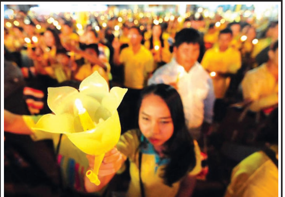
Thai people light candles and sing anthems during the celebration of Thai King Bhumibol Adulyadej's 87 th birthday in Bangkok, Thailand on 5 Dec, 2014. Thai King Bhumibol Adulyadej on Friday cancelled a pre-scheduled public audience on his doctors' advice, which, however, did not damp people's enthusiasm to celebrate his 87 th birthday.