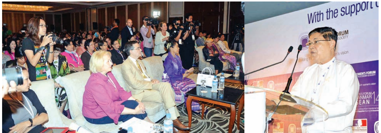
Union Minister at the President Office U Soe Thane speaking at second-day session of Women's Forum Myanmar 2014.

YANGON, 6 Dec — A woman of great efficiency is capable of raising a happy family and contributing to society and national de-