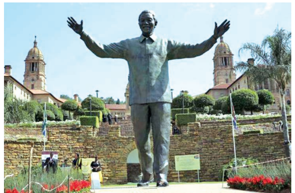
Graca Machel (bottom 3 rd L), widow of former South African President Nelson Mandela, gives a speech before laying wreaths during the official commemoration ceremony marking his first death anniversary at the world's largest Mandela statue at the Union Buildings in Pretoria on 5 Dec, 2014.