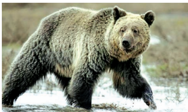
A grizzly bear roams through the Hayden Valley in Yellowstone National Park in Wyoming, on 18 May, 2014.

SALMON, (Idaho) 6 Dec — Federal wildlife managers on Friday declined to upgrade protections for a population of grizzly bears in the remote reaches of Idaho and northwest Montana that numbers fewer than 50, and which conservationists say are going extinct.