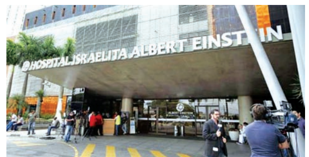
General view of Albert Einstein Hospital where Brazilian soccer legend Pele is in the intensive care unit in Sao Paulo on 28 Nov, 2014.

The 74-year-old Pele, born Edson Arantes do Nascimento, has suffered a series of health problems in the past decade that, among other things, have led to emergency eye surgery for a detached retina and a hip replacement.—Reuters