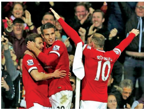
Manchester United's Juan Mata (L) celebrates his goal with teammates Robin van Persie (C) and Wayne Rooney during their English Premier League soccer match against Crystal Palace at Old Trafford in Manchester, northern England, on 8 Nov, 2014.

United, one point behind Southampton in fourth spot, will be without Argentina winger Angel Di Maria because of a hamstring injury.—Reuters