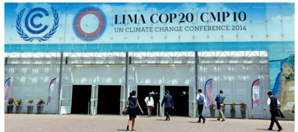
People walk at the venue of the UN Climate Change Conference COP 20 in Lima on 4 Dec, 2014.