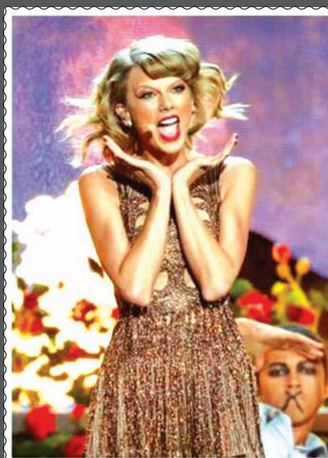
Pop star Taylor Swift (L) and British soul-pop artist Sam Smith perform during the 42nd American Music Awards in Los Angeles, California in this combination photo from 23 Nov, 2014 file photos.

Pharrell, 41, earned Grammy nominations for his own album "Girl" and