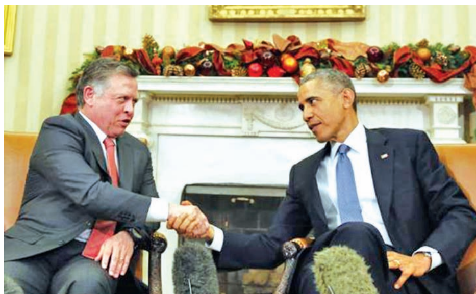
US President Barack Obama shakes hands with King Abdullah of Jordan in the Oval Office of the White House in Washington, on 5 Dec, 2014.

Beyond the military challenge, the two leaders