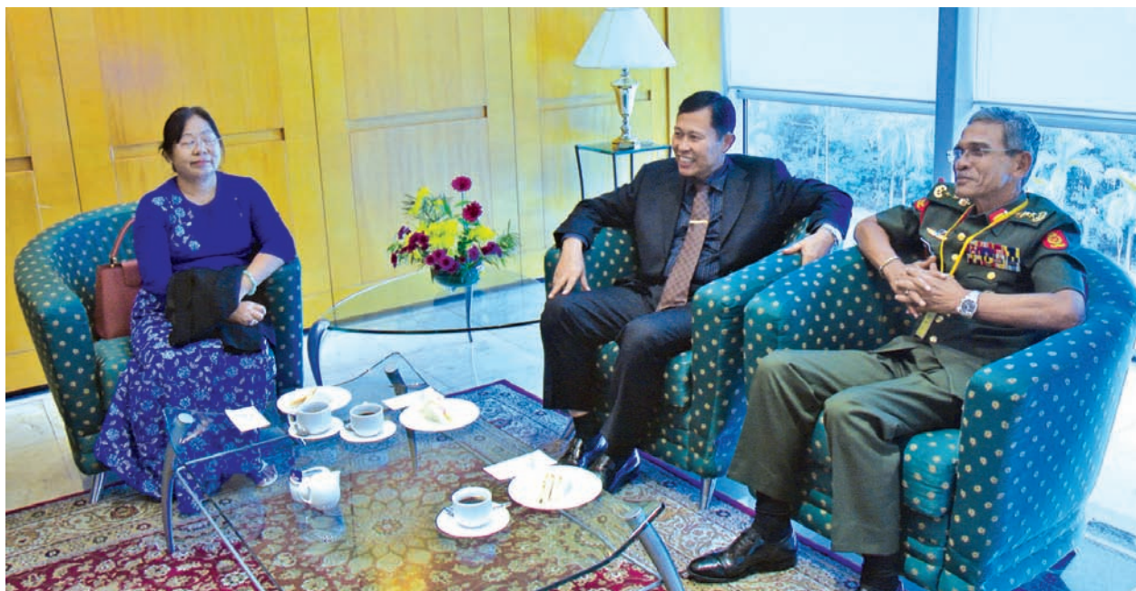
Vice-Senior General Soe Win and wife at Kuala Lumpur International Airport with Malaysian senior military officer.