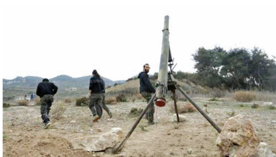
Rebel fighters prepare to launch a Grad long distance shell towards forces loyal to Syria’s president Bashar Al-Assad located in the city of Jableh at the Syrian coast, from Jabal al-Akrad area in Syria’s northwestern Latakia Province on 4 Dec, 2014.