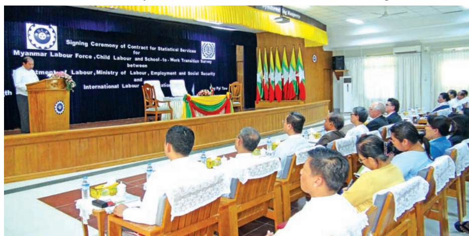
Union Minister U Aye Myint addresses signing ceremony of the contract for statistical services for Myanmar Labour Force, Child Labour and School-to-Work Transition Survey.—MNA

ILO will provide monetary and technical assistance to Labour Department, Central Statistical Organization and Population Department in conducting the labour statistics, compilation of questions, conducting the training course for collection data and analysis for facts and figures.—MNA