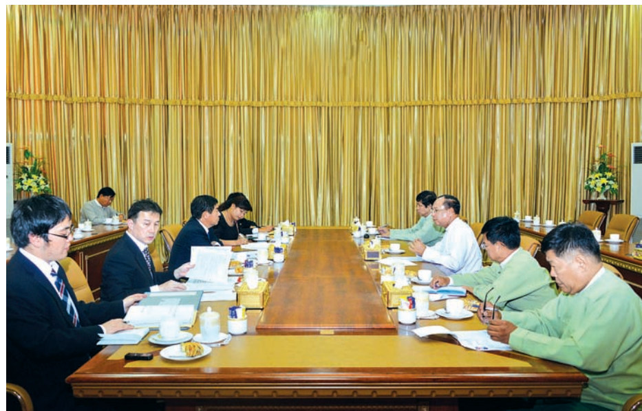
Union Minister U Win Tun holds talks with Vice Minister Mr Kisaburo Ishii of Land, Infrastructure, Transport and Tourism of Japan.—MNA

NAY PYI TAW, 6 Dec— Production of precise map based on Global Positioning System (GPS) and Continuously Operating Reference Station (CPRS) was discussed between Union Minister for Environmental Conservation and Forestry U Win Tun and Vice Minister Mr Kisaburo Ishii of Land, Infrastructure, Transport and