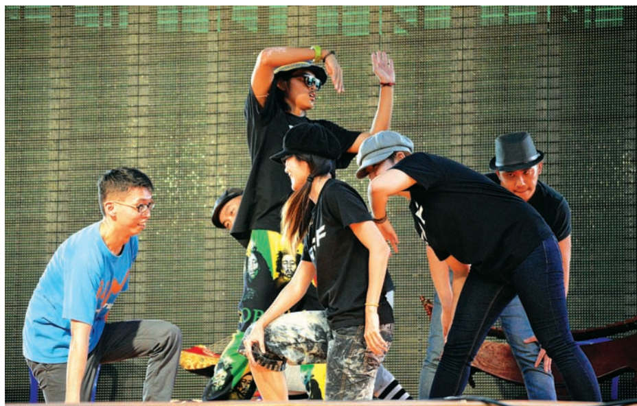
Hearing impaired Singaporean performers rehearse before the start of ASEAN Festival of Disabled Artists 2014 at Myoma Parade Ground in Yangon on Friday. The festival, the first event for people with disabilities in the ASEAN region, is to continue through Sunday.