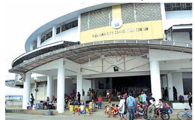
Residents with their belongings wait outside the convention centre, which is being used as an evacuation centre in Tacloban city, central Philippines on 4 Dec, 2014.

Eastern Samar and the island of Leyte were worst-