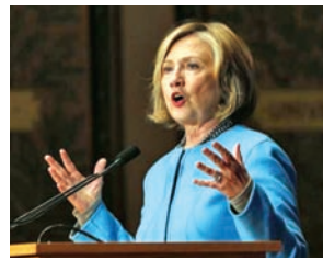
Former Secretary of State Hillary Clinton speaks on “Smart Power: Security Through Inclusive Leadership” at Georgetown University in Washington on 3 Dec, 2014.

Clinton, who lost the Democratic presidential nomination in 2008 to Barack Obama and served as his secretary of state from