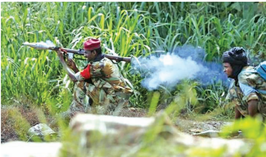
A Seleka fighter fires a rocket propelled grenade (RPG) towards French soldiers in Bambari on 24 May, 2014.

PARIS, 5 Dec — France is withdrawing troops from Central African Republic as a United Nations peace-keeping force nears its full deployment, but will keep a presence to support the UN with a rapid reaction force, officials and diplomats said.