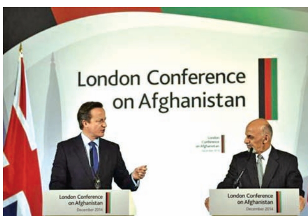
President Ashraf Ghani of Afghanistan (R) and Britain's Prime Minister David Cameron speak at a joint news conference at the London Conference on Afghanistan in central London on 4 Dec, 2014.

Kerry said the London conference was never