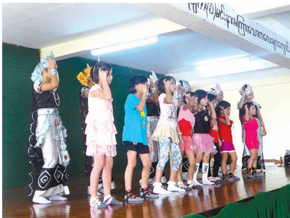
Students from Mary Chapman School for the Deaf entertain the audience with dance.