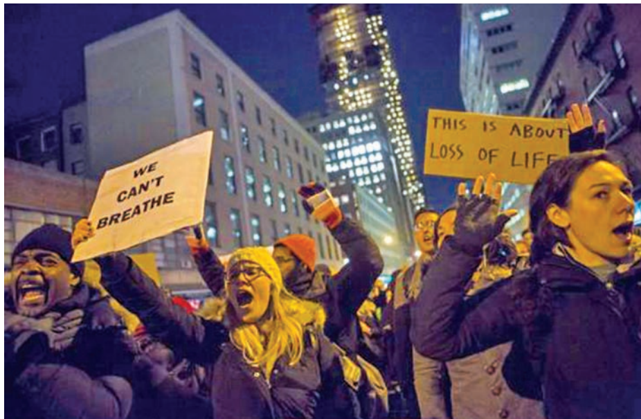
Protesters march in Manhattan as thousands of demonstrators take to the streets of New York demanding justice for the death of Eric Garner on 4 Dec, 2014.

ry terminal at Manhattan's southern. The main group headed west and temporarily shut the West Side Highway, resulting in at least a handful of arrests, before turning north toward Times Square.