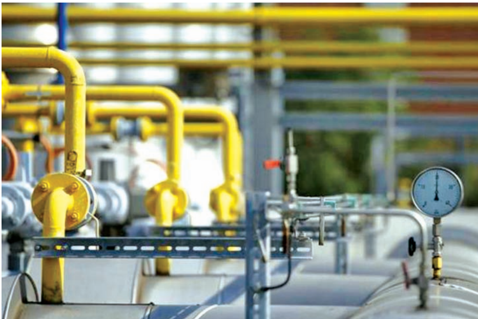
A gas gauge and pipes are pictured at Wiener Netze (Viennese Energy Supply Company), Vienna's gas distribution node, in the Erdberg district of Vienna on 19 Sept, 2014.—REUTERS

KIEV, 5 Dec — Ukraine's new energy minister pleaded with industrial and domestic consumers to use less electricity as hard frosts led to a sharp drop in gas stocks and low coal stockpiles, making more blackouts likely.