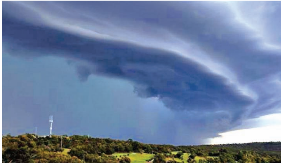
A large storm front crosses over the Sydney suburb of Wakehurst on 5 Dec, 2014.

SYDNEY, 5 Dec — A severe thunderstorm hit parts of Sydney on Friday afternoon and damaged more than 100 properties, with the Bureau of Meteorology issuing a “severe