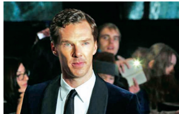
Cast member Benedict Cumberbatch arrives for the world film premiere of "The Hobbit: The Battle of the Five Armies" at Leicester Square in central London on 1 Dec, 2014.