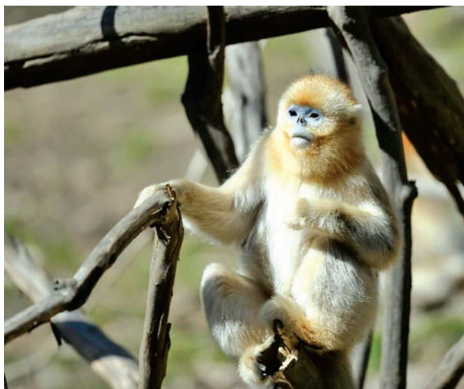
A wild golden monkey is seen at the Qinling Mountains in Ningshan County, northwest China's Shaanxi Province, on 4 Dec, 2014. The number of wild golden monkeys at the Qinling Mountains has increased to about 5,000, according to Shaanxi provincial forestry department.

SEOUL, 5 Dec — Death toll has risen to 25 in a South Korean fishing ship sinking accident in the Bering Sea as five more bodies were recovered, Seoul's foreign ministry said on Friday.