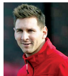
Barcelona’s soccer player Lionel Messi takes part in a commercial event at Camp Nou stadium in Barcelona on 27 Nov, 2014.

The RFEF said on its website (www.rfef.es) the committee had been unable to detect “deliberate time-wasting” on Messi’s part but only “a normal reaction from someone who had suffered an aggression