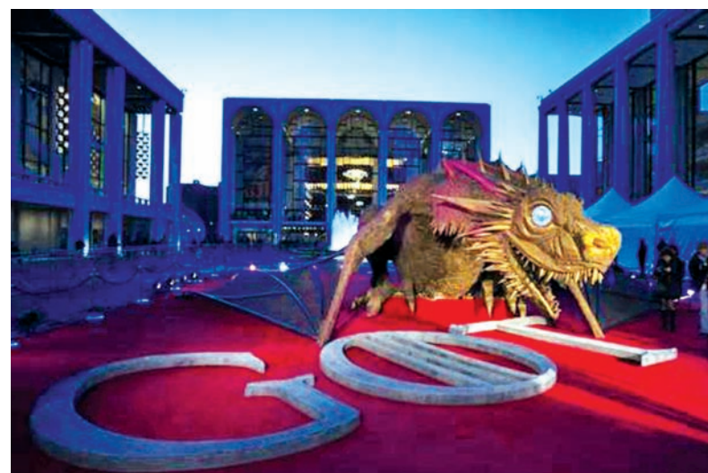
A dragon statue stands on a red carpet in preparation for the season four premiere of the HBO series "Game of Thrones" in New York on 18 March, 2014.

The nominees for best comedy episode include