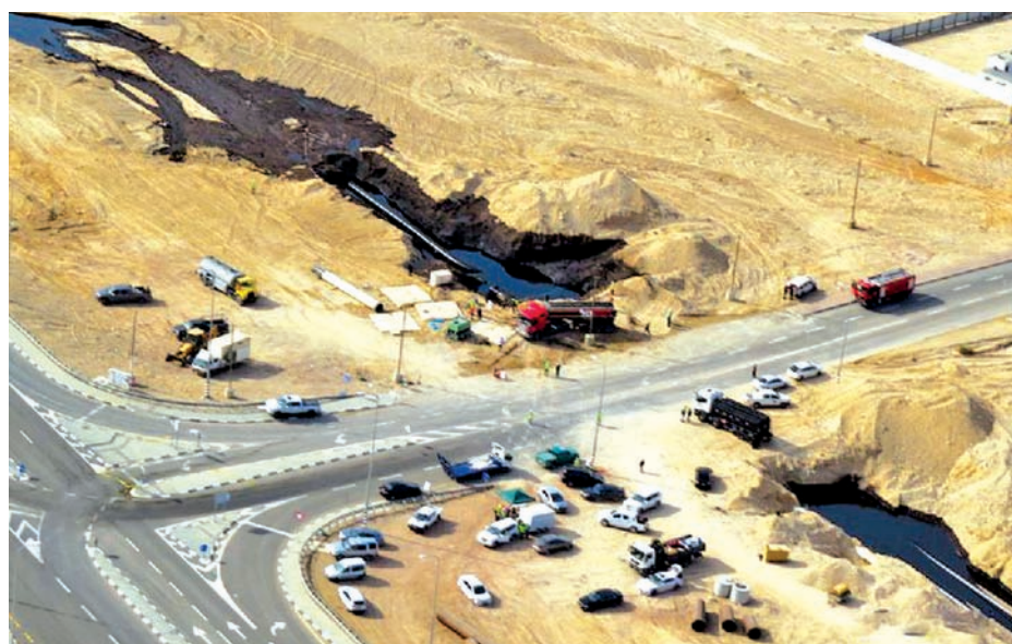
Handout aerial photograph provided by the Israeli Ministry of Environmental Protection shows a large oil spillage caused by an oil pipeline that breached during maintenance work in the Arava desert, southern Israel, on 4 Dec, 2014. An oil spill flooded overnight a desert nature reserve in southern Israel, causing "one of the worst" ecological disasters in Israel, officials and local media said on Thursday. —XINHUA

"Rehabilitation will take months, if not years ... This is one of the State of Israel's gravest pollution events. We are still having trouble gauging the full extent of the contamination." There was no immediate word of any injuries or damage on the Jordanian side of the frontier.—Reuters