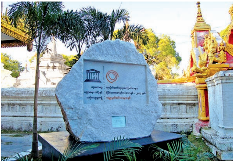
Mandalay's Kuthodaw Pagoda stone inscriptions included in World Heritage List of UNICEF in 2013.

During the visit, the Norwegian King and his wife donated cash to the fund of the pagoda on Mandalay hill and looked round world record stone inscriptions and oldest living star-flower trees.