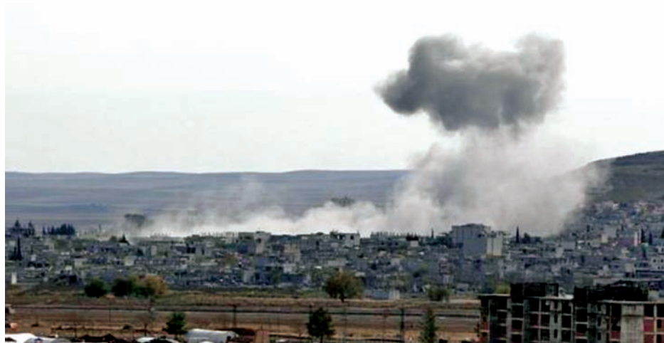
An explosion following an air strike is seen in western Kobani neighbourhood, on 23 Nov, 2014.