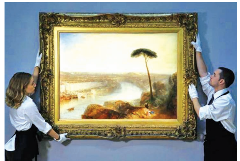
Sotheby's employees pose with British artist JMW Turner's artwork "Rome, from Mount Aventine" at Sotheby's auction house in London on 28 Nov, 2014.