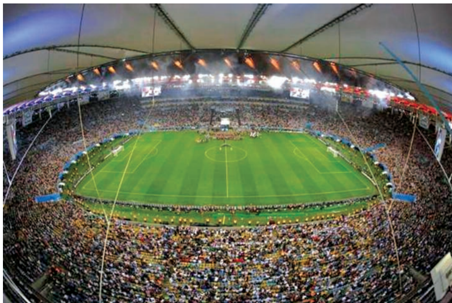
Fireworks explode over the stadium after the German team won their 2014 World Cup final against Argentina at the Maracana stadium in Rio de Janeiro on 13 July, 2014.