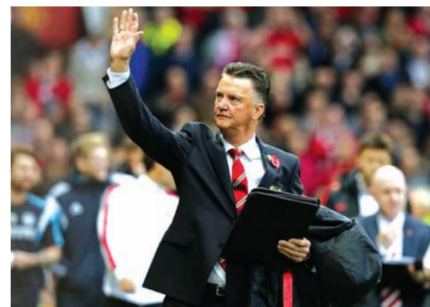
Manchester United’s manager Louis van Gaal waves to fans as he arrives for their English Premier League soccer match against Chelsea at Old Trafford in Manchester, northern England on 26 Oct, 2014.