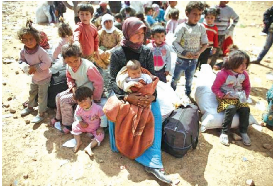
Syrian Kurdish refugees wait after crossing into Turkey near the southeastern Turkish town of Suruc in Sanliurfa Province on 30 Sept, 2014.

food aid was a "looming disaster", as refugees had exhausted their resources and needed whatever help was available after years of displacement, Castragiovanni said.