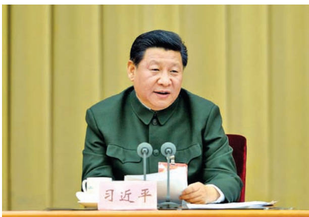
Chinese President Xi Jinping, also general secretary of the Communist Party of China (CPC) Central Committee and chairman of the Central Military Commission (CMC), addresses a meeting of the armament work of the People’s Liberation Army, which is held in Beijing, China, from 3 to 4 Dec, 2014.