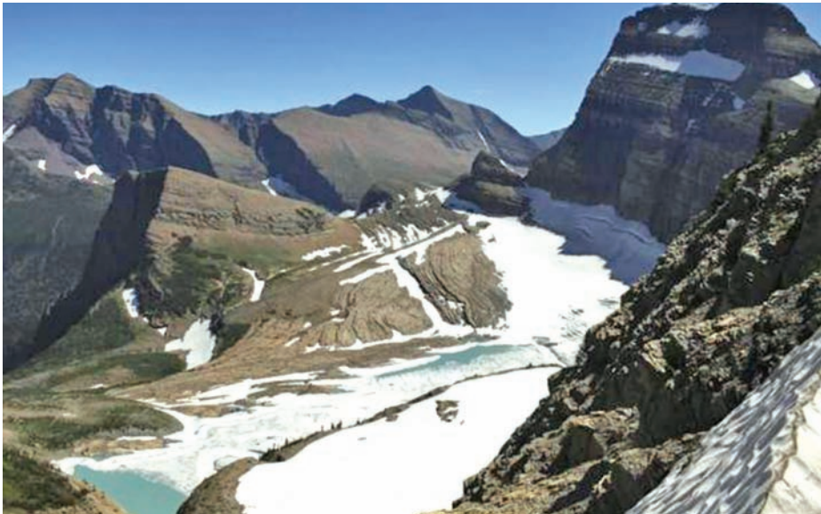
View from atop the Grinnell Glacier Overlook trail in Glacier National Park, Montana on 24 Aug, 2011.

HELENA, (Montana), 5 Dec — The expected disappearance of the famed glaciers at Montana's Glacier National Park by 2030 could spell doom for a rare aquatic insect confined to high mountain streams that are warming due to climate change, US scientists said on Thursday.