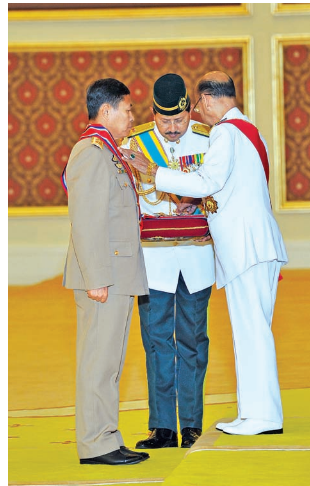
The King of Malaysia confers First Degree, Gallant Commander of Malaysian Armed Forces on Vice-Senior General Soe Win in Malaysia.