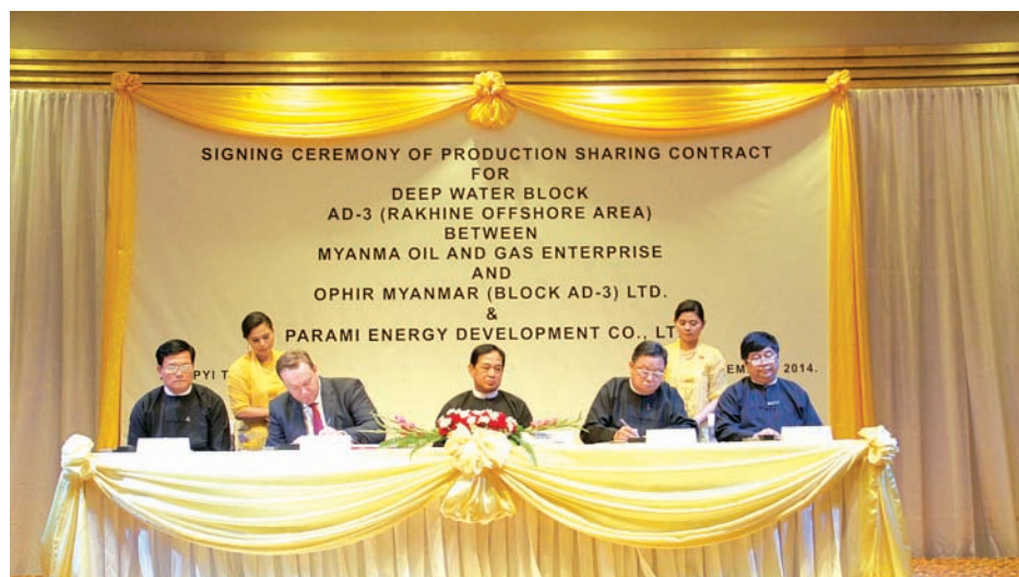
MIC Chairman Union Minister U Zeyar Aung attends signing ceremony of Deep Water Block AD-3.

NAY PYI TAW, 5 Dec— Myanmar Oil and Gas Enterprise under the Ministry of Energy and Ophir Myanmar (Block AD-3) Limited registered at Channel Islands and Parami Energy Development Ltd of Myanmar signed the production sharing contracts at Hilton Hotel in Nay Pyi Taw on 4 December.