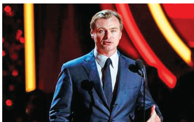
Christopher Nolan to receive the Art Directors Guild's Cinematic Imagery Award.

nominations, while networks ABC and CBS each had six nominations. NBC earned four nods.—Reuters