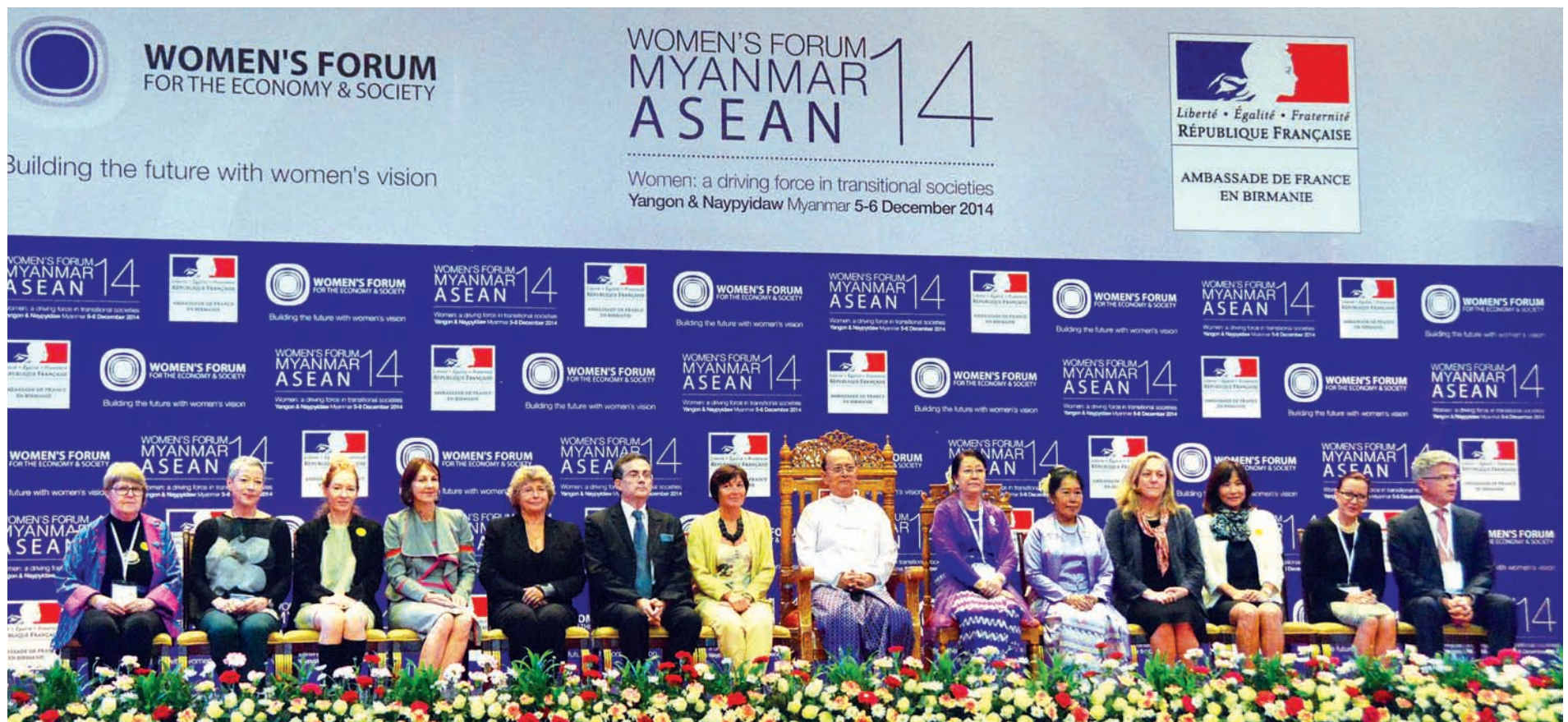
President U Thein Sein poses for documentary photo with participants at Global Women's Forum 2014.

NAY PYI TAW, 5 Dec —President U Thein Sein delivered a speech at the opening ceremony of Global Women's Forum 2014 at Myanmar International Convention Centre-2 in Nay Pyi Taw on Friday.