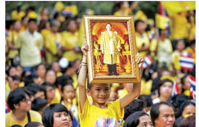
A boy holds up a picture of Thailand’s King Bhumibol Adulyadej as he and others gather to pray for the health and celebrate the birthday of the king at Siriraj hospital where he is staying, in Bangkok on 5 Dec, 2014.

BANGKOK, 5 Dec — The Bureau of the Royal Household announced on Friday that a ceremony to mark the 87 th birthday of Thailand’s revered King Bhumibol Adulyadej has