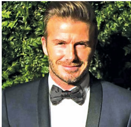
Former British soccer player David Beckham smiles at the Evening Standard Theatre awards in London on 30 Nov, 2014.

"Miami is still David's number one choice and it will happen. The fans and the people of Miami are behind us and we hope to announce some positive and exciting news soon." — Reuters