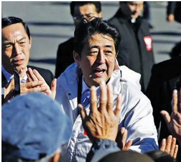
Japan's Prime Minister Shinzo Abe, who is also leader of the ruling Liberal Democratic Party (LDP), gives high-fives to supporters during his official campaign kick-off for the 14 December lower house election, at the Soma Haragama fishing port in Soma, Fukushima prefecture on 2 Dec, 2014.

TOKYO, 4 Dec — Japan's ruling and opposition parties have started adjusting their campaign strategies after opinion polls suggested the Liberal Democratic Party may win more than 300 of the 475 seats in the 14 December lower house election.