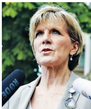
Australia's Foreign Minister Julie Bishop

It is the first use of new security powers obtained by conservative Prime Minister Tony Abbott, under which Australian citizens travelling to any area overseas declared off limits can face up to a decade in prison. "Under the provisions of our foreign fighters legislation, I have today declared Al Raqqa Province an area where a listed terrorist organization is engaging in hostile activity,"