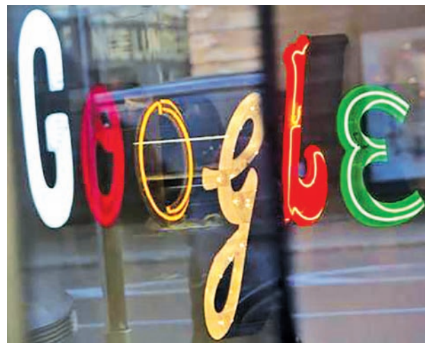
The Google signage is seen at the company's offices in New York on 8 Jan, 2013.