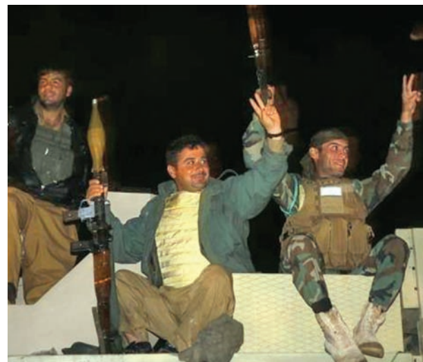
Kurdish Peshmerga fighters hold their weapons while celebrating atop an army vehicle as they move towards the Syrian town of Kobani from the border town of Suruc, Sanliurfa Province on 13 Oct, 2014.