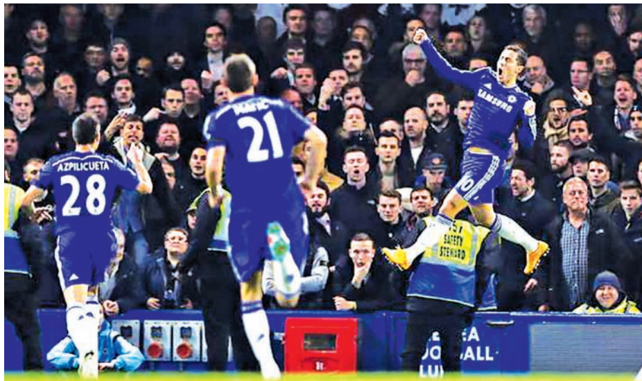
Chelsea's Eden Hazard (R) celebrates after scoring a goal against Tottenham Hotspur during their English Premier League soccer match at Stamford Bridge in London on 3 Dec, 2014.

LONDON, 4 Dec — Chelsea's inexorable Premier League title march continued with a consummate 3-0 triumph over Tottenham Hotspur and champions Manchester City stayed second with a 4-1 canter at Sunderland on Wednesday.