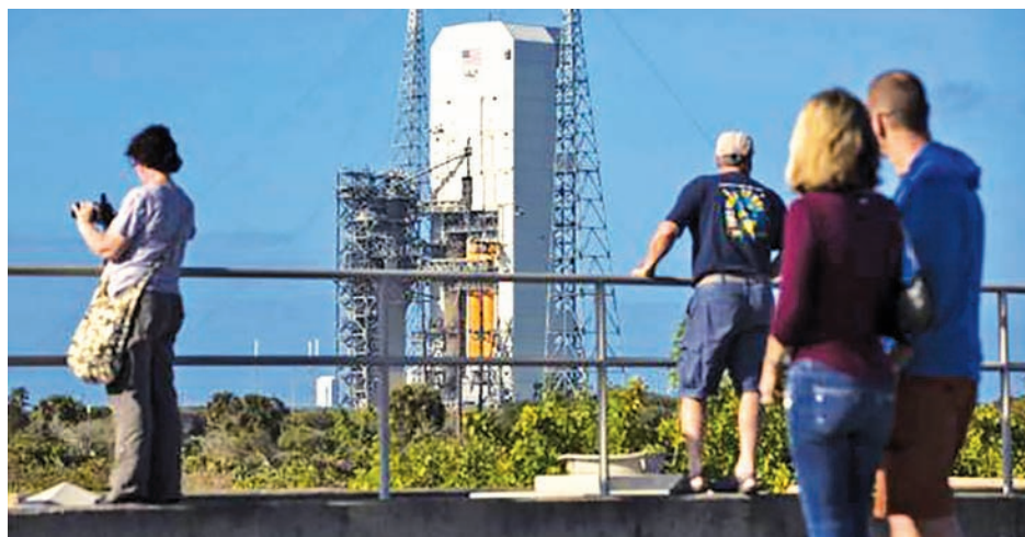
Tourists stand on the original Apollo 1 launch pad overlooking the Delta IV Heavy rocket with the Orion spacecraft on Space Launch Complex 37B pad at the Cape Canaveral Air Force Station in Cape Canaveral, Florida on 1 Dec, 2014.—REUTERS

The rocket will take Orion about 3,600 miles (5,800 km) into space, some 15 times farther than where the International Space Station flies, before it plunges back to Earth. Key events, such as the jettisoning of aerodynamic panels and launch escape system and the deployment of parachutes, will be immediately apparent. How Orion weathers other aspects of the flight will not be known until engineers retrieve recorded data from more than 1,200 sensors aboard the ship.—Reuters