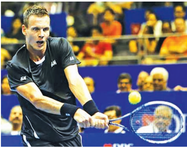
Singapore Slammers' Tomas Berdych of the Czech Republic hits a return to Manila Mavericks' Jo-Wilfried Tsonga of France during their men's singles match at the International Premier Tennis League (IPTL) in Singapore on 2 Dec, 2014.

SINGAPORE, 4 Dec — The Singapore Slammers took their first International Premier Tennis League (IPTL) victory at the fifth time of asking when Tomas Berdych led the home side to a thrilling 24-23 victory over the previously unbeaten Indian Aces on Wednesday.