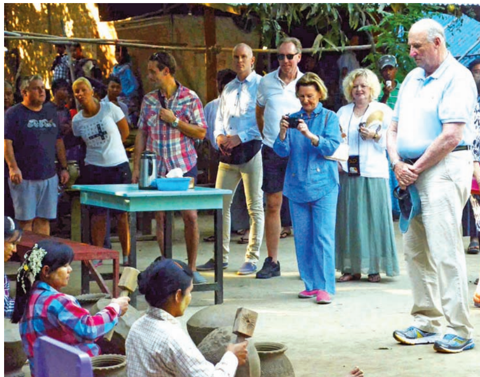
His Majesty King Harald V and Her Majesty Queen Sonja of Norway view production process of pottery in Yandabo Village, Myingyan District.