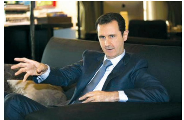
Syria's President Bashar al-Assad speaks during an interview with French magazine Paris Match, in Damascus, in this handout released by Syria's national news agency SANA on 4 Dec, 2014.

es had not used chemical weapons because they had more efficient arms to fight "terrorists." Rebel groups,