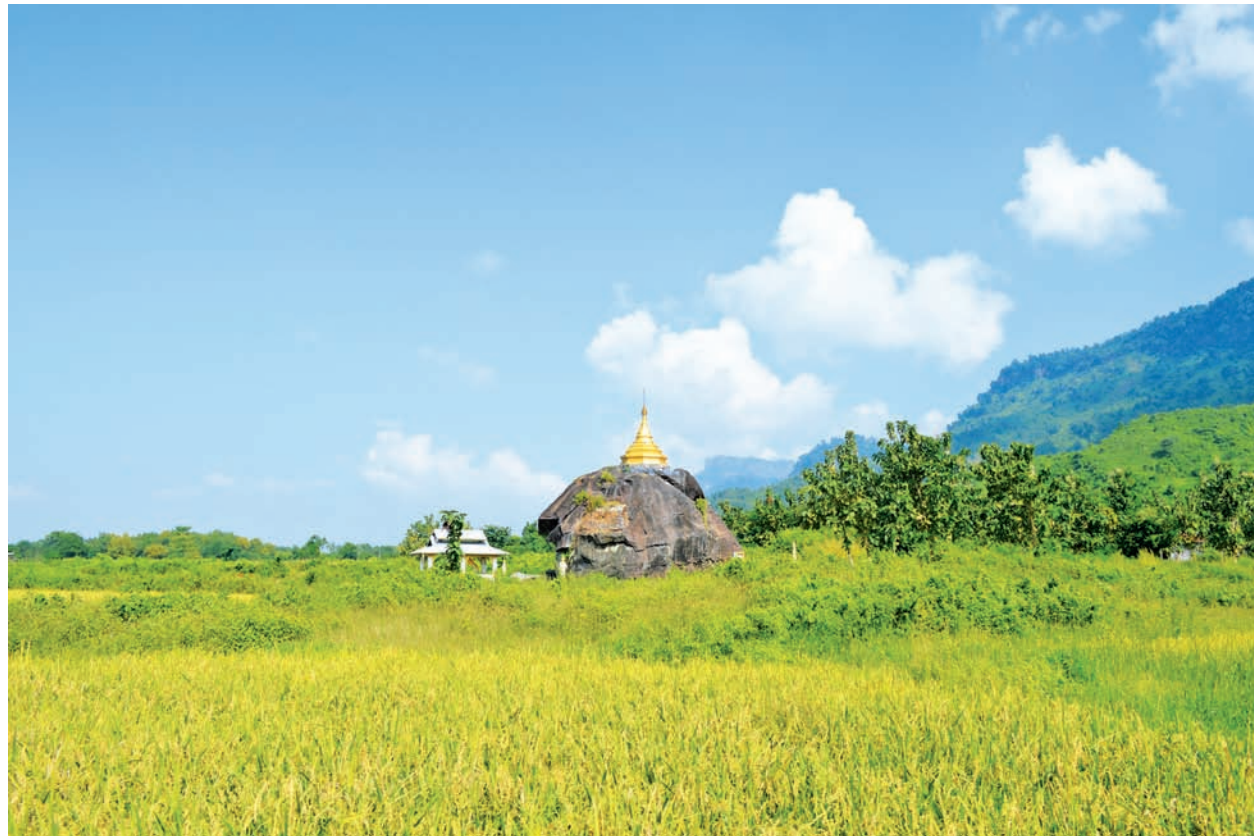
A stupa built on a stone in Myanmar offers breathtaking beautiful scenery to globetrotters seeking ecotourism thrills.

With a 43 percent rise on 1,121,795 who entered the country during