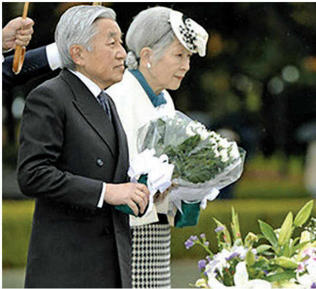
Japan's Emperor Akihito and Empress Michiko offer flowers in front of a cenotaph for atomic-bomb victims at the Peace Memorial Park in Hiroshima, western Japan, on 4 Dec, 2014.

HIROSHIMA, 4 Dec — Emperor Akihito and Empress Michiko on Thursday visited Peace Memorial Park in Hiroshima and laid flowers at the cenotaph for atomic-bomb victims.