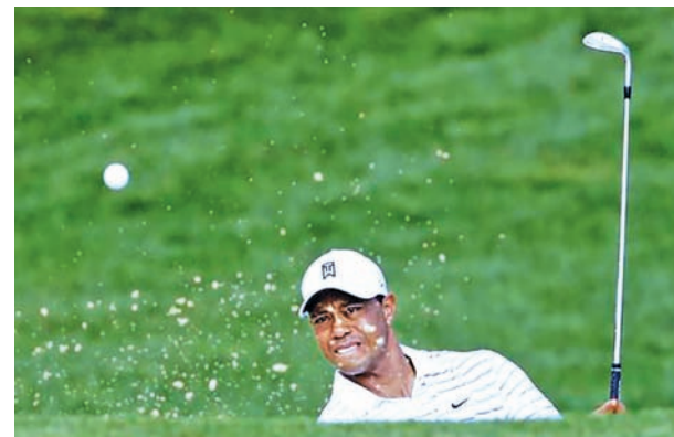
Tiger Woods of the US hits from a sand trap on the 12 th hole during the second round of the PGA Championship at Valhalla Golf Club in Louisville, Kentucky on 8 Aug, 2014.

"Watched the first two, three, four balls and then it hit me — 'Oh, wait a minute, he hasn't played in a while. It looked like he was just kind of riding