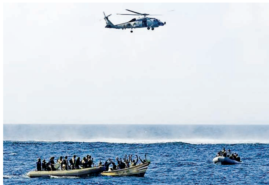
Visit, board, search and seizure (VBSS) team members from the guided-missile cruiser USS Vella Gulf (CG 72) close in on rigid-hulled inflatable boats to apprehend suspected pirates in Gulf of Aden in the Arabian Sea, in this 12 Feb, 2009 file photo.