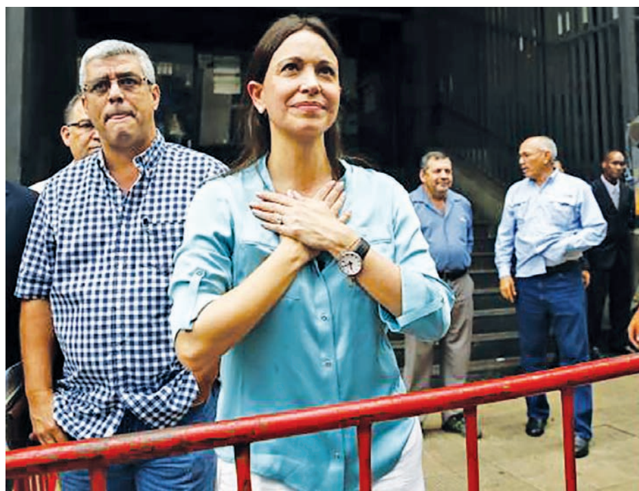
Venezuela's opposition leader Maria Corina Machado arrives to state prosecutor office in Caracas on 3 Dec, 2014.

The opposition's radical wing praises the fiery Machado, 47, for standing up to what they consider a dictatorship. But she is loathed by many government supporters, who see her as an out-of-touch aristocrat intent on toppling the government.—Reuters