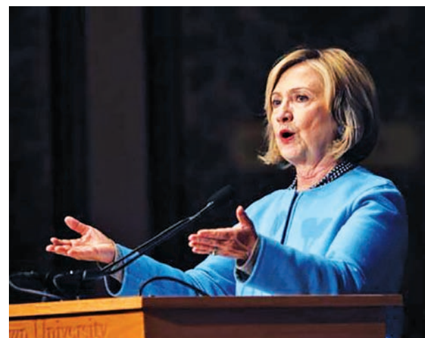
Former US Secretary of State Hillary Clinton speaks on "Smart Power: Security Through Inclusive Leadership" at Georgetown University in Washington on 3 Dec, 2014.

WASHINGTON, 4 Dec — US President Barack Obama met Hillary Clinton, his former secretary of state, on Wednesday but the White House declined to say whether they discussed her possible presidential candidacy in 2016.