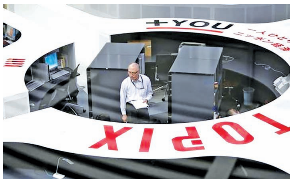
Tokyo Stock Exchange (TSE) staff members work at the bourse at TSE in Tokyo on 16 Oct, 2014.

"The prospect of a sovereign bond buying