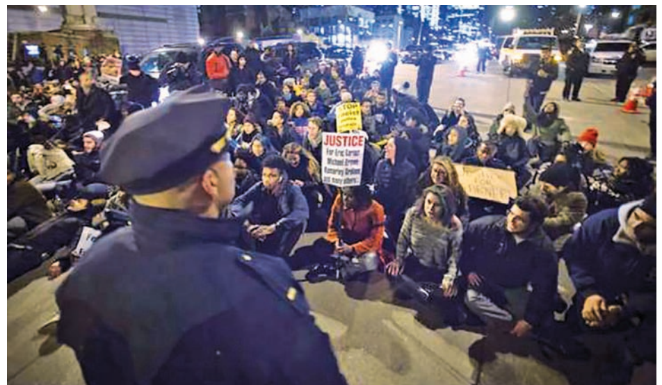
People sit and block the Lincoln Tunnel as they protest against the grand jury decision to not indict the police officer in the death of Eric Garner, in the Manhattan neighbourhood of New York on 3 Dec, 2014.

About a thousand people packed into the ornate main hall of Grand Central Terminal for a noisy but peaceful protest.