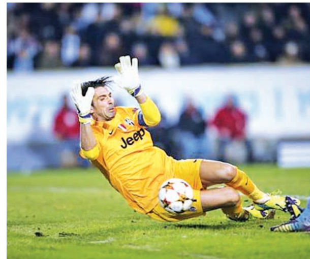
Juventus goalkeeper Gianluigi Buffon makes a save against Malmo during their Champions League Group A soccer match in Malmo on 26 Nov, 2014.

ZURICH, 4 Dec — The FIFA Ballon D'Or award has become a painful reminder of the sorry state Italian football, Juventus and Italy goalkeeper Gianluigi Buffon said on Wednesday. Italy has not had a player on the final shortlist of three since Fabio Cannavaro was voted World Player of the Year in 2006.