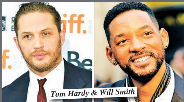
Tom Hardy & Will Smith