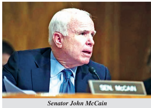
Senator John McCain

Some are also offering protection in areas where piracy has increased such as West Africa, with 23 attacks recorded up to September this year, and Asia, where almost 100 attacks were reported in the waters off Singapore, Indonesia and Malaysia.— Reuters