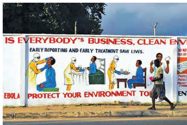
A man walks by a mural with health instructions on treating the Ebola virus, in Monrovia on 18 Nov, 2014.