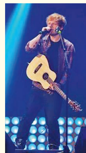
Singer Ed Sheeran

Spotify, which provides free on-demand music, or ad-free tunes for paying customers, has been in the spotlight in recent months after million-selling American singer Taylor Swift pulled her entire catalogue from the service.—Reuters