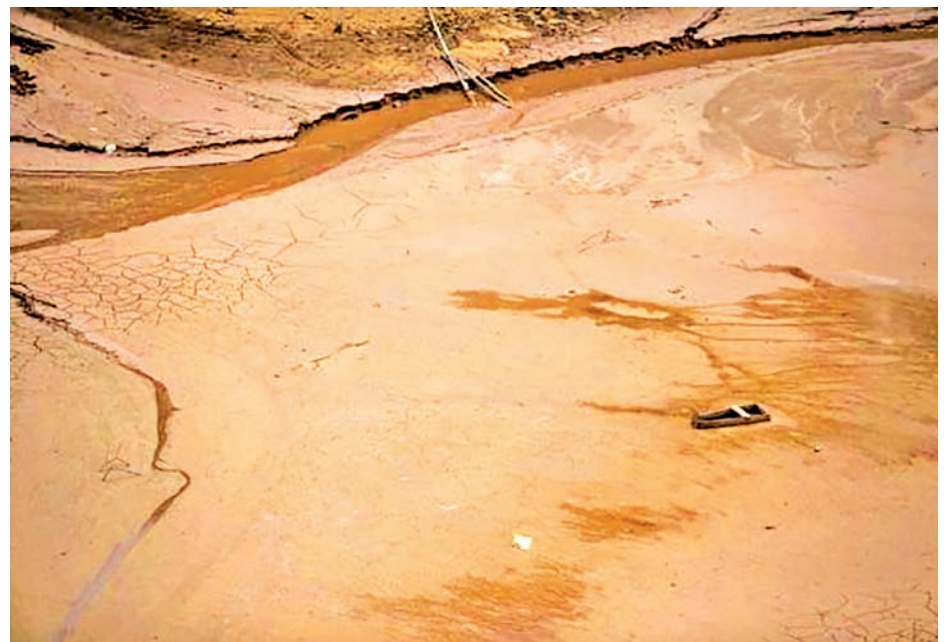
A boat sits on the nearly dry lake bed behind the Nazare Paulista dam, part of the Cantareira water system that provides greater Sao Paulo with most of its water, in Nazare Paulista on 25 Sept, 2014.

"The urgency is actually to get, ... hopefully within this decade, to the turning point" to start cutting emissions, she said. The Lima talks are working on a deal to limit climate change, due to be agreed in Paris in a year's time. — Reuters