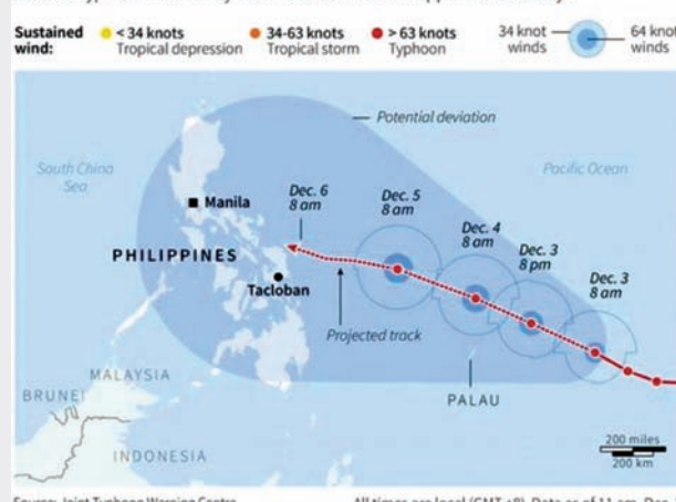
Map showing the projected and potential path of Typhoon Hagupit which is currently heading towards the Philippines.

Tacloban city, the worst-hit town by super typhoon Haiyan last year, is bracing for another typhoon which may make landfall in the Philippines on Sunday.