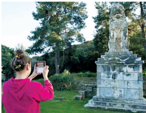
A girl takes a picture of a marble lion statue located near the site of an archaeological excavation, at the town of Amphipolis, in northern Greece on 22 Nov, 2014.