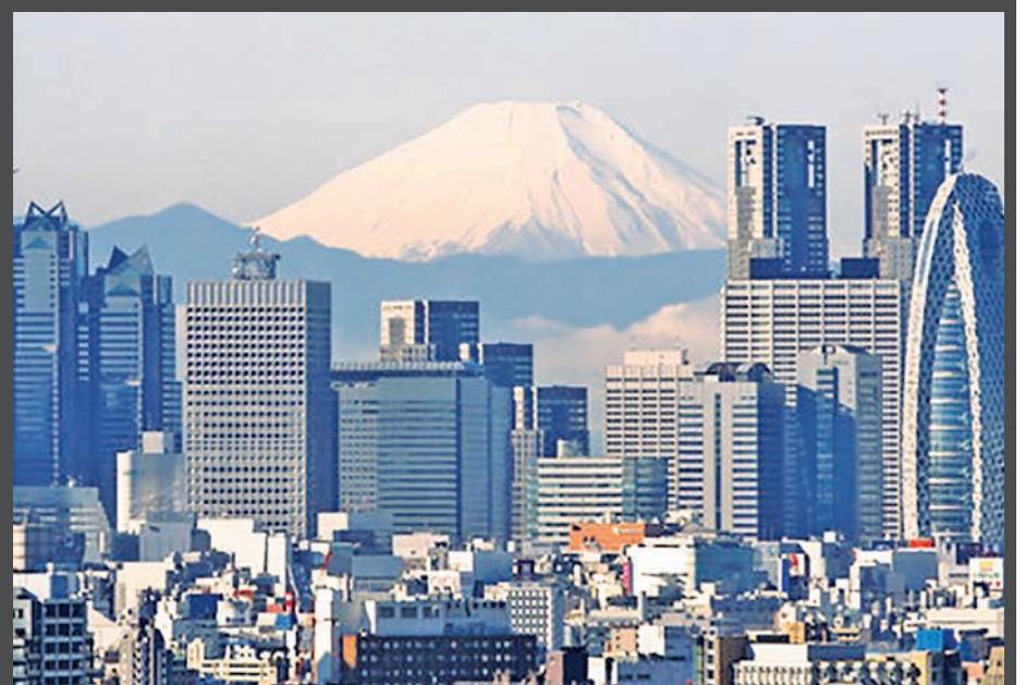
Photo taken from Bunkyo Ward in central Tokyo shows Mt Fuji, Japan’s tallest mountain, covered with a layer of snow, seen in the back of skyscrapers towering over Tokyo’s Shinjuku district in the morning on 27 Nov, 2014.