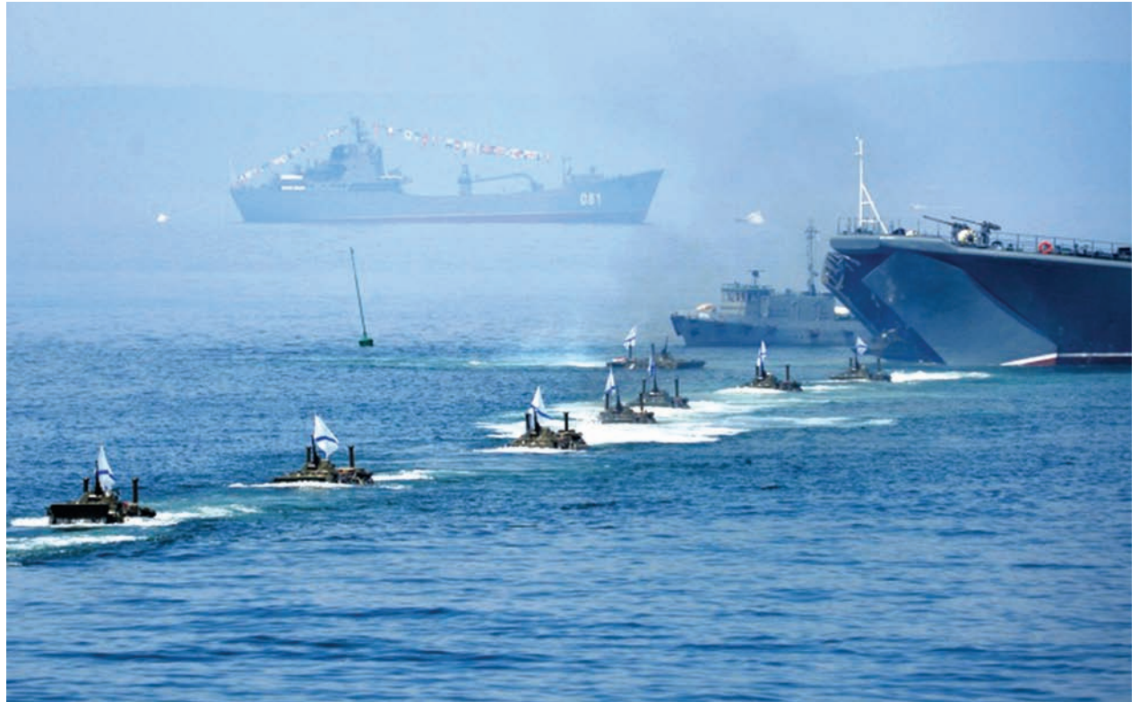
The Russian Marines mark the 309 th anniversary on 27 Nov, 2014.