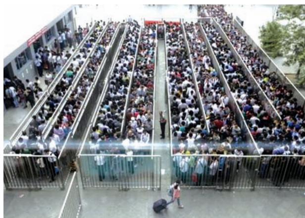
Passengers, seen through glass, line up and wait for a security check during morning rush hour at Tiantongyuan North Station in Beijing on 27 May, 2014.

2. Tender documents are available at our office starting from 24.11.2014 during office hours and for further detail please contact: Deputy General Manager Supply Department, Myanma Railways, Corner of Theinbyu Street Merchant Street, Botahtaung, Yangon, Phone: 95-1-291985, 291994.