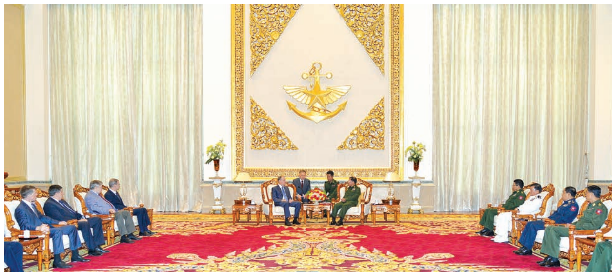
Senior General Min Aung Hlaing receives Mr Nikolay P Patrushev, Secretary of Security Council of the Russian Federation.