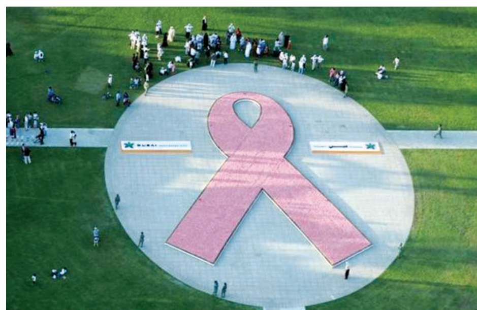
The world's largest awareness ribbon made of flowers is seen from above during the UAE leg of the Avon Walk around the world for Breast Cancer Awareness walkathon in Zaabeel park in Dubai on 16 Nov, 2007.