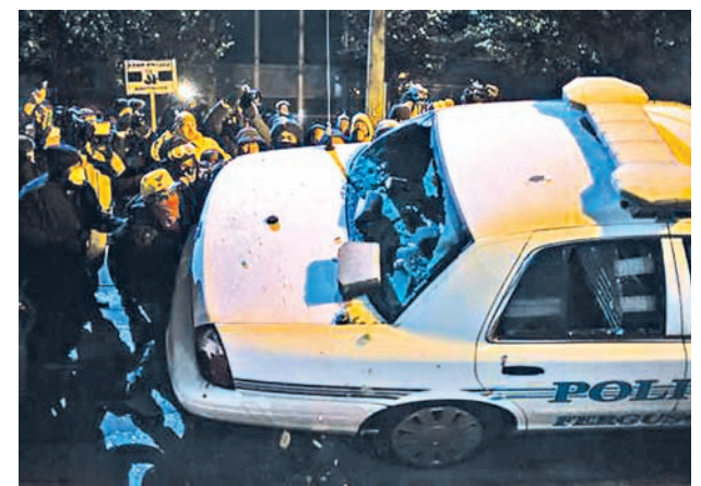
Protestors damage and flip a police vehicle parked outside of City Hall in Ferguson on 25 Nov, 2014.

simmered for decades, with many blacks feeling the US legal system and law enforcement authorities do not treat them fairly.