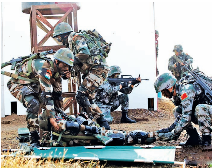
China and India hold anti-terror military drill in India on 24 Nov, 2014.