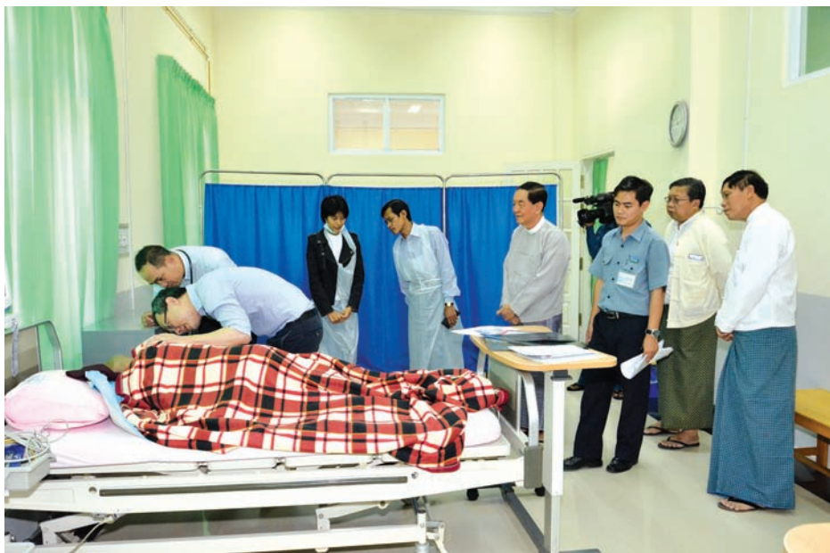
Union Minister U Thein Nyunt views medical treatment being given by specialists to patient at Zabuthiri Special Hospital in Nay Pyi Taw.