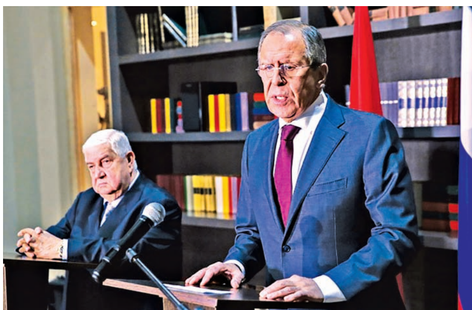
Sergey Lavrov (right) and Walid Muallem.

An international peace conference on Syria, dubbed Geneva-2, organized by Russia and the United States and designed to negotiate a solution to the Syrian crisis, kicked off on 22 January in Montreux, Switzerland. Its first two rounds in January and February 2014 brought no particular progress. The