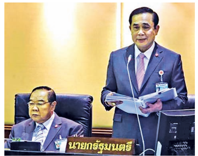
Thailand’s Prime Minister Prayuth Chan-ocha (R) reads out his government’s policy, as Deputy Prime Minister and Defence Minister Prawit Wongsuwan listens, at the Parliament in Bangkok on 12 Sept, 2014.—REUTERS

“Six months after the coup, criticism is systematically prosecuted, political activity is banned, media is censored, and dissidents are tried in military courts,” it said.—Reuters