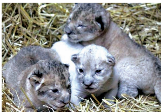
A rare white lion cub (C) is seen in a handout picture released by the Omaha Henry Doorly Zoo and Aquarium in Omaha, Nebraska, on 26 Nov, 2014.

“These weren’t intentionally bred to produce a white lion - it’s just that