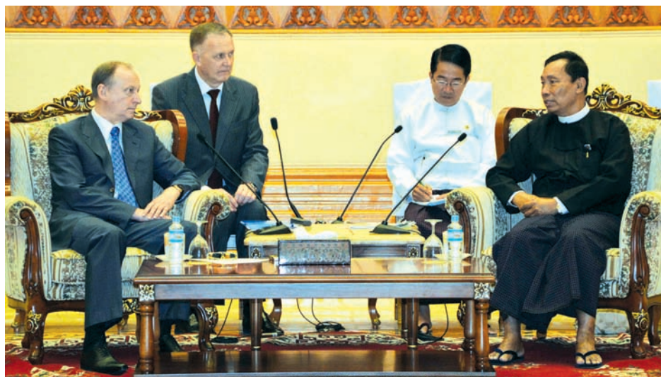
Speaker Thura U Shwe Mann holds talks with Secretary of the Security Council of the Russian Federation Mr Nikolay P Patrushev.

NAY PYI TAW, 27 Nov—The Speaker of the Pyidaungsu Hluttaw and the Pyithu Hluttaw Thura U Shwe Mann received the delegation led by Secretary of the Security Council of the Russian Federation Mr Nikolay P Patrushev at the Hluttaw Building in Nay Pyi Taw on Thursday.