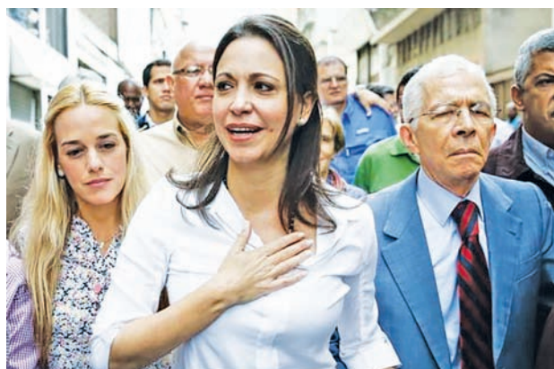
Venezuela’s opposition leader Maria Corina Machado (C) gestures next to Lilian Tintori (L), wife of jailed opposition leader Leopoldo Lopez, as Machado arrives under a subpoena at a court in Caracas on 16 June, 2014.

CARACAS, 27 Nov — Venezuelan opposition leader Maria Corina Machado will be charged next