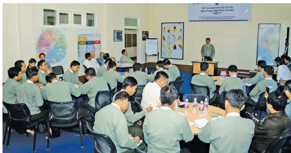
UEC Chairman U Tin Aye speaking at workshop with discussions about data collection on possible risks.—MNA

In the evening, the delegation attended a dinner hosted by the judges at a Myat Taw Win Hotel here.—MNA