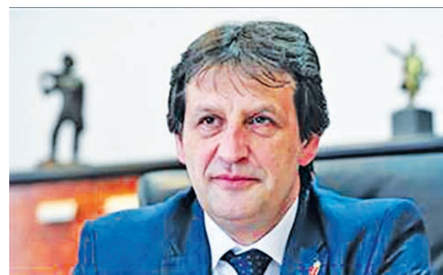
Serbia’s Defence Minister Bratislav Gasic.

BELGRADE, 27 Nov — Serbia’s Defence Minister Bratislav Gasic and Chief of the Hungarian Armed Forces General Staff General Tibor Benko underscored in Belgrade on Wednesday that the regional military cooperation is a significant factor of stability and prosperity in this part of Europe.