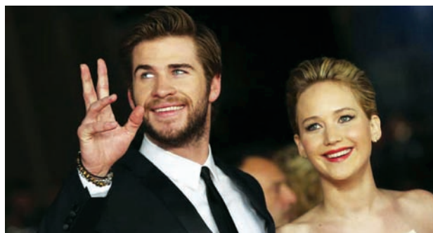
Jennifer Lawrence on Liam Hemsworth: He's the most wonderful, lovable, family-oriented, sweet, hilarious, amazing guy.

LONDON, 27 Nov — friend as he encourages her to stand up for herself. The Oscar-winning actress Jennifer Lawrence says she is glad to have actor Liam Hemsworth as her best