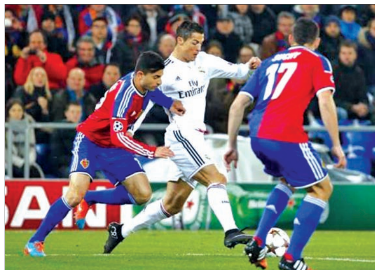
FC Basel's Behrang Safari (L) fights for the ball with Real Madrid's Cristiano Ronaldo during their Champions League Group B soccer match at St Jakob-Park stadium in Basel on 26 Nov, 2014.

Real were always dangerous though and Gareth Bale fired against the underside of the crossbar before a Ronaldo shot grazed the post.—Reuters