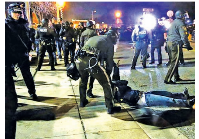
A protester is dragged across the street as he is arrested in front of the Ferguson Police Department on 25 Nov, 2014.

Tensions between police and black Americans have