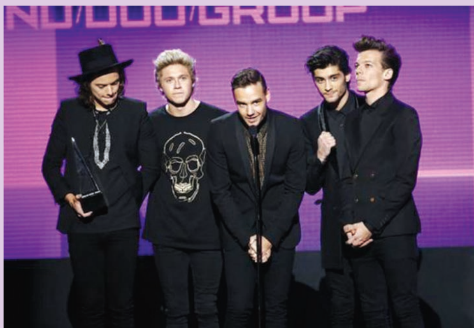
One Direction accepts the award for favourite pop/rock band duo or group during the 42 nd American Music Awards in Los Angeles, California on 23 Nov, 2014.