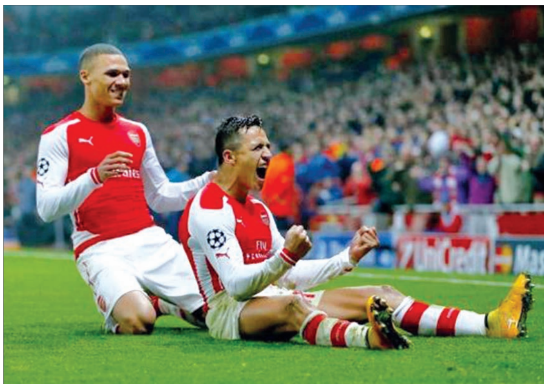
Arsenal's Alexis Sanchez celebrates with his team mate Kieran Gibbs (L) after scoring a goal against Borussia Dortmund during their Champions League group D soccer match in London on 26 Nov, 2014.

LONDON, 27 Nov — Arsenal held their nerve, their lead and their record of reaching the Champions League knockout stages when they beat Borussia Dortmund 2-0 on Wednesday to