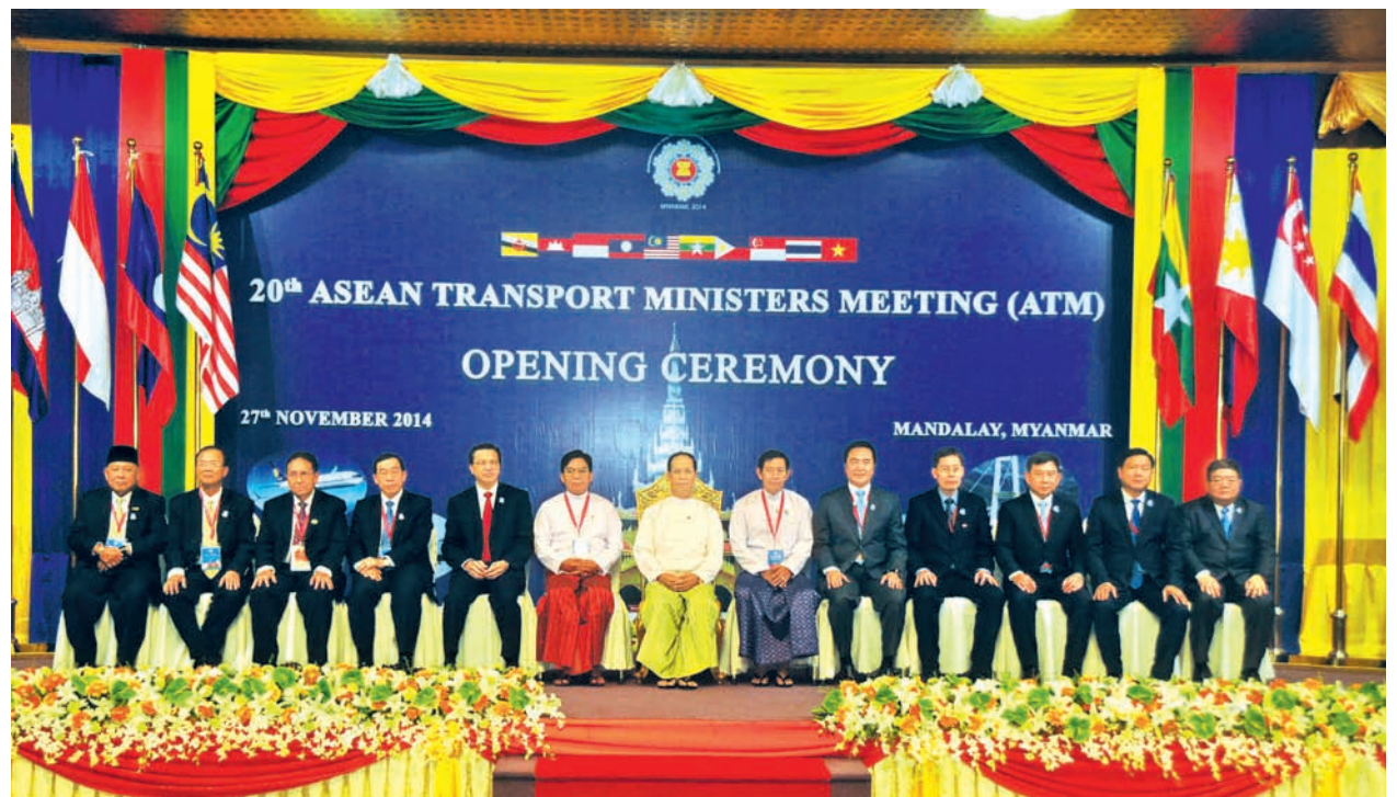
Vice President Dr Sai Mauk Kham poses for documentary photo with ASEAN Transport Ministers at the opening ceremony of 20 th ASEAN Transport Ministers Meeting in Mandalay.

We would like to welcome the progress, made in the implementation of the Roadmap for the ASEAN Community. The roadmap provides blueprints for ASEAN's three pillars as mentioned. The Political-Security blueprint emphasizes—sharing re-