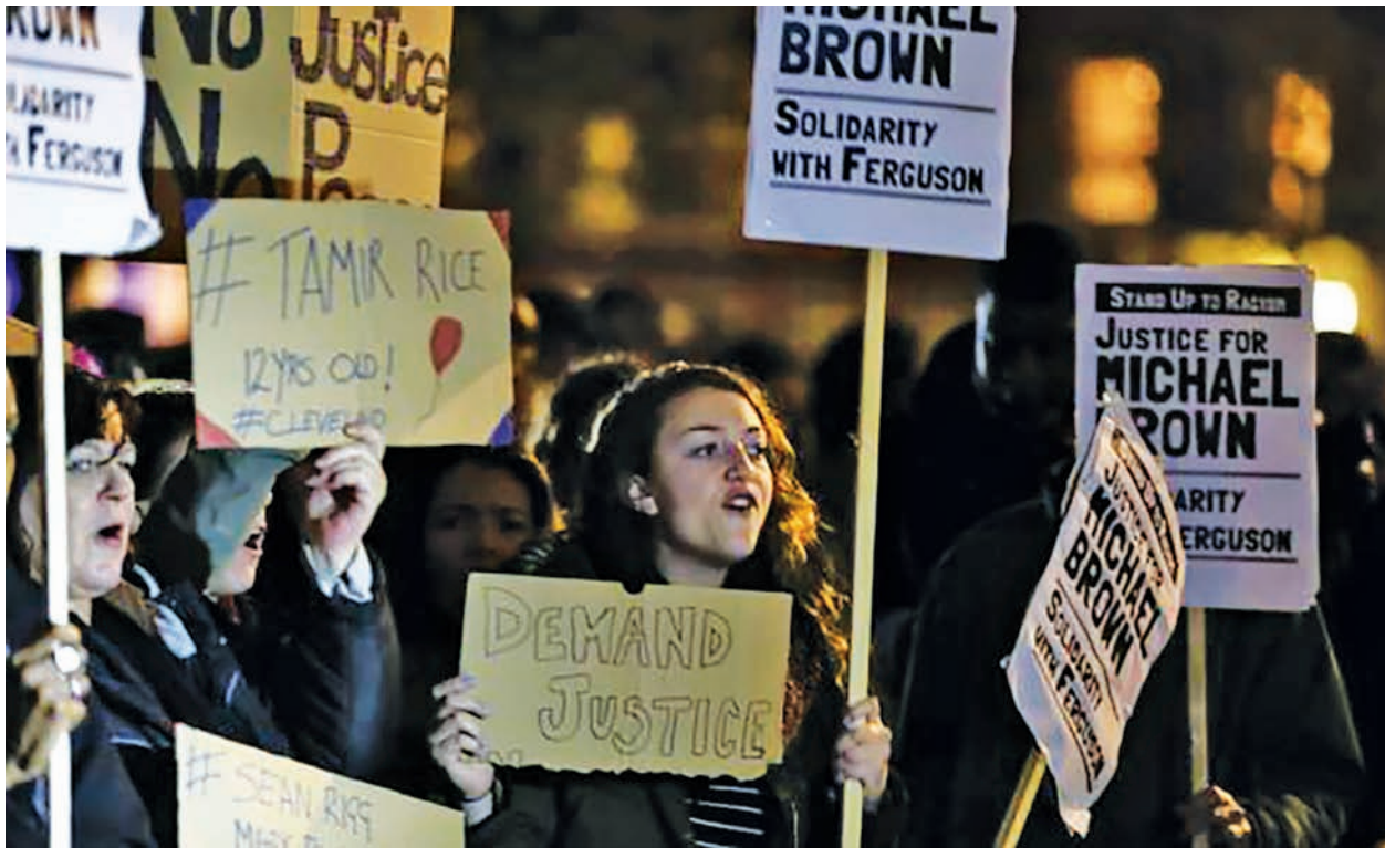
Demonstrators take part in a protest to show solidarity with the family of black teenager Michael Brown, outside the American Embassy in London on 26 Nov, 2014.

FERGUSON, 27 Nov — The streets of Ferguson, Missouri, were mostly quiet on Wednesday after two nights of racially charged unrest following a US grand jury decision to clear a white policeman over the killing of an unarmed black teenager.