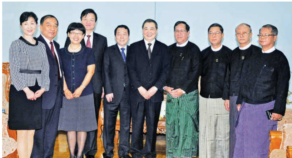
Chief Justice of the Union U Tun Tun Oo poses for photo with Chinese delegation from Supreme People's Court.

NAY PYI TAW, 27 Nov — A Chinese delegation from the Supreme People's Court of the People's Republic of China on Thursday met Chief Justice of the Union U Tun Tun Oo at the latter's office here to discuss future plans for cooperation in judiciary sector.