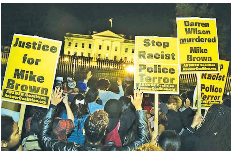
Protesters demonstrate after the decision by a Missouri grand jury not to indict a Ferguson white police officer in the fatal shooting of unarmed black teenager Michael Brown, in front of the White House in Washington on 24 Nov, 2014.