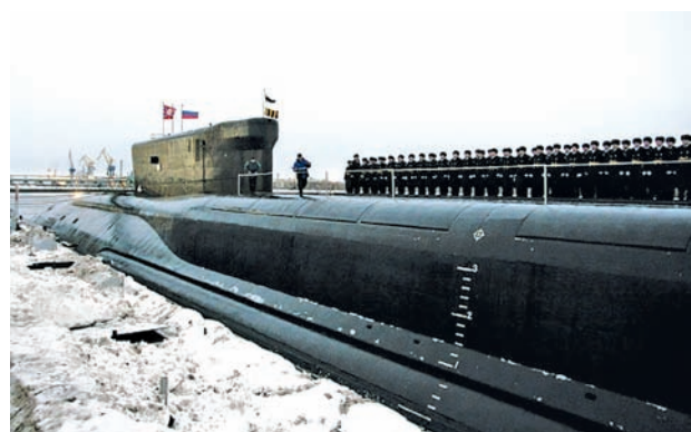
The Alexander Nevsky submarine

After an abortive test-firing in September 2013, Russian Defence Minister Sergey Shoigu ordered to make at least five additional test launches of Bulava.— Itar-Tass