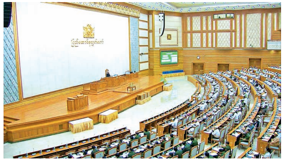
Pyidaungsu Hluttaw representatives focus on amendment of constitution on Tuesday's session.