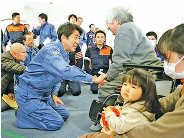
Prime Minister Shinzo Abe talks with people who have evacuated to a shelter in the village of Hakuba, central Japan on 24 Nov, 2014. The village and its surrounding area were hit by a magnitude-6.7 earthquake on 22 Nov that left 41 people injured and heavily damaged or destroyed 54 houses.