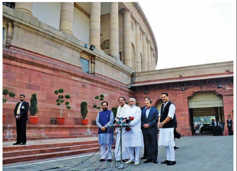
Indian Prime Minister Narendra Modi (C), flanked by his cabinet colleagues Mukhtar Abbas Naqvi (1st L), Venkaiah Naidu (2nd L), Rajiv Pratap Rudy (R) and India Minister of State Dr Jitendra Singh, talks to the press as they arrive on the opening day of winter session of Indian parliament in New Delhi, India on 24 Nov, 2014.