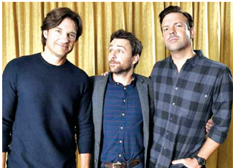
Cast members Jason Bateman (L), Charlie Day (C) and Jason Sudeikis of the film “Horrible Bosses 2” pose for a portrait during a photo call in Beverly Hills, California on 10 Nov, 2014.

LOS ANGELES, 25 Nov — After an unsuccessful attempt to murder their “Horrible Bosses” in the 2011 hit comedy, goofball buddies Nick, Kurt and Dale reunite in a sequel deciding to go into business for themselves and elimi-