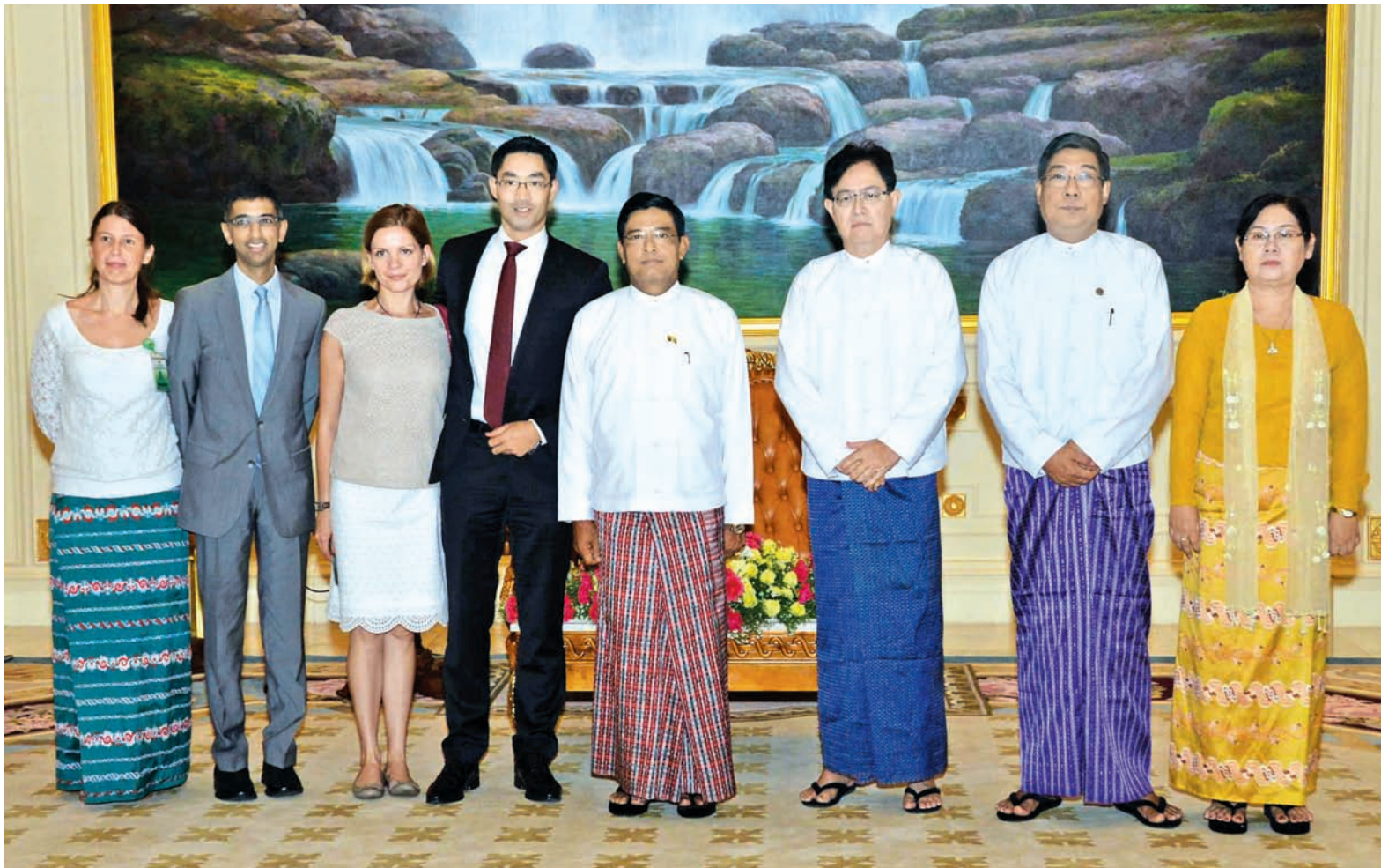
Vice President U Nyan Tun poses for documentary photo with Executive Director Philipp Rösler of the World Economic Forum and party.

NAY PYI TAW, 25 Nov—Vice President U Nyan Tun received Executive Director Philipp Rösler of the World Economic Forum and party at Credentials Hall of the Presidential Palace