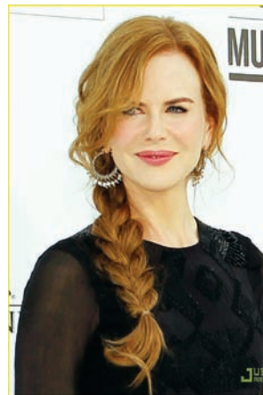
Nicole Kidman: I was the kid that loved the wicked witch in The Wizard Of Oz.

LOS ANGELES, 25 Nov — Oscar-winning actress Nicole Kidman, who stars as a villain in the new Paddington Bear film, says she is happy to play “the bad girl”. The 47-year-old Australian actress said she loved the witch in 1993 American musical fantasy film “The Wizard Of Oz”, reported Sky News.