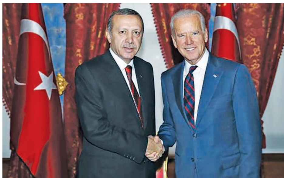
US Vice President Joe Biden (R) shakes hands with Turkey's President Tayyip Erdogan during their meeting at Beylerbeyi Palace in Istanbul on 22 Nov, 2014.

Turkish soldiers have also already trained some 230 Kurdish peshmerga fighters in northern Iraq and will give similar assistance to a new national army unit in Baghdad in support of the government's struggle