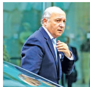
French Foreign Minister Laurent Fabius arrives for a meeting in Vienna on 21 Nov, 2014.

"On limiting (Iran's capacity to enrich), I found that there had been a certain movement," Laurent Fabius told France Inter radio.— Reuters