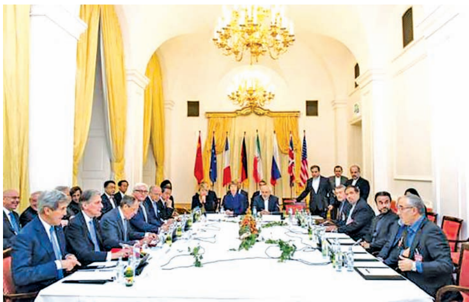
Delegations of US Secretary of State John Kerry, Britain's Foreign Secretary Philip Hammond, Russian Foreign Minister Sergei Lavrov, Iranian Foreign Minister Javad Zarif, German Foreign Minister Frank-Walter Steinmeier, French Foreign Minister Laurent Fabius, EU High Representative Catherine Ashton, Chinese Foreign Minister Wang Yi sit around the negotiations table during their meeting in Vienna on 24 Nov, 2014.

The talks, designed to keep Iran from obtaining nuclear weapons, are apparently deadlocked over when Western powers