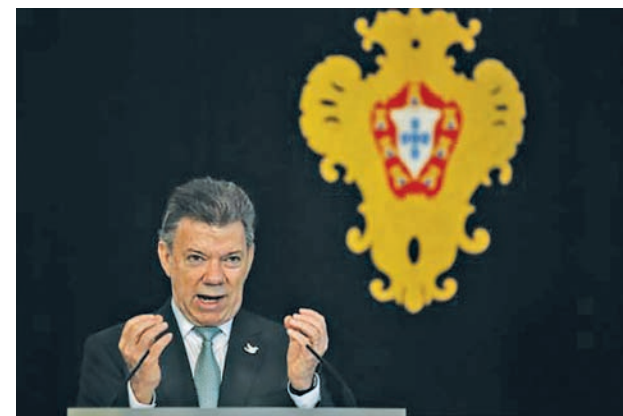
Colombia's President Juan Manuel Santos