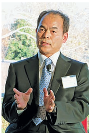
Shuji Nakamura, professor at the University of California, Santa Barbara, delivers a lecture at the Embassy of Sweden in Washington on 24 Nov, 2014.

CAIRO, 25 Nov — An eight-floor residential building collapsed overnight in Cairo, killing at least 10 people and injuring seven others, security sources said on Tuesday.