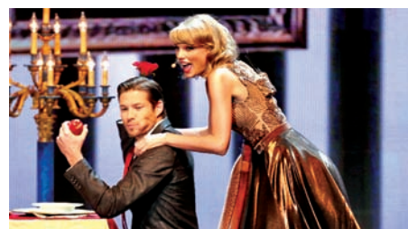
Towards the end of the performance Taylor Swift ripped the frock off to show a mini dress.

LONDON, 25 Nov — Singer Taylor Swift pulled her dress up while performing her new single at the 2014 American Music Awards.