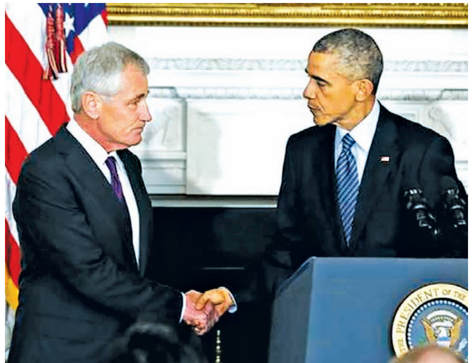
US President Barack Obama (R) greets Defense Secretary Chuck Hagel after announcing Hagel's resignation at the White House in Washington, on 24 Nov, 2014.

WASHINGTON, 25 Nov — US President Barack Obama said on Monday that Defence Secretary Chuck Hagel will be stepping down, a development that apparently came as a surprise to defence officials in Japan who see the United States as Tokyo's closest security ally.