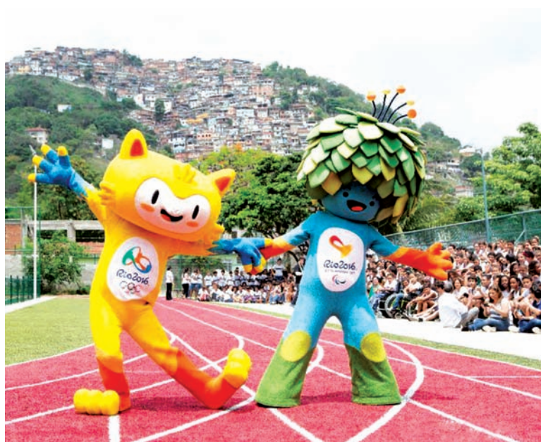
Photo taken on 24 Nov, 2014 shows the mascot of Rio 2016 Olympic Games (L) and Paralympic Games in Rio de Janeiro, Brazil. The unveiling ceremony of the mascots was held here on Monday.

"I can't wait to come to the beautiful city of Sydney for this very special match against my old friend and rival, Lleyton Hewitt," Federer said in a statement on Tennis Australia's website (tennis.com.au) about the 12 January exhibition. "We've had some amazing battles over the years and I think we still bring out the best in each other every time we play."—Reuters