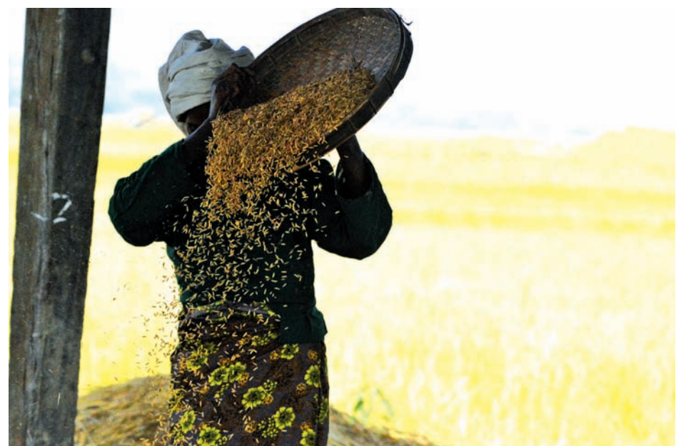
Photo shows a woman winnowing in a field in Myanmar, where rice is the main farm income source, providing livelihoods for over 50% of the population. The World Bank says rice price volatility in Myanmar is the highest among net rice exporting countries in Asia, preventing Myanmar's rice farmers from earning high profits and keeping many families at or close to poverty income levels.

erty Reduction", pointing out that rice price volatility (See page 2)