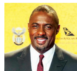
If Elba’s name is finalised, he will step in the role of Apocalypse.—PTI

had earlier cropped up but the actor is apparently no longer in the race. If Elba’s name is finalised, he will step in the role of Apocalypse, an ancient and immortal mutant. ‘X-Men: Apocalypse’ will be released in summer 2016.