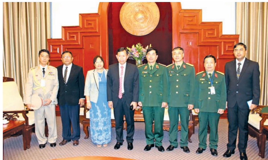
Vice-Senior General Soe Win and party with Vietnamese senior military officers.

NAY PYI TAW, 25 Nov—A delegation led by Deputy Commander-in-Chief of Defence Services Commander-in-Chief (Army) Vice-Senior General Soe Win arrived at Noi Bai Airport in Hanoi, Vietnam, on Monday to attend the 15 th ASEAN Chiefs of