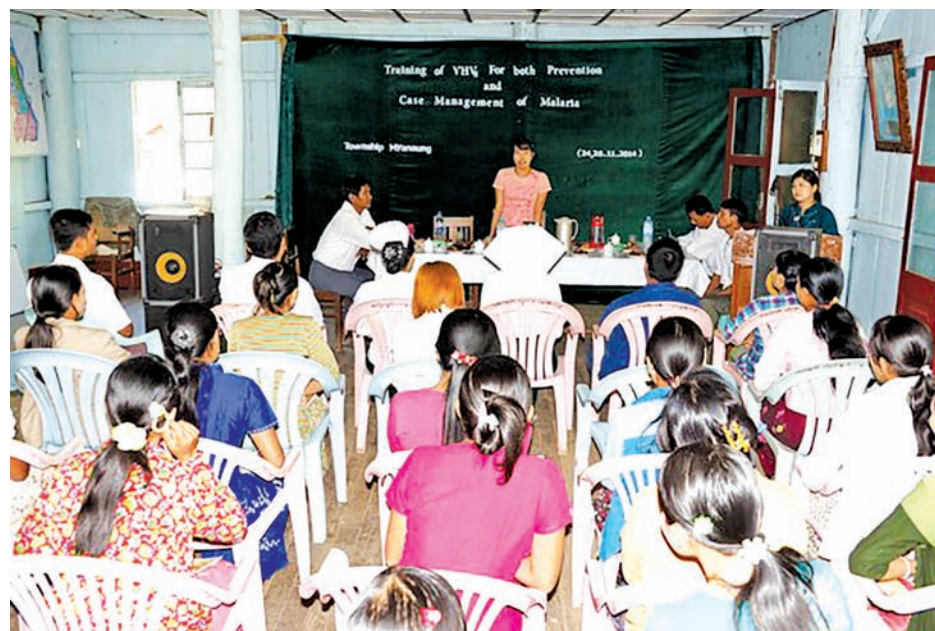
An official explains control of malaria disease for volunteers of villages in Myanaung Township.