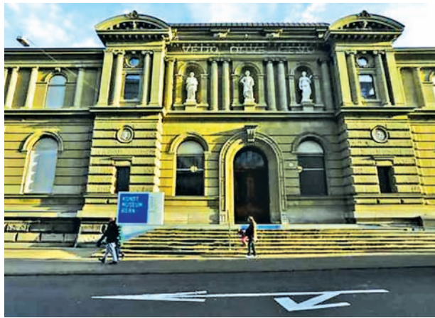
The facade of the Bern Art Museum is seen in the Swiss capital of Bern on 24 Nov, 2014.

A government task force has identified three pieces indisputably taken by the Nazis which would