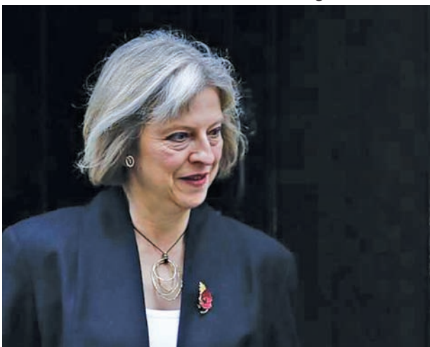
Britain's Home Secretary Theresa May

LONDON, 25 Nov — Britain is facing the biggest terrorism threat in its history and has foiled around 40 major plots since suicide bombers attacked London in 2005, Home Secretary Theresa May said on Monday. The government would on Wednesday set out new laws to take on the militants, May added, including legislation making it easier for security services to track attackers online, and check if radicalised fighters were flying into Britain.