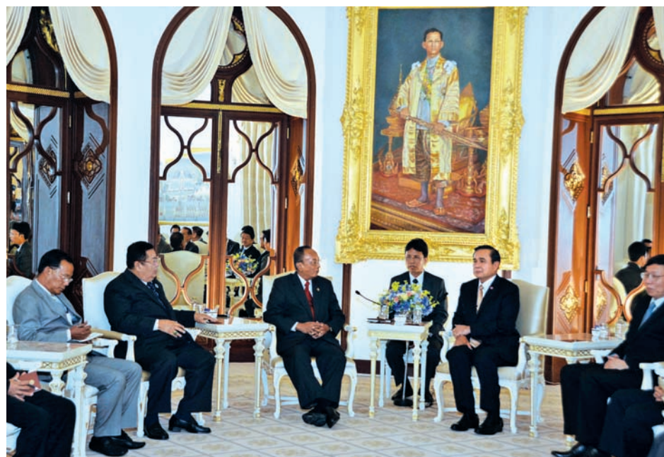
Amyotha Hluttaw Speaker U Khin Aung Myint meets Thai Prime Minister Prayut Chan-o-cha.

BANGKOK, 25 Nov—Speaker of the Amyotha Hluttaw U Khin Aung Myint, currently on a visit to Thailand at the invitation of Professor Pornpetch Wichitcholchai, president of the National Legislative Assembly, laid a wreath at the statue of King Rama II on 24 November, sources said.