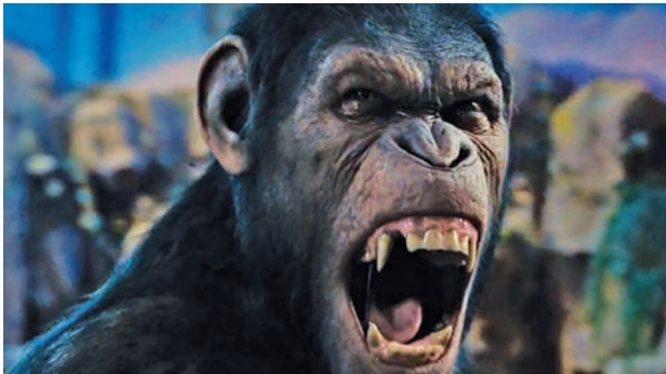
Andy Serkis: It might be three films. It could be four. It could be five. Who knows?

LOS ANGELES, 23 Nov — Hollywood actor Andy Serkis says the new 'Planet of the Apes' franchise may stretch to five movies. Serkis, 50, plays the Ape leader, Caesar, in the rebooted series, reported Ace Showbiz.