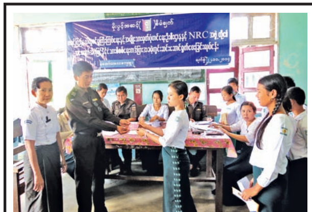
The Head of Myawady Township Immigration and National Registration Department issues citizenship scrutiny card to a student at Mehtawthale Village Basic Education Middle School in Myawady, Kayin State, with the assistance of NRC group on 22 November.