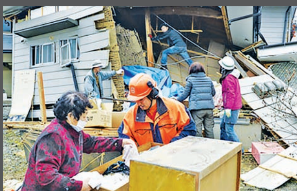
People carry out furniture from a collapsed house in the village of Hakuba, Nagano Prefecture, on 23 Nov, a day after a strong earthquake hit the prefecture and surrounding areas in central Japan. The magnitude-6.7 quake at 10:08 pm on 22 Nov injured at least 39 people.