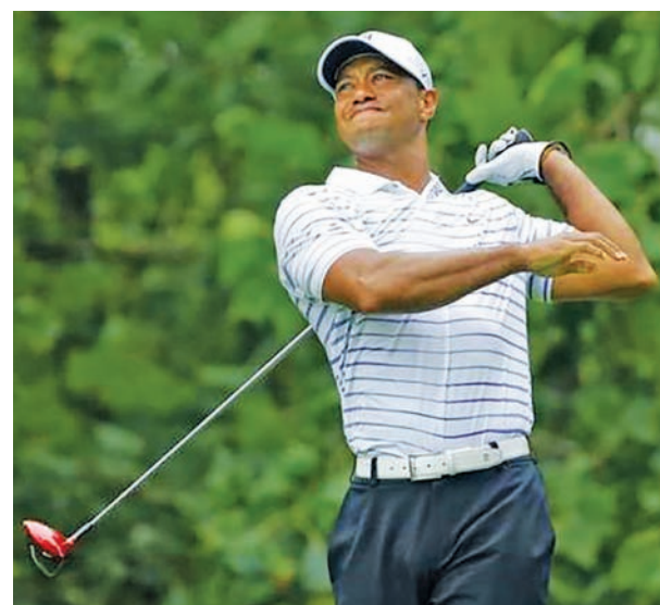
Tiger Woods of the US grimaces after hitting his tee shot on the seventh hole during the second round of the 2014 PGA Championship at Valhalla Golf Club in Louisville, Kentucky, on 8 Aug, 2014.