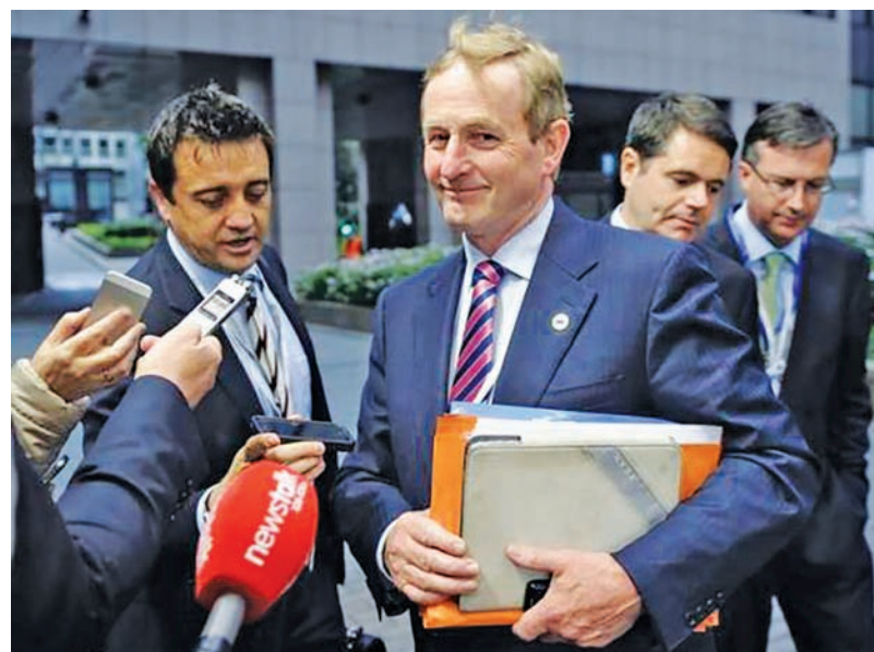
Ireland's Prime Minister Enda Kenny talks to the media as he arrives at an informal summit of European Union leaders in Brussels on 27 May, 2014.

The biggest beneficiaries of the protests have been left-wing Sinn Fein party which is the joint most popular party with 22