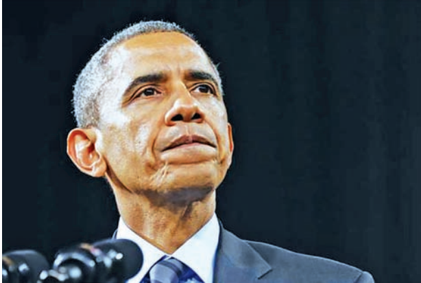
US President Barack Obama pauses while speaking about immigration reform during a visit to Del Sol High School in Las Vegas, Nevada on 21 Nov, 2014.