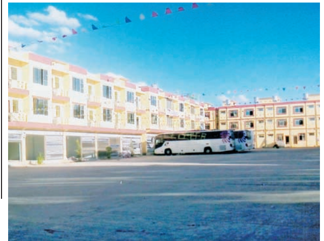
Highway bus terminal in Muse.

MUSE, 23 Nov — A bus terminal will help promote trade between Myanmar and China, enabling the government to earn more revenue and create business opportunities for locals.