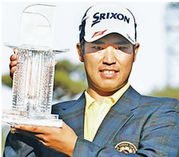
Hideki Matsuyama holds up the winner's trophy after his victory in the Dunlop Phoenix golf tournament at Phoenix Country Club in Miyazaki, southern Japan, on 23 Nov, 2014. Matsuyama won the tournament after a playoff with Hiroshi Iwata.