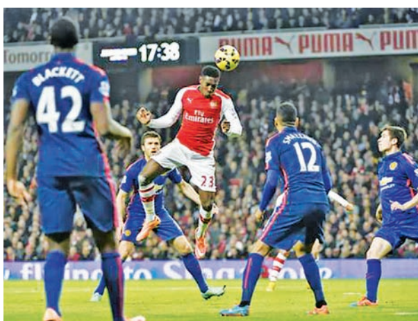
Arsenal's Danny Welbeck (C) heads the ball during their English Premier League soccer match against Manchester United at the Emirates Stadium in London on 22 Nov, 2014.

After seeing his team make it six league wins out