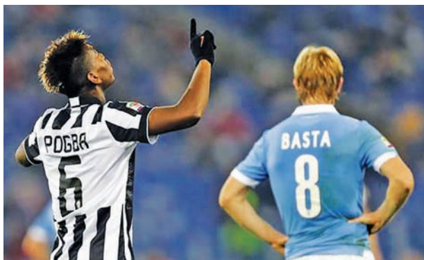
Juventus' Paul Pogba (L) celebrates after scoring his second goal against Lazio during their Italian Serie A soccer match at Olympic stadium in Rome on 22 Nov, 2014.

ROME, 23 Nov — Paul Pogba scored twice and Carlos Tevez was also on target as Serie A leaders Juventus romped to a 3-0 win at Lazio on Saturday.