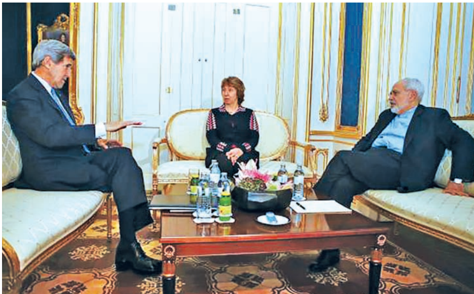
US Secretary of State John Kerry (L), Iranian Foreign Minister Javad Zarif (R) and EU envoy Catherine Ashton pose for photographers before a meeting in Vienna on 22 Nov, 2014.

VIENNA, 23 Nov — World powers and Iran struggled on Saturday to overcome crucial differences that are preventing them from ending a 12-