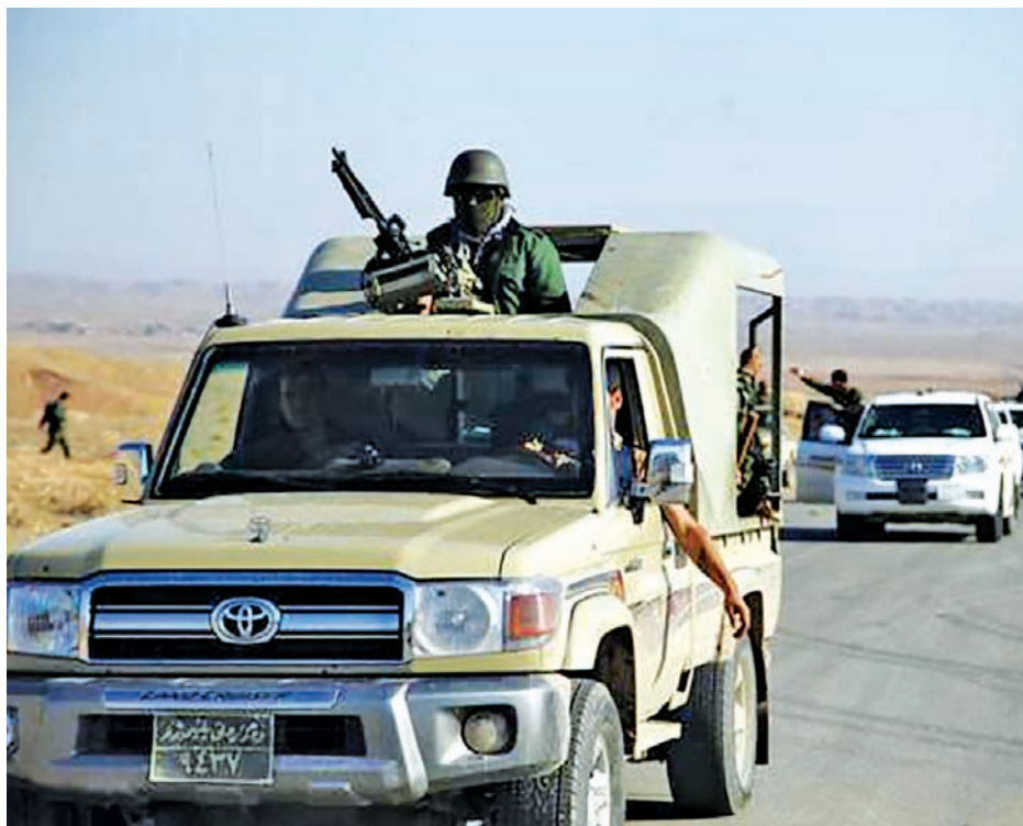
Members of the Kurdish security forces ride in vehicles during an intensive security deployment in Diyala Province north of Baghdad on 19 Nov, 2014. —REUTERS

A car bomb in the Shi’ite town of Yousufiya, 30 km (20 miles) southeast of Baghdad, killed five people on Sunday, police and medics said.—Reuters