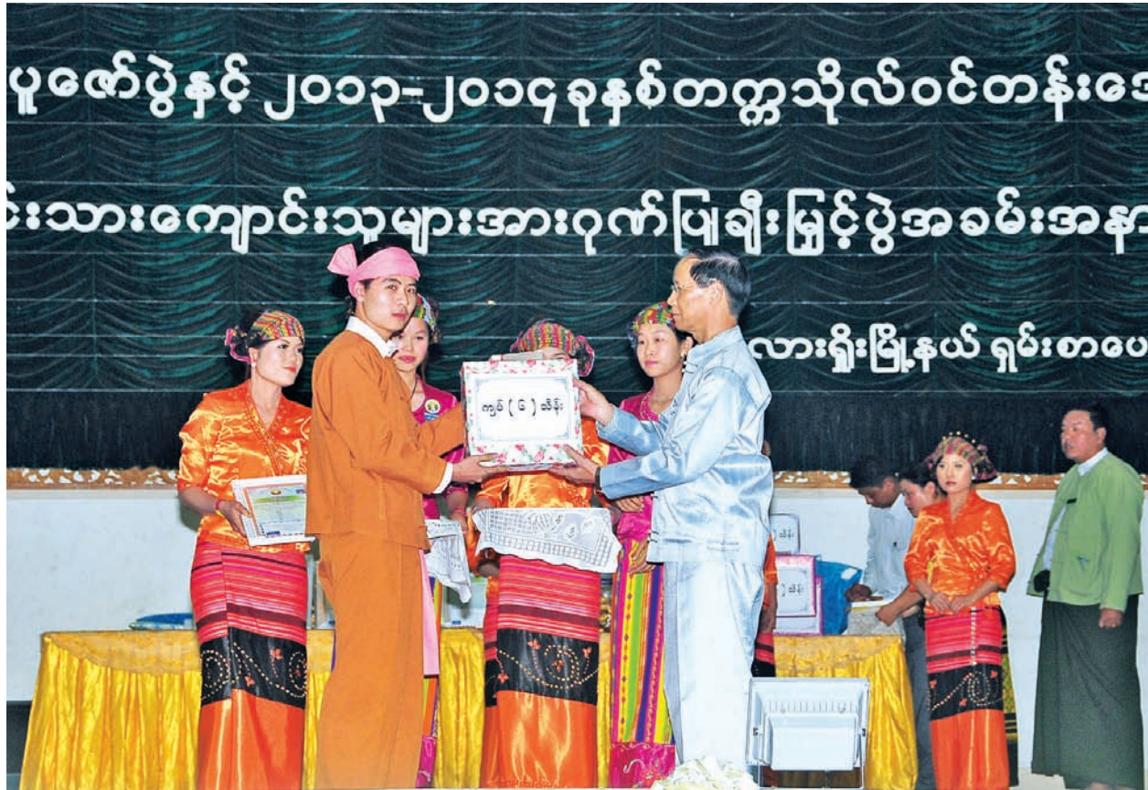
Vice President Dr Sai Mauk Kham presents K600,000 to an outstanding student at the ceremony to honour the students who passed matriculation examination in 2013-14 academic year in Lashio.