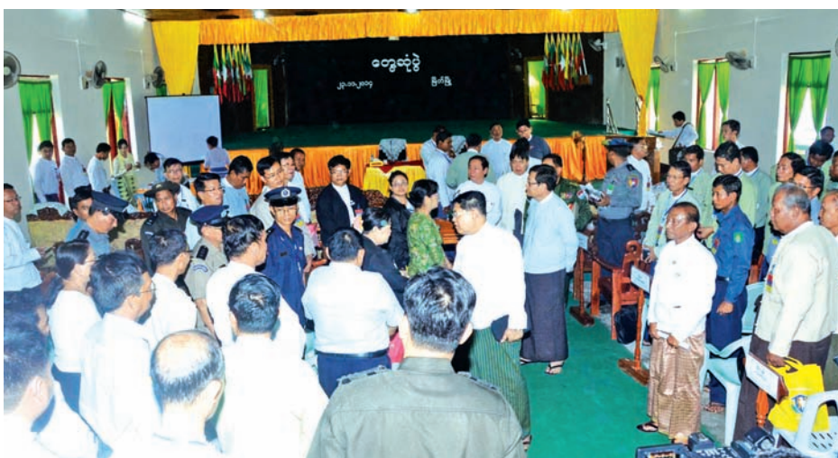
Union Ministers U Soe Thane and U Tin Naing Thein cordially converse with departmental officials and local people in Myeik.