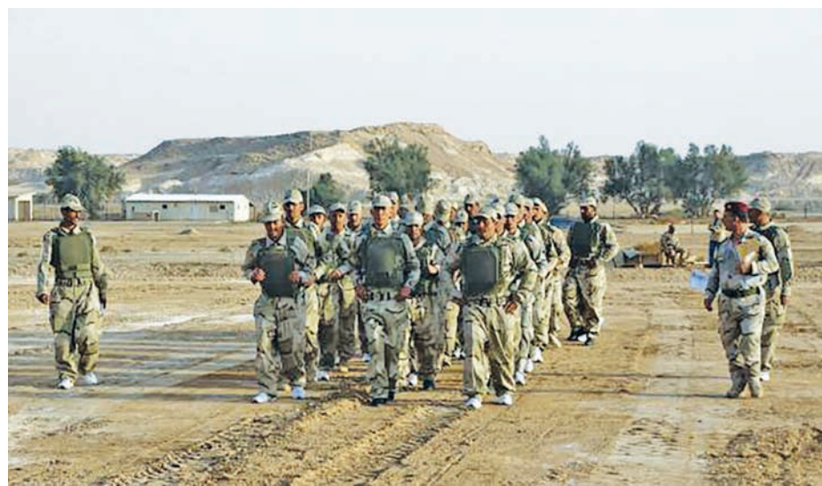
Tribal fighters take part in a military training to prepare for fighting against Islamic State militants, at the Ain al-Assad military base in Anbar province on 15 Nov, 2014.

It noted Iraqi security forces were not “not particularly welcome in Anbar and other majority Sunni areas,” citing their poor combat performance and