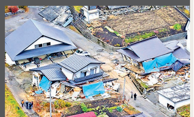
Aerial photo shows collapsed houses in the village of Hakuba, Nagano Prefecture, on 23 Nov, a day after a strong earthquake hit the prefecture and surrounding areas in central Japan. The magnitude-6.7 quake at 10:08 pm on 22 Nov injured at least 39 people.