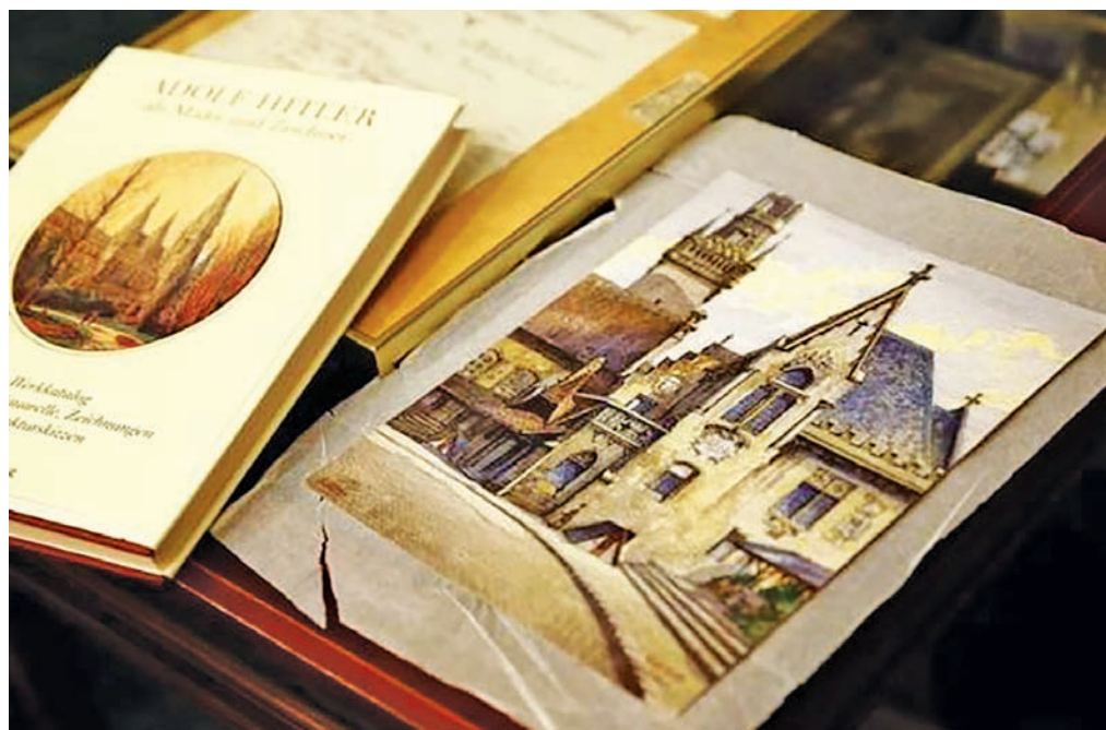
A watercolour of the old registry office in Munich by former German dictator Adolf Hitler lies next to a catalog of his paintings and drawings at Weidler auction house in Nuremberg on 18 Nov, 2014.