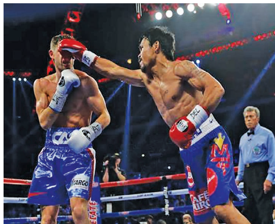
Manny Pacquiao (R) of the Philippines punches Chris Algieri of the US during their World Boxing Organization (WBO) 12-round welterweight title fight at the Venetian Macao hotel in Macau on 23 Nov, 2014.

Algieri (20-1, 9 KOs), who suffered his first defeat, had earned the shot against Pacquiao by overcoming a swollen right eye and two knockdowns against Russia's Ruslan Provodnikov in his previous outing but he was nev-