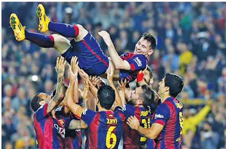
Barcelona's Lionel Messi celebrates his goal with teammates during their Spanish first division soccer match against Sevilla at Nou Camp stadium in Barcelona on 22 Nov, 2014.

"When I scored that goal (against Albacete) I couldn't imagine I could break any record, let alone this one previously held by the great Telmo Zarra," Messi wrote on his Facebook page. "I was only able to achieve this because of