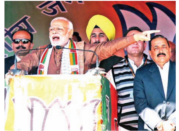
Indian Prime Minister Narendra Modi (2nd L) speaks during an election rally in Kishtwar district of Jammu, Indian-controlled Kashmir, on 22 Nov, 2014. Narendra Modi addressed the gathering here on Saturday for the forthcoming assembly election.