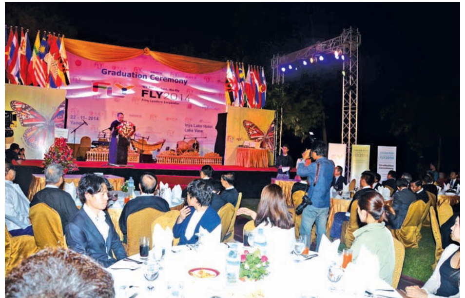
The closing ceremony of ASEAN-ROK Film Leaders Incubator: Fly Project 2014 in progress.