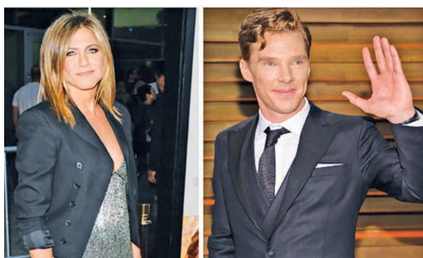
Jennifer Aniston wants Benedict Cumberbatch for 'Horrible Bosses 3'.

LONDON, 23 Nov — Actress Jennifer Aniston and her 'Horrible Bosses' co-stars spent a plane journey with Benedict Cumberbatch discussing a potential role for him