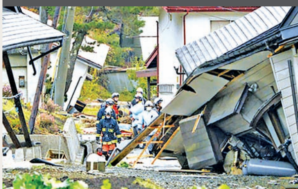
Firefighters and rescue workers walk among collapsed houses in the village of Hakuba, Nagano Prefecture, on 23 Nov, a day after a strong earthquake hit the prefecture and surrounding areas in central Japan. The magnitude-6.7 quake at 10:08 pm on 22 Nov injured at least 39 people.