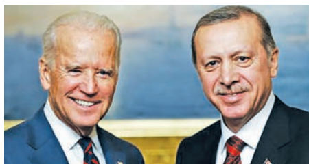
US Vice President Joe Biden (L) meets with Turkey's President Tayyip Erdogan at Beylerbeyi Palace in Istanbul on 22 Nov, 2014.

"On Syria, we discussed ... not only to deny ISIL a safe haven and roll back and defeat them, but also strengthen the Syrian opposition and ensure a transition