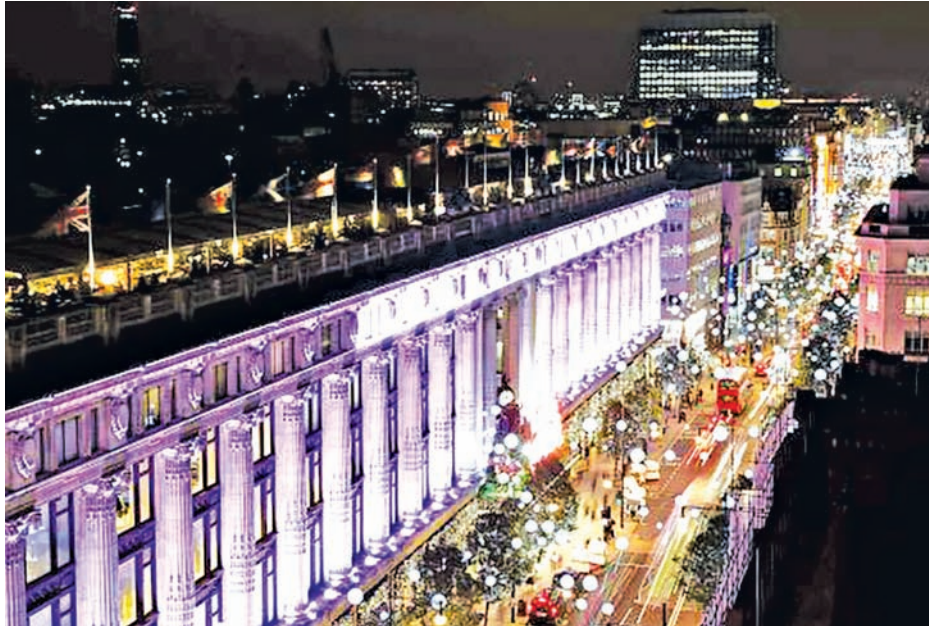
Oxford Street is illuminated after singer Cheryl Fernandez-Versini switched on the Oxford Street Christmas Lights in London on 6 Nov, 2014.

on Christmas trading. John Lewis reported an early peak in sales last year, which it said was driven by