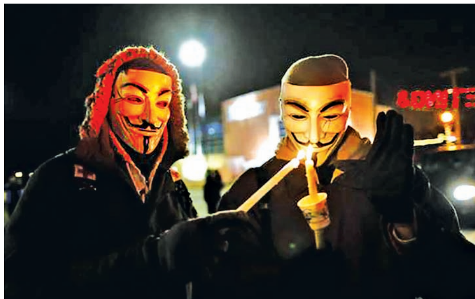
Protesters wearing Guy Fawkes masks take part in a candlelight vigil outside the Ferguson Police Department in Ferguson, Missouri, on 21 Nov, 2014.