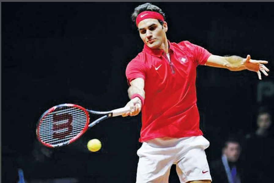
Switzerland's Roger Federer returns the ball to France's Gael Monfils during their Davis Cup final singles tennis match at the Pierre-Mauroy stadium in Villeneuve d'Ascq, near Lille on 21 Nov, 2014.

LILLE, (France), 22 Nov — Despite his defeat by Gael Monfils in Friday's second singles rubber of the Davis Cup final, Roger Federer found something to smile about as the Swiss got "a ghost" off his back.