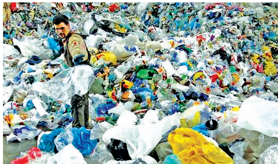
A worker selects white plastic bags at a dumping ground in Uhohlicky village near Prague on 10 April, 2013. — REUTERS

Danish Greens lawmaker Margrete Auken, who negotiated for the European Parliament, called the new law "an historic breakthrough". — Reuters