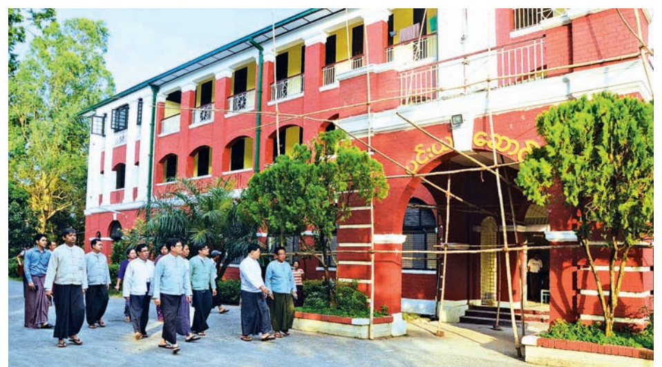
Union Ministers inspect renovation works at hostels of Yangon University.