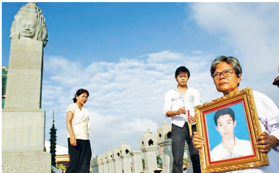
A woman holds the photo of her son who died in a Water Festival stampede four years ago, at a memorial monument in Phnom Penh, Cambodia, on 22 Nov, 2014. Cambodia on Saturday held a Buddhist ceremony to commemorate the fourth anniversary of Water Festival stampede in which 353 people died.