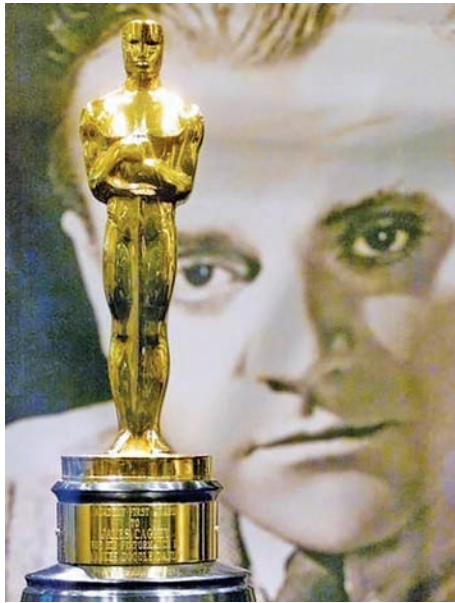
The 1942 Oscar for Best Actor given to James Cagney for his role as the patriot showman George M Cohen in the musical "Yankee Doodle Dandy", shown here in New York on 26 Sept, 2000, is among items from the actor's estate to be auctioned in New York on 27 September.

LOS ANGELES, 22 Nov — James Cagney's best actor Oscar statuette for the 1942 musical film "Yankee Doodle Dandy" went unsold at auction in Los Angeles, in a rare offering of film's top award.