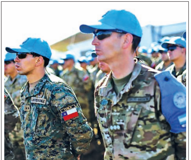
Image provided by Chile’s Defence Ministry shows Chilean and Argentinean soldiers participating in the South Cross II joint exercise, at the Training Camp of Chile’s Army Especial Operations Brigade, in Santiago, capital of Chile, on 21 Nov, 2014.