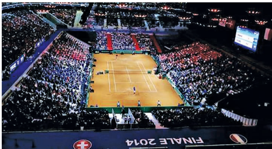
A general view shows the clay court during the Davis Cup final singles tennis match between France’s Jo-Wilfried Tsonga and Switzerland’s Stanislas Wawrinka at the Pierre-Mauroy stadium in Villeneuve d’Ascq, near Lille, on 21 Nov, 2014.

LILLE, (France) 22 Nov — A record crowd of 27,432 people took their seats at the Pierre Mauroy stadium for the Davis Cup final between France and