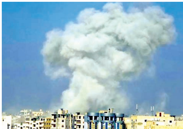
Smoke rises after what activists said was an airstrike by forces loyal to Syria's President Bashar al-Assad in Raqqa, eastern Syria, which is controlled by the Islamic State on 19 Nov, 2014.