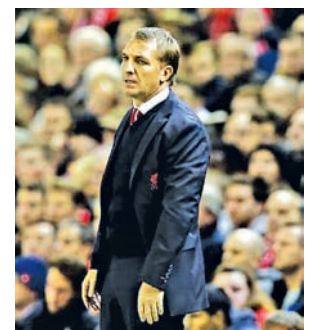
Liverpool manager Brendan Rodgers