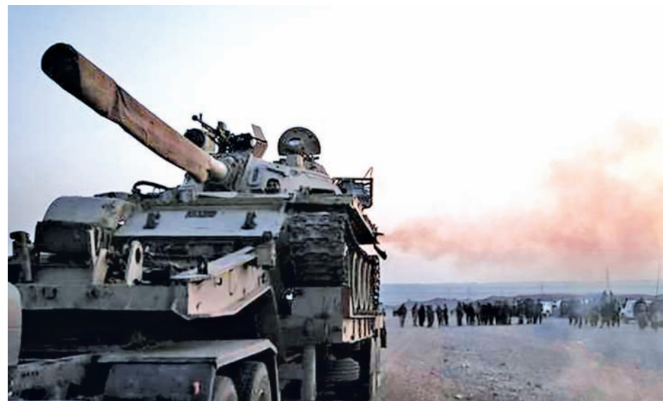
A tank belonging to the Kurdish security forces is seen being transported during an intensive security deployment in Diyala Province north of Baghdad on 19 Nov, 2014.

"I got put on this Earth to do one thing," CBC quoted one of the men, who served in Afghanistan, as saying on condition of anonymity. "I got this fire in me. I still