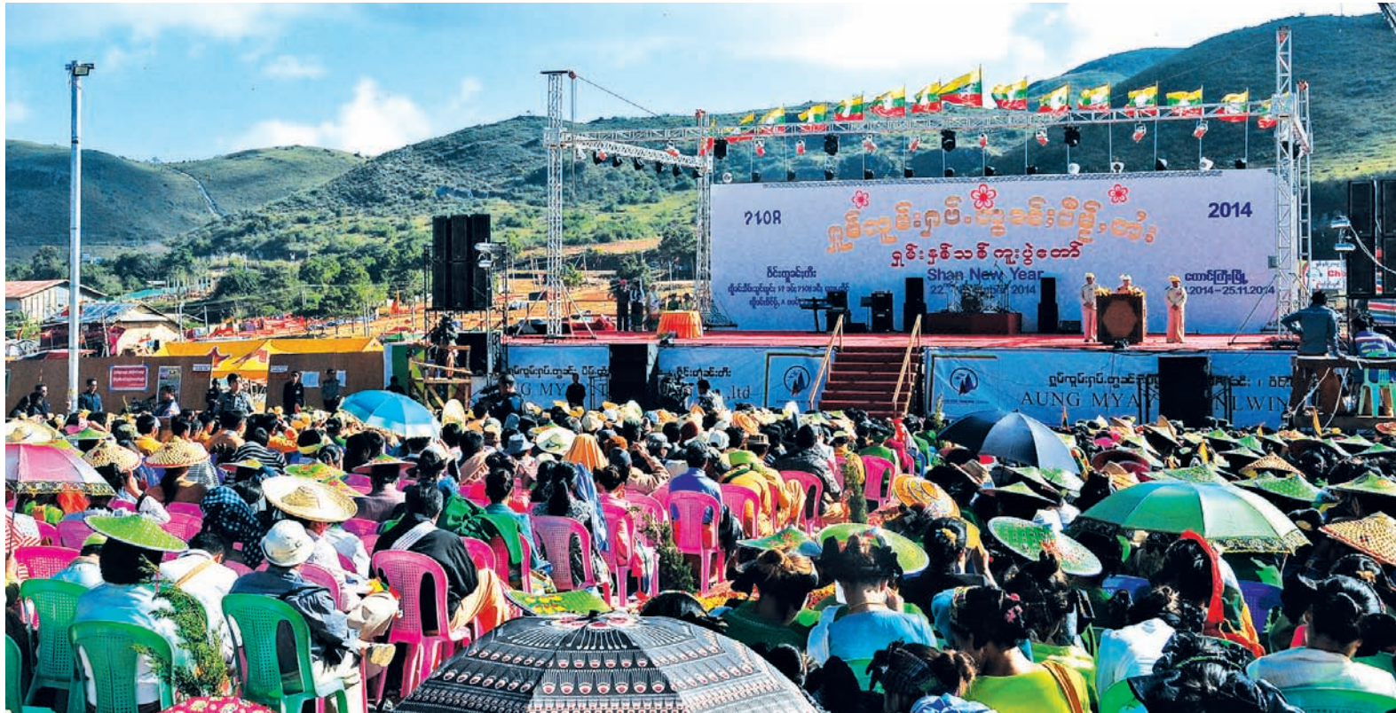
Vice President Dr Sai Mauk Kham joins Shan New Year festival held in Taunggyi on 22 November.

TAUNGGYI, 22 Nov — Vice President Dr Sai Mauk Kham delivered a New Year address at the 2109 Shan New Year festival held at the Aweiyar hot-air balloon ground in Taunggyi, on Friday sources said.