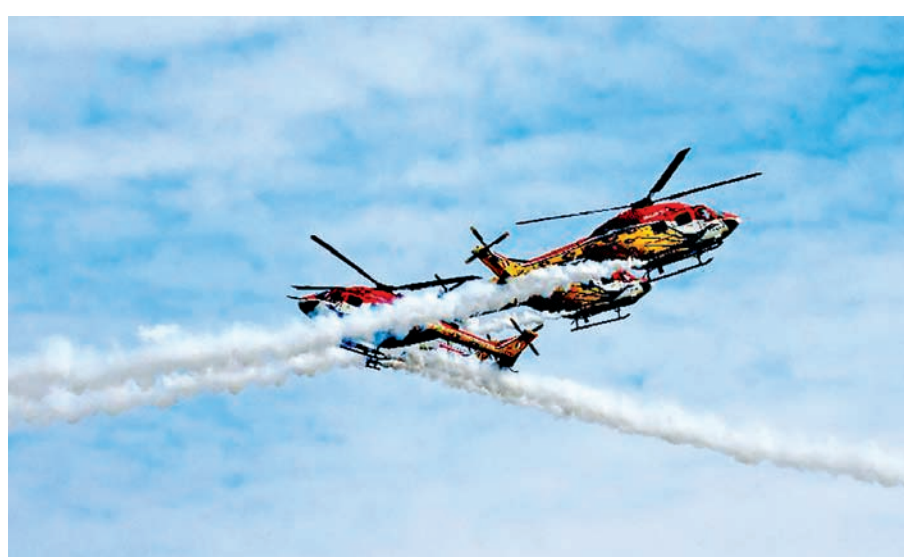
Indian Air Force (IAF) helicopters perform during a parade at an airbase in Tezpur, India, on 21 Nov, 2014.

SHIPPING AGENCY DEPARTMENT MYANMA PORT AUTHORITY AGENT FOR: M/S CHINA SHIPPING LINES Phone No: 2301185