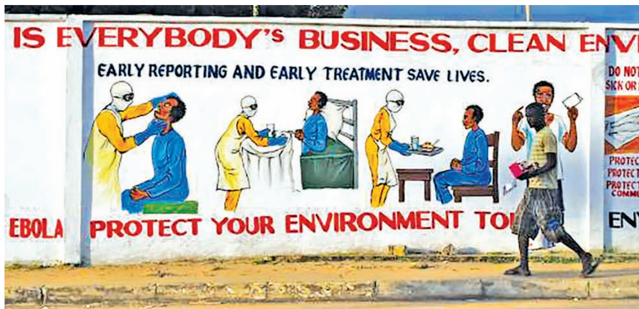
A man walks by a mural with health instructions on treating the Ebola virus, in Monrovia, on 18 Nov, 2014.