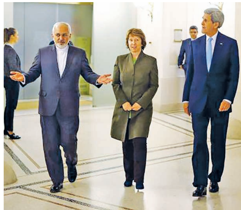
US Secretary of State John Kerry (R), Iranian Foreign Minister Javad Zarif (L) and EU envoy Catherine Ashton arrive for a meeting in Vienna on 20 Nov, 2014.