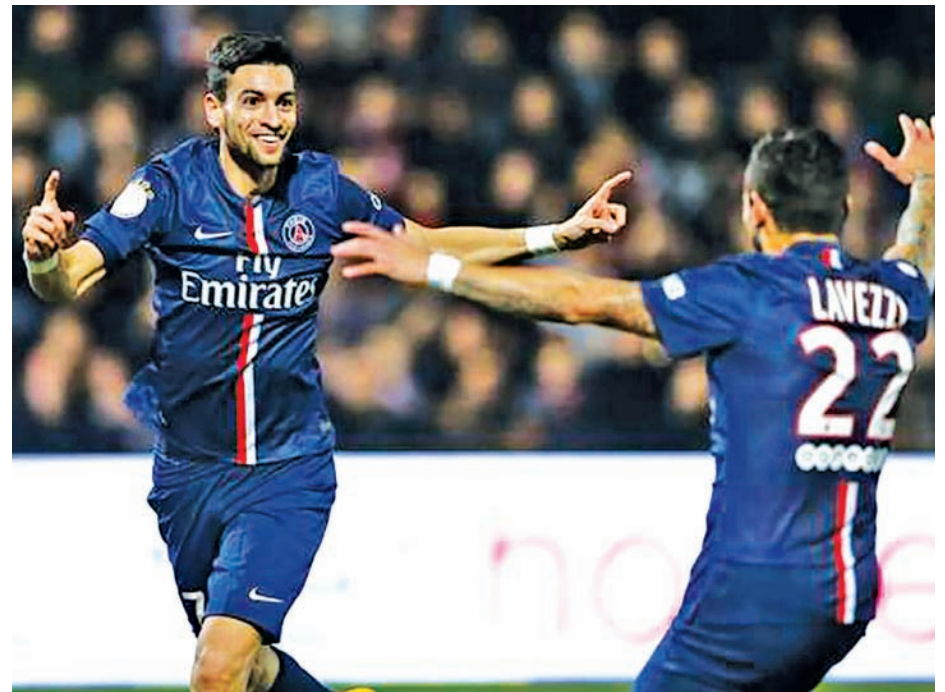
Paris St Germain's Javier Pastore (L) celebrates his goal against Metz with his team mate Ezequiel Lavezzi during their French Ligue 1 soccer match at the Saint Symphorien stadium in Metz on 21 Nov, 2014.