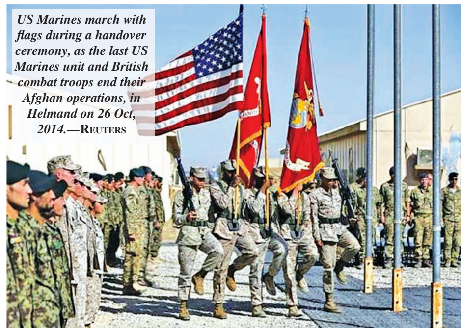
US Marines march with flags during a handover ceremony, as the last US Marines unit and British combat troops end their Afghan operations, in Helmand on 26 Oct, 2014.