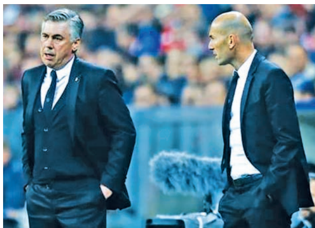
Real Madrid’s coach Carlo Ancelotti (L) and assistant Zinedine Zidane react during the Champions League semi-final second leg soccer match against Bayern Munich at the Arena stadium in Munich, on 29 April, 2014.

Zidane’s defence included the fact that he had the necessary licence that covered him to coach in France and other European countries.