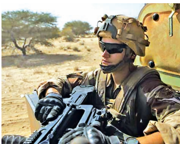
A French soldier from Operation Barkhane rides in an armoured vehicle in Timbuktu, on 5 Nov, 2014.