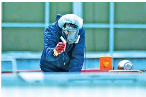
A man wearing a protective mask and suit inspects a container containing eggs and the bodies of culled chickens at a poultry farm, where a highly contagious strain of bird flu was found by Dutch authorities, in Hekendorp on 17 Nov, 2014.