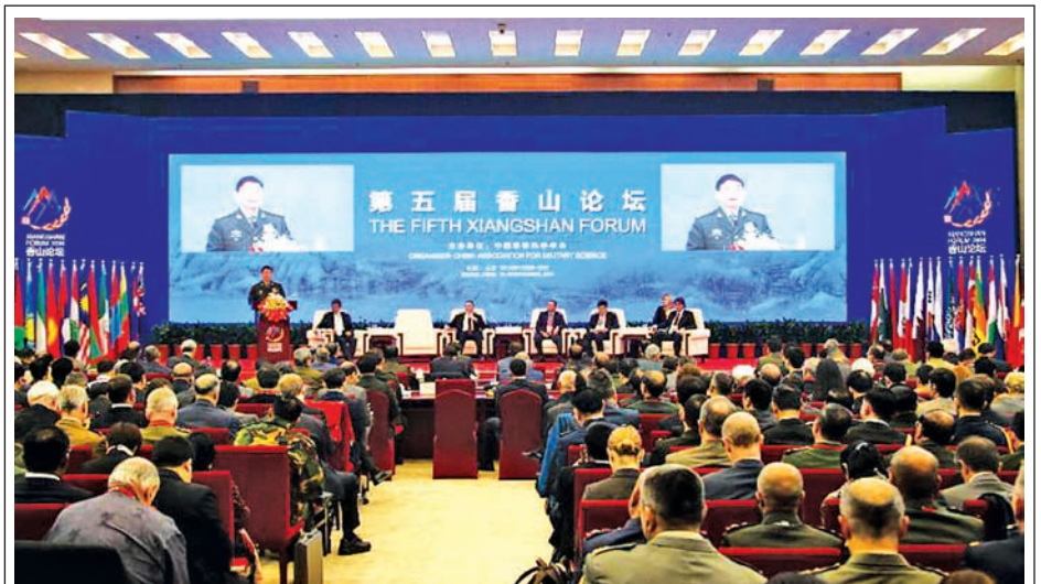
Photo taken on 21 Nov, 2014 shows the scene of the plenary meeting of the 5 th Xiangshan Forum in Beijing, capital of China. The two-day Xiangshan Forum focuses on security in the Asia-Pacific region. The biennial event, organized by China Society of Military Sciences, has been held since 2006. It will be held annually starting this year.