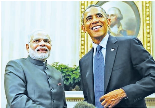
US President Barack Obama and India's Prime Minister Narendra Modi end their meeting in the Oval Office of the White House in Washington on 30 Sept, 2014.

WASHINGTON, 22 Nov — US President Barack Obama will visit India in January to attend Republic Day celebrations and meet with Prime Minister Narendra Modi, the White House said on Friday.