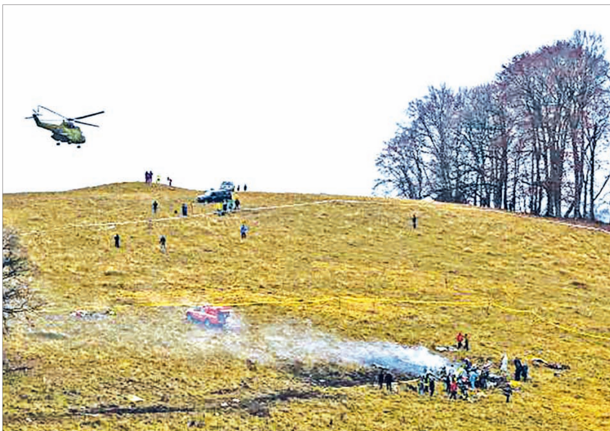
Emergency aid workers inspect the site where a military helicopter IAR-330 Puma built in Romania, crashed near Malancrav on 21 Nov, 2014.

BUCHAREST, 22 Nov — Eight people died when a military helicopter carrying 10 people crashed in the central Romanian county of Sibiu on Friday, the country's emergency response agency said. Romania's defence ministry said the helicopter, an IAR-330 PUMA built in Romania, crashed at about 0840 GMT.