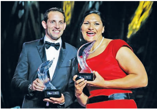
Shot putter Valerie Adams of New Zealand (R) poses with World-record pole vaulter Renaud Lavillenie of France (L) after receiving their 2014 IAAF Athletes of the Year trophies during the IAAF Gala in Monte Carlo on 21 Nov, 2014.