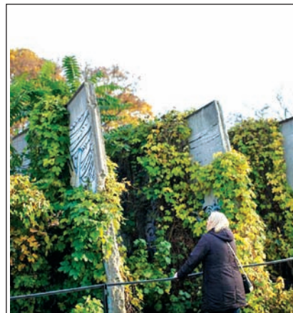
A visitor views a section of wall remains at a Berlin Wall memorial site in Berlin, Germany, on 4 Nov, 2014. Germany will commemorate the 25th anniversary of the fall of Berlin Wall on Sunday, 9 Nov.