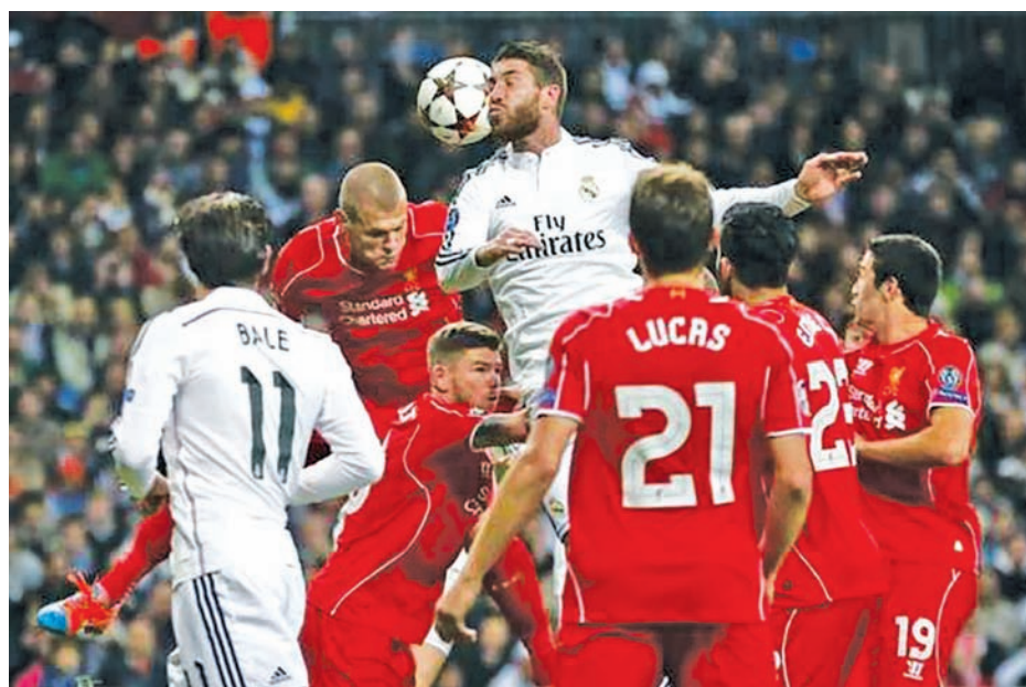
Real Madrid's Sergio Ramos (top) heads the ball during their Champions League Group B soccer match against Liverpool at Santiago Bernabeu stadium in Madrid on 4 Nov, 2014.

Captain Steven Gerrard, Coutinho, Raheem