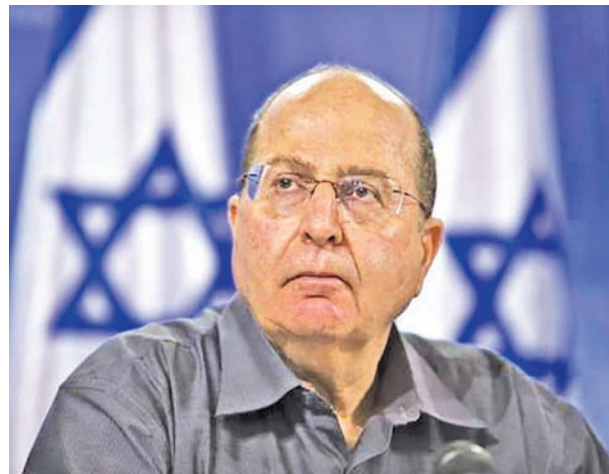
Israeli Defence Minister Moshe Yaalon

LOD, (Israel), 5 Nov — Israel and the United States used the inauguration of a joint warplane project on Tuesday to stress it was business as usual in an alliance hit by acrimony over Israeli settlement building and strategy against Iran.