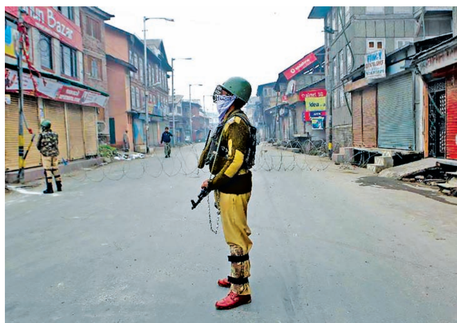
Indian paramilitary troopers stand guard during curfew like restrictions in Srinagar, summer capital of Indian-controlled Kashmir, on 4 Nov, 2014. Authorities imposed curfew like restrictions in most parts of Srinagar to prevent protest and clashes after two youth were killed and two others wounded on Monday evening after Indian army troopers fired on a car at Chattergam in Budgam district, about 14 km south of Srinagar, officials said.

Further unnerving India, al-Qaeda chief Ayman al-Zawahiri, said to be close to TTP-JA, has