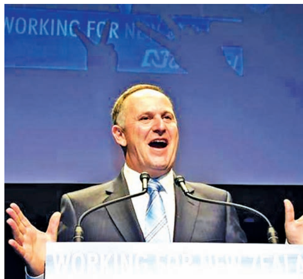
New Zealand's National Party leader John Key and Prime Minister-elect celebrates a landslide victory at the National election party during New Zealand's general election in Auckland, on 20 Sept, 2014.