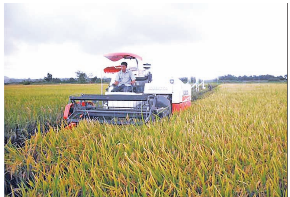
Local farmer harvest ripening monsoon paddy plantation with the use of combine harvester in Loikaw, Kayah State.

LOIKAW, 5 Nov — The government is striving for transform of manual to mechanized farming system across the nation.