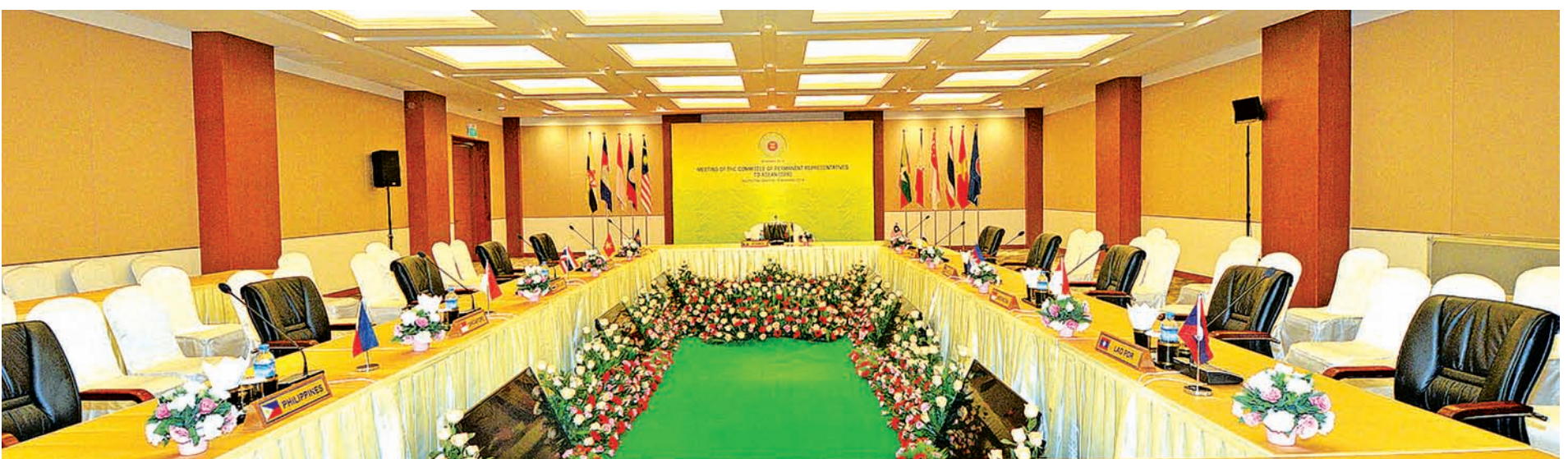
Preparations have been completed for Meeting of the Committee of Permanent Representatives to ASEAN (CPR) at MICC in Nay Pyi Taw.—MNA