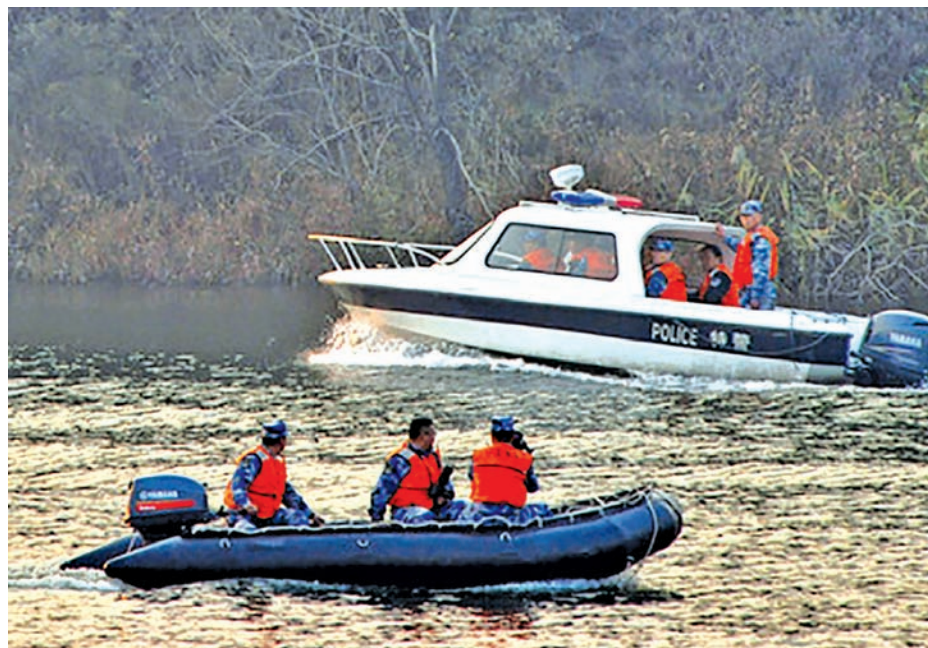
Police officers patrol on boats on 4 Nov, 2014, in an area near the venue for an upcoming APEC summit in Beijing.

BEIJING, 5 Nov — Beijing is on high alert as it hosts a series of APEC meetings this month, mobilizing 60,000 police officers to maintain security and cutting by half the number of vehicles running in the Chinese capital to prevent air pollution.