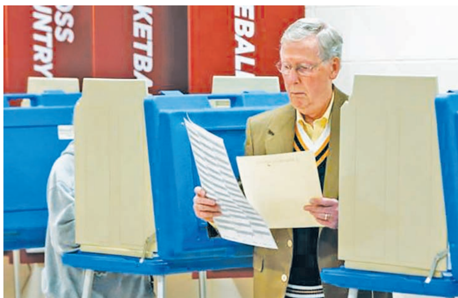
Mitch McConnell looks at his ballot after voting at a polling station in Louisville, Kentucky.

Obama, first elected in 2008 and again in 2012, called Democratic and Re-