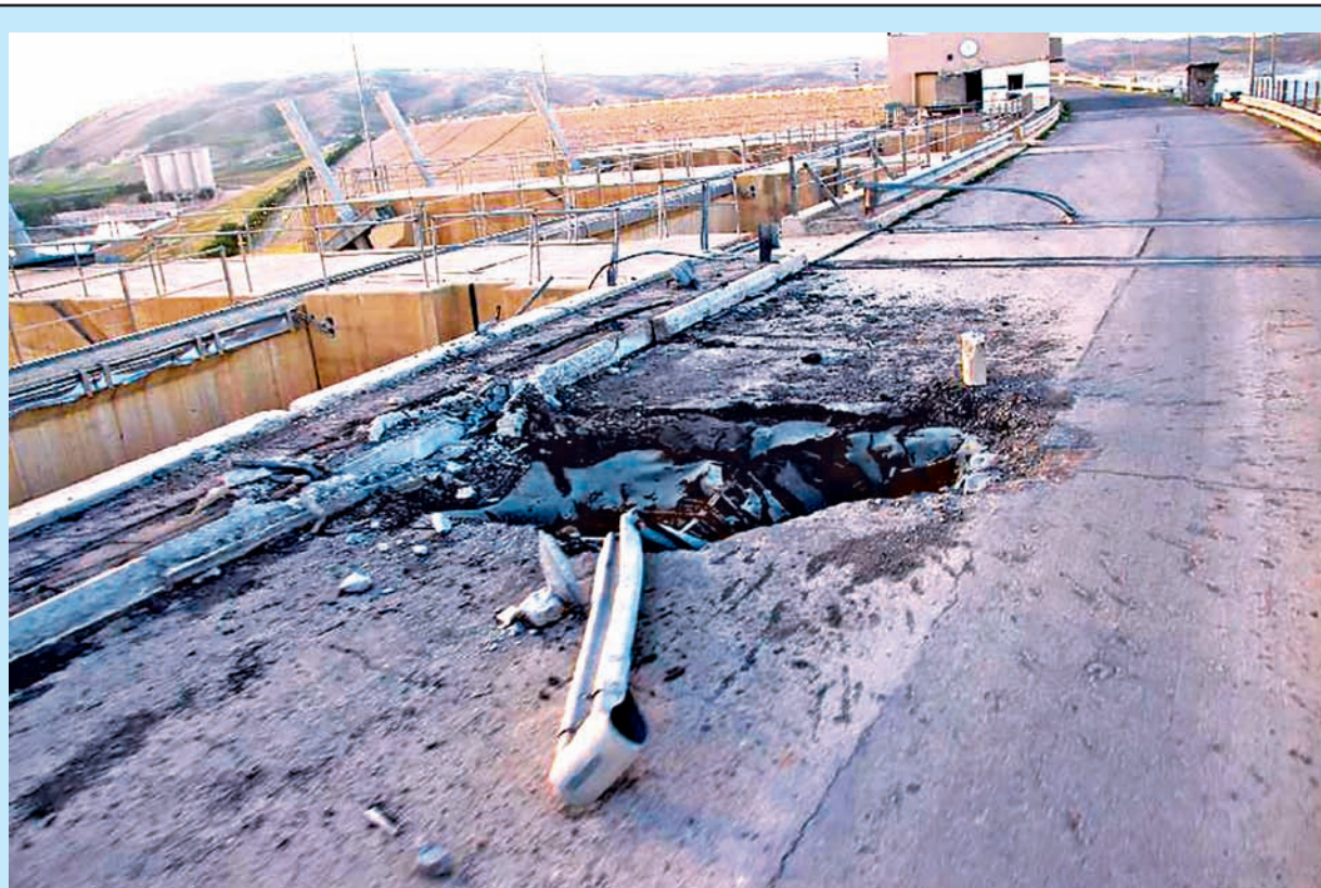
Damages caused by the battle between Iraqi and Kurdish security forces and so-called Islamic State militants is seen on the Mosul Dam on the Tigris River, about 70 km north of the city of Mosul, northern Iraq on 3 Nov, 2014. Iraqi and Kurdish security forces in August jointly took control of Mosul Dam, Iraq's largest dam, in the country's northern province of Nineveh after battles with so-called Islamic State militants who have been trying to regain the control of this important strategic location.

They said Yaalon was expected to decide on that purchase on Wednesday at a meeting of Israeli officials kept low-key because of Finance Ministry misgivings about the large defence budget.