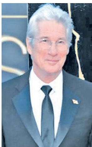
Hollywood superstar Richard Gere

LOS ANGELES, 5 Nov — Hollywood superstar Richard Gere and his estranged wife Carey Lowell are reportedly separating in term of business too. The pair who co-own their the