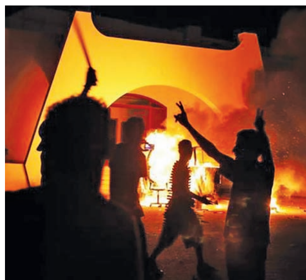
Demonstrators celebrate after burning a car they say was full of ammunition as they stormed the headquarters of the Islamist Ansar al-Sharia militia group in Benghazi on 21 Sept, 2012.