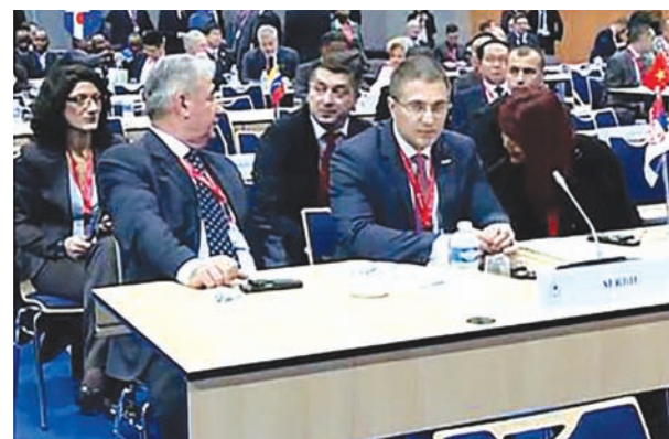
Serbia's Interior Minister Nebojsa Stefanovic (C).

BELGRADE, 5 Nov — Serbia's Interior Minister Nebojsa Stefanovic has said at a meeting of the Interpol General Assembly in Monaco that Interpol data indicates that Serbia is among that organization's 10 most desirable partners, the Interior Ministry has stated.