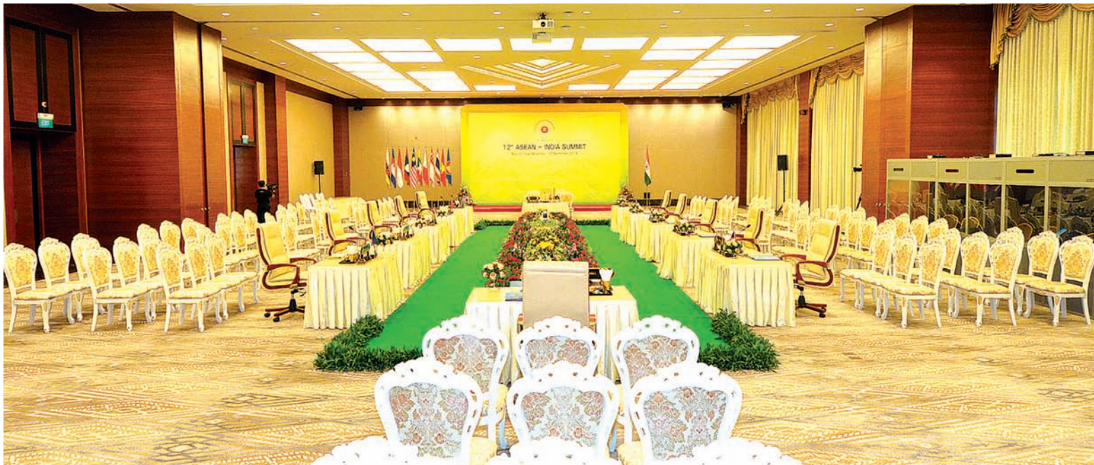
Preparations have been made to host 12 th ASEAN-India Summit on 12 November at Myanmar International Convention Centre in Nay Pyi Taw.