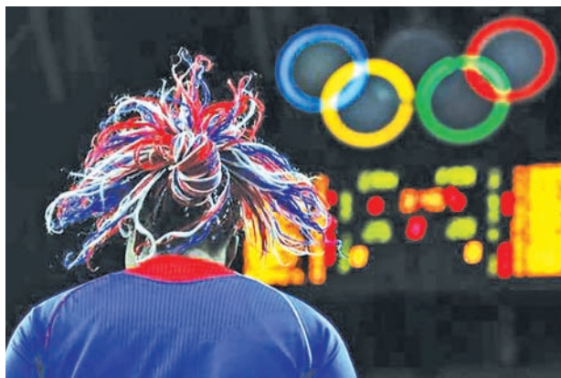
France's Isabelle Yacoubou is seen during the women's preliminary round Group B basketball match against Canada at the Basketball Arena during the London 2012 Olympic Games on 1 Aug, 2012.

The French Committee for International Sport (CFSI) is currently carrying out a study into the possibility of a French Olympic bid. Paris was stunned to lose out to London in the race for the 2012 Games.