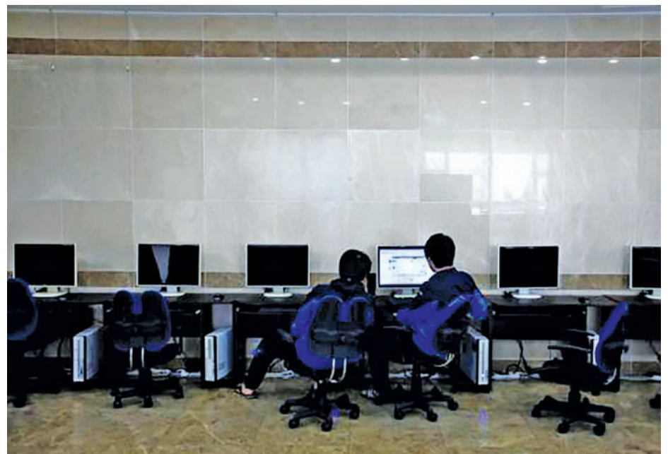
Students retaking the college entrance exams use a public computer during recess at a school in Kwangju, some 40 km (25 miles) southeast of Seoul in this 30 Oct, 2012 file photo.

The survey, the first such exercise by the South Korean government, comes as around 600,000 students gear up for the annual college entrance exam, with places in prestigious schools and a pathway to a secure job at a top corporation on the line. When the test is held on 13 November, the country's stock market will open an hour later, office openings will be delayed to ensure students don't get stuck in traffic, and the central bank will delay its interest rate-setting meeting by one hour.—Reuters