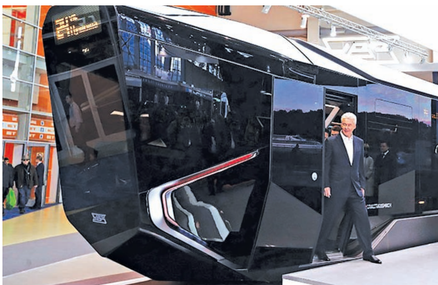
New generation R1 tram from Ekaterinburg was presented during ExpoCityTrans 2014 exhibition in Moscow. This futuristic looking low floor tram is planned to be tested next year.

2. Tender documents are available at our office starting from 10.11.2014 during office hours and for further detail please contact: Deputy General Manager Supply Department, Myanma Railways, Corner of Theinbyu Street and Merchant Street, Botahtaung, Yangon, Phone: 95-1-291985, 291994.