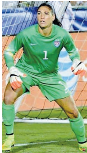
USA goalkeeper Hope Solo

Both organizations have defended their deci-