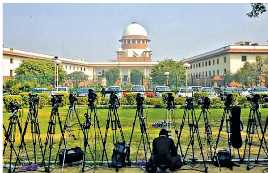
A television journalist sets his camera inside the premises of the Supreme Court in New Delhi on 18 Feb, 2014.

India's $2-billion film industry is the largest in world by ticket sales. It produces between 300 to 325 movies a year and, although there are no official figures, trade analysts say the Hindi-language industry alone employs more than 250,000 people, most of them contract workers.