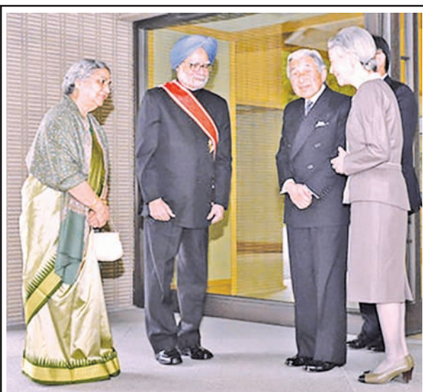
Japan's Emperor Akihito and Empress Michiko (R) send off former Indian Prime Minister Manmohan Singh and his wife at the Imperial Palace in Tokyo on 5 Nov, 2014, after having lunch together. Singh received the Grand Cordon of the Order of the Paulownia Flowers from Emperor Akihito.