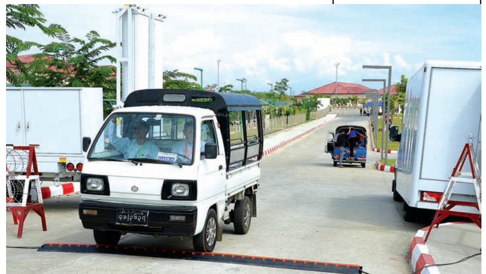
Traffic police rehearse for piloting motorcade of ASEAN delegates to the 25 th ASEAN Summit in Nay Pyi Taw.