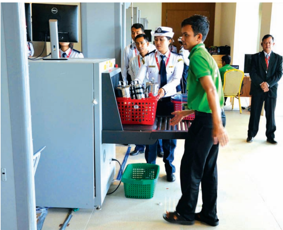
Security personnel check personal equipment of staff and guests at X-ray machine in taking security measures for ASEAN Summit and related meetings at Myanmar International Convention Centre in Nay Pyi Taw.