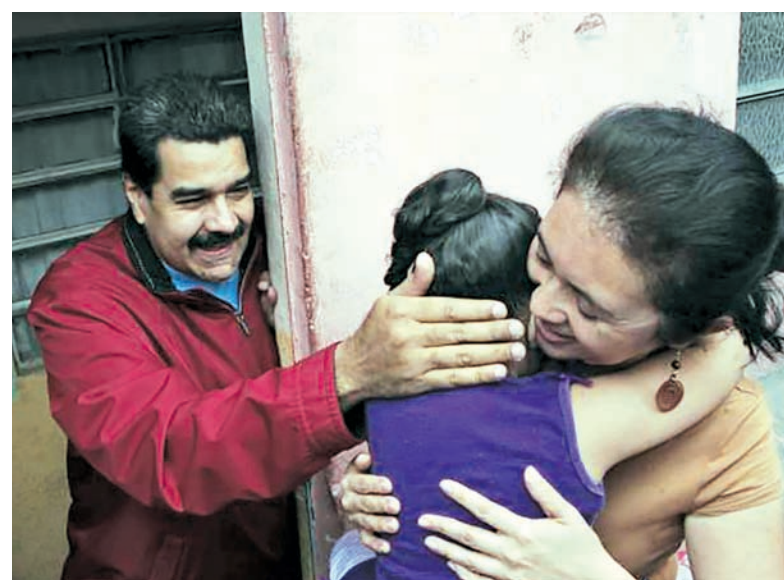
Venezuela's President Nicolas Maduro (L) greets supporters during a meeting outside Caracas in this handout photo provided by Miraflores Palace on 24 Oct, 2014. REUTERS

In the last data available, Venezuela's annualized inflation rate reached 63.4 percent in August, with consumer prices rising by 3.9 percent that month, according to the Central Bank. Oil-dependent Venezuela's inflation malaise is a decades-old problem, also surpassing 60 percent in the 1990s before Chavez, according to IMF data.— Reuters