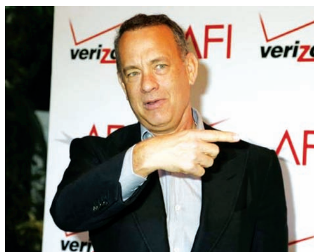
Actor Tom Hanks

NEW YORK, 4 Nov — Actor Tom Hanks will publish a book of stories linked to his collection of typewriters, publisher Alfred A