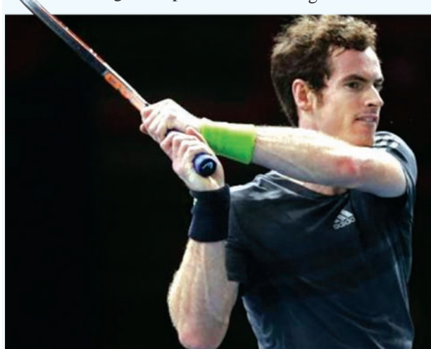
Andy Murray of Britain returns a shot during his men's singles quarter-final tennis match against Novak Djokovic of Serbia at the Paris Masters tennis tournament at the Bercy sports hall in Paris, on 31 Oct, 2014.

LONDON, 4 Nov — Three-times champion and world number one Novak Djokovic has been drawn in a group with US Open champion Marin Cilic in next week's season-ending ATP World Tour Finals in London.