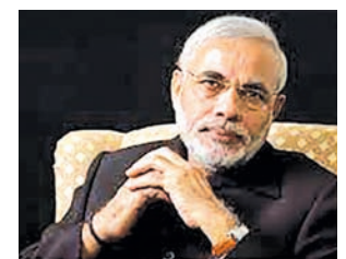
Indian Prime Minister Narendra Modi

NEW DELHI, 4 Nov — Indian Prime Minister Narendra Modi on Tuesday urged non-government organizations to share with him their experiences on battling drug addiction.