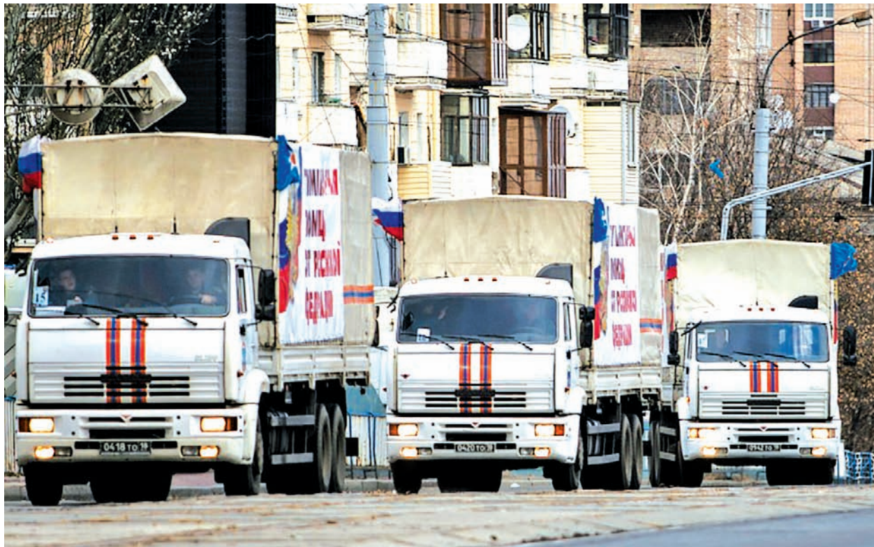
More than 100 tonnes of humanitarian cargoes, including medicines and fuel, have been loaded to some 20 trucks.

At the request from regional authorities aid convoys are delivering 100 tonnes of medicines and fuel which the cities of Donetsk and Luhansk badly need now.