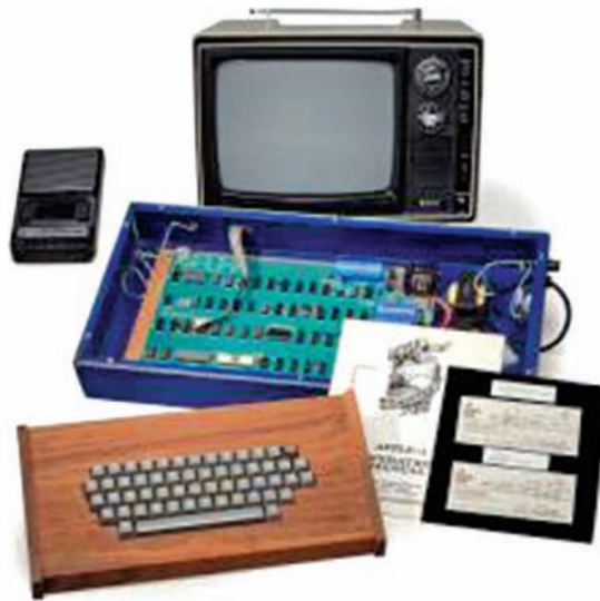
A fully operational Apple computer that company co-founder Steve Jobs sold out of his parents' garage in 1976 for $600 is seen in this undated handout picture courtesy of Christie's.

viced and started the computer, running the standard original software program, Microsoft BASIC, and an original Apple-1 Star Trek game to test it out, Christie's said. The computer will be sold with the cancelled check