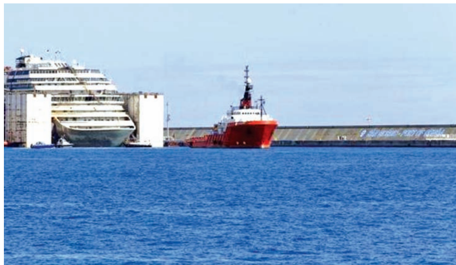
The Costa Concordia ship is docked at Genoa's port, in northern Italy, where the ship will be broken up for scrap, on 27 July, 2014.

ROME, 4 Nov — A corpse found in the wreck of the Costa Concordia is thought to be that of the last person unaccounted for almost three years after the luxury liner sank, Italy's coast guard said on Monday.