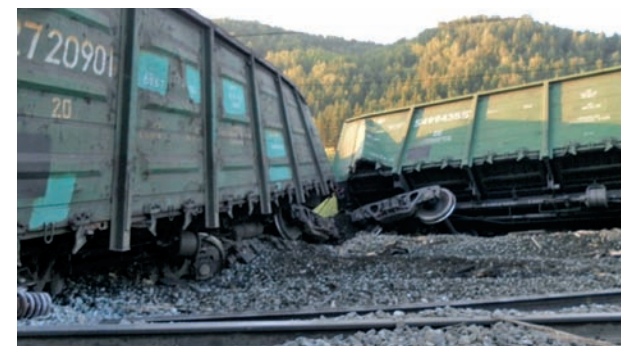
A rail maintenance foreman died and twelve of the 45 people aboard the train were rushed to hospital with medium-heavy traumas.

A passenger train cruising between the port towns of Khomsok and Chekhov slid off the track at 18:35 local time (11.35 MSK). A rail maintenance foreman died and twelve of the 45 people aboard the train were rushed to hospital with medium-heavy traumas. Two