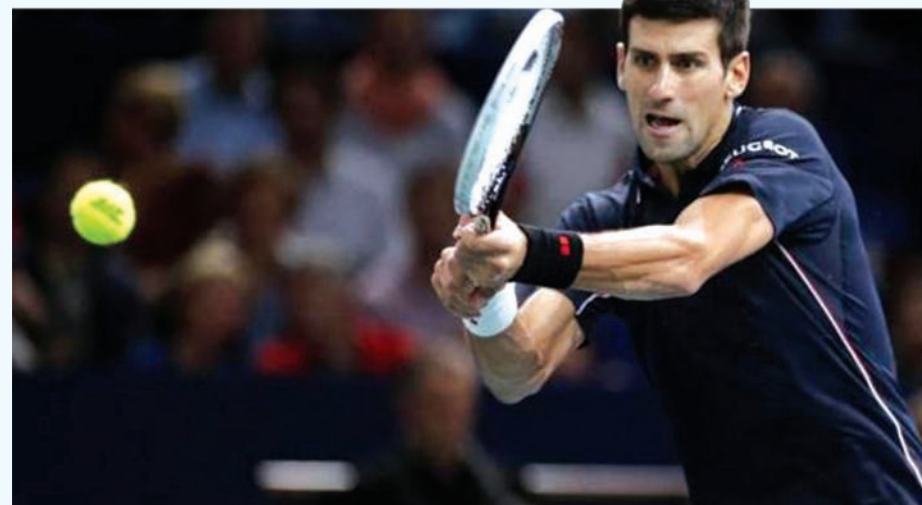
Novak Djokovic of Serbia returns a shot during his men's singles final tennis match against Milos Raonic of Canada at the Paris Masters tennis tournament at the Bercy sports hall in Paris, on 2 Nov, 2014.

"Any of the matches could be a grand slam final so it is satisfying to play in it." Second seed Roger Federer, who has won the year-ending tournament six times and who still has hopes of replacing Djokovic on top of the rankings before the end of the year, faces a clash in Group B