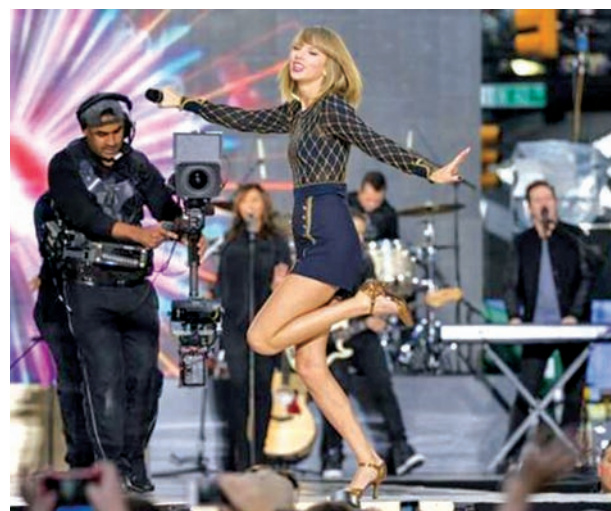
Singer Taylor Swift performs on ABC's "Good Morning America" to promote her new album "1989" in New York, on 30 Oct, 2014.

Swift wrote in an op-ed piece for the Wall Street Journal in July, "Piracy, file sharing and streaming have shrunk the numbers of paid album sales dras-