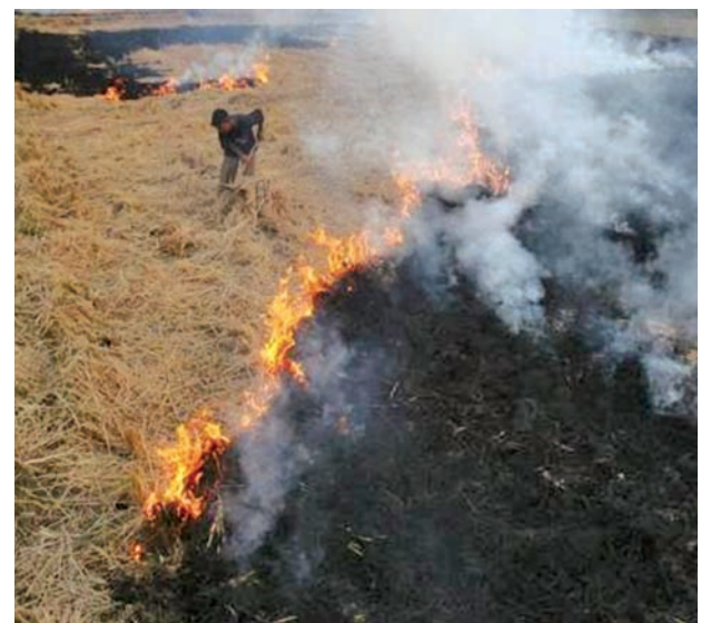
A labourer burns paddy waste stubble at a field on the outskirts of Chandigarh on 5 Nov, 2009.