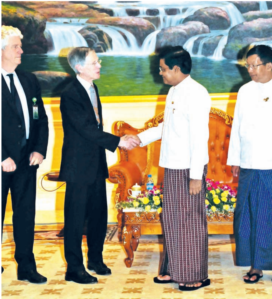
Vice President U Nyan Tun greets BG Group Sustainability Committee Chairman Sir David Manning.

NAY PYI TAW, 4 Nov — Vice President U Nyan Tun received BG Group Sustainability Committee Chair-