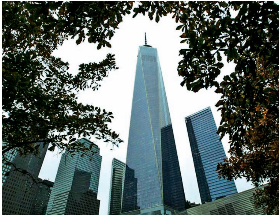
General view of the One World Trade Center in New York on 1 Nov, 2014.

One World Trade Centre stands on the location where more than 2,700 people perished when hijacked planes slammed into the twin towers on 11