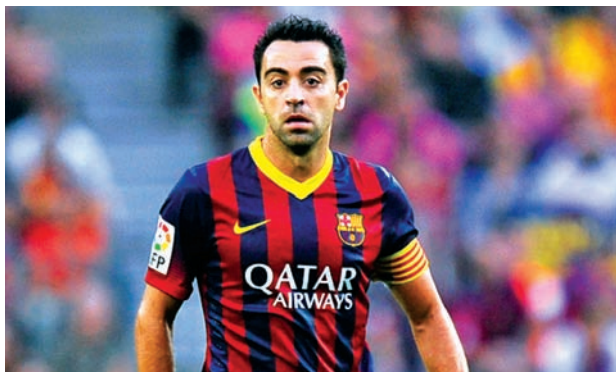
Spanish midfielder Xavi Hernandez

TOKYO, 4 Nov — FC Tokyo are reportedly making a hugely ambitious move for Barcelona's World Cup- and