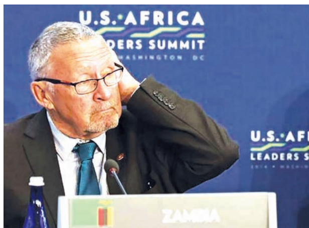
Zambia's Vice President Guy Scott listens as US President Barack Obama (not pictured) speaks, at the first Leaders' Session of the US-Africa Leaders Summit, at the State Department in Washington, in this on 6 Aug, 2014 file picture.

Without giving concrete details how France proposed to help save Aleppo, Fabius said he could not accept that the city would be left to its fate. "That's why, with our coalition partners, we must turn our efforts to Aleppo ... to strengthen the moderate opposition and protect the civilian population against the twin crimes of the regime and Islamic State. After Kobani, we must save Aleppo," the column read.—Reuters