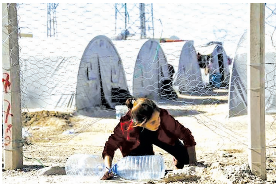
A Kurdish refugee from the Syrian town of Kobani exits from an opening at the fence to collect water for her family at a refugee camp in the border town of Suruc, Sanliurfa Province on 3 Nov, 2014.

In Iraq, the group has executed more than 300 members of a Sunni tribe that dared oppose it last week, after seizing the tribe's village in the