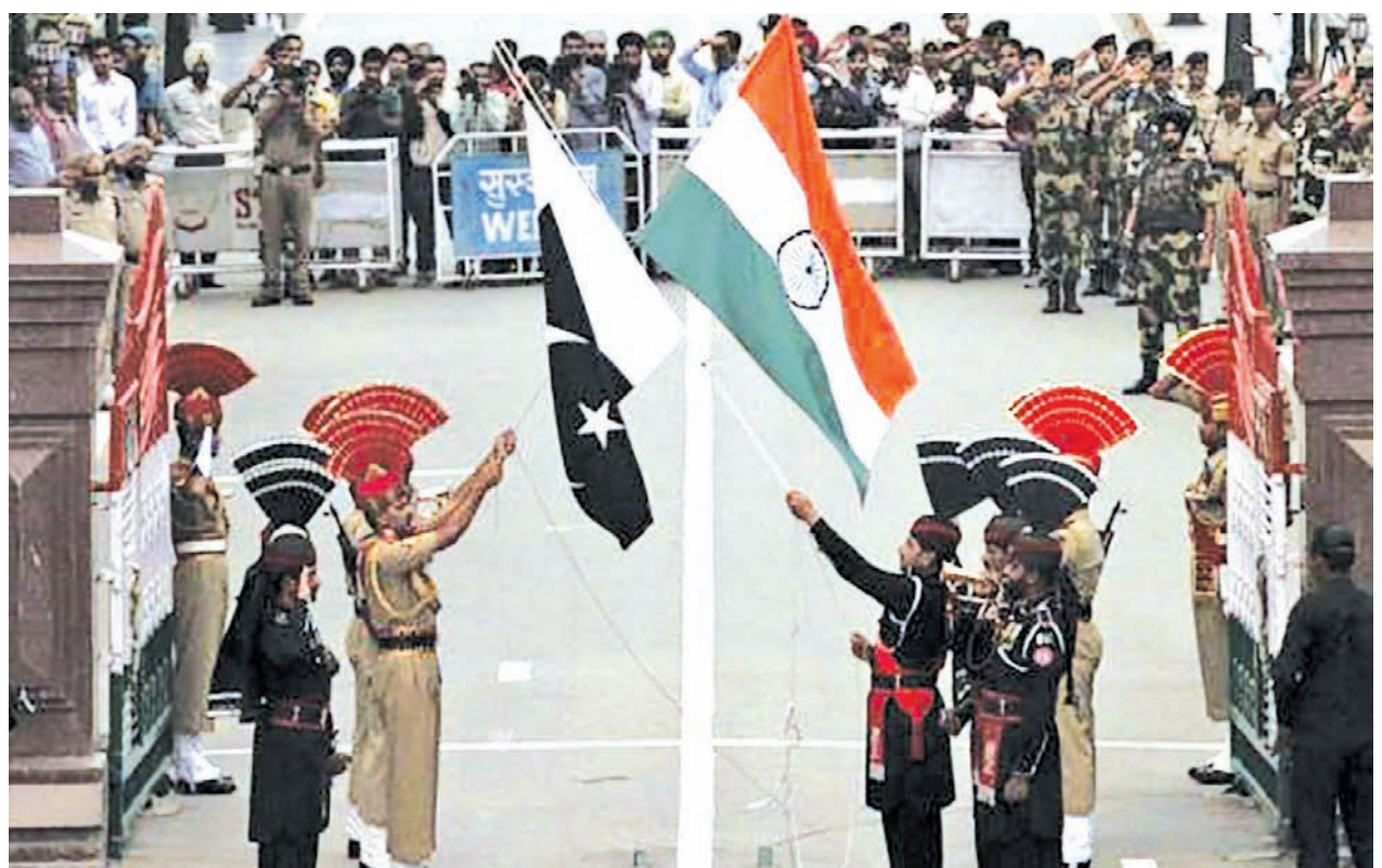
Pakistani rangers (wearing black uniforms) and Indian Border Security Force (BSF) officers lower their national flags during a daily parade at the Pakistan-India joint check-post at Wagah border, near Lahore on 3 Nov, 2014.

The colourful show, where border guards in elaborate uniforms goose-step, shake hands brusquely across the borderline and scowl aggressively at each