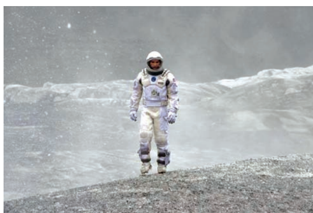
Matthew McConaughey in Interstellar .

LOS ANGELES, 4 Nov — For his first journey into a galaxy far, far away, director Christopher Nolan wanted to tether himself to something close to home.