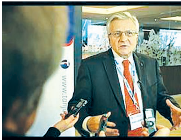
Chairman of the European branch of the Trilateral Commission Jean-Claude Trichet

BELGRADE, 4 Nov — Chairman of the European branch of the Trilateral Commission Jean-Claude Trichet has said that the Serbian government policy of progressive EU integration is clear, impressive and convincing.