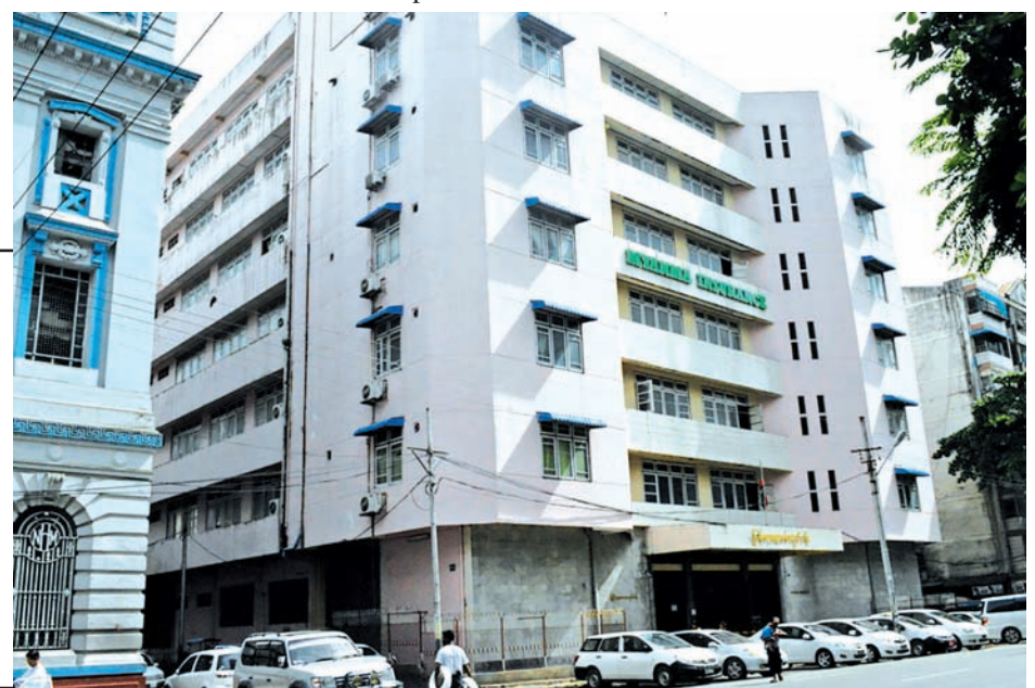
Photo shows the Myanmar Insurance Building in Yangon. Plans are underway to introduce two new products, health insurance and weather index insurance, in Myanmar next year vthe company said.