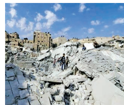
Civilians inspect a site hit by what activists said was a missile fired by forces loyal to Syria's President Bashar al-Assad in al-Kalaseh neighborhood of Aleppo on 28 Oct, 2014.

As US warplanes bomb Islamic State in parts of Syria, Assad's military has in-