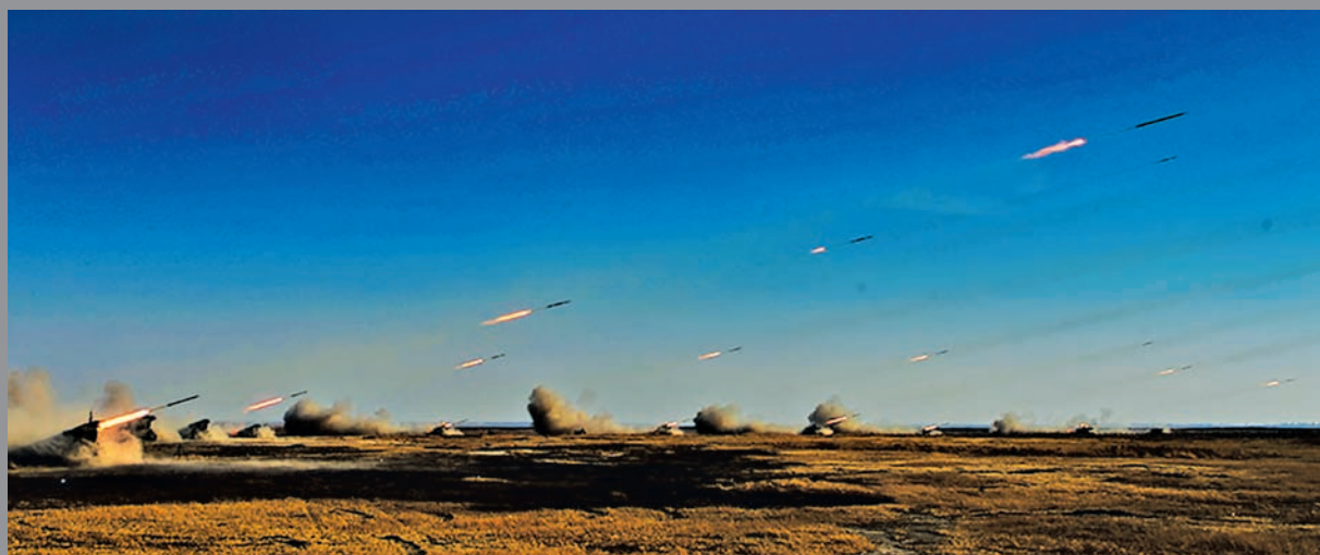
The Chinese People's Liberation Army started a live-fire drill in northeast China, the largest in scale of the year, on 26 Oct, 2014. The military exercise code-named "Joint Action-2014E" is the last event of its kind in this year.