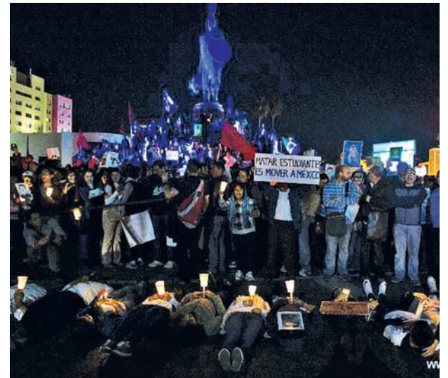
Members of student associations and citizens hold candles and banners during a protest for the disappearance of the 43 students of the Normal Rural School, in the city of Tijuana, northeast Mexico, on 2 Nov, 2014.