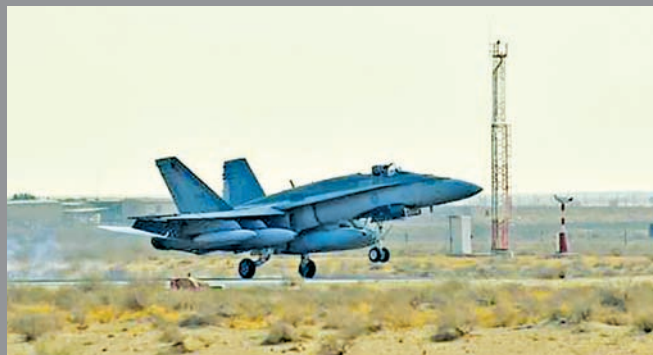
A Canadian Armed Forces CF-18 Fighter jet arrives at the Canadian Air Task Force Flight Operations Area in Kuwait on 28 Oct, 2014 in this Canadian Forces handout photo received on 29 Oct, 2014.

BEIRUT, 3 Nov — Islamic State fighters in Syria said on Monday they had taken control of a gas field in the central province of Homs, the second gas field seized in a week after battles with government forces.