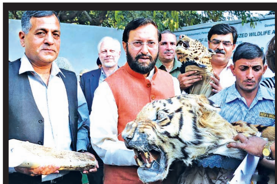
Indian Environment Minister Prakash Javadekar (C) displays a tiger skin before authorities set fire to illegal wildlife parts at the Delhi Zoo in New Delhi, India, on 2 Nov, 2014. A stockpile of tiger skins, elephant tusks, rhino horns and other illegal animal parts were burned Sunday in an effort to discourage wildlife smuggling in South Asia.—XINHUA