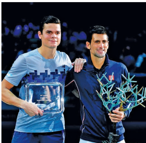
Novak Djokovic (R) of Serbia and Milos Raonic of Canada pose for photograph during the awarding ceremony after the men's singles final match at the ATP World Tour Masters 1000 indoor tennis tournament at the Bercy Palais-Omnisport in Paris, France, on 2 Nov, 2014.