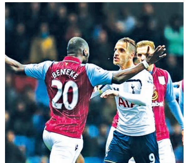
Aston Villa's Christian Benteke (L) confronts Tottenham Hotspur's Roberto Soldado (C) during their English Premier League soccer match at Villa Park in Birmingham, central England on 2 Nov, 2014.