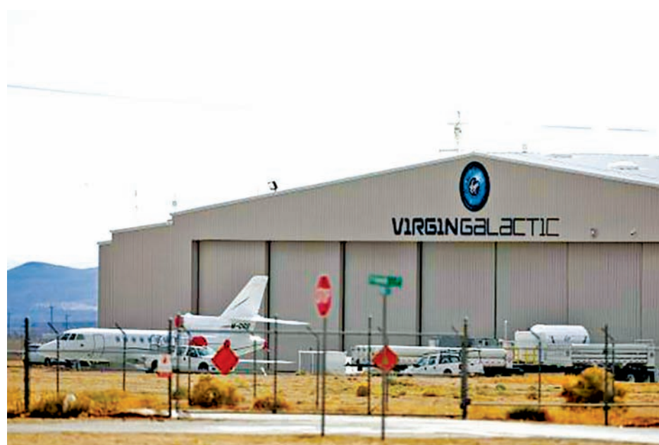
The Virgin Galactic hangar is seen at Mojave airport in Mojave, California on 1 Nov, 2014. — REUTERS

es rocket built and launched by Orbital Sciences Corp exploded after liftoff from Wallops Island, Virginia, destroying a cargo ship bound for the International Space Station.—Reuters