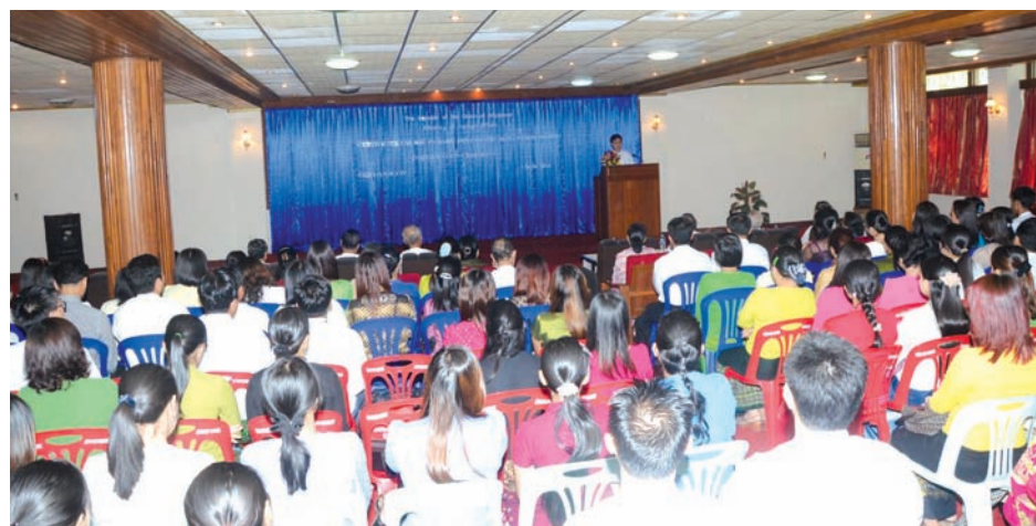
An opening ceremony of Certificate Course No. 34/2014 on Basic Diplomatic Skills in progress.