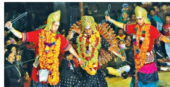
Artists in traditional attire perform during the Kartik Naach festival in the ancient courtyard of Patan Durbar Square in Lalitpur, Nepal, on 2 Nov, 2014. Kartik Naach festival is held annually as storytelling through dance believed to be introduced in the 17 th century.