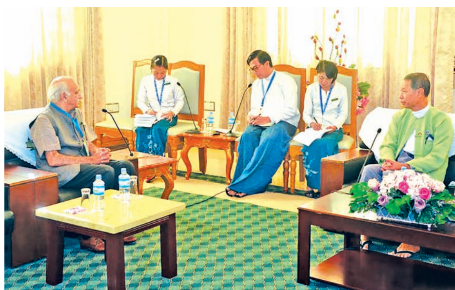
Deputy Speaker of Pyidaungsu Hluttaw and Pyithu Hluttaw U Nanda Kyaw Swa holds talks with Spokesman Mr M J Akbar of Bharatiya Janata Party from India.