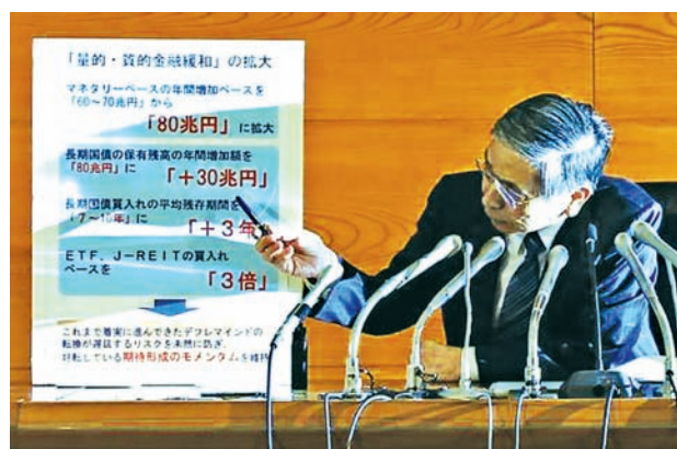
Bank of Japan (BOJ) Governor Haruhiko Kuroda points to a placard showing BOJ policy decisions during a news conference at the BOJ headquarters in Tokyo on 31 Oct, 2014.

Japan's economy, which has been hit by four recessions since 2000, is