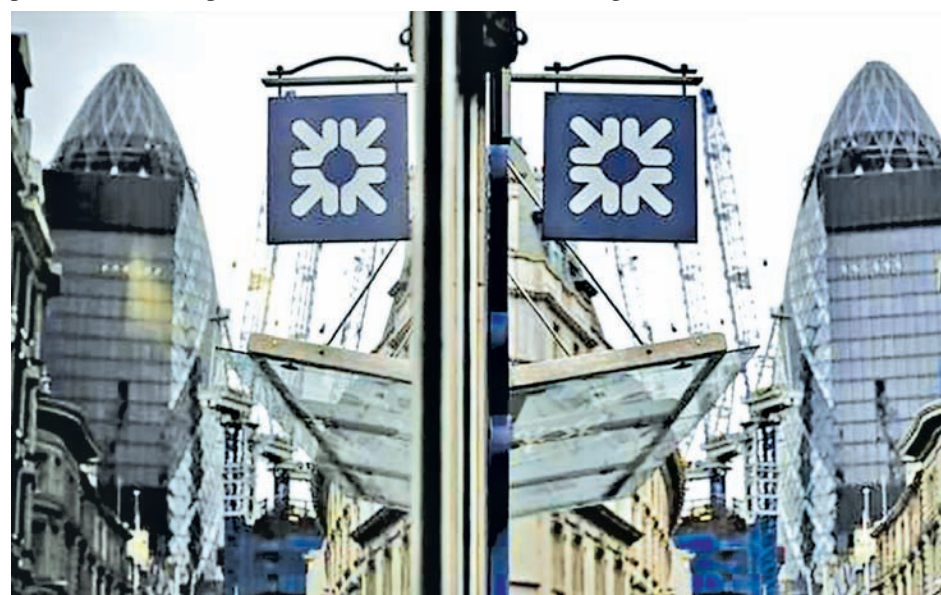
A logo of the Royal Bank of Scotland (RBS) is reflected in the window of a branch office in London on 1 Nov, 2013.