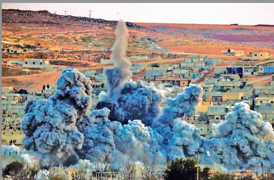
An explosion following an airstrike is seen in the Syrian town of Kobani from near the Mursitpinar border crossing on the Turkish-Syrian border in the southeastern town of Suruc in Sanliurfa province on 2 Nov, 2014.

company and the (positions) surrounding it became part of the land of the Caliphate, the soldiers advanced, conquering new areas, and all praise is due to Allah," Islamic State said in the message.