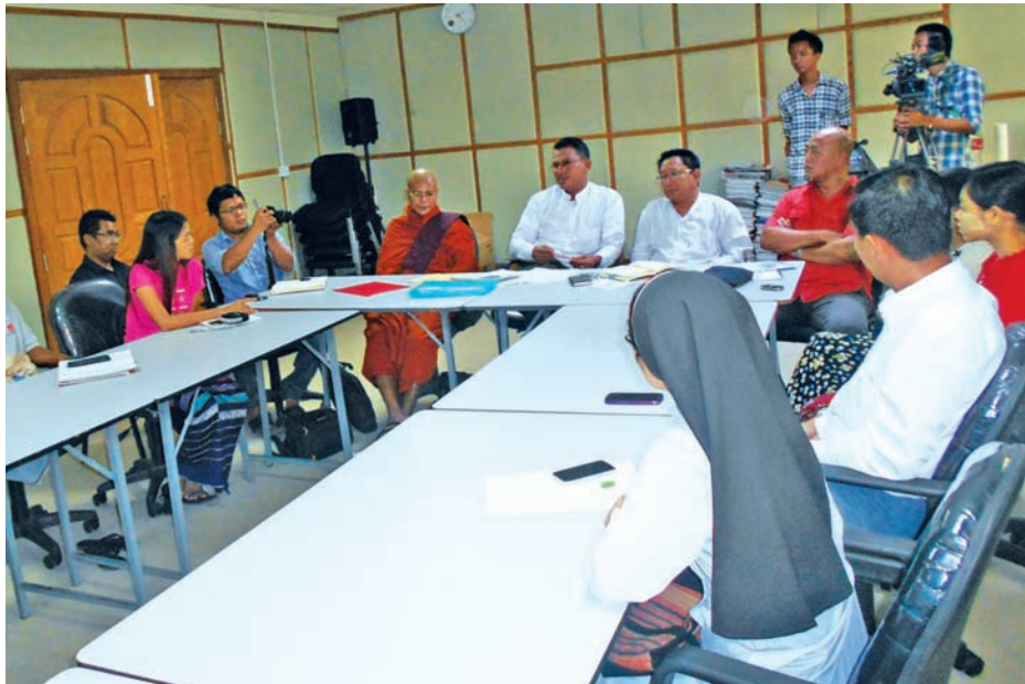
Myanmar Child Rights Development Network discusses future plan to implement its peace for children edutainment programme in November.

He said that the network has future plan to start its pilot projects to be launched in child centres in 27 sub-urban townships to promote community-based child development programmes.—GNLM