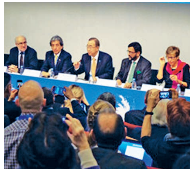
United Nations Secretary General Ban Ki-moon (C) speaks at a news conference in the Danish capital of Copenhagen on 2 Nov, 2014.