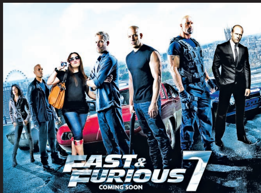
The trailer was released on Saturday during a special world premiere event at the studios.

Walker died in a car crash while on hiatus from shooting the action film. Vin Diesel and Dwayne Johnson also features in the film helmed by director James Wan.