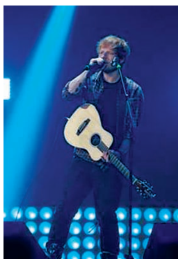
Singer Ed Sheeran performs during the 2014 iHeartRadio Music Festival in Las Vegas, Nevada on 20 Sept, 2014.