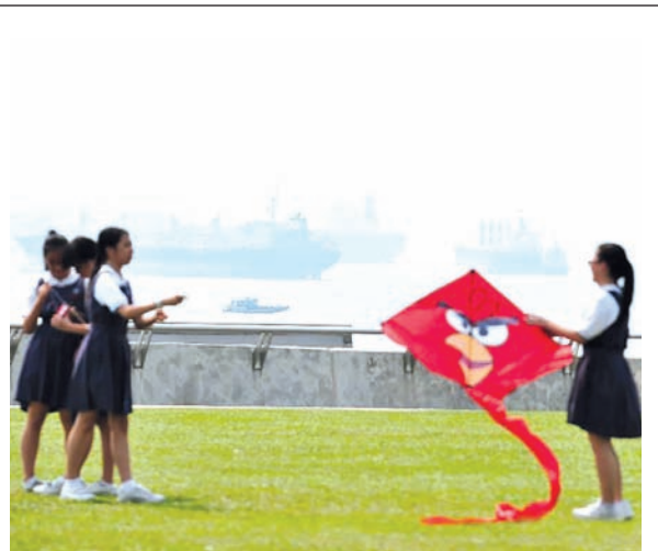
Students play on the Marina Barrage rooftop garden in Singapore, on 3 Nov, 2014. Singapore's 3-hour Pollution Standard Index (PSI) hit 116 on Monday.