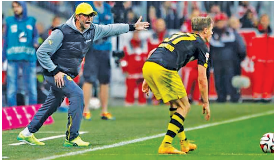
Borussia Dortmund's coach Juergen Klopp shouts at his player Erik Durm (R) during their German first division Bundesliga soccer match against Bayern Munich, in Munich on 1 Nov, 2014.

new hope to winless Manchester City, who let a 2-0 lead slip away to CSKA Moscow and now need to win the return in England and hope the Italians lose again. Dortmund are having a strange season in which they struggle domestically while brushing aside all opposition in Group D.