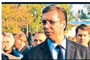
Serbian Prime Minister Aleksandar Vucic

Vucic said in the city Subotica, northern Serbia, on Sunday, that he and Putin would talk about the Serbian gas debt issue, stressing that there was no