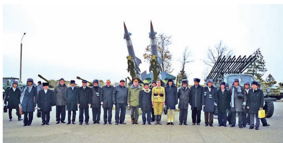
Myanmar military delegation with Russian officers at Stalin's Line.

The over 1,200 kilometer-long historic fortification line stretched from Karelain Isthmus in the north to the south and covered 23 defence areas with over 4,000 defence posts.