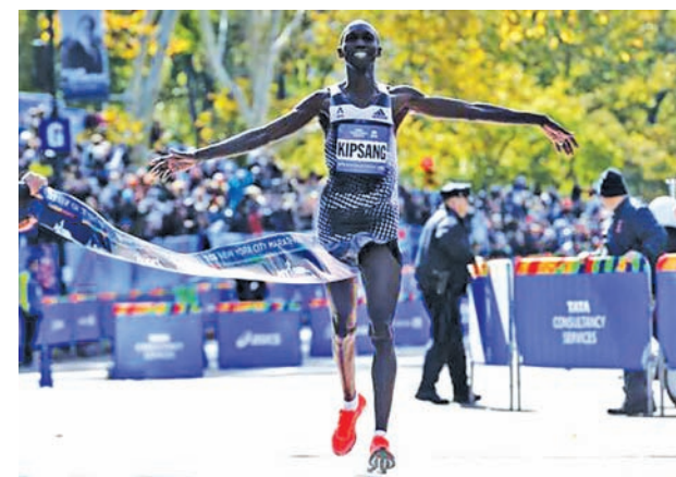
Wilson Kipsang of Kenya crosses the finish line to win the men's professional division of the 2014 New York City Marathon in Central Park in Manhattan, on 2 Nov, 2014.

NEW YORK, 3 Nov — Wilson Kipsang won a lucrative duel to the finish to join compatriot Mary Keitany in a Kenyan sweep of the men's and women's races at a cold, windy New York City Marathon on Sunday.