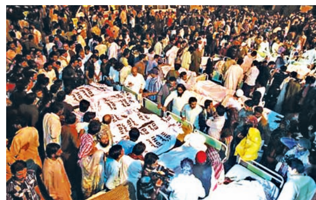
Pakistani relatives gather beside the covered bodies of victims who were killed in suicide bomb attack in Wagah border near Lahore on 2 Nov, 2014.

"I was sitting in my office near the border when I heard the blast. I rushed to the scene and saw scattered bodies, injured men, women and children and smashed cars," a Pakistani