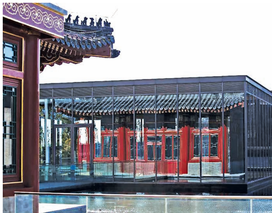
The image of an ancient Chinese style house is reflected in a glass-made architecture in the media centre for the 2014 APEC Economic Leaders' Week at Yanqi Lake in Huairou District of Beijing, China on 3 Nov, 2014. The Chinese-style media centre at Yanqi Lake is one of the two media centres set up for the upcoming Apec leaders' week, offering all-round services to media organizations.—XINHUA

They encouraged the private sectors of both countries to further collaborate in accelerating bilateral trade and investment cooperation to deepen economic integration of the region towards the realization of the ASEAN Economic Community (AEC) in 2015, the statement said.—Xinhua