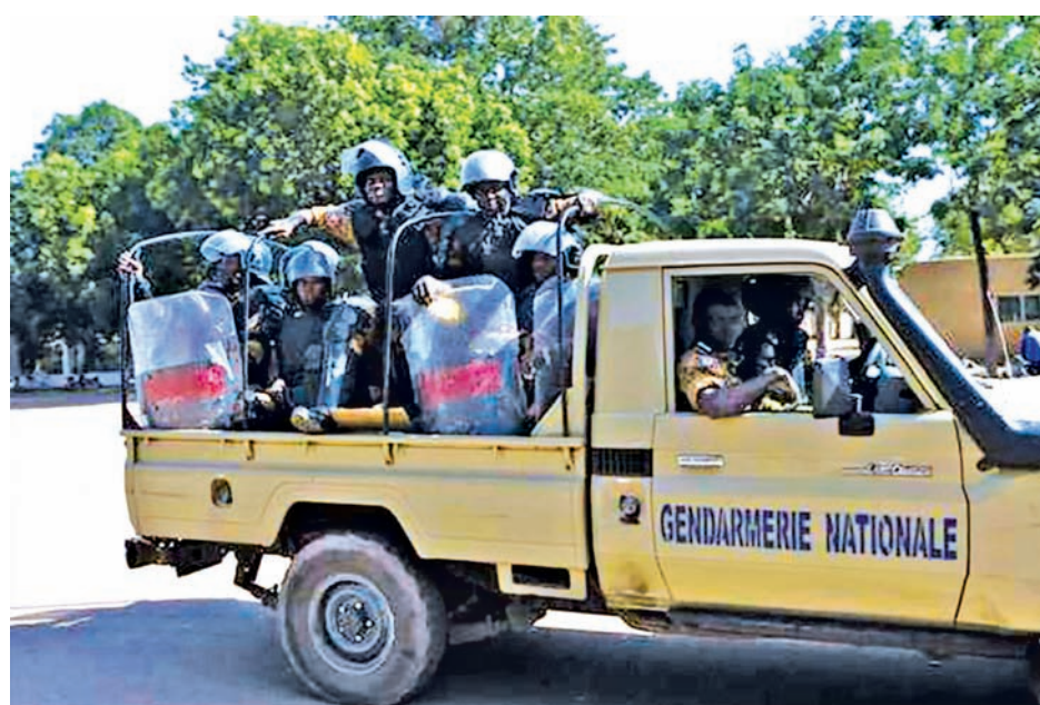
Gendarmes drive on a street after military fired in the air to disperse protesters at the state TV headquarters in Ouagadougou, capital of Burkina Faso on 2 Nov, 2014.

Shortly afterwards, presidential guards moved in to prevent access to Ouagadougou’s central Place de la Nation, the site of violent demonstrations against Compaore last week in