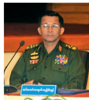
Senior General Min Aung Hlaing.