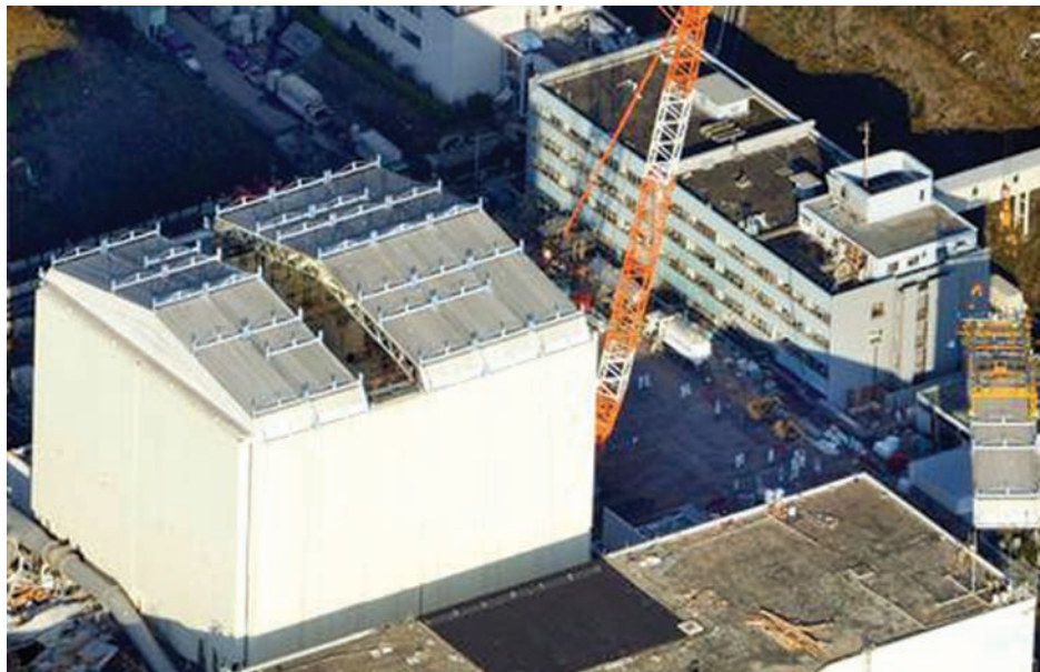
Photo taken 31 Oct, 2014 from a Kyodo News helicopter shows the No 1 reactor building of the crippled Fukushima Daiichi complex in northeastern Japan, after its operator Tokyo Electric Power Co removed a panel from the roof of the cover shrouding the building, which is a first step toward removing spent fuel rods stored in a cooling pool in the building.

On Friday morning, plant workers removed a huge panel using a crane to see whether antidispersal agents, inserted last week to prevent radioactive dust from being scattered, are taking effect. No changes in radiation levels have been observed around the plant so far, the company