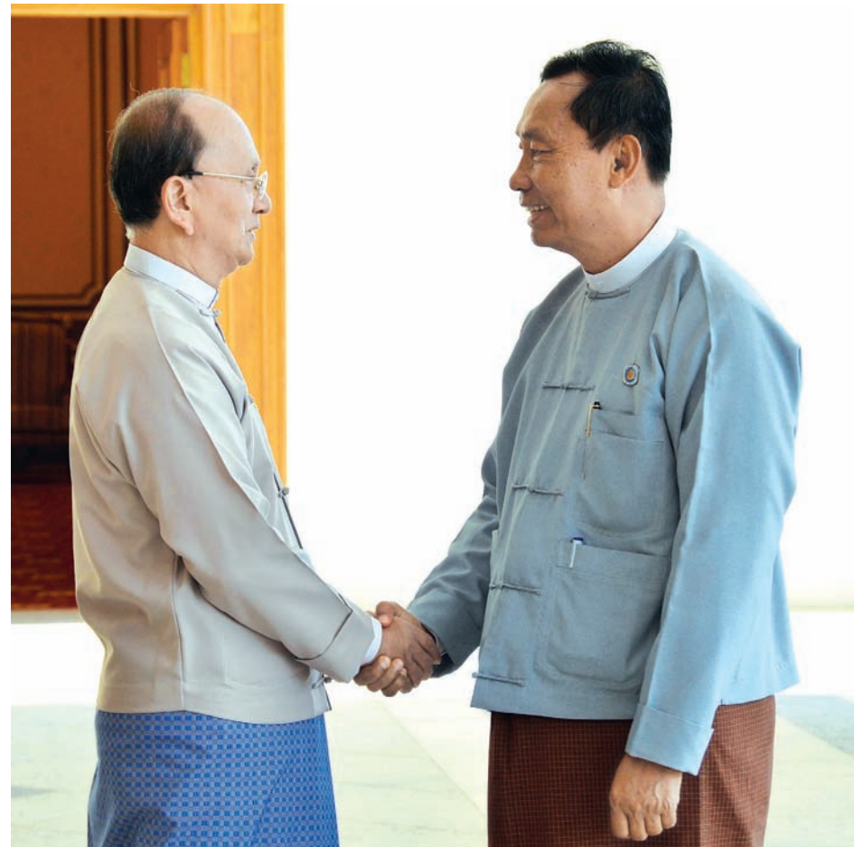
President U Thein Sein cordially greets Speaker of Pyidaungsu Hluttaw and Pyithu Hluttaw Thura U Shwe Mann at political dialogue.

we will be able to start the political dialogue process. We will also need to have both the short term and the long term plans to aid us in finding solutions. What we are trying to achieve is to