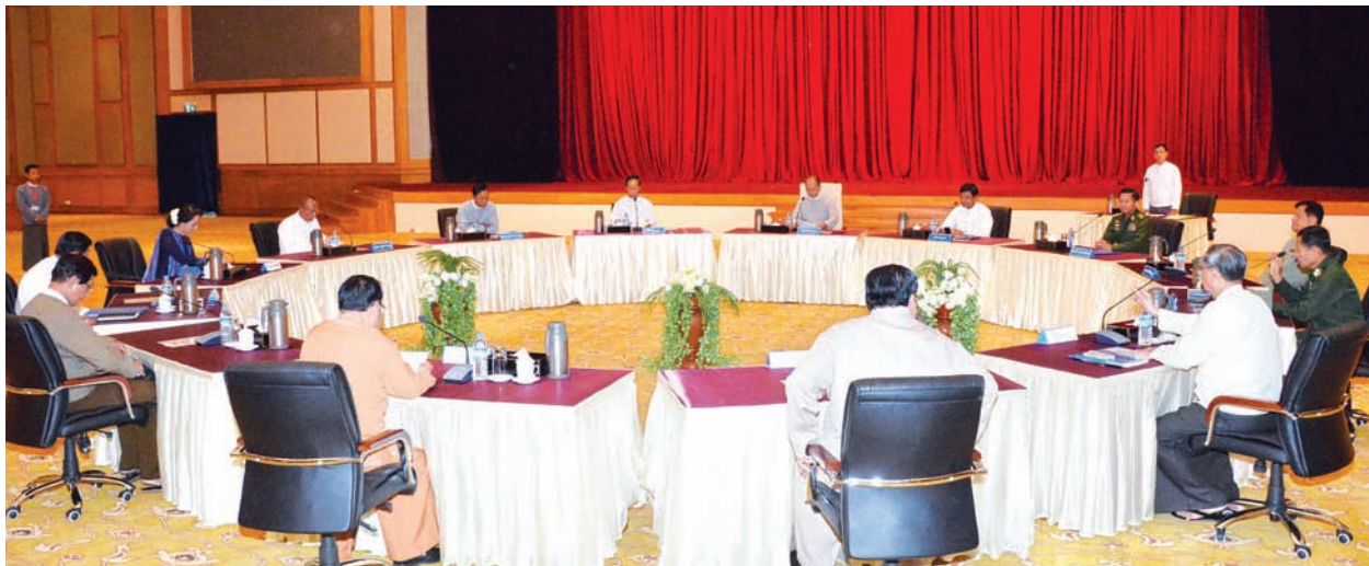
President U Thein Sein, Vice Presidents Dr Sai Mauk Kham and U Nyan Tun, state leaders and political leaders at political dialogue.