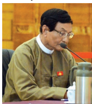
Representative of FDA U Khin Maung Swe.