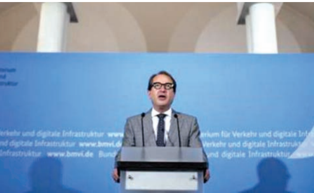
German Transport Minister Alexander Dobrindt addresses the media in Berlin on 30 Oct, 2014.

After months of heated debate between Chancellor Angela Merkel’s Christian Democrats (CDU) and their Bavarian sister party Christian Social Union (CSU),