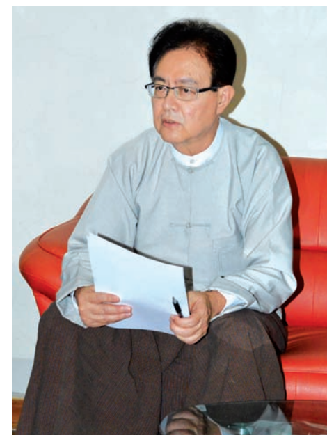
Deputy Minister for Foreign Affairs U Thant Kyaw.