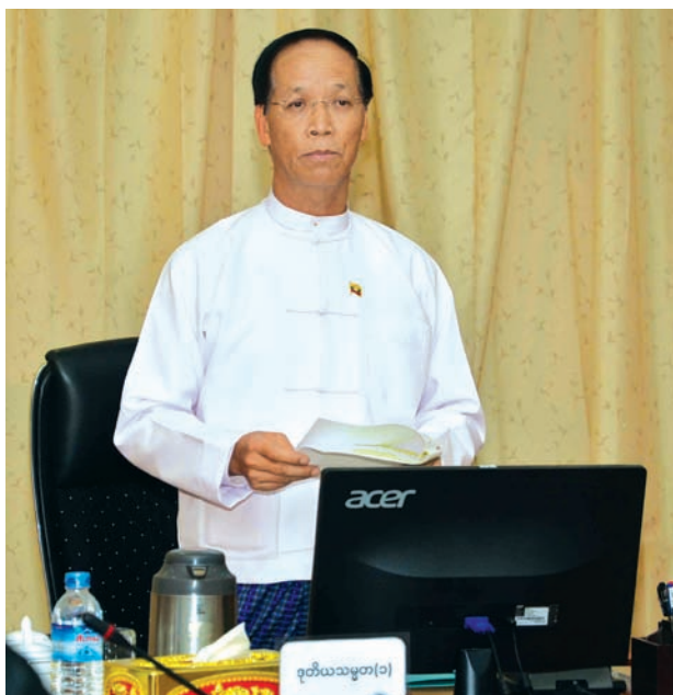
Vice President Dr Sai Mauk Kham delivers an address at 67 th Anniversary Independence Day Organizing Committee Meeting.