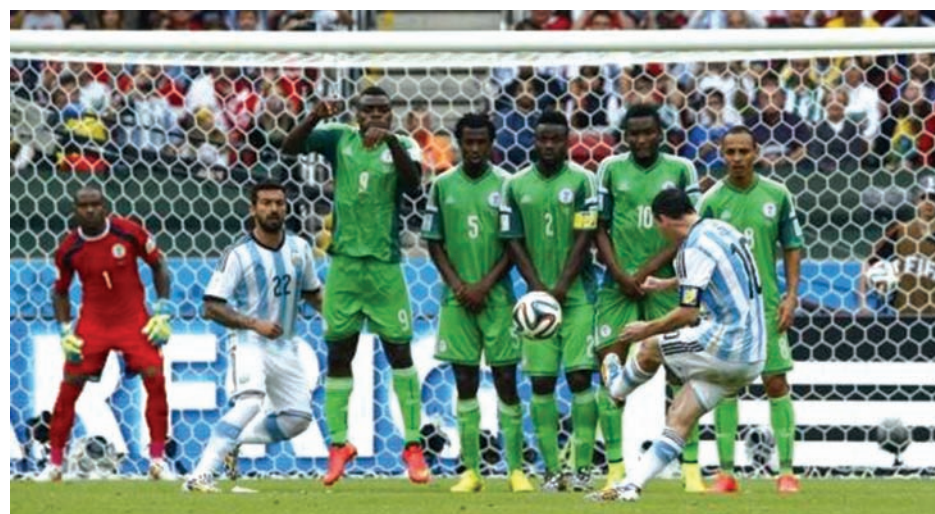
Argentina's Lionel Messi scores on a free kick during the 2014 World Cup Group F soccer match against Nigeria at the Beira Rio stadium in Porto Alegre on 25 June, 2014.