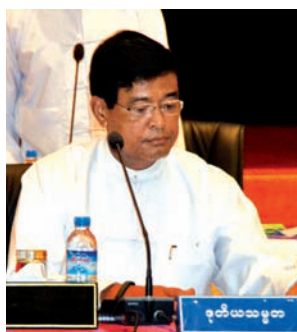
Vice President U Nyan Tun. MNA