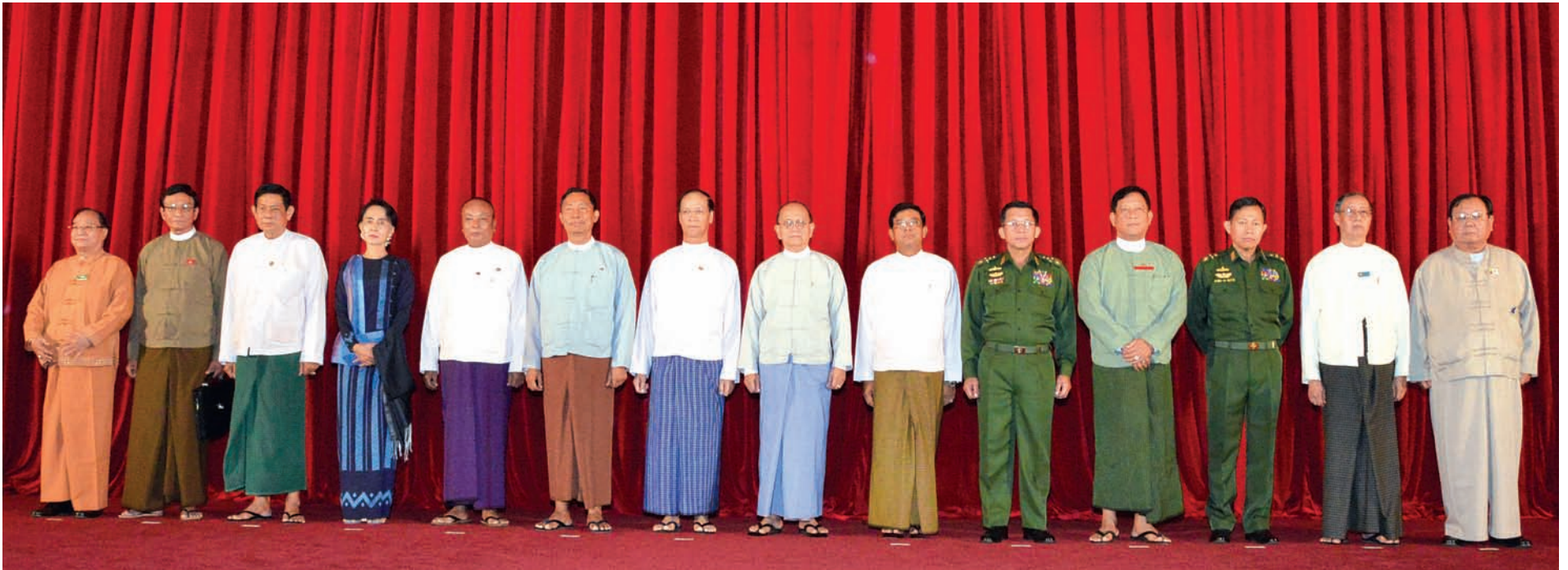
President U Thein Sein poses for documentary photo together with leaders of the State and political parties at political dialogue.—MNA