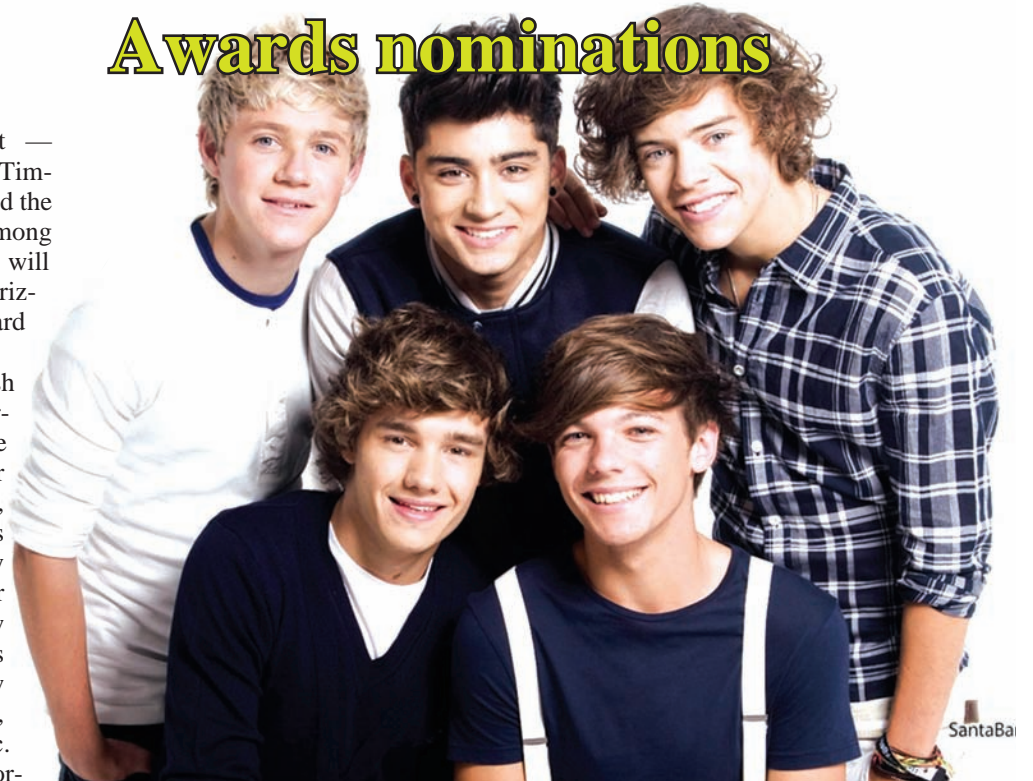
One Direction lead Billboard Touring Awards nominations.

LONDON, 31 Oct — One Direction, Justin Timberlake, Katy Perry and the Rolling Stones are among the headliners who will compete for major prizes at the 2014 Billboard Touring Awards.