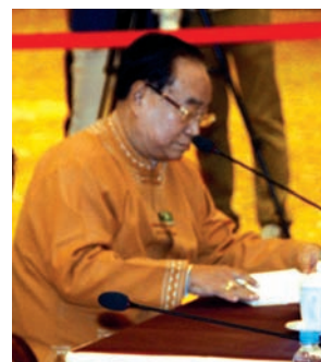
Representative of NBF U Sai Aik Paung.