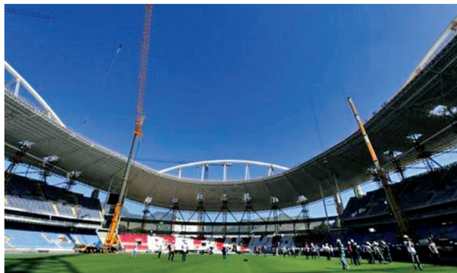
Members of the media visit the Joao Havelange Olympic Stadium, undergoing renovation to stage athletic competitions during the Rio 2016 Olympic Games, during the 2 nd world press briefing for the games in Rio de Janeiro on 6 Aug, 2014.