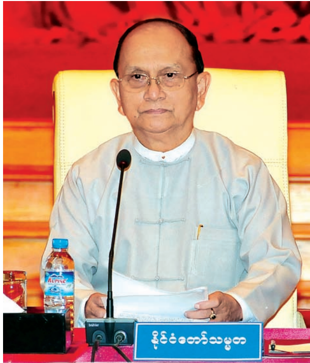
President U Thein Sein at political dialogue.

Also present at the dialogue were Vice Presidents Dr Sai Mauk Kham and U Nyan Tun, Speaker of Pyidaungsu Hluttaw and Pyithu Hluttaw