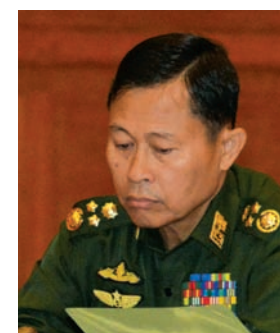
Vice Senior General Soe Win.