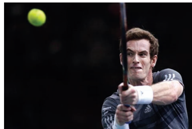
Andy Murray of Britain returns a shot during his men's singles tennis match against Grigor Dimitrov of Bulgaria in the third round of the Paris Masters tennis tournament at the Bercy sports hall in Paris, on 30 Oct, 2014.

Berdych kept his Tour Finals hopes alive with a 7-5, 6-3 win over Spain's Feliciano Lopez as did