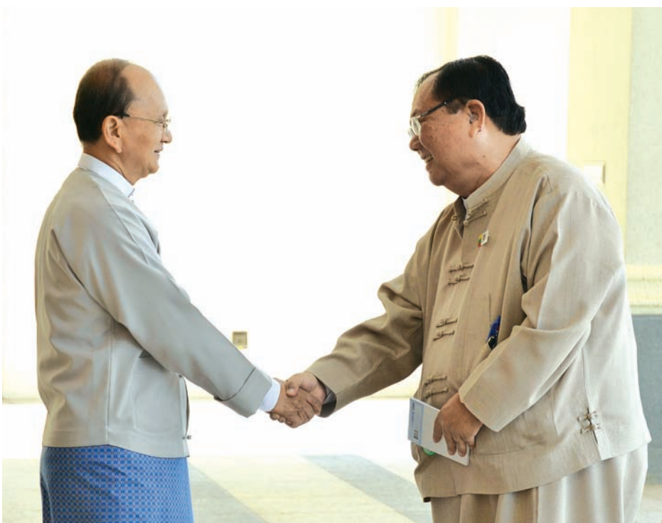
President U Thein Sein shakes hands with U Khun Tun Oo, representative of United Nationalities Alliance at political dialogue.

the political and peace processes. The reason that I am placing an emphasis on political stability during this time of transition is not because I want to restrict the rights of the people to organize political activities freely but because I want to make certain that the political reform process can move forward without any interruptions. I also want to note that we should take full advantage of the political openness we have achieved thus far to en-