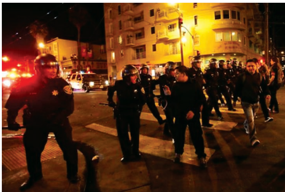
Police officers disperse a crowd in the Mission District, in San Francisco, California on 29 Oct, 2014.