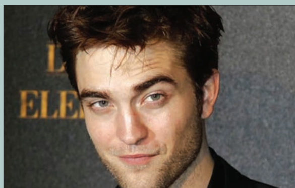
'Twilight' star Robert Pattinson

LONDON, 31 Oct — 'Twilight' star Robert Pattinson is reportedly moving to London to live with his rumoured girlfriend FKA Twigs.