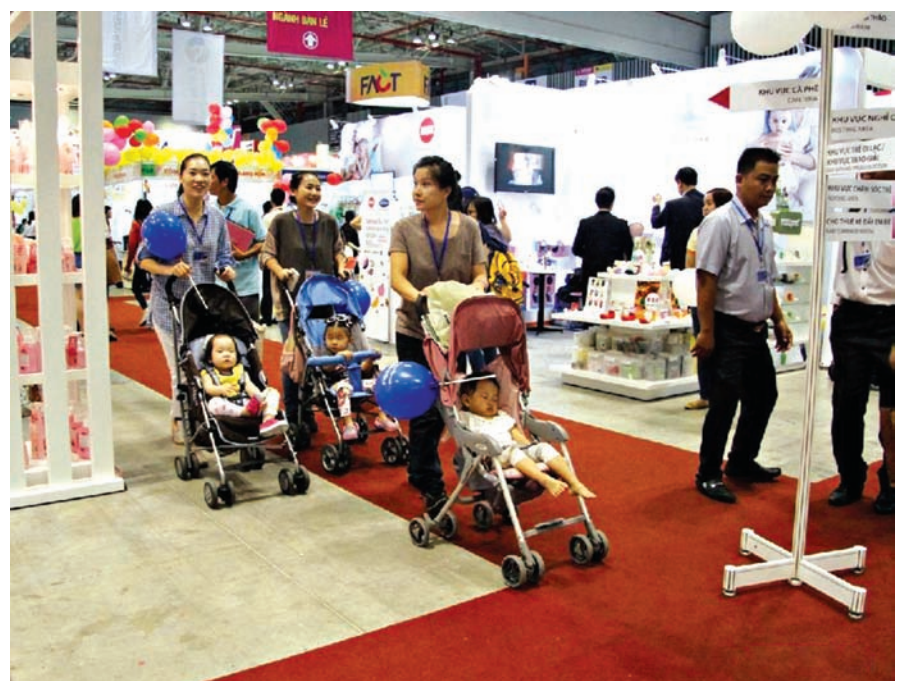
People visit an exhibitor's booth during the Vietnam International Baby and Kid Fair 2014 in Ho Chi Minh City, Vietnam, on 30 Oct, 2014. The exhibition runs from 30 Oct to 1 Nov, 2014.—XINHUA