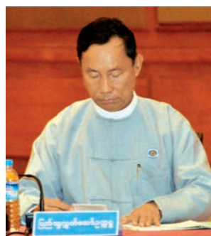
Pyidaungsu Hluttaw Speaker Thura U Shwe Mann.