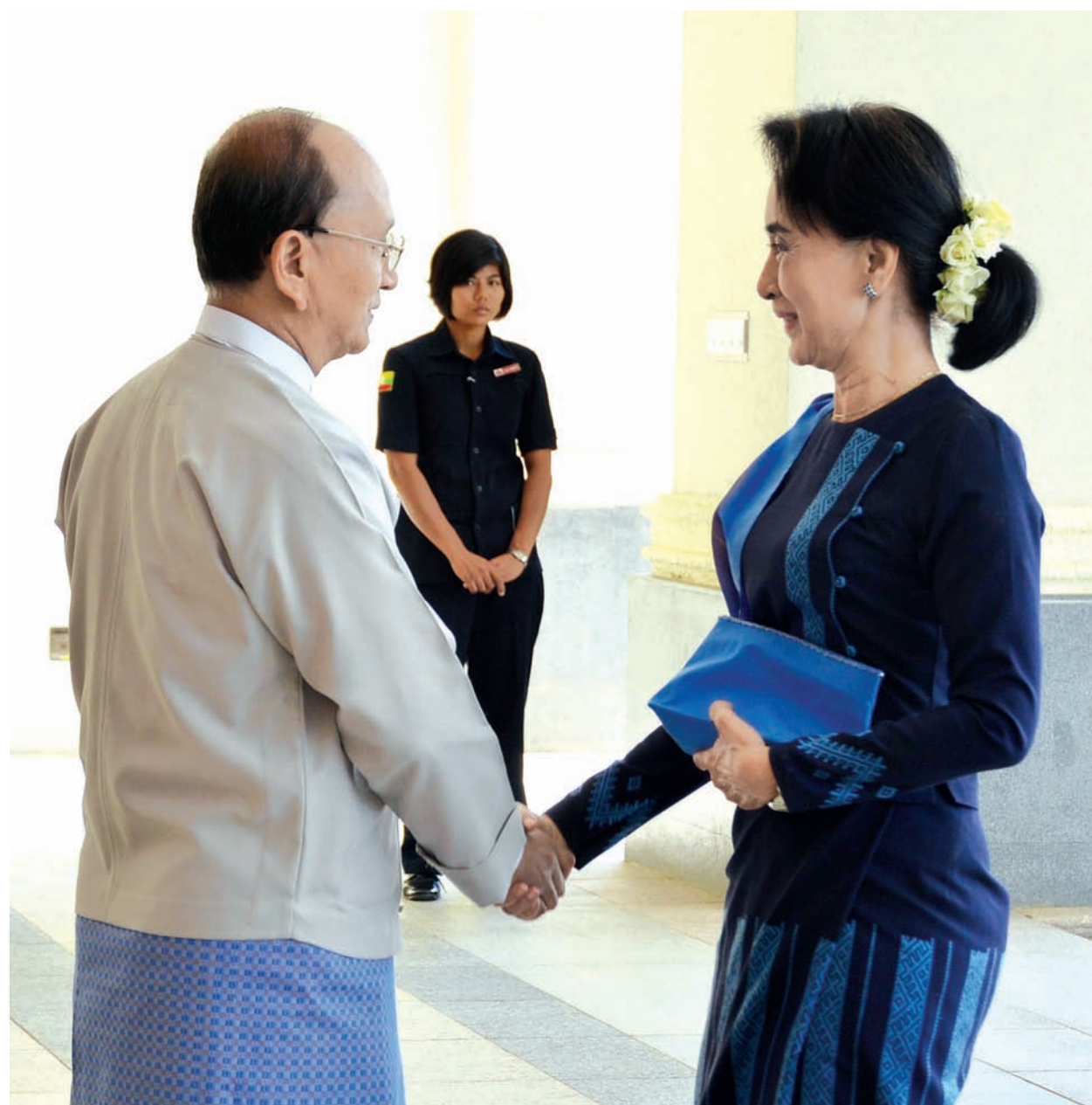
President U Thein Sein shakes hands with NLD Chairperson Daw Aung San Suu Kyi at political dialogue.

Since my administration came into power, we have tried to implement a holistic set of reforms after carefully considering from all perspective the ways