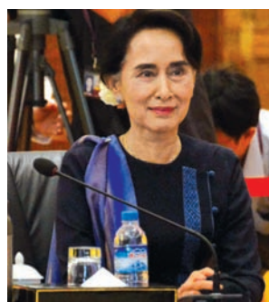
NLD Chairperson Daw Aung San Suu Kyi.