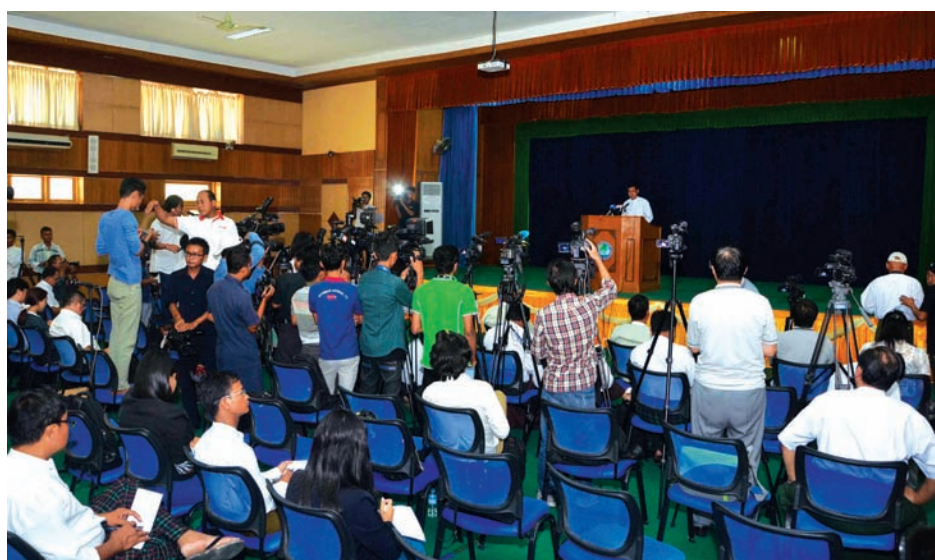
Union Minister for Information U Ye Htut clarifies discussions of State leaders and political party leaders at political dialogue. —MNA

The press conference drew 89 local and foreign journalists. —MNA