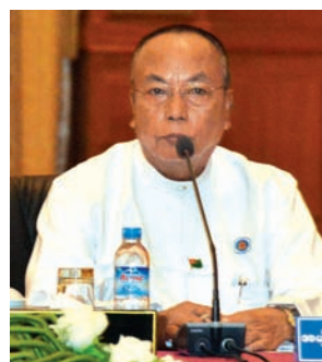
Speaker of Amyotha Hluttaw U Khin Aung Myint.