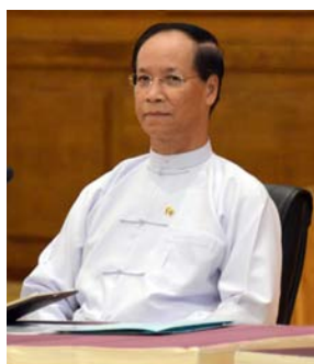
Vice President Dr Sai Mauk Kham.