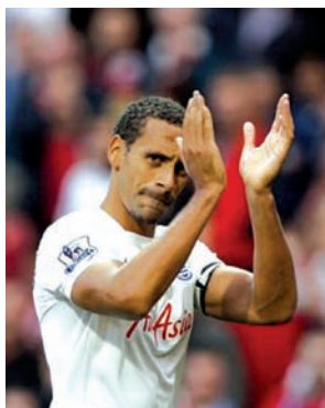
Queens Park Rangers' Rio Ferdinand

LONDON, 30 Oct — Queens Park Rangers defender Rio Ferdinand has been suspended for three matches and fined 25,000 pounds ($40,030) after he was found guilty of misconduct by the Football Association (FA) for