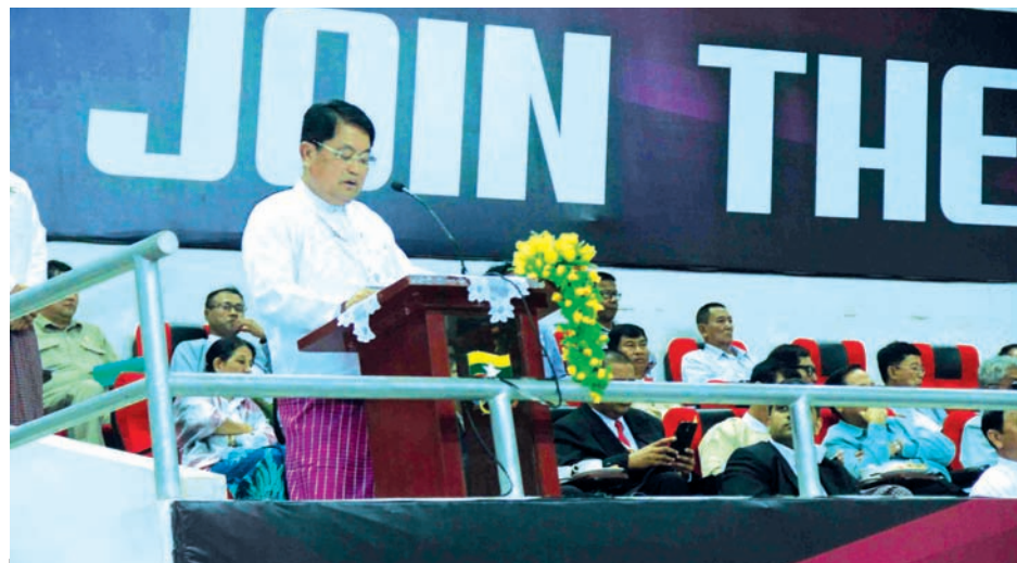
Union Minister for Sports U Tint Hsan delivers an address at ISTAF Super-Series Myanmar 2014-2015.