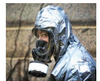
An emergency worker wears a hazmat suit during a mock “crisis response” exercise in Toronto, on 26 Oct, 2014.