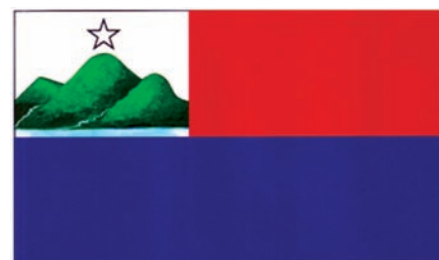
Flag of Wa National Unity Party