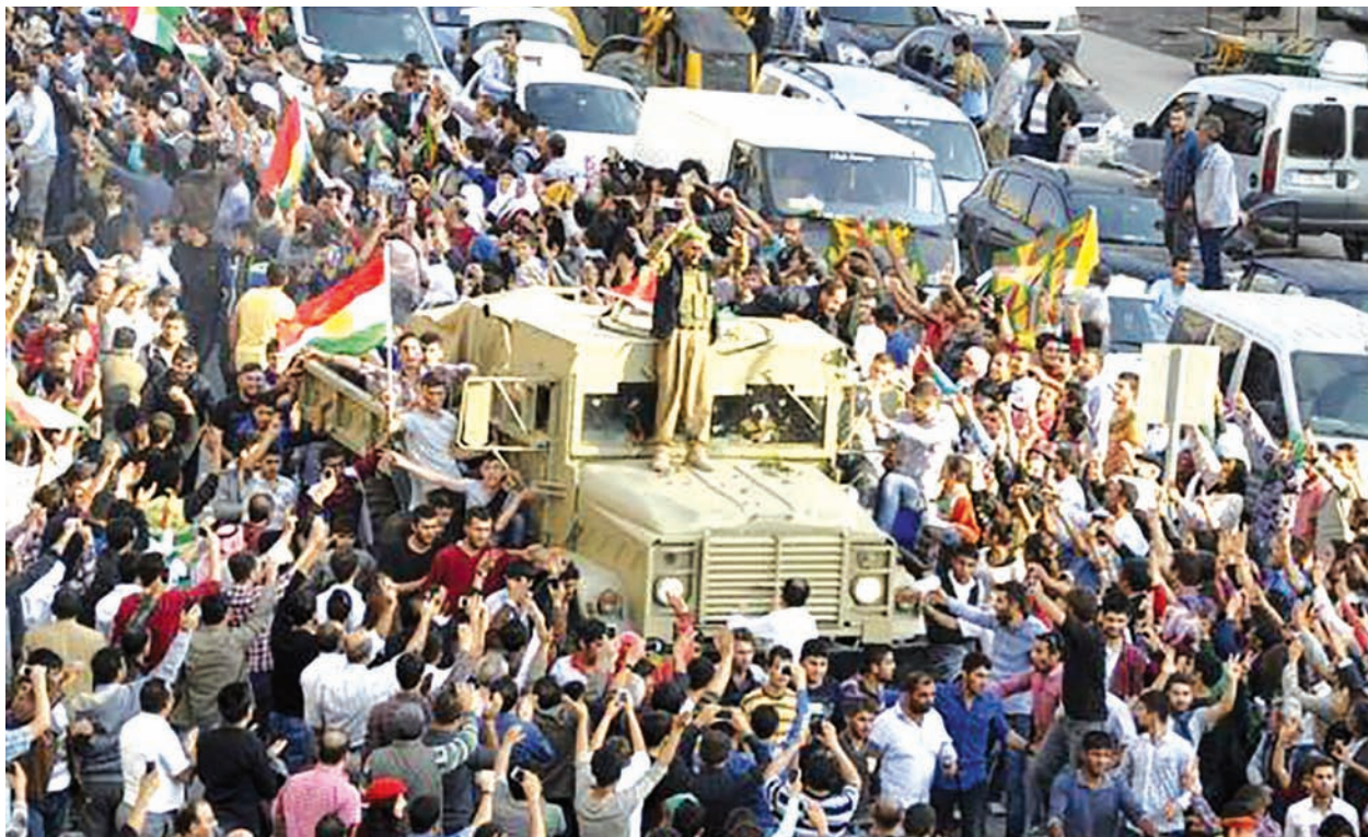
A convoy of peshmerga vehicles is escorted by Turkish Kurds on their way to the Turkish-Syrian border, in Kiziltepe near the southeastern city of Mardin on 29 Oct, 2014.

BEIRUT, 30 Oct — The first Iraqi Kurdish peshmerga fighters entered the besieged Syrian town of Kobani through the border crossing with Turkey on Thursday, the Syrian Observatory for Human Rights said.