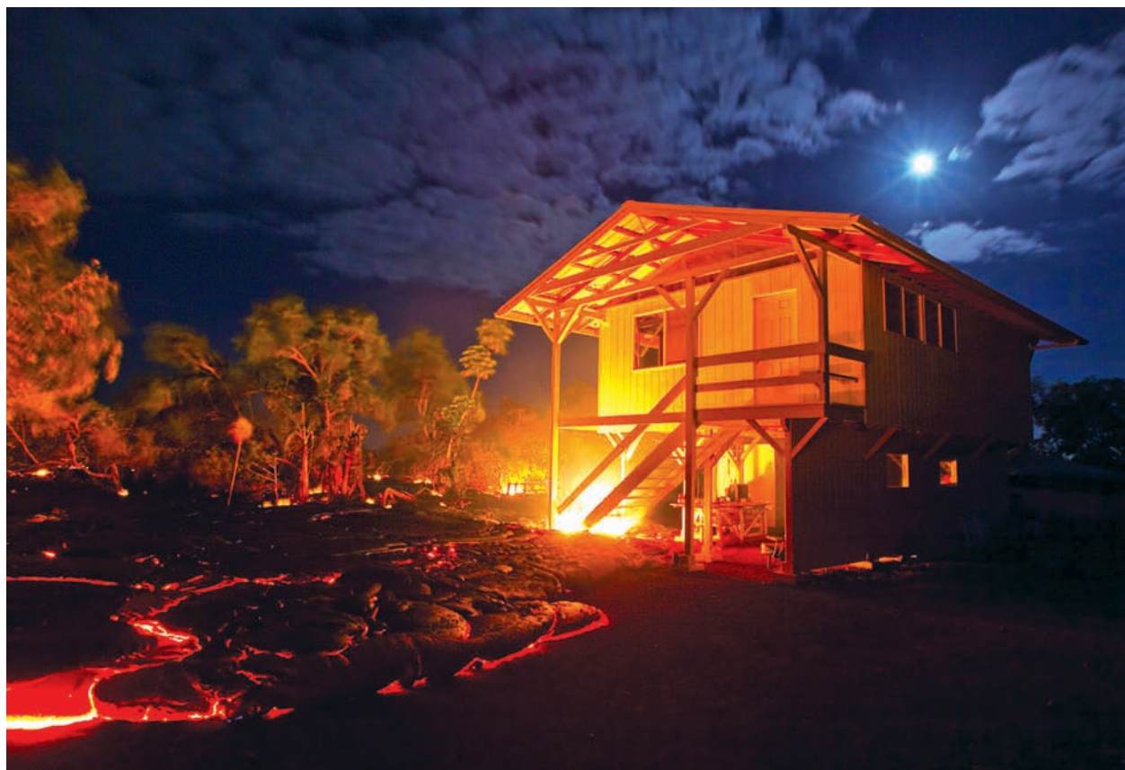
In this file photo, Lava surrounds the home of Gary Sleik and ignites the staircase, Kalapana Gardens, Hawaii.

PAHOA, (Hawaii), 30 Oct — A slow-moving river of molten lava from an erupting volcano crept over residential and farm property on Hawaii's Big Island on Wednesday after incinerating an outbuilding as it threatened dozens of homes at the edge of a former plantation town.