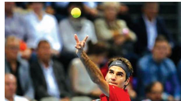
Switzerland's Roger Federer

"He was tough on the baseline early on," said Nishikori, adding that the hip he had injured felt fine after the match lasting nearly two hours. "But it all changed with (the first break point won). I tried to be more aggressive on my returns and kept moving my feet."