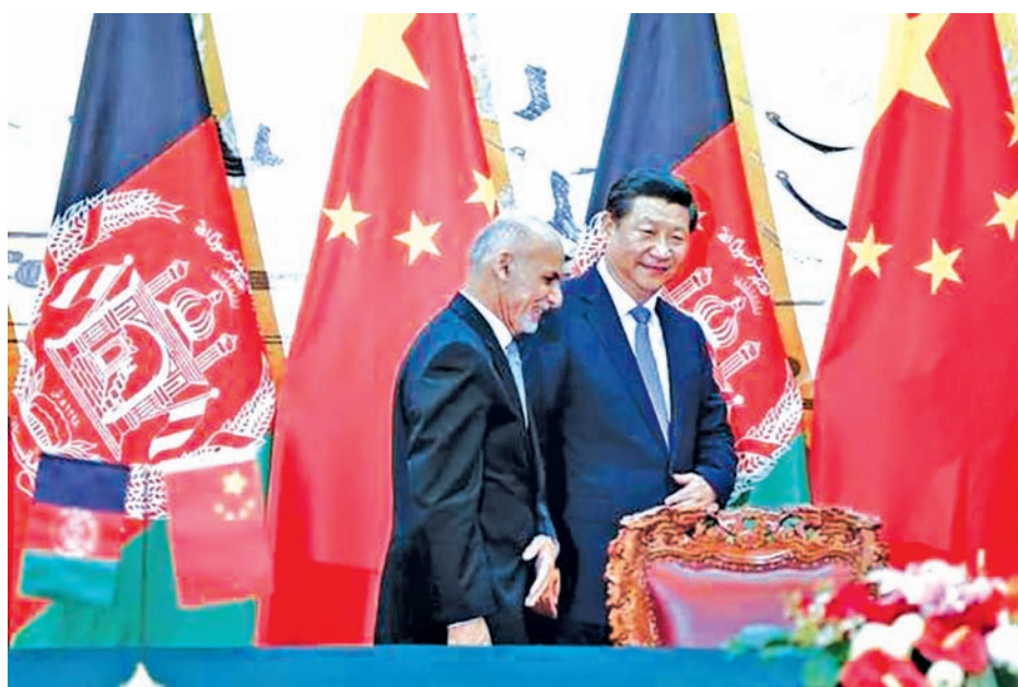
Chinese President Xi Jinping (R) and Afghan President Ashraf Ghani Ahmadzai attend a signing ceremony at the Great Hall of the People in Beijing on 28 Oct, 2014.

On Tuesday, China pledged to give Afghanistan $327 million in aid through 2017, more than the $250 million contribution it has so far offered since the fall of the hardline Islamist Taliban regime in 2001. "China's view of engaging in Afghanistan over the course of these past few years has really changed