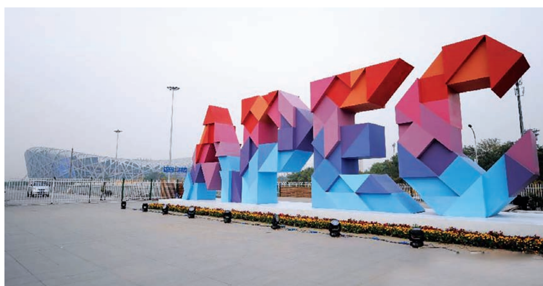
Photo taken on 29 Oct, 2014 shows the sign of APEC staged in Beijing Olympic Park.