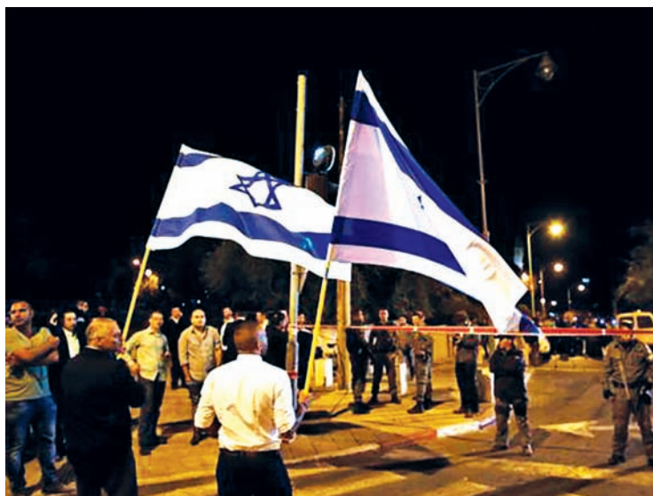
Israelis wave national flags next to security personnel securing an area in Jerusalem where a far-right activist was shot and wounded, on 29 Oct, 2014.

Seeking to avert friction, police took the exceedingly rare step of shutting the flashpoint holy site to all worshippers and visitors until further notice, after far-right Israeli activists urged adherents to respond to the shooting by heading en masse to the site on Thursday.—Reuters