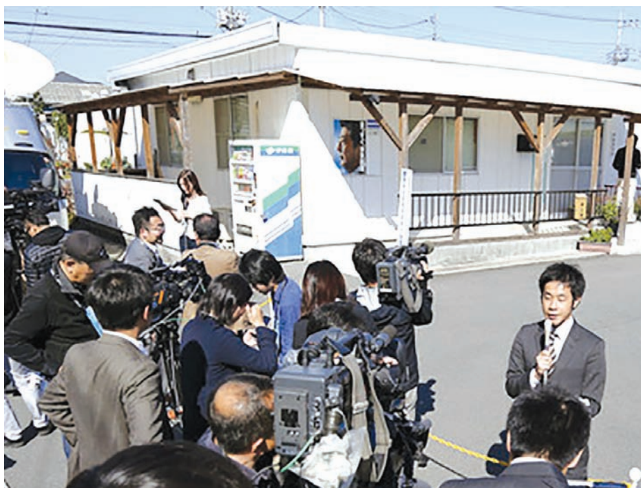
Photo shows the office of a group of supporters of former trade and industry minister Yuko Obuchi, in the city of Takasaki, Gunma Prefecture, on 30 Oct, 2014. Prosecutors raided the office the same day as they launched a formal investigation into irregularities in the political funds reports of groups related to Obuchi.