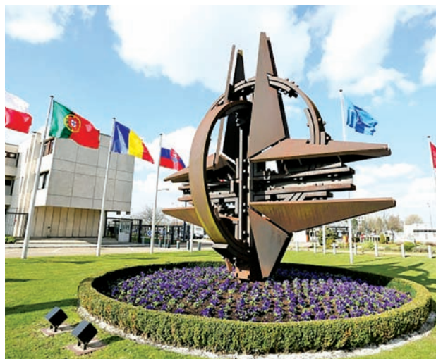
A report alleged that four groups of Russian warplanes held exhibition maneuvers over the Baltic, North, and Black Seas, as well as over the Atlantic Ocean on 28 October and 29 October.—REUTERS

BRUSSELS, 30 Oct — Allied Command of NATO's Armed Forces in Europe claims that it is registering an unusually high level of Russian Air Force activity in the skies over Europe.