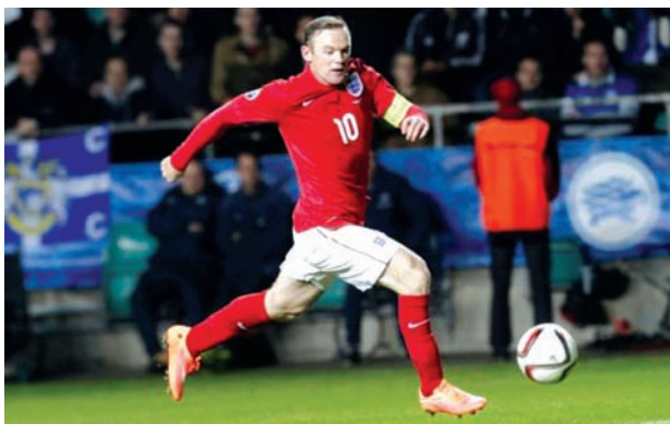
England's Wayne Rooney controls the ball during their Euro 2016 qualifying soccer match at the A. Le Coq Arena against Estonia in Tallinn on 12 Oct, 2014.

"It's a massive boost for us to have him back," United defender Luke Shaw told British media this week. "It's something I think he's