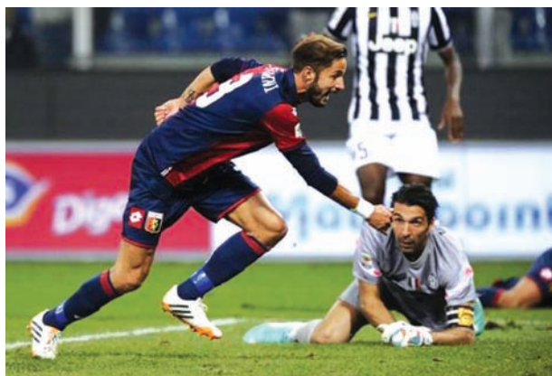
Genoa's Luca Antonini (L) shoots to score past Juventus' goalkeeper Gianluigi Buffon during their Italian Serie A soccer match at Luigi Ferraris Stadium in Genoa on 29 Oct, 2014.

Napoli, who beat Verona 6-2 on Sunday with an Higuain hat-trick, found life much tougher at Ata-