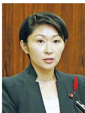
Former trade and industry minister Yuko Obuchi

TOKYO, 30 Oct — Prosecutors launched a formal investigation on Thursday into irregularities in the political funds reports of groups related to former trade and industry minister Yuko Obuchi, searching the home of her former secretary.