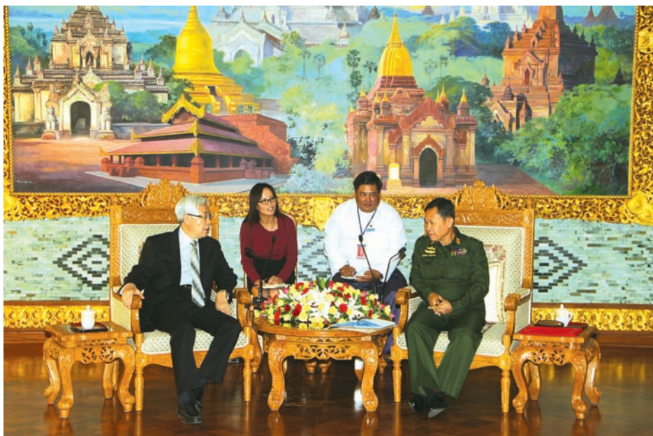
Vice-Senior General Soe Win holds talks with Mr Wang Yingfan, Special Envoy on Asian Affairs of the Ministry of Foreign Affairs of China.