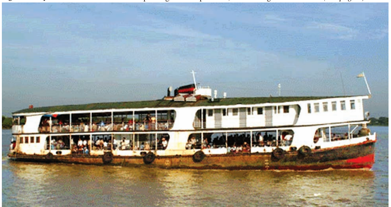
Inland Water Transport urgently needs to replace its decades-old ships running along the navigable waterways with modern and faster ones to recover from losses.