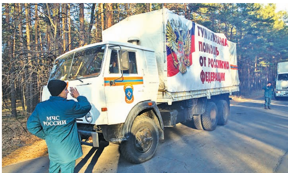
The convoy is carrying about 1,000 tonnes of cargoes — building materials, foodstuffs, medicines and equipment necessary to get prepared for the upcoming winter.

This is the fourth Russian humanitarian convoy to eastern Ukraine. The previous three convoys delivered an aggregate of 6,000 tonnes of cargoes — foodstuffs, including cereals and canned foods, medicines, electricity generators, warm clothes, bottled drinking water — to Donetsk and Lugansk.