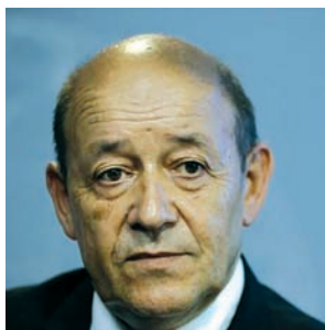
France's Defence Minister Jean-Yves Le Drian

PARIS, 30 Oct — France said on Wednesday a French soldier was killed during a fierce clash between its forces and Islamist militants in northern Mali earlier in the day. The offices of President Francois Hollande and Defence