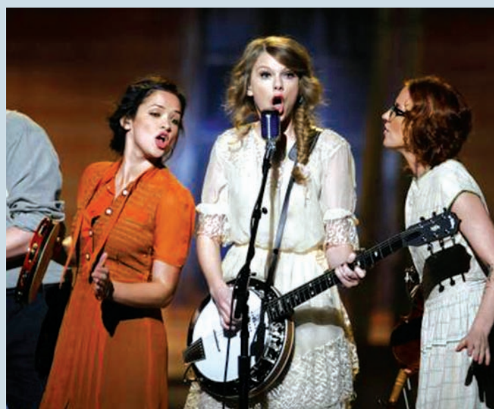
Taylor Swift performs “Mean” at the 46 th annual Academy of Country Music Awards in Las Vegas on 3 April, 2011.

thing Goes,” dropped to No 5 this week. For the week ending 19 October, overall album sales were down less than 1 percent from the comparable week in 2013 to 4.45 million, while year-to-date album sales tallied 193.4 million, down 14 percent from the comparable point last year.—Reuters