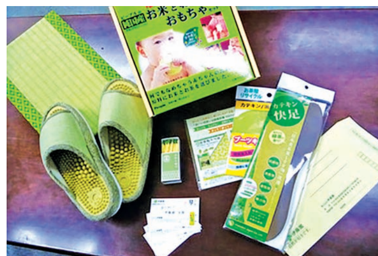
Photo shows products made from recycled tea leaves, which are known to have antibacterial and odor-killing effects.

“I would like to make the mat into a core business” of Ito En by recycling more used tea leaves, he said.