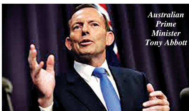
Australian Prime Minister Tony Abbott

Australian Prime Minister Tony Abbott told parliament at least 70 Australians were fighting in Iraq and Syria backed by about 100 Australia-based “facilitators”.