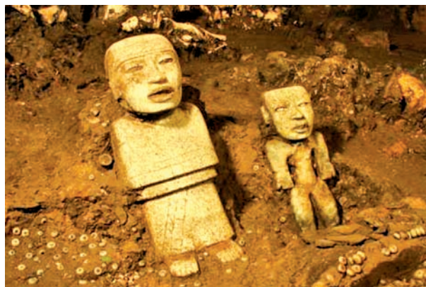
Stone figurines are seen in a tunnel that may lead to a royal tombs discovered at the ancient city of Teotihuacan, in this 19 Nov, 2013 National Institute of Anthropology and History (INAH) handout picture made available to Reuters on 29 Oct, 2014.