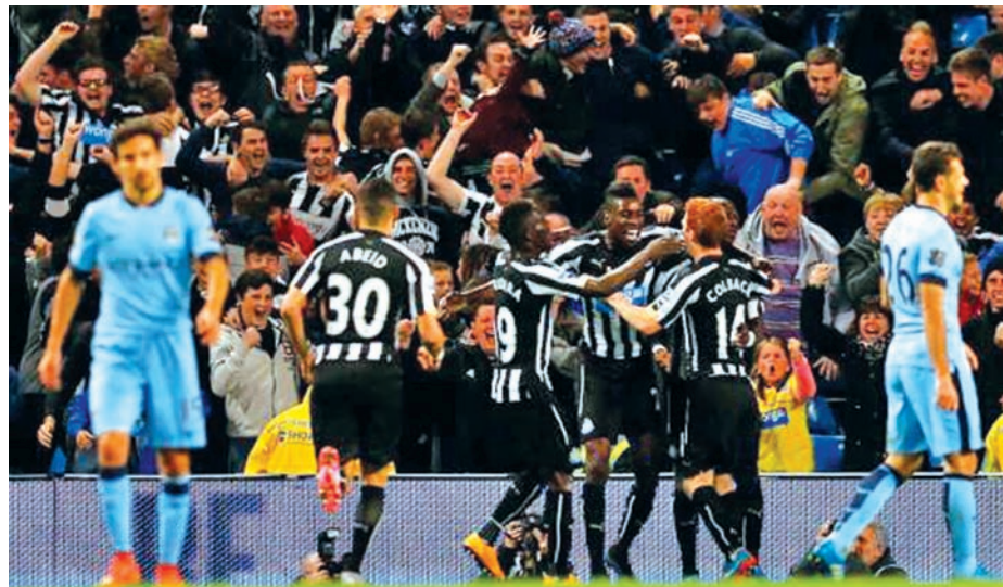
Newcastle United’s Moussa Sissoko (3 rd R) celebrates his goal against Manchester City with team mates during their English League Cup fourth round soccer match at the Etihad Stadium in Manchester, northern England on 29 Oct, 2014.