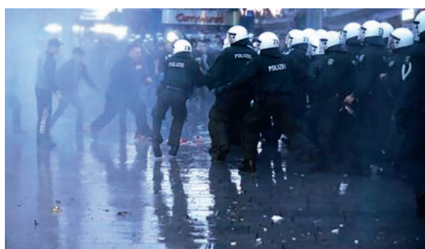
Riot police clash with protestors during a demonstration by 'hooligans against Salafists and Islamic State extremist' in Cologne on 26 Oct, 2014.

In Syria, the BND said fighting between IS and Kurdish forces in Kobani near the Turkish border showed that the militants