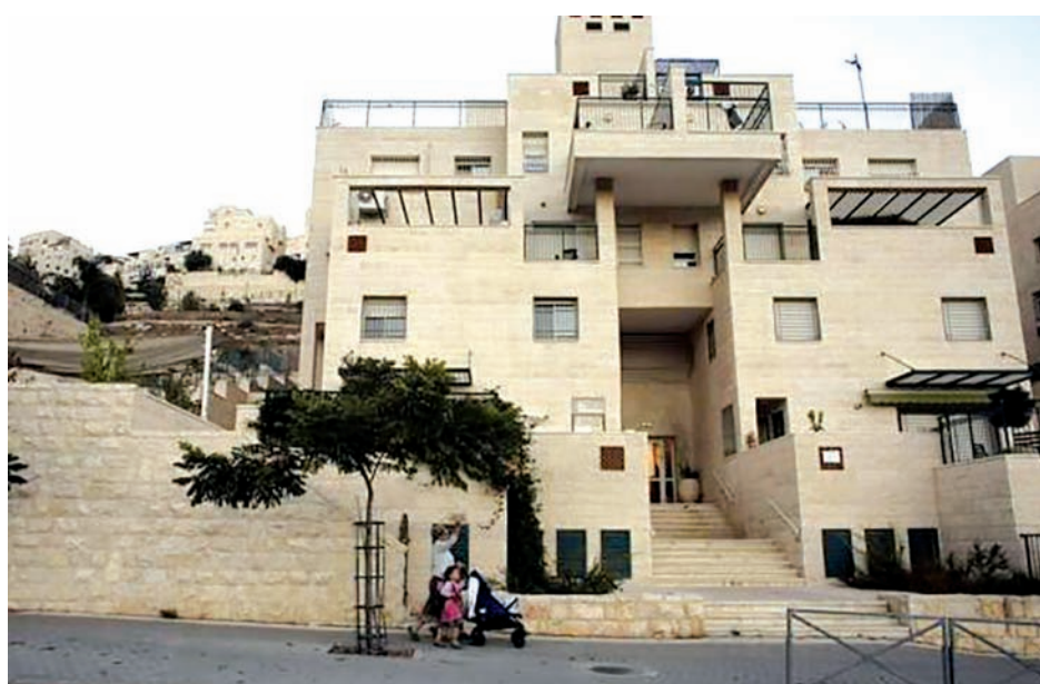
A woman pushes a pram as she walks in a Jewish settlement near Jerusalem known to Israelis as Har Homa and to Palestinians as Jabal Abu Ghneim on 27 Oct, 2014.

JERUSALEM, 28 Oct—Israeli Prime Minister Benjamin Netanyahu will expedite planning for some 1,000 settler homes in East Jerusalem, a government official said on Monday, in a bid to placate a restive coalition ally without further aggravating a dispute with Washington.