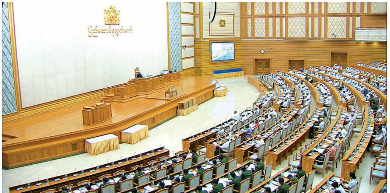
Representatives focus on discussions at Tuesday's session of Pyidaungsu Hluttaw.

Deputy Minister for Livestock, Fisheries and Rural Development, explained how his ministry is implementing the fight against