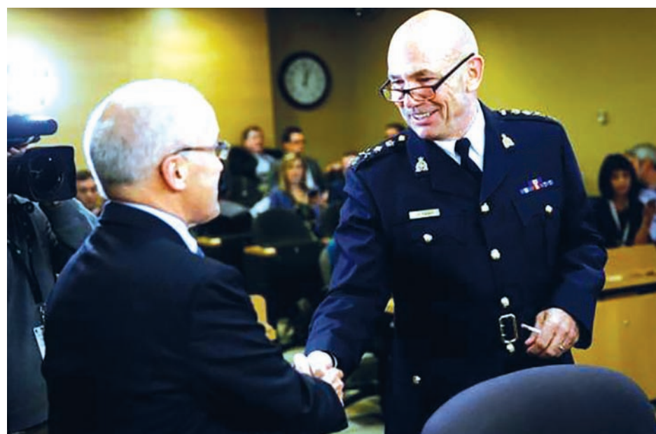
Royal Canadian Mounted Police Commissioner Bob Paulson (R) prepares to testify before a Senate committee in Ottawa on 27 Oct, 2014.

Lawmakers could help security agencies track suspected militants by making