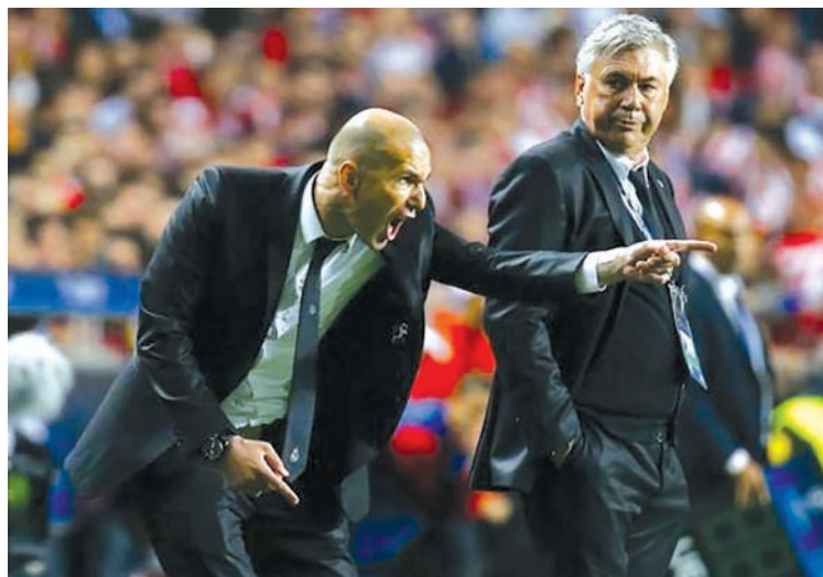
Real Madrid's coach Carlo Ancelotti (R) watches his assistant Zinedine Zidane shout at their players during their Champions League final soccer match against Atletico Madrid at Luz stadium in Lisbon, on 24 May, 2014.