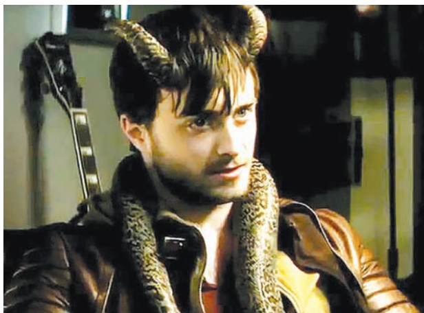
'Harry Potter' star Daniel Radcliffe

LONDON, 28 Oct — 'Harry Potter' star Daniel Radcliffe says more than the success of his films, he is proud of the fact that he learnt dancing for Broadway.