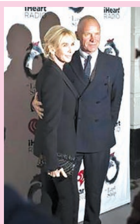
Singer Sting and his wife Trudie Styler