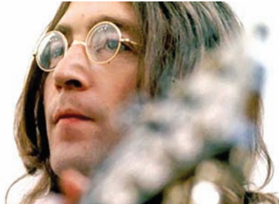
A pair of Beatle legend John Lennon's iconic glasses, which he lent to a flirty girl, will go on sale for 25,000 pounds.