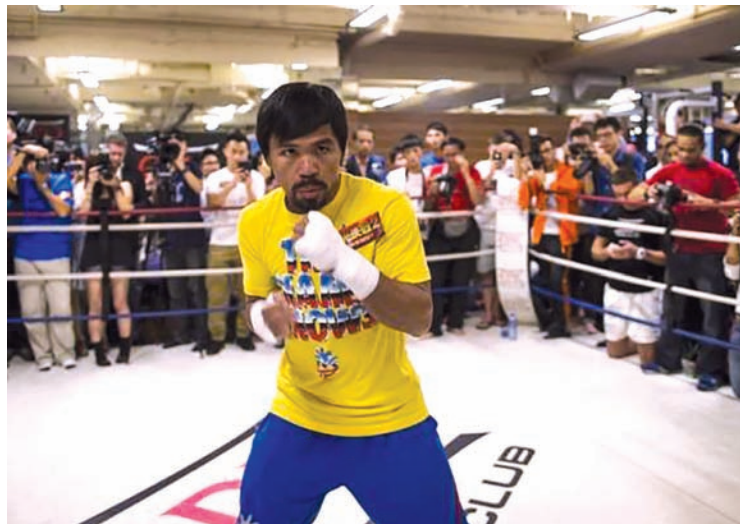
Boxer Manny Pacquiao of the Philippines trains during a media workout in Hong Kong on 27 Oct, 2014.

shape. Our strength coach came in 10 days before me. He started working him and by the time I worked with him, we were sparring 12 rounds in the mitts,” he added.