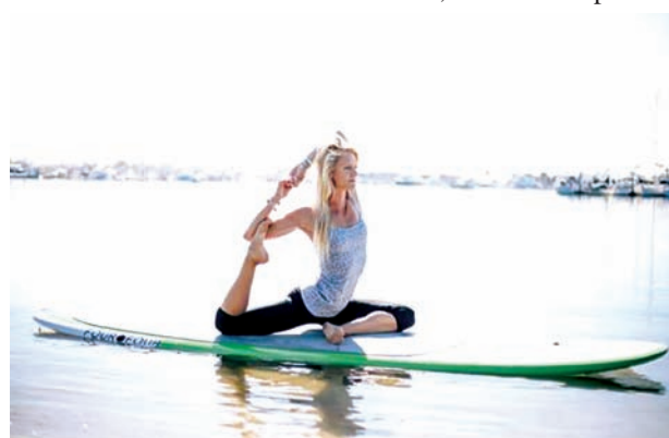
A model demonstrates a "Pigeon Pose" during a Paddleboard Yoga demonstration in San Diego Bay, California in this May 2014 handout photo provided by Shadow Van Houten on 24 Oct, 2014.

And while the classical techniques of yoga date back more than 5,000 years, a worldwide survey of more than 3,000 fitness profes-