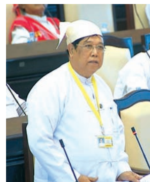
Deputy Minister for Construction U Soe Tint.