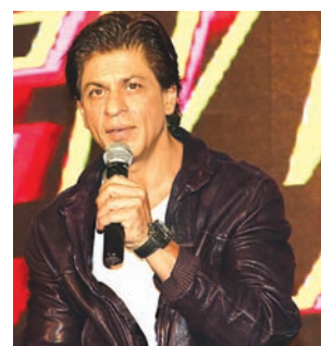
Shah Rukh Khan

"AbRam is looking adorable in the film. The best compliment I got was from Deepika. She said she wants to do her next film with him (AbRam) as she find him adorable," Shah Rukh Khan told reporters during the success party of