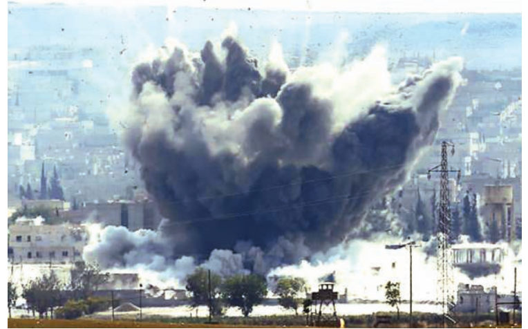
An explosion following an air-strike is seen in the Syrian town of Kobani from near the Mursitpinar border crossing on the Turkish-Syrian border in the southeastern town of Suruc in Sanliurfa province on 28 Oct, 2014.

"Equip and train the Free Syrian Army so that if ISIS (Islamic State) leaves, the regime should