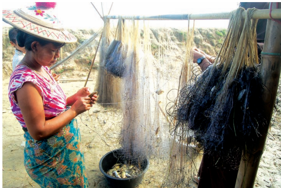
Family members of fisherman picking out fish as usual livelihood for earning their income through sales of fish and fish products in rural area of Bago Township.