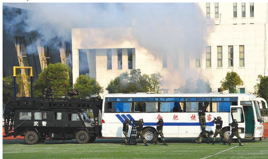
Policemen attend an anti-terror drill in Hefei, capital of east China's Anhui Province, on 26 Oct, 2014.