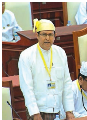
Deputy Ministry for Electric Power U Maw Tha Htwe.—MNA

Deputy Minister for Electric Power U Maw Tha Htwe responded to the question of U Khaing Maung Yi, representative of Ahlon constituency, saying that compensations to the ministerial staff for the loss of their lives or properties caused by electricity are carried out in accordance with the rules and regulations of ministry and those to the public are reimbursed from the social funds.