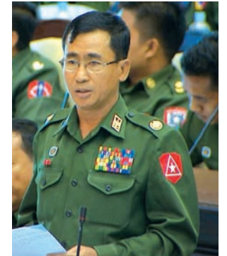
Defence Services Personnel representative Brig-Gen Aung Kyaw.

NAY PYI TAW, 28 Oct—With regard to the question raised by Defence Services Personnel representative Brig-Gen Aung Kyaw at Tuesday's session of Amyotha Hluttaw (Upper House), Deputy Minister for Construction U Soe Tint replied that a plan is underway to upgrade Mongphyat-Mongyawng road to the asphalt road for smooth transport of local people by demanding the fund.