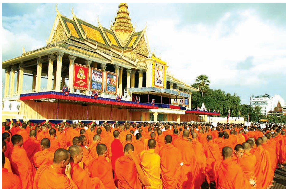
Monks gather in front of the Royal Palace in Phnom Penh, Cambodia, on 28 October, 2014. Hundreds of Cambodian Buddhist monks chanted in religious language in front of the Royal Palace here on Tuesday to bless the nation's King Norodom Sihamoni on the occasion of the 10th anniversary of his coronation.