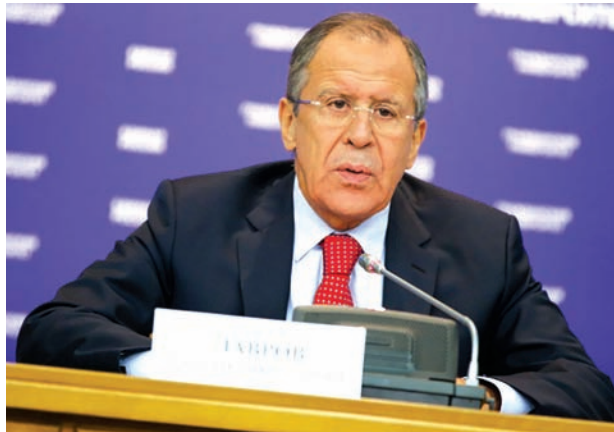
Russian Foreign Minister Sergey Lavrov

MOSCOW, 28 Oct — Russian Foreign Minister Sergey Lavrov hopes that Ukraine's new coalition government will include ministers committed to the course of achieving peace. He said it in an interview