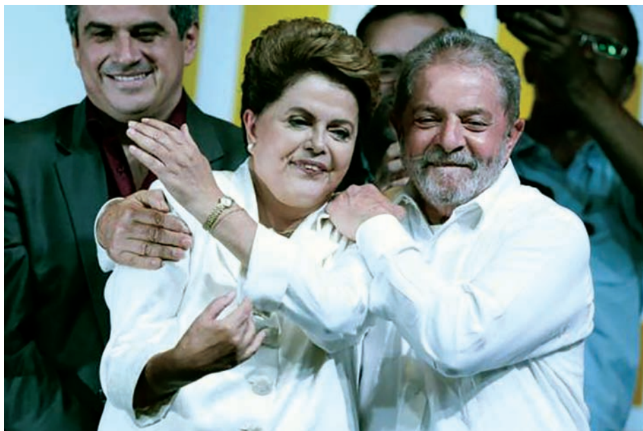
Former president Luiz Inacio Lula da Silva congratulates Brazil's President and Workers' Party (PT) presidential candidate Dilma Rousseff (L) during news conference after disclosure of the election results, in Brasilia on 26 Oct, 2014.

The benchmark Bovespa stock index fell 5 percent in early trade and closed 2.72 percent lower while the real currency ended at 2.52 per dollar, its weakest level since April 2005. Both had already seen heavy losses in recent sessions as Rousseff took a lead in polls.