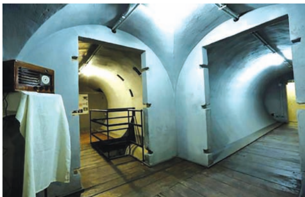
A passageway is pictured inside a secret bunker of Fascist leader Benito Mussolini that was built between 1942 and 1943 under his private residence at Villa Torlonia in Rome, on 25 Oct, 2014.

Two other shelters, which opened briefly in 2006 and had to close because of environmental problems, are due to reopen on the same date.