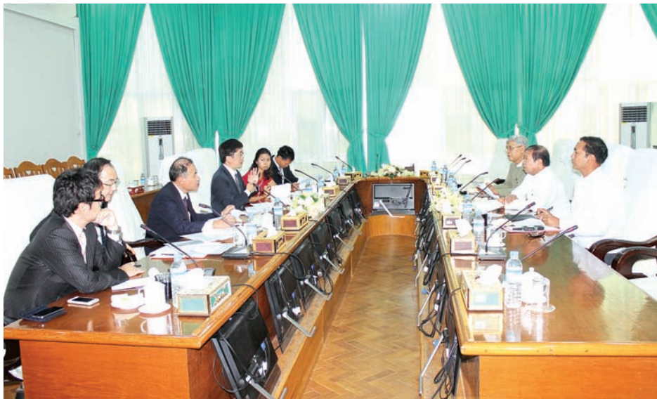
Union Minister U Aye Myint holds talks with Japanese delegates from Dawei Institute of Research and Deloitte Tohmatsu Consulting Co., Ltd on Dawei SEZ project.

Yangon, 28 Oct—Union Minister for Labour, Employment and Social Security U Aye Myint on Tuesday met Japanese delegates from Dawei Institute of Research and Deloitte Tohmatsu Consulting Co., Ltd at the ministry here to discuss the progress of research projects to implement the Dawei Special Economic Zone success-