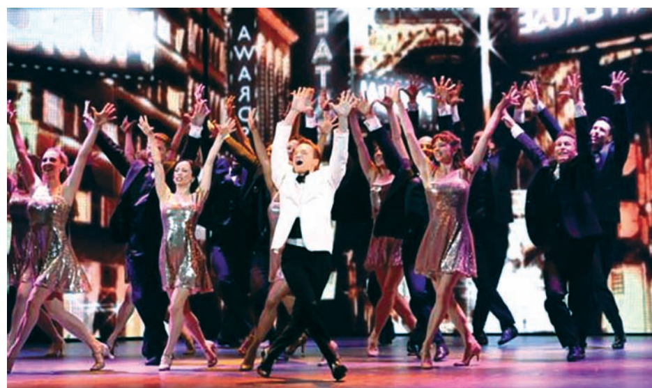
Neil Patrick Harris has been tapped to host next year's Academy Awards ceremony, say the organizers of Hollywood's biggest night.

episodes of the US series from ITV Studios America, which will be filmed in front of a live audience. No air date has been scheduled yet.