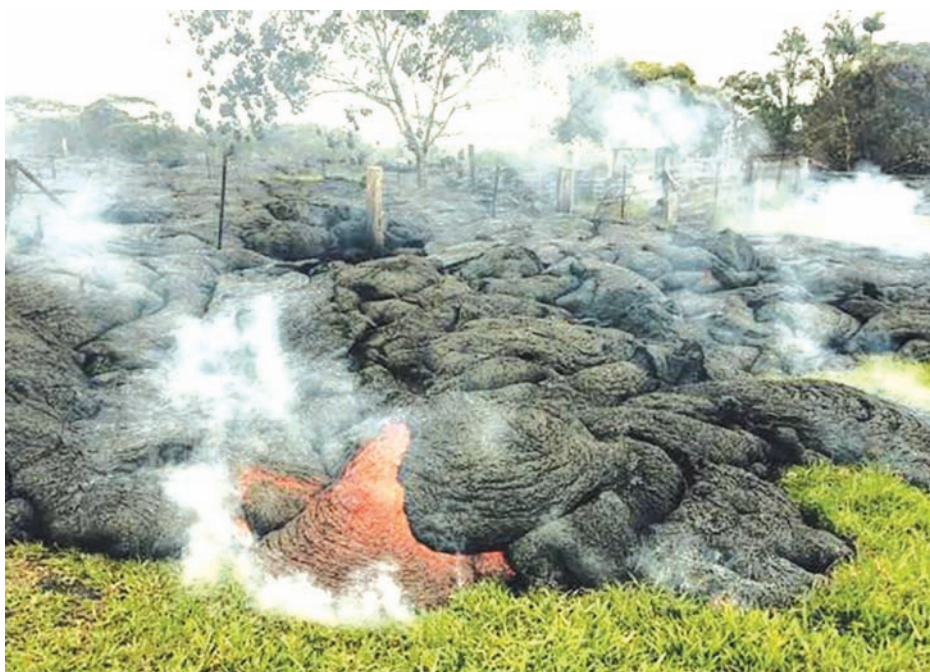
The lava flow from the Kilauea Volcano is seen in a US Geological Survey (USGS) image taken near the village of Pahoa, Hawaii, at 10:00HST (20:00GMT) on 26 Oct, 2014.

The leading edge of the flow, which is about 110 yards wide and spreading, has overrun a cemetery on its path toward Pahoa village, a historic former sugar plantation consisting of small shops and homes