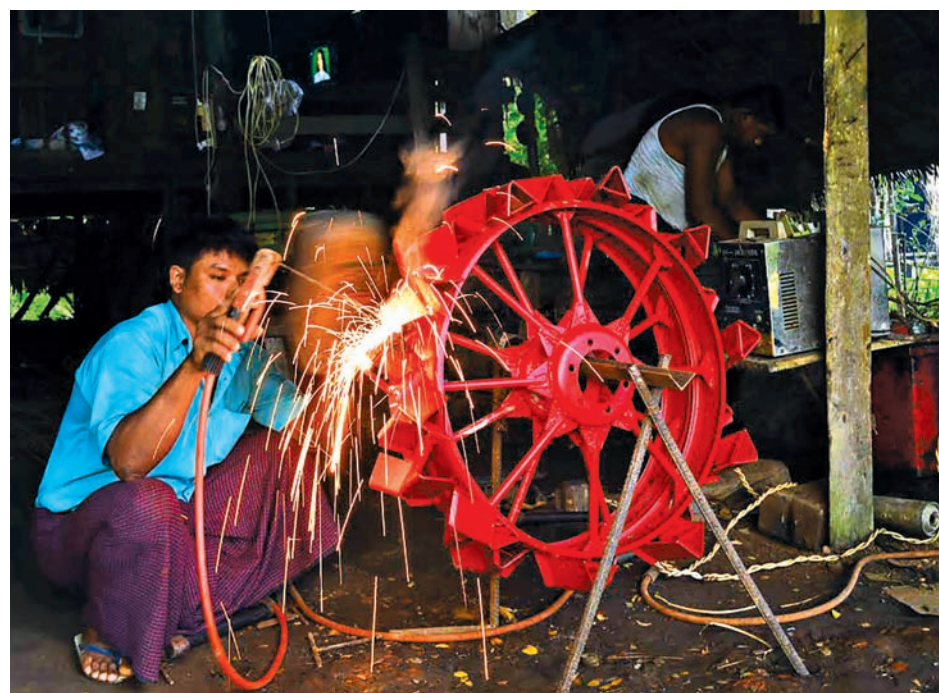
A worker of blacksmith welding a machine part of power-tiller at the workshop in Kawa Township.

plicants may submit applications to the committee not later than 30 November 2014. —Maung Pyi Thu (Mandalay)