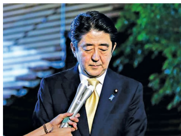
Japan’s Prime Minister Shinzo Abe reacts as he speaks to the media at his official residence in Tokyo on 20 Oct, 2014.

Abe hopes to contain the damage through swift replacements of the two, but other cabinet members including Defence Minister Akinori Eto, Ag-