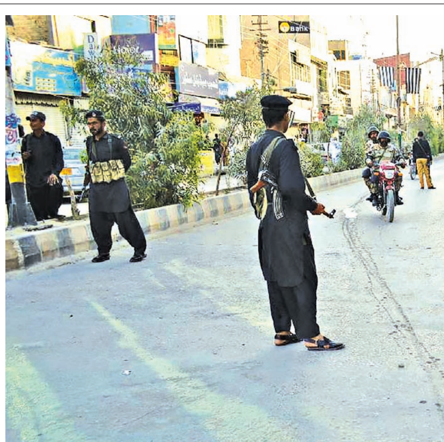
A Pakistani soldier stands guard on the road due to high-level security alerts on the first day of Muslims month of Muharram in southwest Pakistan's Quetta on 26 Oct, 2014.—XINHUA

The indirect Israeli-Palestinian dialogue was a resumption of the talks that led to an Egypt-brokered cease-fire agreement, which ended the latest 50-day large-scale Israeli air and ground offensive on the Gaza Strip in August. More than 2,000 Palestinians were killed, 11,000 others wounded and over 100,000 displaced during the conflict, while Hamas attacks also killed at least 73 Israelis.—Xinhua