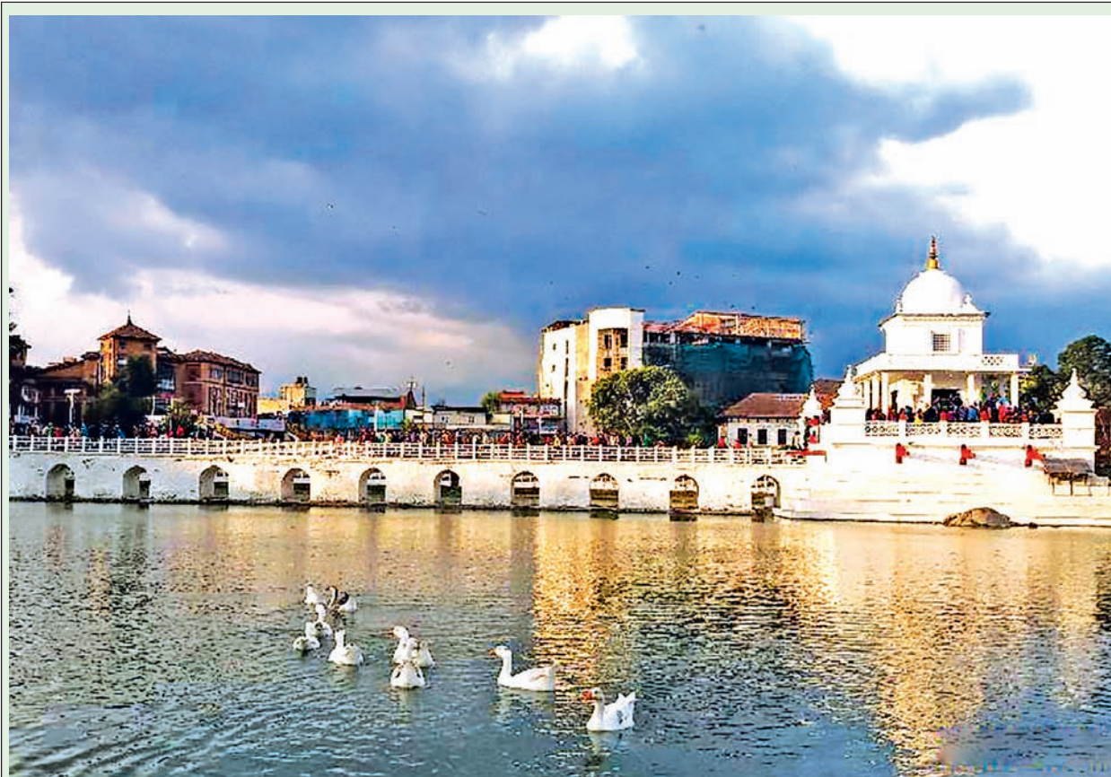
Nepalese people are seen visiting Yamleshwor Temple for offerings during “Bhai tika”, the fifth and last day of Tihar festival at Ranipokhari in Kathmandu, Nepal, on 25 Oct, 2014. Nepalese people visit this temple to receive blessings and Tika at the temple which opens for the day once in a year.

Local media said an estimated 500 British people have traveled to Iraq and Syria to join IS, while study suggested that 24 Britons were believed to have died.