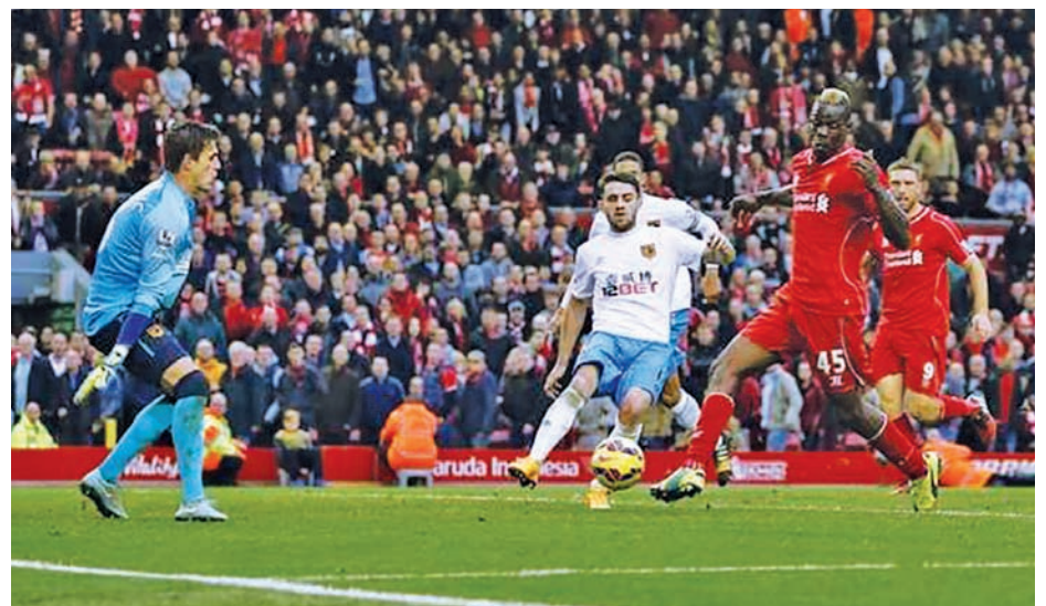
Liverpool's Mario Balotelli (2 nd R) misses the chance to score during their English Premier League soccer match against Hull City at Anfield in Liverpool, northern England on 25 Oct, 2014.

best player," said Bruce. "There is a lot written about him and a lot of debate about him and he is