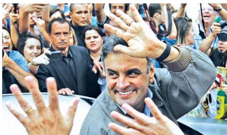
Brazil's presidential candidate Aécio Neves of Brazilian Social Democratic Party (PSDB) greets supporters in Sao Joao del Rei on 25 Oct, 2014.

RIO DE JANEIRO, 26 Oct — Brazilians vote on Sunday in a bitterly-contested election that pits a leftist president with strong support among the poor against a centrist senator who is promising pro-business policies to jumpstart a stagnant economy.