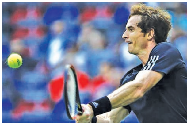
Andy Murray of Britain returns a shot during his men's singles tennis match against David Ferrer of Spain at the Shanghai Masters tennis tournament in Shanghai on 9 Oct, 2014.

Top-seeded Spaniard Ferrer, who was chasing a