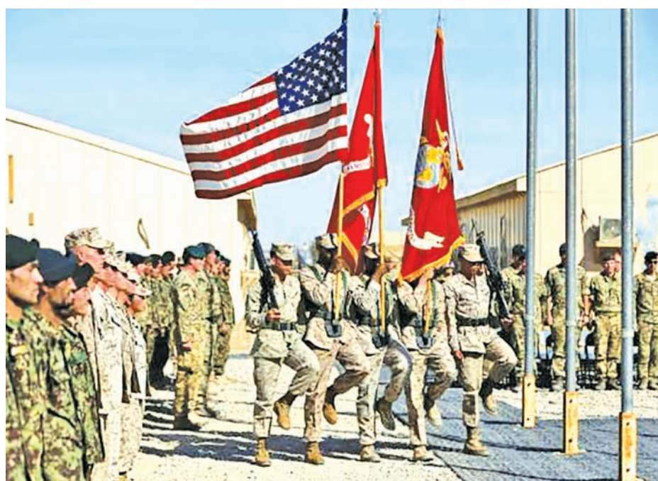
US Marines march with flags during a handover ceremony, as the last US Marines unit and British combat troops end their Afghan operations, in Helmand on 26 Oct, 2014.

After the withdrawal, the Afghan National Army's 215 th Corps will be headquartered at the 6,500-