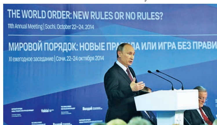
Russian President Vladimir Putin

So the US efforts have brought about a rather dangerous situation in the new, altered world and urgent stabilization is much needed here so that to return to the principles of international law and to revive undermined respect for sovereignty.— Itar-Tass