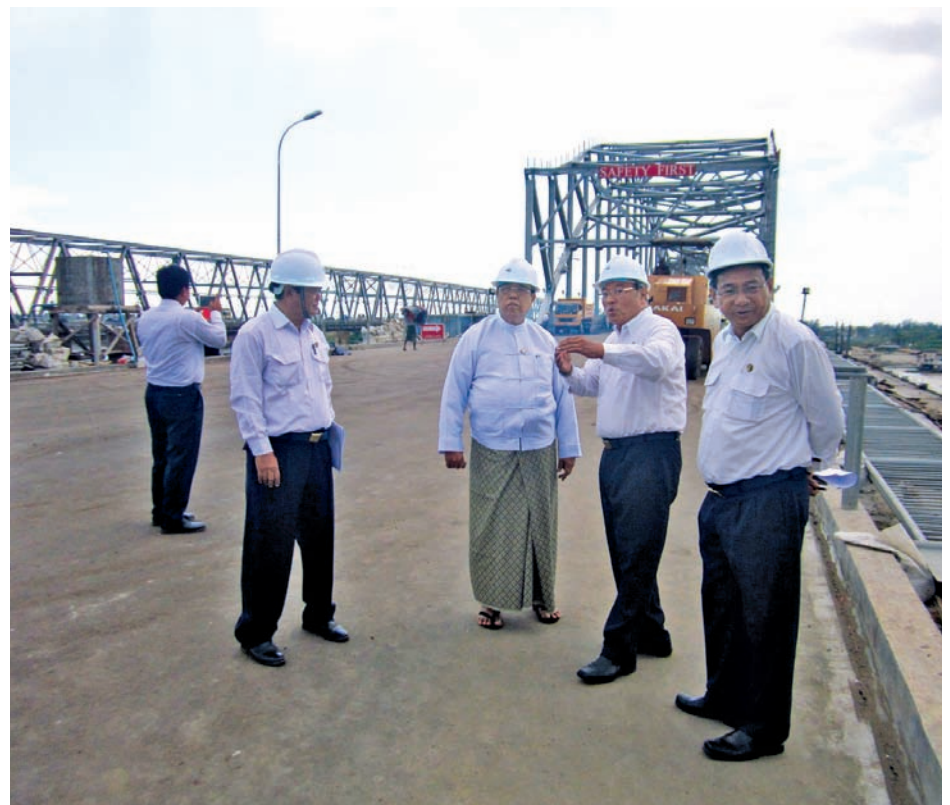
Deputy Minister for Construction U Soe Tint inspects progress of Bayintnaung Bridge-2.

ciation, highway bus association and departmental officials participated in dis-