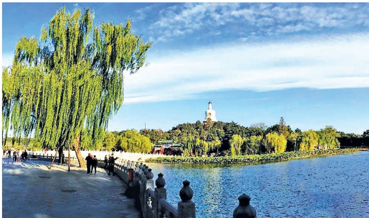
Photo taken on 26 Oct, 2014 shows the Beihai Park under the clean and blue sky in Beijing. Thanks to overnight wind which dispersed the week-long smoggy weather, Beijingers finally see crystal blue and sunny sky on this Sunday.