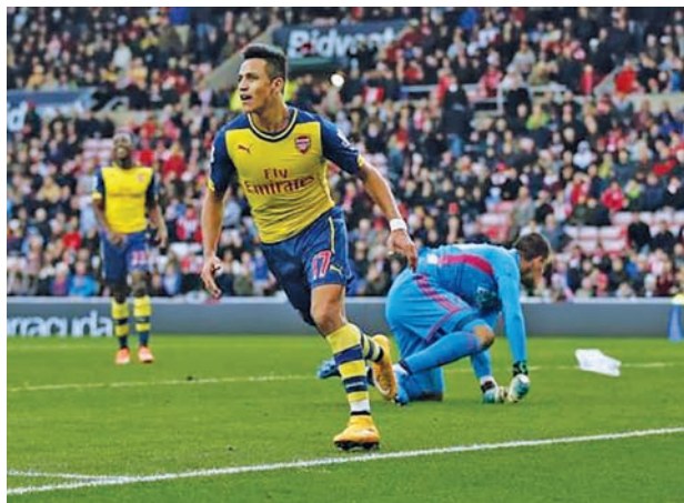
Arsenal's Alexis Sanchez (C) celebrates after scoring his second goal past Sunderland goalkeeper Vito Mannone during their English Premier League soccer match at the Stadium of Light in Sunderland, northern England on 25 Oct, 2014.

For Sunderland manager Gus Poyet, though, there was only more dismay as he watched his side try valiantly to bounce back from their humiliation at St Mary's only to be undone by two awful errors.—Reuters