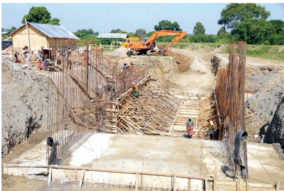
Speaker of Amyotha Hluttaw (Upper House) U Khin Aung Myint views construction works during his inspection tour of Yamethin Township.