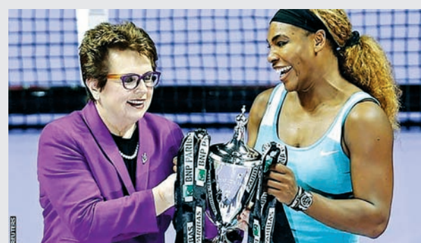
Serena Williams (USA) at the trophy presentation after the 2014 WTA tennis tournament in Singapore on 26 Oct, 2014.

Halep shocked Williams 6-0 6-2 in the group