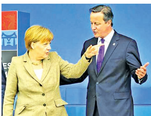
German Chancellor Angela Merkel and Britain's Prime Minister David Cameron (L).

The Sunday Times has previously reported that Cameron is considering the