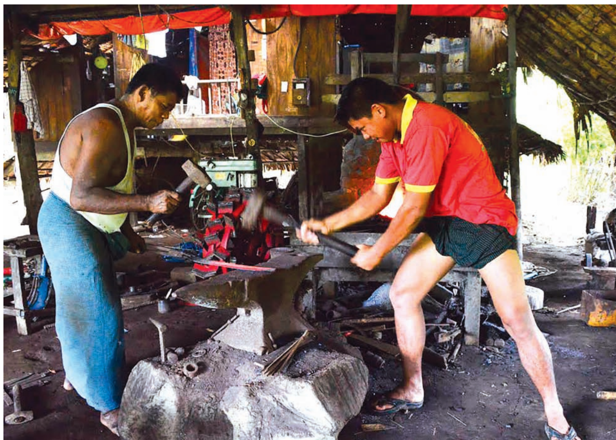
Workers of blacksmith workshop focusing on poduction of agricultural tools in traditional ways at a village in Kawa Township to survive their livelihoods while agricultural machinery are bieng used on a wider scale in rural area for cultivation of paddy and crops.