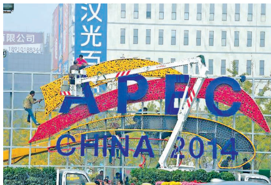
Workers set up a flower decoration for the upcoming APEC meeting in Xidan of Beijing, China, on 25 Oct, 2014. The APEC Economic Leaders’ Meeting will be held in Beijing from 10 to 11 November. The APEC leaders’ week also includes the final senior officials’ meeting from 5 to 6 November, and the 26 th ministerial meeting from 7 to 8 November.