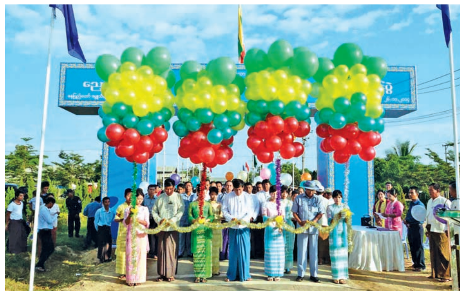
Opening ceremony of asphalt road to Nyaungbinwaing village in progress in Zabuthiri Township.—MNA

The newly-opened road is 4,000 feet long and 12 feet wide. It was upgraded from the earthen facility for convenience of public transport.—MNA