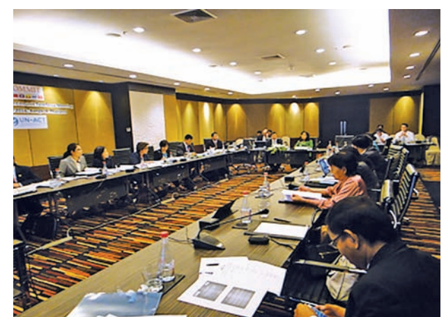
Delegates from the greater Mekong sub-region discussed human trafficking issues at the 2 nd Regional COMMIT Taskforce Meeting in May 2014 in Thailand.