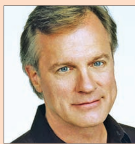
Actor Stephen Collins

The audio tape was apparently taken a therapy session with his wife Faye Grant in 2012. Collins is currently in the process