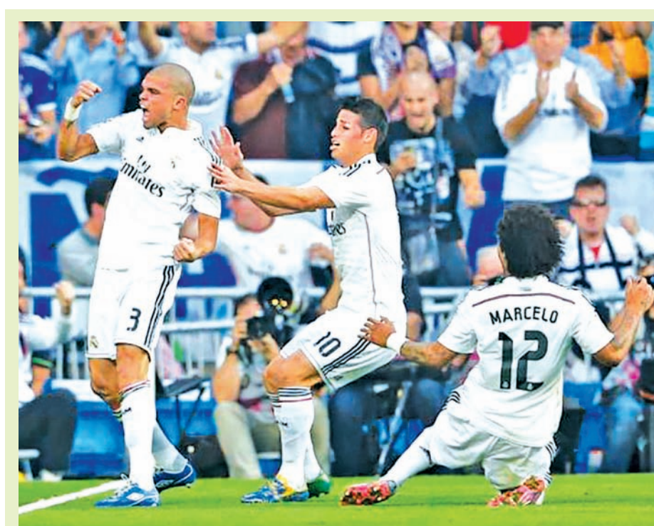
Real Madrid's Pepe (L) celebrates with James Rodriguez (C) and Marcelo after scoring against Barcelona during their Spanish first division "Clasico" soccer match at the Santiago Bernabeu stadium in Madrid on 25 Oct, 2014.

showed that there are opponents who are just as good as us, if not better, like today," Luis Enrique told a news conference.