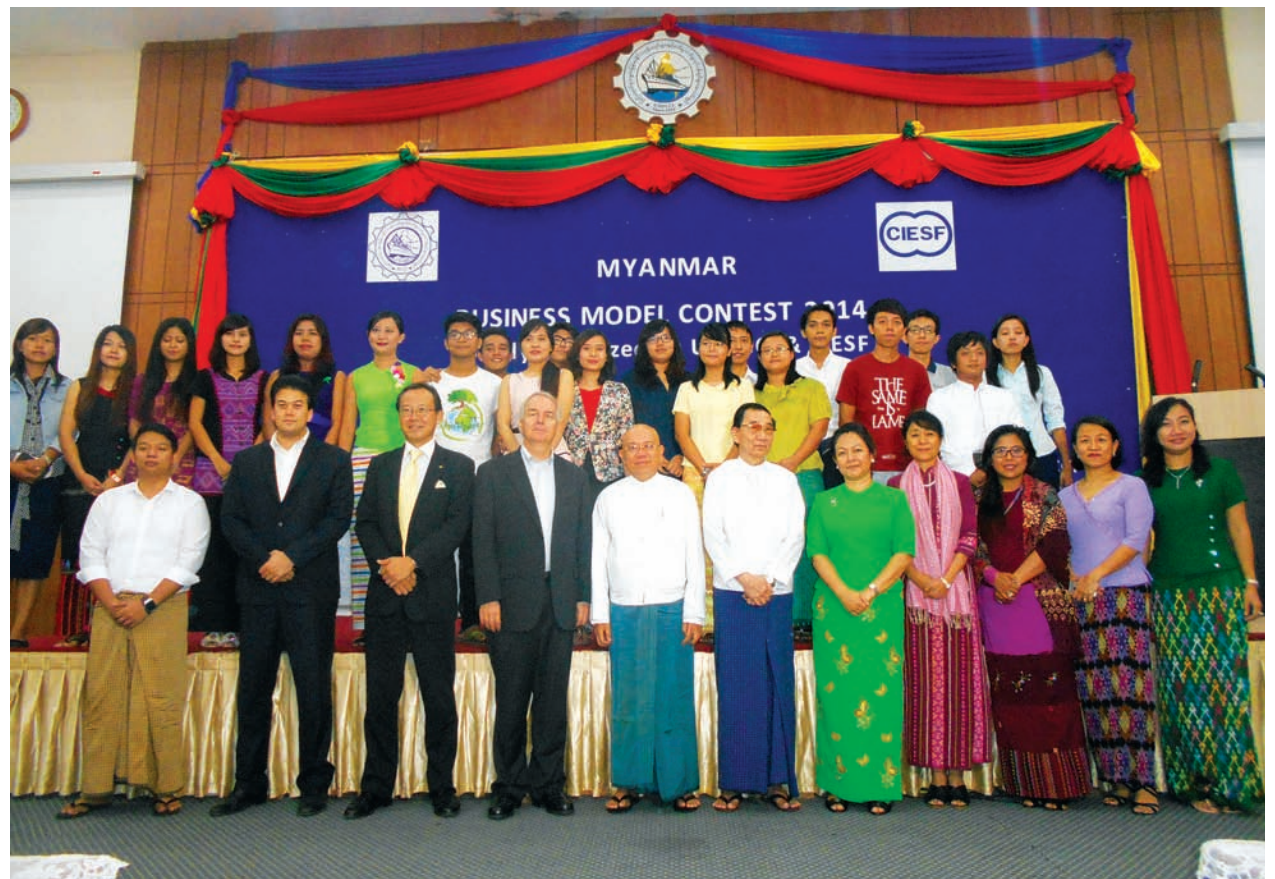
Organizers, training providers and participants of Myanmar business model contest in group photo.