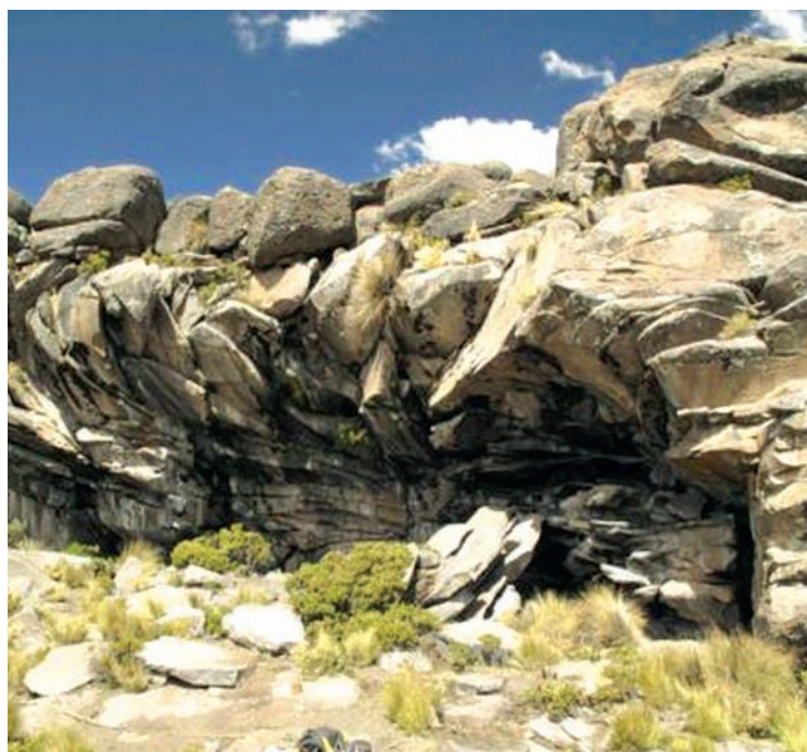
Cunchaicha rock shelter in Peruvian Andes is shown in this handout image released on 22 Oct, 2014.