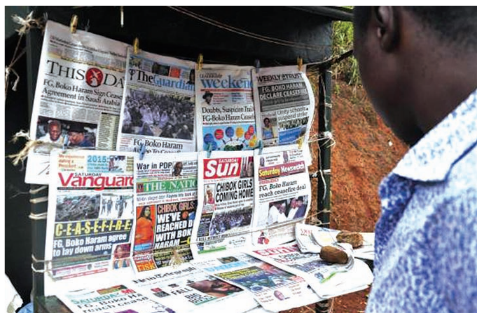
Newspapers with various front page headlines on the Chibok girls and their possible release are displayed at a news stand in Abuja on 18 Oct, 2014.

"The starting condition of Boko Haram was the liberation of some of their members ... That is the compensation," Dago said, adding that the specifics on the names and num-