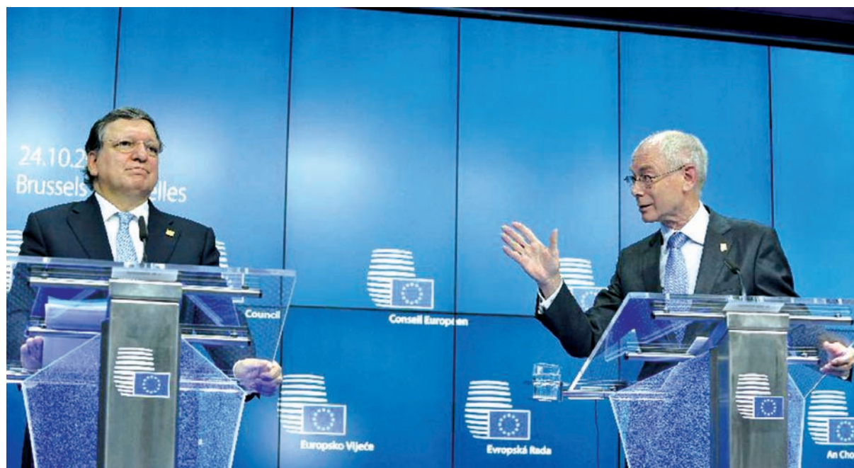
European Commission President Jose Manuel Barroso (l) and European Council President Herman Van Rompuy give a Press conference at the end of EU Summit at EU council headquarters in Brussels, Belgium, on 24 Oct, 2014.

Although Turkish and US officials acknowledge Kobani itself is not especially strategically important, the fate of the town has become a credibility test of the international coalition’s response to Islamic State.— Reuters