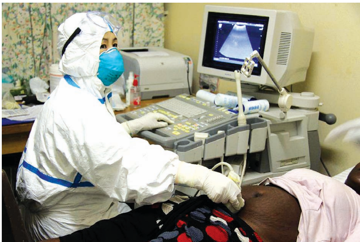
A Chinese medical expert works in a hospital in Monrovia, capital of Liberia on 23 Oct, 2014. Chinese experts in Liberia keep on providing medical assistance in the frontline of a battle against the deadly Ebola virus.