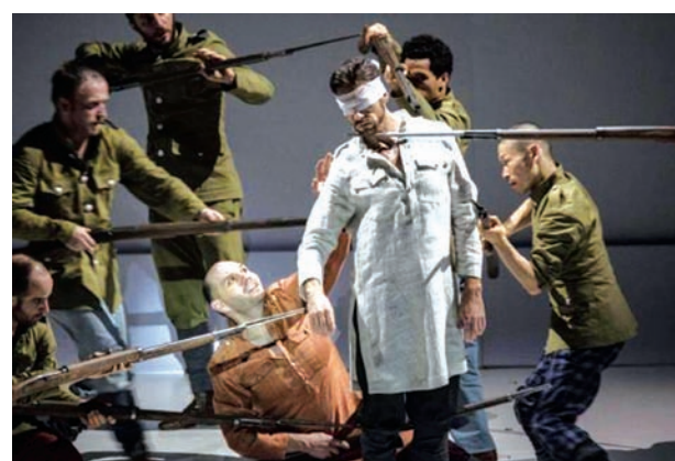
Opera singers and dancers perform on stage during a rehearsal of "Shell Shock", an opera marking the centenary of World War One, at La Monnaie Theatre in Brussels on 17 Oct, 2014, in this handout courtesy of La Monnaie.—REUTERS

Best known for his time as lead singer of alternative rock band Bad Seeds, Cave said he struggled with the subject matter and the problem of