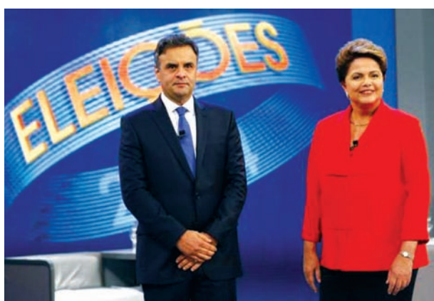
Presidential candidates Aécio Neves of Brazilian Social Democratic Party (PSDB) and Dilma Rousseff of Workers Party (PT) pose before a television debate in Rio de Janeiro on 24 Oct, 2014.

BRASILIA, 25 Oct — Presidential candidates traded accusations over political corruption on Friday night in a last ditch attempt to sway undecided voters before Sunday's election runoff in Brazil's closest race in decades.