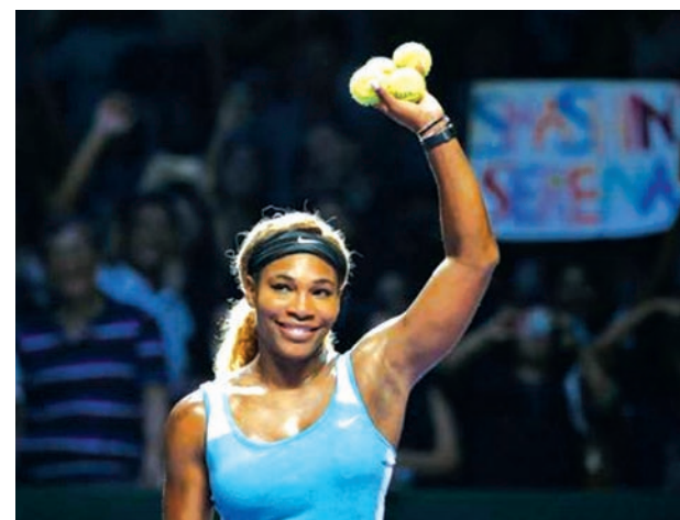
Serena Williams of the US celebrates her win over Caroline Wozniacki of Denmark during their WTA Finals singles semi-finals tennis match at the Singapore Indoor Stadium on 25 Oct, 2014.

SINGAPORE, 25 Oct — Serena Williams regained her composure after smashing her racquet and being on the brink of defeat to beat Caroline Wozniacki 2-6, 6-3, 7-6 (6) on Saturday and reach the title match at the WTA Finals. The best of friends off the court, the pair slugged it out like two prizefighters for more than two hours until Williams delivered the killer blow to end a contest filled with drama and escalating tension.