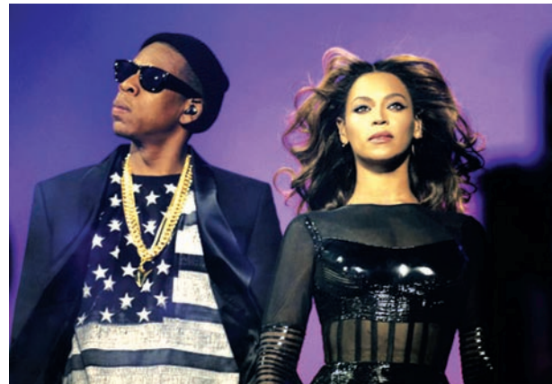
Hollywood star couple Beyonce Knowles and Jay Z

"Things have been difficult for them but they have worked through it. Now things are better than ever for them," a source said about the Beyonce, 33, and Jay Z, who have a two-