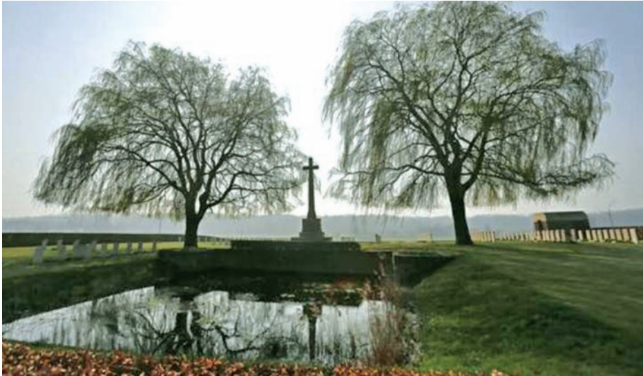
A World War One cemetery is seen near the city of Ypres on 13 March, 2014.

YPRES, (Belgium), 25 Oct — Pondfarm in western Belgium is used to digging up an unusual crop.