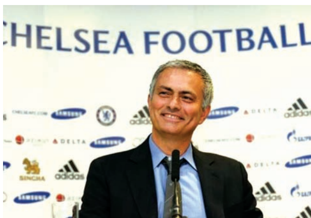
Chelsea manager Jose Mourinho

“I knew already he had talent because I let him do Catalunya Cup matches for me instead of my other assistants,” Van Gaal told a news conference on Fri-