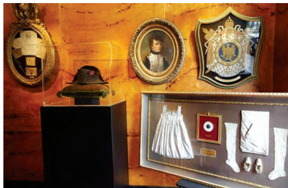
The black felt two-cornered hat belonging to French Emperor Napoleon Bonaparte (L) is displayed near clothes belonging to his son Napoleon II, known as the Roi de Rome, at the Osenat auction house in Paris on 24 Oct, 2014.

The hat fell into possession of the head veterinary surgeon at the Imperial stables at the beginning