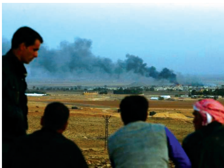
Turkish Kurds watch as smoke rises over the Syrian town of Kobani, from a hill near the Mursitpinar border crossing, on the Turkish-Syrian border in the southeastern town of Suruc in Sanliurfa Province on 24 Oct, 2014.

Turkey’s unwillingness to send its powerful army across the Syrian