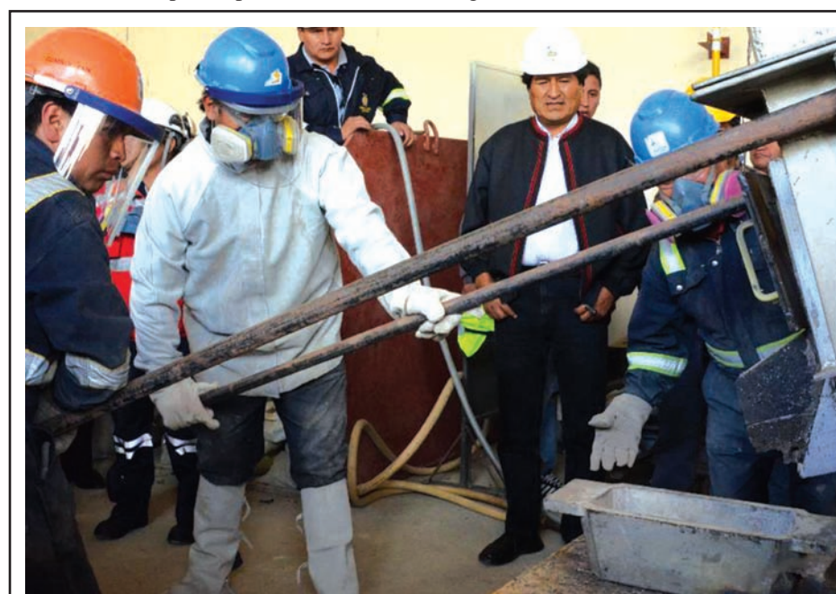
Bolivia's President Evo Morales (2nd, R) attends the presentation of the first batch of silver ingot production at the Karachipampa silver and lead foundry in Potosi, Bolivia, on 24 Oct, 2014.