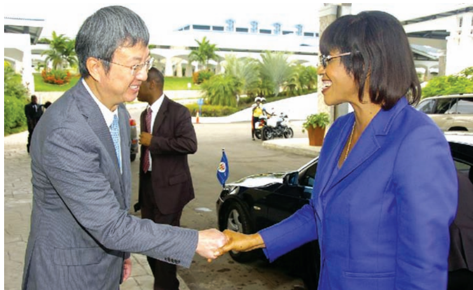
Deputy Managing Director of the International Monetary Fund (IMF) Zhu Min (L) shakes hands with Jamaica's Prime Minister Portia Simpson-Miller before the inauguration of the Caribbean High Level Forum of IMF in Montego Bay, Jamaica, on 23 Oct, 2014. IMF kicked off a high-level forum here on Thursday in hopes of unlocking economic growth for the Caribbean region.