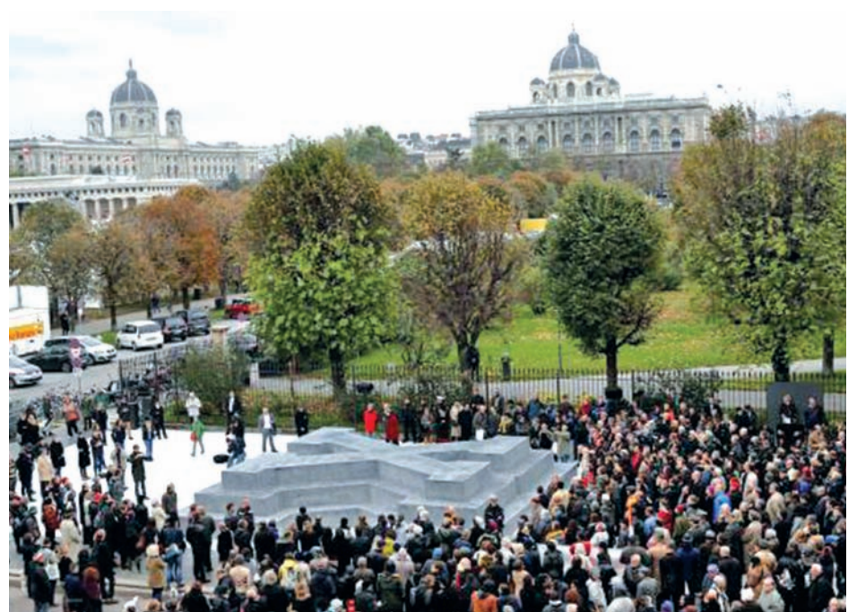
People surround the memorial for 'Victims of Nazi Military Justice' during the inauguration ceremony in front of Hofburg Palace in Vienna on 24 Oct, 2014.