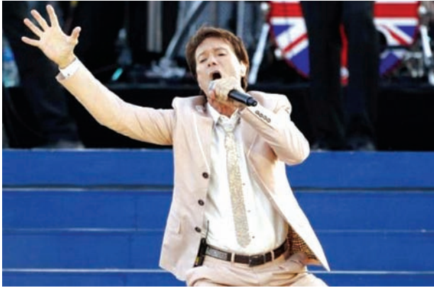
Singer Cliff Richard

LONDON, 25 Oct — The search of Cliff Richard's house by police investigating allegations of child sex crimes, which was broadcast live on television, was "inept" and caused "irreparable damage" to the British singer's reputation, lawmakers said on Friday.