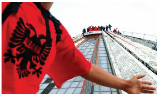
Albanian soccer fans protest near the Serbian Embassy in Tirana on 16 Oct, 2014.

Riot police moved in when about a dozen fans