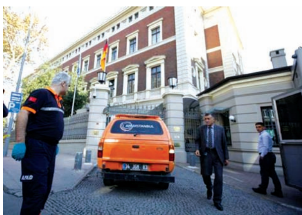
A member of the Turkey's disaster management agency (AFAD) waits in front of the German Consulate in Istanbul on 24 Oct, 2014.

A US Embassy spokesman confirmed the Consul General had received a "suspicious" envelope con-