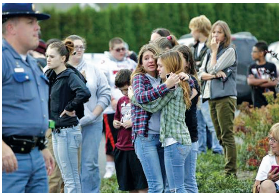
Two girls hug at Shoultes Gospel Hall church where families are reuniting after an active shooter situation at Marysville-Pilchuck High School in Marysville, Washington on 24 Oct, 2014.

Two of the wounded were boys and two girls, hospital officials said.