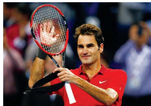
Roger Federer of Switzerland

Nadal’s timing improved marginally in the second but twice Coric served to stay in the set and he then held his nerve when