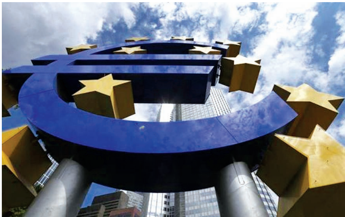
A huge euro logo is pictured next to the headquarters of the European Central Bank (ECB) before the bank's monthly news conference in Frankfurt on 7 Aug, 2014.

Chinese tourists spent 120 billion US dollars abroad last year, and "these are figures we cannot ignore," he said.—Xinhua