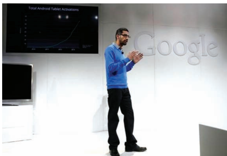
Sundar Pichai, senior vice president at Google, speaks during a Google event at Dogpatch Studio in San Francisco, California, on 24 July, 2013.

Google, the world's No1 Internet search engine, has experienced several high-level management changes this year.