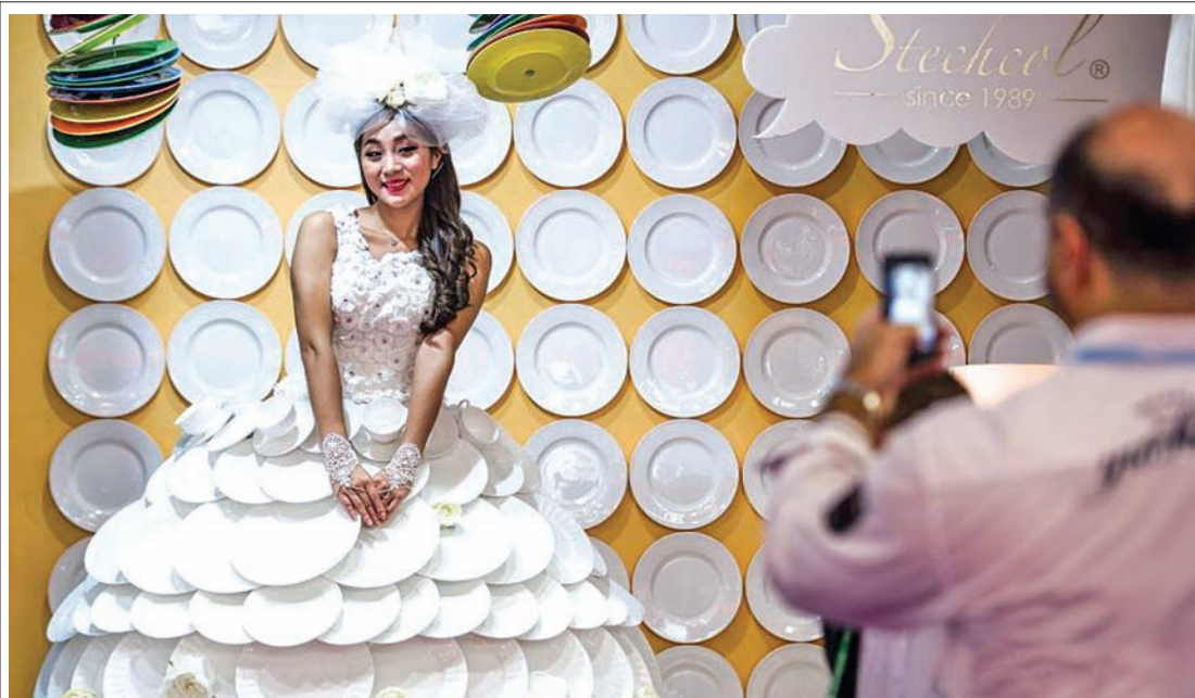
Photos taken on 24 October show evening gowns made of saucers at China Import and Export Fair (Canton Fair) in Guangzhou, North China's Guangzhou Province.—XINHUA

Rescuers had been rushing to the spot, the official added.—Xinhua