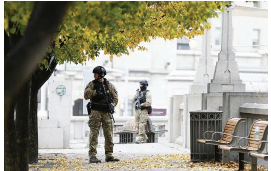
Police officers stand guard near the National War Memorial in downtown Ottawa on 23 Oct, 2014.

Police said on Thursday there were at least 93 Canadians who were viewed as "high risk" because they wanted to travel