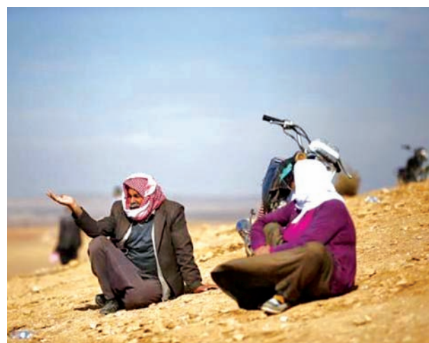
Turkish Kurds watch the Syrian town of Kobani from a hill near the Mursitpinar border crossing, on the Turkish-Syrian border in the southeastern town of Suruc in Sanliurfa Province on 23 Oct, 2014.