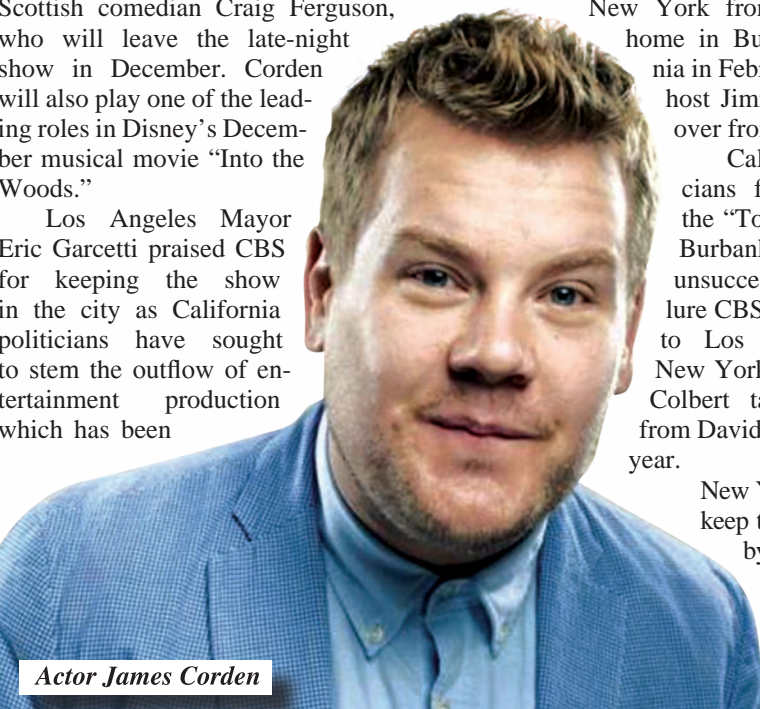
Actor James Corden