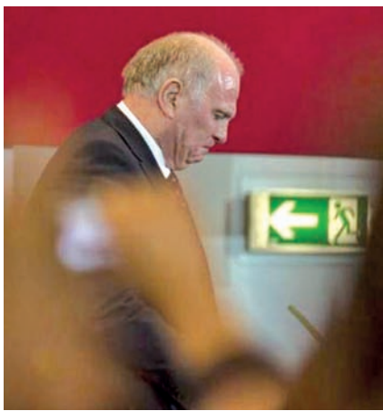
Bayern Munich's former President Uli Hoeness leaves the stage during an extraordinary general meeting of the German Bundesliga first division soccer club in Munich on 2 May, 2014.

MUNICH/WARSAW, 24 Oct — Police in Warsaw detained a Swiss banker on Wednesday in connection with the recent conviction of former Bayern Munich president Uli Hoeness for tax evasion, German and Polish authorities said on Thursday.