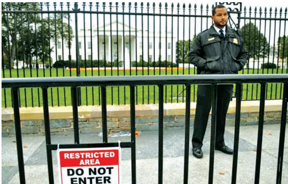
A member of the US Secret Service stands guard in front of the North Lawn of the White House in Washington on 23 Oct, 2014.