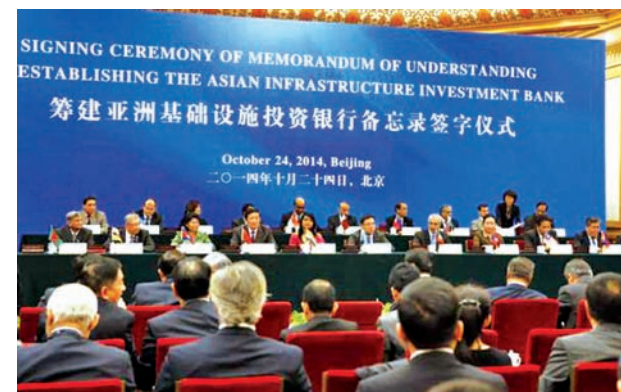
A general view of the signing ceremony of the Asian Infrastructure Investment Bank at the Great Hall of the People in Beijing on 24 Oct, 2014.