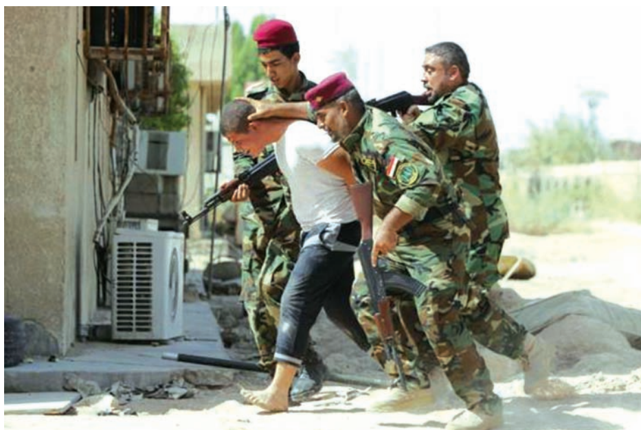
Shi'ite volunteers, who have joined the Iraqi army to fight against militants of the Islamic State, take part in a field training in Basra, southeast of Baghdad, on 27 Sept, 2014.

The officials, briefing a group of reporters, said the priority in Iraq was halting the Islamic State's advance but acknowledged Iraq's western Anbar Province was contested, despite