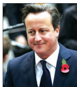
Britain's Prime Minister David Cameron arrives at an European Union leaders summit in Brussels on 23 Oct, 2014.