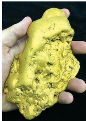
The Butte Nugget is shown in Tiburon, California in this undated handout photo provided by Kagin’s Inc and received by Reuters on 23 Oct, 2014.

Kagin’s earlier this year offered for sale pieces from a trove of rare Gold Rush-era coins that were discovered in California last year by a couple walking their dog and assessed at more than $10 million. Many of the coins were offered on Amazon.com.— Reuters