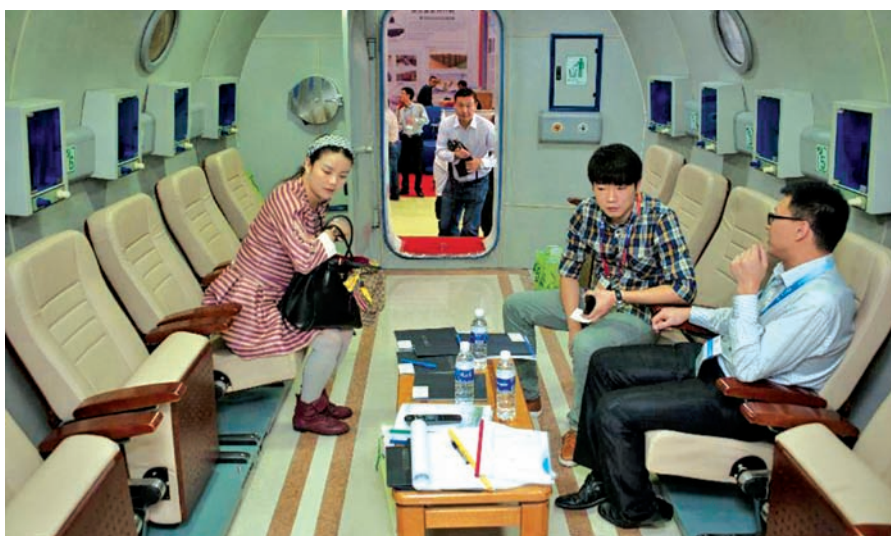
Visitors experience a hyperbaric oxygen chamber at the 72nd China International Medical Equipment Fair (CMEF Autumn 2014) in southwest China's Chongqing on 23 Oct, 2014. The fair kicked off on Thursday and has attracted 2,800 companies of 26 countries and regions from home and abroad, with 80,000 visitors expected to attend the event in four days.