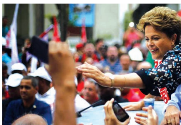
Brazil's President and Workers' Party (PT) presidential candidate Dilma Rousseff (R) greets her supporters during a campaign rally in Duque de Caxias near Rio de Janeiro on 22 Oct, 2014.

Neves, 54, told reporters in Rio that Rousseff had run a "sordid" campaign that was a full of lies about him. His attacks on Rousseff — he called her a "liar" and "flighty" in an acrimonious debate last week — have lost him support among women voters who perceived his comments as male chauvinist. Rousseff