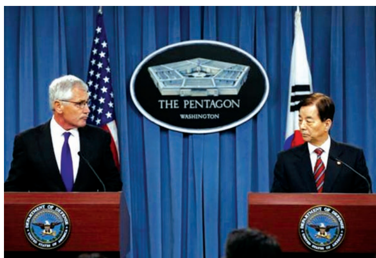
US Secretary of Defence Chuck Hagel and South Korean National Defence Minister Han Min Koo attend a news conference at the Pentagon in Washington, on 23 Oct, 2014.

South Korea has cited North Korea's growing