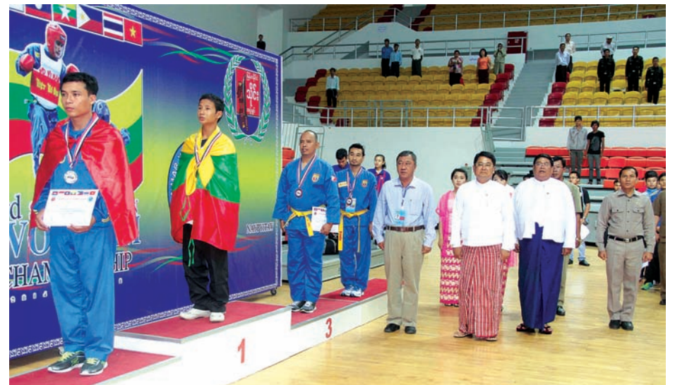
Union Minister for Sports U Tint Hsan and prize winning athletes celebrating victory of Myanmar in Vovinam Championship.