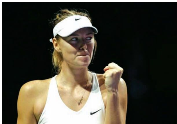
Maria Sharapova of Russia celebrates a point against Agnieszka Radwanska of Poland during their WTA Finals singles tennis match at the Singapore Indoor Stadium on 24 Oct, 2014.

guaranteed a last four berth so even if she loses to Kvitova, the Czech Wimbledon champion will advance with her instead of Radwanska.