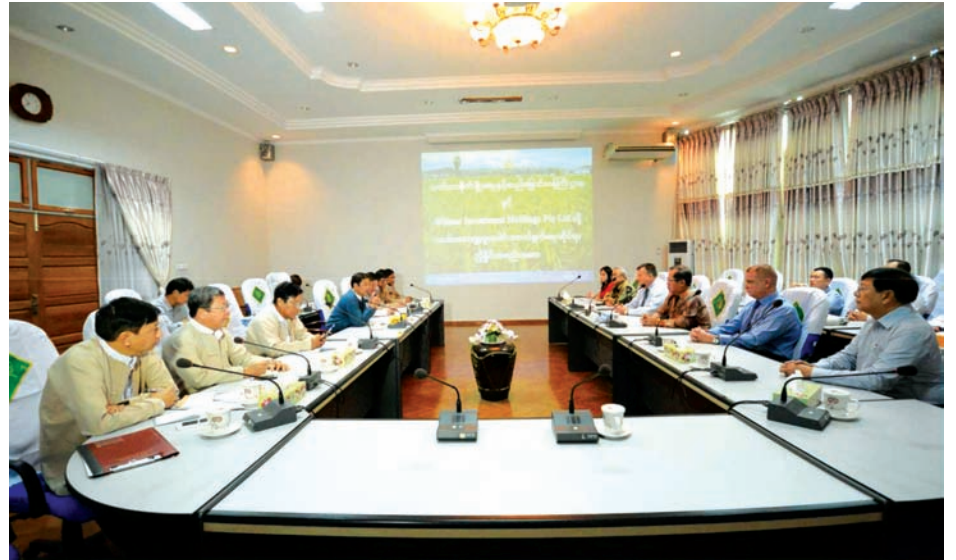
Union Minister U Myint Hlaing holds talks with Indonesian and Singaporean entrepreneurs about investment opportunities in agriculture sector.—MNA

The Union minister explained investment opportunities in the agricultural sector, mutual interests, job opportunities and prospect of increasing in-