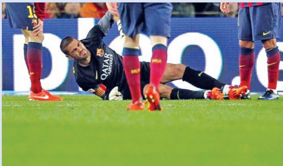
Former Barcelona's goalkeeper Victor Valdes (bottom), surrounded by his teammates, gestures as he lies injured after a freekick during their La Liga soccer match against Celta Vigo at Camp Nou stadium in Barcelona on 26 March, 2014.

"Valdes will have his recovery supervised by the United medical staff before training with the first team as he bids to regain full fitness," United said on their website (www.manutd.com). Sixth-placed United host Premier League leaders Chelsea at Old Trafford on Sunday.