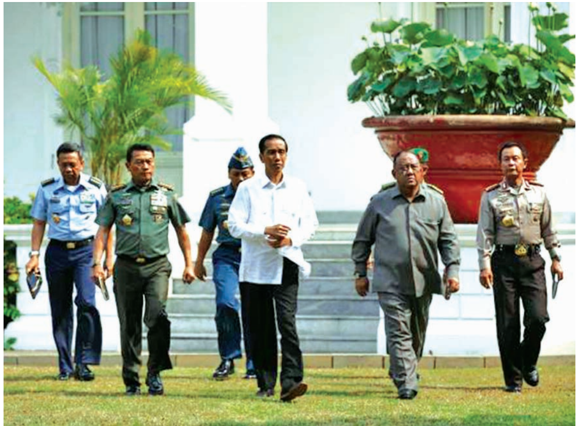
New Indonesian President Joko Widodo walks with heads of the military, police and intelligence to address the media at the presidential palace in Jakarta on 22 Oct, 2014.

The cabinet will now be made up of 34 ministers, con-