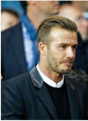
Former soccer player David Beckham

BRIDETOWN, (Barbados), 24 Oct — Major League Soccer commissioner Don Garber says an apparent lack of political will is making the bid to set up a franchise in Miami “complicated” and