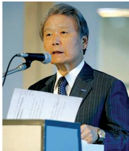
Japan Business Federation Chairman Sadayuki Sakakibara gives a speech at a Tokyo seminar organized by Kyodo News on 24 Oct, 2014. He said Japan should accept more foreign workers to address labour shortages in the economy.