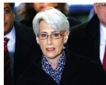
US Under Secretary of State for Political Affairs Wendy Sherman

"If that does not happen, the responsibility will be seen by all to rest with Iran," Sherman added. Iran's best chance to have sanctions relief is to strike a deal with major powers in the next