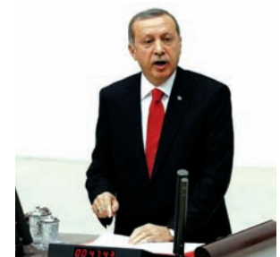
Turkey's President Tayyip Erdogan

RIGA, 24 Oct — Turkish President Tayyip Erdogan said on Thursday agreement had been reached on sending 200 Kurdish peshmerga fighters from Iraq through Turkey to help defend the Syrian border town of Kobani against Islamic State militants.