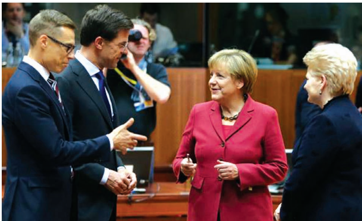
(L-R) Finland's Prime Minister Alexander Stubb, Netherlands' Prime Minister Mark Rutte, Germany's Chancellor Angela Merkel and Lithuania's President Dalia Grybauskaitė attend an European Union leaders summit in Brussels on 23 Oct, 2014.