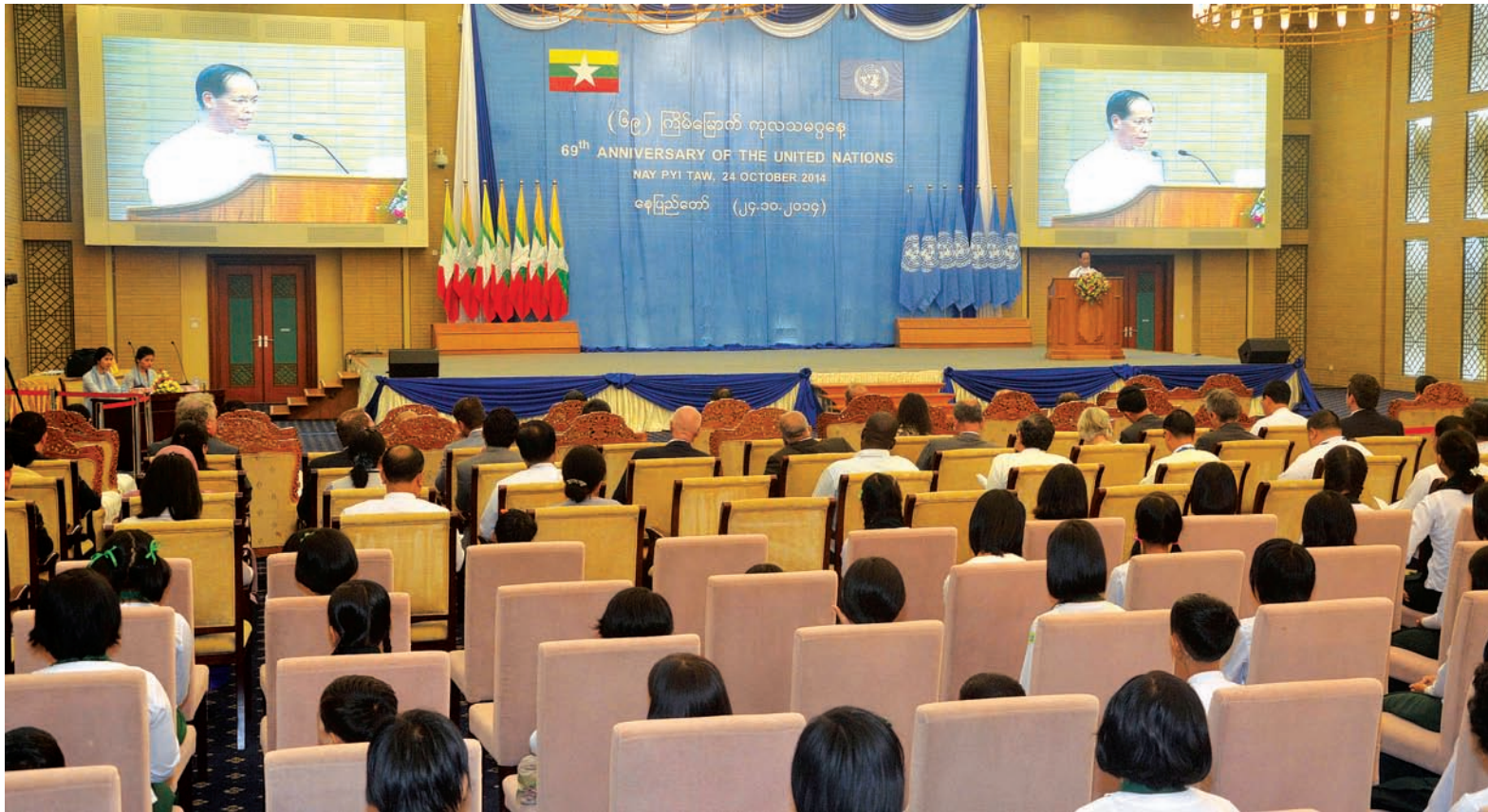
Vice President Dr Sai Mauk Kham addresses the ceremony to mark 69 th Anniversary of the United Nations.

Vice President attends ceremony to mark 69 th Anniversary of United Nations