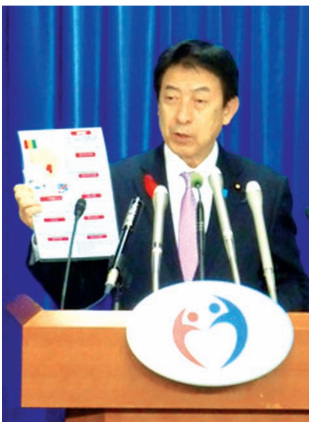
Health, Labour and Welfare Minister Yasuhisa Shiozaki explains on 24 Oct, 2014, in Tokyo that Japan will strengthen its airport quarantine system to prevent the spread of the Ebola virus. All immigrants from overseas will be asked if they stayed in any of four African nations — Guinea, Liberia, Sierra Leone and Congo.

The total number of travelers to Japan from abroad annually reaches 28 million, of which