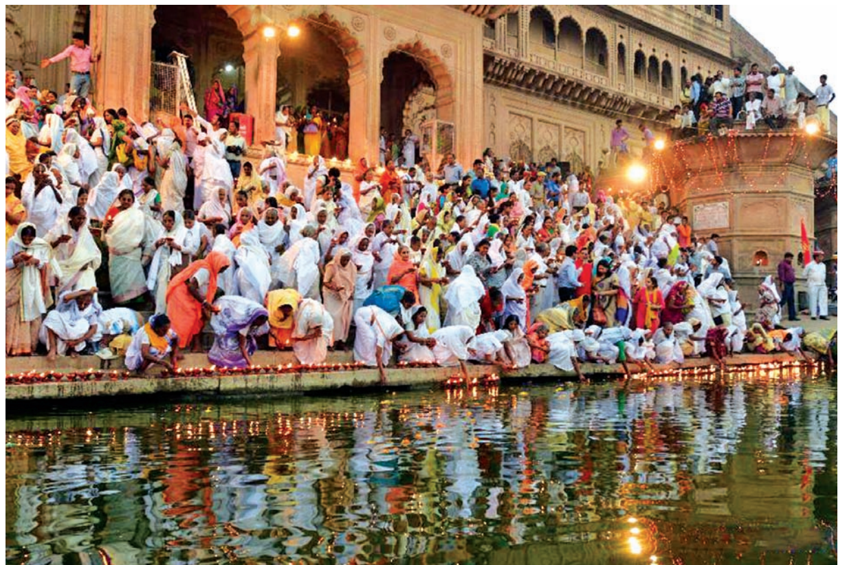
Hindu widows light candles to celebrate Deepawali festival, or festival of lights, at the bank of river Yamuna in Vrindavan, India, on 21 Oct, 2014.