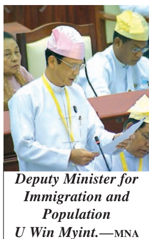
Deputy Minister for Immigration and Population U Win Myint.—MNA

NAY PYI TAW, 22 Oct — Pyithu Hluttaw (Lower House) convened 22 nd day meeting here on Wednesday.