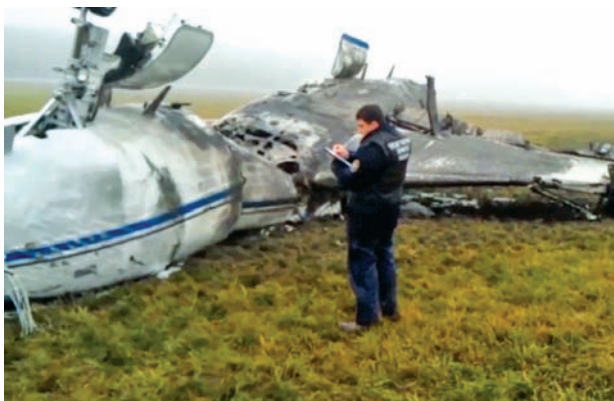
The French experts plan to stay in Russia for three or five days to provide assistance in the jet crash investigation.

The French experts plan to stay in Russia for