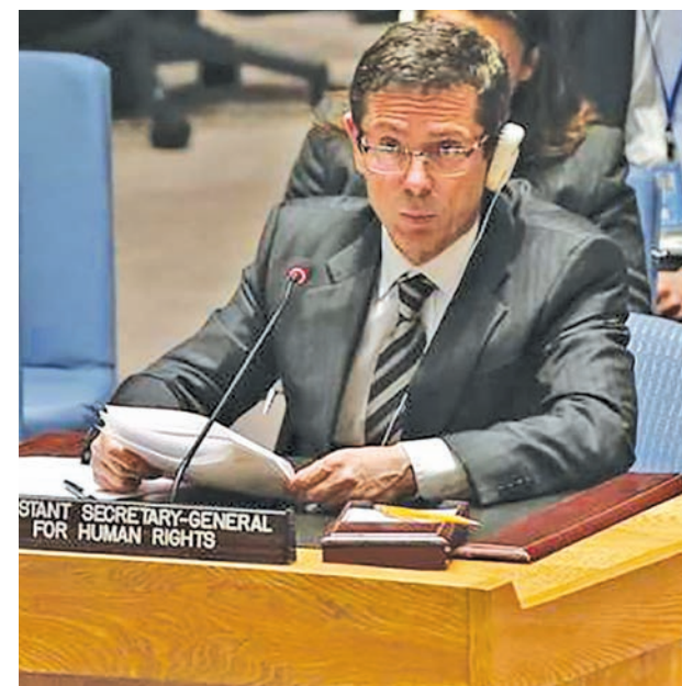
Iman Simonovic, United Nations assistant Secretary-General for Human Rights.—REUTERS

Israel and Egypt signed a peace treaty in 1979, and Egyptian forces have been trying to curtail Islamist militant operations in Sinai. Wednesday’s attack occurred about half way between Eilat and the Gaza Strip, said the army.—Reuters