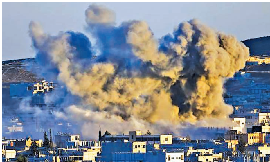
Smoke rise over Syrian town of Kobani after an airstrike, as seen from the Mursitpinar crossing on the Turkish-Syrian border in the southeastern town of Suruc in Sanliurfa province on 21 Oct, 2014.

BAGHDAD, 22 Oct —Iraqi army tanks and armored vehicles on Wednesday fought off an advance by Islamic State militants on the town of Amiriya Fallujah, west of the Iraqi capital Baghdad, army sources said, part of a multinational effort to check the group’s progress.