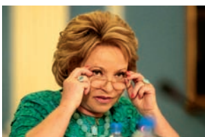
The speaker of the Federation Council upper house of the Russian parliament, Valentina Matviyenko.

Moscow, 22 Oct — The speaker of the Federation Council upper house of the Russian parliament, Valentina Matviyenko, said on Wednesday she was against tighter rules