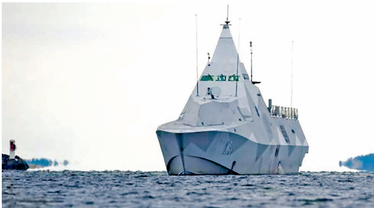
The Swedish corvette HMS Visby is seen in the search for suspected "foreign underwater activity" at Mysingen Bay, Stockholm on 21 Oct, 2014.

Some of the incidents were later reclassified as likely to have been false