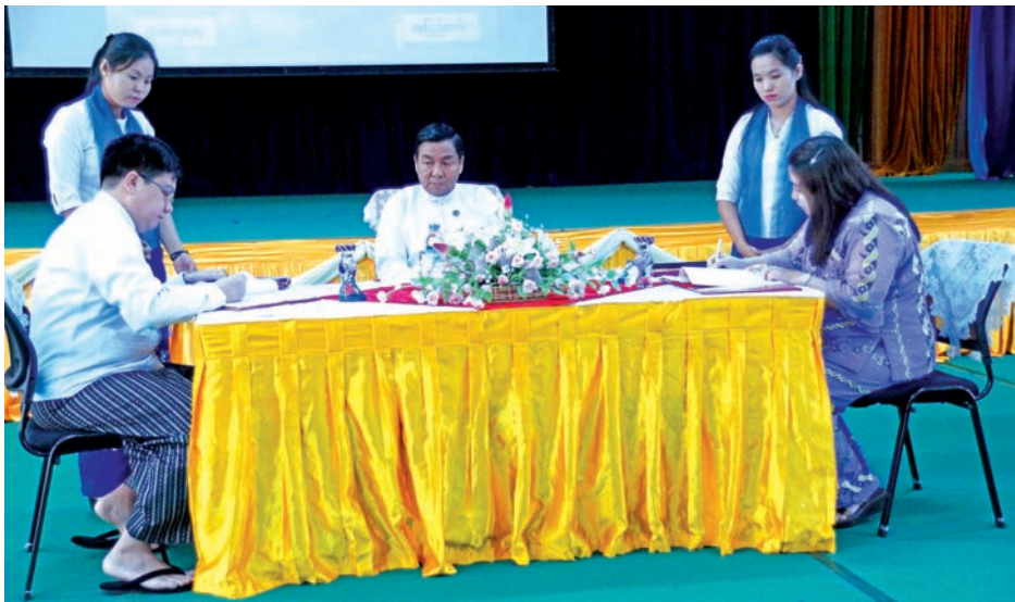
Deputy Minister for Information U Pike Htway attends signing ceremony of agreements with local broadcast media.—MNA

NAY PYI TAW, 22 Oct—Director-General U Tint Swe of Myanmar Radio and Television (MRTV) and officials from local broadcast media groups—Forever Group, Shwe Than Lwin Media,