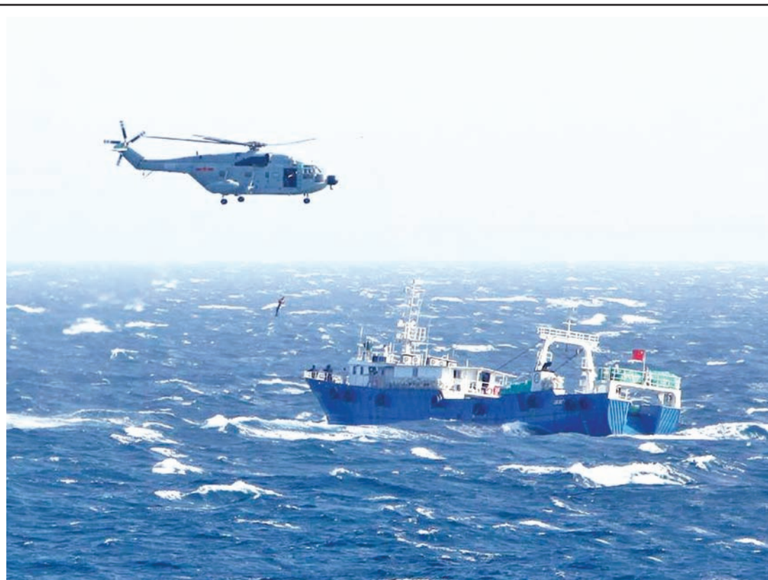
The 18 th Chinese Navy escort fleet finished their 772 nd mission to provide escort for two Chinese fishing boats near Bab al-Mandab, on 21 October.

As of the end of September, a total of 5,262 domestic projects with registered capital of 512.03 trillion Vietnamese dong (24.27 billion US dollars) came to Vietnam's industrial parks and economic zones. During a nine-month period, the country's industrial parks and economic zones enjoyed total revenue of over 55.7 billion US dollars, up 30 percent year-on-year, contributing 42,02 trillion Vietnamese dong (1.99 billion US dollars) to the state budget, according to FIA.—Xinhua