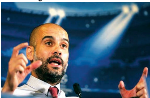
Bayern Munich's coach Pep Guardiola attends a news conference on the eve of their Champions League match against AS Roma at the Olympic stadium in Rome on 20 Oct, 2014.

"This game is an exception, an incident," he said. "It's not the difference between the two teams, we will see that in two weeks."