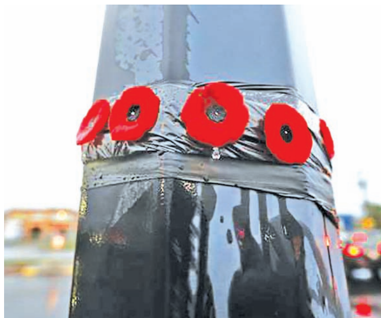
A raindrop falls from one of the poppies placed on a lamp post in the parking lot in front of a Service Canada building, where a suspected Islamic militant deliberately ran over two soldiers with his car, in Saint-Jean-sur-Richelieu, Quebec on 21 Oct, 2014.