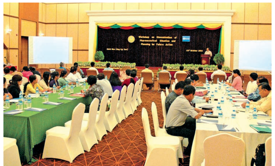
Workshop on discrimination of pharmaceutical situation for planning for future action in progress.