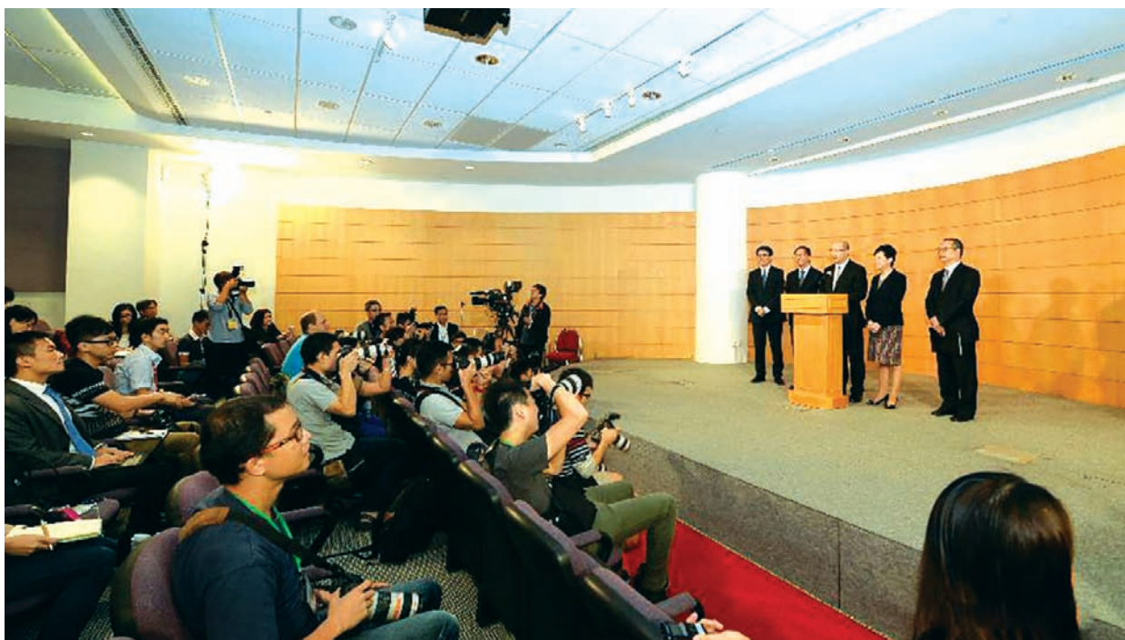
Representatives of China's Hong Kong SAR government attend a Press conference after their talks with student leaders in the Hong Kong Academy of Medicine, south China's Hong Kong, on 21 Oct, 2014. The Hong Kong government on Tuesday held the first formal talks with student leaders speaking for sit-in protesters to find a peaceful way to end the Occupy Central movement which started on 28 September.