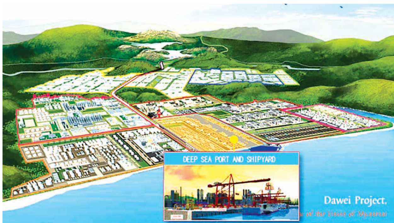
An artist's view of the Dawei Special Economic Zone in Myanmar.