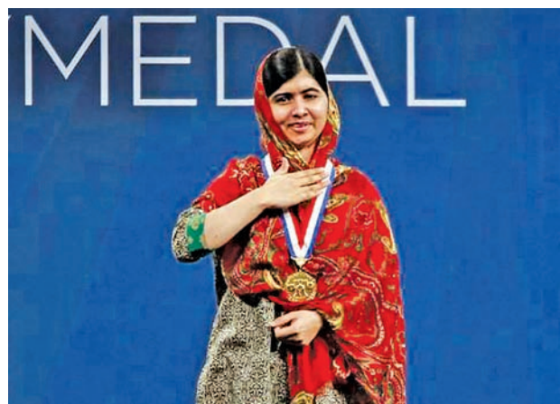
Malala Yousafzai, of Pakistan, gestures as she wears the 2014 Liberty Medal which was presented to her at a ceremony at the National Constitution Centre in Philadelphia on 21 Oct, 2014.