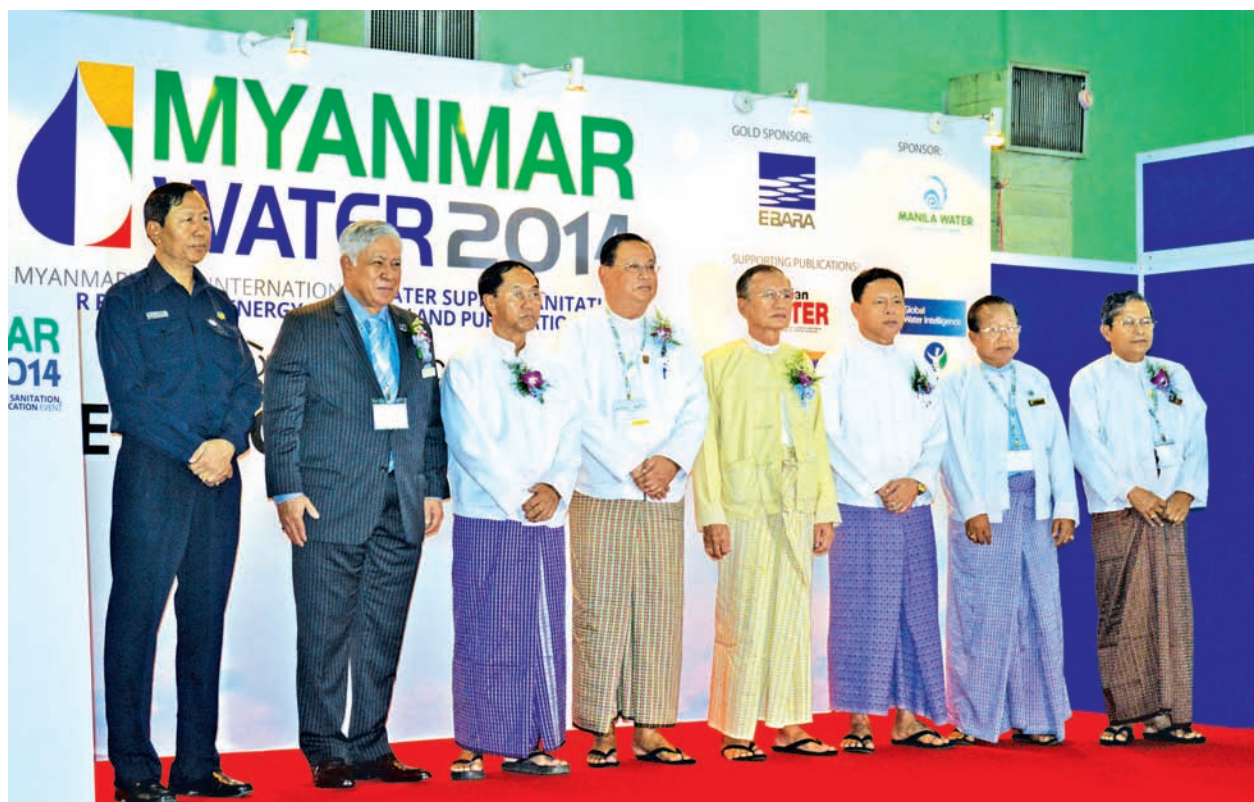
Myanmar Water 2014 kicks off with an opening ceremony at Tatmadaw Convention Hall in Yangon on Wednesday.—PHOTO: YE MYINT

The Myanmar Water 2014 event coincided with the National Water Forum 2014 held in Nay Pyi Taw on Tuesday. It was the second time for Myanmar to host the exhibition. According to officials, it is scheduled to hold Myanmar Water 2015 in September next year. — GNLM