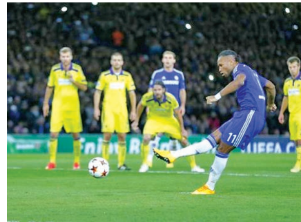
Chelsea's Didier Drogba shoot to score a penalty during their Champions League Group G soccer match against Maribor at Stamford Bridge in London on 21 Oct, 2014.

In another high-scoring contest, Schalke beat Sporting 4-3.—Reuters