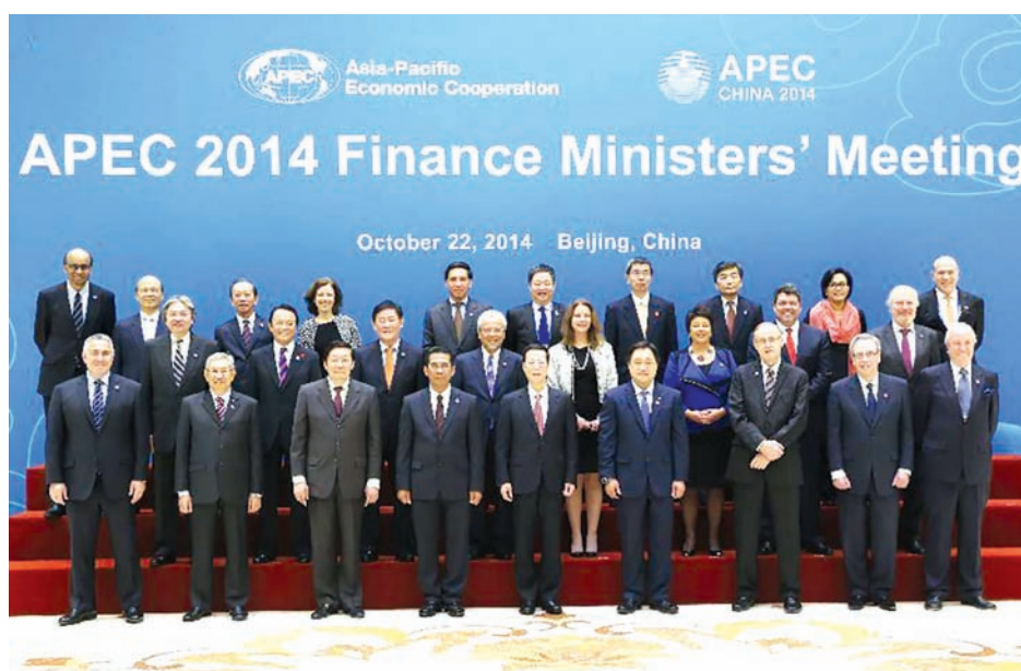
Chinese Vice Premier Zhang Gaoli (C, front) and other delegates pose for a group photo before attending the APEC (Asia-Pacific Economic Cooperation) 2014 Finance Ministers' Meeting in Beijing, capital of China, on 22 Oct, 2014.

Japanese Prime Minister Shinzo Abe is hoping to hold first formal talks with Chinese President Xi Jinping when he travels for the 10-11 November summit in Beijing.