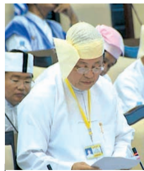
Deputy Minister for Livestock, Fisheries and Rural Development U Tin Ngwe.

NAY PYI TAW, 22 Oct — The Amyotha Hluttaw (Upper House) continued for the 22 nd day at its hall in Nay Pyi Taw on Wednesday.