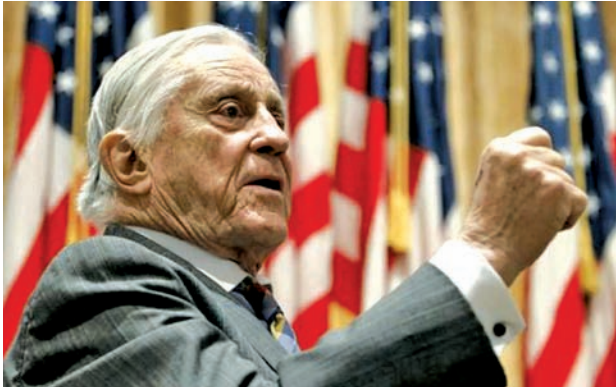
Ben Bradlee, a former Washington Post executive editor

WASHINGTON, 22 Oct — Ben Bradlee, the hard-driving editor who reigned over the Washington Post with the style of a well-dressed swashbuckler and the profane vocabulary of a dockworker as the newspaper helped topple President Richard Nixon, died on Tuesday aged 93.