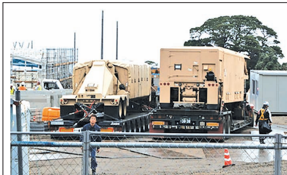
US military radar, the X-band radar, has been brought into the Air Self-Defence Force Kyogamisaki sub-base in western Japan city of Kyotango on 21 Oct, 2014. The radar, which is the second X-band radar in Japan following the ASDF Shariki sub-base in northeastern city of Tsugaru, was installed in light of North Korea's nuclear ambitions and missile development.