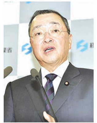
Japan's new Economy, Trade and Industry Minister Yoichi Miyazawa meets with reporters at his ministry on 21 Oct, 2014, following an attestation ceremony. He shows his willingness to resume operations of nuclear power plants once their safety is confirmed.

In addition to Obuchi, Justice Minister Midori Matsushima — another female member of the Cabinet — resigned Monday over a separate scandal. Matsushima allegedly