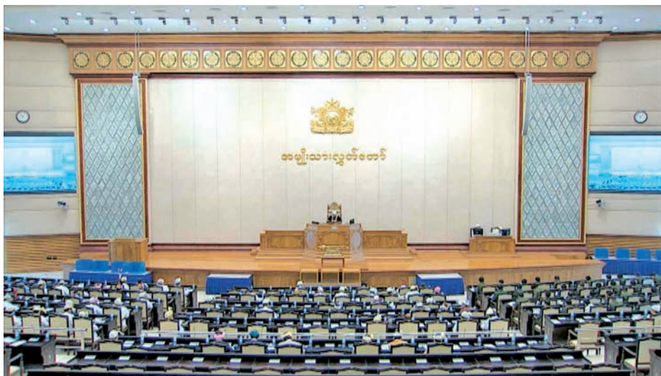
Representatives participate in discussion of topics at Tuesday's session of Amyotha Hluttaw (Upper House).—MNA

NAY PYI TAW, 21 Oct — The Amyotha Hluttaw (Upper House) convened its 21st day meeting here on Tuesday.