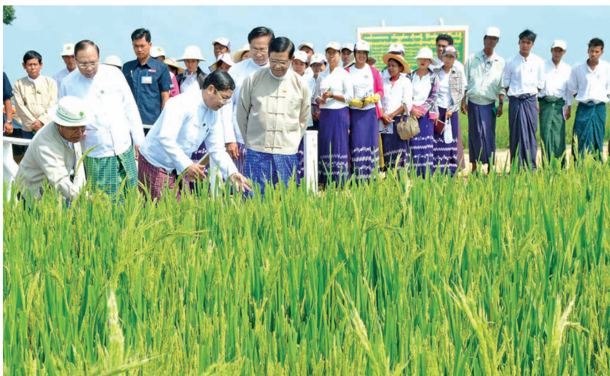
Vice President U Nyan Tun views thriving paddy plantation in Nay Pyi Taw.