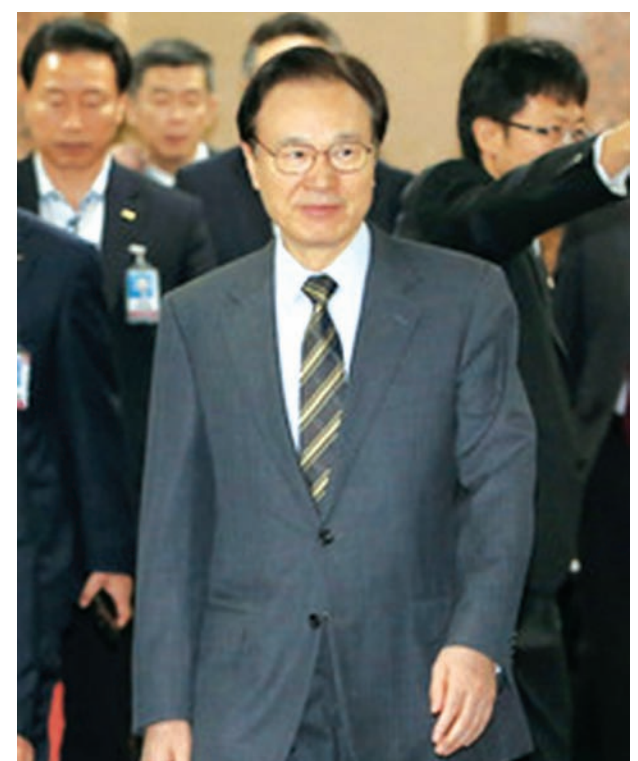
Shotaro Yachi, Japan's national security adviser to the Cabinet, arrives at Gimpo International Airport in Seoul, South Korea, on 21 Oct, 2014, for a two-day visit to discuss a wide range of issues concerning security and bilateral relations with top South Korean officials.

It is Yachi's first visit to South Korea since he be-