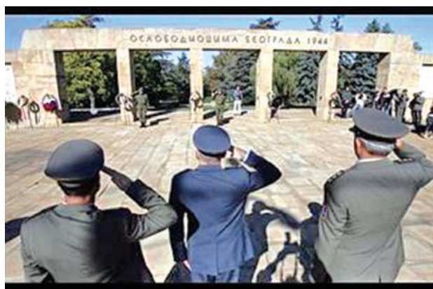
Minister for War Veteran Affairs Aleksandar Vulin and Belgrade Mayor Sinisa Mali laid wreaths at the cemetery dedicated to Belgrade's liberators.

General Staff of the Russian Armed Forces General Valery Gerasimov also paid their respects.