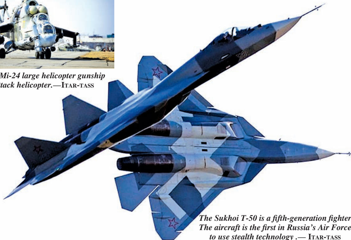
The Sukhoi T-50 is a fifth-generation fighter. The aircraft is the first in Russia's Air Force to use stealth technology.

MOSCOW, 21 Oct — Seven Commonwealth of Independent States CIS states began air defence drills on Tuesday. Around 100 warplanes of fighter, bombing, assault and long-range aviation as well as