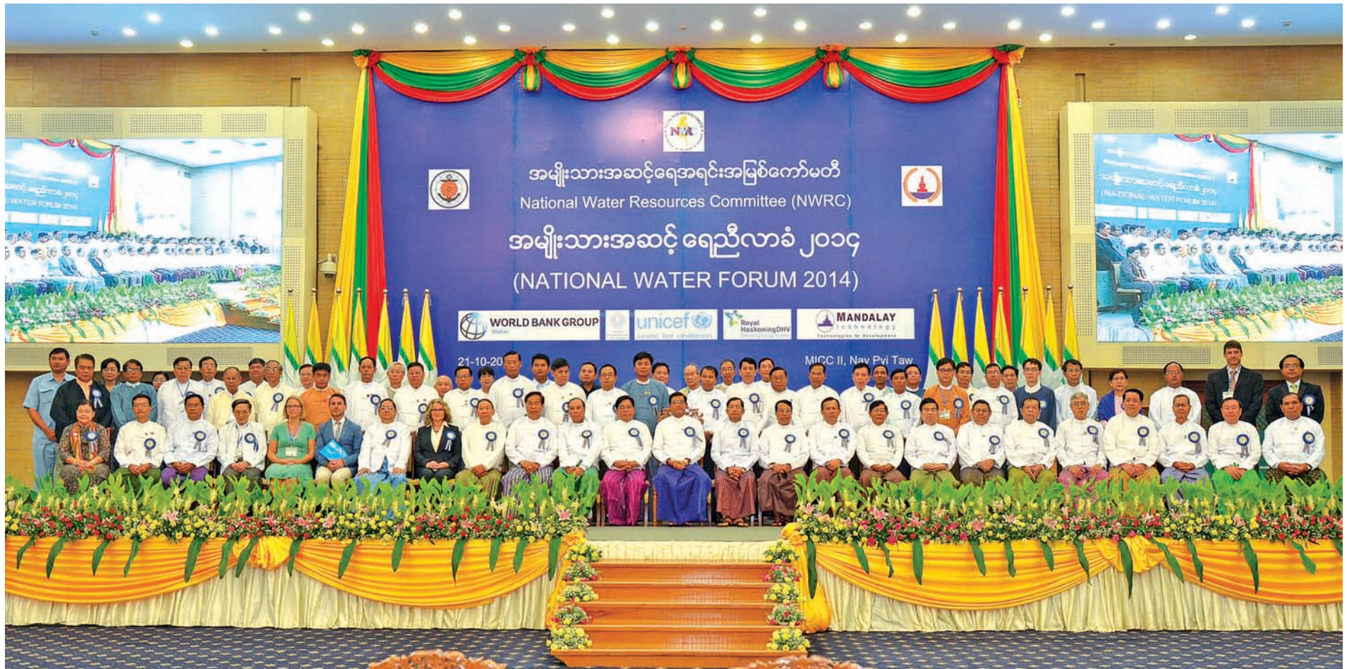
Vice President U Nyan Tun with Union Ministers, officials of UN agencies at National Water Forum organized by National Water Resources Committee.—MNA

NAY PYI TAW, 21 Oct— The National Water Forum 2014 took place at the Myanmar International Convention Centre in the capital city of Nay Pyi Taw on Tuesday, with an address by Vice President U Nyan Tun, who is also Chairman of the National Water Resources Committee (NWRC).