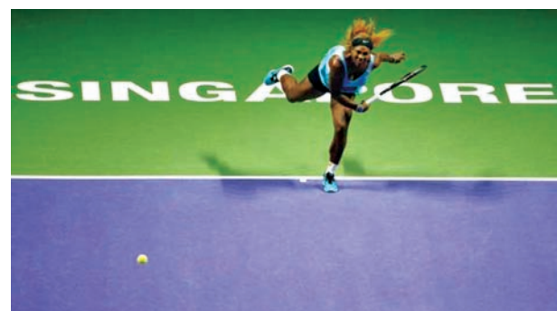
Serena Williams of the US serves against Ana Ivanovic of Serbia during their WTA Finals singles tennis match in Singapore on 20 Oct, 2014.