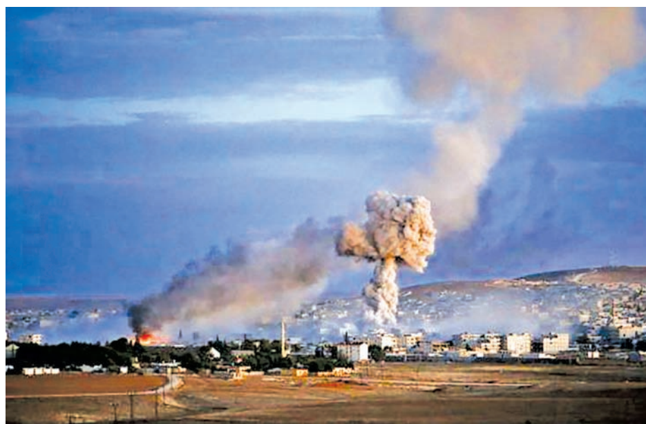
Smoke and flames rise over Syrian town of Kobani after an airstrike, as seen from the Mursitpinar crossing on the Turkish-Syrian border in the southeastern town of Suruc in Sanliurfa Province, on 20 Oct, 2014.

Turkey's refusal to intervene in the fight with Islamic State has frustrated the United States and sparked lethal riots in southeastern Turkey by Kurds furious at Ankara's failure to help Kobani or at least open a