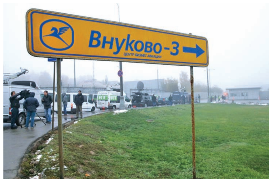
Media crews at French jet crash site to collect information.