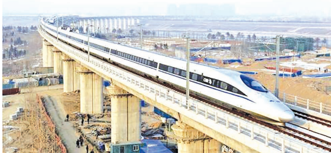
A high-speed train travelling to Guangzhou is seen running on Yongdinghe Bridge in Beijing, on 26 Dec, 2012.

The country has helped or indicated its interest to build thousands of kilometres of high-speed track in countries such as Turkey, Saudi Arabia and Venezuela, though it has yet to sell a high-speed train abroad. Premier Li Keqiang — dubbed by local media as China's high-speed rail salesman — has led a drive to promote its technology in Thailand, Britain, Russia and India.—Reuters