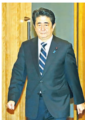
Japanese Prime Minister Shinzo Abe

The secretaries general of the two ruling parties met early on Tuesday to pledge their continued support for Abe, who is