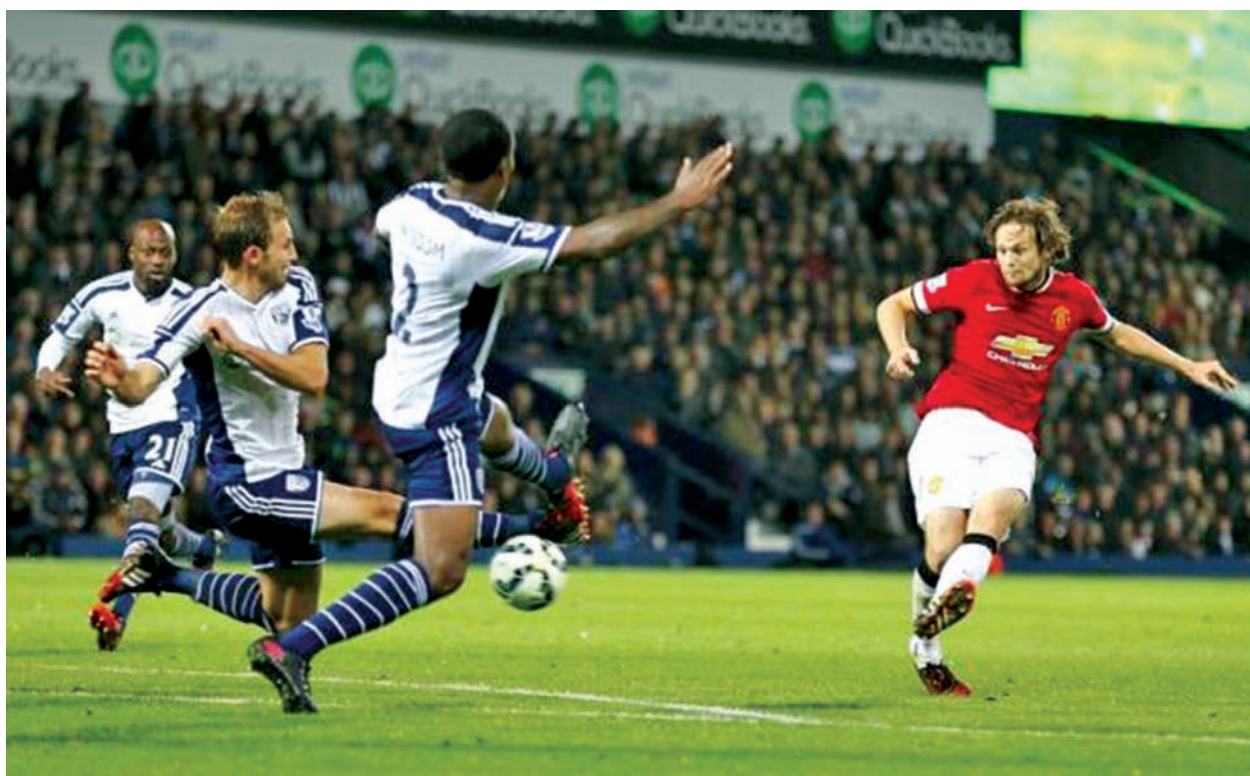
Daley Blind of Manchester United shoots to score against West Bromwich Albion during their English Premier League soccer match at The Hawthorns in West Bromwich on 20 Oct, 2014.

but that does not count in our world, but I also have to be happy because we created lots of chances and West Brom only had two chances. "We gave it away which is a pity because we could have had a new start if we had won today."