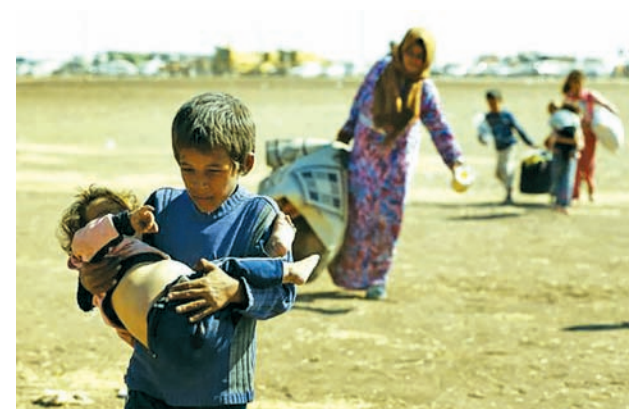
A young Syrian Kurdish refugee boy carries an infant after crossing the Syrian-Turkish border, near the southeastern town of Suruc in Sanliurfa Province on 23 Sept, 2014.

“If you scratch beneath the surface, the statistics around things like sexual violence, violent discipline