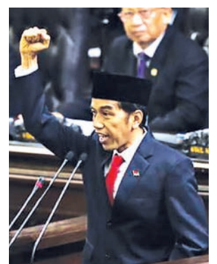
Indonesia's new President Joko Widodo

It was not clear if the second anti-graft agency considering cabinet nominations, the Indonesian Financial Transaction Reports and Analysis Centre, also raised concerns. Centre officials were not available for comment. All eyes are on Widodo's choices to head the main economic ministries. They will inherit problems in Southeast Asia's biggest economy ranging from a widening current account deficit and cooling investment to the slowest growth since 2009.—Reuters