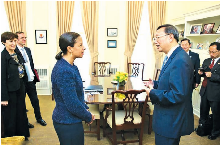
Chinese State Councillor Yang Jiechi (R) meets with US President Barack Obama's National Security Advisor Susan Rice in Washington DC, the United States, on 20 Oct, 2014.

official also urged the two sides to conduct active interaction and cooperation in the Asia-Pacific region, resolve bilateral issues in a constructive way, and seek more tangible achievements in building a new model of major-country relationship, thus making active contributions to enhancing regional and global peace, stability and prosperity.