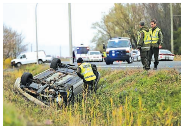
A Surete du Quebec (SQ) officer investigates an overturned vehicle in Saint-Jean-sur-Richelieu, Quebec on 20 Oct, 2014.—REUTERS

The incident took place in Saint-Jean-sur-Richelieu, around 40 km (25 miles) southeast of Montreal.— Reuters