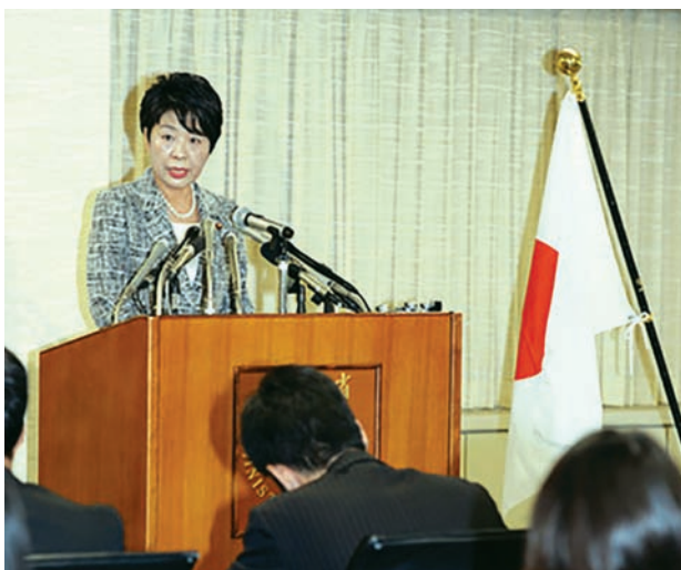
Japan's new Justice Minister Yoko Kamikawa attends a Press conference on 21 Oct, 2014, at her ministry in Tokyo following an attestation ceremony. She said she will make utmost efforts to gain public understanding over a controversial secrecy law that will take effect on 10 December.

“There is no doubt that nuclear power is our nation's important base-load power source,” Miyazawa, 64-year-old nephew of the late former Prime Minister Kiichi Miyazawa, said at a