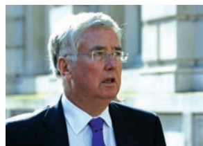
Britain's Defence Secretary Michael Fallon

LONDON, 21 Oct — Britain said on Tuesday it was authorizing spy planes and armed drones to fly surveillance missions over Syria “very shortly” in or-