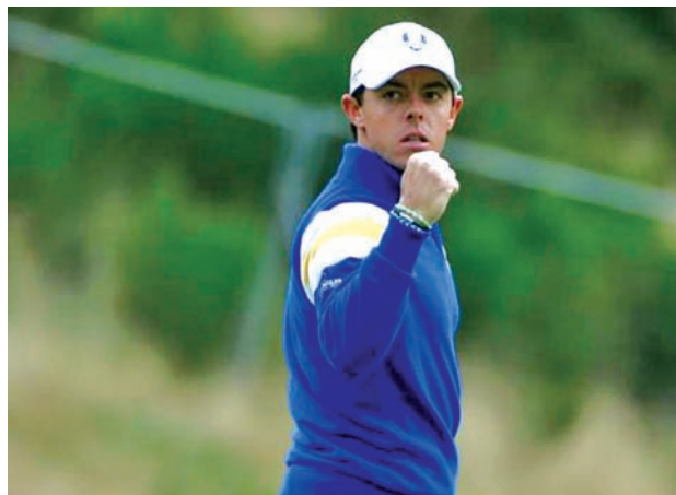
European Ryder Cup player Rory McIlroy celebrates as he wins 5&4 on the 14th green against US Ryder Cup player Rickie Fowler during the 40th Ryder Cup singles matches at Gleneagles in Scotland on 28 Sept, 2014.