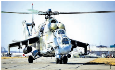
The Mil Mi-24 large helicopter gunship and attack helicopter.—ITAR-TASS