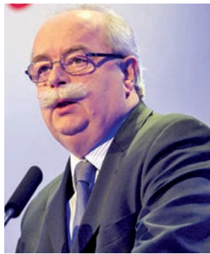
CEO of French multinational oil company Total, Christophe de Margerie.

"During taxi the jet collided at 11.57 pm Moscow Time on Monday (7.57 pm GMT) with a snow removal machine of the airport's service," the airport said at its website. The driver of the snow removal machine wasn't hurt.