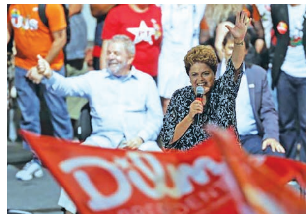
Brazil's President and Workers' Party (PT) presidential candidate Dilma Rousseff (R) gestures next to Brazil's former President Luiz Inacio Lula da Silva as they attend a campaign rally in Sao Paulo on 20 Oct, 2014.