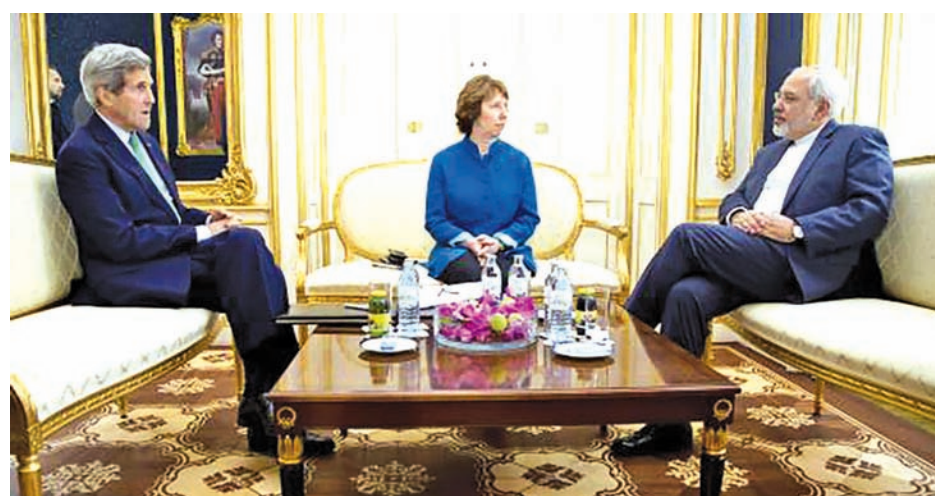
(L-R) US Secretary of State John Kerry, European Union Foreign Policy Chief Catherine Ashton, and Iran's Foreign Minister Mohammad Javad Zarif are photographed as they participate in a trilateral meeting in Vienna on 15 Oct, 2014.

The officials say that in talks in Vienna they too have offered what they call compromises over demands that Iran limit its nuclear programme, but they have been rejected by Teheran. "The bottom line is that