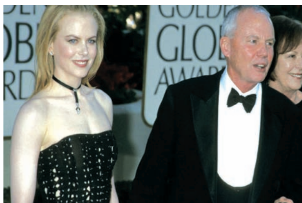
Nicole Kidman has been trying to paint on a brave face after her father tragically died on 12 September.