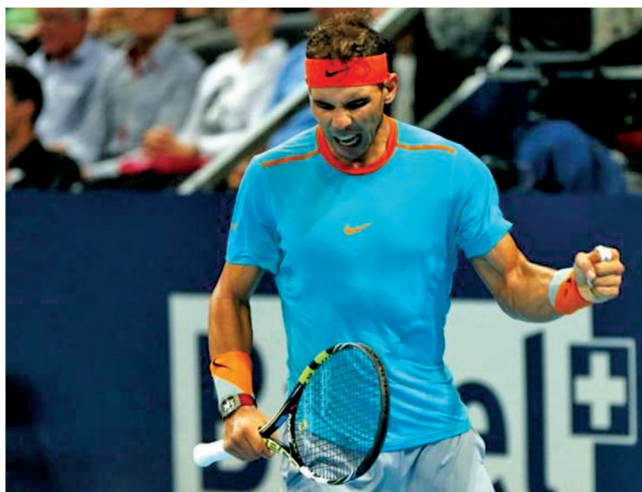
Spain's Rafael Nadal reacts after winning his tennis match against Simone Bolelli of Italy at the Swiss Indoors ATP tournament in Basel on 20 Oct, 2014.

BASEL, 21 Oct — Rafa Nadal did not appear to be affected by his appendicitis problems as he charged into the second round of the Swiss Indoors with a no nonsense 6-2, 6-2 win over Simone Bolelli on Monday.