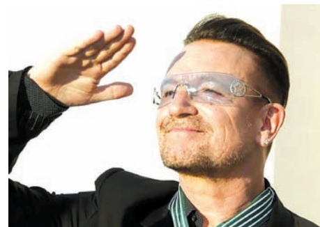
Bono, lead singer of the band U2

LOS ANGELES, 19 Oct — U2 frontman Bono has revealed the mystery behind his trademark sunglasses. The Irish rocker has glaucoma. Bono told British TV chat show host Graham Norton he had suffered from the condition for two decades, according to a preview clip released on Friday ahead of the latest episode of BBC's "The Graham Norton Show".