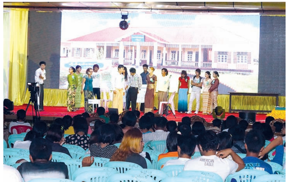
Contestants participate in performing arts competition of Rakhine State in Sittway.