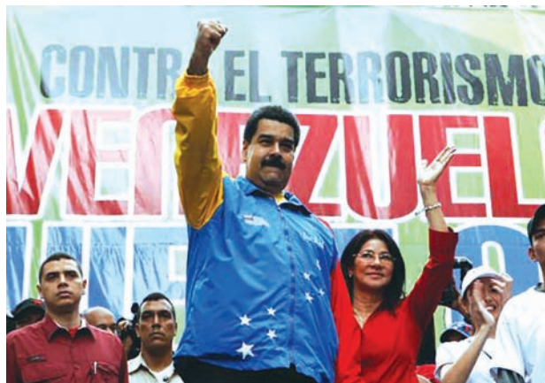
Venezuela's president Nicolas Maduro attends a rally for peace and against paramilitary forces in the country, in Caracas on 18 Oct, 2014.