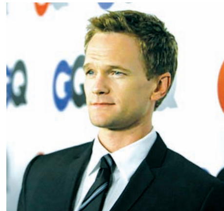
Neil Patrick Harris

Harris has hosted the Emmy Awards twice and the