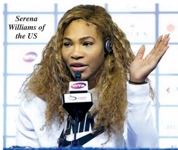
Serena Williams of the US

World number one Serena Williams headlines the event, but there are concerns about her fitness after the 33-year-old American quit the Beijing tournament earlier this month because of knee pain. Williams