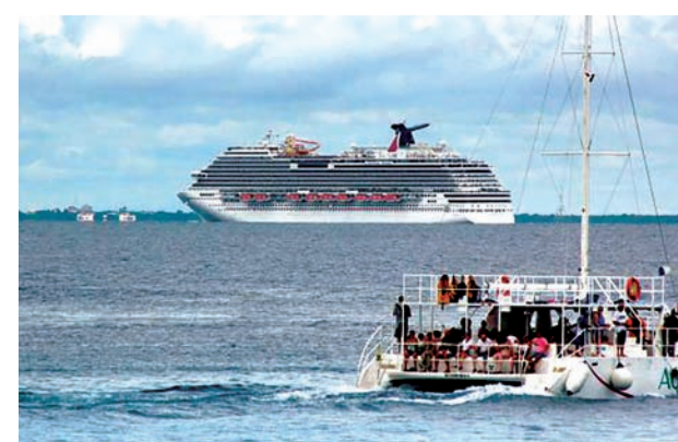
Tourists enjoy a ride on a catamaran as cruise ship Carnival Magic is seen near the shores of Cozumel on 17 Oct, 2014.