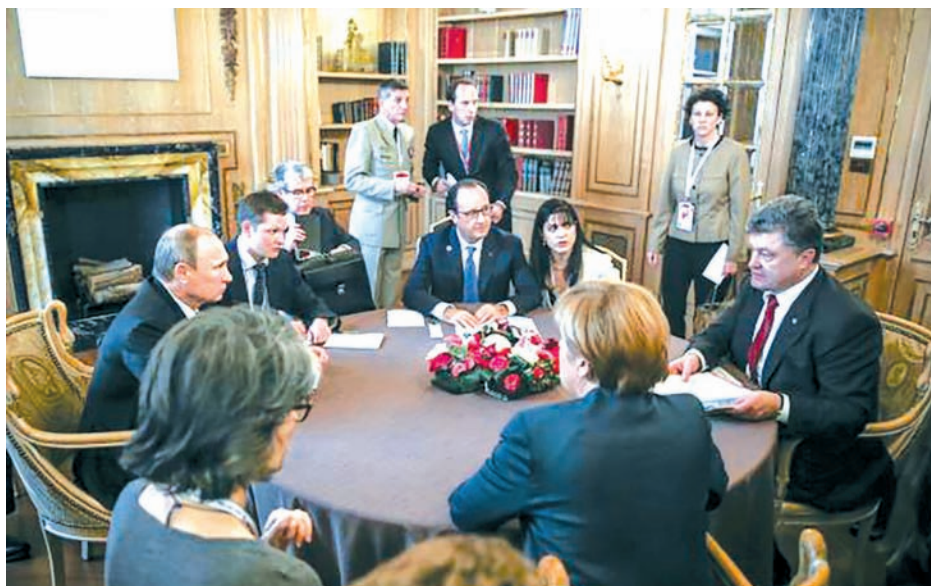
Ukraine's President Petro Poroshenko (R) talks with his Russian counterpart Vladimir Putin (L), as France's President Francois Hollande (C) watches during a meeting in Milan on 17 Oct, 2014.

An agreement signed in 2009 by former Prime