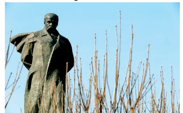
"Culture is beyond sanctions", — Russian Culture Minister said. —ITAR-TASS

RIGA, 19 Oct — Sanctions cannot affect Russia's cultural exchanges with foreign countries including Latvia, Russian Culture Minister Vladimir Medinsky told TASS on Saturday.