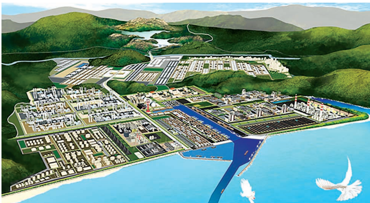
An artist's view of the Dawei Special Economic Zone in Myanmar.