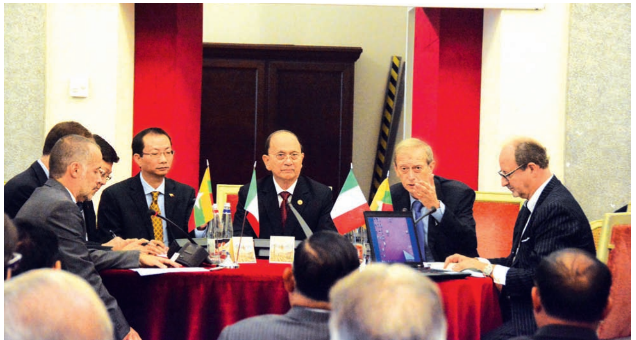
President U Thein Sein together with Turin Mayor Mr Piero Fassino meets leading business executives of Italy.

During the three-year term of the government, it has experienced challenges, difficulties and problems. However, the government did not derail from its commitments. We have decided not to go backsliding.