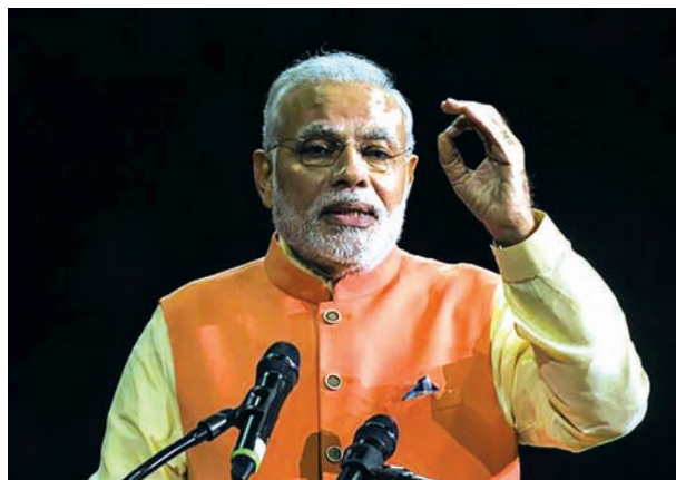
India's Prime Minister Narendra Modi

NEW DELHI, 19 Oct — Prime Minister Narendra Modi's Hindu nationalist party made big gains in two Indian state elections, partial results showed on Sunday, in an endorsement that will encourage him to step up the pace of economic reforms.