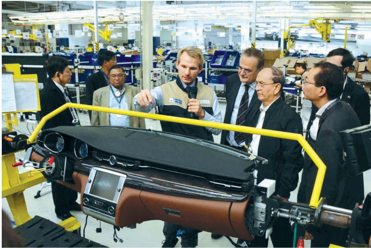
President U Thein Sein views production process at Maserati modern automobile factory of Fiat Company.

President U Thein Sein observes production of automobile, supply of electricity in Turin, Italy