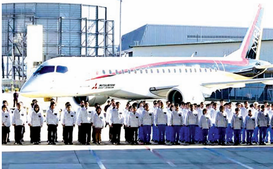
A Mitsubishi Regional Jet (MRJ) is unveiled at the hanger for its roll out ceremony at Mitsubishi Heavy Industries' Nagoya Aerospace Systems Works Komaki Minami Plant in Toyoyama town, Nagoya prefecture, in this photo taken by Kyodo on 18 Oct, 2014. —REUTERS

The ceremony, attended by about 500 people, kicks off a sprint to complete flight tests before the first delivery of the aircraft in June 2017 to ANA