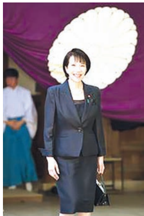
Internal affairs minister Sanae Takaichi

TOKYO, 19 Oct — Internal affairs minister Sanae Takaichi on Saturday became the first Cabinet minister to visit the war-linked Yasukuni Shrine in Tokyo during its four-day autumn festival through Monday, followed by the visit by fellow Cabinet ministers later in the day.