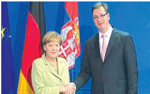
German Chancellor Angela Merkel and Serbian Prime Minister Aleksandar Vucic.

was regional stability, the Serbian government's press office said.