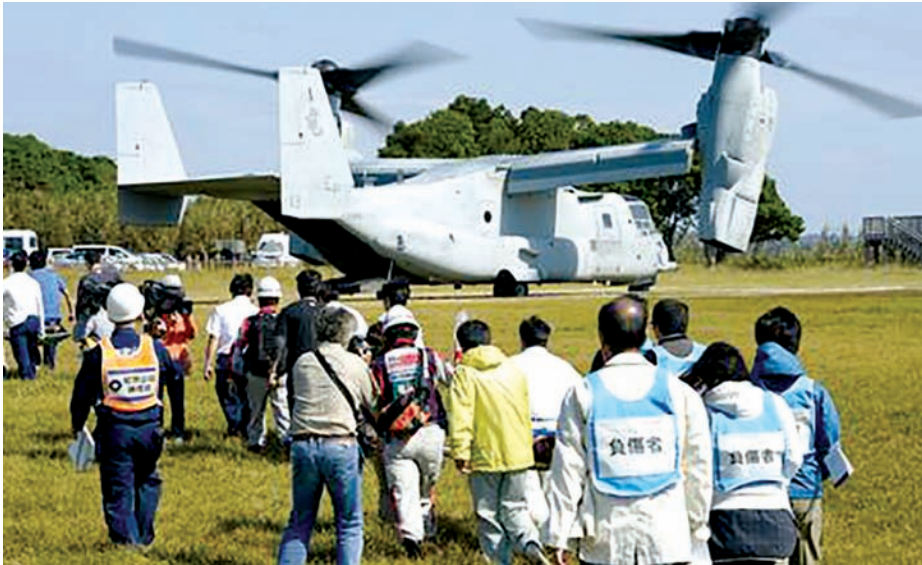
People walk to a MV-22 Osprey aircraft of the US Marine Corps during a tsunami disaster drill in the town of Kushimoto, Wakayama Prefecture, on 19 Oct, 2014. Two Ospreys from the Marines' Futenma Air Station in Okinawa took part in the disaster drill simulating a massive earthquake and tsunami originating in the Nankai Trough off central and western Japan.

WAKAYAMA, (Japan), 19 Oct — Two MV-22 Osprey aircraft of the US Marine Corps took part in a tsunami disaster drill in Wakayama Prefecture south of Osaka on Sunday, marking the first time the tilt-rotor combat troop carrier has been used in a disaster exercise organized by a local government.