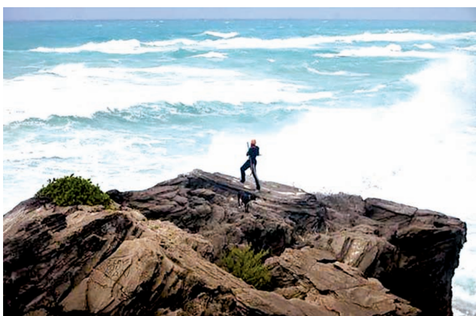
A man takes photos while standing on a cliff on the island's south shore battered by winds from approaching Hurricane Gonzalo, in Astwood Park, on 17 Oct, 2014.

“I think all of Bermuda would agree that we took a licking. We are a bit