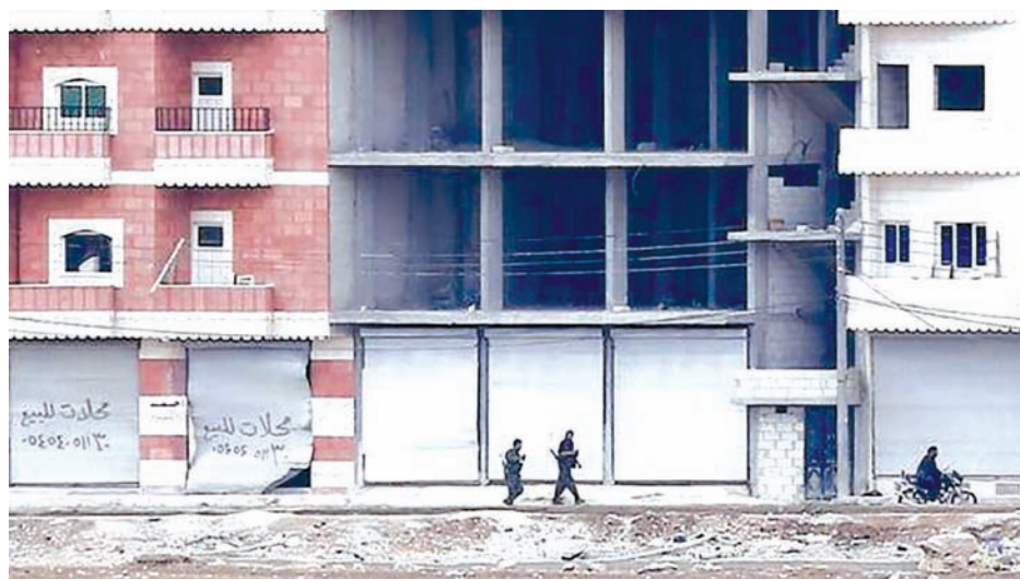
Kurdish fighters walk through a street in the Syrian town of Kobani on 19 Oct, 2014.

The Observatory reported two Islamic State car bombs hit Kurdish positions