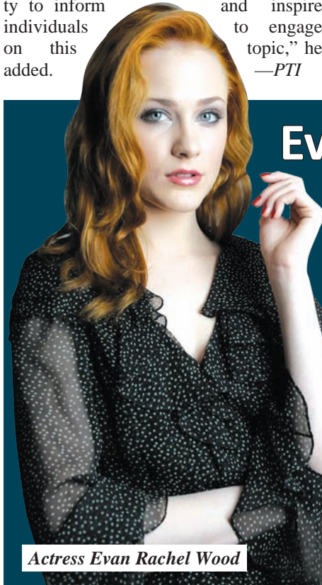
Actress Evan Rachel Wood

"Films like Virunga are powerful stories that are a window into the incredible cultural and natural diversity of our world, the forces that are threatening to destroy it, and the people who are fighting to protect it," DiCaprio said. "Partnering with Netflix on this film is an exciting opportunity to inform and inspire individuals to engage on this topic," he added. —PTI