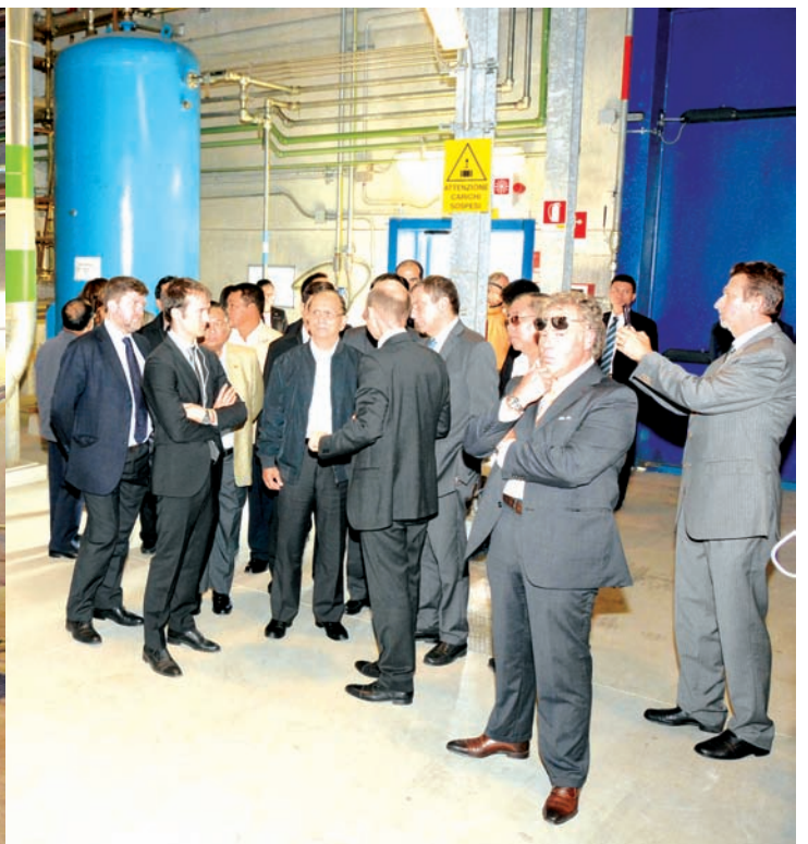
President U Thein Sein hears clarification on supply of electricity by officials of IREN Company.