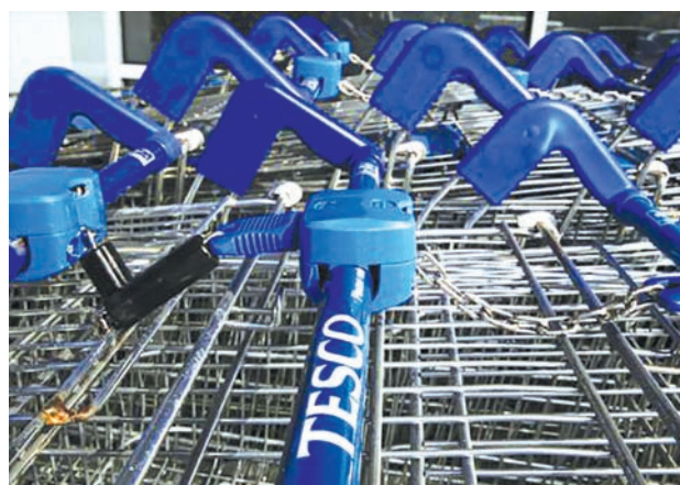
Shopping trolleys are seen at a Tesco Express in southwest London on 22 Sept, 2014.

On Thursday, Frontier Airlines said six crew members were placed on paid leave for 21 days "out of an abundance of caution," after learning that a nurse who had treated Duncan in Dallas may have been symptomatic when she flew on the airline earlier this week.—Reuters