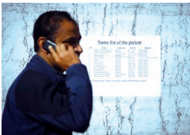
A man from a local travel agency talks to his friend on a mobile phone as he reads out names from a list showing the names of patients who were rescued from the recent avalanches and undergoing treatment at the Army hospital in Kathmandu on 16 Oct, 2014.