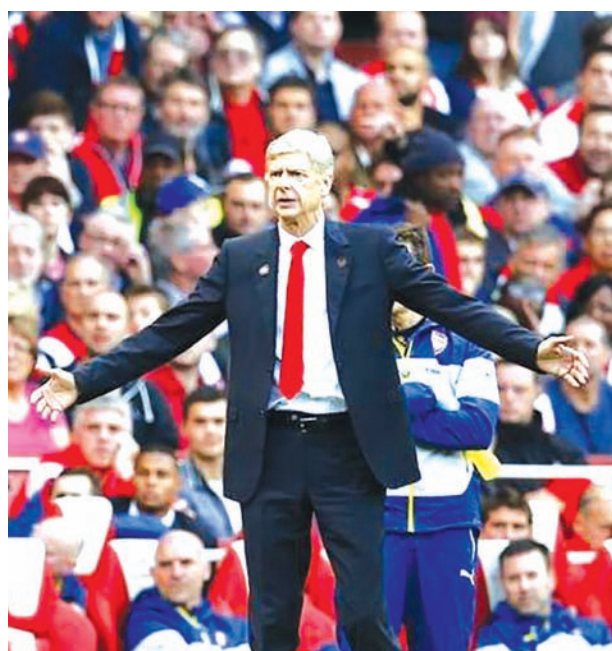
Arsenal's manager Arsene Wenger reacts during their English Premier League soccer match against Hull at the Emirates stadium in London on 18 Oct, 2014.

"We came out of the dressing-room with a lack of focus and gave them the lead straight away. The defensive concentration was missing on the second goal. At that level you cannot give the goals away like that."