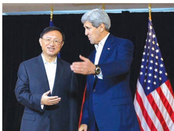
Chinese State Councillor Yang Jiechi (L) and US Secretary of State John Kerry speak to reporters prior to a meeting in Boston, Massachusetts, the United States, on 18 Oct, 2014.

Yang saluted "new and positive progress" that has been made in various aspects of the China-US ties since last year's summit