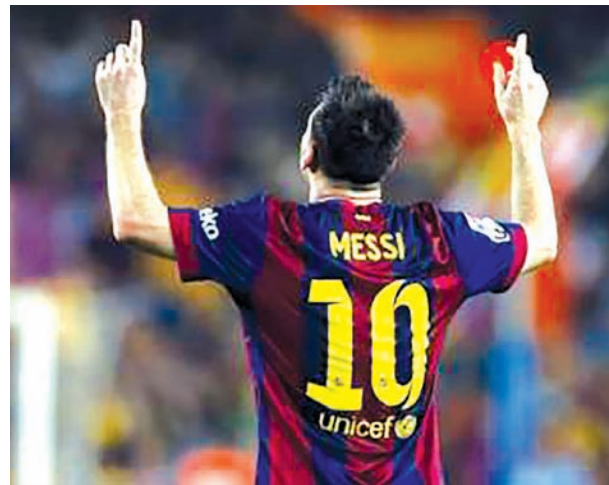
Barcelona's Lionel Messi celebrates a goal against Eibar during their Spanish first division soccer match at Camp Nou stadium in Barcelona on 18 Oct, 2014.