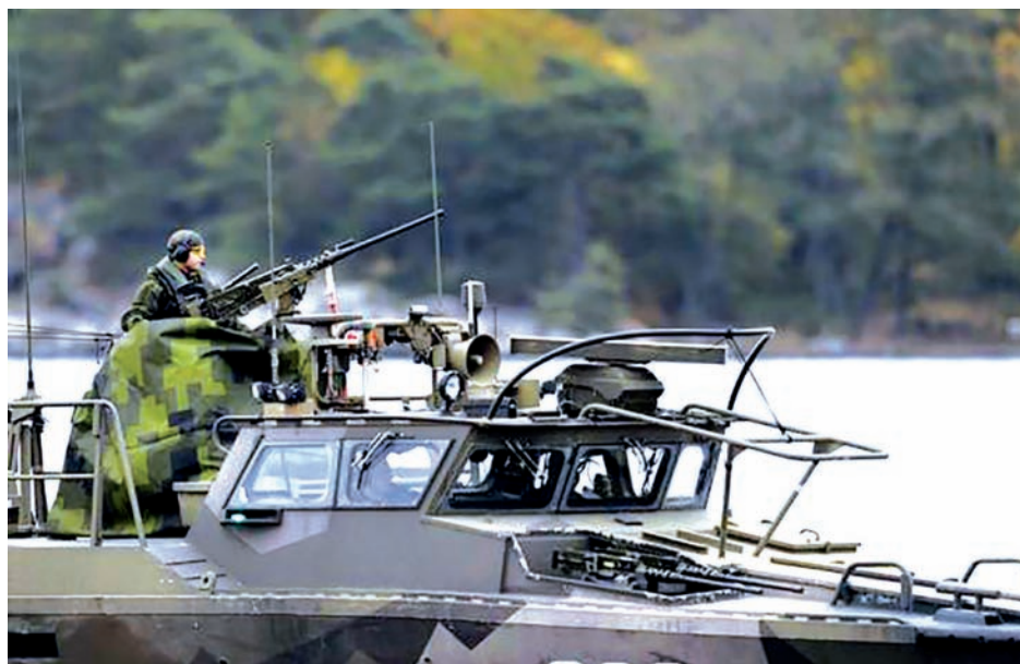
Crew members onboard a Swedish Navy fast-attack craft stand guard at the Stockholm archipelago, in Sweden, on 18 Oct, 2014.