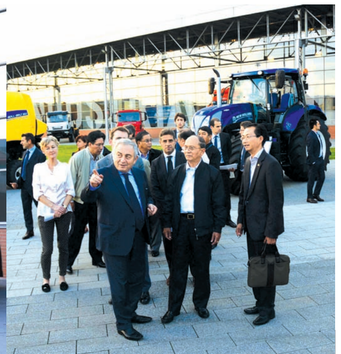
President U Thein Sein and party visit products of CNH Industries.