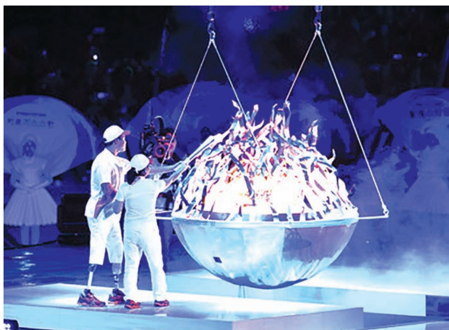
Photo taken on 18 Oct, 2014, shows the sacred fire lit during the opening ceremony of the 2014 Asia Para Games in Incheon, South Korea. Around 4,500 athletes from 41 nations and regions will participate in 23 games.