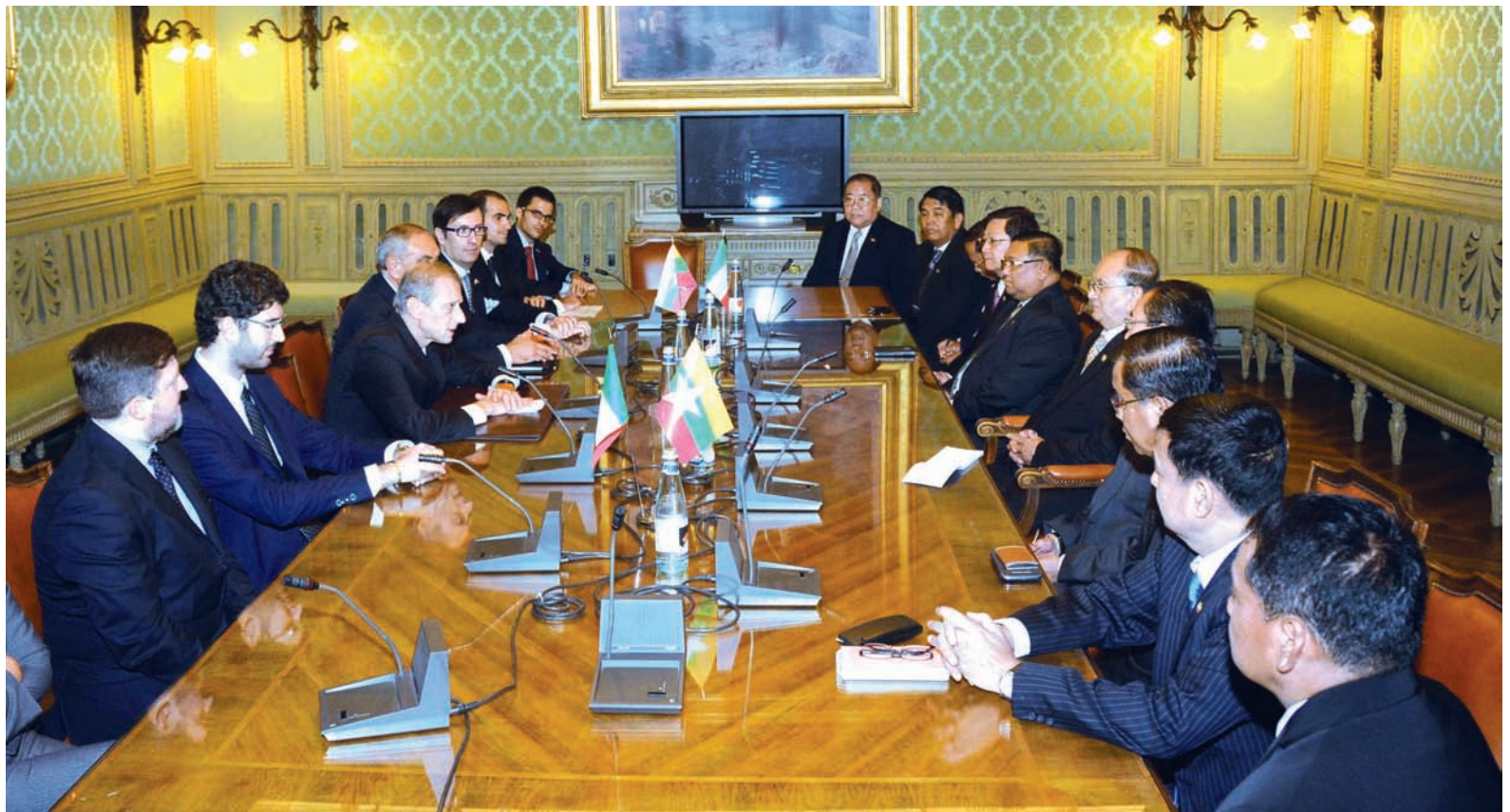
President U Thein Sein holds talks about establishing sister cities between Turin and Yangon with Turin Mayor Piero Fassino.

During the meeting, the president and the mayor held discussions on establishing sister cities between Turin and Yangon,