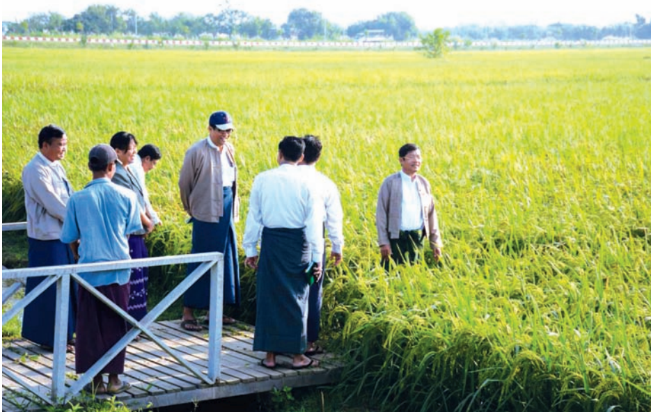
Union Minister for Agriculture and Irrigation U Myint Hlaing views thriving paddy plantation.

NAY PYI TAW, 19 Oct — Union Minister for Agriculture and Irrigation U Myint Hlaing urged the residents from Dekkhinathiri Township here to accelerate their efforts to create a developed country on Sunday on his inspection