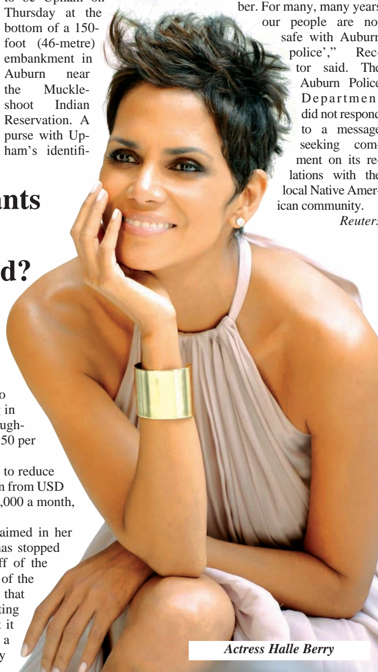
Actress Halle Berry