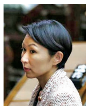
Japan's Economy, Trade and Industry Minister Yuko Obuchi

to Tokyo in the afternoon from Milan, where he joined other leaders from