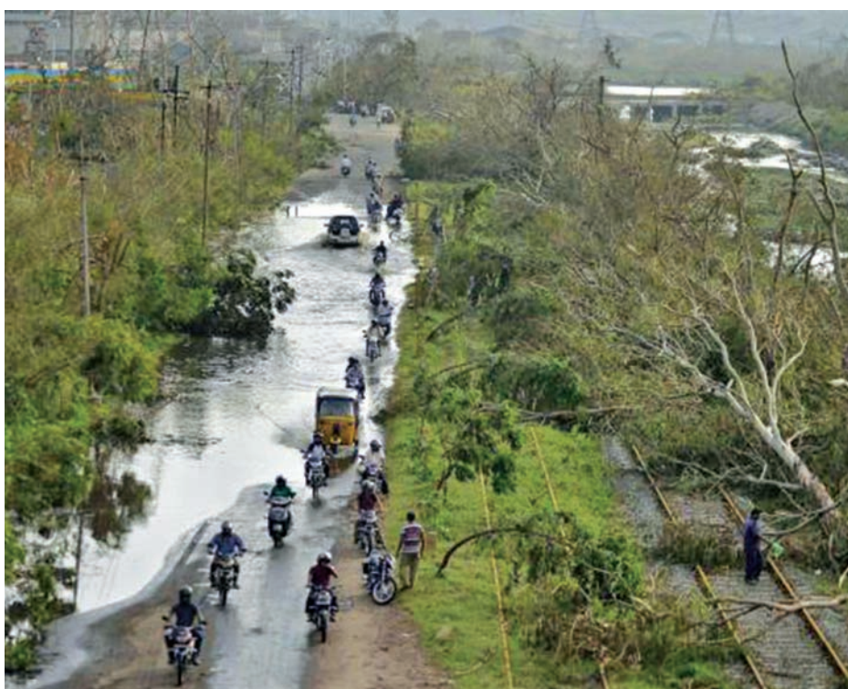
Vehicles move through a flooded road next to the trees fallen over railway tracks after being damaged by strong winds caused by the Cyclone Hudhud in the southern Indian city of Visakhapatnam on 14 Oct, 2014.

While the death toll jumped to 38 in Andhra Pradesh, officials in Odisha