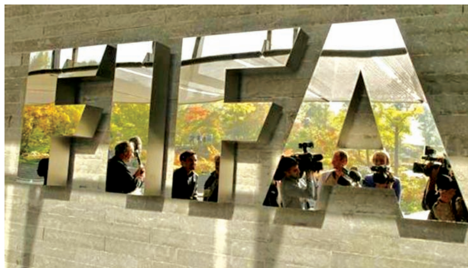
Journalists are reflected in a logo at the FIFA headquarters after a meeting of the executive committee in Zurich on 4 Oct, 2013.