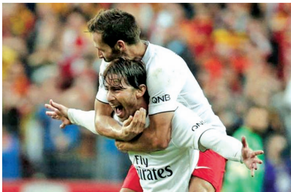
Paris St Germain's Maxwell celebrates with team-mate Yohan Cabaye (top) after scoring their team's second goal during their French Ligue 1 soccer match against RC Lens at the Stade de France in Saint-Denis near Paris on 17 Oct, 2014.