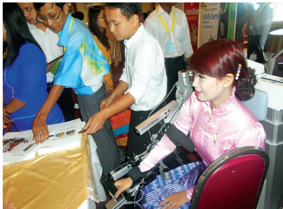
Myanmar model demonstrates how to use a popular machine to treat people affected by injuries, illness or disability.

She expressed her opinion that modern technology affect over thirty-year-old patients, causing them to suffer bulbous enlargement. Most of them are computer programmers and accountants, she said urging people to take regular exercises to avoid such cases.