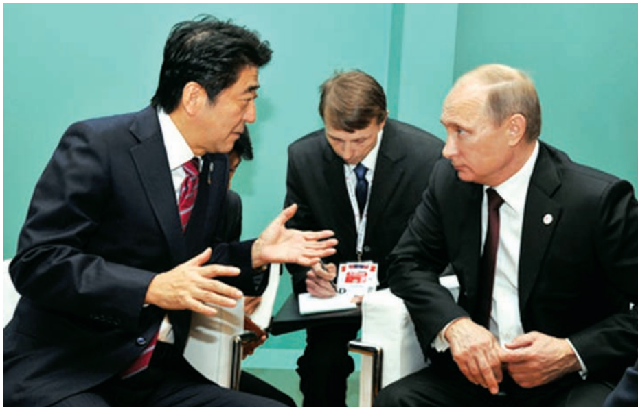
Supplied photo shows Japanese Prime Minister Shinzo Abe (L) talking with Russian President Vladimir Putin on 17 Oct, 2014, in Milan, Italy, on the sidelines of a summit of the Asia-Europe Meeting. In their first face-to-face conversation since the Ukraine crisis erupted, Abe and Putin confirmed their plan to meet formally during the Asia-Pacific Economic Cooperation forum summit in Beijing in November.