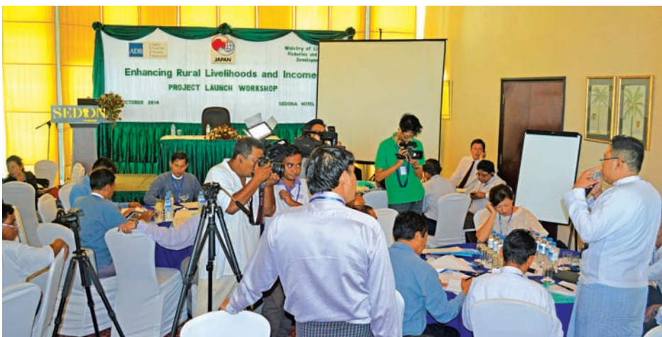
Department of Rural Development and Asian Development Bank undertake a workshop to seek public consultation over implementation of Japan-funded Enhancing Rural Livelihoods and Incomes Project in six townships in Myanmar.