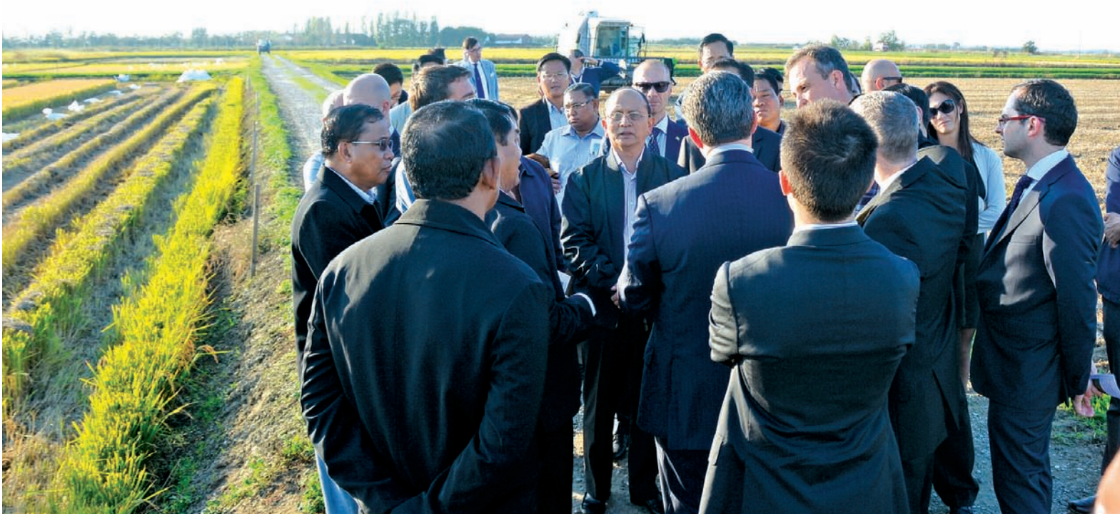
President U Thein Sein visits Paddy Seed Research Centre in Castello d' Agonga (PV) of Milan in Italy on Friday.

MILAN, 18 Oct—President U Thein Sein visited the Paddy Seed Research Centre in Castello d' Agonga (PV) of Milan in Italy, on Friday.