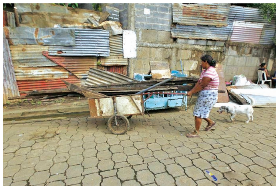
A resident displaced by landslides moves her belongings in Managua, capital of Nicaragua, on 17 Oct, 2014. Nine people dead as the result of a landslide and collapse of a perimeter wall of the residential "Lomas del Valle" according to rescue groups on Friday.