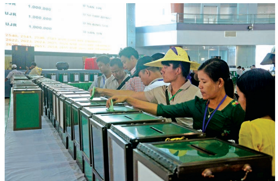
Bidders put their bidding forms in tender boxes on the fifth day of gems and utility jade sales in Nay Pyi Taw.—MNA

merchants but also local markets for finished gem stones. A local gem merchant suggested that jade lots should be placed in the same serial order and that spaces between them should be wide enough for visitors to examine with ease.—MNA