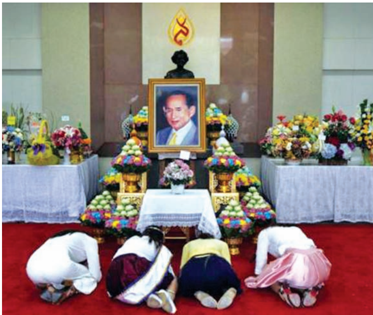
Well-wishers pray for the health of Thailand's revered King Bhumibol Adulyadej at the Siriraj hospital in Bangkok on 8 Oct, 2014. —REUTERS

The health of Bhumibol has formed the backdrop to a complex crisis being fought out between Thailand's rival business and political elites. He is widely seen as a unifying figure and moral arbiter among Thais.—Reuters