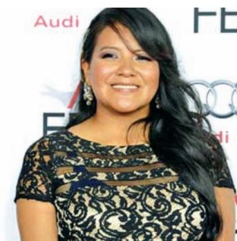
Actress Misty Upham

SEATTLE/ LOS ANGELES, 18 Oct — "August: Osage County" actress Misty Upham's body, found at the bottom of a deep river embankment near Seattle, was officially identified on Friday by a Washington state coroner, more than a week after her family reported her missing.