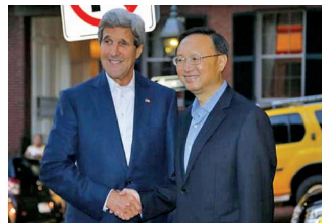
US Secretary of State John Kerry greets China's State Councilor Yang Jiechi (R) outside Kerry's home in Boston, Massachusetts on 17 Oct, 2014.

Analysts familiar with US thinking expect the Boston talks to include discussion of intelligence cooperation, including tracking militant movements and financing. China is also keen to lay out a strong agenda for a summit between its President Xi Jinping and Obama in Beijing on 12 November after a meeting of the Asia-Pacific Cooperation forum (APEC). China hopes the leaders will be