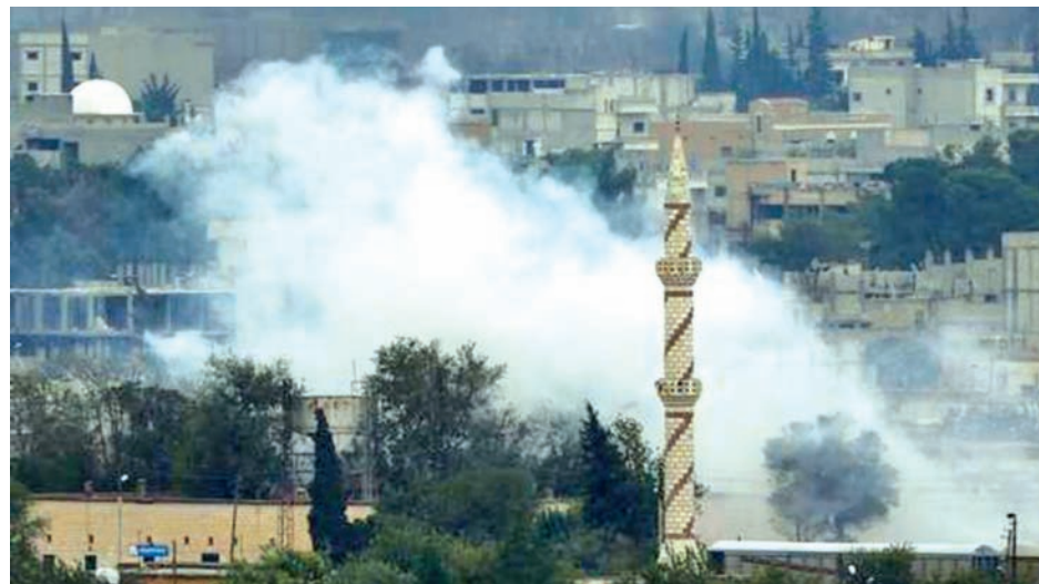
Smoke rises from the Syrian town of Kobani, seen from near the Mursitpinar border crossing on the Turkish-Syrian border in the southeastern town of Suruc in Sanliurfa Province, on 17 Oct, 2014.

WASHINGTON, 18 Oct — The head of US troops in the Middle East said on Friday Iraqi forces are "incrementally" recapturing ground from Islamic State militants who seized much of the country's northwest this year, but he added that major Iraq advances will take time.