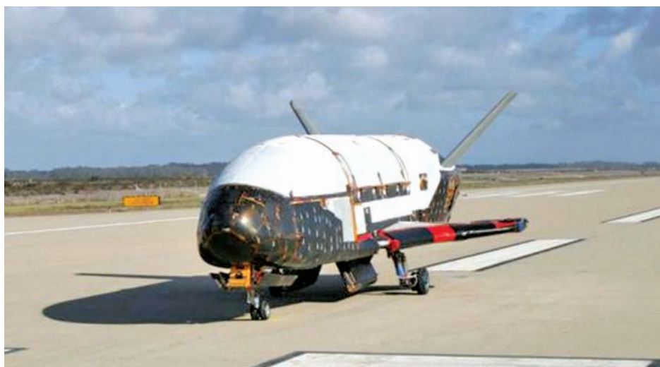
The X-37B Orbital Test Vehicle taxis on the flightline in June 2009 at Vandenberg Air Force Base, California.