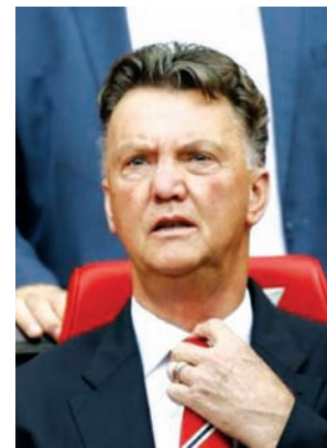
Manchester United manager Louis Van Gaal

day), we didn't need any players from the second team and that is a plus," Van Gaal said. "I am very happy because there are no injuries from the international games."