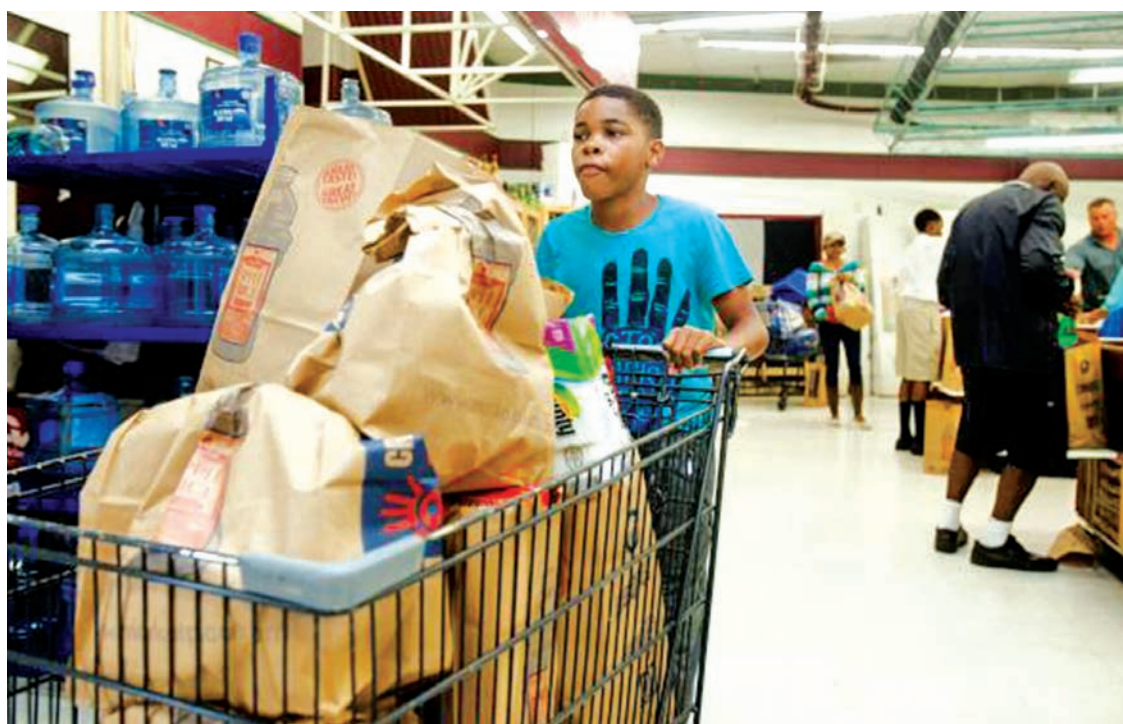
Shoppers stock up on groceries as they prepare for the arrival of Hurricane Gonzalo in Hamilton, on 16 Oct, 2014.

While damage was believed to be widespread, authorities were unable to immediately get into the streets to assess the full extent, said Sergeant Russann Fran-