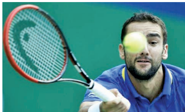
Marin Cilic of Croatia returns a shot during his men's singles tennis match against Ivo Karlovic of Croatia at the Shanghai Masters tennis tournament on 6 Oct, 2014.

While the omens are not fantastic for United — they have won only one of their last five Premier League matches played on a Monday — they are dire for West Brom. The Baggies have won only two of their previous 18 Premier League matches played on a Monday.