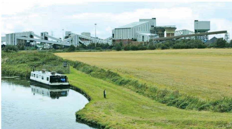
A general view shows the Kellingley Colliery in Knottingley, northern England on 14 Aug, 2014.