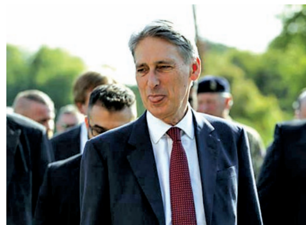
British Foreign Secretary Philip Hammond

If re-elected, Cameron has promised to renegotiate Britain's EU ties before holding a referendum