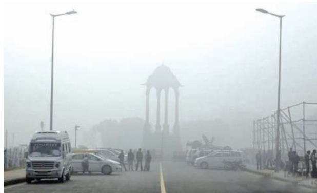
Vendors selling drinks stand beside vehicles near the India Gate war memorial on a smoggy day in New Delhi on 1 Feb, 2013.