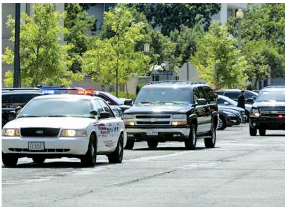
A motorcade believed to be carrying Libyan militia leader Ahmed Abu Khatallah speeds away from the US federal courthouse in Washington on 28 June, 2014.

Khatallah was captured in Libya in June by a US military and FBI team and transported to the United States aboard a US Navy ship to face charges in