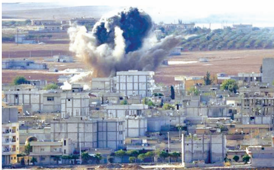
Smoke rises from the Syrian town of Kobani, seen from near the Mursitpinar border crossing on the Turkish-Syrian border in the southeastern town of Suruc in Sanliurfa province on 15 Oct, 2014.

War on the militants in Syria is threatening to unravel a delicate peace