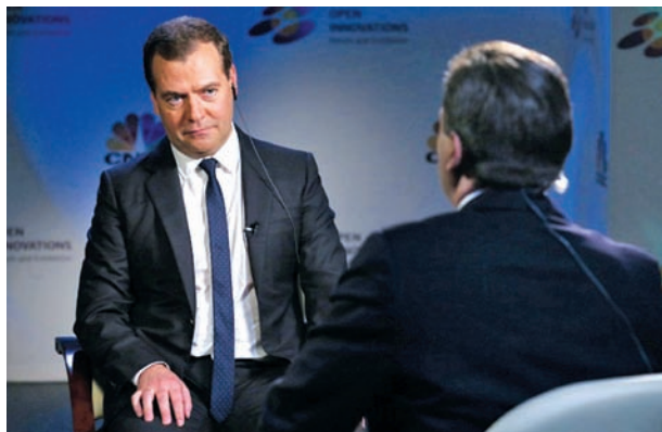
Russian Prime Minister Dmitry Medvedev

By pulling back troops from the border with Ukraine, Russia did not intend “to give a signal” to Washington, Medvedev noted. “This is not a signal to Washington. It is Russia’s domestic decision. This can be interpreted in any way, but this is not a signal,” the premier said. “Any decisions that Russia takes, including those regarding our armed forces, are within our authority, the authority of the Russian president, and are not linked with the situation we witness there (in Ukraine), though we are certainly quite strongly