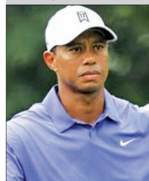
Tiger Woods of the US

NEW YORK, 15 Oct — Former world number one Tiger Woods and five-times major champion Phil Mickelson have been named on an 11-man United States Ryder Cup Task Force.