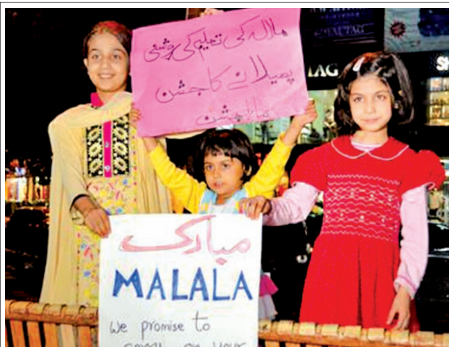
People in Pakistan celebrate Malala's Nobel win: Girls participating in a gathering hold message boards in Islamabad, Pakistan on 14 Oct, 2014, to congratulate Malala Yousafzai, a Pakistani teenager and education activist, on winning the Nobel Peace Prize on 10 Oct.