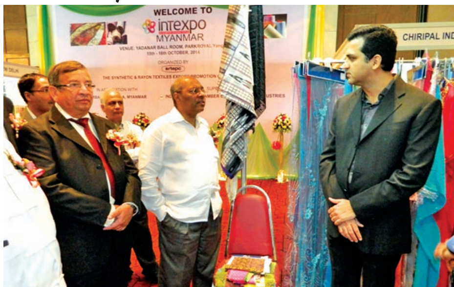
Guests view round textile products at booths at INTEXPO Myanmar 2014 at Parkroyal Hotel in Dagon Township.