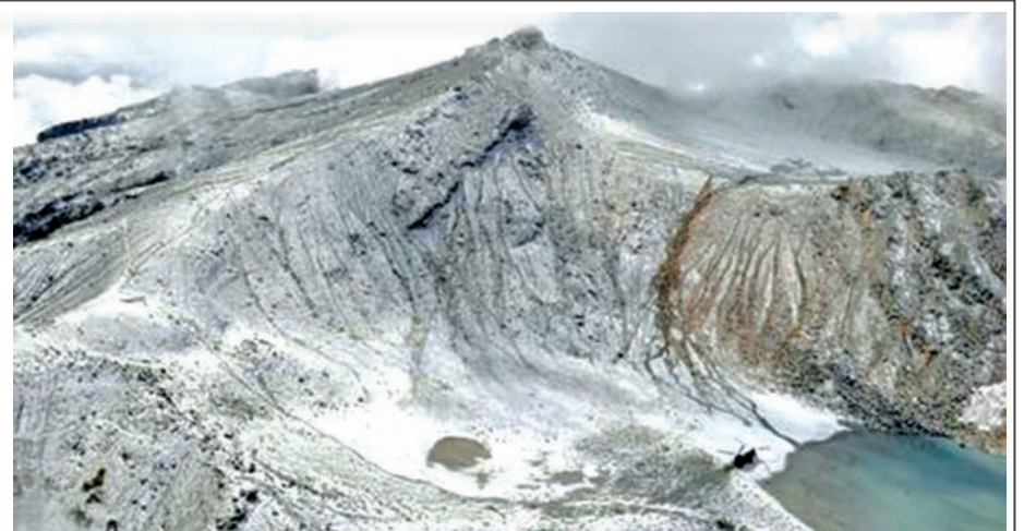
Snowcapped Mt Ontake Photo taken from a Kyodo News helicopter on 15 Oct, 2014, shows snowcapped Mt Ontake in central Japan, whose eruption on 27 September has claimed 56 lives with seven people remaining missing. Kengamine, the highest peak of the mountain, is seen in the background and one of its ponds, called Ninoike, is seen in front.