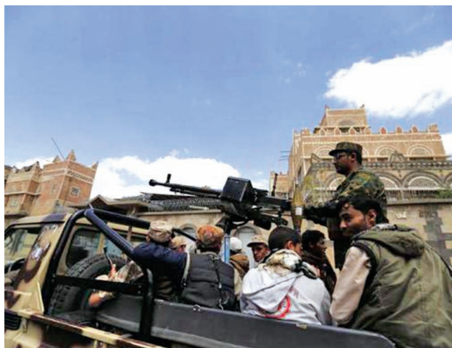
Shi'ite Houthi militants patrol the vicinity of a venue where a mass funeral for victims of a suicide attack on followers of the Shi'ite Houthi group was being held in Sanaa on 14 Oct, 2014.