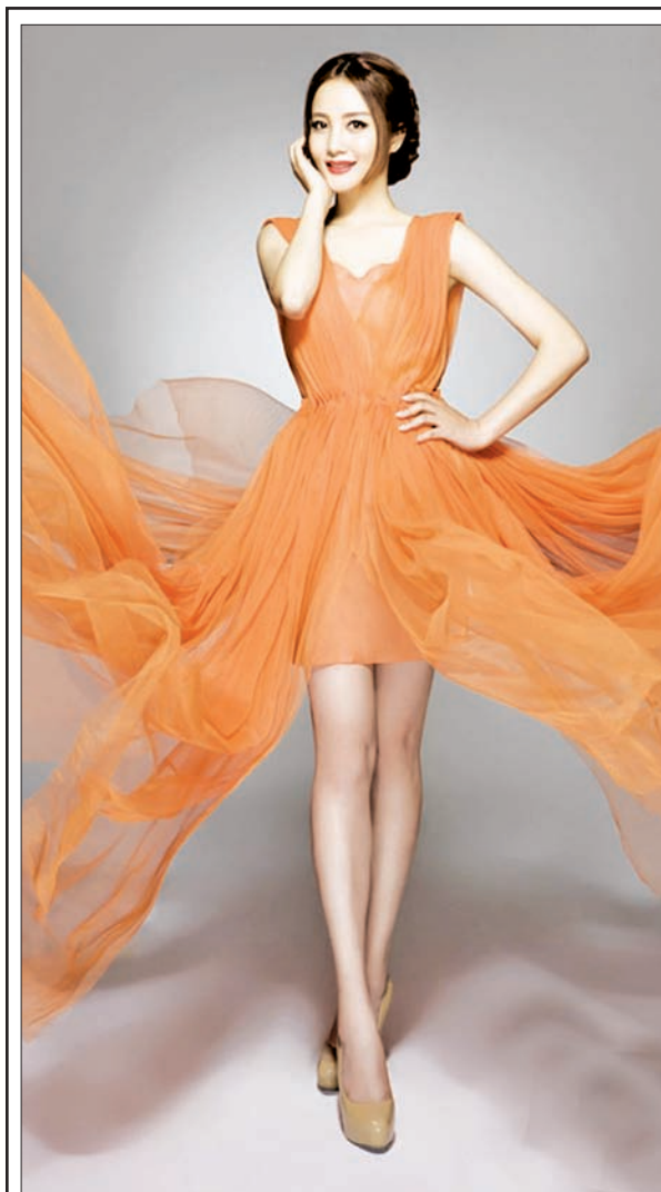
Chinese actress Tao Hong looks so charming and graceful in her latest fashion shoot.