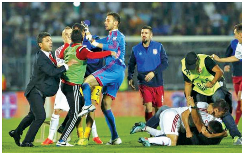
Fans and players of Serbia and Albania scuffle during their Euro 2016 Group I qualifying soccer match at the FK Partizan stadium in Belgrade on 14 Oct, 2014.

BELGRADE, 15 Oct — The politically-sensitive Euro 2016 qualifier between Serbia and Albania was abandoned on Tuesday following a brawl between players from both sides after a flag stunt.