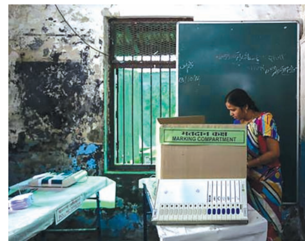
A woman casts her vote at a polling station during Maharashtra state elections, in Mumbai on 15 Oct, 2014.