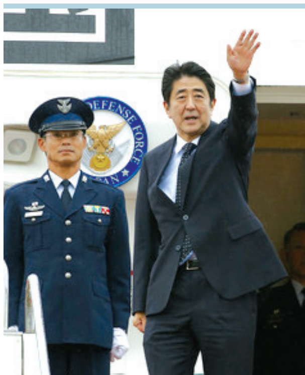
Japanese Prime Minister Shinzo Abe (R) waves as he leaves Tokyo's Haneda airport on 15 Oct, 2014, for Italy to attend a two-day Asia-Europe Meeting summit that will begin the following day in Milan.

Despite the relatively muted performance of Modi's government so far, investors still view him positively, as reflected in Mumbai's financial markets.