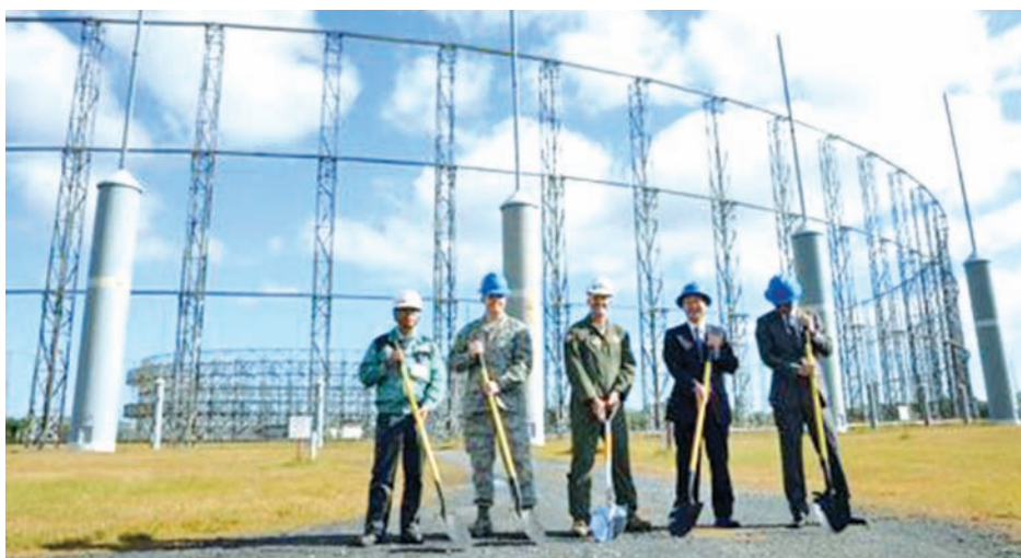
A ceremony is held in front of an antenna array at the US military’s Misawa Airbase in Aomori Prefecture on 15 Oct, 2014, before the military began dismantling the aged facility, nicknamed the “Elephant Cage,” that was used to intercept radio transmissions during the Cold War era.

AOMORI, (Japan), 15 Oct — The US military began on Wednesday a year-long project to dismantle an aged antenna array nicknamed the “Elephant Cage” at its Misawa Airbase in northern Japan that was used to intercept radio transmissions during the Cold War era.