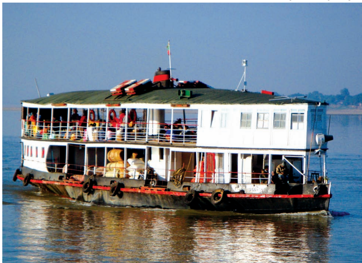
Inland Water Transport's ferry on the Ayeyawady River.

IWT had been operating its transportation at losses and at affordable prices for the people for decades thanks to the budget allocation from the successive governments.