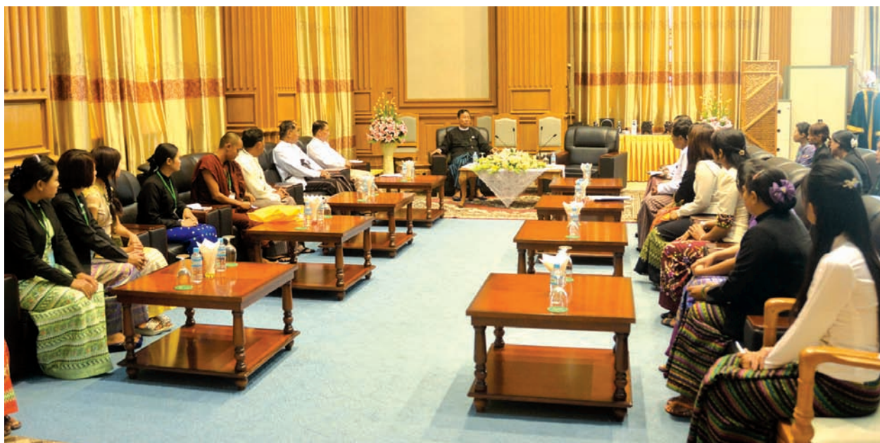
Speaker of Pyidaungsu Hluttaw and Pyithu Hluttaw Thura U Shwe Mann explains process of Pyithu Hluttaw to Law major students of Mandalay University.