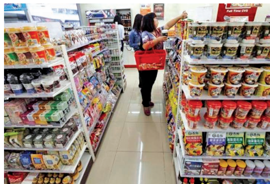
Customers choose goods at a shop in Beijing on 14 Oct, 2013.

While previous research had shown that couches were particularly hazardous for infants, the new study published on Monday identified significant factors linked to infant deaths on sofas.