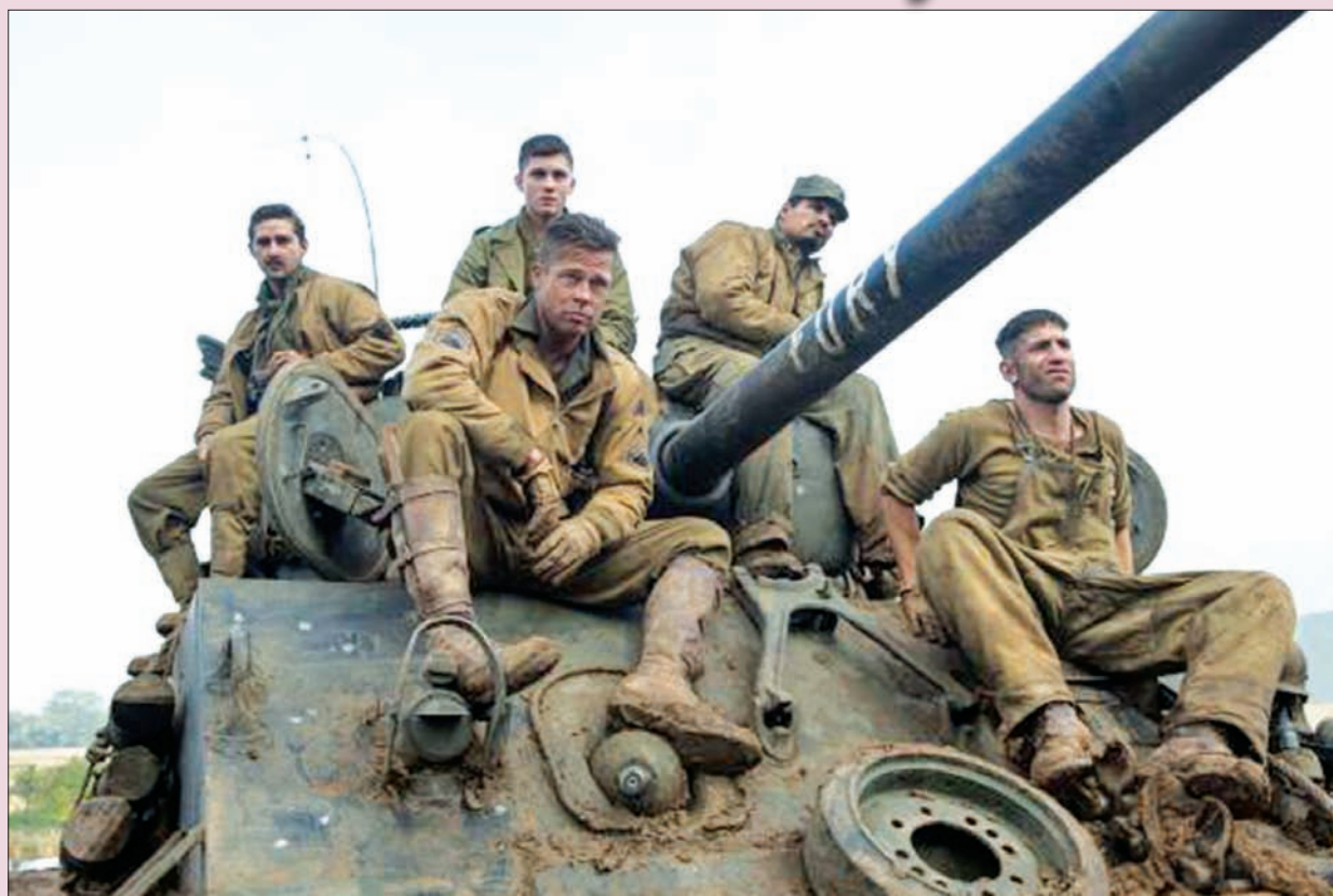
Shia LaBeouf as Boyd “Bible” Swan, Logan Lerman as Norman, Brad Pitt as Wardaddy, Michael Pena as Trini “Gordo” Garcia and Jon Bernthal as Grady “Coon-Ass” Travis in Columbia Pictures’ Fury.

LOS ANGELES, 15 Oct — When writer-director David Ayer decided to tackle the “beaten-to-death” World War Two movie genre with “Fury,” he decided to make it an intimate affair for his cast