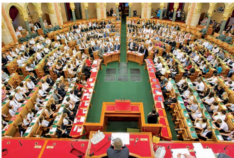
Children attend session of the Children's Parliament in Hungarian parliament building in Budapest, Hungary on 14 Oct, 2014. Hungarian parliament and the International Children's Safety Service Tuesday hosted the fourth Children's Parliament. Hungarian children from various cities in Hungary and abroad were chosen to take part in the event and were offered the possibility to ask questions to some of the politicians attending their session.

Then Police Minister Anne Tolley said in April that Customs and Police staff would also travel to China to take part in targeted operations and to increase the level of engagement with Chinese enforcement agencies.