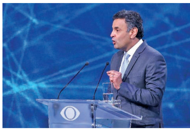
Aécio Neves, presidential candidate for the Brazilian Social Democrat Party, attend a television debate with Dilma Rousseff (not pictured), Brazil's president and presidential candidate for the Worker's Party, in Sao Paulo on 14 Oct, 2014. Brazil will hold presidential runoff between Dilma Rousseff and Aécio Neves on 26 Oct.

Rousseff retorted by pointing to an airport Neves built adjacent to an uncle's farm when he was governor