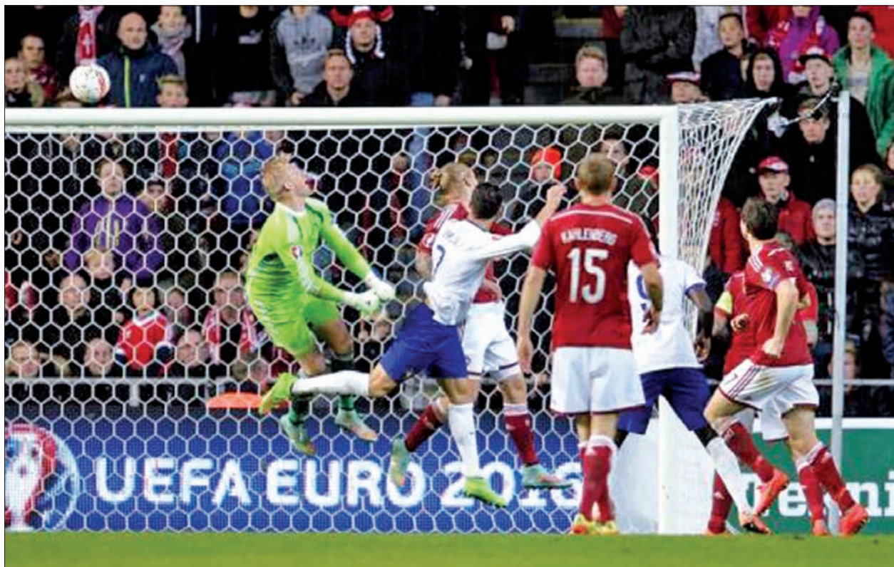
Portugal's Cristiano Ronaldo scores during their EURO 2016 qualifying soccer match against Denmark at Parken Stadium in Copenhagen on 14 Oct, 2014.