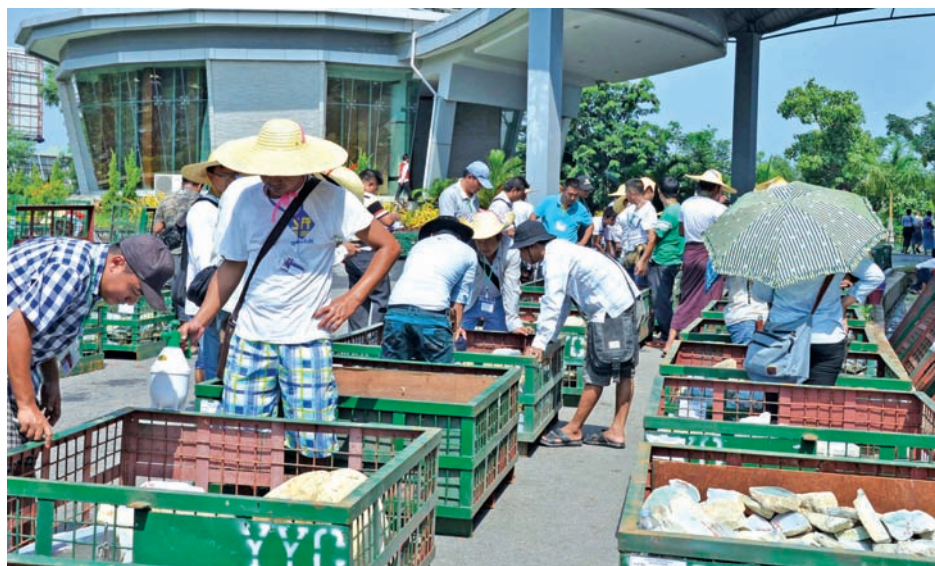
Gem merchants check gem stones and utility jade stones at Mani Yadana Jade Hall in Nay Pyi Taw.

Likewise, winners in the tenders for jade lots will be announced from 17 to 20 October. Thanks to the sales, the gems entrepreneurs will have materials.