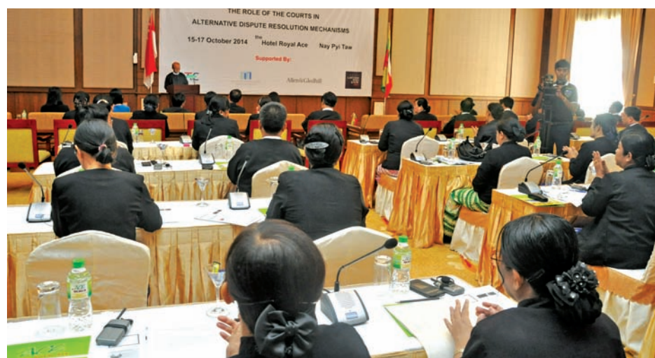
Workshop on role of courts in alternative dispute resolution mechanisms in progress at Royal Ace Hotel in Nay Pyi Taw.—MNA

NAY PYI TAW, 15 Oct — Under the MoU on Singapore-Myanmar bilateral cooperation in legal affairs, the Supreme Court of the Union and Ministry of Law of Singapore jointly organized the Workshop on role of courts in alternative