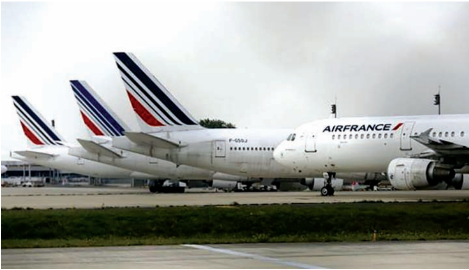
Air France planes are parked on the tarmac at the Charles de Gaulle International Airport in Roissy, near Paris on the second week of a strike by Air France pilots on 22 Sept, 2014.

PARIS, 12 Oct — Air France-KLM is pressing ahead with expansion of its low cost brand in France