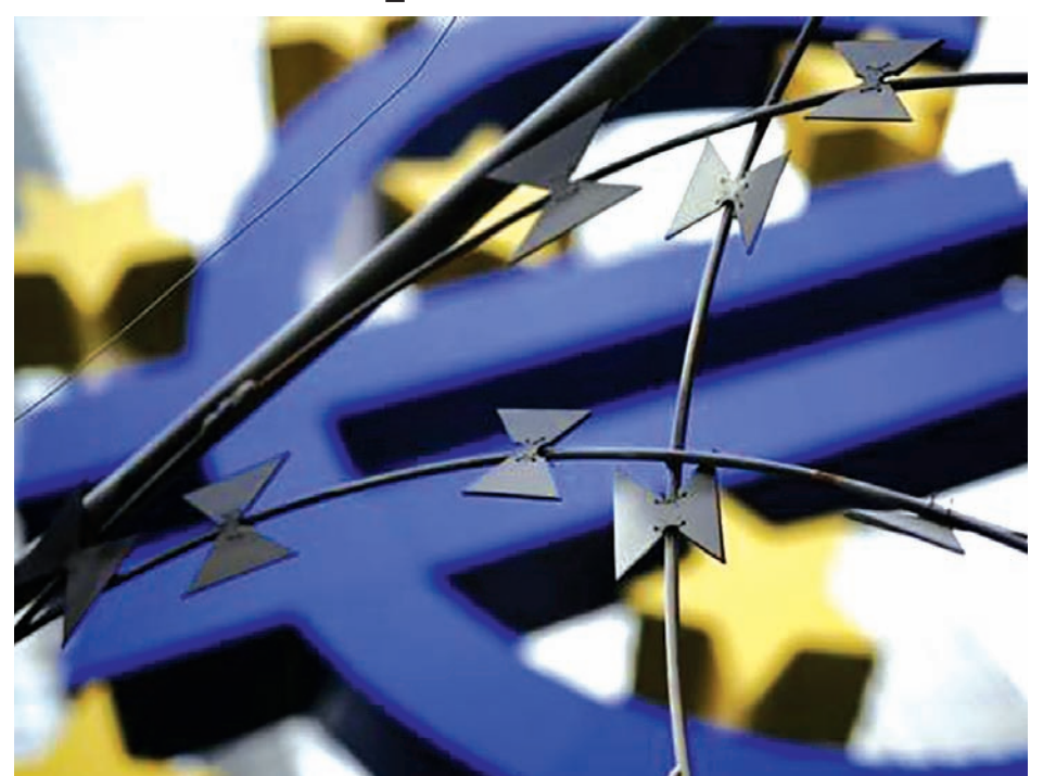
Protestors left some barbed wire in front of the euro sign landmark outside the headquarters of the European Central Bank (ECB) before the ECB's monthly news conference in Frankfurt, on 4 Sept, 2014.