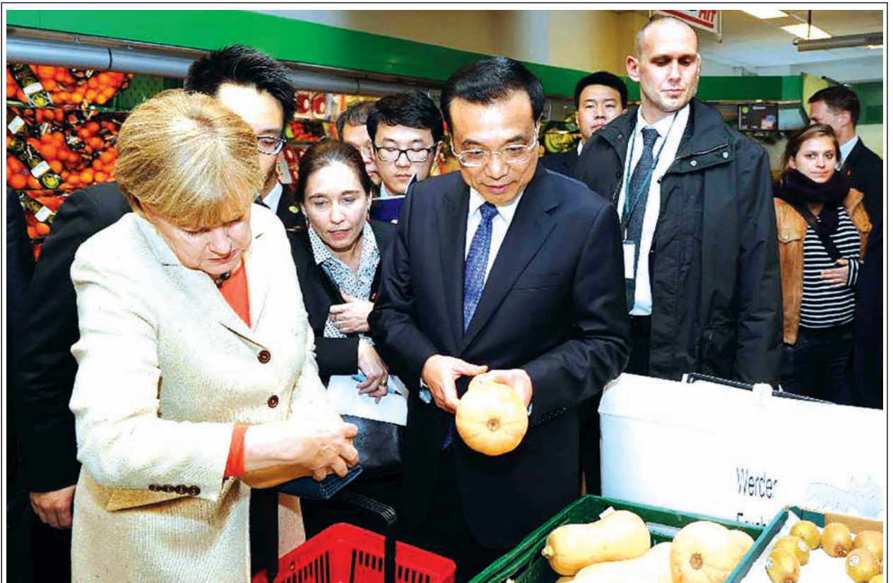
Chinese Premier Li Keqiang (C) and German Chancellor Angela Merkel (L) visit a supermarket after the bilateral governmental consultations in Berlin, Germany, on 10 Oct, 2014.