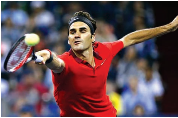
Roger Federer of Switzerland returns a shot during his men's singles semi-final match against Novak Djokovic of Serbia at the Shanghai Masters tennis tournament in Shanghai on 11 Oct, 2014.

The 27-year-old Djokovic kept muttering to himself and appeared frustrated