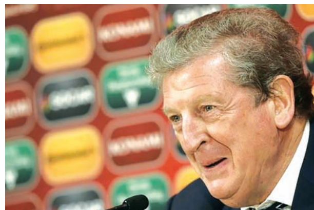
England's soccer team coach Roy Hodgson

"There were elements of leadership but it was his ideas on principles of play and how you should defend and attack. There were interesting things that stuck