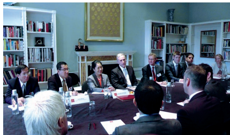
Union Minister for Social Welfare, Relief and Resettlement Dr Daw Myat Myat Ohn Khin holds talks with British officials about social production.

During his trip, the Union minister inspected maintenance of Minbu-Salin road, and Salin-Kanbya-Sedoktara road and bridges, cultivation of monsoon paddy along both sides of the roads and development of Salin.