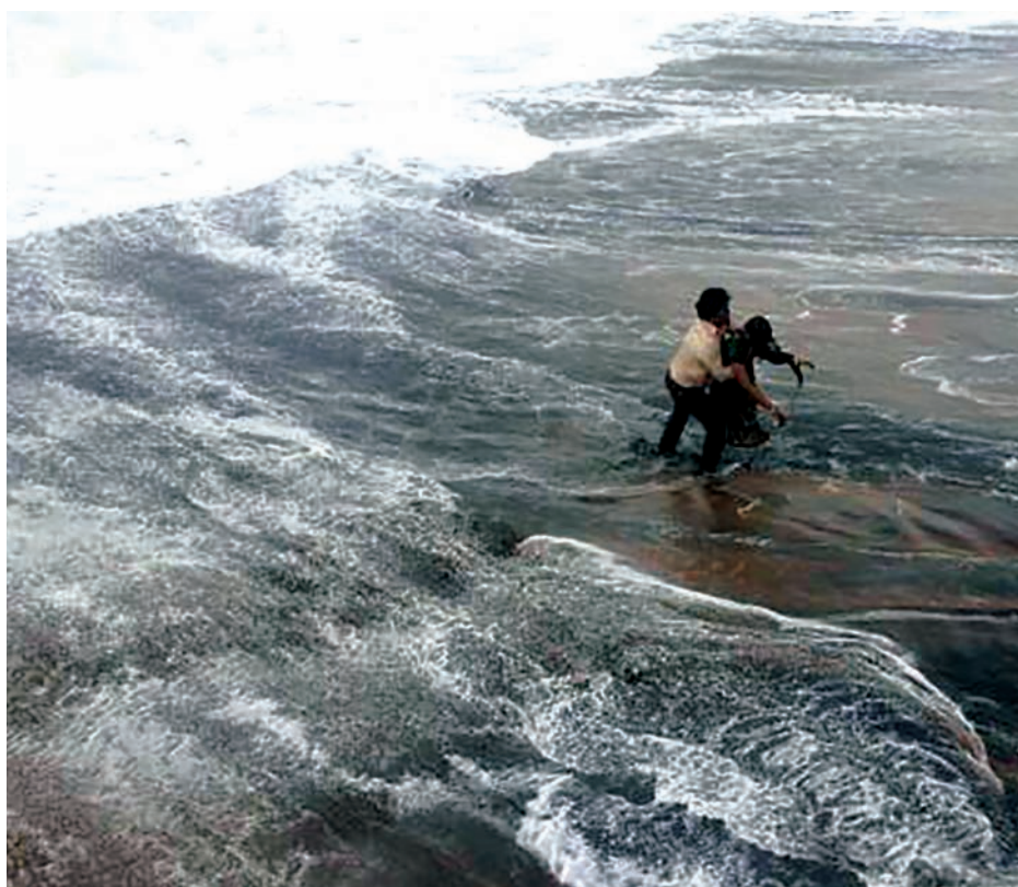
A man carries his wife to a safer ground after a wave hits a beach in Gopalpur in Ganjam district in the eastern Indian state of Odisha on 12 Oct, 2014.

NEW DELHI, 12 Oct — At least six people were killed Sunday when severe cyclone "Hudhud" hit the east coast of India with winds of almost 200 kmph, said officials.