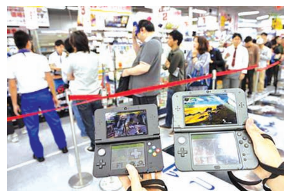
Nintendo’s new 3DS console hits shelves in Japan Photo shows the New Nintendo 3DS portable game consoles (front) at an electronics store in Osaka, and people lining up to purchase them on 11 Oct, 2014. Nintendo Co launched the product, which comes in two sizes, the same day in time for the year-end shopping season.