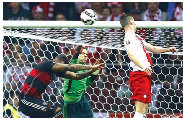
Poland's Arkadiusz Milik scores past Germany's goalkeeper Manuel Neuer and Jerome Boateng (R-L) during their Euro 2016 group D qualifying soccer match at the National stadium in Warsaw on 11 Oct, 2014.

WARSAW, 12 Oct—Poland struck twice on the break to stun wasteful World Cup winners Germany 2-0 on Saturday, earning their first ever victory over their illustrious neighbours and taking control of Euro 2016