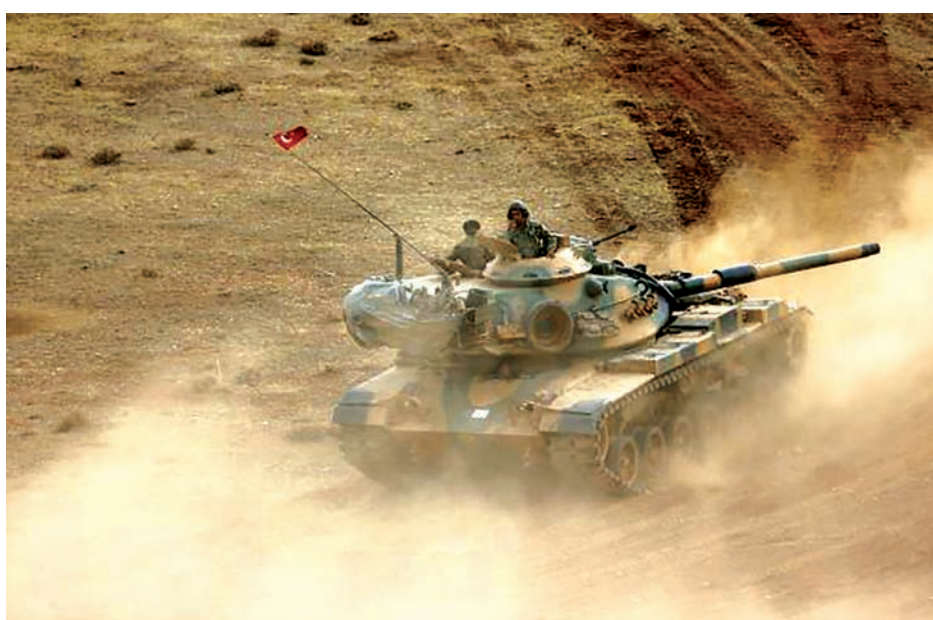
A Turkish army tank manoeuvres near Turkish Kurds watching over the Syrian town of Kobani from atop a hill near Mursitpinar border crossing in the southeastern Turkish town of Suruc in Sanliurfa Province on 11 Oct, 2014.

“The air strikes are benefiting us, but Islamic