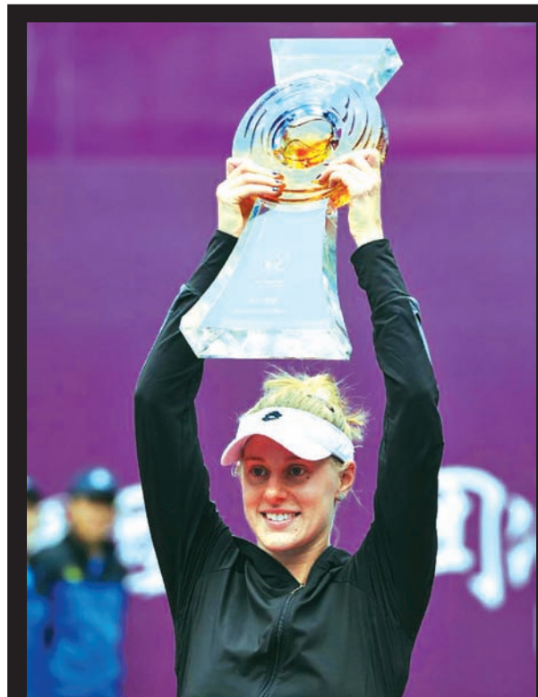
Alison Riske of the United States holds the trophy during the awarding ceremony after the women's singles final against Belinda Bencic of Switzerland at the 2014 Tianjin Open tennis tournament in Tianjin, north China, on 12 Oct, 2014. Riske won 2-0 to claim the title.—XINHUA

The duo have also won 16 grand slam titles together, a record for a pair, and in 2012 became only the second team to complete a golden slam after they won the London Olympics doubles title.—Reuters