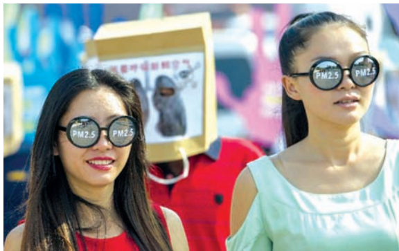
People take part in an action art activity for environment protection in the “Yangrenjie” scenery spot in Chongqing Municipality, southwest China, on 11 Oct, 2014. The participants promote more green plants and less smoking and driving cars.

The Request for Expression of Interest (REOI) and Terms of References (TOR) are available at http://www.mcit.gov.mm/news