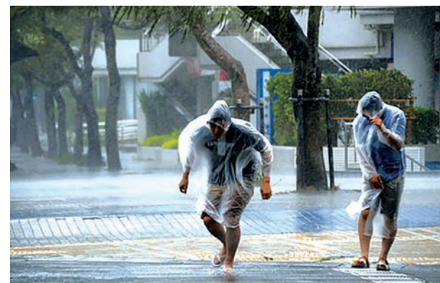
Pedestrians battle strong winds while walking on a street in Naha, Okinawa Prefecture on 11 Oct, 2014, as Vongfong, a powerful typhoon, approaches Japan's southernmost prefecture.

TOKYO, 12 Oct—A powerful typhoon is on track to sweep through the Japanese archipelago after moving over the southern islands of Okinawa and injuring dozens, the Japan Meteorological Agency said on Sunday.