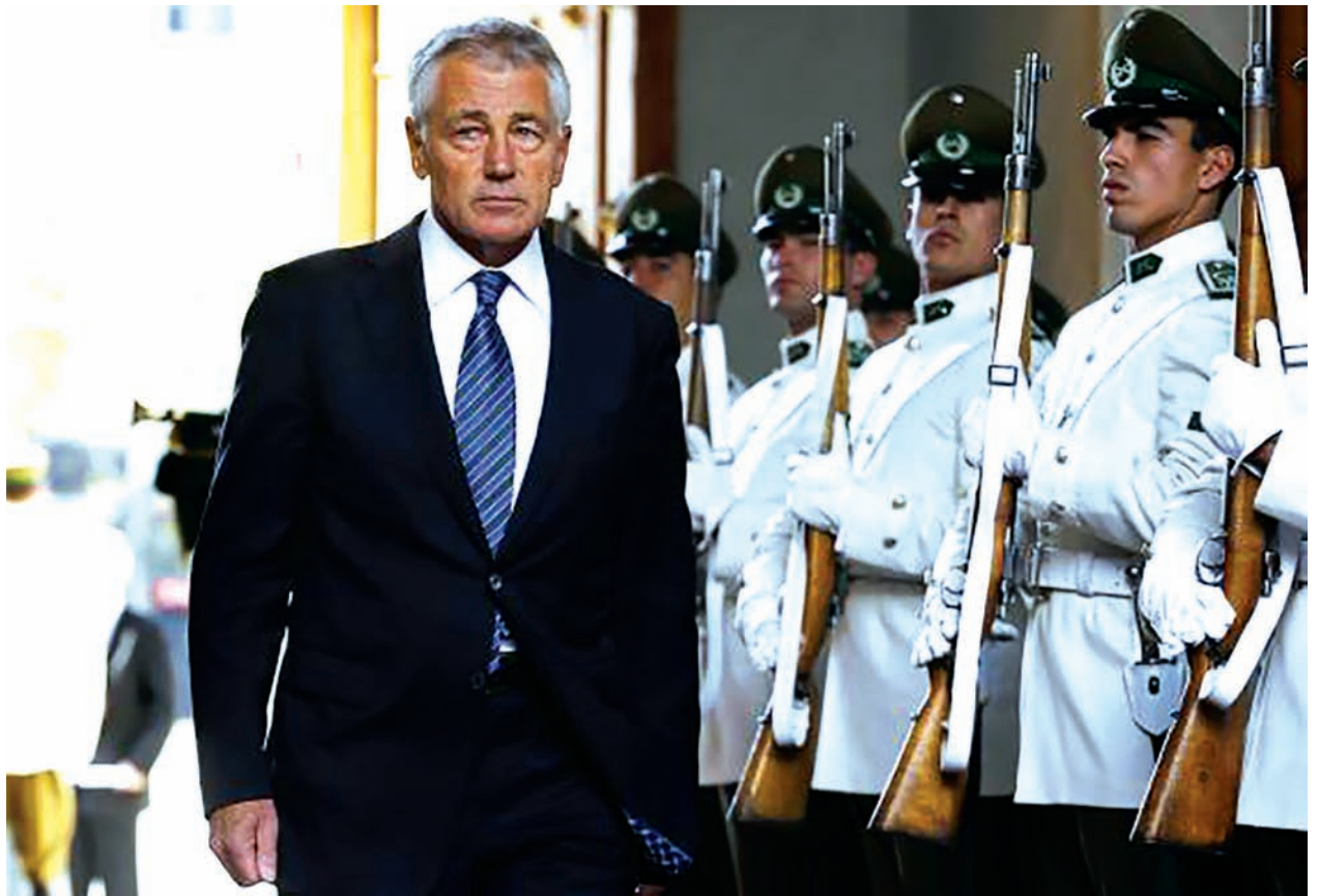
US Defence Secretary Chuck Hagel walks past a honour guard before a meeting with Chile’s President Michelle Bachelet (not pictured) at the government palace in Santiago on 11 Oct, 2014.

“We continue to help them with air strikes, with our assistance and advisors.”—Reuters