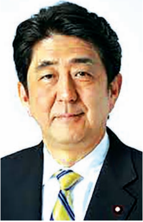
Prime Minister Shinzo Abe

TOKYO, 12 Oct — Prime Minister Shinzo Abe is considering holding a summit with Palau President Tommy Remengesau by next spring in Japan, ahead of the planned visit to the Pacific island country by Emperor Akihito and Empress Michiko, Japanese government sources said on Saturday.