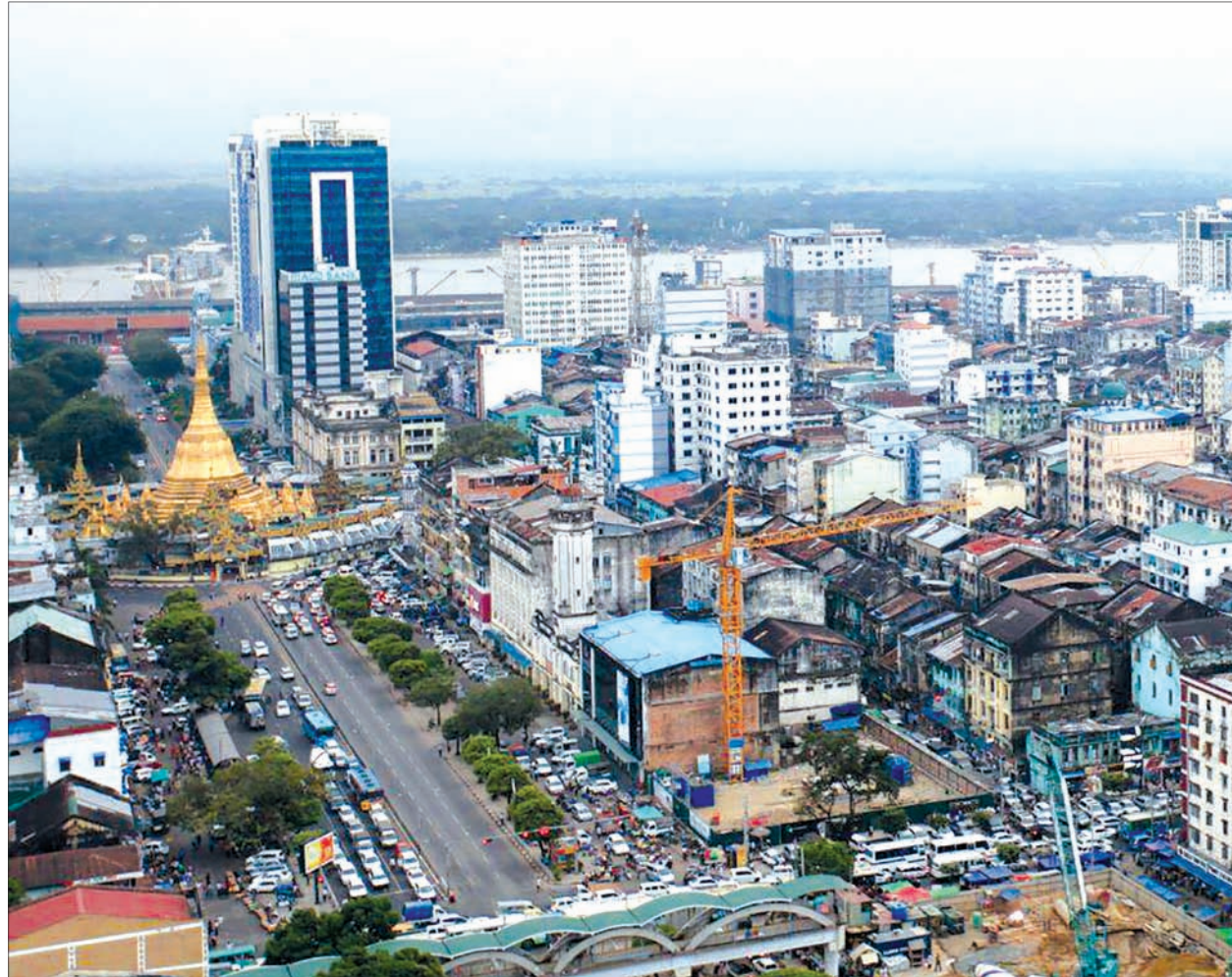
International Monetary Fund projects Myanmar's gross domestic product will post an impressive rate of 8.5 percent in the region in 2014 and 2015.

"Certainly, there are a lot of works to be done in the coming years," said the APD deputy director who is also one of the authors of the latest Asian and Pacific