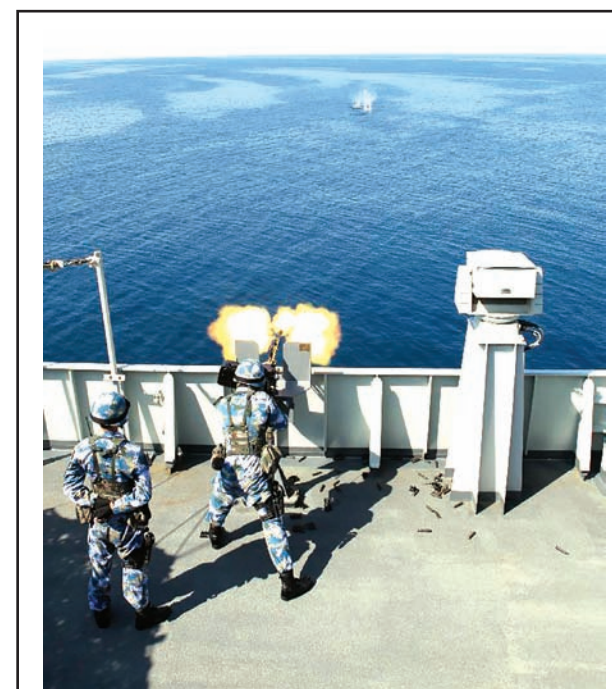
Soldiers of Chinese People’s Liberation Army Navy take part in a shoot training on Changbaishan warship, on 11 Oct, 2014. Changbaishan warship is part of the 18th batch of convoy fleet sent by the Chinese People’s Liberation Army Navy for escort missions in the Gulf of Aden.