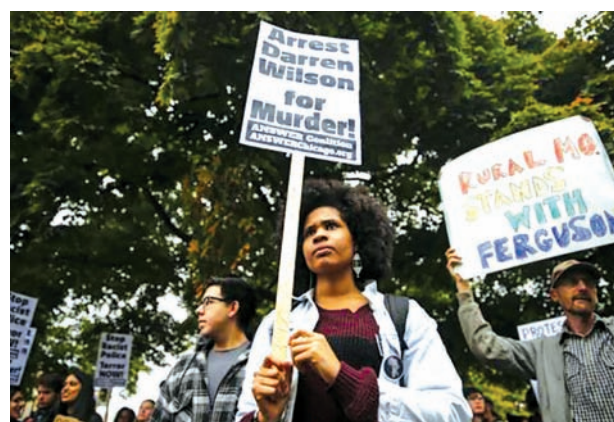
A woman holds a sign as demonstrators rally in St Louis, Missouri on 11 Oct, 2014.