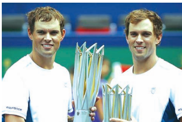
Bob Bryan (L) and his brother Mike Bryan of the US pose with their trophies after winning the men's doubles final against Julien Benneteau and Edouard Roger Vasselin of France at the Shanghai Masters tennis tournament on 12 Oct, 2014.

The 35-year-old siblings defeated French Open champions Julien Benneteau and Edouard Roger-Vasselin 6-2, 7-6(3) on the Chinese hard court to take an unprecedented 101st career title in their 152nd final. The Masters 1000 events are the top ranking tournaments on the ATP Tour outside of the grand slams with the Bryans now boasting 31 of them after multiple wins in Indian