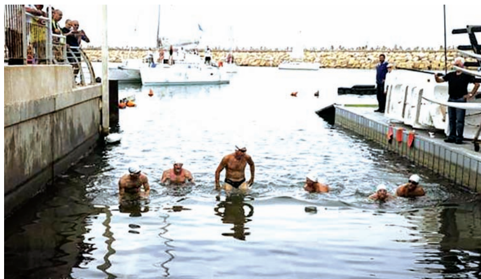
Six Israeli swimmers emerge from the water during a media presentation, a day after their attempt to claim the Guinness world record for open-water relay distance swimming, in the Herzliya Marina, near Tel Aviv on 11 Oct, 2014.