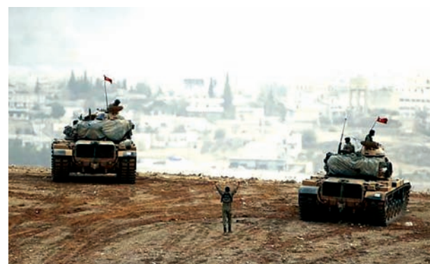
Turkish army tanks take position on top of a hill near Mursitpinar border crossing in the southeastern Turkish town of Suruc in Sanliurfa Province on 11 Oct, 2014.