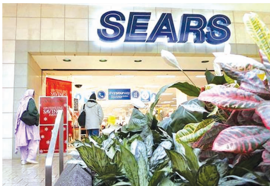
Customers walk into a Sears store at Fair Oaks Mall in Fairfax, Virginia, on 7 January, 2010. Sears Holdings Corp forecast fourth-quarter earnings well above Wall Street expectations, sending its shares up 15 percent in pre-market trade.