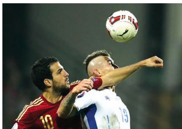
Cesc Fabregas of Spain challenges Juraj Kucka of Slovakia (R) during their Euro 2016 qualification soccer match at the MSK stadium in Zilina on 9 Oct, 2014.

Midfielders Xavi and Xabi Alonso and striker David Villa, who were core players in Spain's period of dominance when they won European championships either side of their 2010 World Cup victory, all retired from the international game after their failure in