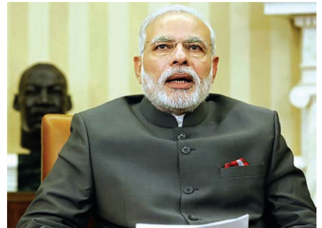
India's Prime Minister Narendra Modi

A big win in Maharashtra could make it easier to forge ahead on reforms in the run-up to the annual budget next February.