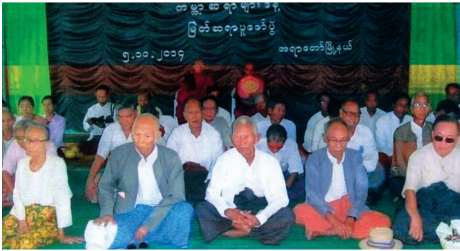
tance. Students of Ayadaw BEHS sang the song in commemoration of the ceremony.

Old students and teachers paid respects to the retired teachers and gave gifts and cash assis-