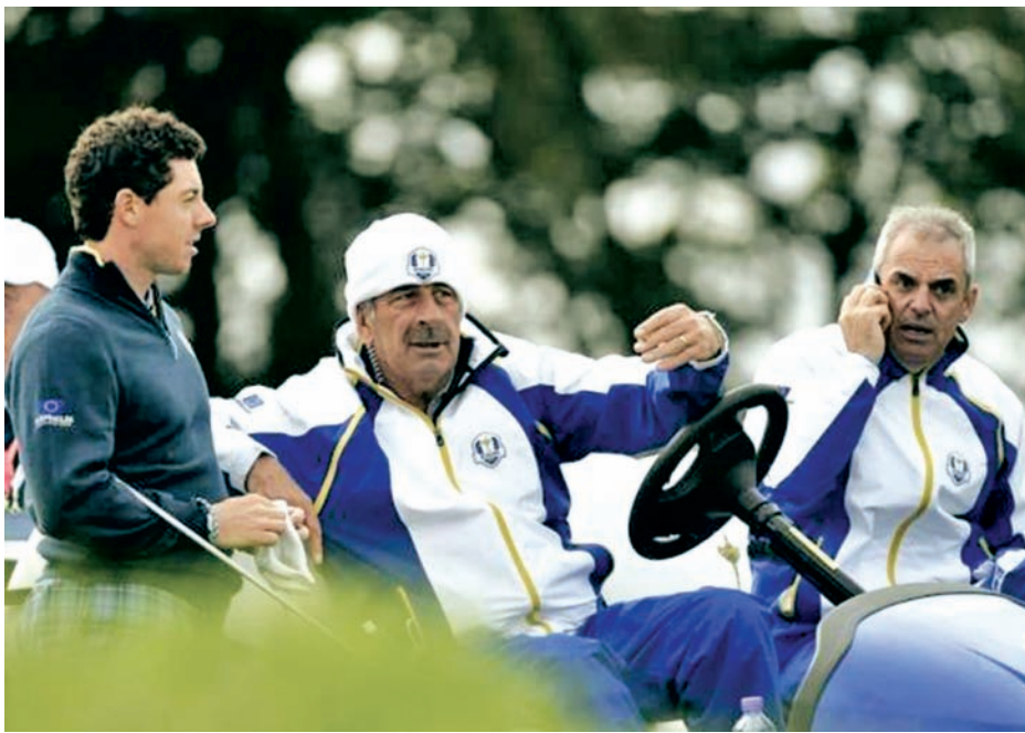
European Ryder Cup player Rory McIlroy (L) chats with vice-captain Sam Torrance during practice ahead of the 2014 Ryder Cup at Gleneagles in Scotland on 23 Sept, 2014.

The 25-year-old Northern Irishman was the star of