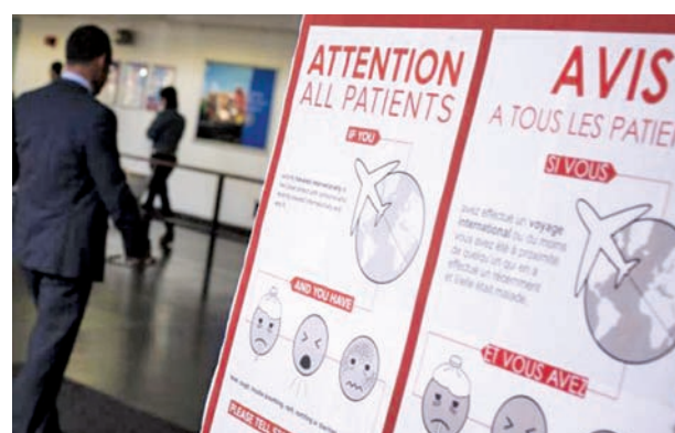
A sign asks patients to inform staff if they have fever, cough, trouble breathing, rash, vomiting or diarrhea symptoms and have recently traveled internationally or have had contact with someone who recently traveled internationally at Bellevue Hospital in Manhattan, New York on 8 Oct, 2014.

The Ebola virus causes hemorrhagic fever and is spread through direct contact with body fluids from an infected person, who would suffer severe bouts of vomiting and diarrhea.