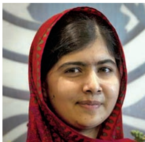
Pakistani schoolgirl activist Malala Yousafzai poses for pictures during a photo opportunity at the United Nations in the Manhattan borough of New York on 18 Aug, 2014.

OSLO, 10 Oct — Pakistani teenager Malala Yousafzai, who was shot in the head by the Taliban in 2012 for advocating girls' right to education, and Indian children's right activist Kailash Satyarthi