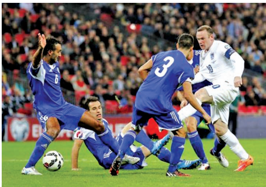
England's Wayne Rooney (R) has his path blocked by the San Marino defence during their Euro 2016 qualifying soccer match at Wembley Stadium in London on 9 Oct, 2014.

While the result was convincing, it did not reflect how poor England were in the first half or how they were frustrated