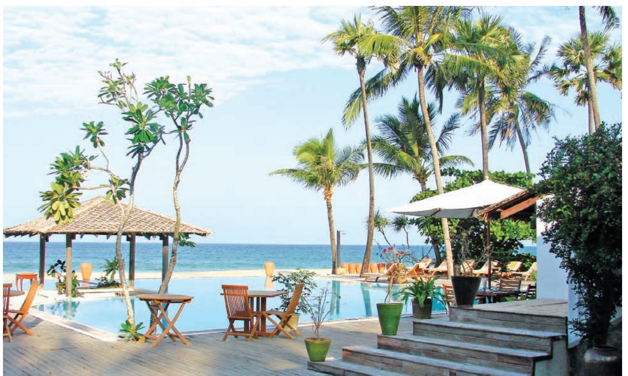
Scenic beauty of Ngwesaung beach with bungalows and swimming pool for relaxation of guests.

In the 2013 tourism season from Jan to Dec, the number of local tourists to Ngwesaung beach totalled 30,819 while that of foreign tourists amount-