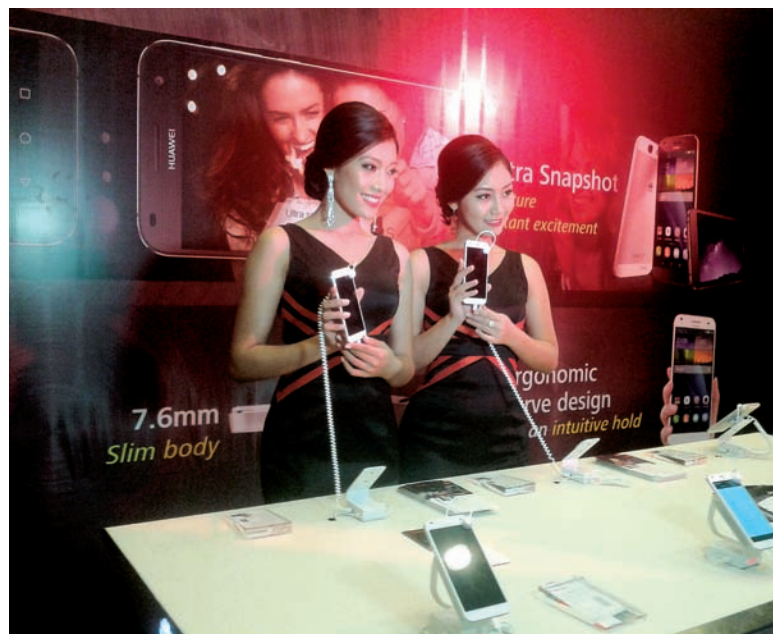
Model girls display Huawei Brand new products Huawei Ascend Mate 7 and G7 handsets at the Parkroyal Hotel.

YANGON, 10 Oct—The British Council and the UK Trade and Investment jointly conducted a panel discussion to bring culture to the fore in Myanmar's public policy while recognizing the social and aesthetic value of culture and the potential benefits it can bring to the country's budding economy.