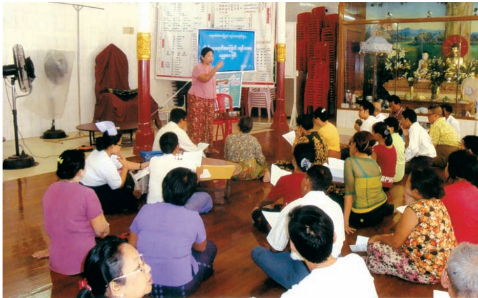
YANGON, 10 Oct—Health Department and Department jointly organized a talk on Ebola Kyauktada Township General Administration.

disease at the Dhammayon in Ward 3 on 7 October and the Dhammayon in Ward 6 on 9 October.