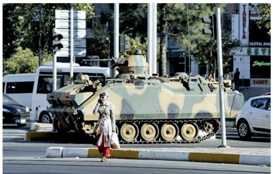
A woman walks past a tank from which Turkish soldiers keep guard on a main street in Diyarbakir on 9 Oct, 2014.

Police officers were also targeted in attacks in the southeastern province of Siirt, the southern province