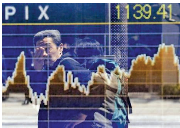
A man is reflected on a screen displaying a graph showing movements of the Tokyo Stock Exchange Stock Price Index (TOPIX), outside a brokerage in Tokyo on 14 April, 2014.

TOKYO, 10 Oct — Asian shares shuddered and Brent crude oil prices tumbled to their lowest since 2010 on Friday after weak German export data raised fears that Europe’s economic woes could drag down the global economy.