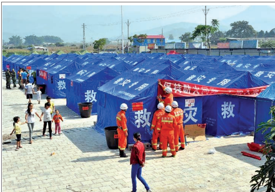
Photo taken on 9 Oct, 2014 shows the tents at a temporary resettlement site in quake-hit Yongping Township of the Jinggu Dai and Yi Autonomous County, southwest China's Yunnan Province. A total of 8,000 tents have been pitched at several temporary resettlement sites in the quake zone.

Thousands of disaster management personnel have been deployed in both the states and the military has also been kept as standby, the sources said. Cyclone Hudhud is named after a bird.—Xinhua