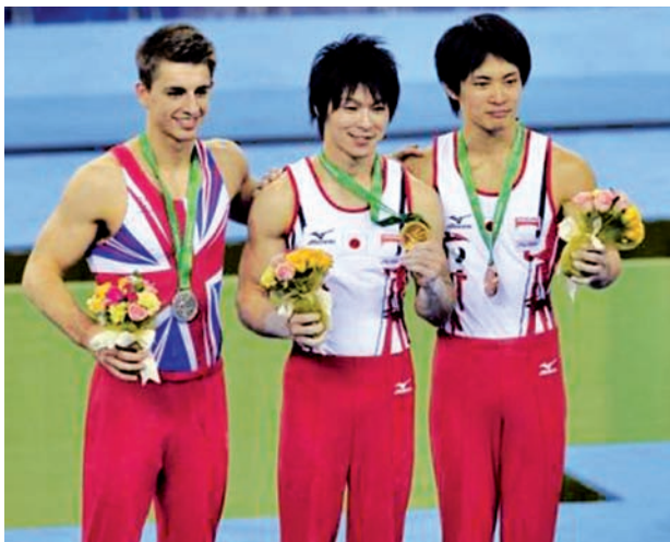
(From L to R) Silver medalist Max Whitlock of Britain, gold medalist Kohei Uchimura of Japan and bronze medalist Yusuke Tanaka of Japan pose for photographs at the podium after the men's all-around final of the 2014 World Artistic Gymnastics Championships in Nanning, Guangxi Zhuang Autonomous Region, on 9 Oct, 2014.

NANNING, 10 Oct — Japan's Kohei Uchimura claimed a record-extending fifth consecutive men's all-around title at the Gymnastics World Championships on Thursday.