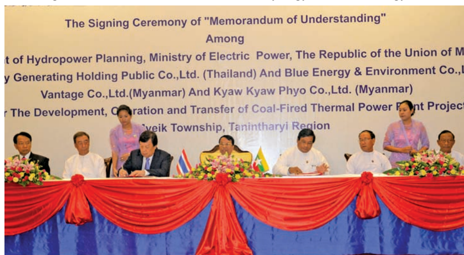
The Signing Ceremony of "Memorandum of Understanding" Among

The projects will be implemented through clean coal technology.