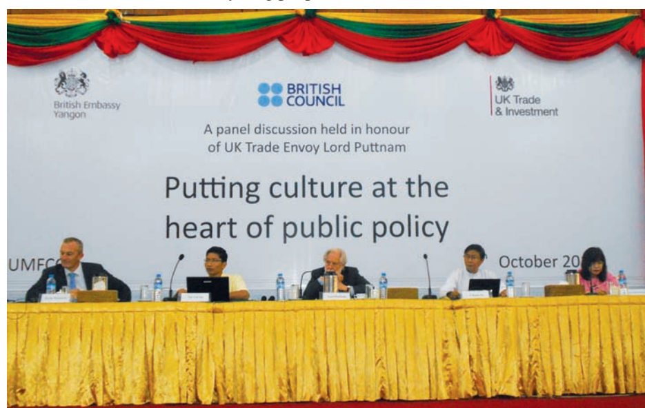
Local and foreign panelists discuss the roles of culture in the country's development at UMFCFI in Yangon..—PHOTO: KHAING THANDA LWIN

social media like Facebook but maintain the country's traditional customs and culture.—GNLM