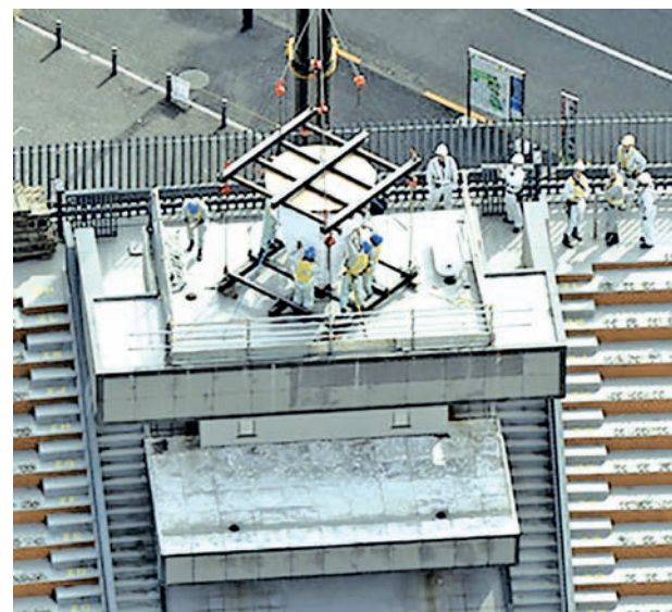
Photo taken from a Kyodo News helicopter on 10 Oct, shows workers preparing for the removal of the 1964 Tokyo Olympics cauldron at the National Stadium in Tokyo. The Olympic cauldron, a symbol of Japan's postwar reconstruction, will be transferred to the March 2011 disaster-hit city of Ishinomaki as the stadium will be demolished prior to the 2020 Tokyo Olympics.