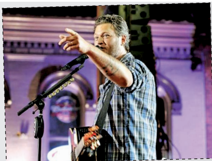
Musician Blake Shelton performs 'Boys' Round Here' during the 2014 CMT Music Awards in Nashville, Tennessee on 4 June, 2014.

The only other new debut in the top 10 of the Billboard 200 chart, which measures physical and digital album sales, is Irish