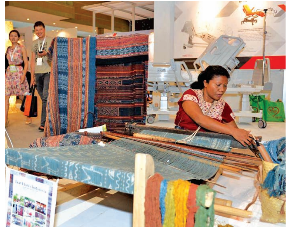
People visit the exhibition during the Trade Expo Indonesia in Jakarta, Indonesia, on 9 Oct, 2014. Trade Expo Indonesia was an annual national showcase of export oriented products and services from all Indonesia.