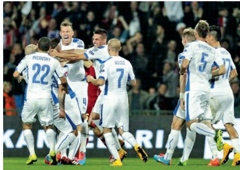
Juraj Kucka of Slovakia (3 rd L) celebrates his goal against Spain with team mates during their Euro 2016 qualification soccer match at the MSK stadium in Zilina on 9 Oct, 2014.

Ukraine and Macedonia also have three points and Luxembourg and Belar-