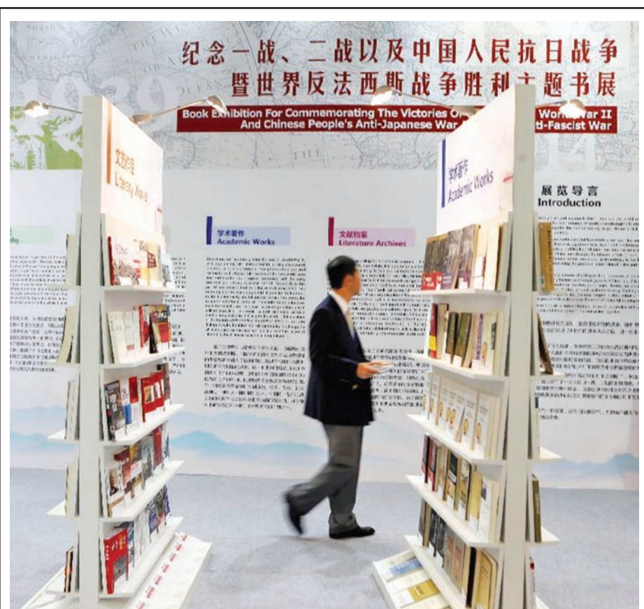
A man visits the book exhibition for commemorating the victories of the World War I and World War II and Chinese people's anti-Japanese War and the world's anti-Fascist War during the 66 th Frankfurt Book Fair in Frankfurt, Germany on 9 Oct, 2014.