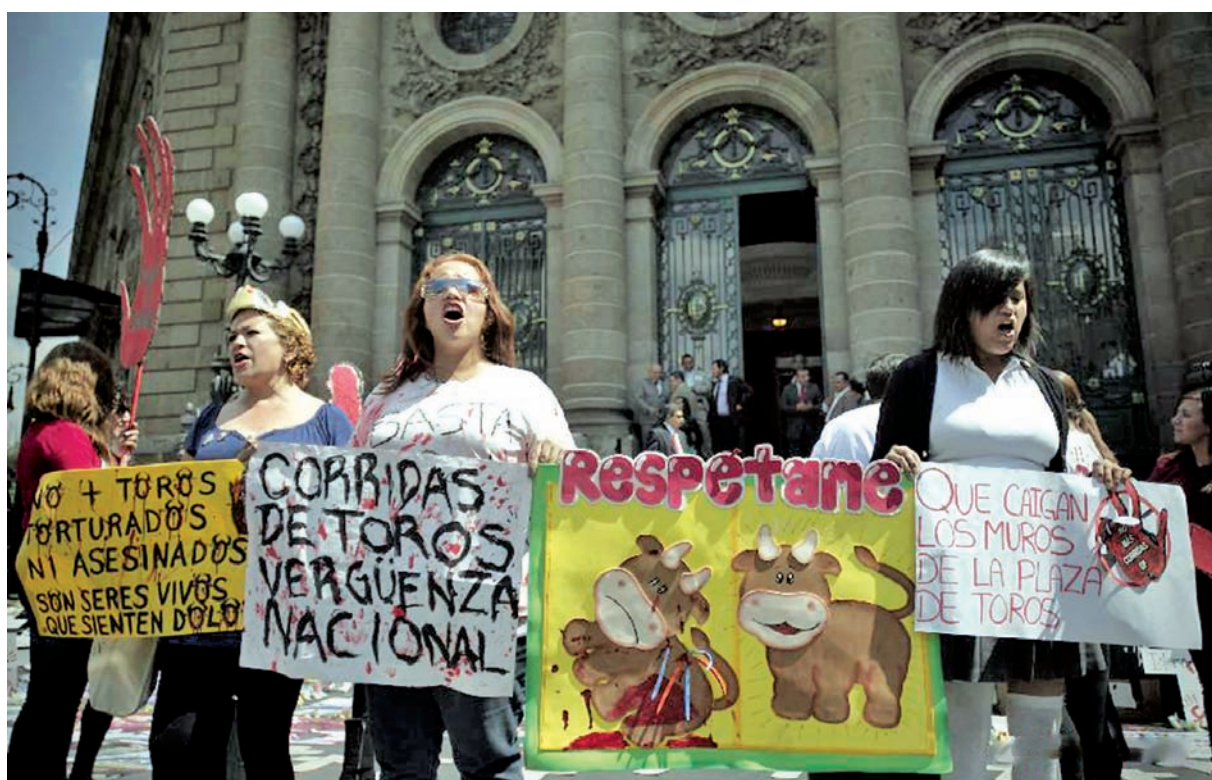
Residents hold banners during a demonstration to protest against bull fighting in front of the headquarters of the Legislative Assembly in Mexico City, capital of Mexico on 9 Oct, 2014.