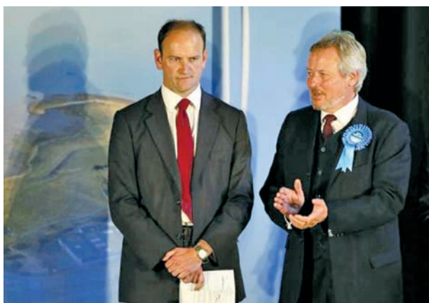
United Kingdom Independence Party (UKIP) candidate Douglas Carswell (L) reacts next to the Conservative Party candidate Giles Watling after winning the by-election in Clacton-on-Sea in eastern England on 10 Oct, 2014.

Quoting Abraham Lincoln's Gettysburg Address and the words of John Wy-