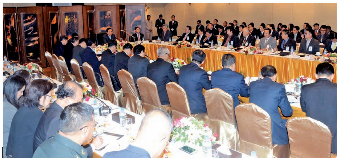
Thai Prime Minister Mr Prayuth Chan-o-cha meets Thai businessmen at Thai Embassy in Yangon.