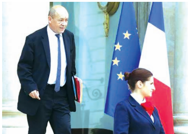
French Defence Minister Jean-Yves Le Drian (L) leaves after a war cabinet meeting at the Elysee Palace in Paris on 25 Sept, 2014.

PARIS, 9 Oct — France will soon provide weapons and military equipment to the Lebanese army as part of a $3 billion grant from Saudi Arabia to help it fight jihadis encroaching into Lebanon from Syria, Defence Minister Jean-Yves Le Drian said on Wednesday.