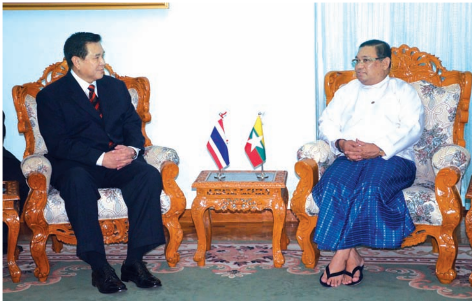
Deputy Prime Minister and Minister of Foreign Affairs of Thailand General Tanasak Patimapragorn meets with Union Minister for Foreign Affairs U Wunna Maung Lwin.

NAY PYI TAW, 9 Oct—Union Minister for Foreign Affairs U Wunna Maung Lwin received General Tanasak Patimapragorn,