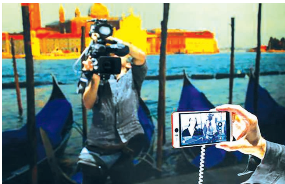
A guest looks at a HTC desire eye smartphone after its launch in New York on 8 Oct, 2014.