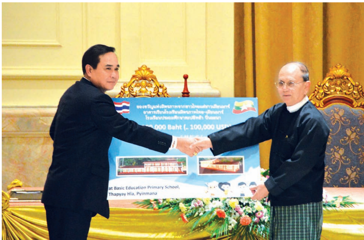
President U Thein Sein and Thai Prime Minister Mr Prayuth Chan-o-cha exchange notes of MoU for construction of basic education high school in Thapyay Hla village, Pyinmana Township.