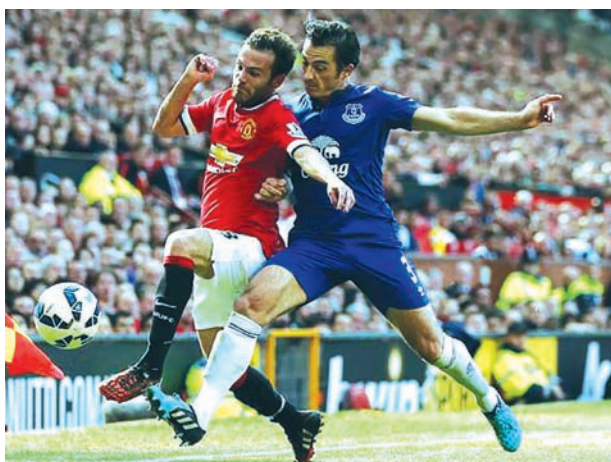
Manchester United's Juan Mata (L) challenges Everton's Leighton Baines during their English Premier League soccer match at Old Trafford in Manchester, northern England on 5 Oct, 2014.

The Times said that the proposal had been discussed at a meeting of Premier League club chairmen and chief executives last month.