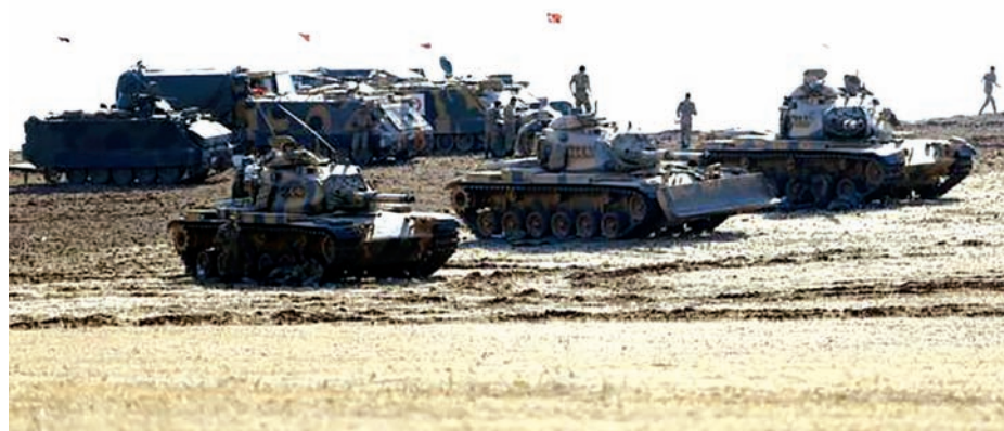
Turkish army tanks take up position on the Turkish-Syrian border near the southeastern town of Suruc in Sanliurfa Province on 8 Oct, 2014.

Secretary of State John Kerry said the loss of the town would not be a strategic defeat. Other officials stressed the focus of the campaign remained Iraq and that air strikes in Syria were intended to initially degrade Islamic State in neighbouring Iraq before ultimately destroying them over the long term in both countries.