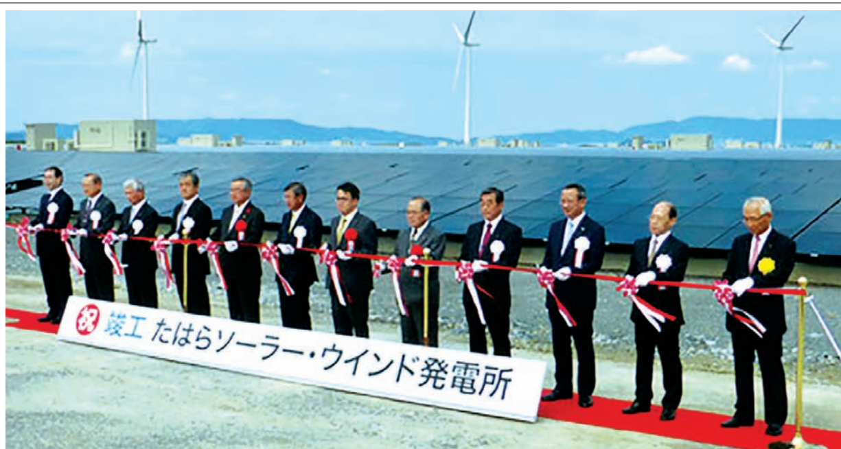
Solar-wind hybrid power plant completed in Aichi Prefecture A ceremony is held in Tahara, Aichi Prefecture, on 8 Oct, 2014, to mark the completion of the Tahara Solar/Wind Electricity Generation Plant (back), one of Japan's biggest solar-wind hybrid power plants. The plant on an 800,000-square-meter site consists of a 50-megawatt photovoltaic power generator and a 6-MW wind power generator, covering the power consumption of about 19,000 households.