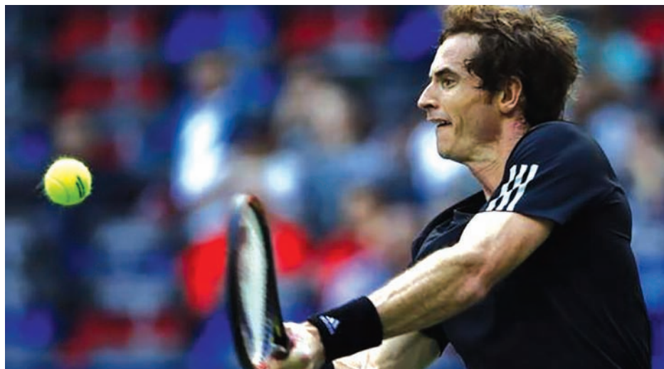
Andy Murray of Britain returns a shot during his men's singles tennis match against David Ferrer of Spain at the Shanghai Masters tennis tournament in Shanghai on 9 Oct, 2014.