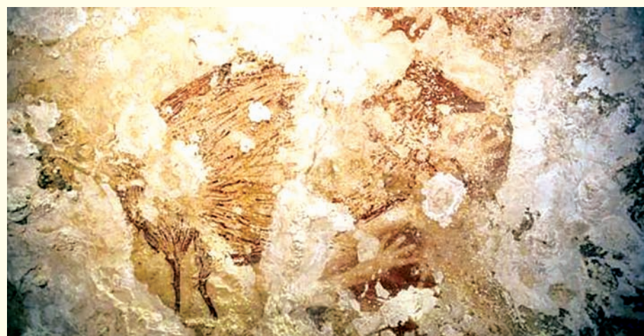
A Babirusa ("pig-deer") and a hand stencil are pictured in this undated handout image

Most of the artwork was created with a pigment called red ochre to produce red- and mulberry-colored paintings. The art's existence had been known for decades, but its age had never been determined.