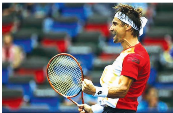
David Ferrer of Spain celebrates winning his men's singles tennis match against Andy Murray of Britain at the Shanghai Masters tennis tournament in Shanghai on 9 Oct, 2014.

There was no let up in the final set either as the Spaniard raced to a 5-2 lead and raised his arms in celebration when twice champion Murray buried a return into the net. Ferrer now replaces Murray in ninth spot in the race for the eight-man Tour Finals. "I needed to play my best tennis today," Ferrer told the ATP World Tour website (www.atp-