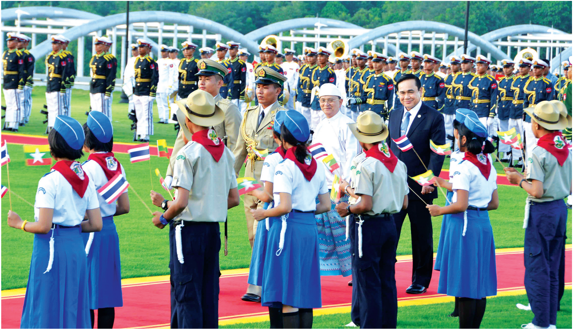
President U Thein Sein gives red carpet treatment to Thai Prime Minister Mr Prayuth Chan-o-cha at welcoming ceremony in Nay Pyi Taw.

NAY PYI TAW, 9 Oct —President U Thein Sein greeted Thai Prime Minister Mr Prayuth Chan-o-cha at a ceremony held in honour of the visiting prime minister at the Presidential Palace in Nay Pyi Taw on Thursday.