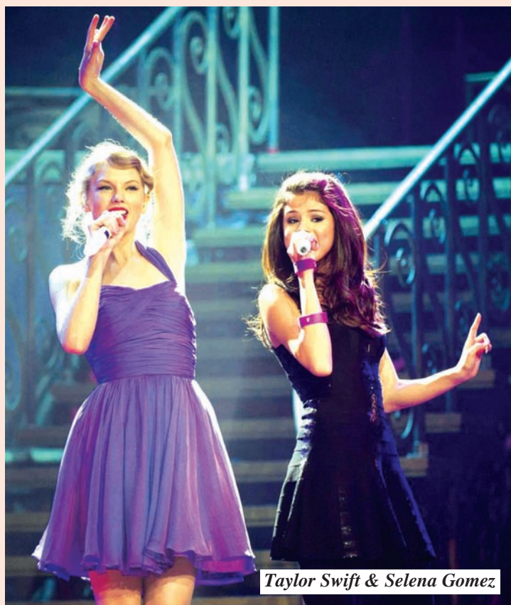
Taylor Swift & Selena Gomez

LOS ANGELES, 9 Oct — Singer Selena Gomez has revealed her good friend Taylor Swift has been “begging” her to move to New York where the ‘Love Story’ star is currently living.