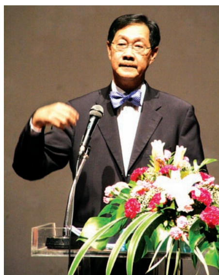
Thai Deputy Prime Minister Pridiyathorn Devakula

Prayuth Chan-ocha, the army chief who led the coup, was appointed prime minister in August and heads an interim cabinet stacked with serving and retired military officers.