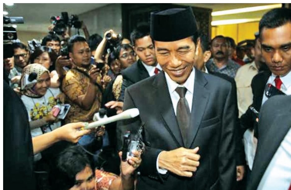
Indonesia's president-elect Joko Widodo smiles as he leaves City Hall after resigning as the Jakarta Governor on 2 Oct, 2014.

JAKARTA, 9 Oct — Indonesian president-elect Joko Widodo strengthened his minority coalition by gaining support from a small Islamist party, but rivals remain in control of parliament and have pledged to obstruct his reform programme unless he makes concessions.