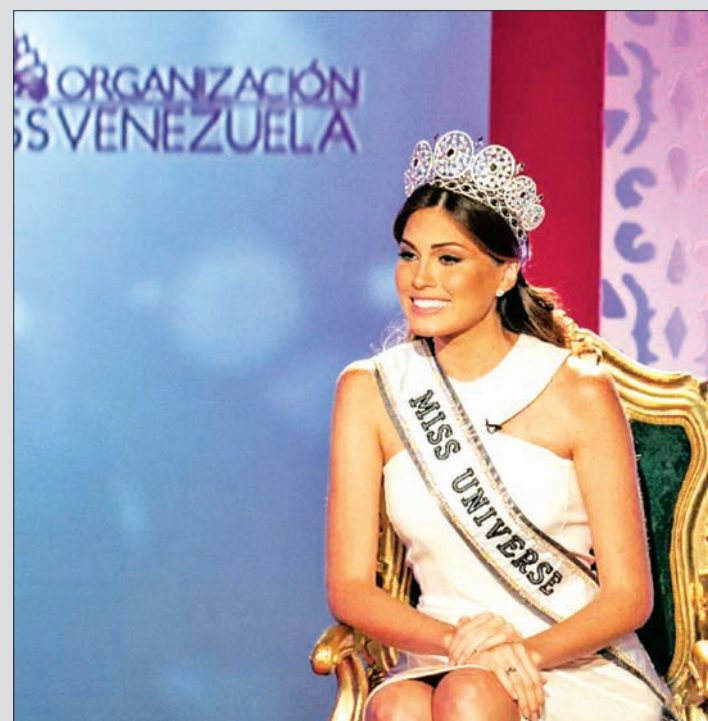
The winner of the contest Miss Universe 2013 Gabriela Isler takes part in a Press conference in the framework of the edition 2014 of Miss Venezuela, in the city of Caracas, Venezuela on 8 Oct, 2014.