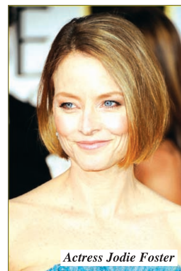
Actress Jodie Foster

Foster’s former private pad also features a high hedge surrounding the pool and courtyard area, a step-down living room complete with cathedral ceiling