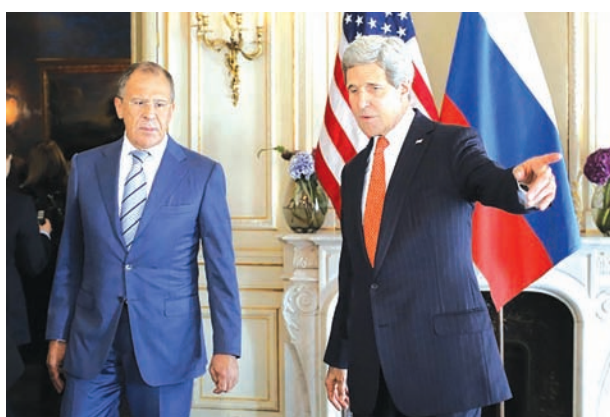
Russian Foreign Minister Sergei Lavrov and US Secretary of State John Kerry.