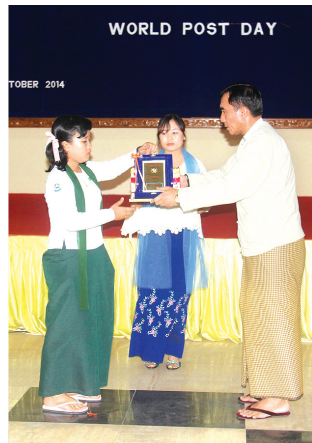
Union Minister U Myat Hein presents prize to a winner in contests to mark World Post Day.