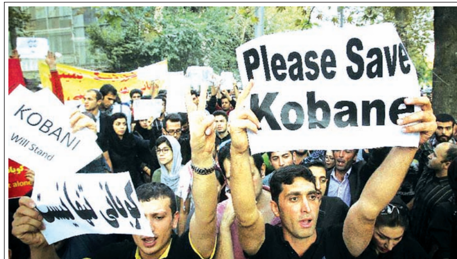
Iranians shout slogans during an anti-Islamic State (IS) protest in front of United Nations office in Teheran, Iran on 8 Oct, 2014. Thousands of Iranian people attend a demonstrations against the advance of IS militants into Kurdish populated Kobane town in northern Syria.

Royal Canadian Mounted Police Commissioner Bob Paulson said the force had 63 active national security investigations on 90 individuals who had either intended to go abroad or had returned to Canada.