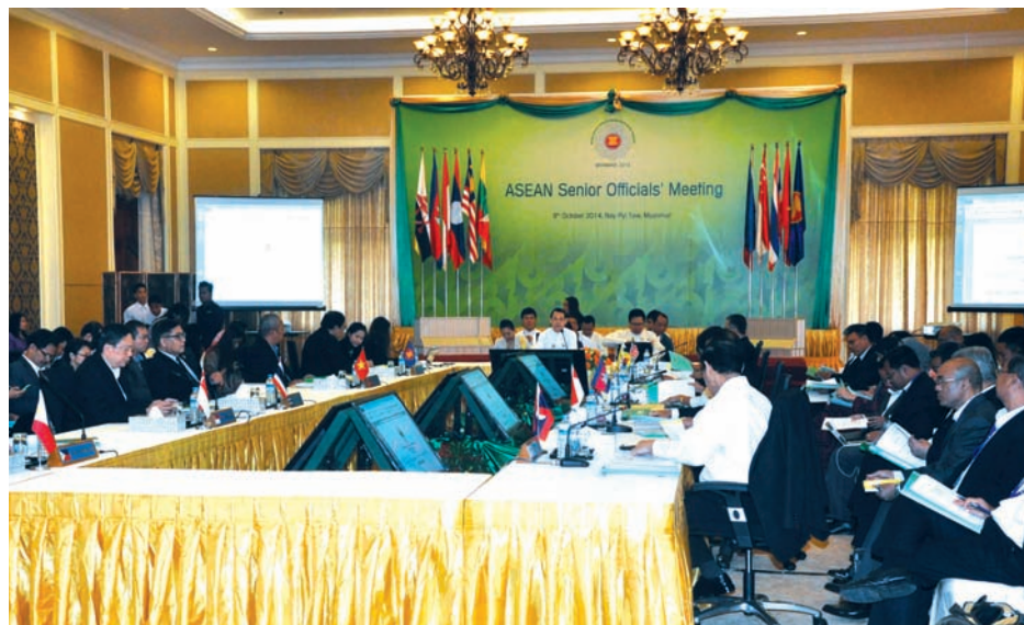
ASEAN Senior Officials' Meeting in progress at Grand Amara Hotel in Nay Pyi Taw.

cussed matters relating to the preparation of the upcoming 25 th ASEAN Summit scheduled from 9-13 November 2014 including ASEAN Community Building, ASEAN's External Relations, future of ASEAN and strengthening of institutional capacity of ASEAN.