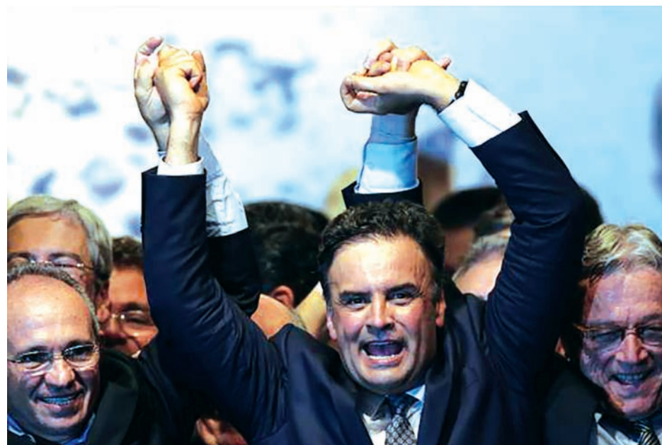
Brazil's Social Democratic Party (PSDB) presidential candidate Aecio Neves reacts during a meeting with governors and senators elected in the first round of the general elections in Brasilia on 8 Oct, 2014.

Neves is also seeking endorsement by the influential family of Campos, a former governor of the