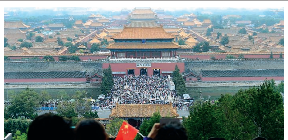
The northern gate of the Palace Museum is crammed with tourists on the second day of the Chinese National Day holidays in Beijing, capital of China, 2 Oct, 2014. Almost all scenic spots in Beijing were packed with tourists on the second day of the National Day holidays, which falls from 1 Oct to 7 Oct. The 26 mainly monitored scenic spots of Beijing received 542,000 trips on 1 Oct, up 32.8 percent over the same day of last year. —XINHUA

"The fair clearly shows the efforts of the ministry of commerce in promoting local fruits and vegetables to consumers," said Sam Sereyath, undersecretary of state at the ministry of commerce. "Products with quality will gain broader access to local markets so that it will gradually replace the imports of foreign products." — Xinhua