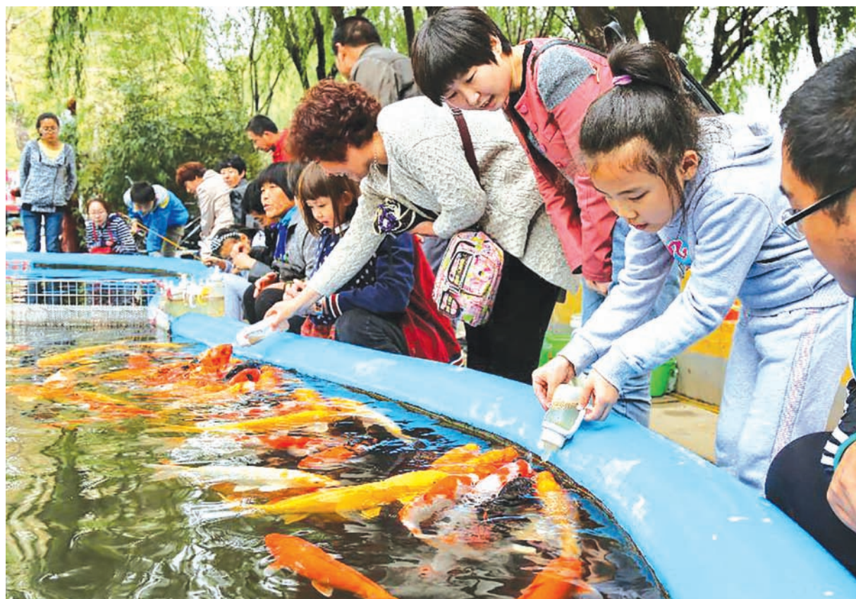
People feed fishes with fish food in nursing bottles at a farm in Qinhuangdao, north China's Hebei Province, on 2 Oct, 2014.

WARSAW, 3 Oct — Polish food exports are expected to drop by 2 percent in 2014 from a year ago, said a report by the Institute of Agricultural and Food Economics (IERiGZ) released on Thursday. The report showed that Poland's food trade surplus is expected to contract to 6.0 billion euros (7.6 billion US dollars) from 6.1 billion in 2013.