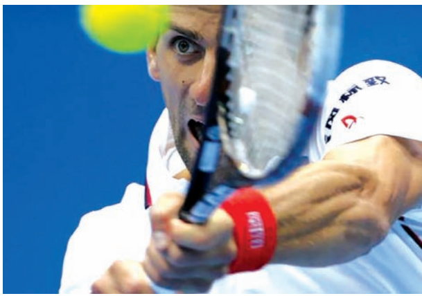
Novak Djokovic of Serbia returns the ball during his men's quarter-final match against Grigor Dimitrov of Bulgaria at the China Open tennis tournament in Beijing, on 3 Oct, 2014.

It was the second tournament in a row the 33-year-old, who won her 18 th grand slam singles title at the US Open last month, had been forced to withdraw after she quit her opening match at the Wuhan Open last week because of illness.