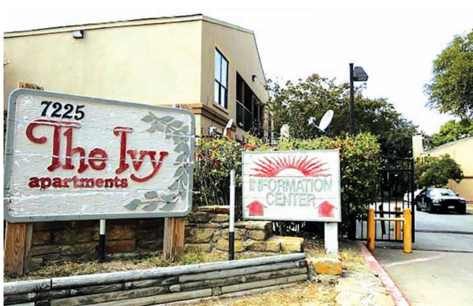
A general view of The Ivy Apartments in Dallas, on 1 Oct, 2014.

The entire NBC crew will fly back to the United States on a private charter plane and will place themselves under quarantine for 21 days, the maximum incu-