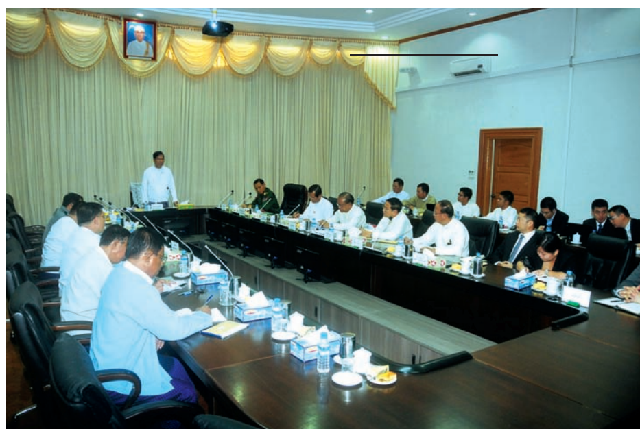
Union Minister U Hla Tun speaking at coordination for Letpadaungtaung copper mine project.—MNA

According to the Investigation Commission, the Letpadaungtaung copper mine project is of great importance to the country.—MNA