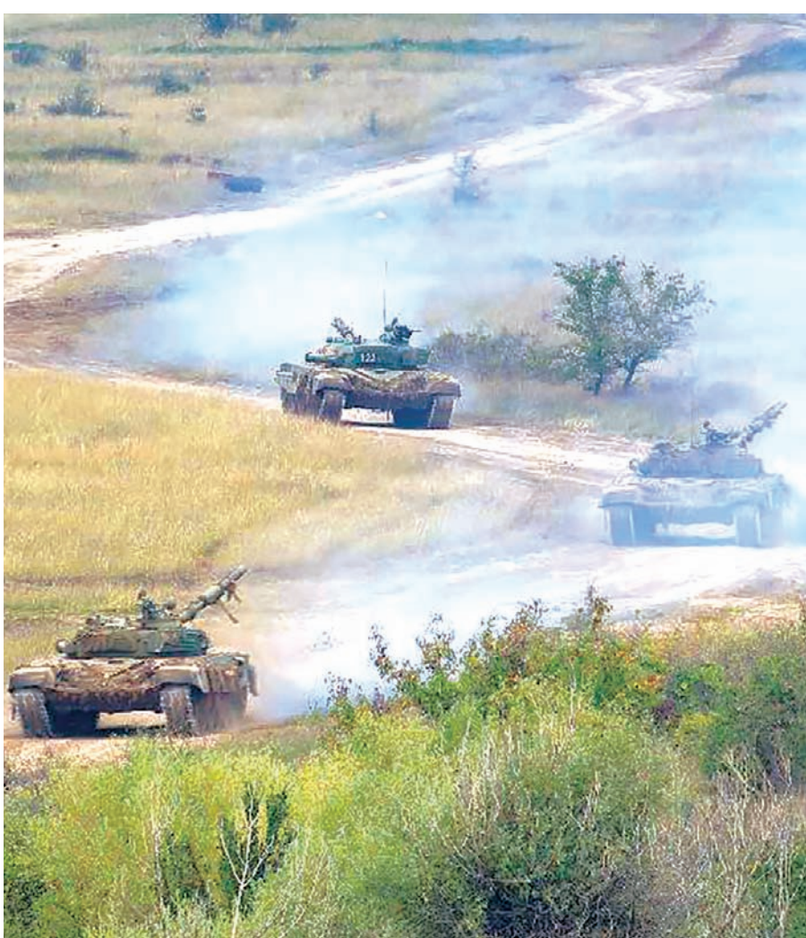
Hungarian tanks participate in a joint Hungarian-US military exercise near the Osku village, about 90 km southwest of Budapest, Hungary, on 2 Oct, 2014. A series of military exercises titled Joint Action 2014 involving 1,300 soldiers goes on from 8 Sept until 17 Oct in Hungary.

While alluding to the 15 April, 2013, attack on the Boston Marathon that killed three people and injured more than 260, Biden said: "You are twice as likely to be struck by lightning as you are to be affected by a terrorist event in the United States."— Reuters