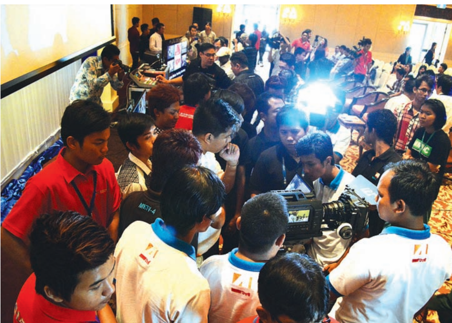
Enthusiasts surround a blackmagic digital film camera before the start of revolutionary video technology workshop at Sule Shangri-La Hotel in Yangon on Friday.