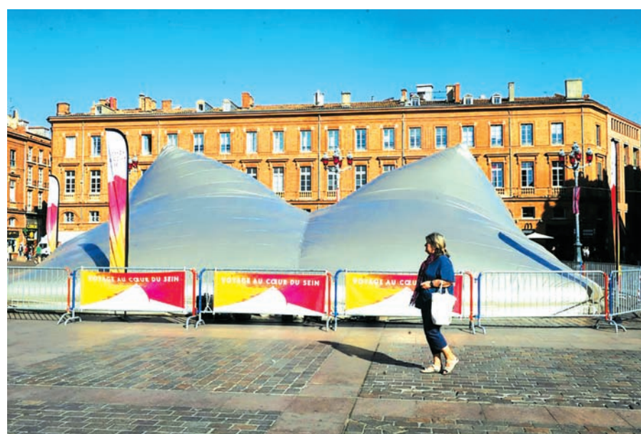
The installation art "World's largest breast" is seen in Toulouse, southwestern France on 2 Oct, 2014. It is displayed to appeal to people's awareness of breast cancer prevention.