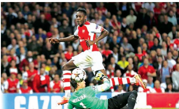
Arsenal's Danny Welbeck (top) scores past Galatasaray's goalkeeper Fernando Muslera during their Champions League match at the Emirates in London on 1 Oct, 2014.

Record signing Angel Di Maria has made a