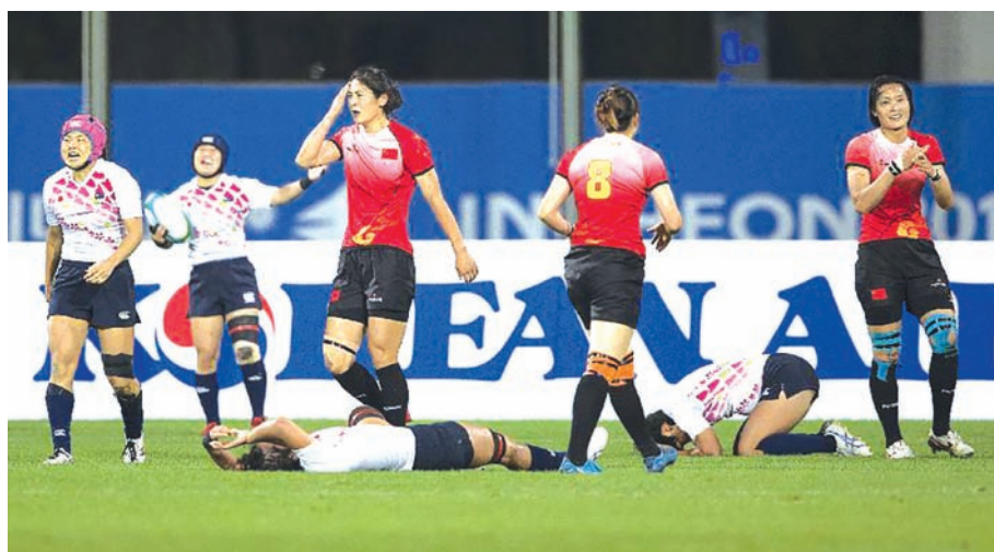
Players of China and Japan react after the women's rugby final match at the 17 th Asian Games in Incheon, South Korea, on 2 Oct, 2014. China defeated Japan 14-12 and claimed the title.