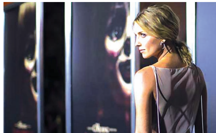
Cast member Annabelle Wallis poses at the premiere of "Annabelle" at the TCL Chinese theatre in Hollywood, California on 29 Sept, 2014.