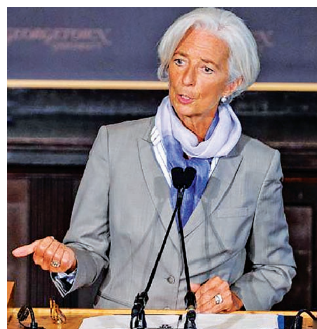
International Monetary Fund (IMF) Managing Director Christine Lagarde delivers a speech at the Georgetown University in Washington DC, capital of the United States, on 2 Oct, 2014.

She also underlined the rising geographical tensions posing risks to the global economy, as a possible further escalation of the situation in Ukraine could provoke disruptions in commodity prices, financial markets and trade. An expansion of the Ebola outbreak in Africa could pose a significant risk to the region and indeed the world, if not urgently and