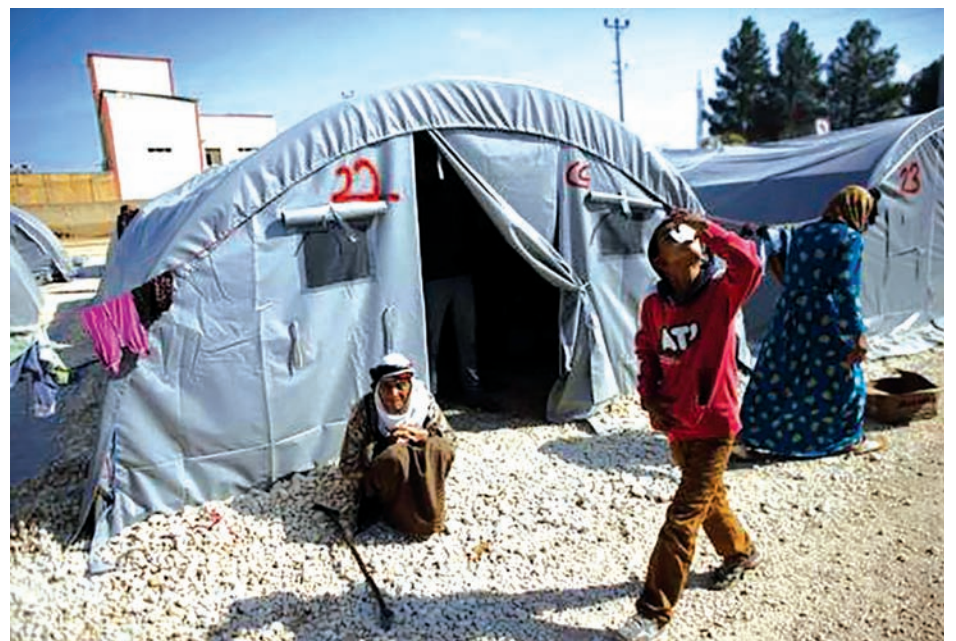
Syrian Kurdish refugees sit outside their tents at a temporary refugee camp which is set up by local municipality, in the southeastern Turkish town of Suruc in Sanliurfa Province on 2 Oct, 2014.

Kurdish militants in Turkey warned that peace talks with Ankara, meant to end a three-decade insurgency, would collapse if the Islamist insurgents were