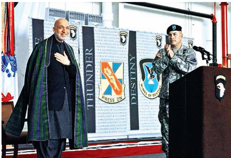
Afghan President Hamid Karzai (L) is applauded by US Army Maj Gen John F Campbell, commanding general, 101st Airborne Division at Fort Campbell, Kentucky, on 14 May, 2010.

WASHINGTON, 3 Oct — Afghan military casualties have spiked in recent weeks amid an increase in Taliban attacks, but the top US commander in the country said on Thursday that rebel gains were fleeting and he was confident Afghan forces could stop them from holding ground.