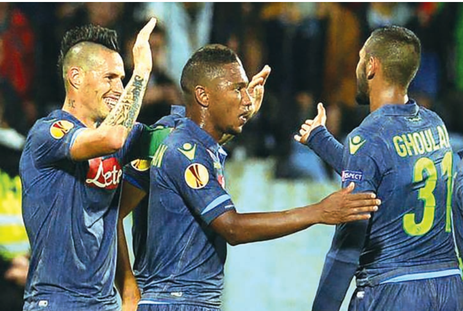
Marek Hamsik (L) of Napoli celebrates after goal with teammate Faouzi Ghoulam during their Europa League group I soccer match at the Arena Pasienky in Bratislava on 2 Oct, 2014.

Napoli have endured a difficult start in Serie A with only two wins from their opening five games, heaping pressure on manager Rafa Benitez, who had already failed to steer his team through a Champions League playoff.—Reuters