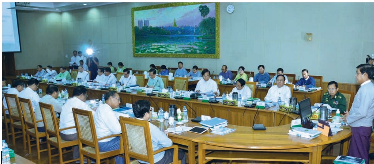
Vice President U Nyan Tun highlights rural development and poverty alleviation at the coordination meeting.