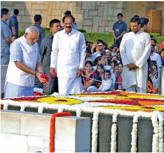
Indian Prime Minister Narendra Modi pays tributes to Mahatma Gandhi during a remembrance ceremony for his 145 th birth anniversary at Rajghat in New Delhi, India, on 2 Oct, 2014.