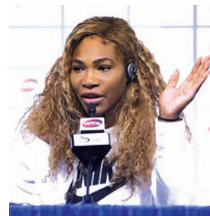
Serena Williams of the US answers a question at a news conference at the China Open tennis tournament in Beijing, on 3 Oct, 2014.

Djokovic will face either US Open champion Marin Cilic or Briton Andy