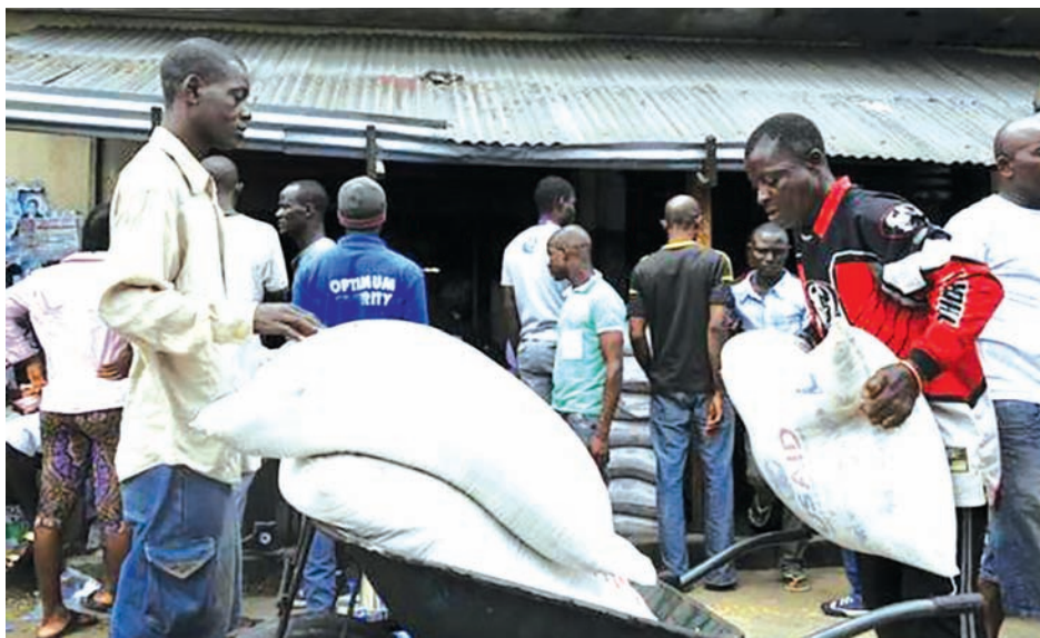
Residents of West Point neighbourhood, which has been quarantined following an outbreak of Ebola, receive food rations from the United Nations World Food Programme (WFP) in Monrovia on 28 Aug, 2014.

FREETOWN/DAKAR, 3 Oct—The threat of hunger is tracking Ebola across affected West African nations as the disease kills farmers and their families, drives workers from the fields and creates food shortages.