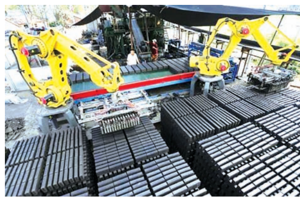
Workers look at machines moving newly made raw bricks at a factory in Huaibei, Anhui Province on 13 July, 2014.