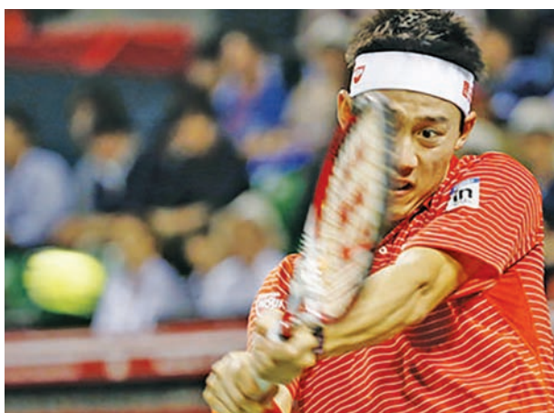
Kei Nishikori of Japan returns the ball to Donald Young of the United States during their second-round match at the Japan Open tennis tournament in Tokyo on 2 Oct, 2014. Nishikori won 6-4, 7-6(4) to advance to the quarterfinals.

"I've known my opponent since we were playing in juniors," Nishikori said. "We each know what the other's got, so it's a little hard to play him, but I com-