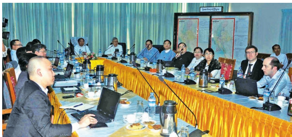
Myanmar and Thailand officials hold talks at meeting of Dawei special economic zone and related projects.—MNA

NAY PYI TAW, 2 Oct — Myanmar and Thailand met at the Ministry of Transport here on 1 October to discuss matters related to the continued implementation of the Dawei special economic zone and related projects, sources said.