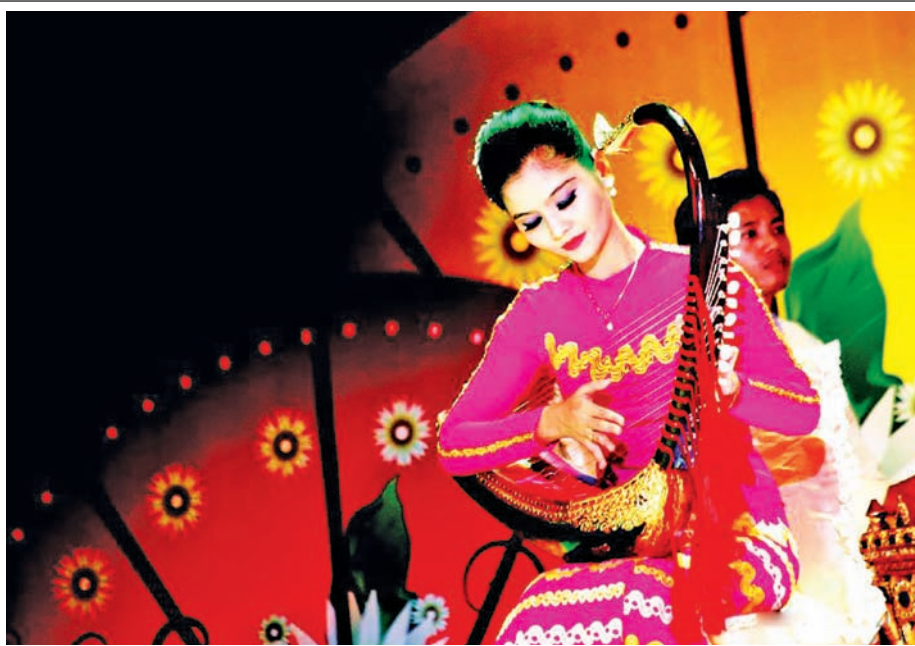
A Myanmar artist performs with traditional musical instrument during the ASEAN cultural fair in Yangon, Myanmar, on 1 Oct, 2014. The cultural fair will run till Friday. — XINHUA

Jokowi’s coalition only controls 139 seats in parliament.— Kyodo News