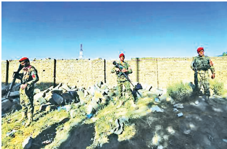
Afghan security forces inspect the site of a suicide bomb attack in Kabul on 2 Oct, 2014.

Beltran Leyva now faces charges of trafficking cocaine from Mexico and South America to the United States and Europe and a host of other crimes. In November, the US Treasury Department said the Beltran Leyva gang was responsible for "countless murders" of Mexican anti-drugs and military personnel.—Reuters