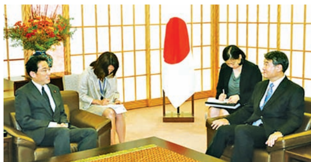
Japanese Foreign Minister Fumio Kishida (far L) and Cho Tae Yong (far R), South Korea's first vice foreign minister, hold a meeting at the Foreign Ministry in Tokyo on 2 Oct, 2014.

TOKYO, 2 Oct — Foreign Minister Fumio Kishida on Thursday called for joint efforts with South Korea to advance bilateral relations including holding a summit between the two countries' leaders. In a meeting in Tokyo with Cho Tae Yong, South Korea's first vice foreign minister, Kishida stressed the importance of "continuing and deepening communications" with Seoul "at high political levels," the Foreign Ministry said.