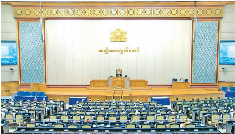
Amyotha Hluttaw (Upper House) continues Thursday's session.

NAY PYI TAW, 2 Oct — The Yangon Region Government has planned to upgrade 15 sports grounds in six townships in the region, the deputy minister for Sports told the Amyotha Hluttaw (Upper House) on Thursday.