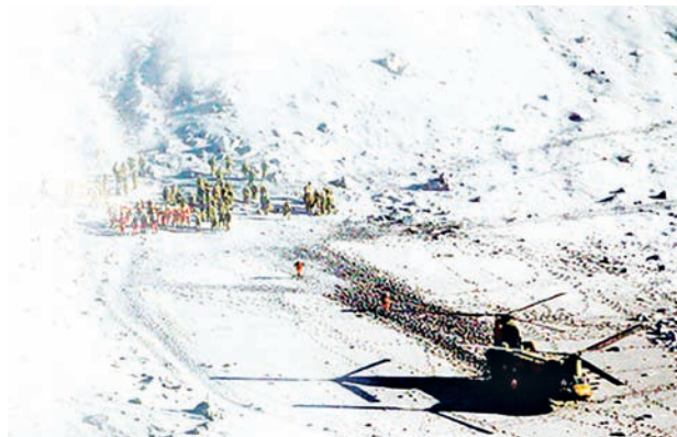
Photo taken from a Kyodo News helicopter shows rescue workers standing near a helicopter following search and rescue operations for missing climbers on Mt Ontake in central Japan on 1 Oct, 2014. The death toll from 27 Sept eruption has reached 48, making it the worst postwar volcanic disaster in Japan.

TOKYO, 2 Oct — Rain halted search efforts at Mt Ontake in central Japan on Thursday, the sixth day after the country's worst postwar volcanic disaster killed at least 47 people.