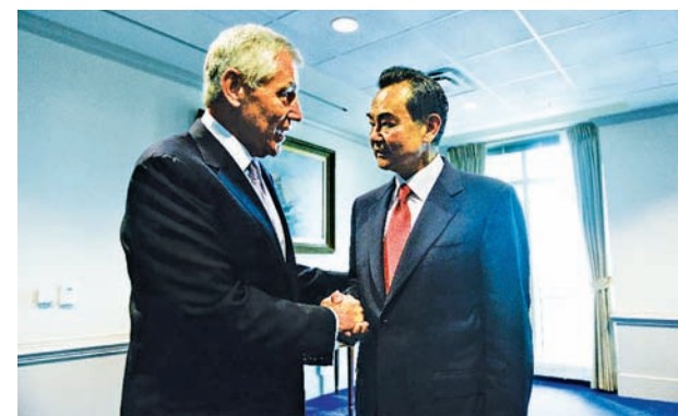
Chinese Foreign Minister Wang Yi (R) meets with US Defence Secretary Chuck Hagel in Washington DC, the United States, on 1 Oct, 2014.

China and the United States should build strategic mutual trust, very importantly the mutual trust between their militaries, and reduce mistrust, he said. Expressing congratulations on the 65 th anniversary of the founding of the People's Republic of China, Hagel said that the United States and China are partners, not rivals, and there are far more common interests than differences between the two countries.—Xinhua