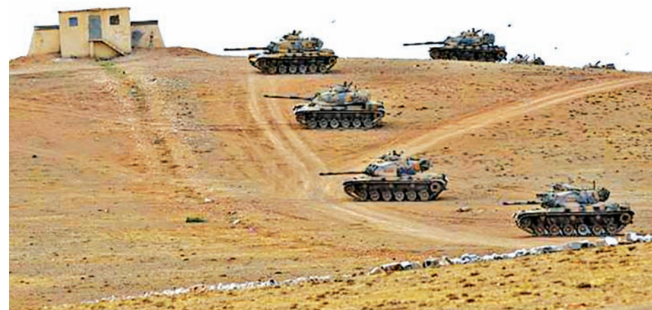
Turkish army tanks take up position on the Turkish-Syrian border near the southeastern town of Suruc in Sanliurfa Province on 29 Sept, 2014.