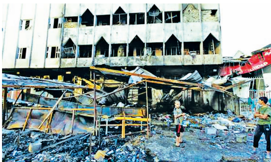
People gather at the site of a car bomb attack in a Shi'ite neighbourhood of New Baghdad in southeastern Baghdad, on 2 Oct, 2014.

Islamic State fighters have taken control of hundreds of villages around Kobani, beheading civilians in a bid to terrorise villagers into submission,