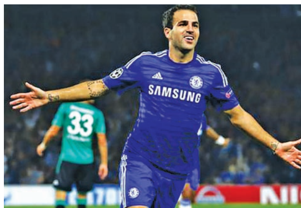
Chelsea's Cesc Fabregas celebrates after scoring a goal against Schalke 04 during their Champions League soccer match against at Stamford Bridge in London on 17 Sept, 2014.—REUTERS

The only league points Chelsea have dropped this season were in their 1-1 draw at Manchester City on 21 September when their former player Frank Lampard scored against them.—Reuters