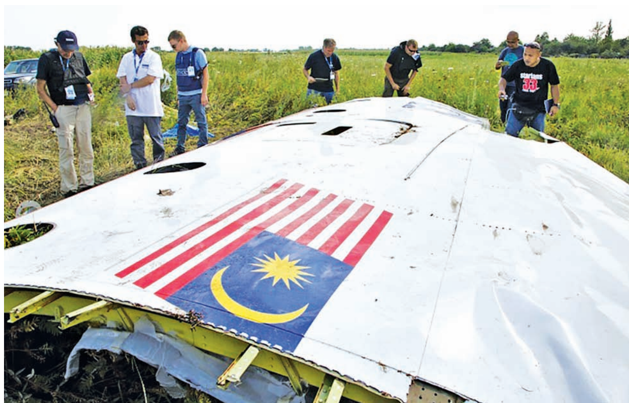
International experts at the site of the crash.

"If they say someone seized a Buk missile system, why then this sector