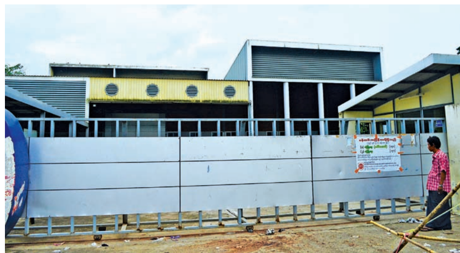
The amaterials inside the Master Sports Factory would be auctioned on 9 October and it would help settle the dispute between the employe and workers of the factory.

my dissertation and he gladly gave me invaluable suggestions. From then on, I was so busy with my research that I had lost contact with him for over a year. Although I often thought of visiting him, I was prevented by some reason from doing so. I, therefore, hearing the unexpected news of the Sayadaw's death, could not help but put the blame on myself. Anyhow, it was the Sayadaw who invested me with the priceless gem of the Dhamma and higher academic knowledge. Therefore, I will go on remembering the gratitude of the Sayadaw nostalgically for life. As a student of the Sayadaw, I, at the same time, have resolved to be a model teacher, following in his footstep to my every possible extent.