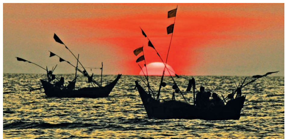
Fishing boats are seen against setting sun on Maungmagan beach near the town of Dawei in southern Myanmar on 19 Nov, 2011. Picture taken on 19 Nov, 2011. — REUTERS

Japan has expressed increasing interest in Dawei — the project could be a significant boost to swelling Japanese industrial interests in the region — though talks with Tokyo have stalled.— Reuters