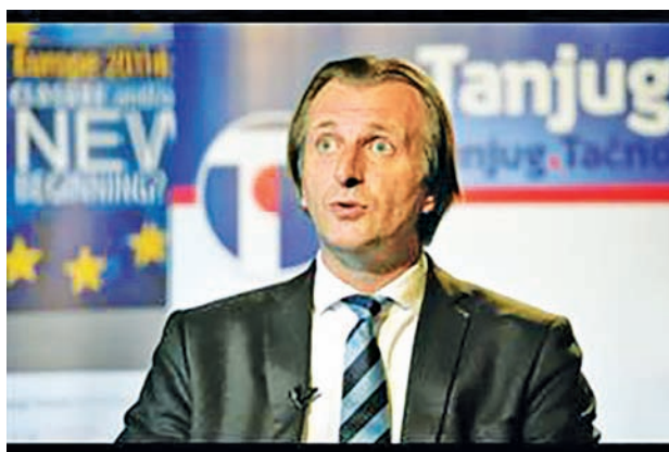
Deputy Minister of Interior Sasa Rasic

There is no accurate information about the number of people from Kosovo currently among the ranks of the Islamic State of Iraq and Syria, but estimates put that figure at around 200, and around 15 have died there,