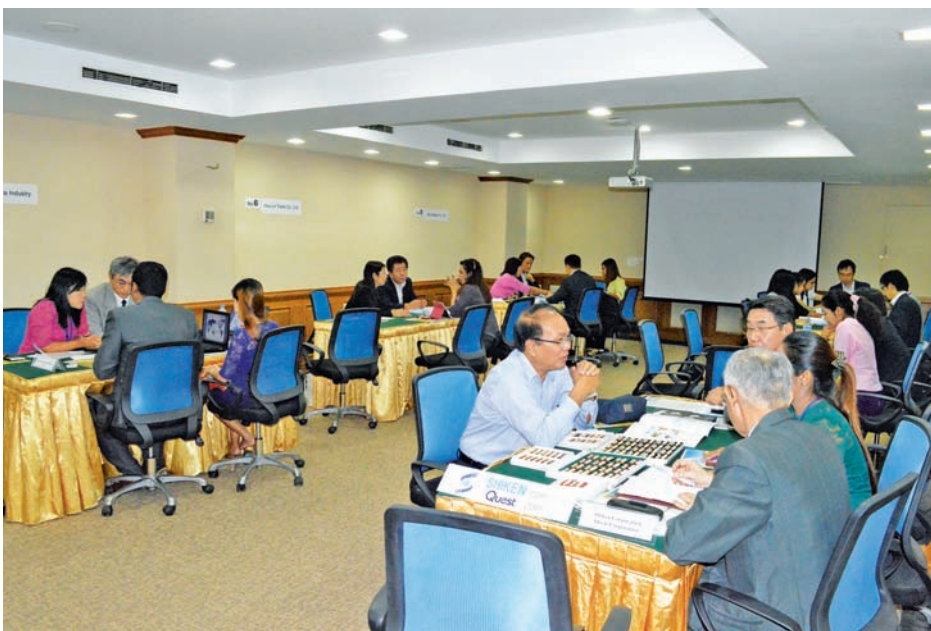
Business matching activities are in progress at UMFCFI Building on Thursday with a view to enhance business networks and collaborations between Myanmar businesses and Japanese SME firms.

It was the second event between Myanmar and Japanese SMEs. Following the first business matching last year, four companies had reached agreements to sign contracts respectively, officials said. According to the UMFCFI, a Myanmar business delegation formed with 25 businesses will visit Japan on 6 October to conduct business matching with Japanese partners in Tokyo and Osaka.—GNLM