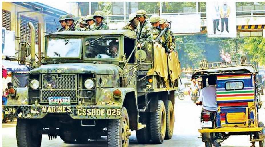
Soldiers ride in a truck as they patrol a road in Jolo, Sulu, in southern Philippines on 25 Sept, 2014.

MANILA, 2 Oct — Al-Qaeda linked Islamist militants in the Philippines said on Thursday they will kill one of two German captives on 17 October unless their demands are met.