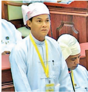
Deputy Attorney-General U Tun Tun Oo.—MNA

NAY PYI TAW, 2 Oct — The Ministry of Sports is organizing state/region chief minister's cup sport events in 15 capitals of states and regions in order to promote sports in Myanmar, spending from K 1.63 million to K 5.28 million for each competition depending on types of sports and competitions, Deputy Minister for Sports U Zaw Win told