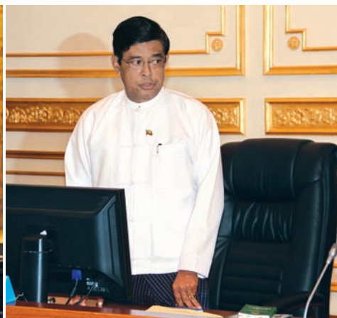
Vice Presidents Dr Sai Mauk Kham and U Nyan Tun participate in discussions at Financial Commission Meeting 3/2014.

NAY PYI TAW, 2 Oct—A Myanmar military delegation led by Commander-in-Chief of Defence Services Senior General Min Aung Hlaing arrived back in Yangon from Seoul on 1 October, sources said.