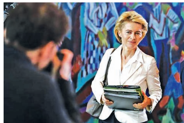
German Defence Minister Ursula von der Leyen arrives at a cabinet meeting at the Chancellery in Berlin on 1 Oct, 2014.