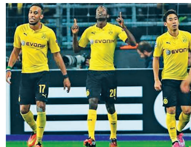
Borussia Dortmund's Adrian Ramos (C) celebrates his goal with team mates Pierre-Emerick Aubameyang (L) and Shinji Kagawa during their Champions League group D soccer match against Anderlecht at Constant Vanden Stock stadium in Brussels on 1 Oct, 2014.

"It was heavy going over the course of 90 minutes and it will still take some time," he said.