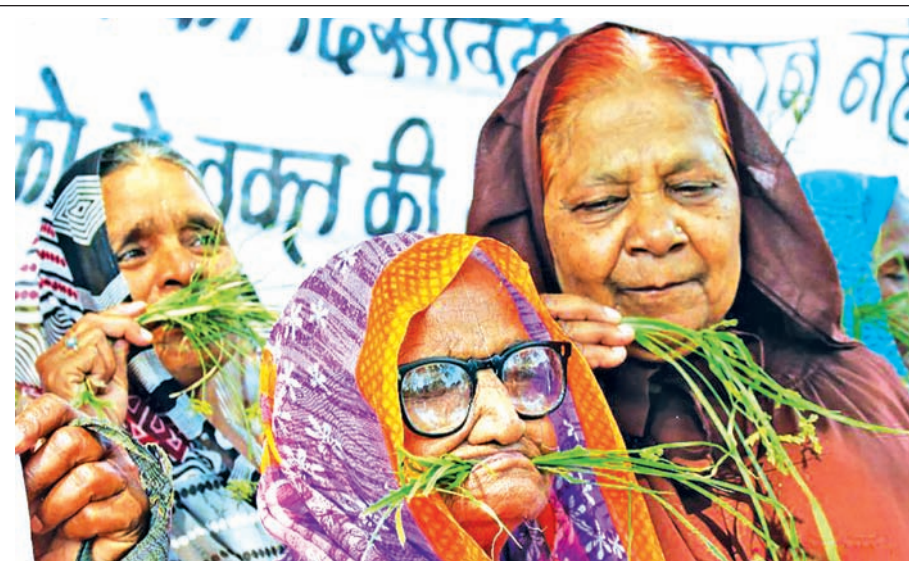
Aged people demonstrate for their rights on the International Day of Older Persons in Bhopal, India, on 1 Oct, 2014. Activists demand for increase in the social security pensions and better medical facilities. 1st October is marked as the International Day of Older Persons to promote the awareness and protection for the elderly.