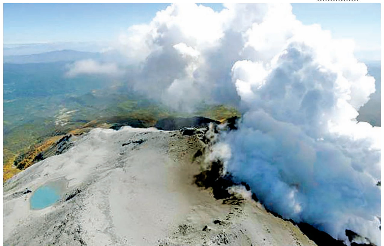
Volcanic smoke rise from Mt Ontake, which straddles Nagano and Gifu prefectures, central Japan, on 13 Sept, 2014.—KYODO NEWS