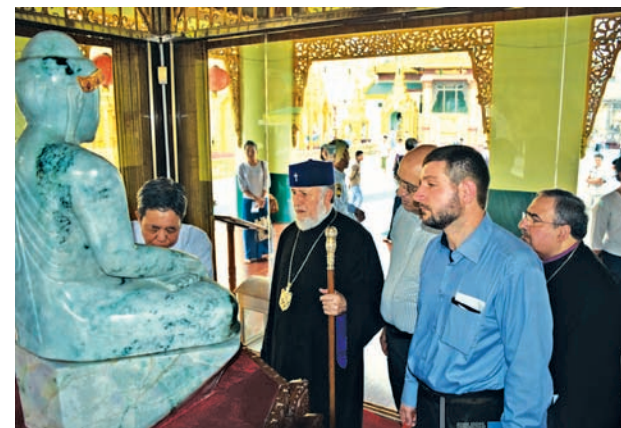
Armenian archbishop Karekin II visits Jade Buddha Image at Shwedagon Pagoda.