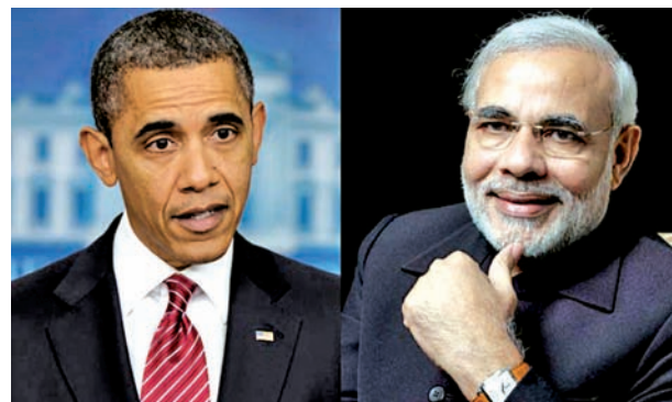
US President Barack Obama and Indian Prime Minister Narendra Modi

Obama and Modi, who took office in May, “agreed