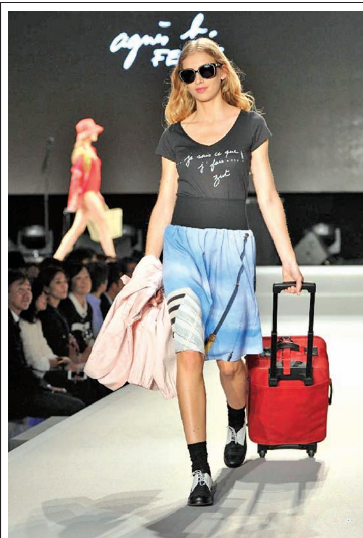
Models present creations of Agnes B. during the 2015 Spring/Summer ready-to-wear collection fashion show in Paris, France on 30 Sept, 2014.—XINHUA

Opening screen of the 27th TIFF will be a US film named Big Hero 6 and the closing screen is Parasyte, a Japanese movie directed by Takashi Yamazaki. The 27th TIFF will be started on 23 October in Tokyo.—Xinhua