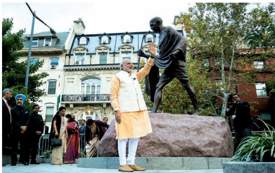
India’s Prime Minister Narendra Modi (C) waves to supporters after paying homage at the Mahatma Gandhi Statue in front of the Indian Embassy in Washington on 30 Sept, 2014.