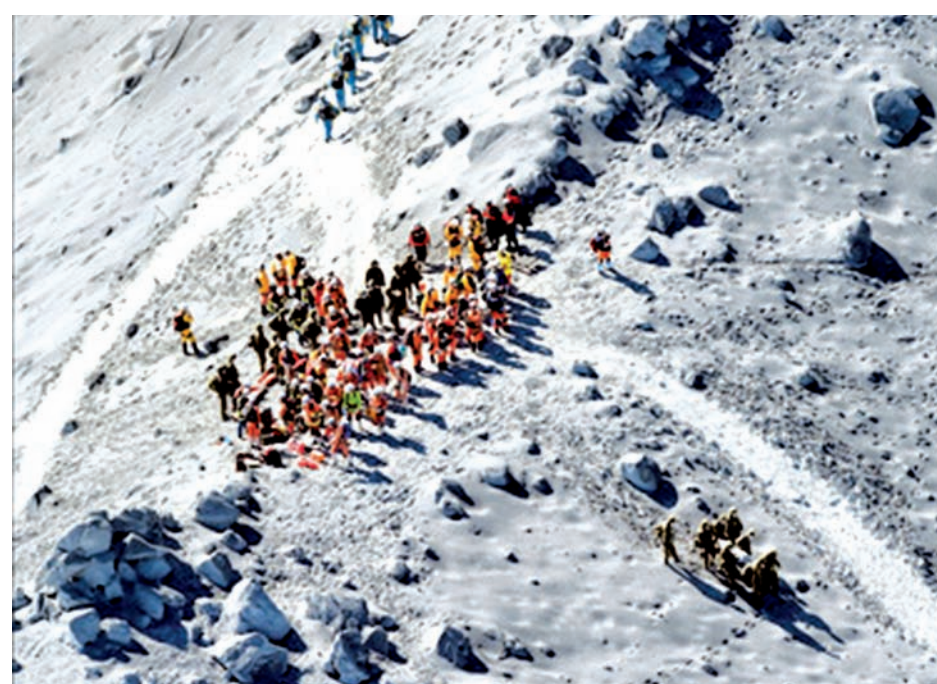
Photo taken from a Kyodo News helicopter shows Ground Self-Defence Force personnel and firefighters searching for survivors and retrieving bodies near the top of Mt Ontake in central Japan on 1 Oct, 2014, four days after the 3,067-metre volcano erupted. The eruption has claimed dozens of victims.