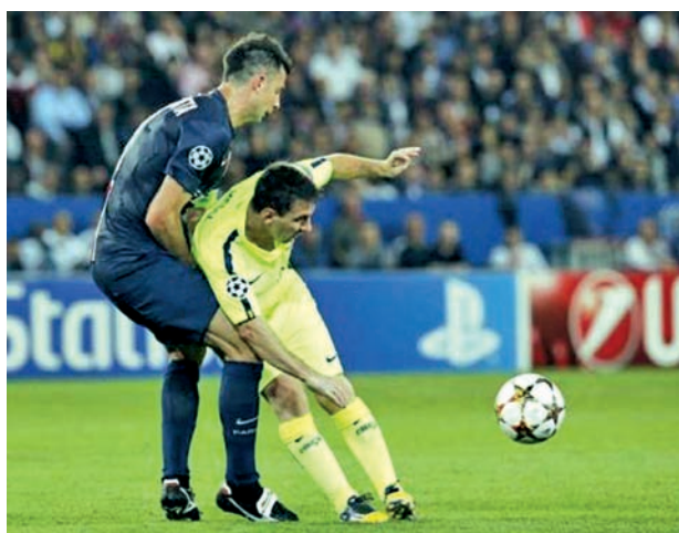
Paris St Germain's Thiago Motta (L), challenges Barcelona's Lionel Messi during their Champions League Group F soccer match at the Parc des Princes Stadium in Paris, on 30 Sept, 2014.

PARIS, 1 Oct — Paris St Germain made light of the absent Zlatan Ibrahimovic and a sub-standard start to the season to claim a 3-2 Champions League victory over Barcelona on Tuesday.