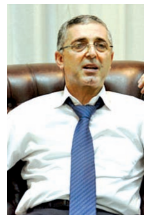
Ali Haidar, the Syrian minister of state for national reconciliation, is interviewed by Kyodo News in Damascus on 30 Sept, 2014. Haidar said Syria is coordinating with the United States “through a mediator” in conducting airstrikes against targets of the Islamic State militant group.