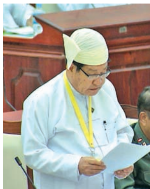
Deputy Minister for Agriculture and Irrigation U Khin Zaw.

NAY PYI TAW, 1 Oct — The Pyithu Hluttaw (Lower House) continued for the 13 th day session on Wednesday with the Q&A session on maintenance of Sawbwa Lake, sufficient supply of water to village, construction of gravel road and town hall, and development of hotels and tourism sector.