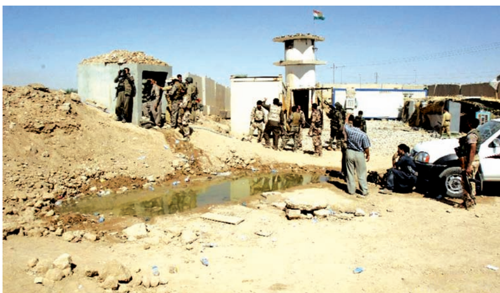
Kurdish security forces, known as Peshmerga, clash with the Islamic State (IS) militants in some villages near Kirkuk, Iraq, on 30 Sept, 2014. Kurdish security forces on Tuesday retook control of a border town with Syria and several others villages from the hands of the Islamic State (IS) militants after heavy clashes in northern Iraq, security sources said.