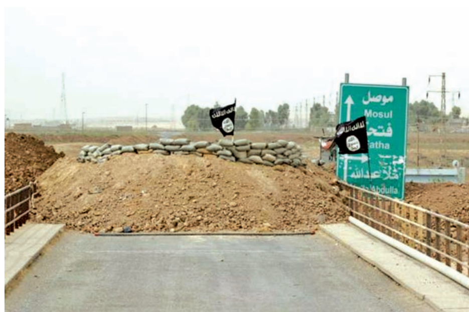
Islamic State flags flutter on the Mullah Abdullah bridge in southern Kirkuk on 29 Sept, 2014.

up of eight Super Hornet fighter jets, an early warning and control aircraft, an aerial refueling aircraft, along with 400 air force personnel and 200 special force soldiers.—Reuters