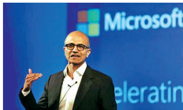
Microsoft Chief Executive Officer (CEO) Satya Nadella addresses the media during an event in New Delhi on 30 Sept, 2014.

al computers and is used by 1.5 billion customers worldwide, is aimed at recapturing the lucrative business market, which generally ignored the new-looking Windows 8.