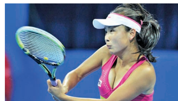
Peng Shuai of China returns a hit to Petra Kvitova of Czech Republic during the women's 2nd round match at the 2014 China Open in Beijing, capital of China, on 1 Oct, 2014. Kvitova won 2-0.

So far, all the Chinese players are out of the China Open women's singles, but Peng Shuai still has a chance to move into the semifinals in the women's doubles with her new partner An-