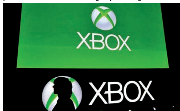
A Spanish Games — blogger is silhouetted against the logo of Microsoft’s Xbox during the Xbox Play Day 2014, before the Gamescom 2014 fair in Cologne on 12 Aug, 2014. — REUTERS

Prosecutors said the ring gained unauthorized access to the computer networks of Microsoft and some of its partners between January 2011 and March 2014 to steal source code, technical specifications and other information. Some of the intrusions were directed at the Xbox One gaming console before its November 2013 release. The hackers tried to build a counterfeit version of the console, according to the indictment. The hackers also stole information about pre-release versions of the “Gears of War 3” and “Call of Duty: Modern Warfare 3” video games, prosecutors said. — Reuters