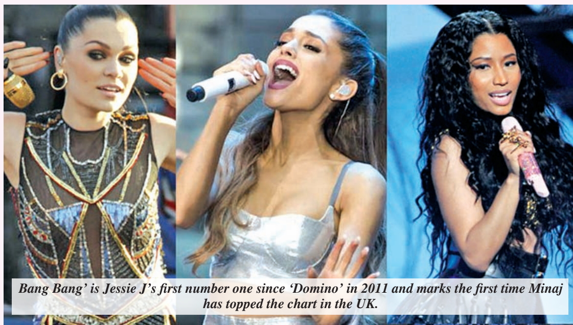
Bang Bang’ is Jessie J’s first number one since ‘Domino’ in 2011 and marks the first time Minaj has topped the chart in the UK.

‘Bang Bang’ is Jessie J’s first number one since ‘Domino’ in 2011 and marks the first time Minaj has topped the chart in the UK. Taylor Swift’s ‘Shake it Off’ climbed to third, ‘Blame’ by Calvin Harris and John Newman dropped to fourth, while Lilly Wood and