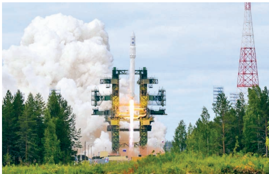
The spotting station was devised in order to detect rocket fragments in a real-time mode.— ITAR TASS

MOSCOW, 1 Oct — Russia's Ministry of Defence will start operating the newest spotting system this year to detect falling rocket fragments. The system was developed at the Khrunichev research and production center to spot impact areas of parts of the carrier rocket Angara , the newspaper Izvestia writes.