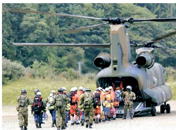
Ground Self-Defence Force personnel and firefighters board a helicopter on 1 Oct, 2014, to head for Mt Ontake, continuing to fume since its eruption four days earlier, in central Japan. Police, firefighters and the GSDF resumed operations the same day to find survivors and retrieve bodies at the 3,067-metre volcano, after interruptions due to continued volcanic activity. The eruption has claimed dozens of victims