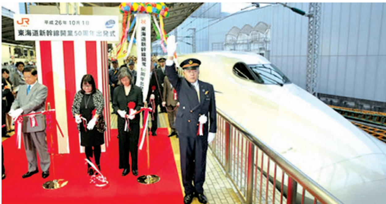
A shinkansen bullet train departs JR Tokyo Station for Fukuoka on 1 Oct, 2014, in a ceremony to commemorate the 50th anniversary of the launch of Tokaido Shinkansen bullet train services connecting Tokyo with Osaka.