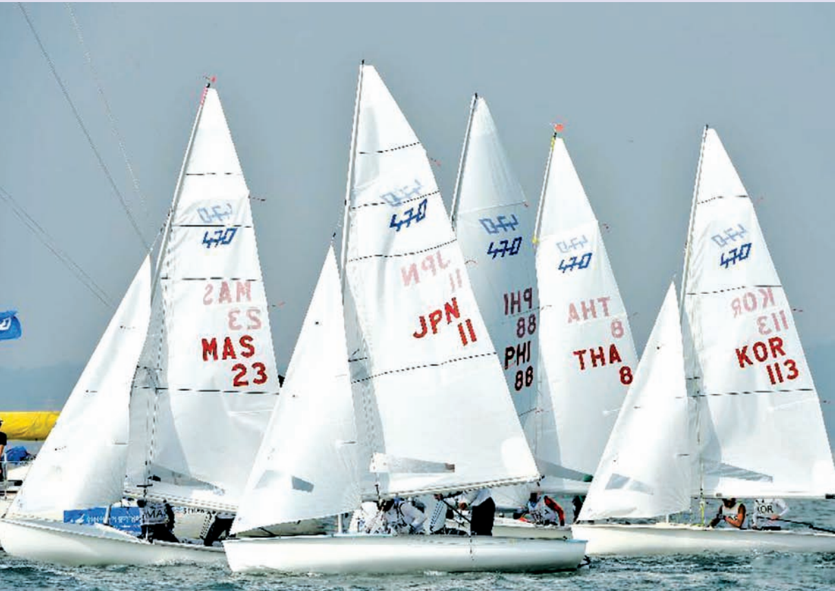
Athletes compete during the 470 — men's two person dinghy match of sailing at the 17 th Asian Games in Incheon, South Korea on 30 Sept, 2014.