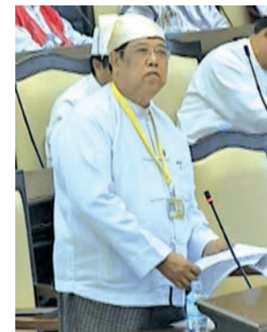
Deputy Minister for Construction U Soe Tint. —MNA

He was responding to the question raised by a representative who asked whether the government has