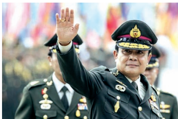
Thailand’s Prime Minister Prayuth Chan-ocha waves after a handover ceremony for the new Royal Thai Army Chief at the Thai Army Headquarters in Bangkok on 30 Sept, 2014.