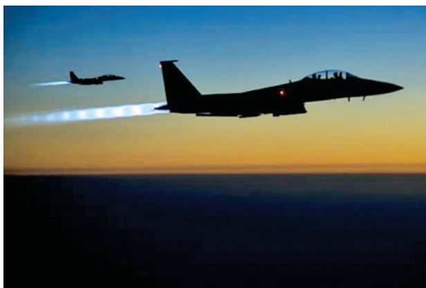
A pair of US Air Force F-15E Strike Eagles fly over northern Iraq after conducting airstrikes in Syria, in this US Air Force handout photo taken early in the morning of on 23 Sept, 2014.

SYDNEY, 1 Oct — Australian aircraft will join the US-led coalition in air strikes against Islamic State insurgents in Iraq in an initial support role, Prime Minister Tony Abbott said on Wednesday, ahead of a final decision to undertake bombing missions.