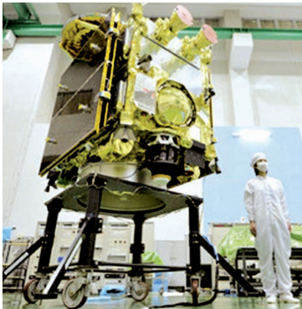
File photo taken in August 2014 in Sagami-hara, near Tokyo, shows the Hayabusa2 asteroid explorer that the Japan Aerospace Exploration Agency will launch on 30 Nov, 2014, the successor to the Hayabusa probe that returned to Earth in June 2010 after its unprecedented collection of asteroid surface samples.