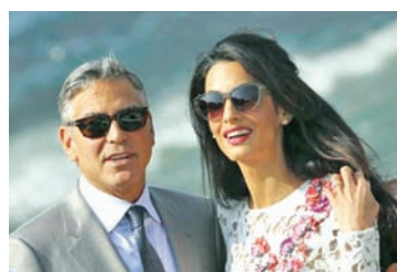
US actor George Clooney and his wife Amal Alamuddin travel on a water taxi at the Grand Canal in Venice on 28 Sept, 2014.

The piece de resistance was an off-the-shoulder tulle and Chantilly lace gown she wore at