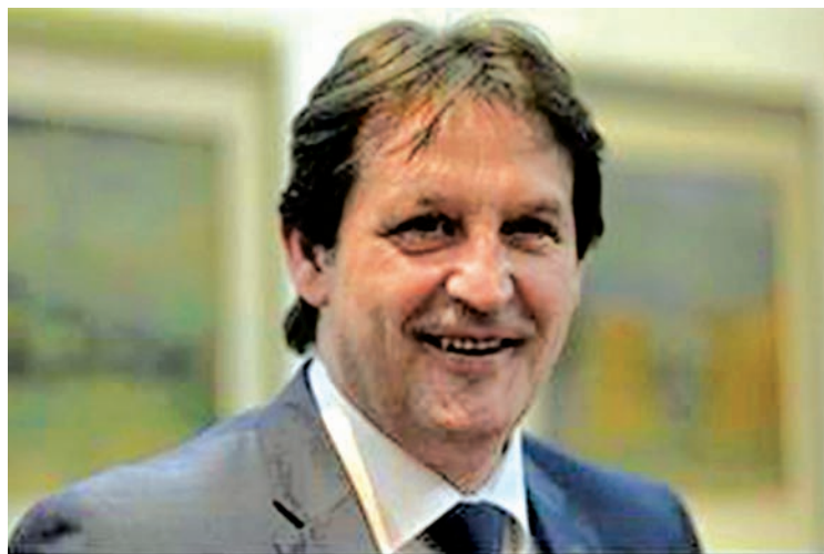
Serbian Defence Minister Bratislav Gasic

of joint actions with the Russian Federation, the United States of America and other partners. The Serbian Armed Forces is thus raising its operational capability, experience and knowledge to the highest level. This is not a silent accession or any other kind of accession. The Serbian parliament has made a decision that Serbia is neutral in military terms and end of story,” Gasic said.