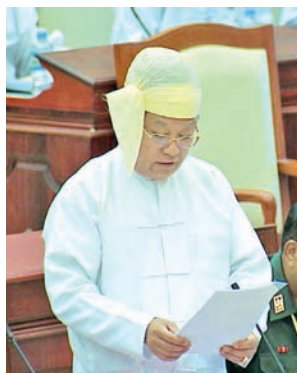
Deputy Minister at the President Office U Aung Thein. —MNA

Deputy Minister at the President Office U Aung Thein replied to the question of U Aung Kyaing of NyaungU constituency, saying that water from Ayeyawady River was pumped up to Tuywin Hill in 1964 with the assistance of Australia. In 2001, the tasks were handed over to Development Affairs Department to supply water. The department sank tube-wells in the villages. Now, NyaungU Township Development Affairs Committee plans to hand its duty of water supply to Rural Development Department. Arrangements are being made for supply