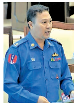
Lt-Cdr Ko Ko discusses amendment for Inland Water Transport Bill.