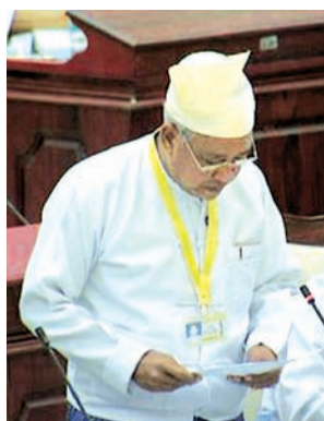
Deputy Minister for Communications and Information Technology U Win Than.—MNA

NAY PYI TAW, 26 Sept — Virgin lands, wetlands and marshlands have been allocated to farmless people in a bid to reduce poverty in rural areas, with the land management committees turning shifting plantation into ladder farming in hilly