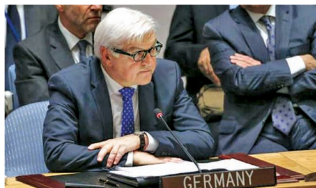
German Minister of Foreign Affairs Frank-Walter Steinmeier speaks during a United Nations Security Council meeting on Iraq at the UN headquarters in New York, on 19 Sept, 2014.

NEW YORK, 26 Sept — Six world power have never been so close to a deal with Iran that would resolve the