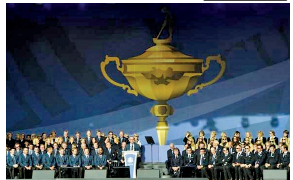
Team Europe captain Paul McGinley speaks during the opening ceremony of the 40 th Ryder Cup, at Gleneagles in Scotland on 25 Sept, 2014.

Former world number one Victoria Azarenka also withdrew before the tournament started while second seed Simona Halep could not take to the court for her third round match because of a stomach bug and Jelena Jankovic retired with a back injury.