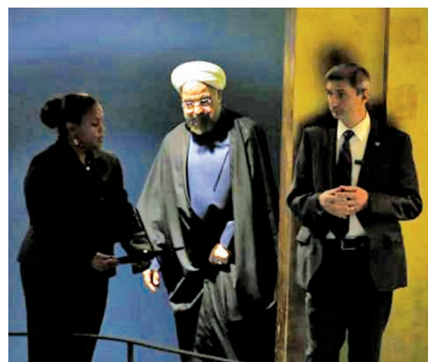
Iranian President Hassan Rouhani is escorted to the podium for his address to the 69 th United Nations General Assembly at United Nations Headquarters in New York, on 25 Sept, 2014.

In July, Iran and the six countries agreed to extend negotiations over Iran’s