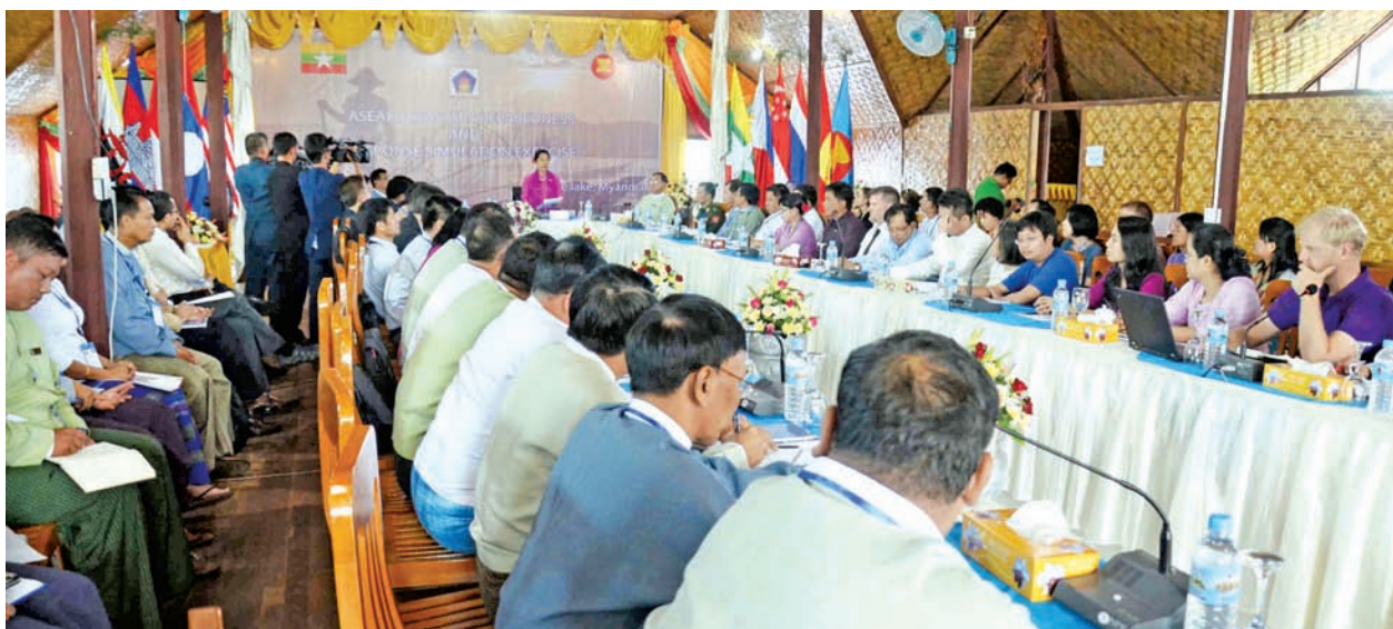
Union Minister Dr Daw Myat Myat Ohn Khin highlights preparedness for natural disasters and response simulation exercise with the strength of volunteers.

NAY PYI TAW, 26 Sept — The ASEAN Rehabilitation Taskforce Meeting, the Consultation Workshop on the ASEAN Guideline on Recovery Planning and the ASEAN Disaster Preparedness and Response Simulation Exercise took place at Shwe Kyunmyaw Hotel-2 in Inlay Lake of Nyaungshwe Township in Shan State on