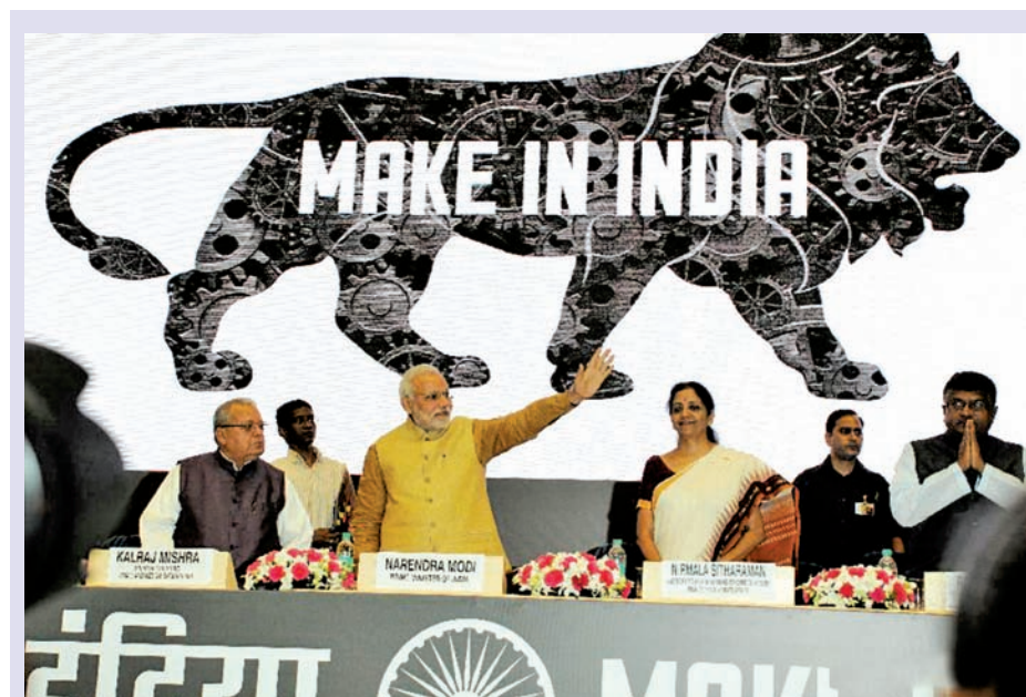
Indian Prime Minister Narendra Modi (3 rd L) unveils the logo of "Make in India" initiative prior to his scheduled departure to the United States in New Delhi, India on 25 Sept, 2014. Indian Prime Minister Narendra Modi launches "Make in India" campaign on Thursday in the capital, inviting global firms to set up manufacturing bases here.

Analysts say maintaining a positive mood will be important during the visit, given that Modi was denied a US visa in 2005 after more than 1,000 people, most of them Muslims, were killed in riots in the state he governed. There was no immediate comment from the Indian embassy in Washington on the letter from the US business lobby.—Reuters