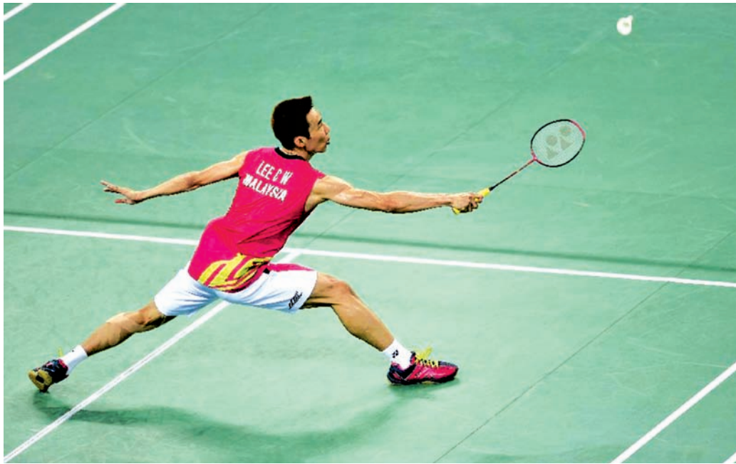
Lee Chong Wei of Malaysia returns the shuttlecock during the badminton men's singles round of 16 match against Parupalli Kashyap of India at the 17 th Asian Games in Incheon, South Korea on 26 Sept, 2014. Lee Chong Wei won 2-0.