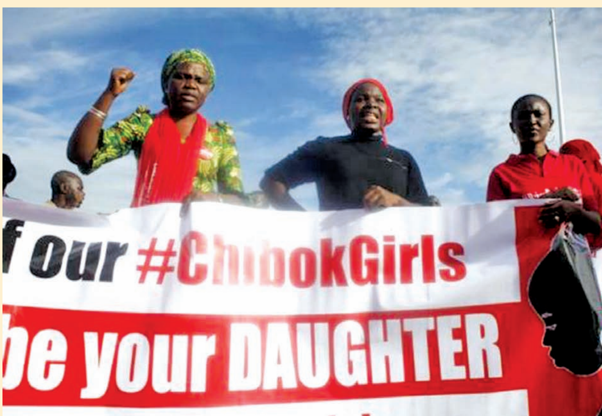
"#Bring Back Our Girls" campaigners march during a rally calling for the release of the Abuja school girls who were abducted by the Boko Haram militants in Borno State on 22 Aug, 2014. —REUTERS

Boko Haram militants" at Mubi in Adamawa state, some 100 km (60 miles) from Chibok.