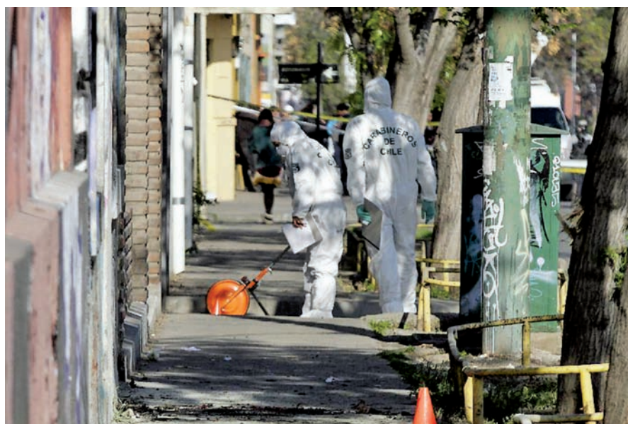
Officials inspect the blast site in the Yungay neighbourhood in downtown Santiago, capital of Chile, during the early hours of on 25 Sept, 2014. An unidentified young man died early on Thursday in the centre of Chilean capital after a handmade bomb blew off while manipulating it, police said.

The two Palestinian factions had set up a unity government in June but never took hold. Palestinian president Mahmud Abbas criticized Hamas of running another administration in Gaza.—Xinhua