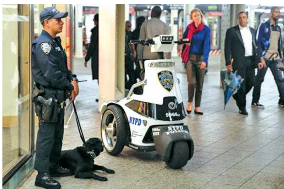
A member of the NYPD is seen with a canine at the Times Square subway station in New York, on 25 Sept, 2014.

"The NYPD Intelligence Bureau, which everyone knows has outposts all over the world and is the leader in terms of this work in local law enforcement all over the country, has assessed the statements of the Iraqi prime minister, and at this point finds no