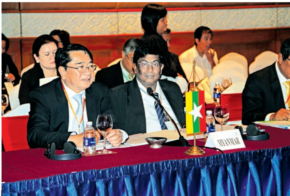
Union Minister for Health Dr Than Aung attends ASEAN Health Ministers' meetings in Vietnam.