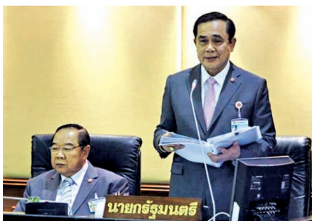
Thailand's Prime Minister Prayuth Chan-ocha (R) reads out his government's policy, as Deputy Prime Minister and Defence Minister Prawit Wongsuwan listens, at the Parliament in Bangkok on 12 Sept, 2014.

"There are academics, lawyers and (members of) social organizations so it should be viewed in a positive light," Prayuth said.