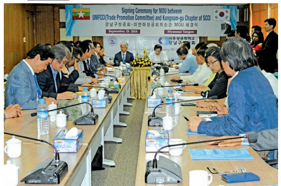
A South Korean trade mission in discussion with UMFCCI officials in Yangon on Thursday.