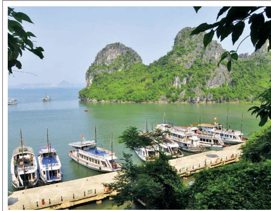
Photo taken on 24 Sept, 2014 shows a scenery of Ha Long Bay, literally “the descending dragon bay”, a world heritage and travel destination in northern Vietnam. Ha Long Bay, in the Gulf of Tonkin, includes some 1,600 islands and islets, forming a spectacular seascape of limestone pillars. Because of their precipitous nature, most of the islands are uninhabited and unaffected by a human presence. The site’s outstanding scenic beauty is complemented by its great biological interest. It was inscribed in UNESCO’s World Natural Heritage list in 1994. —XINHUA

Police have offered an award of up to 20,000 yuan (3,250 US dollars) for information. The search team is increasing as more police and civilians get involved.—Xinhua