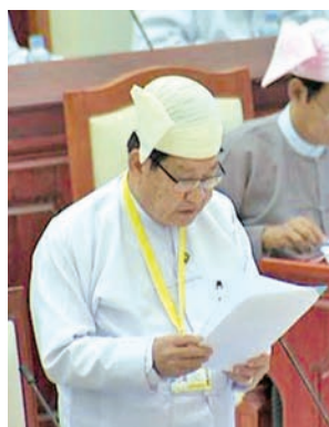
Deputy Minister for Agriculture and Irrigation U Khin Zaw.