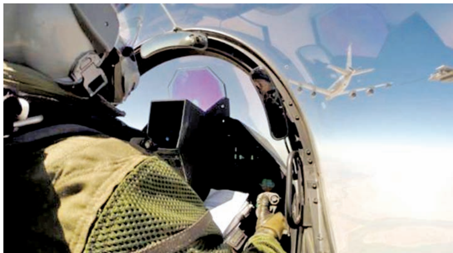
A pilot of a French Rafale fighter jet is pictured as he flies in formation next to an airborne Boeing C-135 refuelling tanker aircraft, during a mission from Al-Dhafra airbase on 18 Sept, 2014, in this handout image provided by ECPAD.

NEW YORK/ BEIRUT, 26 Sept — French fighter jets struck Islamic State targets in Iraq on Thursday, and the United States hit them in Syria, as a US-led coalition to fight the militants gained momentum with an announcement that Britain would join.