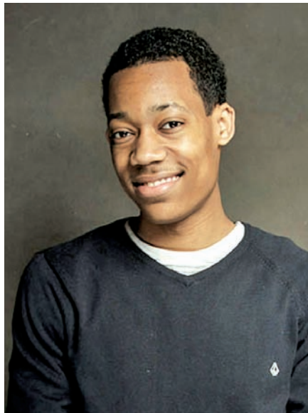
Tyler James Williams

'The Walking Dead' season five begins on 12 October.