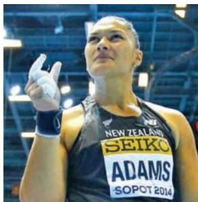
Valerie Adams of New Zealand reacts during the women's shot put final at the world indoor athletics championships at the ERGO Arena in Sopot on 8 March, 2014.