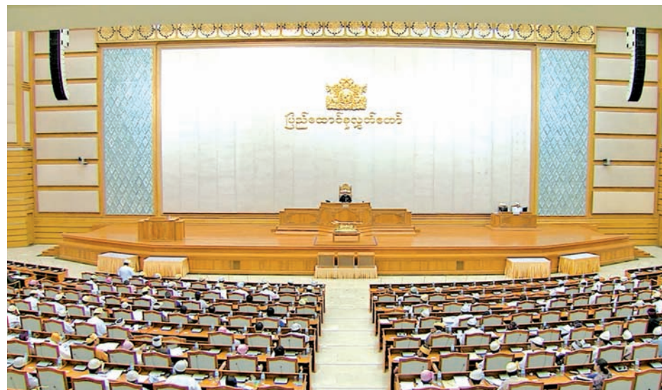
Pyidaungsu Hluttaw being convened with participation of representatives on Friday's session.