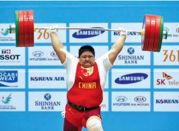
China's Zhou Lulu sets a new world record in the women's over 75kg clean and jerk weightlifting competition at the Moonlight Festival Garden during the 17 th Asian Games in Incheon on 26 Sept, 2014. Zhou set a new world record lifting a weight of 192kg and won the gold medal in the event.

INCHEON, (South Korea), 26 Sept — Chinese weightlifter Zhou Lulu set a clean and jerk world record of 192 kilograms to win gold in the women's +75kg category at the Asian Games on Friday. Zhou added 2kg to Russian Tatiana Kashirna's previous mark set last year in Poland. The London Olympics champion also hoisted 142kg in the snatch component to record an overall lift of 334kg but seemed completely underwhelmed at becoming the Asian Games champion. "Nothing special about it," she said, her world record barely meriting a mention. Zhou preferred to focus on the negatives.