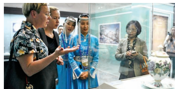
People from the Czech Republic talk about the history of glass art at the exhibition in the Inner Mongolia Museum in Hohhot, north China's Inner Mongolia Autonomous Region, on 25 Sept, 2014. The European Glass Art Exhibition, co-sponsored by the Prague National Gallery and the Inner Mongolia Museum, was opened to the public on 26 Sept.

STATE OF THE SEA: Sea will be slight to moderate in Myanmar waters.