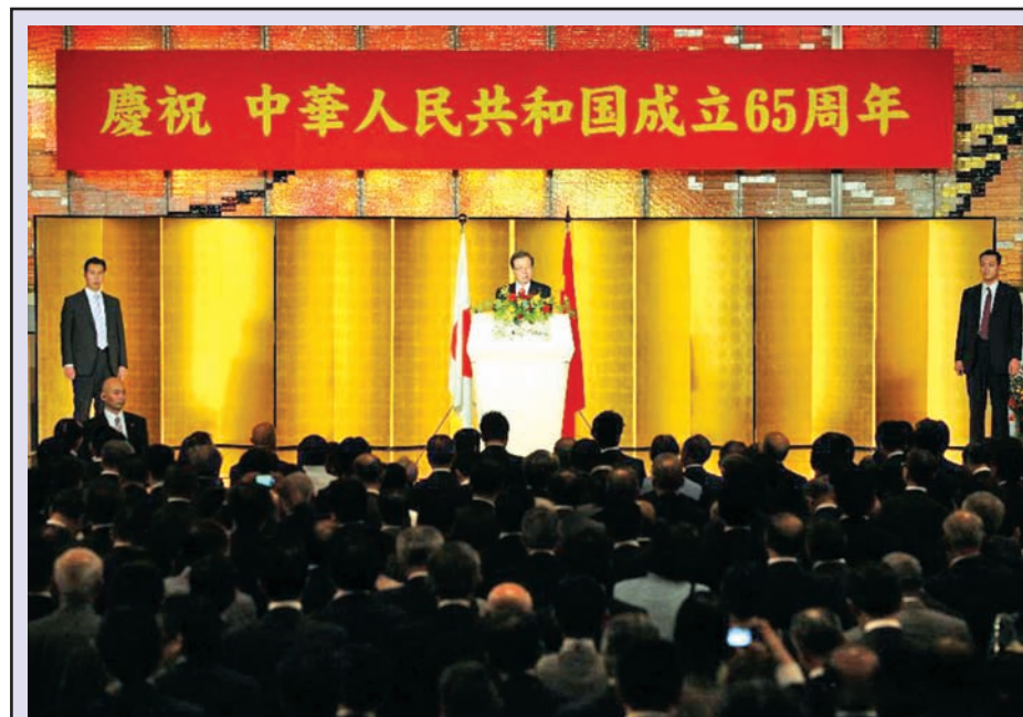
Chinese Ambassador to Japan Cheng Yonghua (C) delivers a speech during a ceremony marking the 65th anniversary of the People's Republic of China in Tokyo, Japan on 25 Sept, 2014.