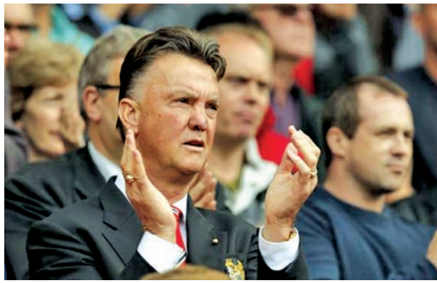
Manchester United's manager Louis Van Gaal applauds his team during their English Premier League soccer match against Queens Park Rangers at Old Trafford in Manchester, northern England on 14 Sept, 2014.

"If we'd have won it would be different. You can't make one incident a regular one. We will overcome things. The season lasts more than one competition day." Eighth-placed West Ham United travel to