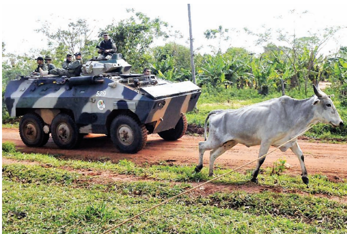
Members of the Joint Task Force patrol during an operation on the Horqueta mountain in Concepcion Department, Paraguay, on 25 Sept, 2014. The operation was held to search for members of the Paraguayan People Army and the Armed Farmer Group, considered by the government of Paraguay as highly dangerous groups.