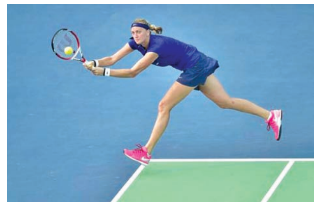
Petra Kvitova of the Czech Republic returns to Elina Svitolina of Ukraine during their women's singles semi-final match at the Wuhan Open tennis tournament in Wuhan, Hubei Province, on 26 Sept, 2014.

Kvitova lost her only previous meeting with Svitolina but was always the dominant player this time, winning the first set with ease and edging the second after surrendering an early break of service to the world