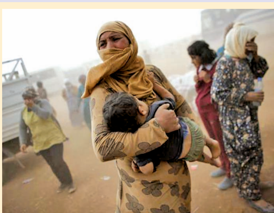
A Kurdish Syrian refugee waits for transport during a sand storm on the Turkish-Syrian border near the southeastern town of Suruc in Sanliurfa Province, on 24 Sept, 2014. —REUTERS

Many failed to reach safety, with the death toll so far this year from shipwrecks in the Mediterranean nearing 3,000 would-be migrants and asylum-seekers, aid agencies say. —Reuters