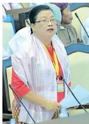
Deputy Minister for Labour, Employment and Social Security Daw Win Maw Tun.