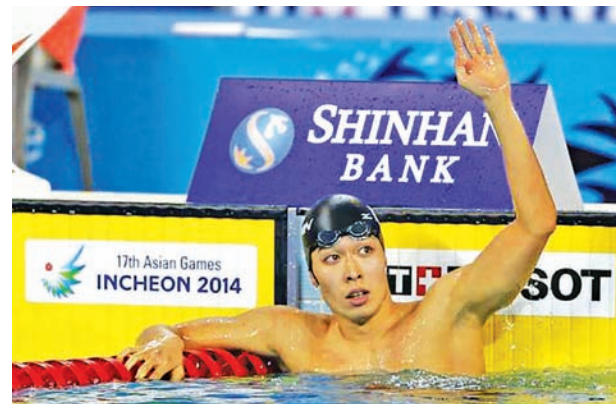
Japan's Kosuke Hagino reacts after winning the men's 200m individual medley final at the swimming competition at the Munhak Park Tae-hwan Aquatics Center during the 17th Asian Games in Incheon on 22 Sept, 2014.