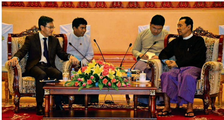
Speaker Thura U Shwe Mann holds talks with Mr Thongsavanh Phomvihane, Deputy Head of the Committee for External Relations of the Central Committee of Lao People's Revolutionary Party.

NAY PYI TAW, 23 Sept — To discuss parliamentary affairs, Speaker of Pyidaungsu Hluttaw and Pyithu Hluttaw Thura U Shwe Mann met a delegation led by Mr Thongsavanh Phomvihane, Deputy