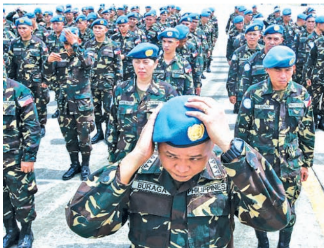
Soldiers of Armed Forces of the Philippines (AFP) attend the send-off ceremony for the 18th AFP contingent to the United Nations Peace Keeping Force at the Villamor Air Base in Pasay City, the Philippines, on 22 Sept, 2014. 157 soldiers will be assigned to Haiti for less than a year.