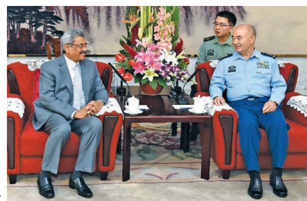
Xu Qiliang (R), vice chairman of China's Central Military Commission, meets with Gotabaya Rajapaksa, secretary of Sri Lanka's Defence and Urban Development Ministry, in Beijing, capital of China on 23 Sept, 2014.

Israel Radio said the aircraft was a drone and was shot down over the Israeli-occupied Golan Heights, where fighting from Syria's civil war has occasionally spilled over. Israeli Army Radio said it may have been a Syrian warplane. —Reuters