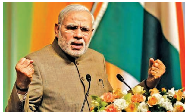
India's Prime Minister Narendra Modi

NEW YORK, 23 Sept — It is a rock 'n' roller's dream to "sell out The Garden," but for a foreign politician to pack New York City's most famous sports and entertainment arena is another thing entirely.