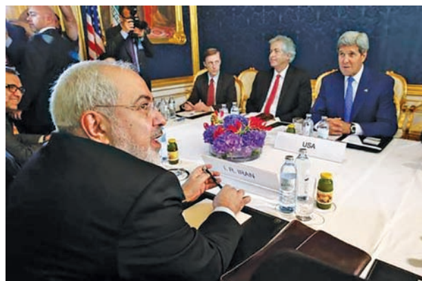
Iran’s Foreign Minister Javad Zarif (L) holds a bilateral meeting with US Secretary of State John Kerry (R) on the second straight day of talks over Teheran’s nuclear programme in Vienna, on 14 July, 2014.

Any material cooperation between the United States and Iran, for example in sharing intelligence about Islamic State movements, would have to be behind the scenes or done through intermediaries, experts say. The reason is that Washington’s Sunni Arab partners in the fight against Islamic State regard Iran with even more suspicion than US officials and see it as trying to deepen Shi’ite dominance in Iraq and extend its own influence in the region.— Reuters