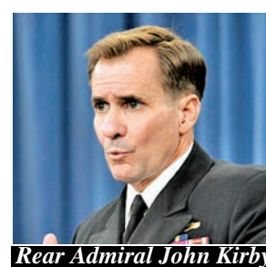
Rear Admiral John Kirby

to build the coalition, Secretary of State John Kerry traveled to New York at the weekend, ahead of the start of United Nations General Assembly meetings, for talks with counterparts from Arab and European allies to discuss plans to defeat Islamic State and hear their views on how they might participate.