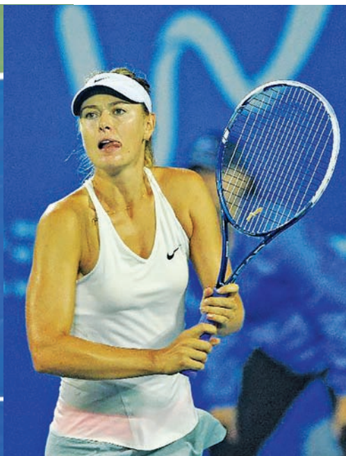
Maria Sharapova of Russia reacts during the Women's singles match against her compatriot Svetlana Kuznetsova at the WTA Wuhan Open tennis tournament in Wuhan capital of central China's Hubei Province, on 22 Sept, 2014. Maria won 2-1.