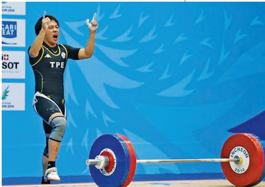
Taiwan's Lin Tzu Chi reacts after setting a new Asian Games record of 116kg in the women's 63kg snatch weightlifting competition at the Moonlight Festival Garden during the 17th Asian Games in Incheon on 23 Sept, 2014.