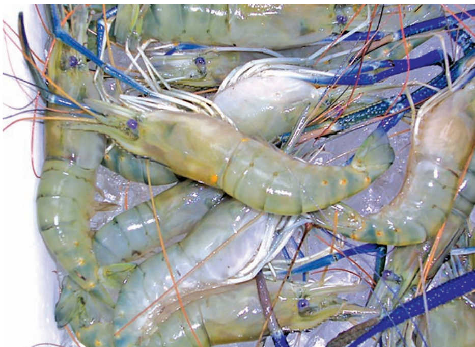
Myanmar aquaculture firms have expressed that a policy aimed at improving prawn and shrimp farming sector should be initiated.