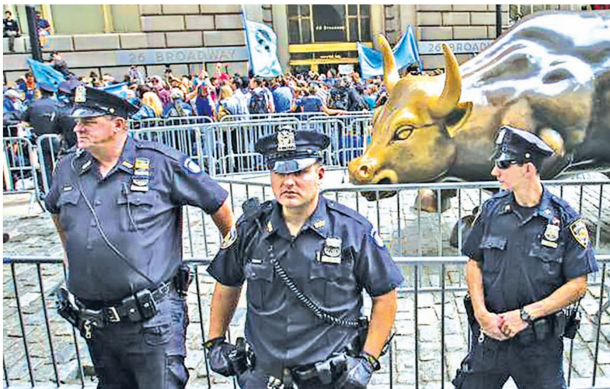
New York City police officers stand guard in front of the Charging Bull sculpture as hundreds of protesters take part in the Flood Wall Street demonstration in Lower Manhattan, New York on 22 Sept, 2014.

NEW YORK, 23 Sept — About 100 protesters were arrested on Monday in New York City during a demonstration that at one point blocked streets near the stock exchange to denounce what organizers say is Wall Street's contribution to climate change.