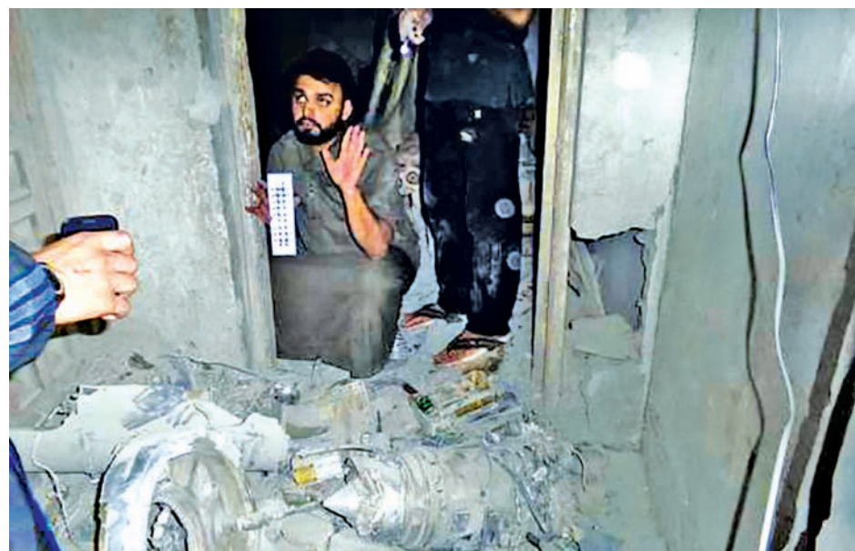
A man inspects the damage in a communication station where Islamist State militants say a US drone crashed into in Raqqa on 23 Sept, 2014.

nation forces are undertaking military action against (Islamic State) terrorists in Syria using a mix of fighter, bomber and Tomahawk Land Attack Missiles,”