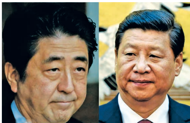
Japanese Prime Minister Shinzo Abe and Chinese President Xi Jinping

NEW YORK, 23 Sept—Japanese Prime Minister Shinzo Abe expressed eagerness on Monday to meet with Chinese President Xi Jinping on the sidelines of