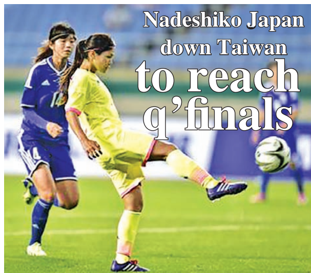
Nahomi Kawasumi (C) of Japan scores her team's third goal in the second half of a Group B match against Taiwan at the Asian Games in Incheon, South Korea, on 22 Sept, 2014. Japan won 3-0, securing their place in the quarterfinals.

us into a team than can win the final," said Sasaki.—Kyodo News