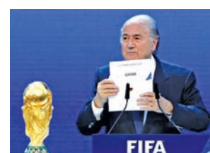
FIFA President Sepp Blatter announces Qatar as the host nation for the FIFA World Cup 2022, in Zurich on 2 Dec, 2010.