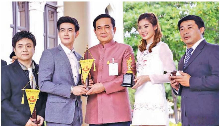
Thailand's Prime Minister Prayuth Chan-ocha (C) receives Vegetarian Festival symbol flags at the Government House in Bangkok, Thailand, on 23 Sept, 2014. The Vegetarian Festival in Thailand will be held from 24 Sept to 2 Oct. The yellow flag is the symbol of the Vegetarian Festival in Thailand.—XINHUA

"The Sultan owes the public an explanation on reasons why he deviated from the constitution," said Maria Chin Abdullah, the head of electoral reform group Bersih.—Reuters