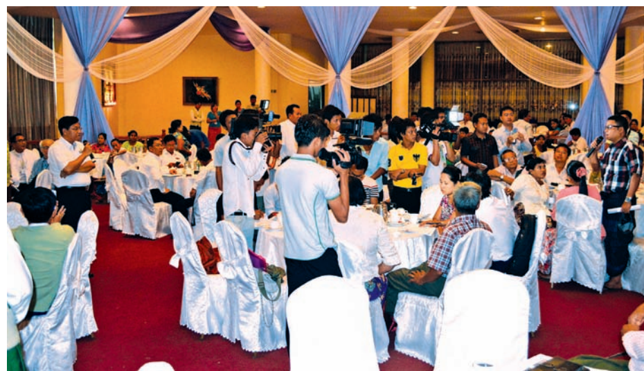
GM U Tun Aung Thinn of Myanmar Railways seeks public consultations over Yangon circular rail line upgrading project at a meeting in Yangon on Tuesday.