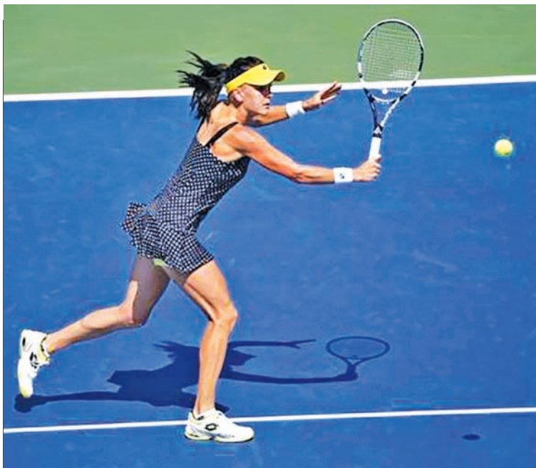
Agnieszka Radwanska of Poland hits a return to Peng Shuai of China during their match at the 2014 US Open tennis tournament in New York, 27 Aug, 2014.

French Open champion and world number four Maria Sharapova made a slow start but was one of the few seeds to make it through the Monday massacre after she beat compatriot Svetlana Kuznetsova 3-6, 6-2, 6-2 in