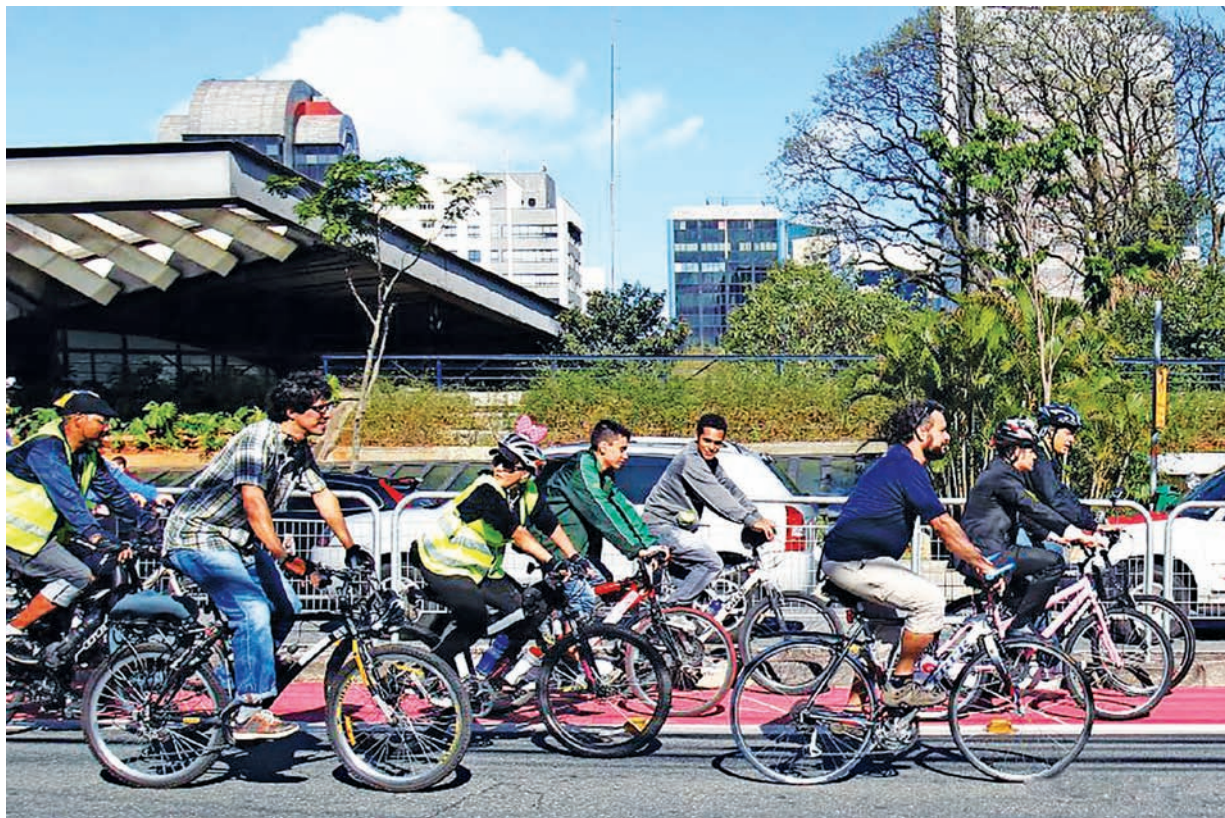
People ride bicycles in the city of Sao Paulo, capital of Brazil, on 22 Sept, 2014, the World Car Free Day.