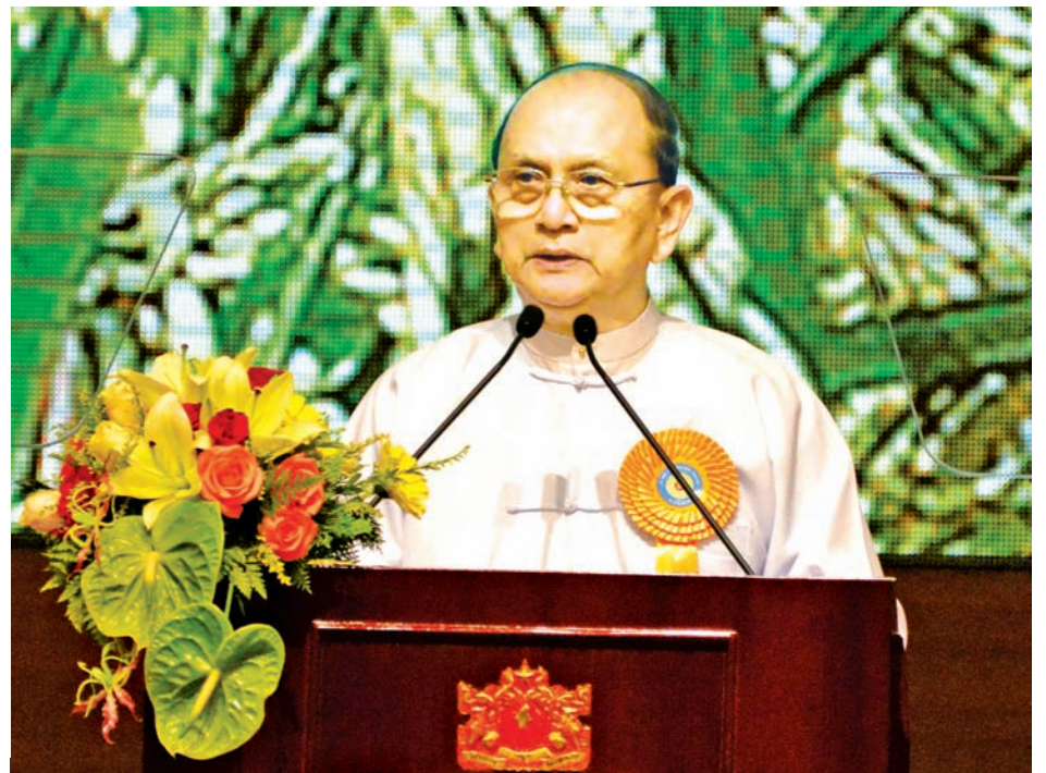
President U Thein Sein delivers address at the 36 th Meeting of the ASEAN Ministers on Agriculture and Forestry (AMAF) in Nay Pyi Taw.—MNA

also like to push our ASEAN member states to double the efforts to conserve natural resources including