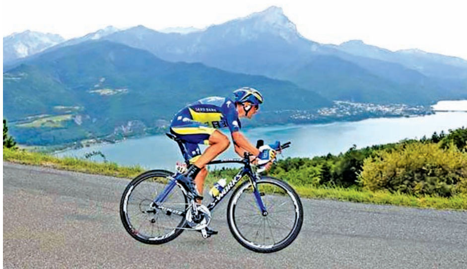
Team Saxo-Tinkoff rider Roman Kreuziger of the Czech Republic cycles during the 32km individual time-trial seventeenth stage of the centenary Tour de France cycling race from Embrun to Chorges on 17 July, 2013.

"At this stage, with the relevant appeal windows opened, the UCI will not make any further comment on the case," added the body, which has one month to appeal. The data in question is from a period when Kreuziger, fifth in last year's Tour, was riding for the Astana team.