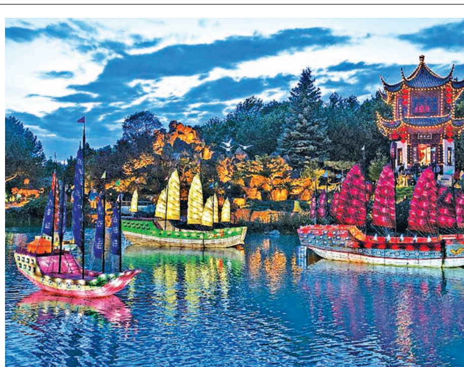
Lantern works are seen at the Botanical Gardens, Montreal, Canada, on 20 Sept, 2014.