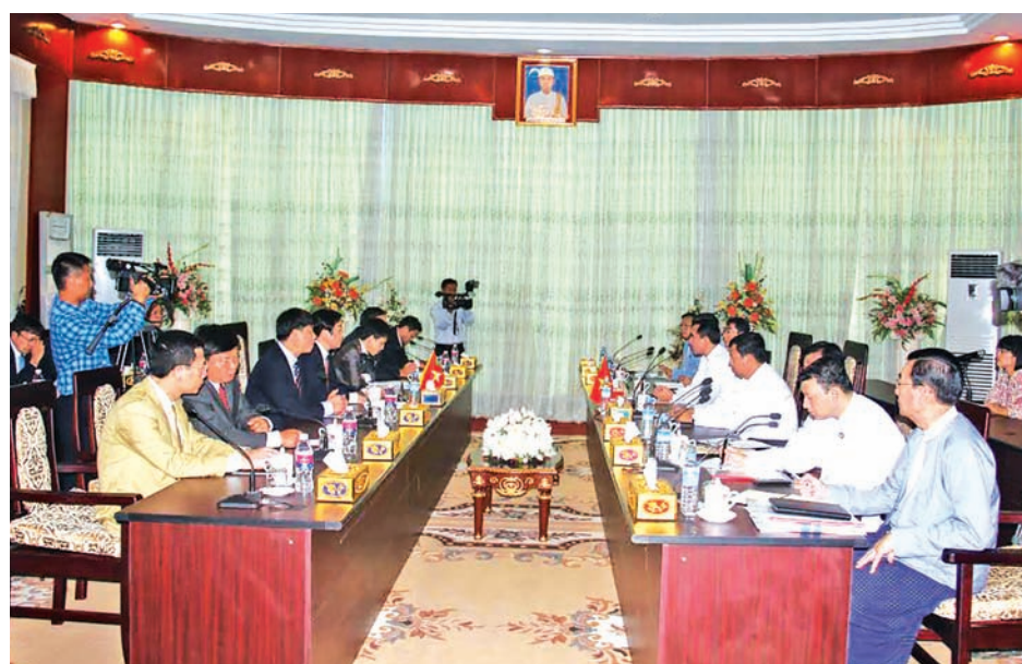
Union Ministers U Myat Hein and U Ye Htut hold talks with Vietnamese minister for Information and Communications Nguyen Bac Son to discuss cooperation in the information and telecommunication sector between Myanmar and Vietnam.

NAY PYI TAW, 22 Sept — Union Minister for Communications and Information Technology U Myat Hein and Union Minister for Information U Ye Htut received Vietnamese min-