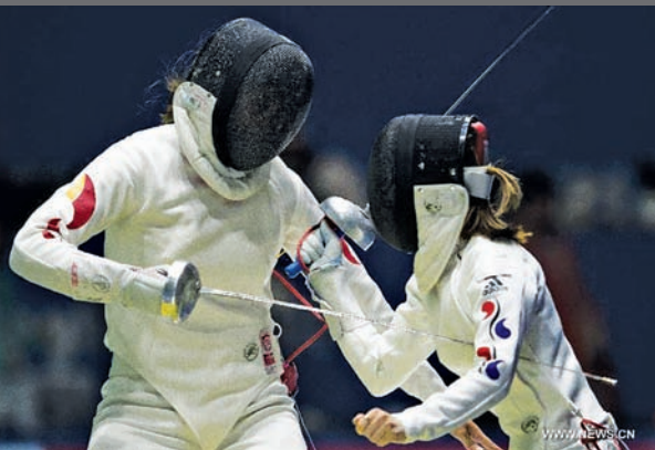
Shin Alam (R) of South Korea competes against Xu Anqi of China during the women's epee individual round of 16 match of fencing at the 17 th Asian Games in Incheon, South Korea, on 22 Sept, 2014. Shin Alam defeated Xu Anqi 15-13.