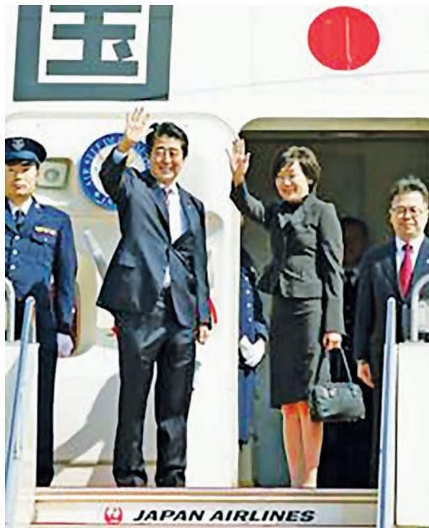
Japanese Prime Minister Shinzo Abe (2 nd from L) and his wife Akie (2 nd from R) wave as they leave Tokyo's Haneda airport on 22 Sept, 2014, for New York to attend UN General Assembly.

TOKYO, 22 Sept — Prime Minister Shinzo Abe left Japan on Monday for a series of UN General Assembly meetings and summit talks with his counterparts in New York, as Japan stepped up its diplomatic efforts to seek reform of the UN Security Council.