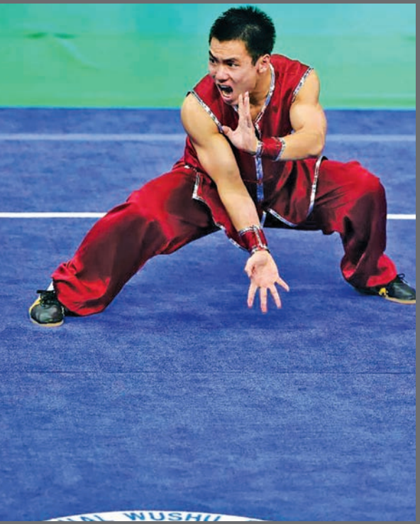
Wang Di of China performs during the nanquan competition of men's nanquan\ nangun all-round Wushu event at the 17 th Asian Games in Incheon, South Korea, on 22 Sept, 2014. Wang Di claimed the title with 19.55 points.