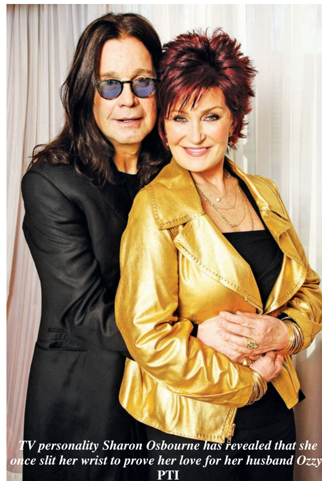
TV personality Sharon Osbourne has revealed that she once slit her wrist to prove her love for her husband Ozzy.

Sharon additionally said, “I’m like, ‘I’ll show you how much I love you, I’d die for you’... so I went to a room service table... and there was a steak knife. I got the knife and I’m like, ‘I love you so much’ and slash, slash, slash on my wrist’.”