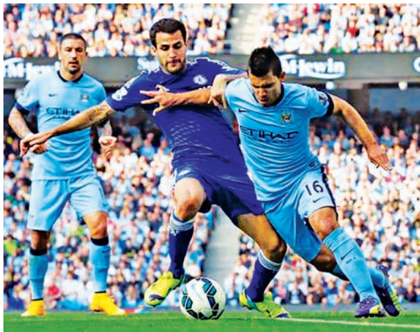
Chelsea's Cesc Fabregas (C) challenges Manchester City's Sergio Aguero during their English Premier League soccer match at the Etihad stadium in Manchester, northern England on 21 Sept, 2014.

"The Chelsea fans were singing my name and it was an emotional day. It's not how I expected to say goodbye to the Chelsea fans. I woke up this morning and didn't know what I wanted from today so I'm glad it's out of the way. I guess this is a happy medium."—Reuters