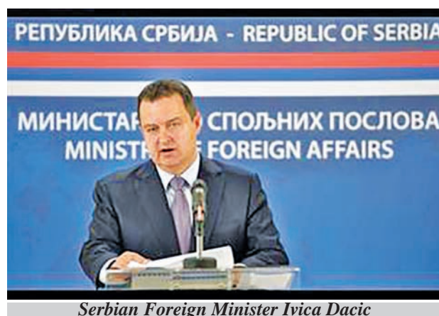
Serbian Foreign Minister Ivica Dacic

When the US ambassador asked why Russian President Vladimir Putin, rather than the president of some other former Soviet republic, should come to Belgrade on the anniversary of the city's liberation in World War II, Chepurin re-