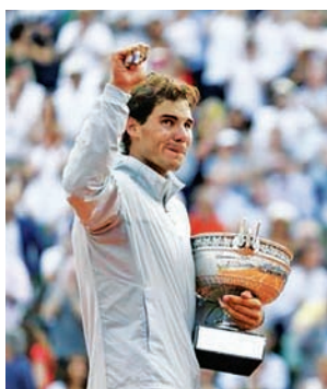
Rafael Nadal of Spain

NEW DELHI, 22 Sept—Fourteen times grand slam winner Rafa Nadal has dealt a big blow to organizers of this year's International Premier Tennis League (IPTL) by pulling out of the inaugural event citing health problems.