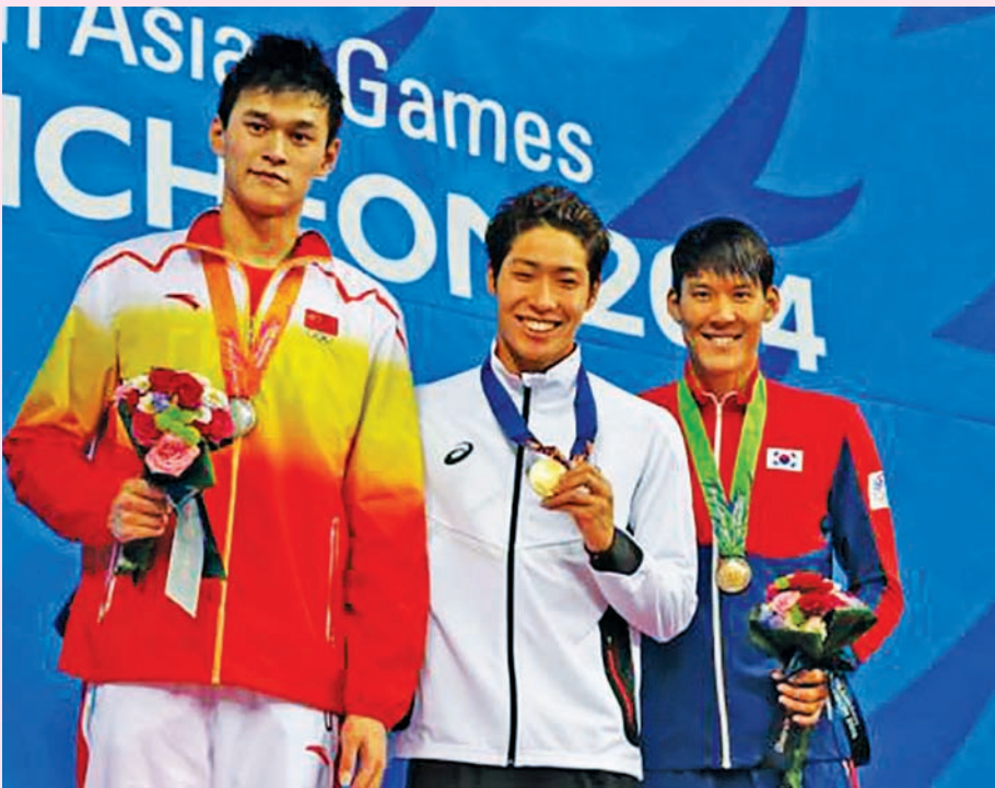
Gold medallist Kosuke Hagino (C) of Japan poses with silver medallist Sun Yang (L) of China and bronze medallist Park Tae-hwan of South Korea on the podium after the men's 200m freestyle final swimming competition at the Munhak Park Tae-hwan Aquatics Centre during the 17 th Asian Games in Incheon on 21 Sept, 2014.

INCHEON, 22 Sept—Japan's Kosuke Hagino gate-crashed the much-hyped showdown between Olympic champions Sun Yang and Park Tae-hwan to win the 200 metres freestyle gold at the Asian Games on Sunday, while four more weightlifting world records fell on the second day of competition in Incheon. A day after North Korean Om Yun Chol lifted more than three times his bodyweight to break the world clean and jerk record, compatriot and fellow Olympic champion Kim Un Guk