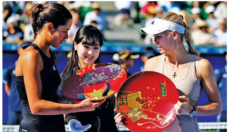
Ana Ivanovic (L) of Serbia and Caroline Wozniacki (R) of Denmark look at their trophies during an award ceremony after their Pan Pacific Open women's singles final tennis match in Tokyo on 21 Sept, 2014.