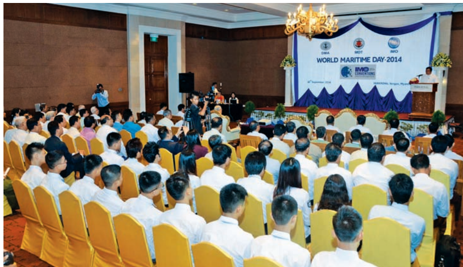
Union Minister for Transport U Nyan Tun Aung addresses ceremony to mark World Maritime Day-2014.