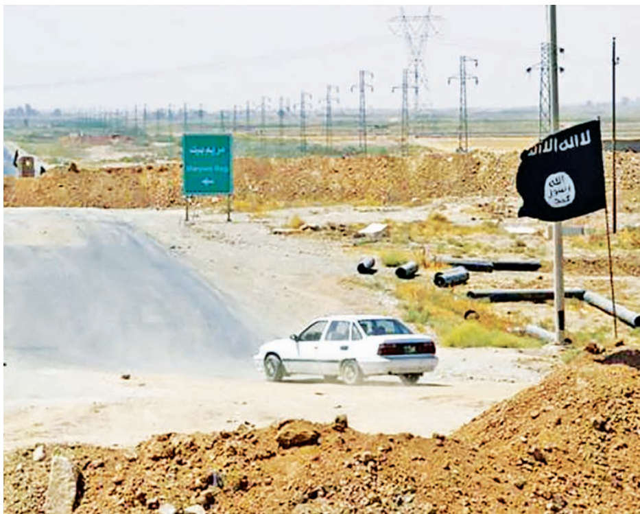
A car drives near a flag belonging to Islamic State militants at the end of a bridge in southern Kirkuk on 23 Aug, 2014.