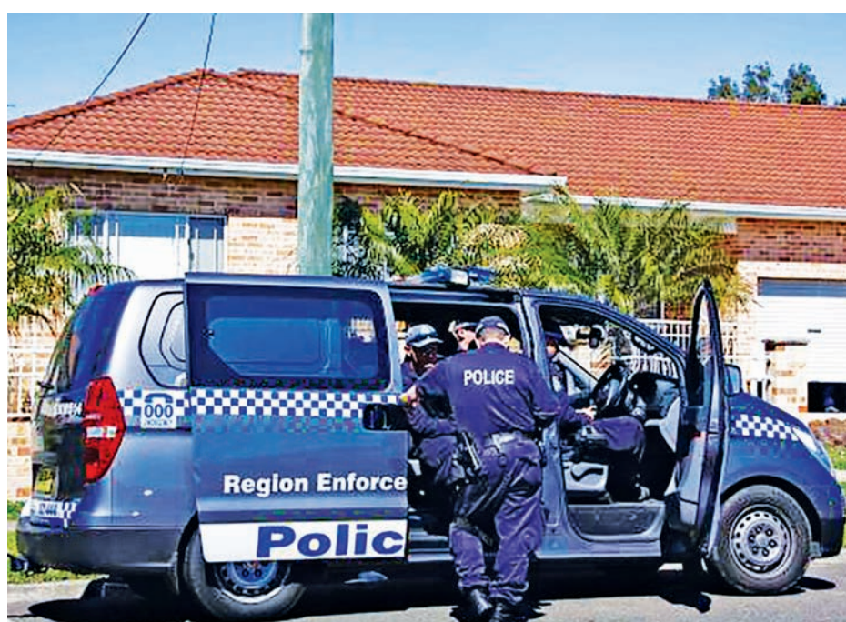
Police talk as they guard a house that was involved in pre-dawn raids in western Sydney on 18 Sept, 2014.

Abbott offered as an example of a "designated area" the city of Raqqa in northern Syria, where a photograph of a young boy holding the decapitated head of a slain Syrian soldier was reported to have been taken earlier this year. The boy was believed to be