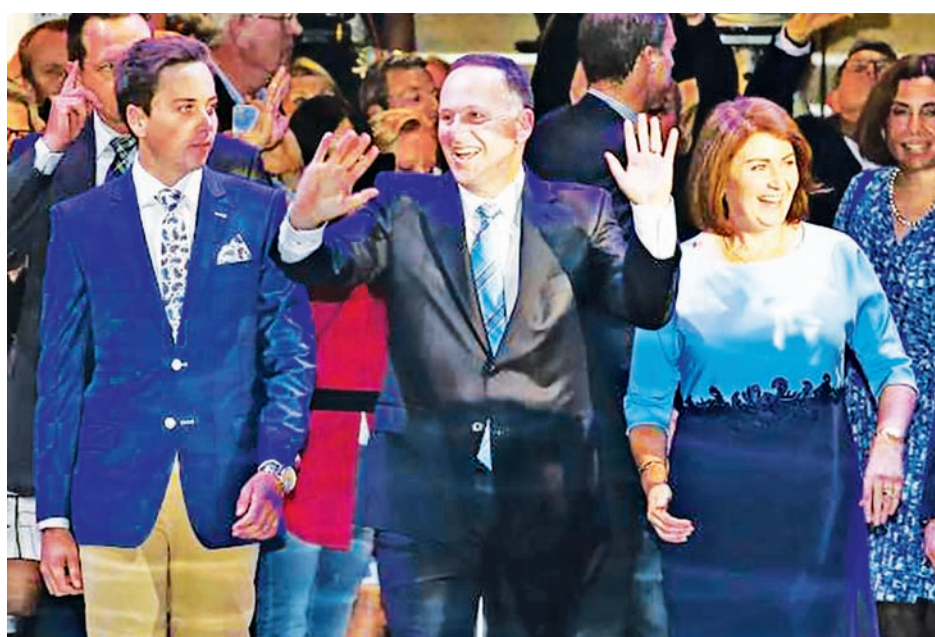
New Zealand's National Party leader and Prime Minister-elect John Key celebrates a landslide victory with his wife Bronagh (R) and son Max (L) at the National election party during New Zealand's general election in Auckland, on 20 Sept, 2014.

WELLINGTON, 22 Sept — New Zealand may vote next year on changing its flag, newly re-elected prime minister John Key said on Monday, as the country looks to assert an identity independent of colonial ties to Britain.