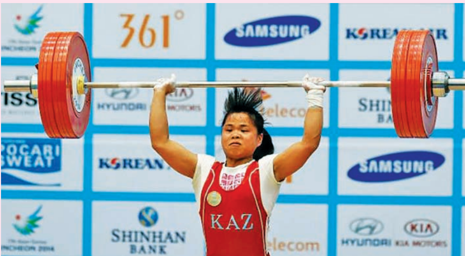
Kazakhstan's Zulfiya Chinshanlo attempts to break her own world record for the clean and jerk on her third attempt in the women's 53kg weightlifting competition at the Moonlight Garden Venue during the 17 th Asian Games in Incheon on 21 Sept, 2014.