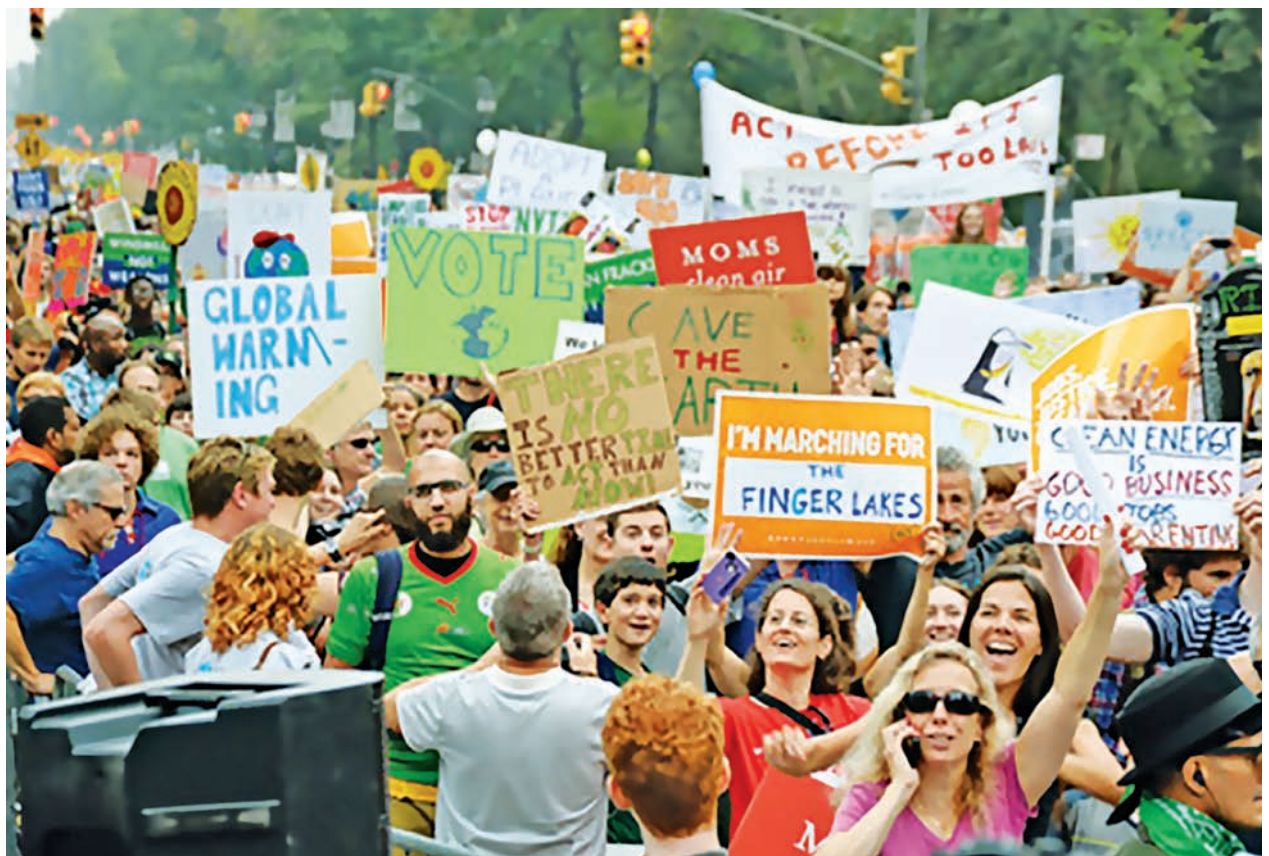
An estimated 400,000 people march in Manhattan, New York, on 21 Sept, 2014, calling for increased measures to curb global warming ahead of the UN climate summit to be held on the following day.