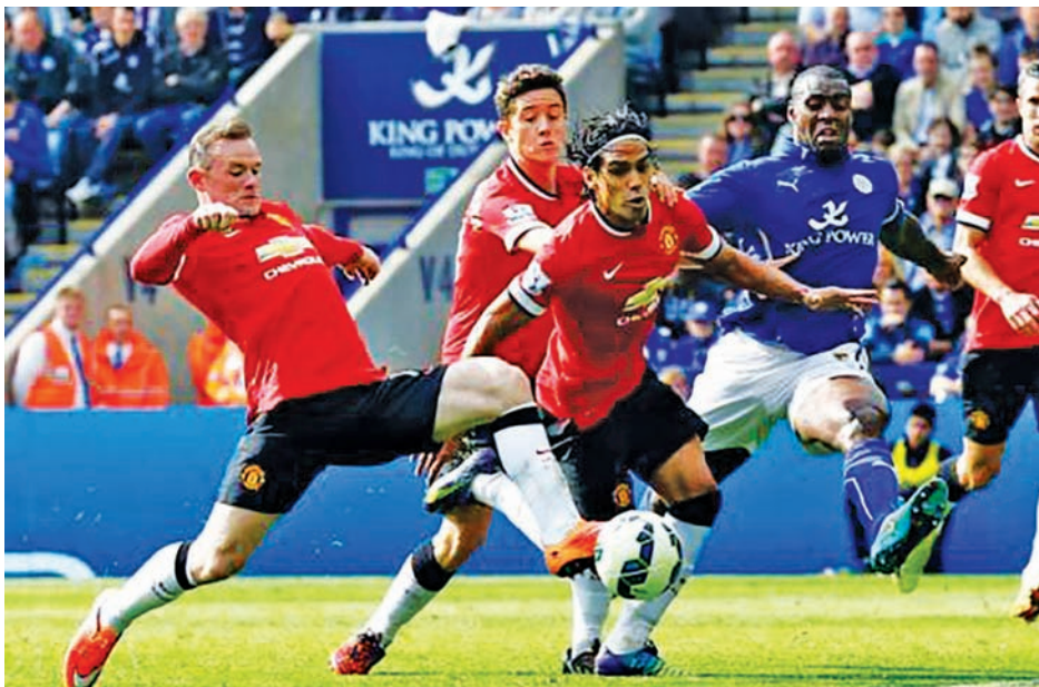
Manchester United's Wayne Rooney (L) and Radamel Falcao (C) challenge Leicester City's Wes Morgan during their English Premier League soccer match at the King Power stadium in Leicester, northern England on 21 Sept, 2014.