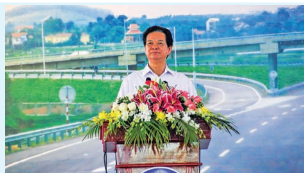
Vietnamese Prime Minister Nguyen Tan Dung delivers a speech during the launching of the expressway connecting Noi Bai in capital Hanoi and the northwestern Lao Cai Province, in Lao Cai Province, Vietnam on 21 Sept, 2014. Vietnam's longest expressway connecting Noi Bai and Lao Cai province, bordering China, with a total length of 245 kilometres, officially opened to traffic on Sunday.