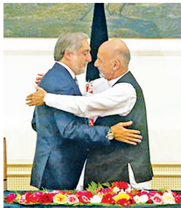
The rivals in Afghanistan's disputed presidential election — former Foreign Minister Abdullah Abdullah (L) and former Finance Minister Ashraf Ghani — hug each other after signing an agreement on the formation of a national unity government at the presidential palace in the capital Kabul on 21 Sept, 2014.