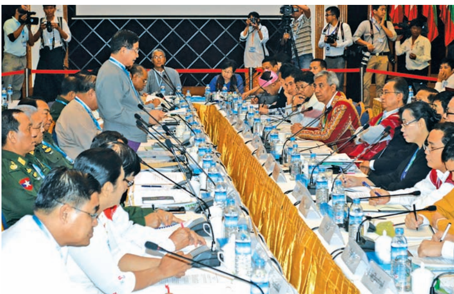
Participants to the sixth UPWC-NCCT meeting that will take for six days gather at Myanmar Peace Centre in Yangon on Monday to seek compromise on five points left to be discussed to finalize the single text for nationwide ceasefire agreement.