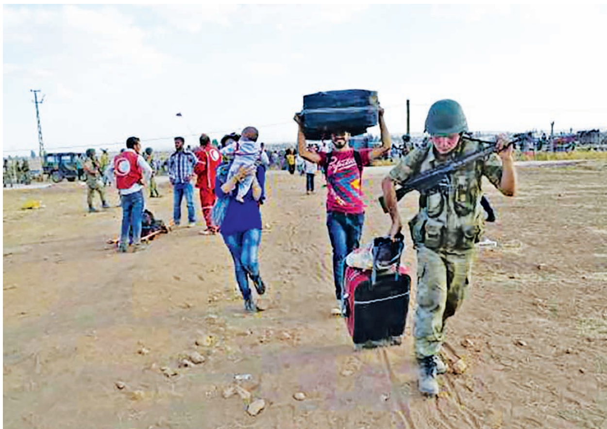
A Turkish soldier helps Syrian Kurds with their luggage after they crossed into Turkey, at the Turkish-Syrian border near the southeastern town of Suruc in Sanliurfa Province, on 20 Sept, 2014.

ISTANBUL, 22 Sept — More than 130,000 Syrian Kurds fleeing an advance by Islamic State militants