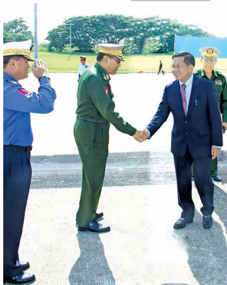
Senior General Min Aung Hlaing being seen off at Nay Pyi Taw Airport by senior military officers on his departure for Japan.