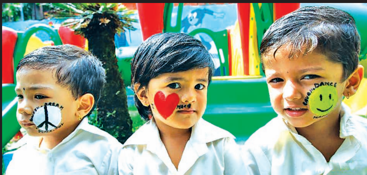
Local kids are seen in a rally organized with the theme of "End violence against women, commit to peace" to mark World Peace Day in Kathmandu, Nepal on 21 Sept, 2014. The World Peace Day was observed here on Sunday.

Osaka Mayor Toru Hashimoto, head of Japan Restoration Party, and lower house member Kenji Eda, chief of Yuinotoh, are co-heads of the new party, and its secretary general is Osaka Gov Ichiro Matsui.