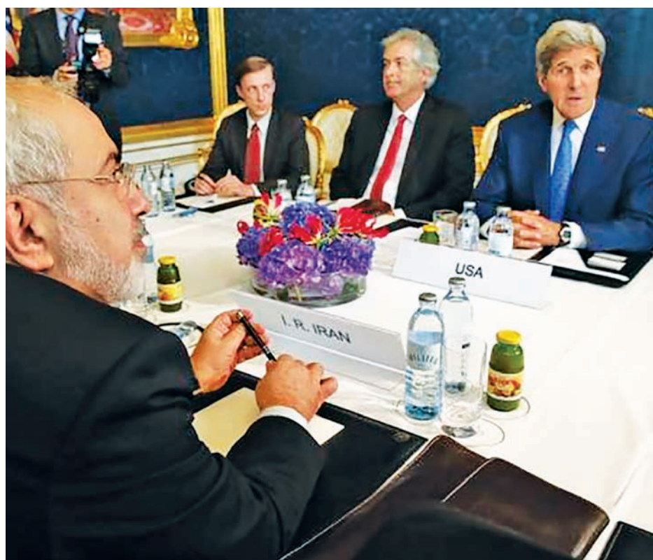
Iran's Foreign Minister Javad Zarif (L) holds a bilateral meeting with US Secretary of State John Kerry (R) on the second straight day of talks over Teheran's nuclear programme in Vienna, on 14 July, 2014.

"Both sides can show flexibility that will lead to an acceptable number for everyone," another Iranian official said.