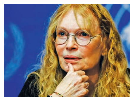
US actress Mia Farrow speaks during a news conference in Geneva in this 14 Nov, 2013 file photo.

"The performances of both actors deepen and evolve as their characters do," said the New York Times . But the newspaper reserved special praise for Farrow.