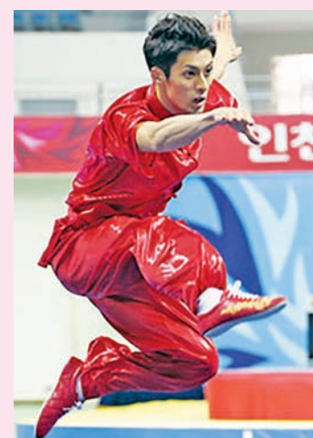
Photo taken on 20 Sept, 2014, in Incheon, South Korea, shows Daisuke Ichikizaki, who gave Japan its first medal of the Asian Games when he won the bronze in the Wushu men's changquan final.