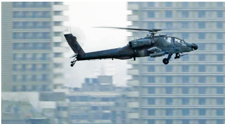
An Apache helicopter flies over Tahrir Square during a protest to support the army, in Cairo on 26 July, 2013.