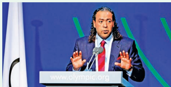
Sheikh Ahmad Al Fahad Al Sabah

INCHEON, 21 Sept—Oceania could join the Asian Olympic family in the not-too-distant future, Olympic Council of Asia President Sheikh Ahmad Al Fahad Al Sabah said on Sunday.