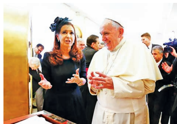
Pope Francis talks with Argentina's President Cristina Fernandez de Kirchner during a private audience at the Vatican on 20 Sept, 2014.