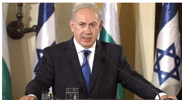
Prime Minister Benjamin Netanyahu

JERUSALEM, 21 Sept — An Israeli government spokesman says Prime Minister Benjamin Netanyahu has ordered the military to strike what he called “terror targets” in Gaza. This comes after three rockets landed in Israel, causing no damage or casualties.