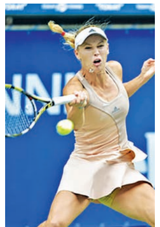
Denmark's Caroline Wozniacki