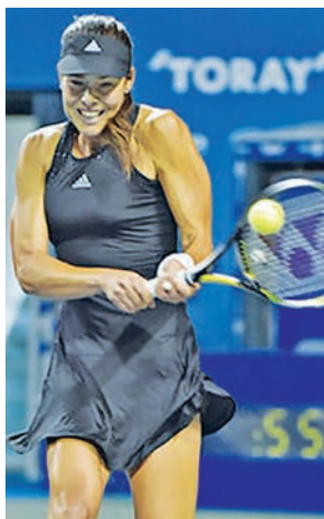
Serbian Ana Ivanovic

TOKYO, 21 Sept — Former world No. 1 Caroline Wozniacki defeated Spaniard Garbine Muguruza in three sets at the Pan Pacific Open in Tokyo on Saturday to reach her second straight final.