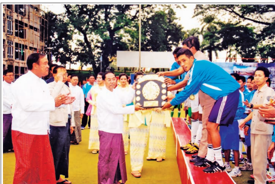
Chief Minister of Yangon Region U Myint Swe presents championship shield to Yangon Region team that emerged champion with a 4-1 win over Mandalay Region team in Yangon Region Chief Minister's Cup Inter-State/Region Hockey Tournament on 20 September.