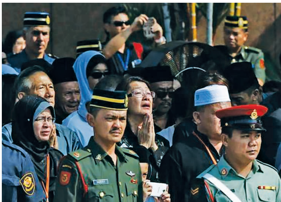
A relative (C) of a victim of the Malaysia Airlines flight MH17 disaster prays as the plane carrying victims' remains arrives for a repatriation ceremony at the Bunga Raya complex of KLIA airport in Sepang on 22 Aug, 2014.

BERLIN, 21 Sept — Survivors of German victims of Malaysian Airlines flight MH17 downed over Ukraine plan to sue the country and its president for manslaughter by negligence in 298 cases, the lawyer representing them said on Sunday.