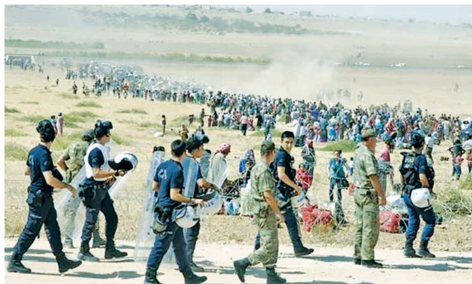
Turkish policemen and soldiers walk as Syrian Kurds wait behind the border fence to cross into Turkey near the southeastern town of Suruc in Sanliurfa Province on 19 Sept, 2014.

SURUC, (Turkey), 21 Sept — Turkey opened a stretch of the frontier on Friday after Kurdish civilians fled their homes, fearing an imminent attack on the border town of Ayn al-Arab, also known as Kobani. A Kurdish commander on the ground said Islamic State had advanced to within 15 km (9 miles) of the town. Local Kurds said they feared a massacre in Kobani, whose strategic location has been blocking the radical Sunni Muslim militants from consolidating their gains across northern Syria. The United States has said it is prepared to carry out airstrikes in Syria to stop the advances of Islamic State, which has also