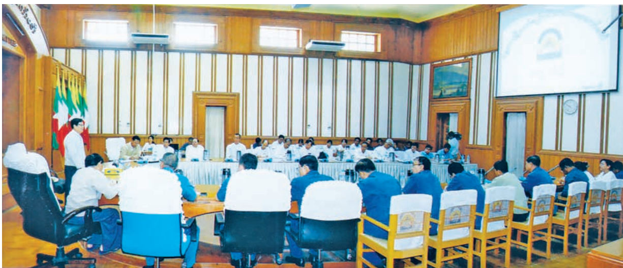
Union Minister at the President Office U Tin Naing Thein meets region ministers and departmental officials at Mandalay City Hall on 21 September to discuss development of Mandalay city and national housing planning. (News on page 1)—MNA