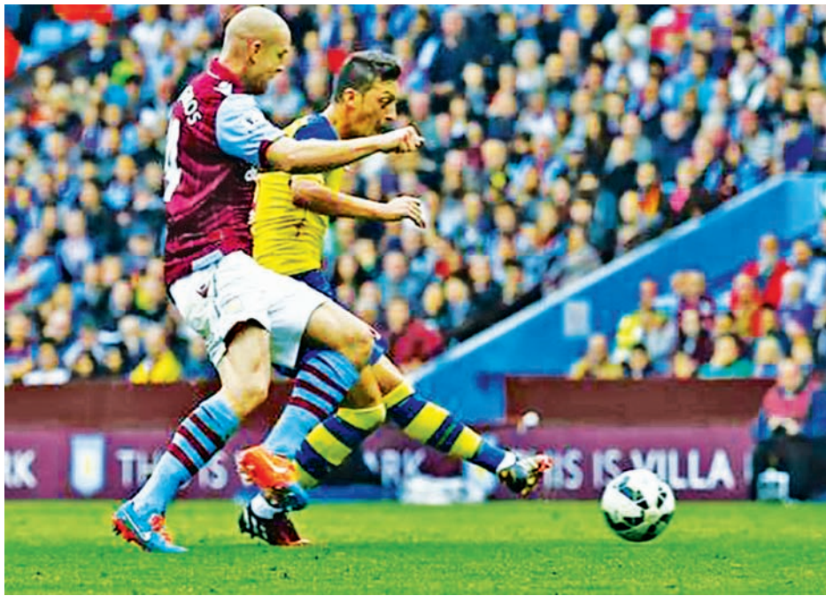
Arsenal's Mesut Ozil (R) scores a goal during their English Premier League soccer match against Aston Villa at Villa Park in Birmingham, central England on 20 Sept, 2014.

Southampton are a point ahead of Arsenal after a 1-0 win at Swansea City, who had Wilfried Bony sent