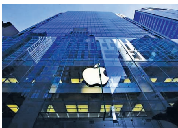
The Apple logo is lit on the first day of sale for the iPhone 6 and iPhone 6 Plus, in Sydney on 19 Sept, 2014.

The app has already given some people greater independence, users said on Thursday and Friday on social-media sites such as