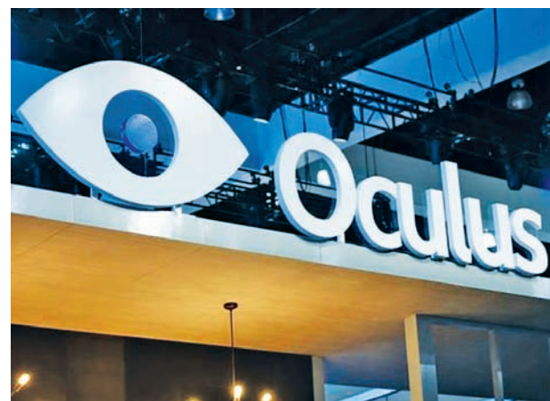
Oculus VR Inc signage is displayed at the company's booth at the 2014 Electronic Entertainment Expo (E3) in Los Angeles, California on 11 June, 2014.

Facebook, the world's largest social network, acquired two-year-old Oculus in July for $2 billion, making a bet that the untested technology will emerge as a new social and communications platform. The Oculus Rift goggles create a 360-degree view that immerses players in fantasy settings. Users mount the device on their heads with a strap. —Reuters