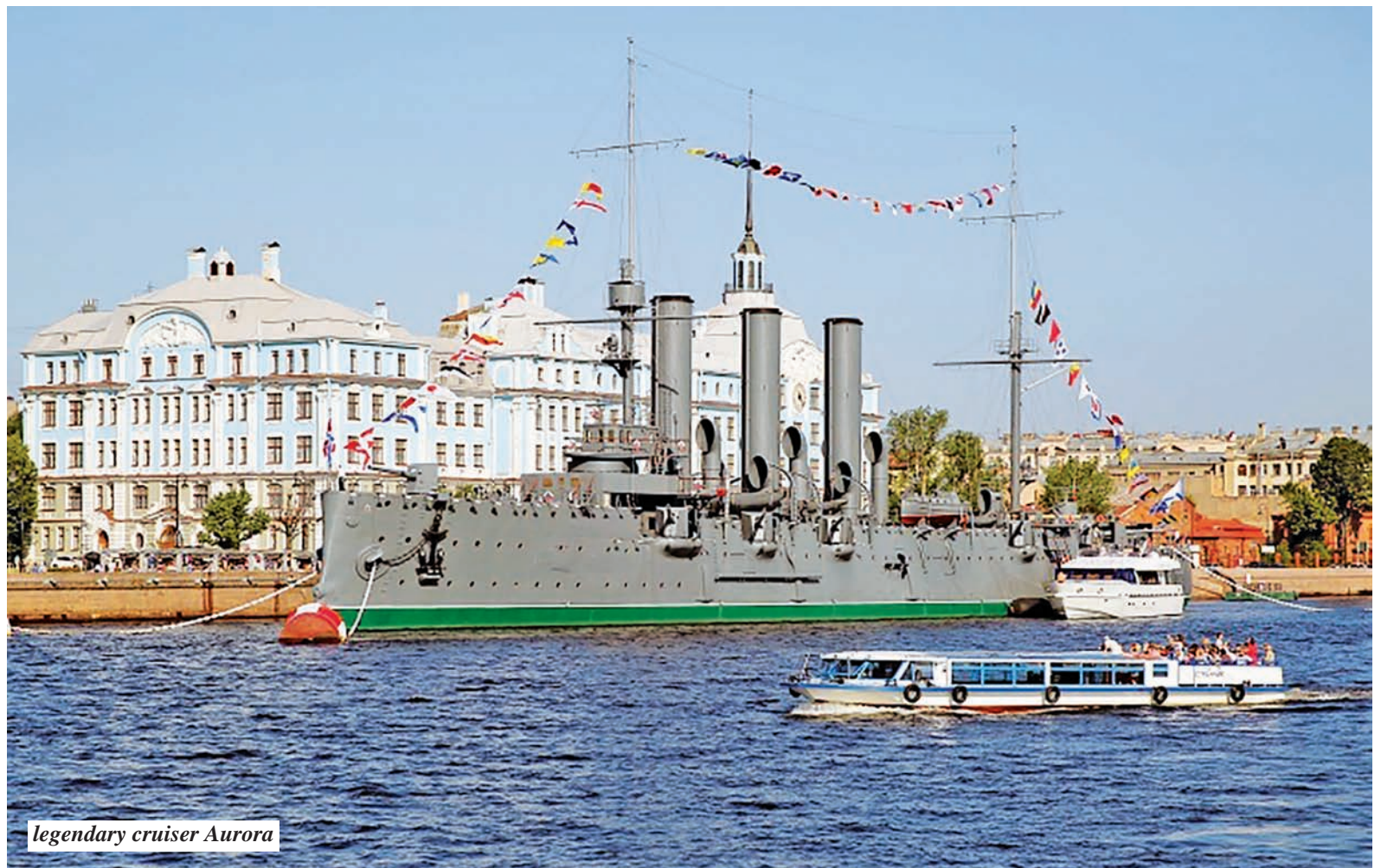
legendary cruiser Aurora

Bascule bridges will be raised across the Neva River starting from 9.45 am Moscow time (5.45 am GMT) and towing will start exactly at 10 am Moscow time (6 am GMT) on Sunday. Defence Ministry hopes that the cruiser will return to its 'eternal mooring' berth at the Petrograd embankment after the overhaul in 2016. Deadlines for repair will be announced after the ship is docked and the underwater part of its