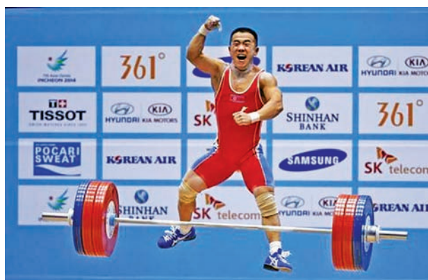
North Korea's Om Yun Chol reacts after successfully lifting his second attempt in the men's 56kg clean and jerk weightlifting competition at the Moonlight Festival Garden during the 17 th Asian Games in Incheon on 20 Sept, 2014.

On Saturday, he added the Asian Games title, with a world record to boot, lifting 170kg in the clean and