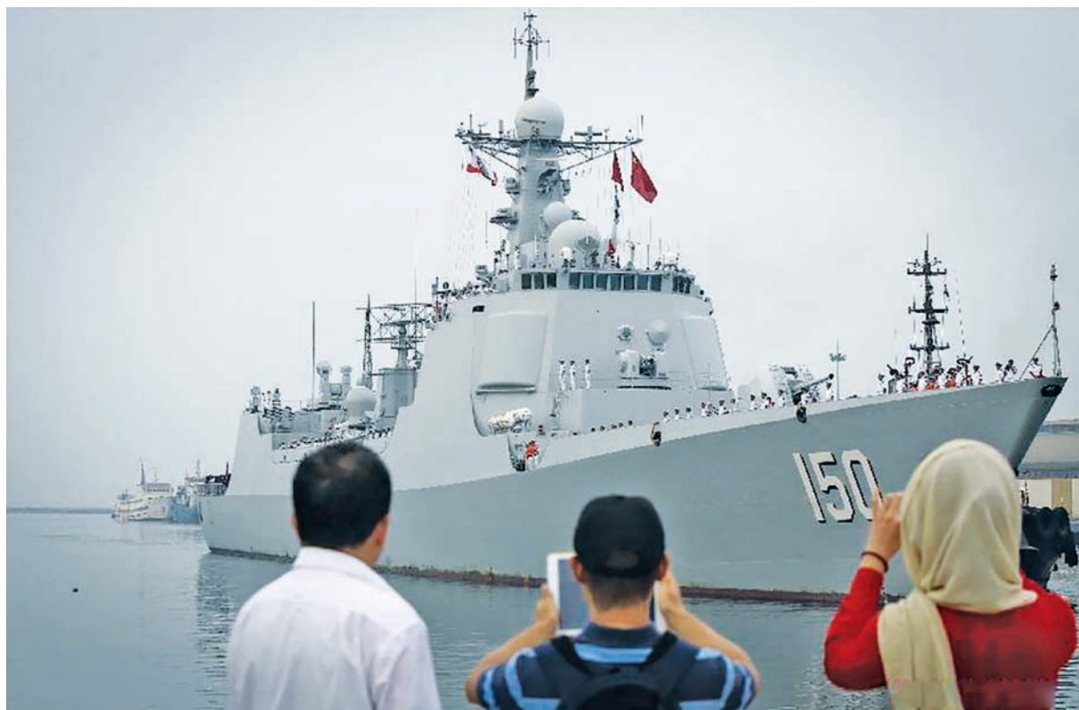
People take pictures of Changchun destroyer from the 17 th Chinese escort naval fleet in southern port of Bandar Abbas, Iran, on 20 Sept, 2014. The 17 th Chinese escort naval fleet docked in south Iran's Bandar Abbas port on Saturday for a five-day visit.