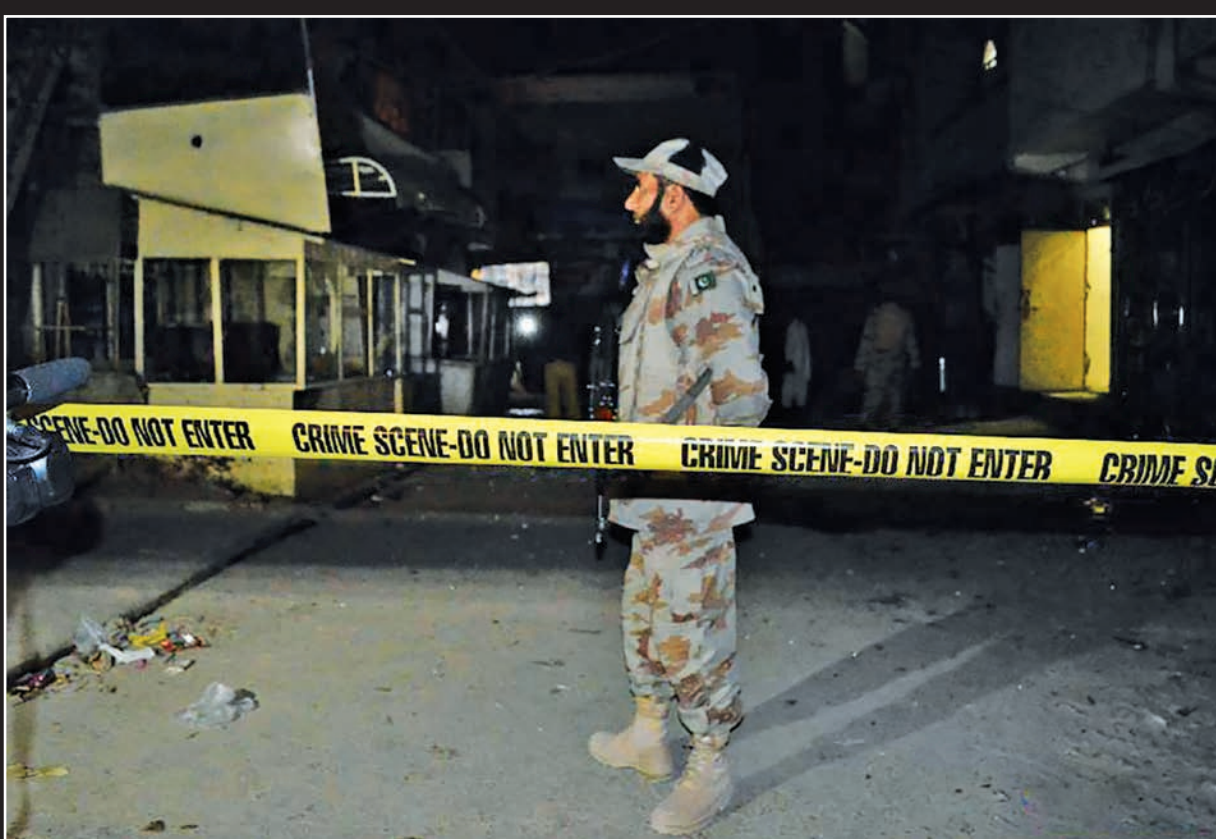
A soldier stands guard at the blast site in southwest Pakistan's Quetta on 21 Sept, 2014. At least 11 people were injured in the blast near a hotel in Quetta on late Saturday night, local media reported.—XINHUA

However, some people on board suffered minor burn injuries, said the report.— Xinhua