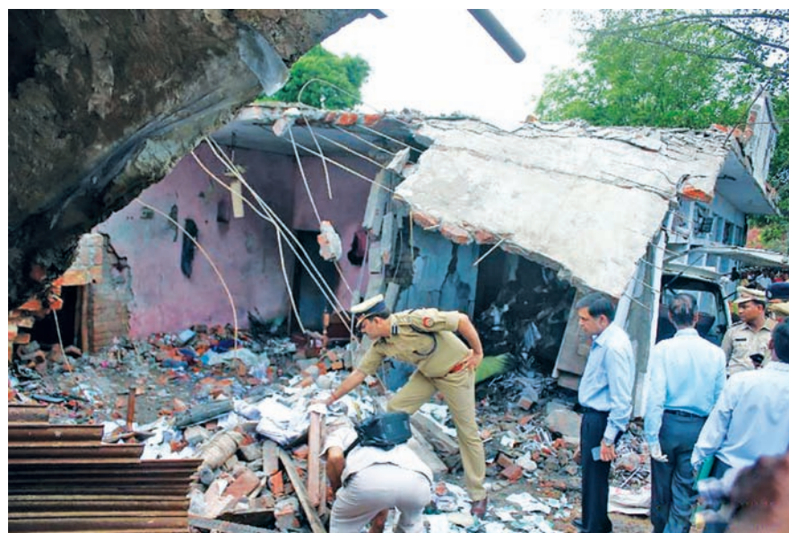
Police personnel inspect the heavily damaged cracker factory in Mohanlalganj in Uttar Pradesh, India, 20 Sept, 2014. At least six people were killed and 14 others injured in a major explosion at an illegal cracker factory at Mohanlalganj in Lucknow, capital of the northern Indian state of Uttar Pradesh on Saturday, a senior police officer said.

STATE OF THE SEA: Seas will be moderate in Myanmar waters.