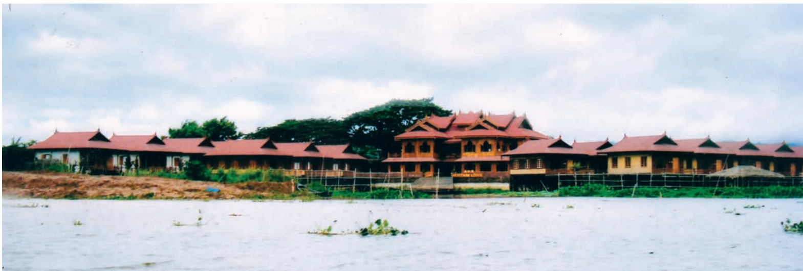
Hotels at the bank of Inlay Lake attract globetrotters for enjoying scanic beauty of the lake and activities of national races.

Visitors to Nyaungshwe and Inlay region will be able to enjoy magnificent views of Inlay Lake surrounded by new hotels, officials said. —NLM 018