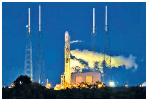
The unmanned Space Exploration Technologies' Falcon 9 rocket is seen before liftoff at Cape Canaveral, Florida in this on 28 Nov, 2013 file photo.