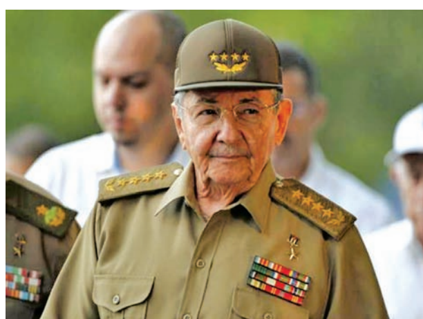
Cuba’s president Raul Castro arrives for an event marking the 1953 assault on the Moncada military barracks, in Artemisa Province, near Havana on 26 July, 2014.

“So we should not undermine commitments previously made, but should instead encourage — and this is certainly our effort — the democratic changes necessary for Cuba to meet the basic qualifications,”