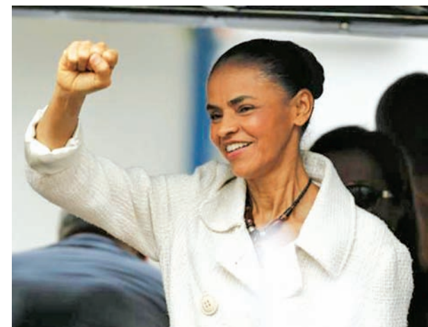
Presidential candidate Marina Silva of the Brazilian Socialist Party (PSB) gestures as she attends a campaign rally in Sao Bernardo do Campo near Sao Paulo on 19 Sept, 2014.

BRASILIA/ SAO PAULO, 20 Sept — Brazil’s financial markets have rallied on the prospect of environmentalist Marina Silva unseating President Dilma Rousseff in next month’s election, but political donations show plenty of companies may be wary of a new administration.