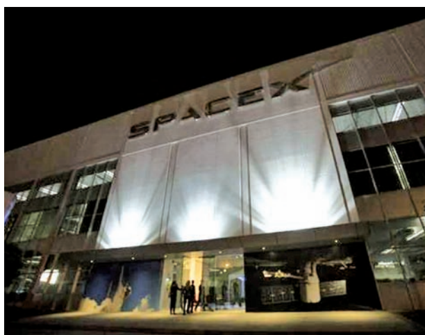
An exterior of the SpaceX headquarters in Hawthorne, California on 29 May, 2014.

United Launch Alliance, a partnership of Boeing and Lockheed Martin, manufactures and sells Atlas 5, which predominantly are used for