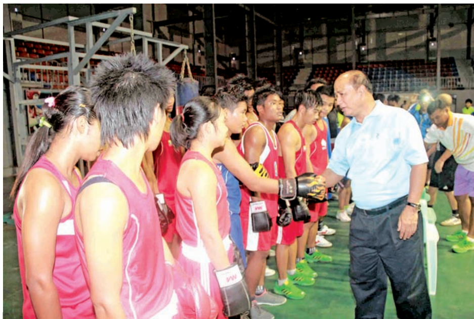
Deputy Minister for Sports U Zaw Win encourages athletes who are going to take part in 28 th SEA Games.—MNA

Before the meeting with sportspersons, the deputy minister inspected the preparations of footballers, archers, boxers and other athletes.—MNA