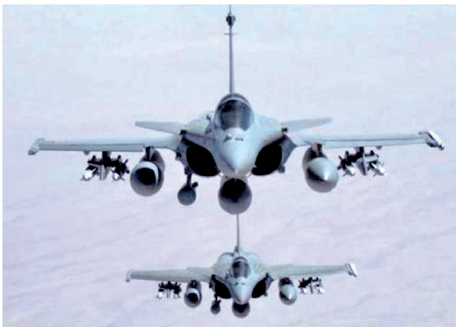
Two French Rafale fighter jets fly in formation during a mission from Al-Dhafra airbase on 18 Sept, 2014 in this handout image provided by ECPAD.— REUTERS

The French military action, which follows US air strikes in northern Iraq and near the capital Baghdad, appeared to win qualified endorsement from Iraq's