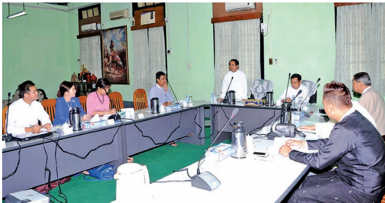
Union Minister for Cooperative U Kyaw Hsan elaborates on sustainable development of libraries.