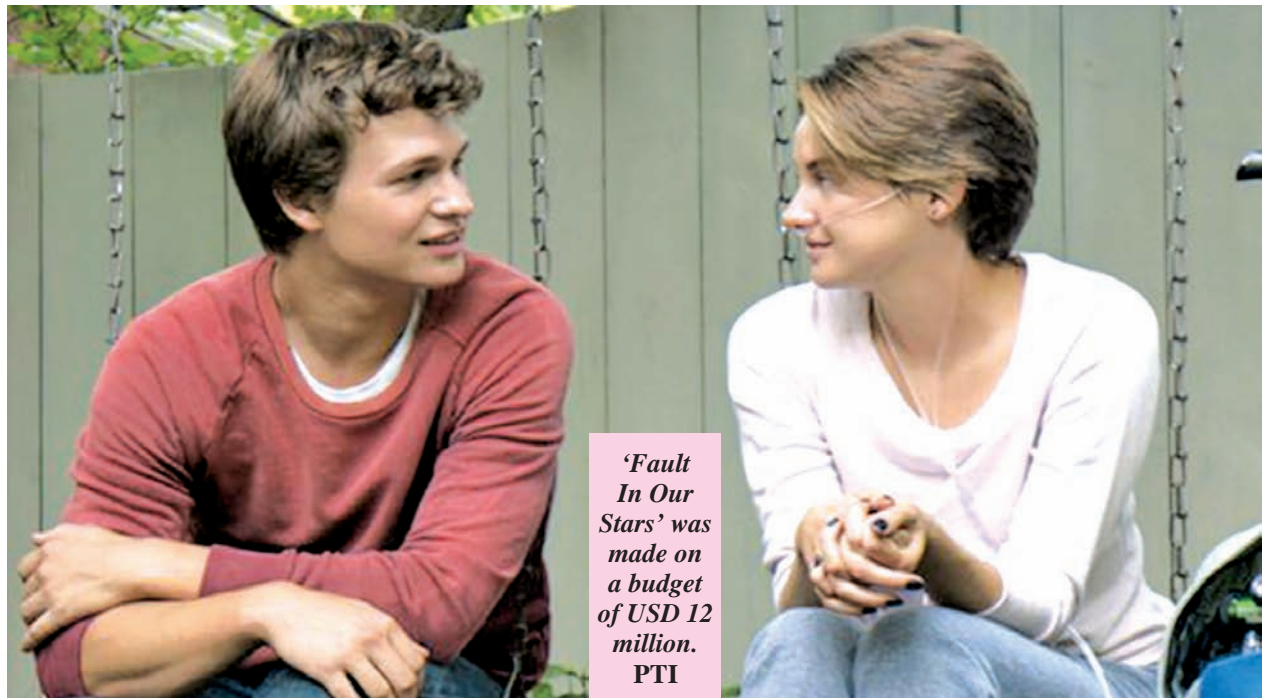
'Fault In Our Stars' was made on a budget of USD 12 million.