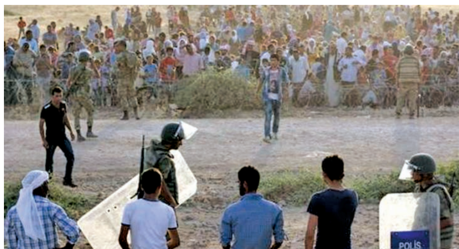
Turkish security forces stand guard as Syrians wait behind the border fences near the southeastern town of Suruc in Sanliurfa Province on 18 Sept, 2014.— REUTERS

The violence is also a headache for neighbouring Turkey, which is already sheltering more than 1.3 million Syrian refugees and fears hundreds of thousands more, waiting in the mountains on the Syrian side of the 900-km (560-mile) border, could seek to cross as fighting escalates.—Reuters