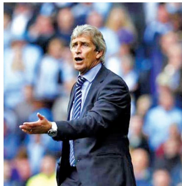
Manchester City manager Manuel Pellegrini reacts during their English Premier League soccer match against Stoke City at the Etihad stadium in Manchester, northern England on 30 Aug, 2014.

"It is very important to win on Sunday, but there is a long way until the end of the season," he said. "This is just the fifth game and