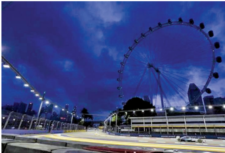
Mercedes Formula One driver Lewis Hamilton of Britain drives past the Singapore Flyer observation wheel during the first practice session of Singapore F1 Grand Prix on the Marina Bay street circuit in Singapore on 19 Sept, 2014.

Vettel, who has dominated this race for the last three years, had his track time compromised after an engine failure at the end of first free practice restricted the German to just eight minutes of action at the end of the second