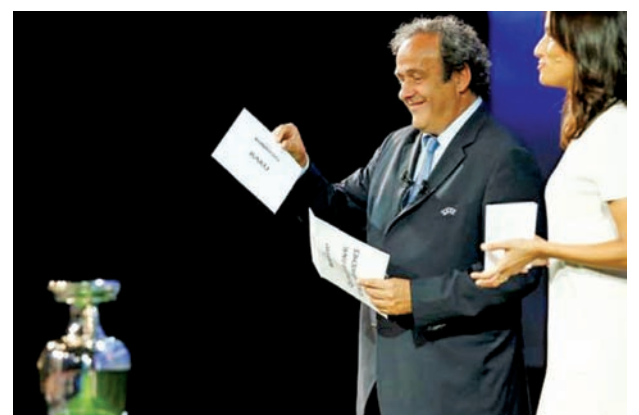
UEFA President Michel Platini shows the name of Baku, one of the 13 cities which will host matches at the Euro 2020 tournament to be played across the continent, next to former Miss Switzerland Melanie Winiger during a ceremony in Geneva on 19 Sept, 2014.