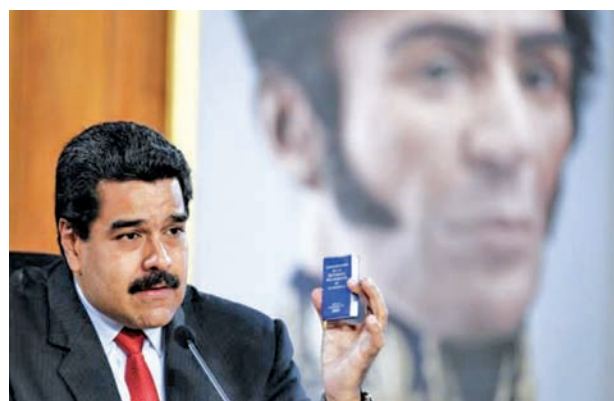
Venezuela's President Nicolas Maduro holds a copy of the country's constitution in front of a painting of South American revolutionary hero Simon Bolivar, as he talks during a news conference at Miraflores Palace in Caracas in this on 2 Sept, 2014 handout picture.

But things are different this year. Venezuela is unopposed in its regional group and is set to join