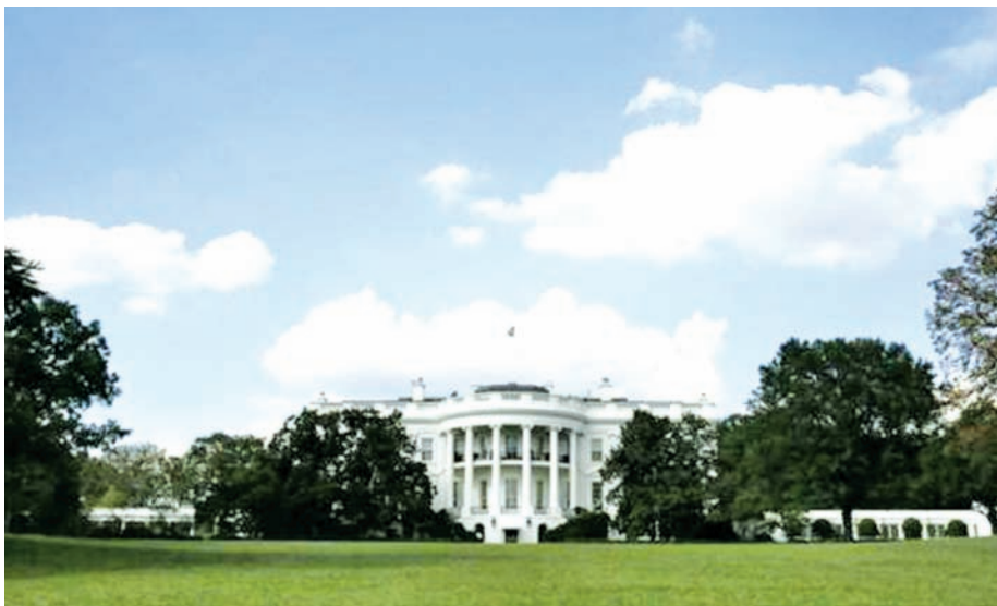
The White House is pictured from the South Lawn in Washington, on 18 Sept, 2014.

to get so far on the grounds before being apprehended is very unusual for a complex that is heavily guarded