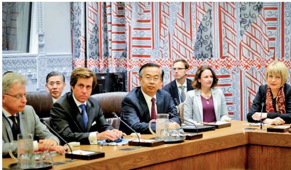
Wang Min (C), head of the Chinese delegation, takes part in discussions with other officials from Iran, the P5+1 — (Britain, China, France, Russia, the United States plus Germany) and the European Union before starting their negotiation over Iran's nuclear programme, at the UN headquarters in New York, on 19 Sept, 2014.

UNITED NATIONS, 20 Sept — Iran and six other major countries started a new round of talks towards a comprehensive agreement on its nuclear programme at the United Nations headquarters in New York on