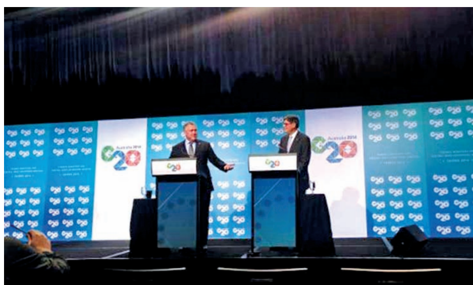
US Treasury Secretary Jack Lew (R) stands with his Australian counterpart Joe Hockey during a media conference at the start of the G20 Finance Ministers and Central Bank Governors meeting in the northern Australian city of Cairns on 12 Sept, 2014.

destiny of the global economy," said Hockey, who back in February launched a campaign to add 2 percentage points to world growth by 2018 as part of Australia's presidency of the G20.