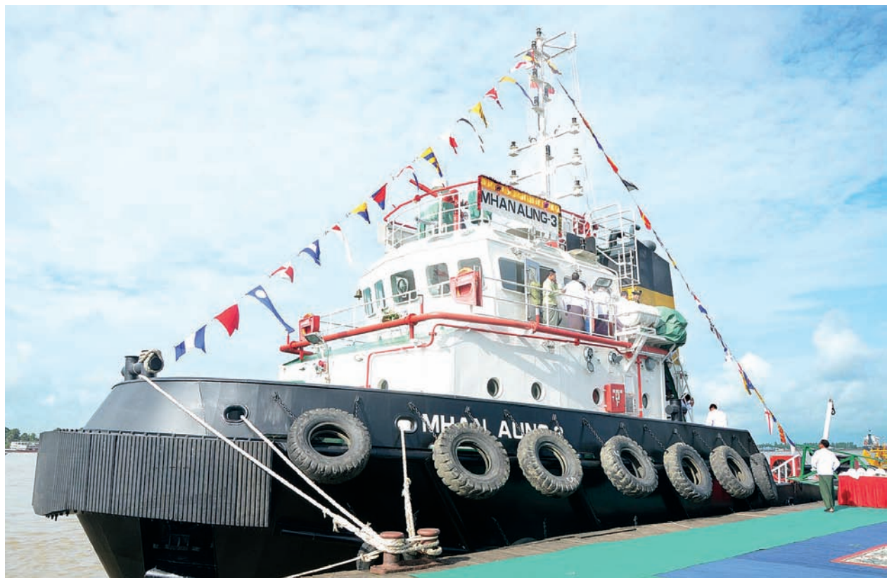
A vessel is handed over to Myanmar Port Authority with a view to accelerating its services at ports as maritime trade is booming.

YANGON, 20 Sept—The Myanmar Port Authority has been strengthened with a tugboat and two garbage boats to accelerate its services, sources said.