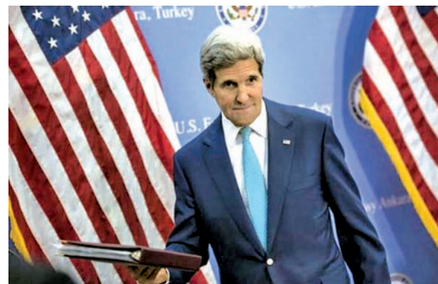
US Secretary of State John Kerry leaves after a news conference in Ankara on 12 Sept, 2014.

US President Barack Obama has said 40 nations have pledged help to a coalition against Islamic State. French jets struck a suspected Islamic State target