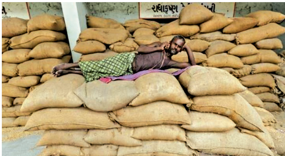
A labourer speaks on a mobile phone while lying on sacks filled with rice at the Agricultural Produce Market Committee (APMC) market yard, on the outskirts of Ahmedabad on 29 July, 2014.

NEW DELHI, 20 Sept — India, the world’s top rice exporter, is preparing to import the grain for the first time in nearly a quarter of a century to feed its remote and hilly northeastern region where rail freight is being disrupted due to a track overhaul.