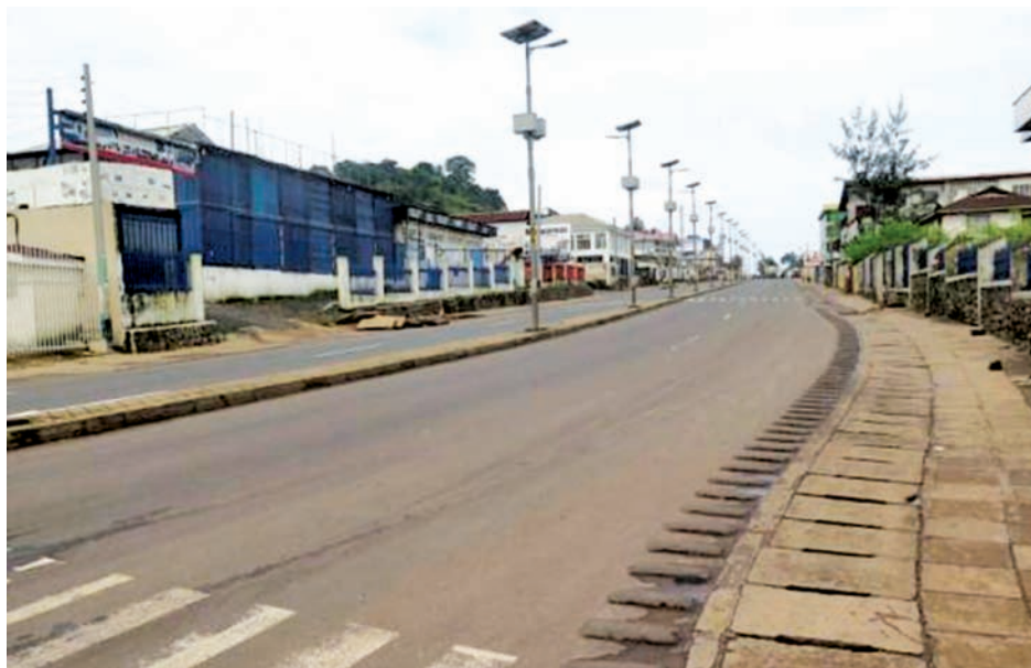
An empty street is seen at the start of a three-day national lockdown in Freetown on 19 Sept, 2014.

FREETOWN, 20 Sept — Streets in the capital of Sierra Leone were deserted on Friday as the West African state began a contested, three-day lockdown in a bid to halt the worst Ebola outbreak on record.