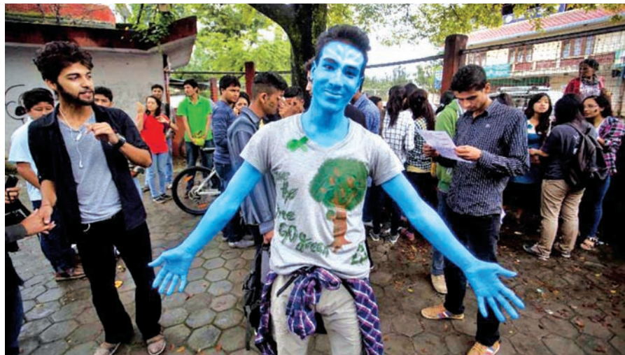
A nepalese youth painted in blue participates in the people's climate march in Kathmandu, Nepal on 20 Sept, 2014. The rally was organized to raise voice for the environment protection.

FORECAST VALID UNTIL EVENING OF THE 21 st September, 2014: Rain or thundershowers will be scattered in Taninthayi Region, fairly widespread in Mandalay, Magway, Bago, Yangon and Ayeyawady Regions, Kayah, Kayin and Mon States and widespread in the remaining Regions and States with likelihood of isolated heavy falls in Sagaing Region, Kachin and Rakhine States. Degree of certainty is (100%).