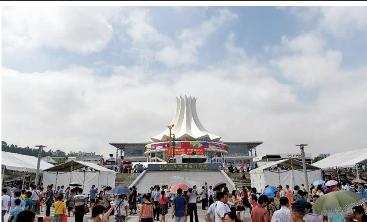
Photo taken on 19 Sept, 2014 shows the Nanning International Convention and Exhibition Centre where the 11 th China-ASEAN Expo (CAEXPO) took place in Nanning, capital of south China’s Guangxi Zhuang Autonomous Region. The four-day expo concluded on Friday.

“China hopes that all factions in Iraq will continue to give top priority to the interests of the nation and people and the stability of the country, advance political dialogue and reconciliation, and strengthen military and security capacity building, so as to lay a solid domestic groundwork for the political process,” Liu said.— Xinhua