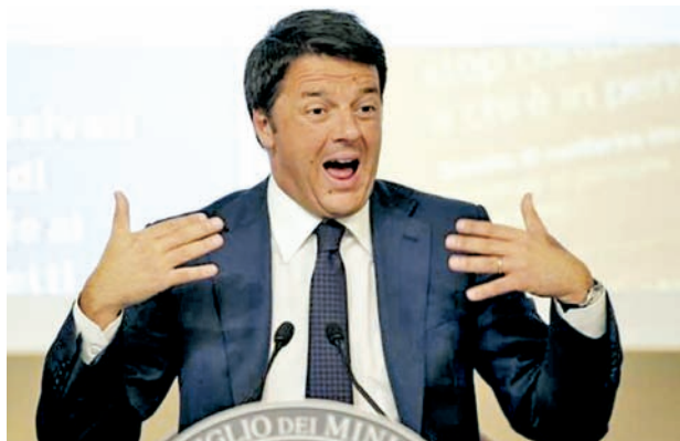
Italy's Prime Minister Matteo Renzi gestures during a news conference at Chigi palace in Rome on 1 Sept, 2014.

On Friday, Renzi hit back, saying in a video posted on Youtube that the unions cared little about the jobless and carried much