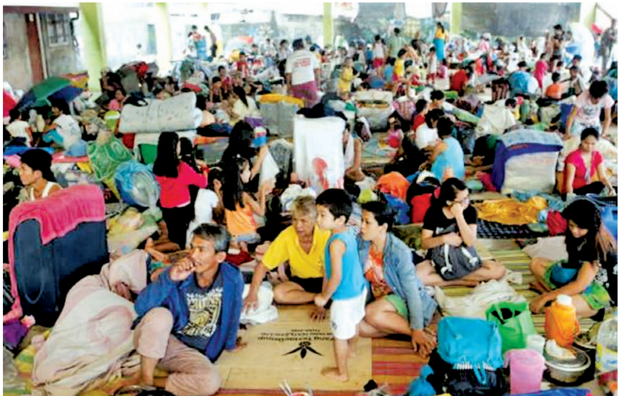
Residents take shelter at an evacuation centre for flood victims a day after tropical storm Fung-Wong inundated the Philippine capital Manila on 20 Sept, 2014.

Trading on the city’s stock exchange and local