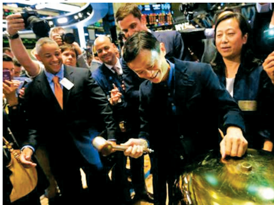
Alibaba Group Holding Ltd founder Jack Ma (C) rings a ceremonial bell to start trading during his company's initial public offering (IPO) under the ticker 'BABA' at the New York Stock Exchange in New York on 19 Sept, 2014.

Alibaba, founded by Ma in 1999, has grown into one of the largest e-commerce behemoths in the world and now controls 80 percent of all online retail sales in China. It started its global roadshow on 8 September in New York and received enough bookings for the offering within five days thanks to massive interest from worldwide investors.