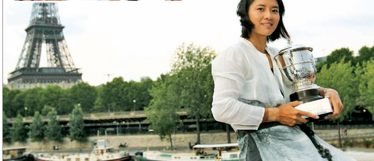
China's tennis player Li Na poses with trophy near the Eiffel Tower after winning the 2011 France Open tennis tournament on 4 June, 2011. China's first and only Grand Slam winner Li Na formally announced her retirement on 19 Sept, 2014, leaving the Chinese tennis yearning for the next superstar.

BEIJING, 19 Sept—China's Li Na, Asia's only grand slam singles champion, announced her retirement from tennis on Friday, citing the effect of long-term injuries, especially her knees.