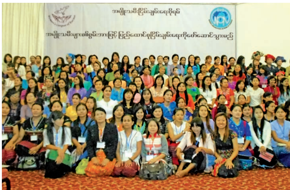
Delegates from local and foreign-based women's organizations pose for documentary photo at women's forum in Yangon.

The organizations are planning to accelerate field trips to grassroots people in regions and states to disseminate research knowledge about violence against women, according to organizers.—NLM