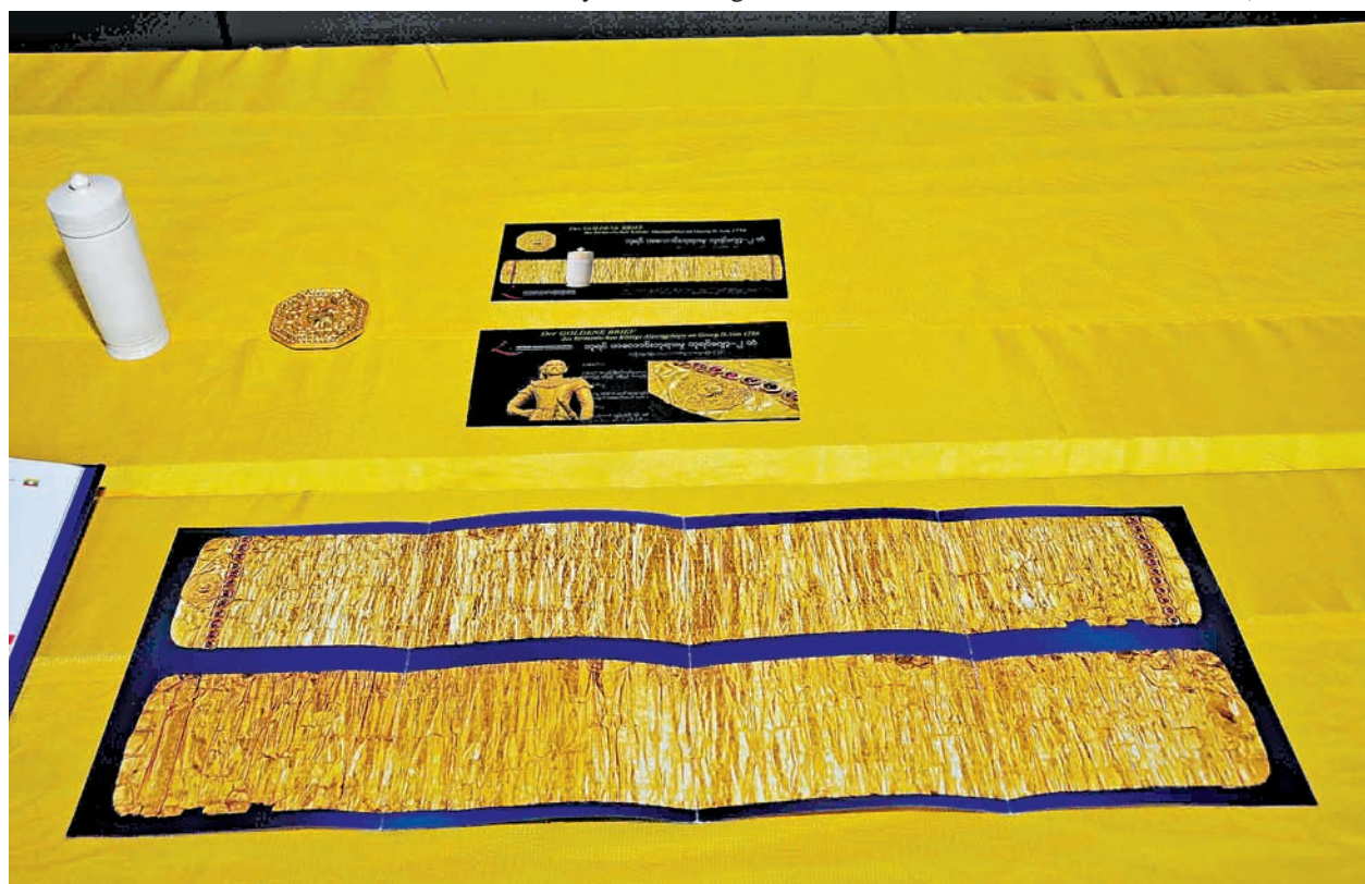
The gold letter sent by King Alaungphaya of Myanmar to King George II of Great Britain in 1756.

German foreign minister. During the official visit, the Myanmar delegation was offered an opportunity to observe the Gold Letter of King Alaungphaya, which is on display at the library of Gottfried Wilhelm in Hannover. It was on that visit that Germany promised Myanmar