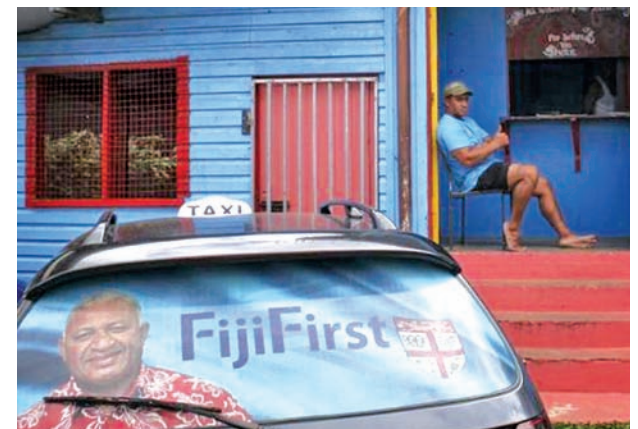
An election poster for Voreqe "Frank" Bainimarama can be seen in the rear window of a taxi as a man gestures from the doorway of a local gymnasium in the Fiji capital of Suva on 26 Aug, 2014.

SYDNEY, 19 Sept — Fiji's strongman ruler looked set on Friday to sail to victory in the South Pacific island nation's first elections after eight years of military rule, a contest praised by regional leaders and observers, but clouded by opposition accusations of fraud.