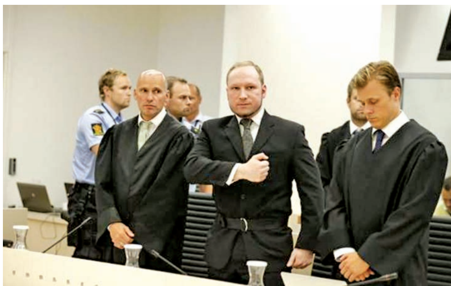
Norwegian mass killer Anders Behring Breivik gestures as he leaves the courtroom after the Oslo Court delivered the verdict of his trial in Oslo Courthouse on 24 Aug, 2012.

Breivik detonated a bomb in central Oslo on 22 July, 2011, killing eight, then took a boat to an island where the ruling