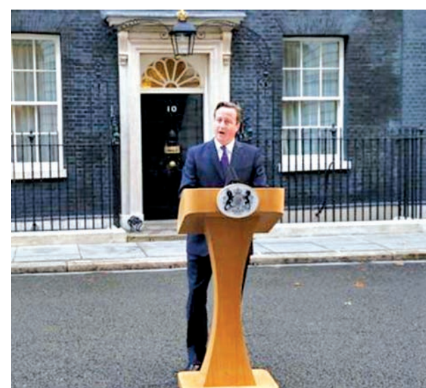
Britain's Prime Minister David Cameron speaks in front of 10 Downing Street, in central London on 19 Sept, 2014.

"The people of Scotland have spoken. It is a clear result. They have kept our country of four nations together. Like millions of other people, I am delighted," said Cameron in a statement released by the Downing Office. "As I said during the campaign, it would have broken my heart to see our United Kingdom come to an end," he added. He added that there was now a chance to change the Britain "for the better."—Xinhua