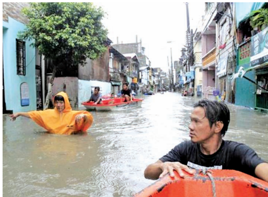
Residents wade through a flooded street during Tropical storm Fung-Wong in Pasay city, metro Manila on 19 Sept, 2014.