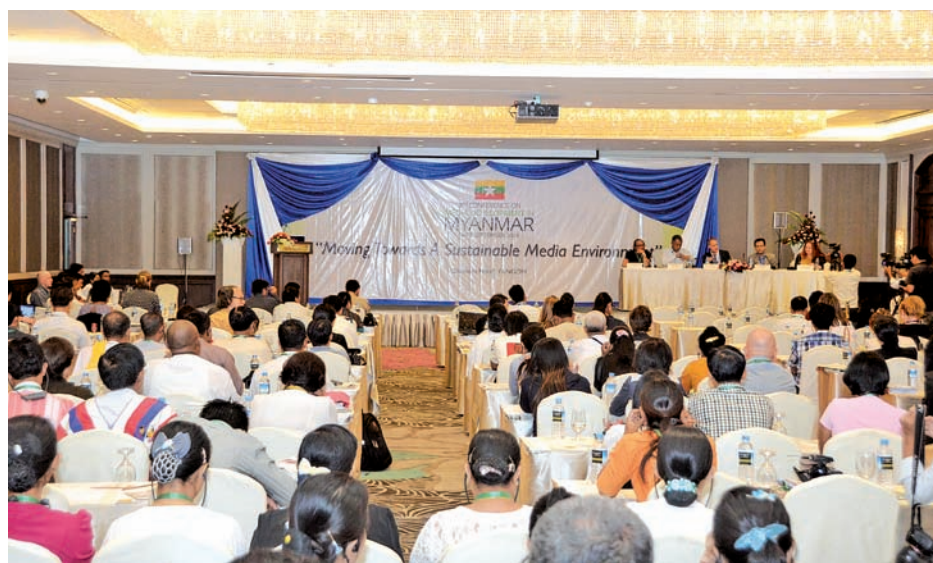
The 3 rd Conference on Media Development in Myanmar: Towards A Sustainable Media Development in progress.—MNA

ter for Information U Ye Htut and officials, Hluttaw representatives, representatives of UNESCO, international media, the Myanmar Press Council (Interim) and local media totalling about 200.—MNA