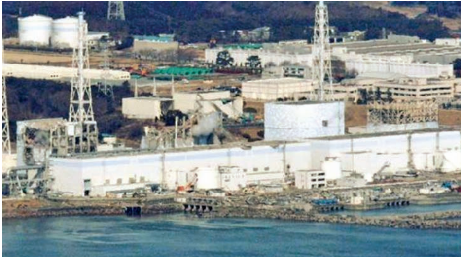
An aerial view shows Fukushima Daiichi nuclear power plant in Fukushima on 17 March, 2011.

LONDON, 19 Sept — Developing nations are leading a revival of interest in nuclear power, say atomic plant builders, but orders remain elusive as more safety features post-Fukushima have inflated investment costs.