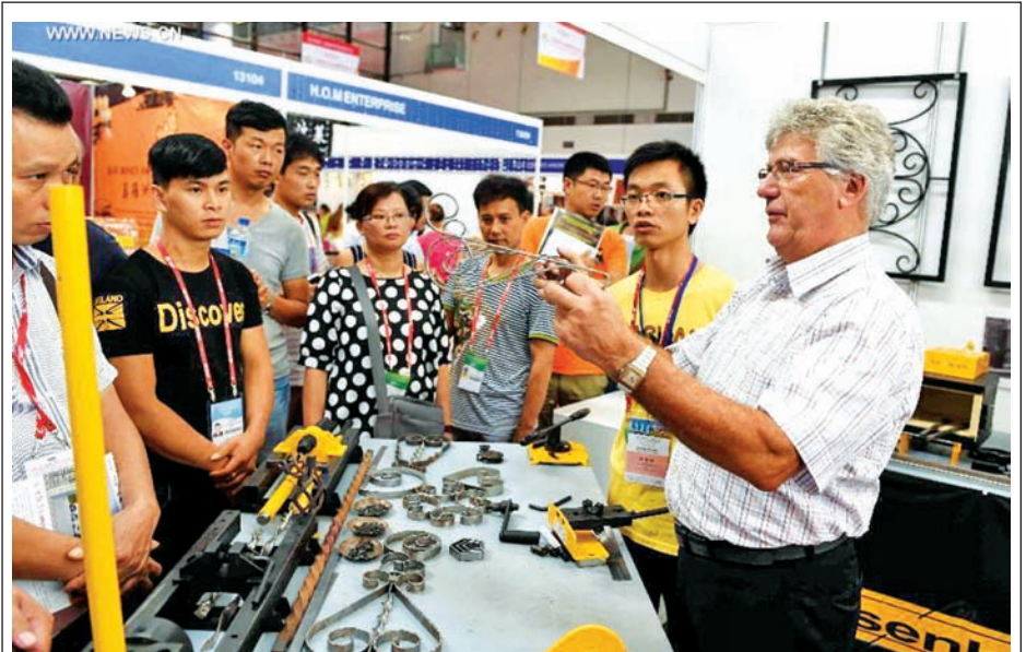
A Singaporean dealer makes iron grilles for visitors at the 11 th China-ASEAN Expo (CAEXPO) in Nanning, capital of south China's Guangxi Zhuang Autonomous Region on 18 Sept, 2014.