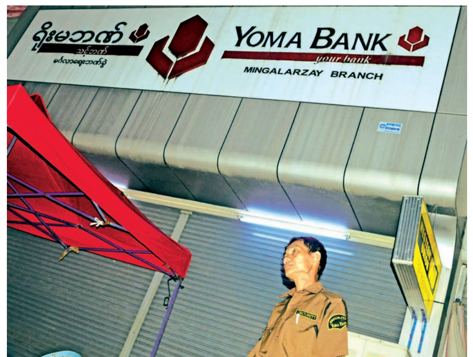
Mingalar Market Branch of Yoma Bank satisfies customers in banking and financial sectors as part of developing State economy.

It said that the loan is the first step in IFC's financial support for the bank, which may be further increased to up to $30 million in coming years in the form of equity, senior debt and trade guarantee lines under IFC's Global Trade Finance Program, which boosts banks' ca-