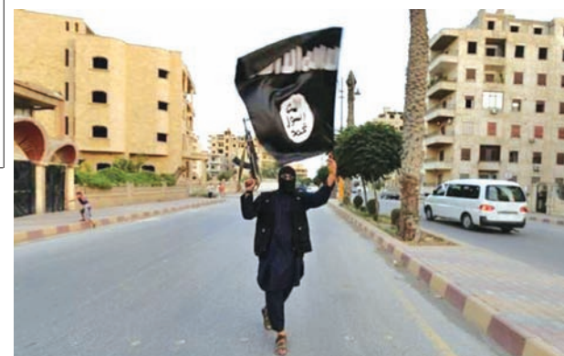
A member loyal to the Islamic State in Iraq and the Levant (ISIL) waves an ISIL flag in Raqqa on 29 June, 2014.

BEIRUT, 19 Sept—Islamic State militants fighting in Iraq and Syria released a video on Thursday that they said shows British journalist John Cantlie in captivity saying he will soon reveal “facts” about the group to counter its portrayal in Western media.