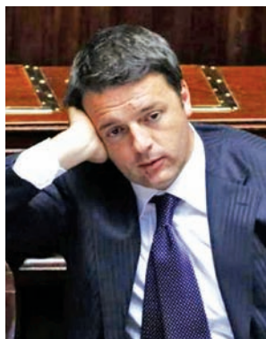
Italian Prime Minister Matteo Renzi is pictured after delivering his speech at the Italian Parliament in Rome on 24 June, 2014.

businessman and former local politician with the now defunct Christian Democrat party in the town of Rignano sull’Arno, near Florence.