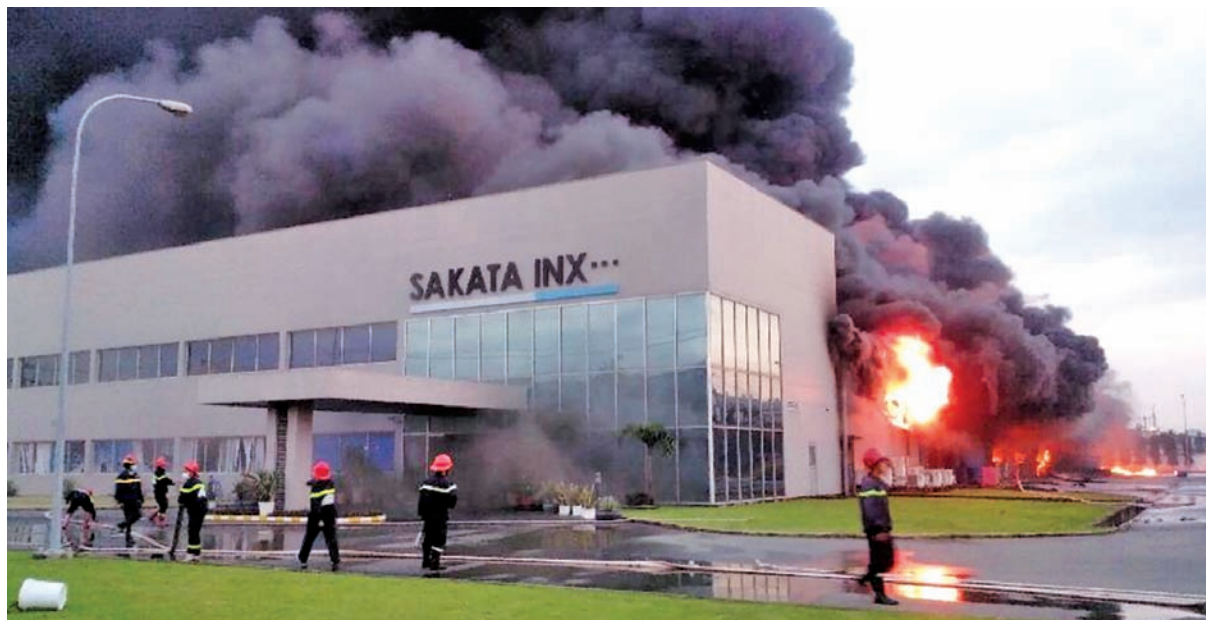
Firemen work at the fire accident site in Vietnam-Singapore Industrial Park 1 in Binh Duong Province, Vietnam, on 18 Sept, 2014

“These videos can be very distressing for the families of the individuals involved,” he told reporters during a visit to Copenhagen.—Reuters