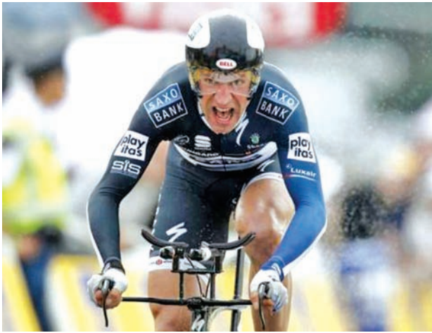
Jens Voigt of Germany in Rotterdam, on 3 July, 2010.

LONDON, 19 Sept — German rider Jens Voigt has beaten the hour record at the velodrome in Grenchen, Switzerland, covering a distance of 51.115 km in an hour, cycling's governing body the UCI said on Thursday.