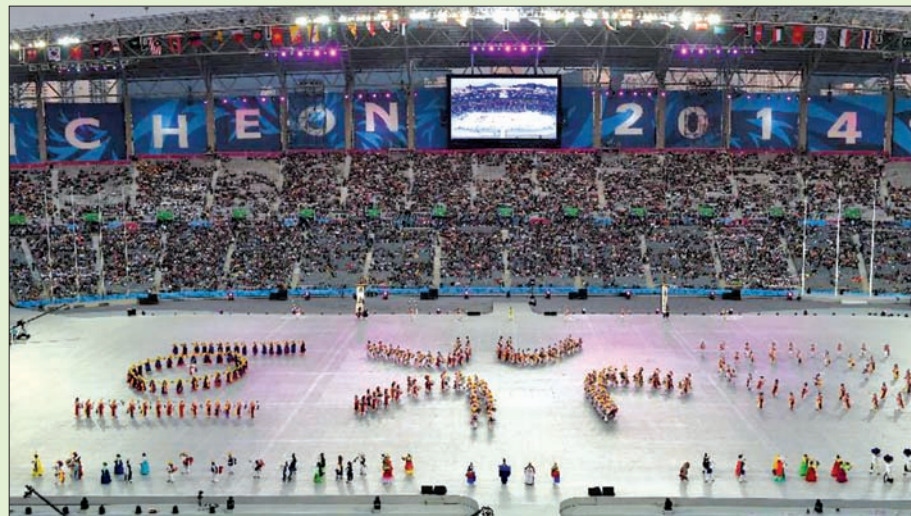
Dancers perform before the opening ceremony of the 17 th Asian Games at the Incheon Asiad Main Stadium in Incheon, South Korea on 19 Sept, 2014.