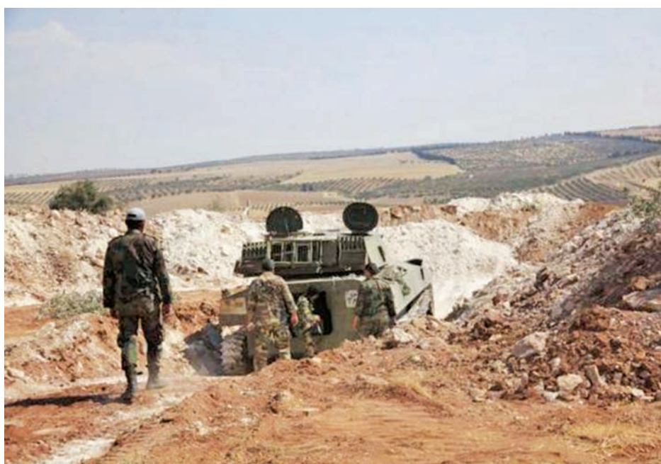
Soldiers from forces of Syria's President Bashar al-Assad walk on the Zalin hills, after saying they have regained control of the hill and farms surrounding it, in the northern Hama countryside on 16 Sept, 2014.

"We've lost touch with many of the residents living in the villages that ISIS