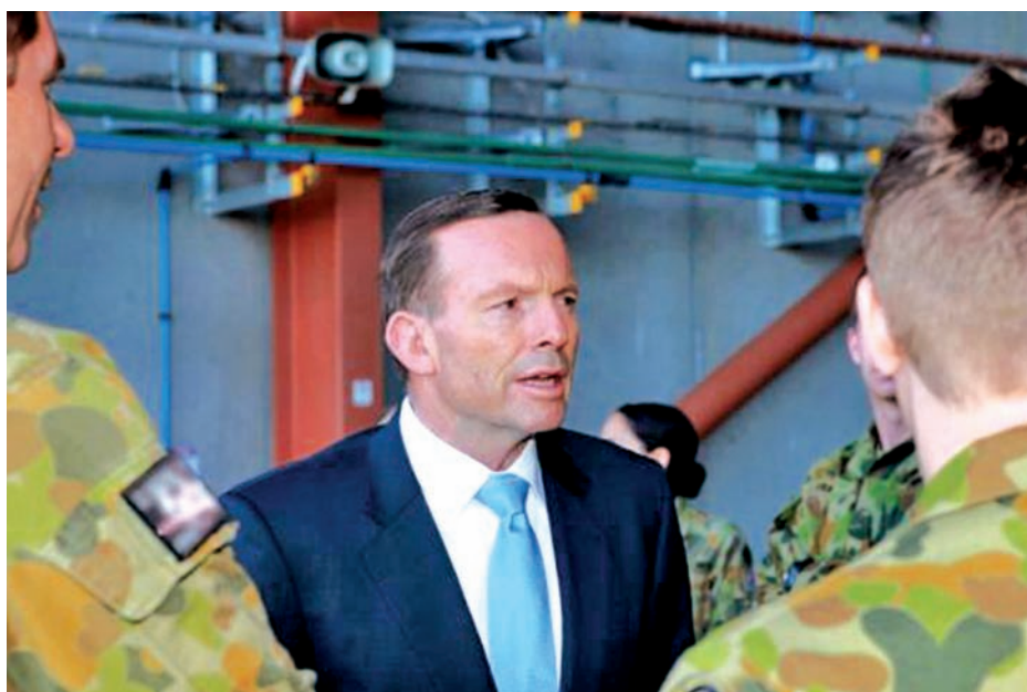
Australia's Prime Minister Tony Abbott (C) speaks to defence personnel at Royal Australian Air Force (RAAF) Base Williamtown, located north of Sydney, before they depart to join the US-led coalition fighting Islamic State militants in Iraq, in this picture released by the Australian Defence Force on 18 Sept, 2014.

More than 800 police were involved in the security operation in Sydney and Brisbane on Thursday, which authorities said had thwarted a plot by militants linked to the Islamic State group to behead a random