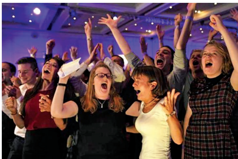
Supporters from the "No" Campaign react to a declaration in their favour, at the Better Together Campaign headquarters in Glasgow, Scotland on 19 Sept, 2014.

Sterling strengthened sharply against the dollar and the euro while British share prices rose. Royal