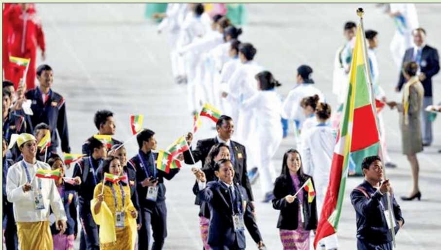
Flag bearer of Myanmar Nay Lin Aung leads the team into the Opening Ceremony of the 17 th Asian Games in Incheon on 19 Sept, 2014.