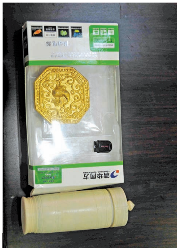
A case made of tusk that stores gold letter sent by King Alaungphaya to the British King.

The Myanmar people of today are fortunate enough to witness a gold letter sent by King Alaungphaya of Myanmar to King George II of Great Britain in 1756. King Alaungphaya was the founder of the Konbaung Dynasty over 250 years ago.