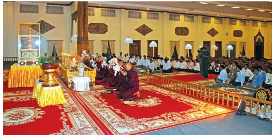
Members of the Sangha consecrate sacred Buddha tooth relic conveyed from China at Nay Pyi Taw Uppatasanti Pagoda.