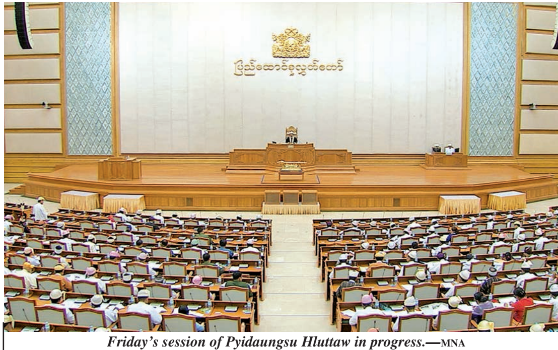
Friday's session of Pyidaungsu Hluttaw in progress.

The Pyidaungsu Hluttaw session also approved borrowing US$ 45 million for the Ministry of Rail Transportation from the EDCF of South Korea. The loan will be spent on (See page 3)