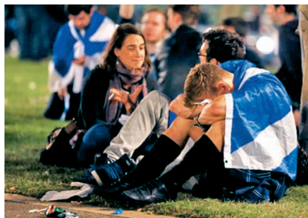
Supporters from the "Yes" Campaign react as they sit in George Square in Glasgow, Scotland on 19 Sept, 2014.