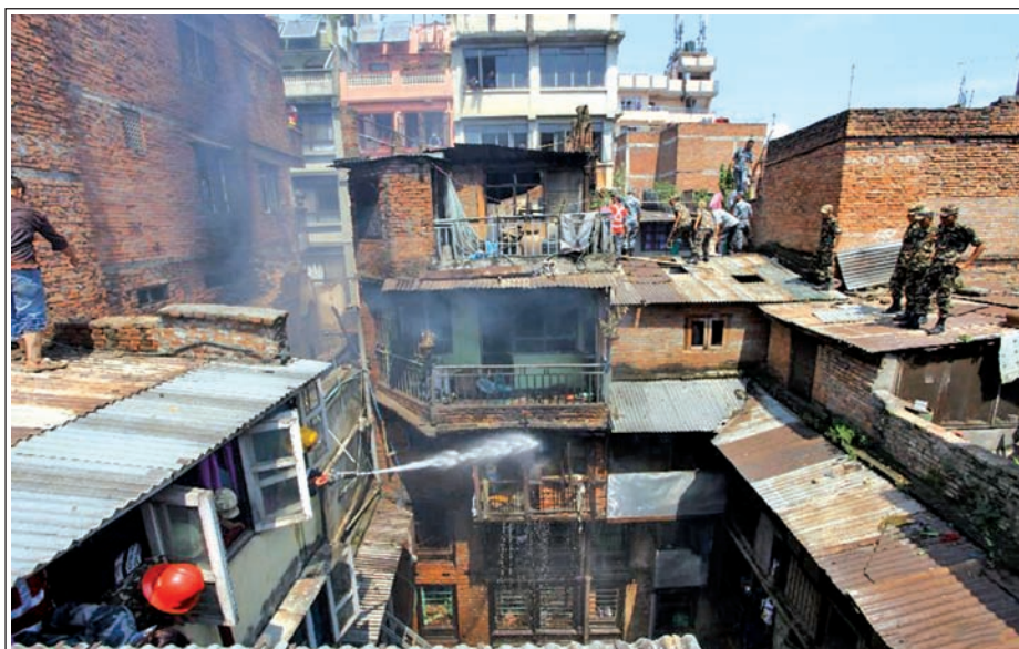
Firefighters try to douse a fire in Kathmandu, Nepal on 18 Sept, 2014. A total of five buildings were destroyed in the fire accident.