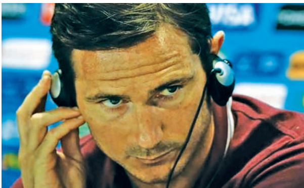
Britain's national team player Frank Lampard listens a question during a news conference in Belo Horizonte on 23 June, 2014.

LONDON, 18 Sept — Frank Lampard could make an emotional appearance against former club Chelsea this weekend as his new employers Manchester City host Jose Mourinho's side in an early showdown between the Premier League's heavyweights.