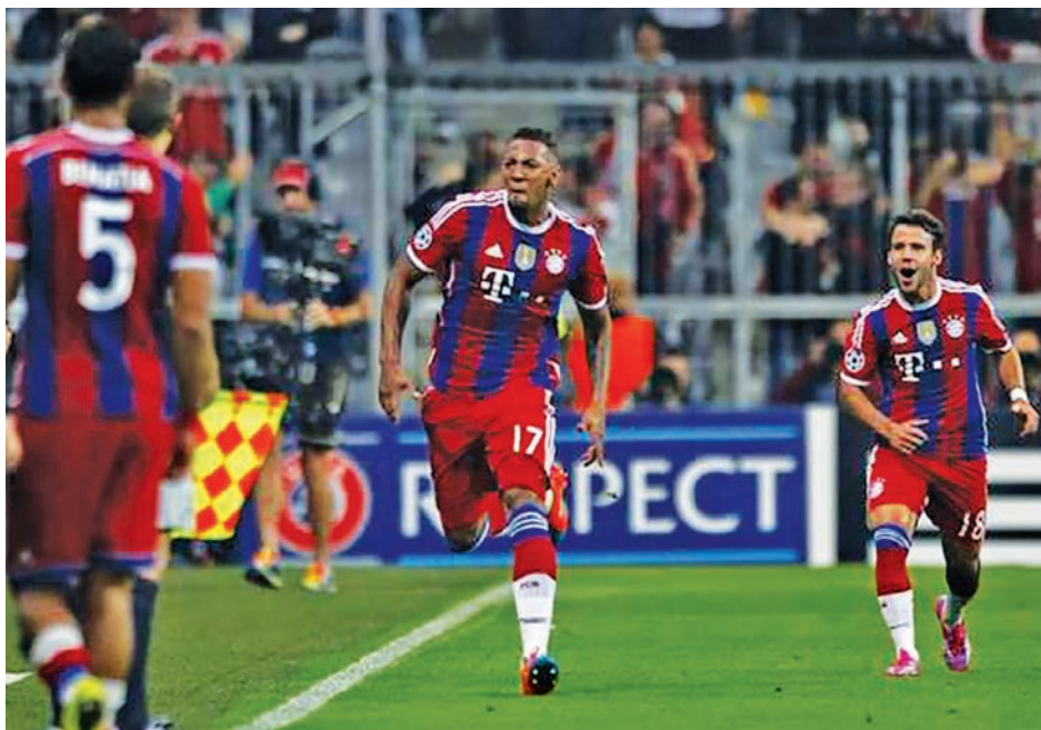
Bayern Munich's Jerome Boateng celebrates with his team mate Juan Bernat (R) after scoring a goal against Manchester City during their Champions League group E soccer match in Munich on 17 Sept, 2014.