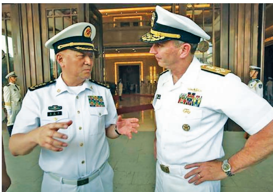
US Chief of Naval Operations Admiral Jonathan Greenert (R) talks with PLA Navy Commander in Chief Admiral Wu Shengli during a welcoming ceremony at the PLA Navy headquarters outside of Beijing on 15 July, 2014.

China has dismissed the criticism as groundless and said the pilot had kept