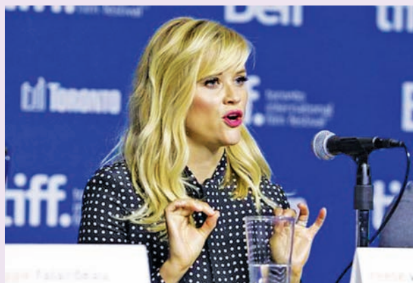
Actress Reese Witherspoon attends a news conference to promote the film "The Good Lie" at the Toronto International Film Festival (TIFF) in Toronto on 8 Sept, 2014.

WASHINGTON, 18 Sept — Oscar-winning actress Reese Witherspoon chose a subdued role in her latest film "The Good Lie," a drama about Sudanese refugee children who end up in America, but there is nothing small in what she hopes to convey.