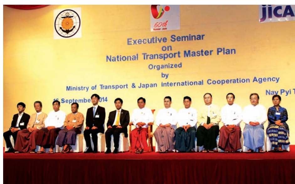
Union Minister U Nyan Tun Aung with JICA Chief Representative Mr Masahiko Tanaka at Executive Seminar on the National Transport Development Master Plan.—NLM

U Nyan Htun Aung, Union Minister for Transport, delivered an address, saying that together with the initiatives for democratization, multi-modal transport sector development has become one of the important and urgent agenda to assist Myanmar's efforts in achieving its targets for sustainable development. Under the Survey Program, the National Transport Master Plan was formulated in cooperation with related departments and ministries. The Master Plan will give strategic policy guidelines, strategies and prioritized list of projects to develop transport sector in line with Myanmar's Na-