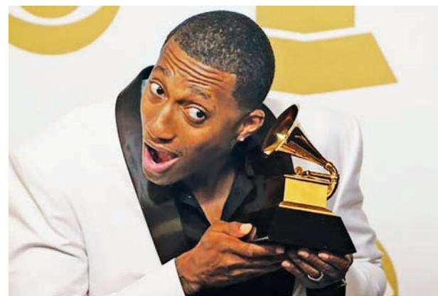
Lecrae poses with his Grammy award for Best Gospel Album for "Gravity" backstage at the 55th annual Grammy Awards in Los Angeles, California on 10 Feb, 2013.