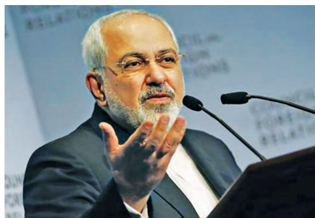
Iranian Foreign Minister Mohammad Javad Zarif

UNITED NATIONS, 18 Sept — A diplomatic breakthrough is unlikely on a nuclear deal to end sanctions against Iran when talks resume in New York this week between Tehran and six world powers deadlocked after a year of negotiations.