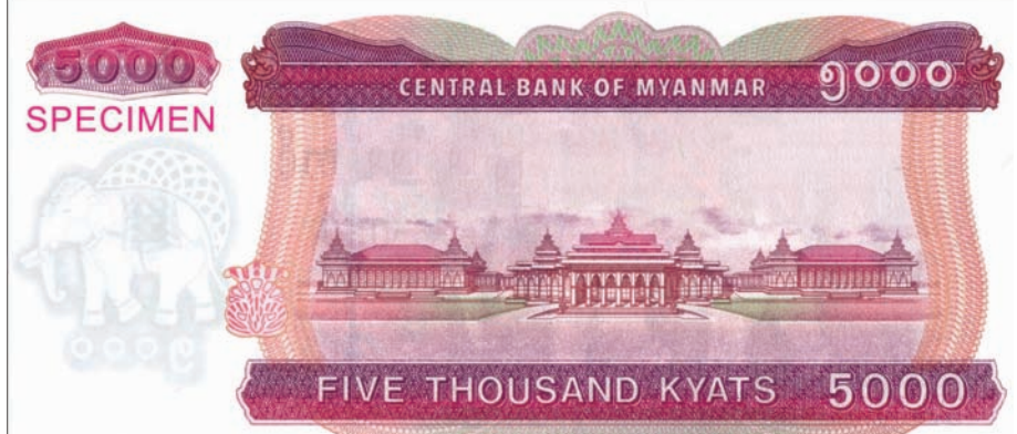
Reverse side of new specimen Five Thousand Kyats note.