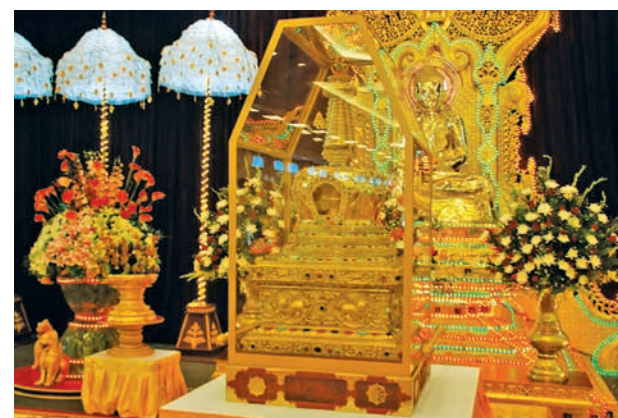
Sacred Buddha tooth relic donated by People's Republic of China being kept in the presence of the Buddha Image at Nay Pyi Taw Uppatasanti Pagoda.

On 19 September morning, the tooth relic will be consecrated at the pagoda and then the tooth relic will be conveyed to Yangon.— MNA