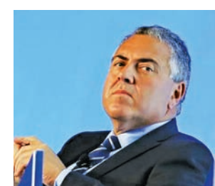
Australian Treasurer Joe Hockey looks on at the B20 Australia Summit in Sydney on 18 July, 2014.

At home, a sweeping counter-terrorism operation across several major Australian cities on Thursday has knocked everything