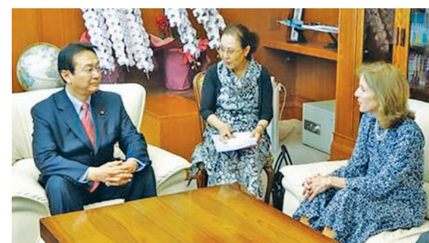
Defence Minister Akinori Eto (L) and US Ambassador to Japan Caroline Kennedy (R) holds a meeting at the Ministry of Defence in Tokyo on 18 Sept, 2014. They agreed to work together toward a reduction in the burden on Okinawa Prefecture of hosting the bulk of US military bases and other facilities in Japan.