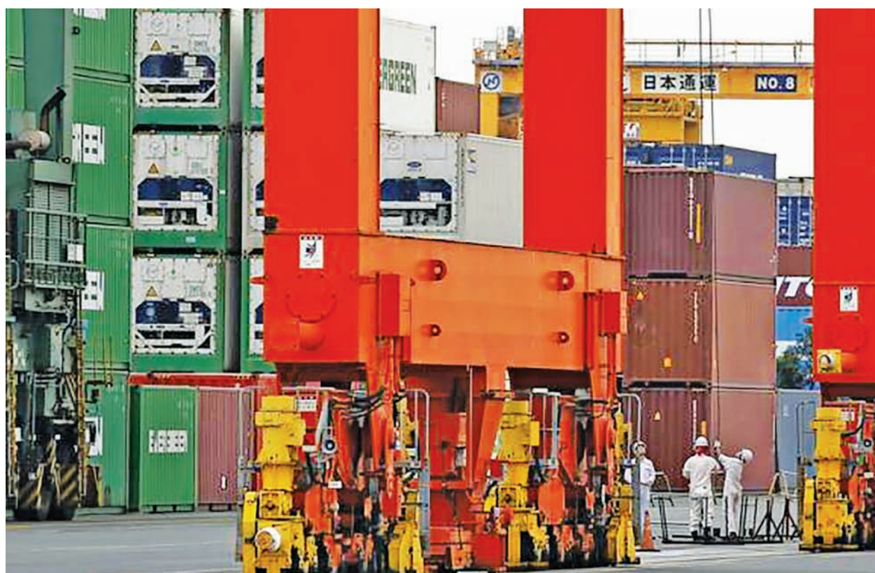
Workers are seen in a container area at a port in Tokyo on 18 Sept, 2014.

The patchy performance has dashed hopes that external demand can offset a consumer spending slump caused by an April sales tax hike to 8 percent from 5 percent, heaping pressure on policymakers to do more to spur economic growth.