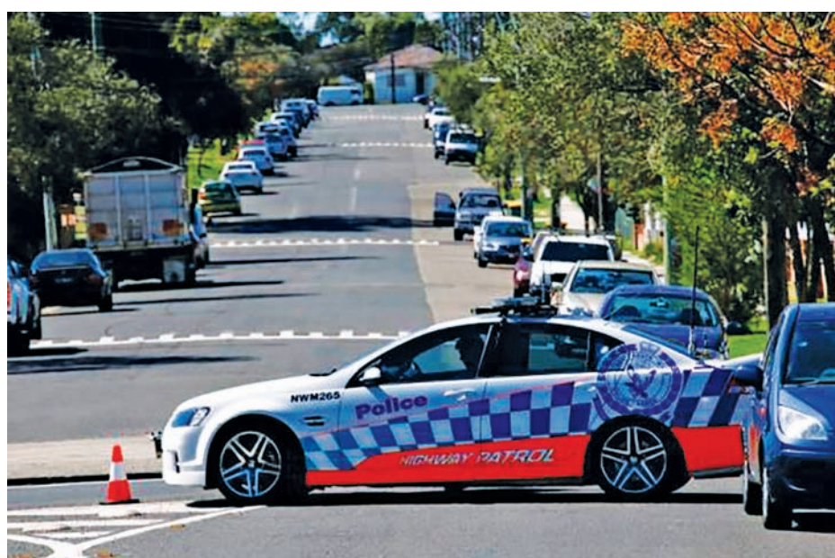
A policeman sits in his patrol car as part of a road block on the street where a house was involved in pre-dawn raids in the western Sydney suburb of Guilford on 18 Sept, 2014.

“The exhortations, quite direct exhortations,