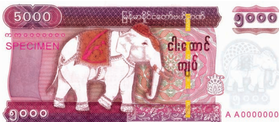
Obverse side of new specimen Five Thousand Kyats note.

The existing Five Thousand Kyats note with is in circulation will continue to be legal tender currency.