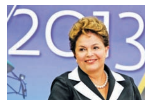
Brazil's President Dilma Rousseff

BRASILIA, 18 Sept — Brazil's President Dilma Rousseff on Wednesday pledged to preserve labour rights if reelected in October, including the year-end bonus, vacations and overtime pay.