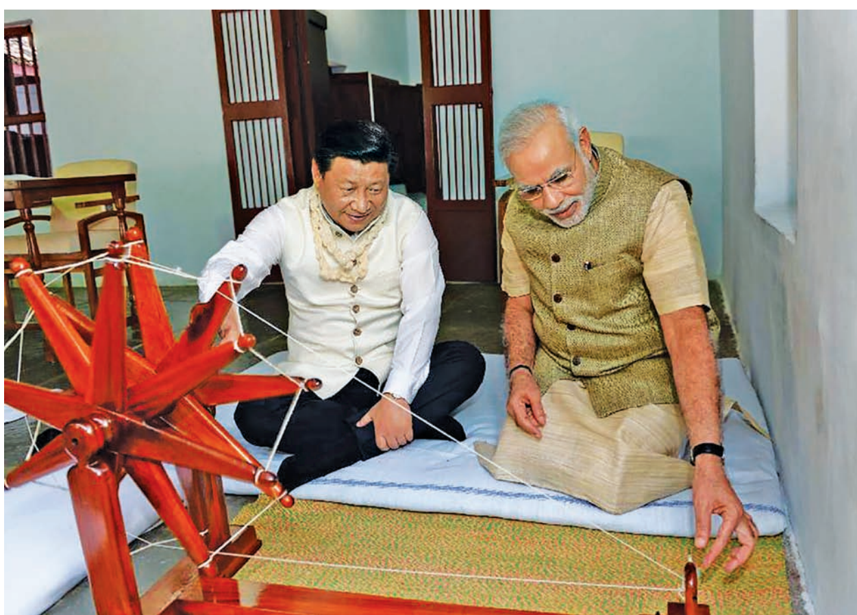
Chinese President Xi Jinping (L) rotates a spinning wheel that was once used by Mahatma Gandhi as he visits Gandhi's former residence along with Indian Prime Minister Narendra Modi (R) in Gujarat, India, on 17 Sept, 2014.

The two countries should respect each other, learn from each other, build good-neighbourly and