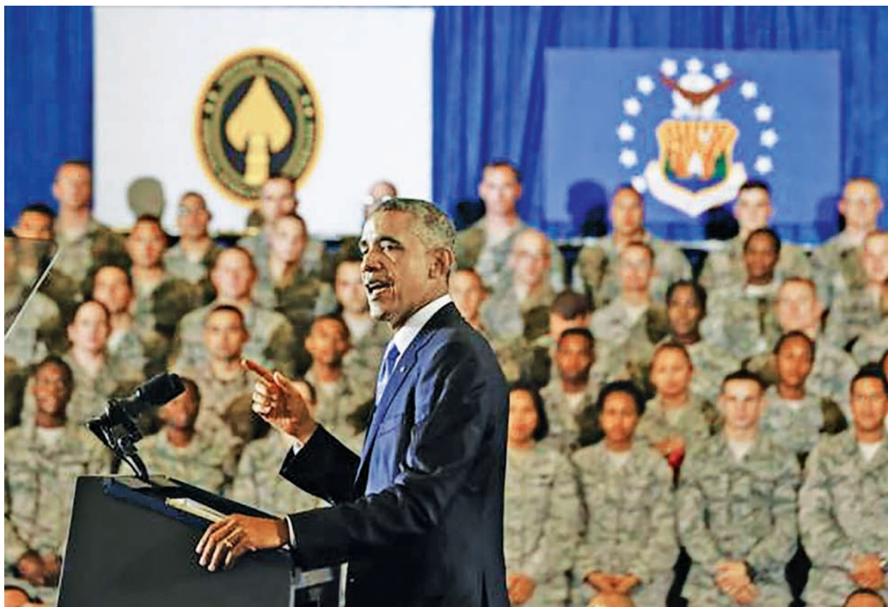
US President Barack Obama speaks after a military briefing at US Central Command at MacDill Air Force Base in Tampa, Florida on 17 Sept, 2014.

His spokesman Josh Earnest said some US military advisers could be deployed to forward positions