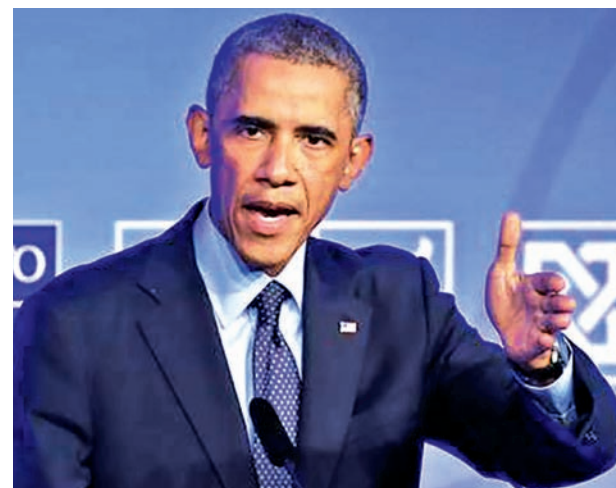
US President Barack Obama

"What I want people to understand, though, is that over the course of months, we are going to be able to not just blunt the momentum of ISIL. We are going to