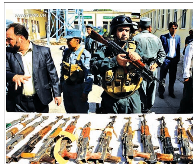
Afghan security forces display weapons captured from Taliban militants in Herat Province, western Afghanistan, on 7 Sept, 2014.