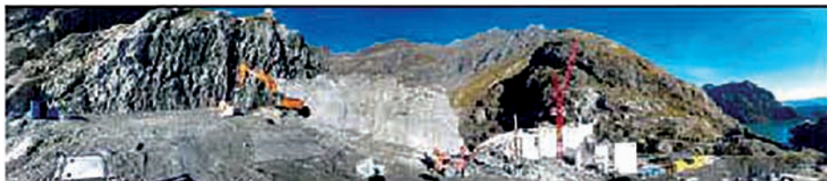
Vieux Emosson Dam, the most spectacular hydropower construction sites in Swiss Alps in Switzerland.

YANGON, 8 Sept—In the framework of the State visit of the Myanmar President Delegation to Switzerland, Union Ministers U Khin Maung Soe, U Ohn Myint and U Nyan Tun Aung had the opportunity to visit the most spectacular hydropower construction sites in the Swiss Alps, the Vieux Emosson Dam heightening project on 5 September. The delegation was accompanied by the directors of STUCKY, the highly re-