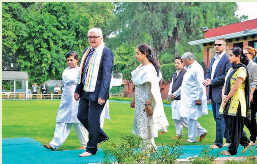
German Foreign Minister Frank-Walter Steinmeier (2 nd L) visits the Gandhi memorial in New Delhi, India, on 7 Sept, 2014.

A final decision was due to be included in the Defence White Paper to be released by mid 2015, however the government could announce the new deal before the end of the year.—Xinhua