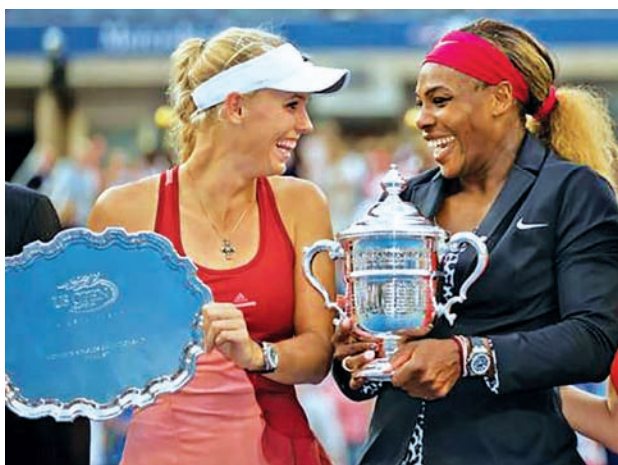
Serena Williams (USA) and Caroline Wozniacki (DEN) at the trophy presentation after the women's singles final of the 2014 US Open tennis tournament at USTA Billie Jean King National Tennis Centre in New York on 7 Sept, 2014.

For the 10 th seeded Wozniacki, back in a grand slam final for the first time in five years, it was another