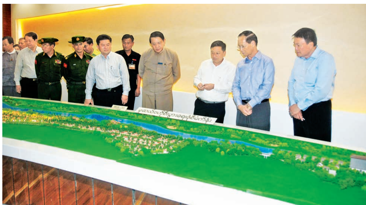
Vice President Dr Sai Mauk Kham views scale model of Muse Central Economic Zone Project.