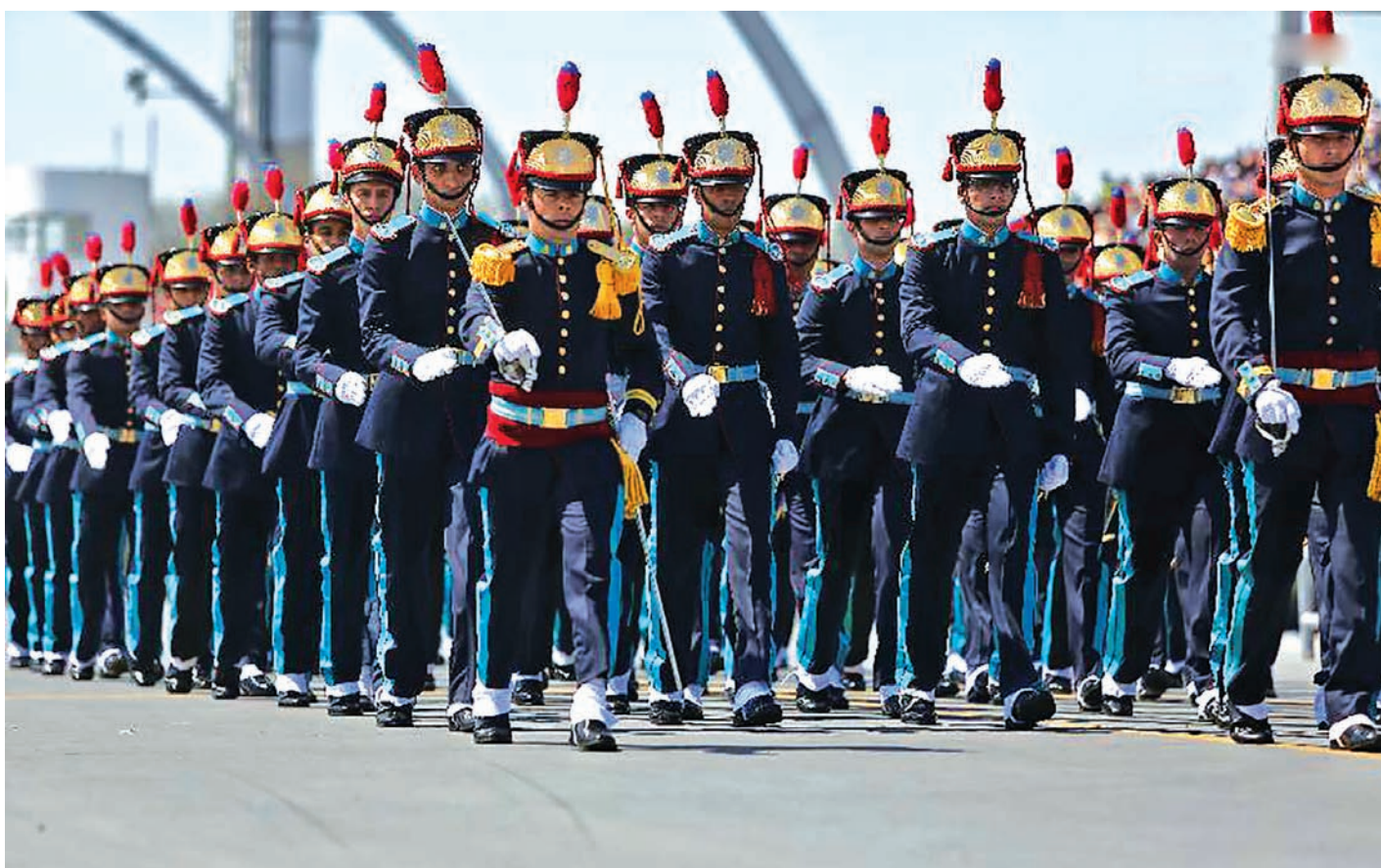
Soldiers take part in a military parade to commemorate the Independence's Day of Brazil, at the Anhembi Sambadrome, in Sao Paulo, Brazil, on 7 Sept, 2014. Brazil celebrated the 192 nd anniversary of its independence on Sunday.