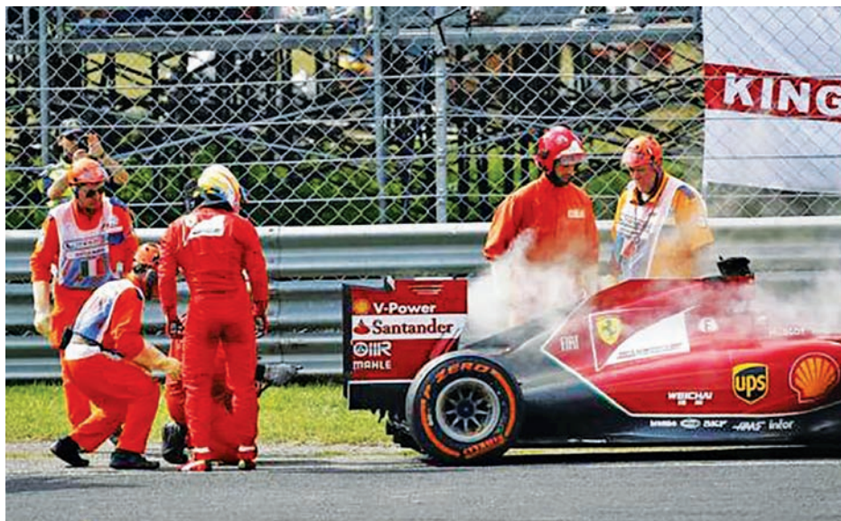
Ferrari Formula One driver Fernando Alonso (front 3 rd L) of Spain looks at his car which stopped during the Italian F1 Grand Prix in Monza on 7 Sept, 2014.

The meagre haul, coupled with third and fourth places for Williams with former Ferrari driver Fe-