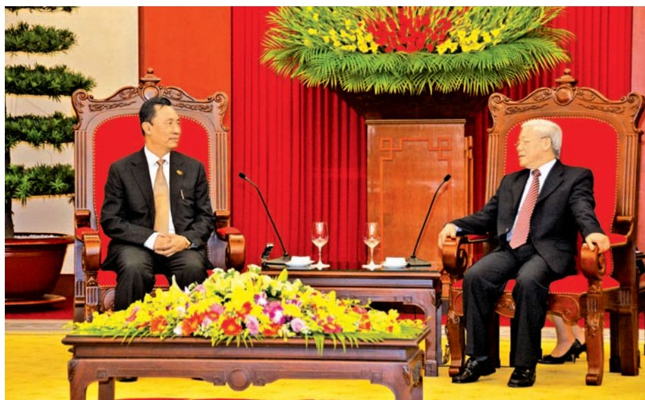
Speaker of Pyidaungsu Hluttaw Thura U Shwe Mann meets Mr Nguyen Phu Trong, General Secretary of the Communist Party of Vietnam.

NAY PYI TAW, 8 Sept —Speaker of Pyidaungsu Hluttaw and Pyithu Hluttaw Thura U Shwe Mann met Mr Nguyen Phu Trong, General Secretary of the Commu-