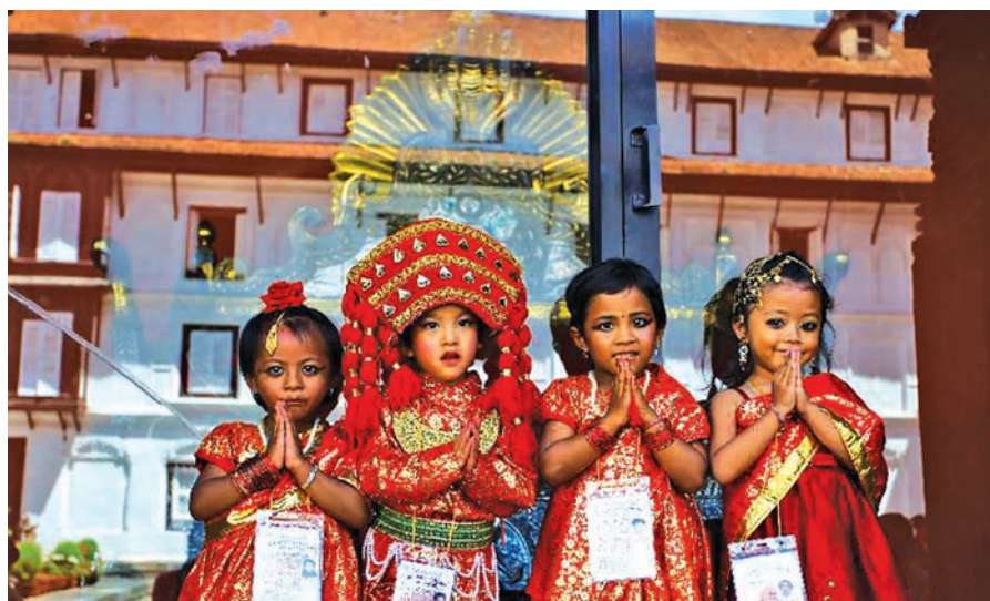
Little girls dressed up as living Goddess react during the procession of Kumari Puja organized on the occasion of Indrajatra festival at Hanumandhoka in Kathmandu, Nepal, on 7 Sept, 2014. More than 300 little girls participated in Kumari Puja. Nepalese celebrate the Indrajatra festival to worship "Indra", the King of Gods according to the Hindu myth.