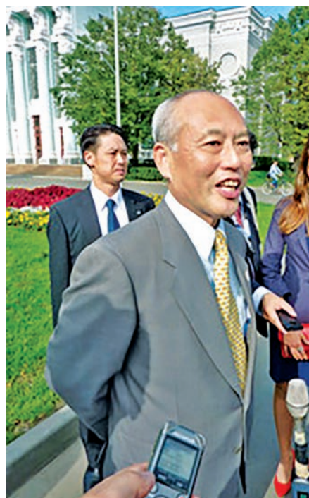
Tokyo Gov. Yoichi Masuzoe speaks to reporters in Moscow on 7 Sept, 2014, after meeting with Moscow Mayor Sergei Sobyanin. Masuzoe said he and Sobyanin agreed to resume exchanges of visits by the leaders of the two capitals, which have had no such exchanges in 20 years.