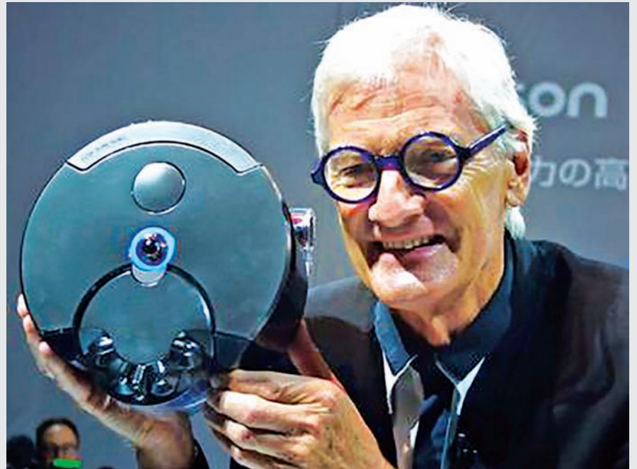
Dyson Ltd. founder James Dyson holds up a new autonomous robotic vacuum cleaner, dubbed "Dyson 360 Eye," in Tokyo on 4 Sept, 2014. The product, equipped with a 360-degree panoramic camera to monitor its surroundings, will go on sale in the spring of 2015.