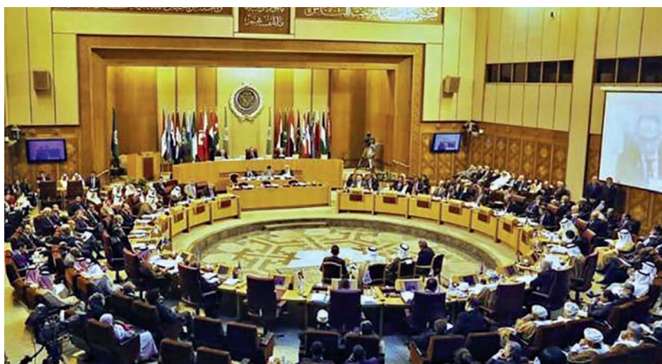
Foreign ministers of the Arab League take part in an emergency meeting at the league's headquarters in Cairo on 7 Sept, 2014.

CAIRO, 8 Sept — Arab League foreign ministers agreed on Sunday to take all necessary measures to confront Islamic State and cooperate with international, regional and national efforts to combat militants who have overrun swathes of Iraq and Syria.