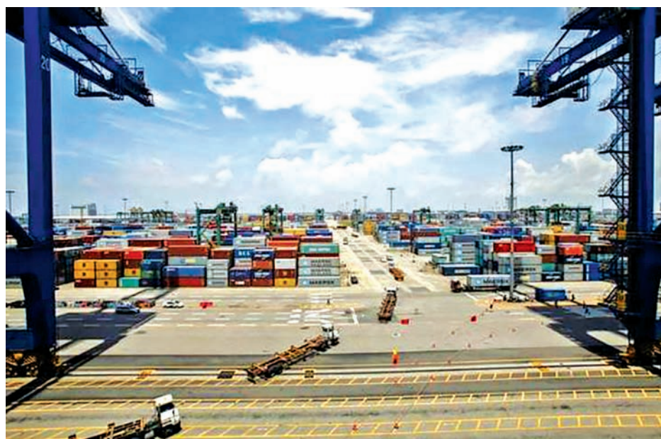
Containers are transported at Nansha port in Guangzhou, Guangdong Province, on 26 June, 2014.

It was the second straight month that China's import growth has been unexpectedly weak, raising concerns that sluggish domestic demand exacerbated by a cooling housing market