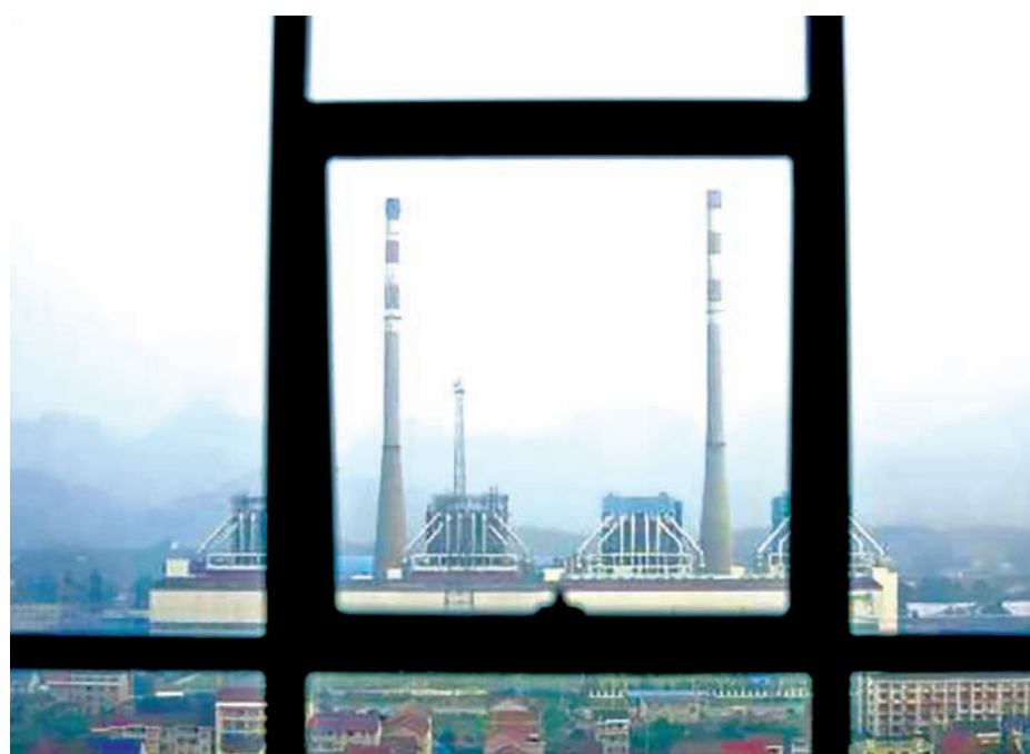
Chimneys are seen through a window at a coal-fired power plant on a hazy day in Shimen county, central China's Hunan Province, on 2 June, 2014.

France's shift to nuclear power in the 1980s delivered a 4 percent cut, Britain's "dash for gas" in