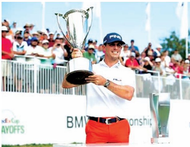
Billy Horschel winner of the BMW Championship holds a trophy at Cherry Hills Country Club in Cherry Hills Village, Colorado on 7 Sept, 2014.

CHERRY HILLS VILLAGE, Colorado, 8 Sept — American Billy Horschel withstood an early challenge from Ryan Palmer and a late charge by Bubba Watson to win his second PGA Tour title by two shots at the BMW Championship on Sunday.