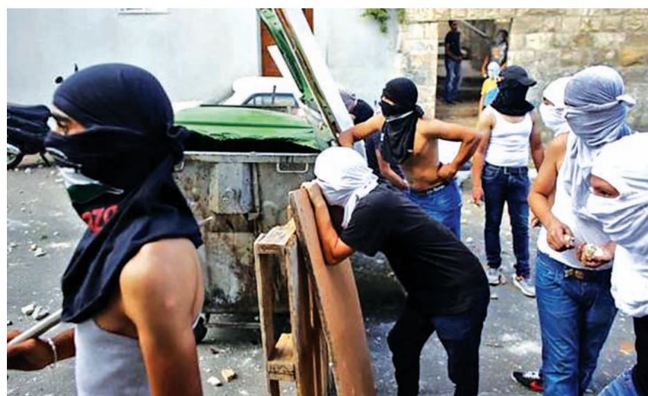
Palestinian protesters take cover during clashes with Israeli police in the East Jerusalem neighbourhood of Wadi Joz on 7 Sept, 2014.

The protests erupted in July after the murder of a Palestinian teen in an alleged revenge attack by three Jews, who are standing trial. That followed the killing of three Israeli youths in the occupied West Bank by Hamas Islamist militants.