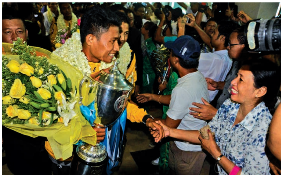
A local heartily welcomes back footballers of victorious Myanmar national football team at Yangon International Airport.

The people, members of social organizations and staff of companies cheered the Myanmar team along the