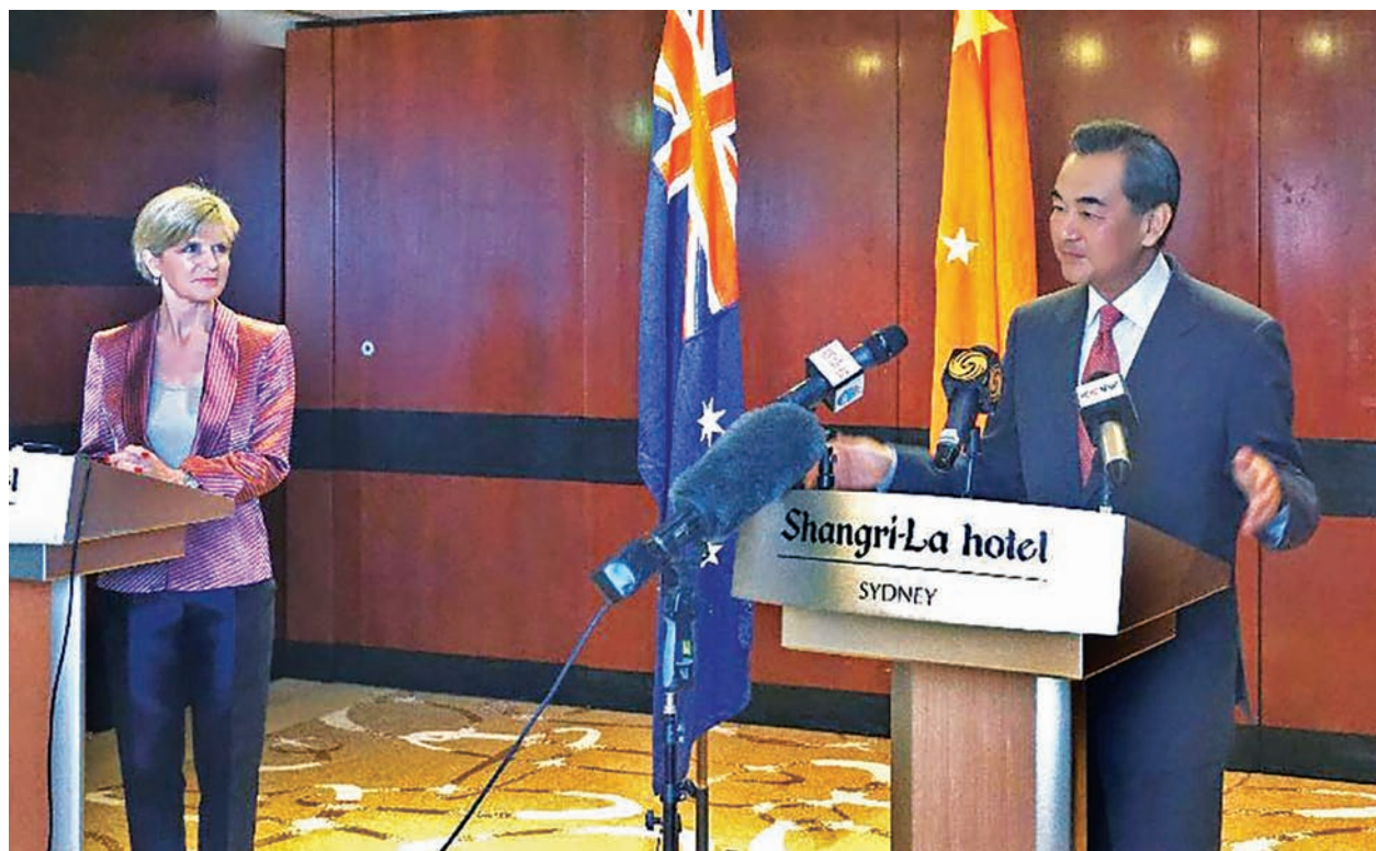
Chinese Foreign Minister Wang Yi (R) and his Australian counterpart Julie Bishop attend a news conference before the second China-Australia diplomatic and strategic dialogue in Sydney, Australia, on 7 Sept, 2014.