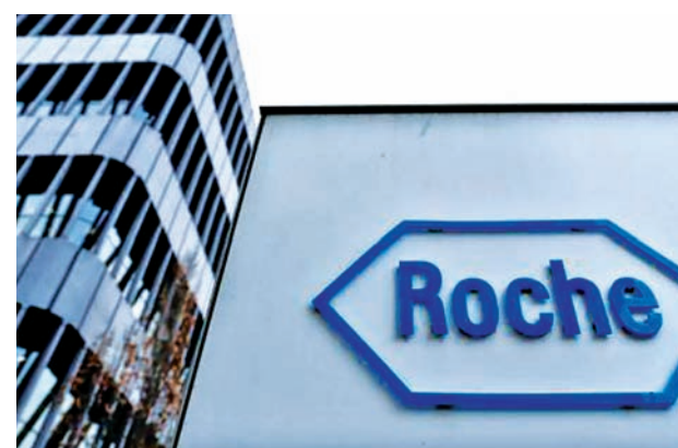
The logo of Swiss pharmaceutical company Roche is seen outside their headquarters in Basel on 30 Jan, 2014.

ZURICH, 8 Sept — Swiss drugmaker Roche Holding AG said on Monday the European Union has approved the use of its drug RoActemra in patients with early-stage rheumatoid arthritis.