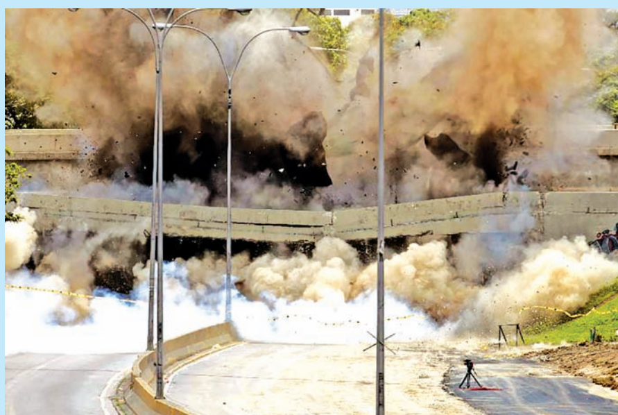
The Santa Cecilia Bridge is demolished in a controlled explosion on the Francisco Fajardo Highway in Caracas, capital of Venezuela, on 7 Sept, 2014.