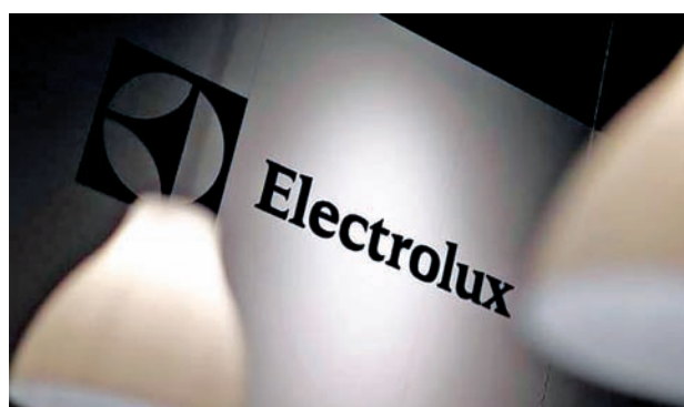
The Electrolux logo is seen during the IFA Electronics show in Berlin on 4 Sept, 2014.

STOCKHOLM, 8 Sept — Sweden's Electrolux (ELUXB.ST) said on Monday it had agreed its biggest ever deal, buying General Electric Co's (GE.N) ap-