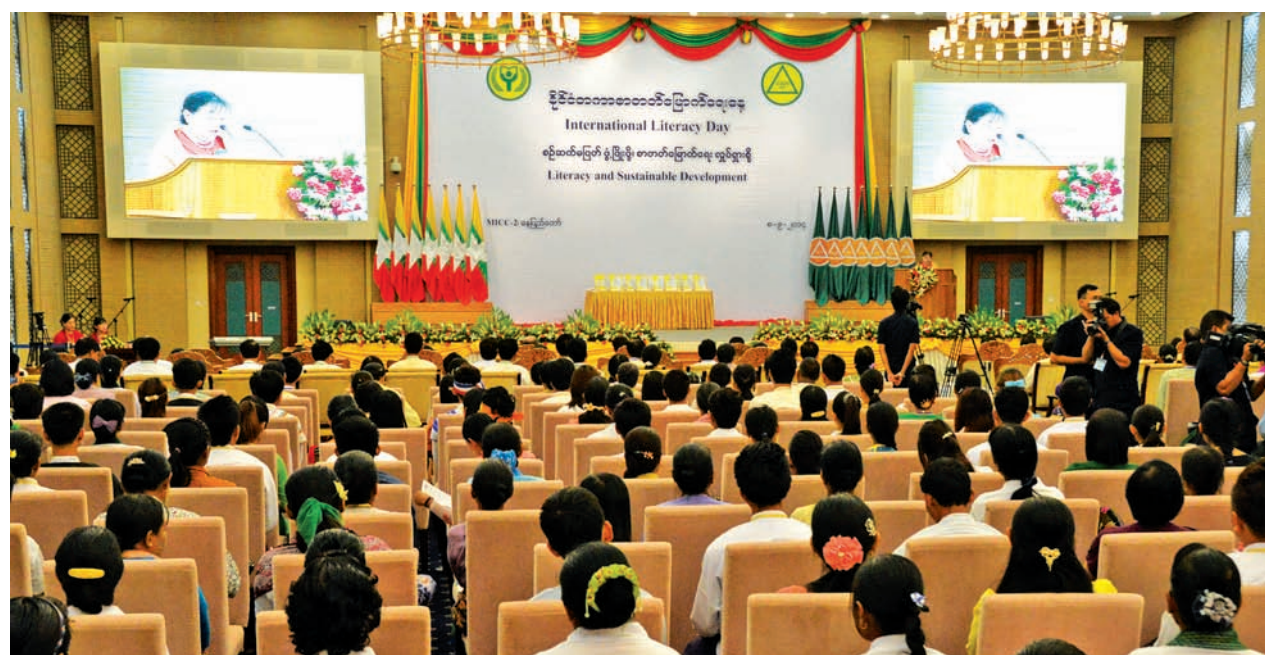
Union Minister Dr Daw Khin San Yi delivers an address at ceremony to mark International Literacy Day.

Union Ministers U Tin Naing Thein, Dr Daw Khin San Yi and Dr Daw Myat Myat Ohn Khin and Deputy Minister Dr Daw Min Aung presented prizes to the winners in the open article contest, education uni-