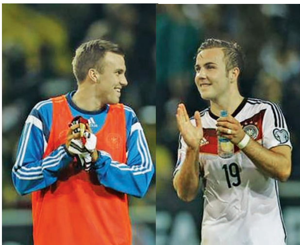
Germany's Kevin Grosskreutz and Mario Goetze (R) react after winning their Euro 2016 qualifying soccer match against Scotland in Dortmund on 7 Sept, 2014.