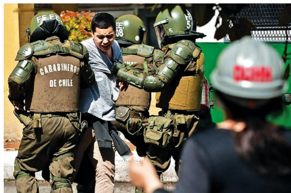
Riot police arrest a demonstrator during a clashes on the 41 st anniversary of the military coup that brought Augusto Pinochet to power, in Santiago, capital of Chile, on 7 Sept, 2014. By the end of Pinochet's regime in 1990, 200,000 Chileans were driven into exile, 40,000 were tortured by the security apparatus, and more than 3,000 were executed or remain unaccounted for in the country.—XINHUA

was once hailed by Israeli authorities as a symbol of coexistence, had put a third of its carriages out of commission.—Reuters