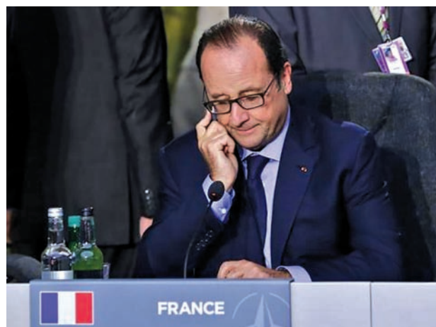
French President Francois Hollande reacts as he attends the NATO summit at the Celtic Manor resort, near Newport, in Wales on 4 Sept, 2014.

Hollande has reshuffled his government twice since May mainly to respond to public dissatisfaction with economic policies that have failed to revive the French economy.—Reuters