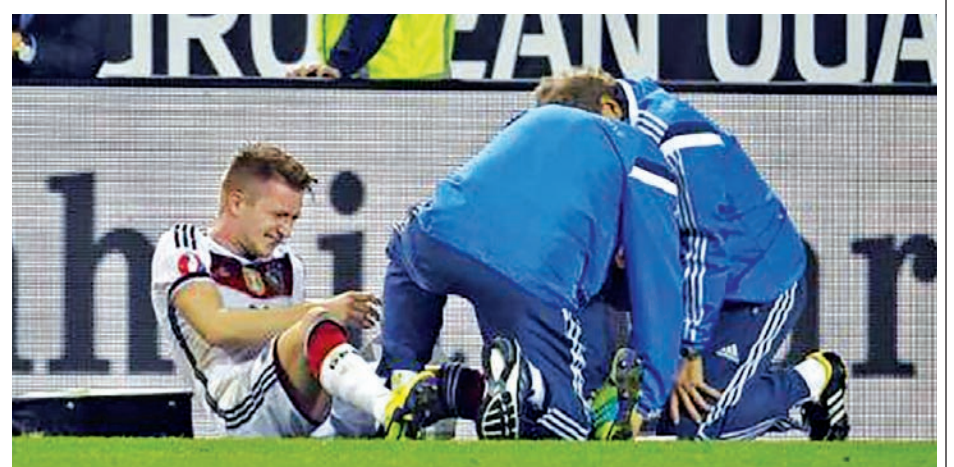
Germany's Marco Reus receives medical treatment during their Euro 2016 qualifying soccer match against Scotland in Dortmund on 7 Sept, 2014.

"Initial diagnosis suggests it may not be as bad as before the World Cup. But we will have to wait for more checks." Reus, a transfer target for almost every top European club, went down in stoppage time of Germany's first competitive game since their World Cup victory, grimacing in pain, before being helped off the pitch. Last season's runners-up Borussia Dortmund kick off their Champions League group matches against Arsenal on 16 September. —Reuters