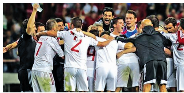
Albania's national soccer team players celebrate their victory against Portugal at the end of their Euro 2016 qualifying soccer match at the Aveiro city stadium in Aveiro on 7 Sept, 2014.

The Serbs open their 2016 European championship qualifiers away to Armenia and at home to Albania in October.—Reuters