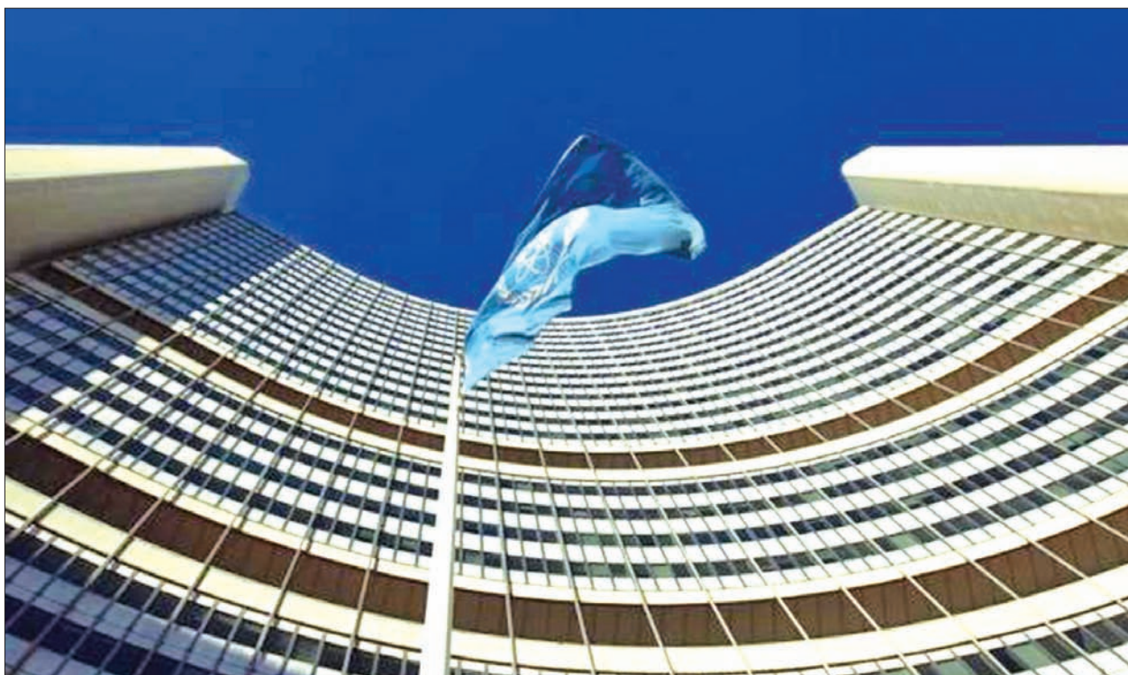
The flag of the International Atomic Energy Agency (IAEA) flies in front of its headquarters during a board of governors meeting in Vienna on 28 Nov, 2013.