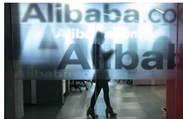
An employee is seen behind a glass wall with the logo of Alibaba at the company’s headquarters on the outskirts of Hangzhou, Zhejiang Province, on 23 April, 2014.