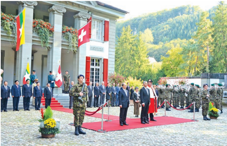
President U Thein Sein and Swiss President Mr Didier Burkhalter take the salute of the Guard of Honour at the Lohn Manor in Bern, Switzerland on Friday evening.

Then, the two Presidents held discussions on organizing an exhibition on cultural heritage of Bagan and Pyu periods in Switzerland and preservation of