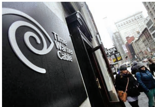
Pedestrians walk past the Time Warner Cable headquarters in New York on 13 Feb, 2014.