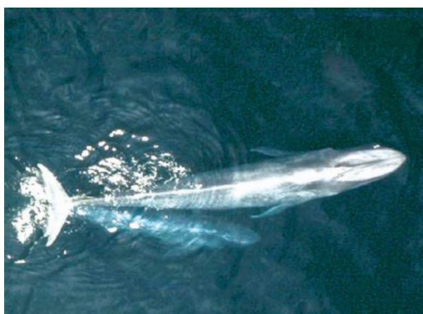
Blue Whales are seen in this undated handout photo courtesy of NOAA National Marine Fisheries Service.

Conservation groups say at least 11 blue whales are struck each year along