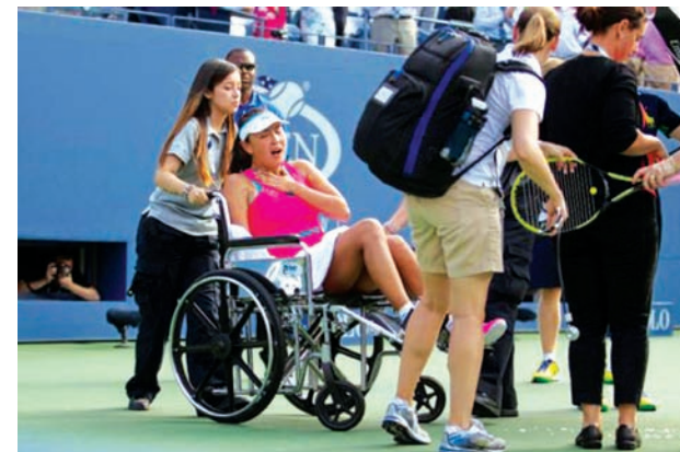
Peng Shuai (CHN) is helped off the court in a wheelchair after an apparent injury and is forced to retire from her match against Caroline Wozniacki (DEN) on day eleven of the 2014 US Open tennis tournament at USTA Billie Jean King National Tennis Centre in New York on 5 Sept, 2014.