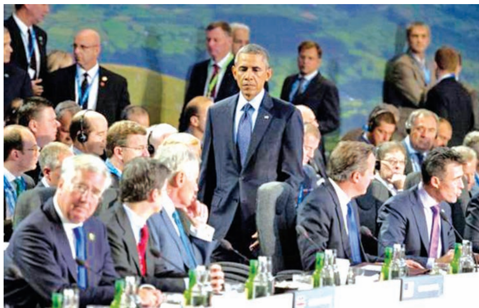
US President Barack Obama (C) arrives for a meeting on the second and final day of the NATO summit, at the Celtic Manor resort, near Newport, in Wales on 5 Sept, 2014.

The British public is deeply wary of foreign military intervention after London joined Washington in the 2003 invasion of Iraq based on false information about weapons of mass destruction. France, which