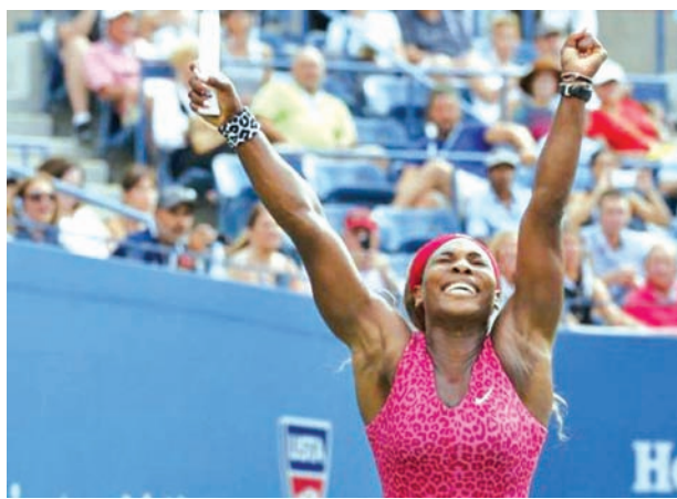
Serena Williams of the US celebrates winning match point against Ekaterina Makarova of Russia during their semi-final match at the 2014 US Open tennis tournament in New York on 5 Sept, 2014.

The opening semi-final produced some scary moments as China's Peng