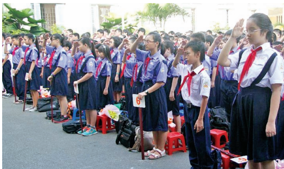
Students attend the opening ceremony for new school year in Ho Chi Minh City, Vietnam, on 5 Sept, 2014.