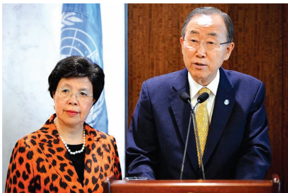
UN Secretary-General Ban Ki-moon (R) speaks as Director-General of the World Health Organization (WHO), Dr Margaret Chan looks on during a press briefing at the UN headquarters in New York, the United States, on 5 Sept, 2014. UN Secretary-General Ban Ki-moon said Friday that the world organization is going to establish an Ebola crisis center to stop the spread of the virus in six to nine months.

UNITED NATIONS, 6 Sept — The United Nations plans to set up an Ebola crisis centre to coordinate the response to the deadly virus and to strive to halt its spread in West African countries in six to nine months, UN Secretary-General Ban Ki-moon announced on Friday.