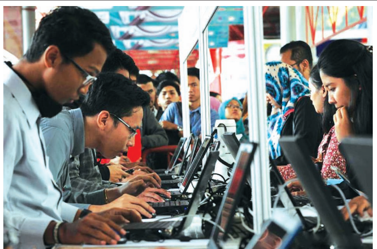
Job seekers fill in online application to meet prospective employers at Job Fair 2014 held by Indonesia's Ministry of Manpower and Transmigration at JIEXPO Kemayoran in Jakarta, capital of Indonesia on 5 Sept, 2014. Job Fair 2014, held from on 5 to 6 Sept, supports government programmes in reducing the number of the unemployed and facilitate job seekers to find a job.