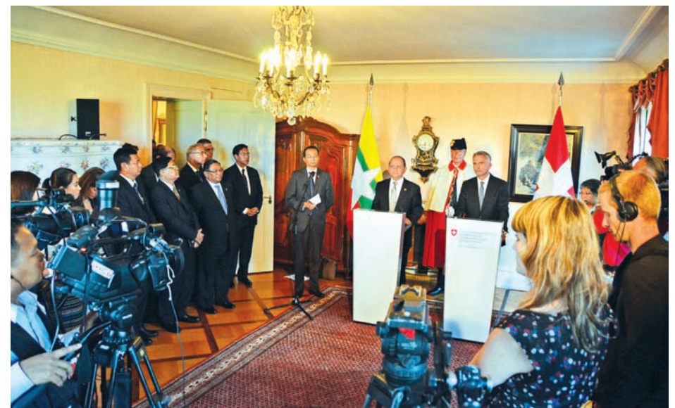
President U Thein Sein and Swiss President hold a joint press conference on the first floor of Salon Churchill.