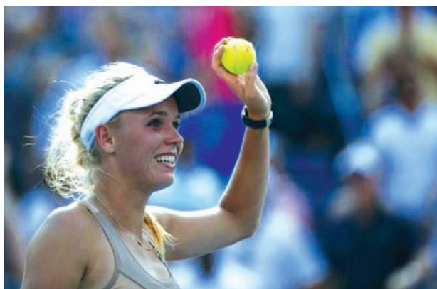
Caroline Wozniacki of Denmark celebrates after winning her semi-final match against Peng Shuai of China after Shuai had to retire due to an injury at the 2014 US Open tennis tournament in New York on 5 Sept, 2014.