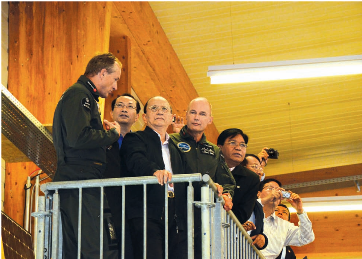
President U Thein Sein and party looking at a solar-powered plane at Payerne Air Base in Bern, Switzerland during his 10-day official visit to three countries of Western Europe.

BERN, 6 Sept — President U Thein Sein and party observed a solar-powered plane at Payerne Air Base in Bern, Switzerland on Saturday morning.