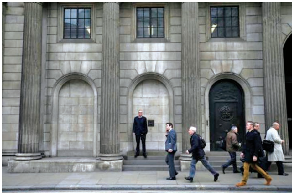
A man smokes a cigarette outside The London Stock Exchange on 11 Nov, 2013.

A weak US jobs report reassured investors the