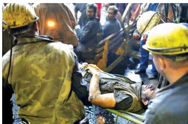
Coal miners carry out a fellow miner who was injured while he was trapped in Raspotocje coal mine in Zenica on 5 Sept, 2014.

Some relatives criticised the mine management, particularly for saying initially that only eight