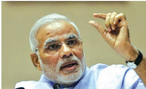
Prime Minister Narendra Modi speaks during the launch of the Jan Dhan Yojana, or the Scheme for People's Wealth, in New Delhi on 28 Aug, 2014.

NEW DELHI, 6 Sept — Narendra Modi took decisive action as chief minister of Gujarat to secure round-the-clock supplies of electricity. Now, as prime minister of India, he is under attack for failing to avert a national power crisis.