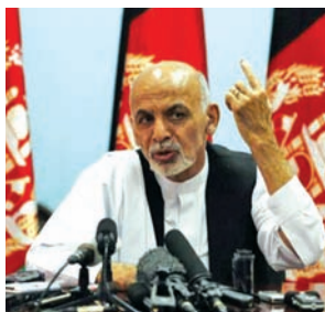
Afghan presidential candidate Ashraf Ghani Ahmadzai speaks with the media in Kabul on 12 Aug, 2014.

KABUL, 6 Sept — A UN-supervised audit of votes in Afghanistan's disputed presidential election has finished, an Afghan electoral official said on Friday. The audit of the 14 June run-off election was part of a US-brokered deal to defuse escalating tension in a ballot intended to mark the country's first democratic transfer of power.