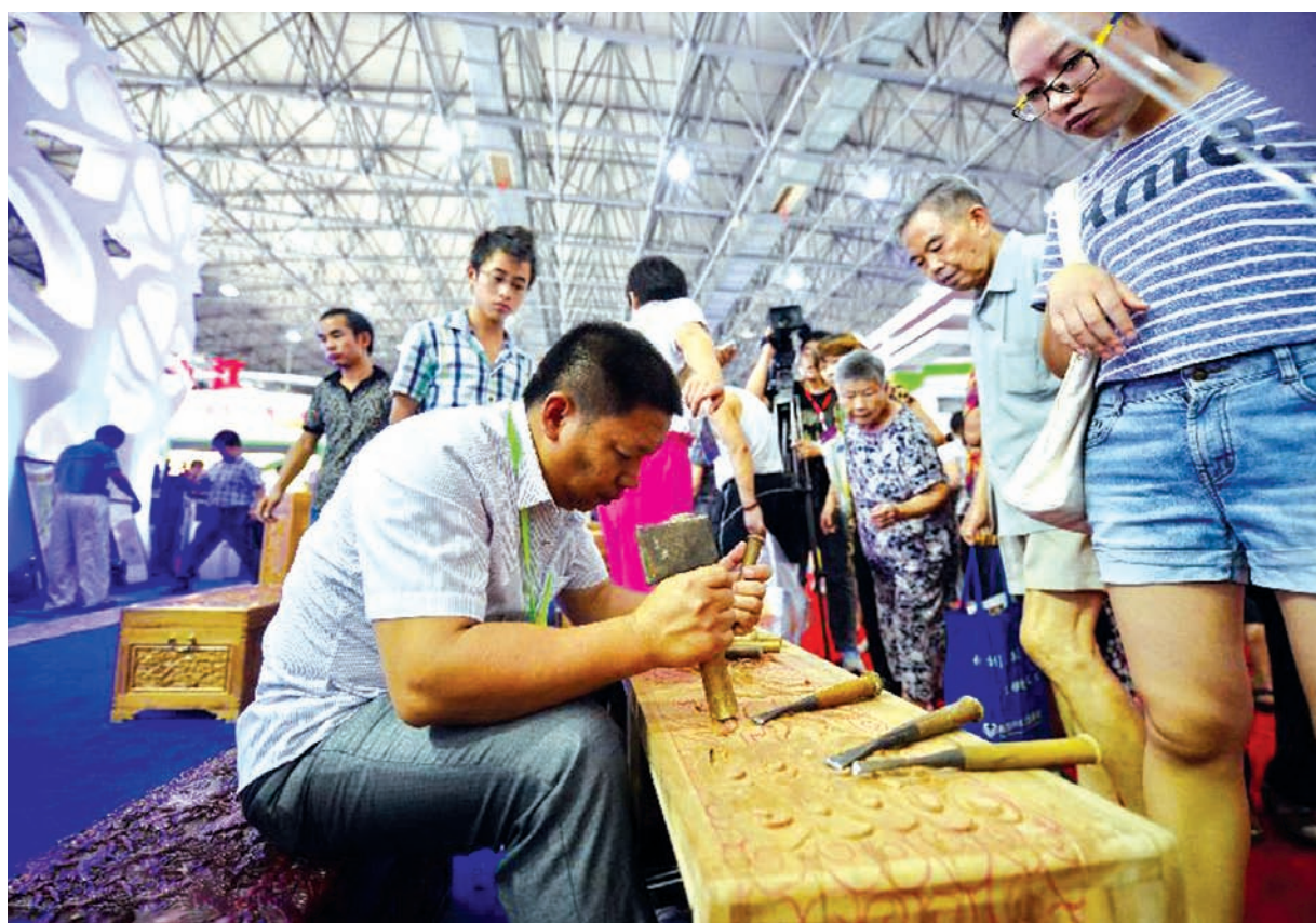
Visitors watch Yujiang woodcarving during the Jiangxi Tourism Product Fair in Nanchang, capital of east China's Jiangxi Province on 5 Sept, 2014. The three-day fair, which kicked off on Friday, presented more than 3,000 items of Chinese tourism commodities, including 38 intangible cultural heritage items in Jiangxi.