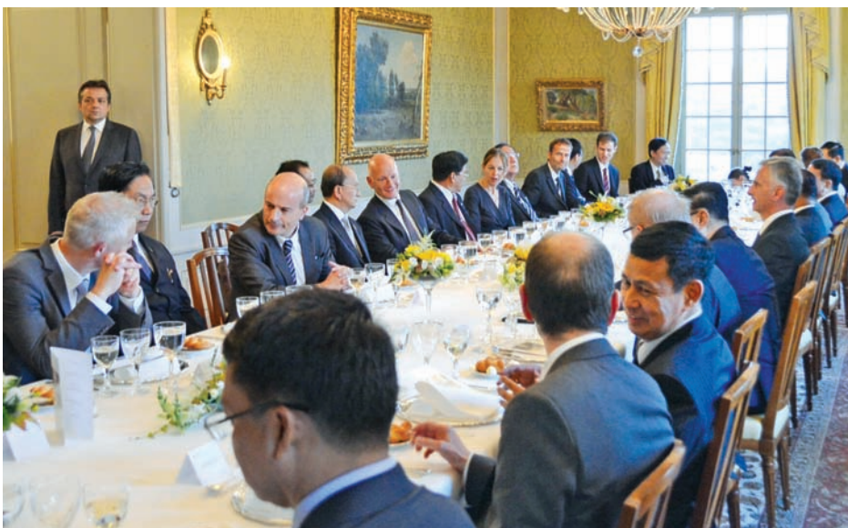
Swiss president hosts a state dinner for President U Thein Sein, government dignitaries and high-ranking officials.