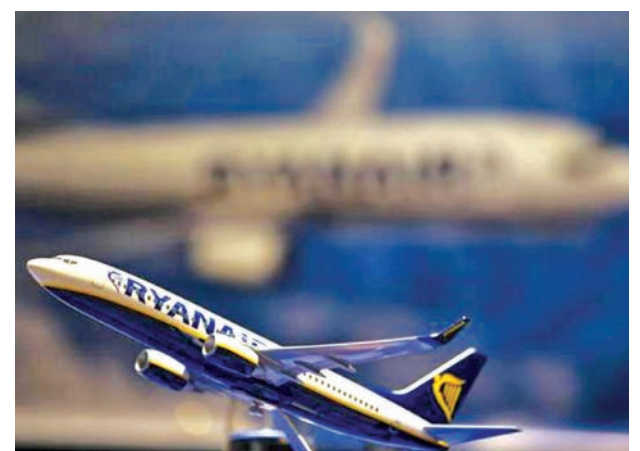
A model airplane rests on a table during an announcement of the commitment for Ryanair to purchase aircraft from Boeing, in New York on 19 March, 2013.