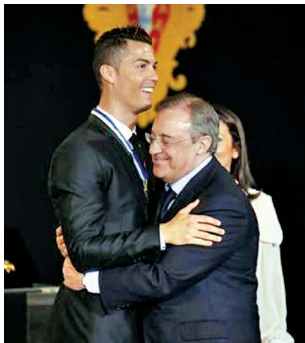
Portugal's soccer team captain Cristiano Ronaldo hugs with Real Madrid's President Florentino Perez (R) after receiving the Ordem do Infante Dom Henrique in Lisbon on 20 Jan, 2014.

MADRID, 6 Sept — Real Madrid president Florentino Perez sought to play down an apparent spat with Cristiano Ronaldo on Friday as he announced the La Liga club's income had surged above 600 million euros (477.04 million British pound) in 2013-14.