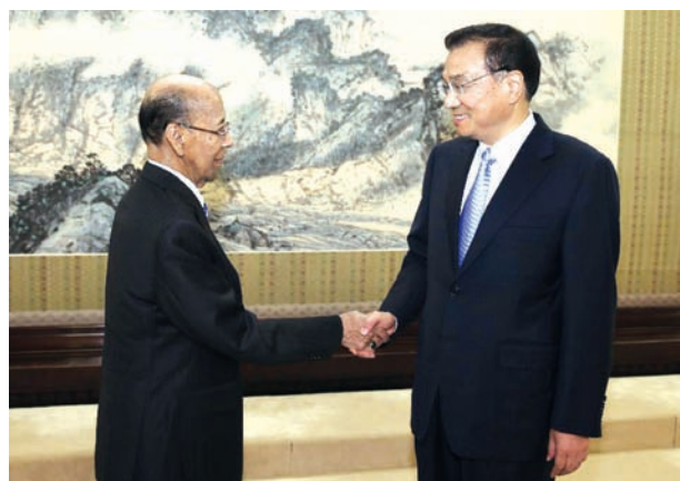
Chinese Premier Li Keqiang (R) meets with Malaysian Supreme Head of State Abdul Halim Mu'adzam Shah in Beijing, capital of China, on 5 Sept, 2014.

for assistance in searching the flight and vowed to keep in close communication with the Chinese side.