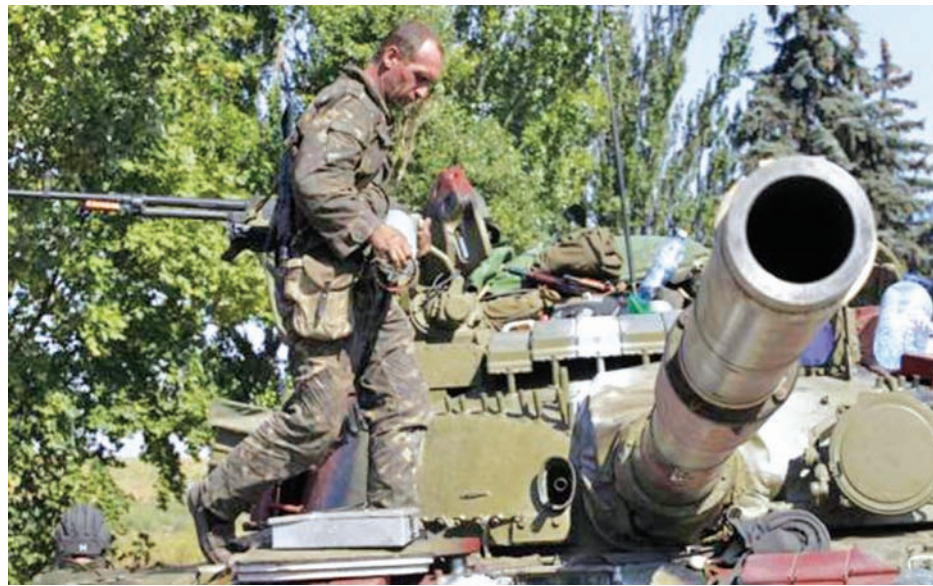
A Ukrainian serviceman loads a shell onto a tank at a checkpoint in the southern coastal town of Mariupol on 5 Sept, 2014.

al Ban Ki-moon on Friday welcomed the truce deal, encouraging all parties to “display good will and take concrete steps toward urgent, full and effective implementation.”