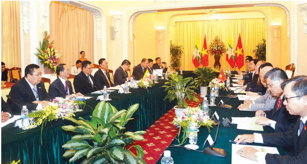
Thura U Shwe Mann, Speaker of the Pyidaungsu Hluttaw and Pyithu Hluttaw (Lower House) and Vietnam's National Assembly Chairman Nguyen Sinh Hung hold talks on enhancement of friendly relations between the two countries.

NAY PYI TAW, 6 Sept — Thura U Shwe Mann, Speaker of the Pyidaungsu Hluttaw and the Pyithu Hluttaw (Lower House) left Yangon on Friday for Vietnam on an official visit at the invitation of Vietnam's National Assembly Chairman Nguyen Sinh