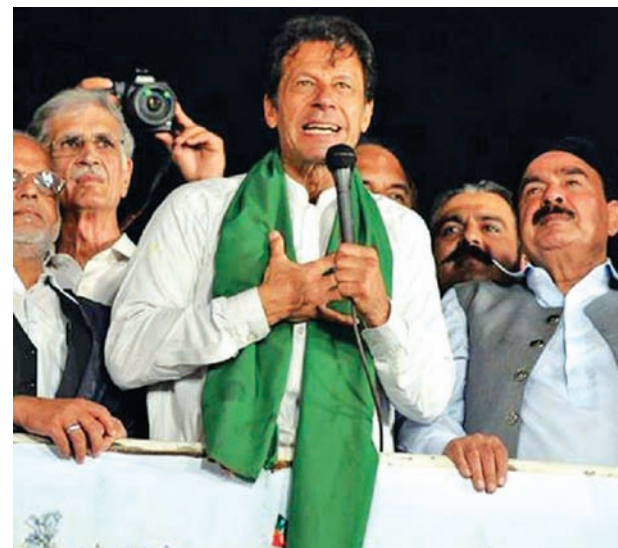
Leader of Pakistan Tehrik-e-Insaf party Imran Khan (C) addresses supporters during an anti-government protest near the prime minister's residence in Islamabad, capital of Pakistan on 5 Sept, 2014.

He said the country has suffered huge economic and diplomatic losses. Important visits by foreign dignitaries could not materialize due to protests. He said Moody's, a rating agency, has said that Pakistan's rating could go down if political instability persists. Both sides have already held several rounds of talks, but the process could not make any progress due