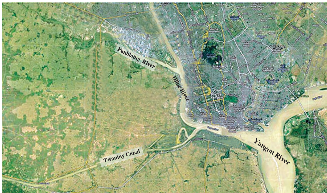
A satellite map of Yangon City and its satellite areas where a new town project will be implemented.

Those women under-18 years of age who want to join the contest are to send a SMS message to 18877 number of the company's head office in Yangon and they may type (See page 3)