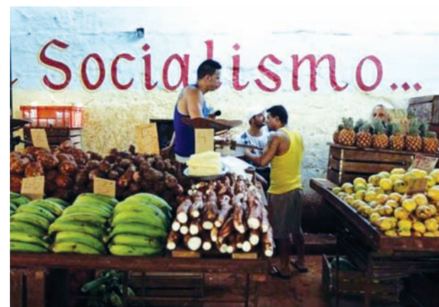
Vendors wait for customers at their stalls, with prices tagged in Cuban pesos, at a market in Havana on 23 Oct, 2013.