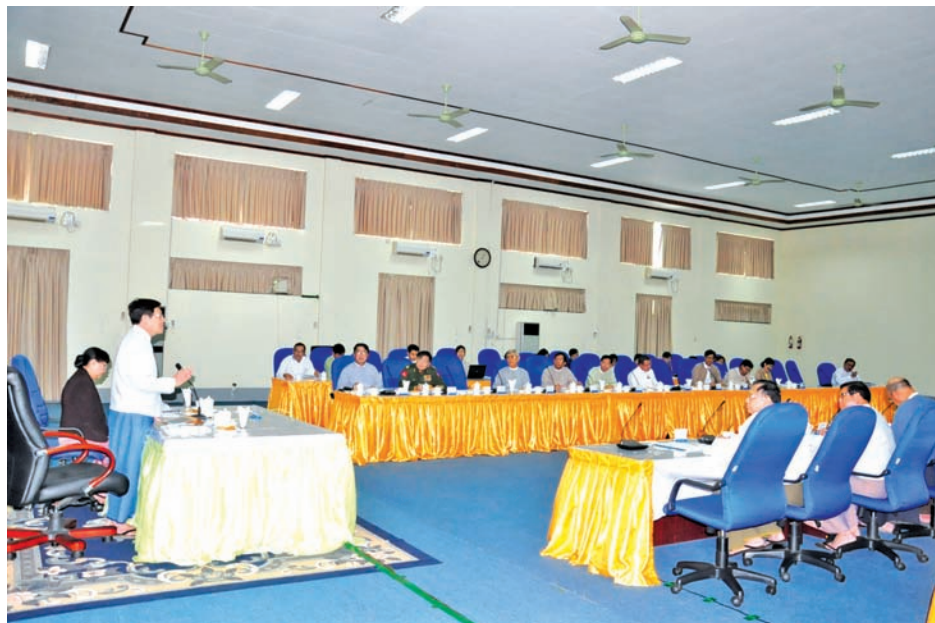
Union Minister at the President Office U Tin Naing Thein and Union Minister for Education Dr Daw Khin San Yi meet with departmental officials in discussing autonomy of universities.—MNA

NAY PYI TAW, 2 Sept—The Ministry of Education on Tuesday discussed the higher education bill here, aimed at increasing auton-