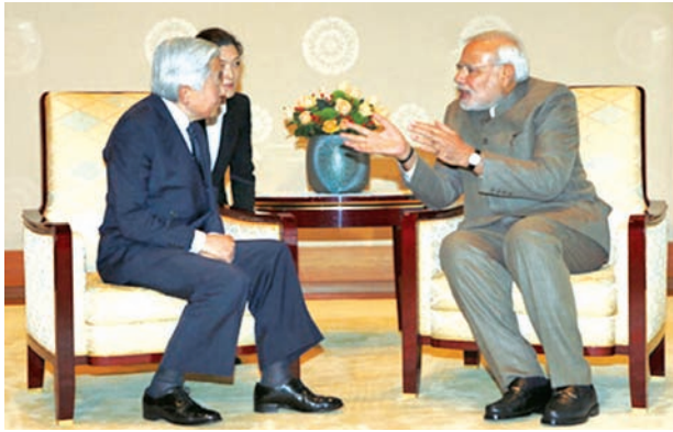
Indian Prime Minister Narendra Modi (R) meets with Japan's Emperor Akihito on 2 Sept, 2014, at the Imperial Palace in Tokyo. Modi agreed with Prime Minister Shinzo Abe the previous day to strengthen bilateral security relations and set a target of doubling Japanese investment in India within five years.

The emperor and empress visited India from late November to early December at the invitation of the Indian government to commemorate the 60th