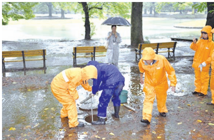
Workers remove water from a spray pond at Yoyogi Park in Tokyo on 1 Sept, 2014, to curb mosquito emergence with the total number of dengue fever patients in Tokyo exceeding 20 as the first domestic infection in Japan since 1945.

35 mosquitoes on the evening of 26 August and the following morning, but none were found to carry the dengue fever virus.