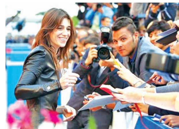
Cast member Charlotte Gainsbourg signs autographs during the red carpet for the movie "Nymphomaniac II" at the 71st Venice Film Festival 1 Sept, 2014.