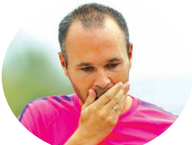
Barcelona's soccer player Andres Iniesta