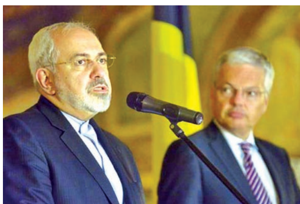
Belgium's Foreign Minister Didier Reynders (R) and his Iranian counterpart Mohammad Javad Zarif hold a news conference after a meeting at the Egmond Palace in Brussels on 1 Sept, 2014.

BRUSSELS, 2 Sept — Iranian Foreign Minister Mohammad Javad Zarif voiced optimism after talks with European Union foreign policy chief Catherine Ashton on Monday that a dispute over Teheran's nuclear programme can be resolved by a 24 November deadline.