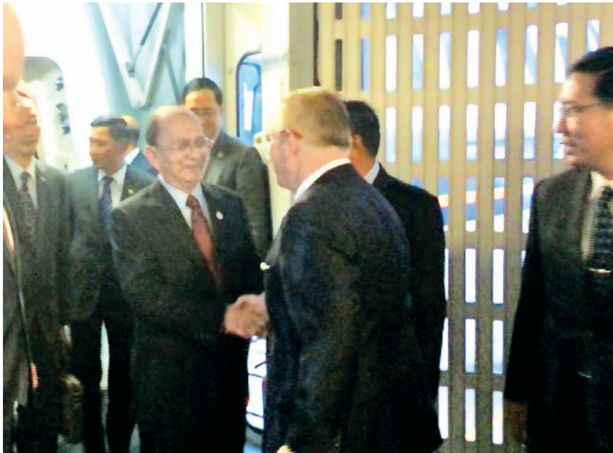
Myanmar President U Thein Sein being welcomed by the German Ambassador to Myanmar and officials at Frankfurt International Airport in Germany.