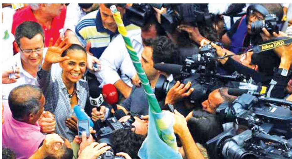
Presidential candidate Marina Silva of Brazilian Socialist Party (PSB) waves to the crowd as she attends a rally campaign at Rocinha slum in Rio de Janeiro on 30 Aug, 2014.

Silva, 56, has struggled during her political career to recruit and maintain allies, having quit two parties since