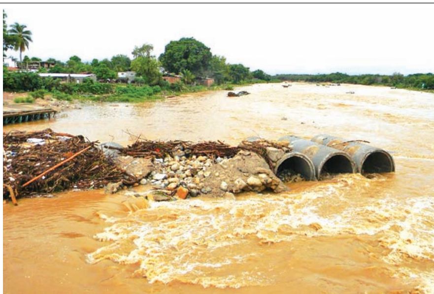
The river is flooding in El Ticui community of the municipality of Atoyac de Alvarez, Guerrero, Mexico, on 1 Sept, 2014. The strong rainfalls registered in the Guerrero's coast in recent days, have caused floodings in the fields and houses of four localities, and the collapse of a temporary bridge due to the strong stream of the river, according to the local press.

FORECAST VALID UNTIL EVENING OF THE 3rd September, 2014: Rain or thundershowers will be isolated in Sagaing and Magway Regions, Kachin State, scattered in Mandalay, Shan, Chin and Kayah States, fairly widespread in Rakhine State and widespread in the remaining Regions and States with likelihood of isolated heavy falls in Bago and Taninthayi Regions, Kayin and Mon States. Degree of certainty is (100%).