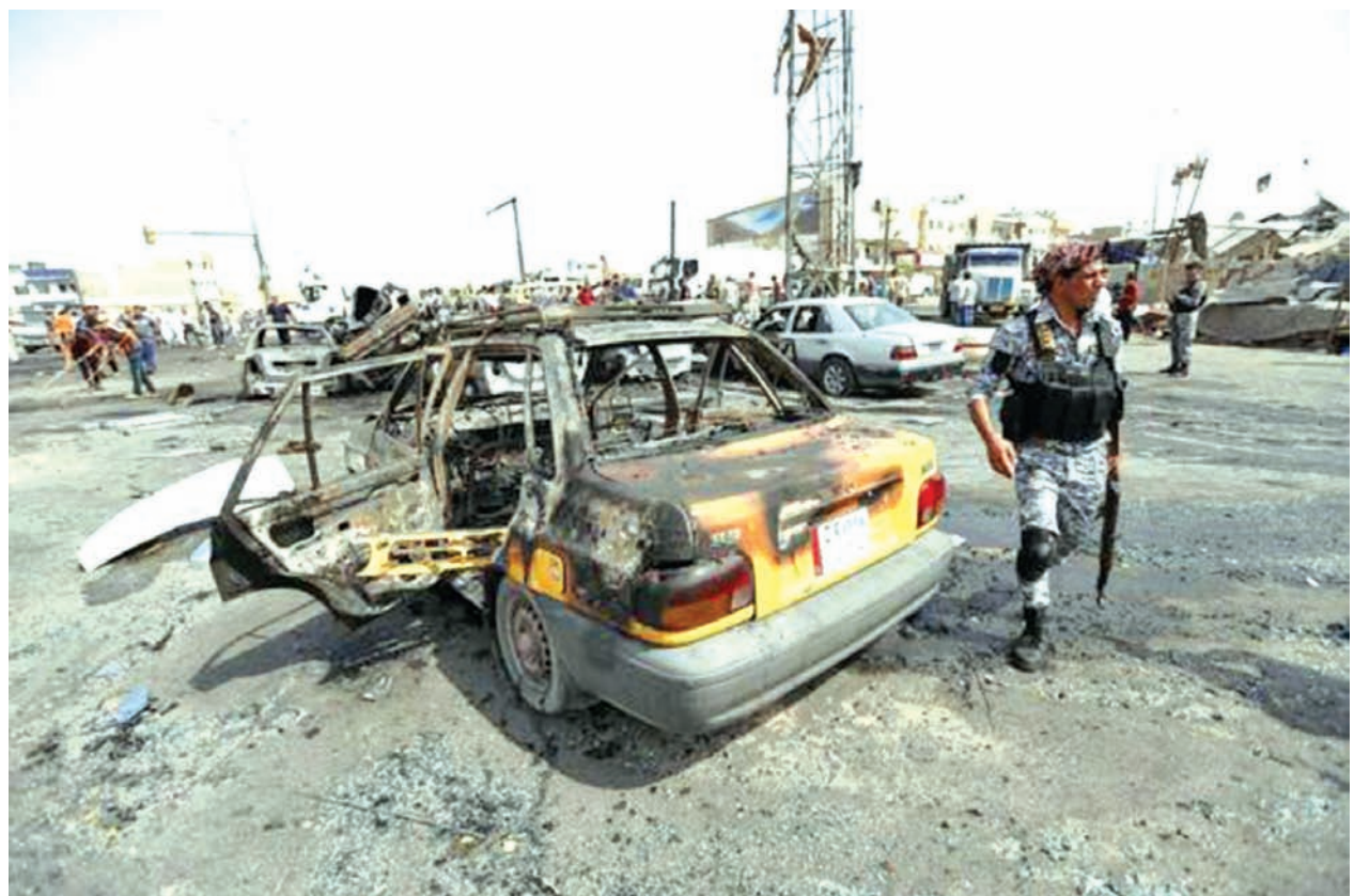
A member of the Iraqi security forces walk at the site of a car bomb attack in the New Baghdad neighbourhood on 26 Aug, 2014.