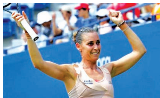
Flavia Pennetta of Italy celebrates her win over Casey Dellacqua of Australia at the 2014 US Open tennis tournament in New York on 1 Sept, 2014.

Williams will meet Italian 11th seed Flavia Pennetta, a semi-finalist last year who advanced with a 7-5, 6-2 win against 29th-seeded Australian Casey Dellacqua.—Reuters