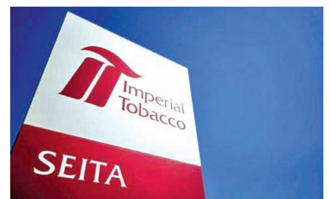
View of a sign outside the Imperial Tobacco Seita cigarette plant in Carquefou, near Nantes, on 15 April, 2014.

Mandated lead arrangers joining the financing were BBVA, Bank of America Merrill Lynch, Bank of China, Barclays Bank, Commerzbank, Credit Agricole CIB, HSBC Bank, Intesa Sanpaolo, Mizuho Bank, Sumitomo