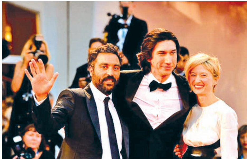
Director Saverio Costanzo, actor Adam Driver and actress Alba Rohrwacher (from L to R) pose on the red carpet for "Hungry Hearts" which is selected for the main competition during the 71th Venice Film Festival, in Lido of Venice, Italy on 31 Aug, 2014.

VENICE, (Italy), 2 Sept—Hungry Hearts, a film presented on Monday at the ongoing Venice Film Festival, has impressed the audience with a story that reflects the obsessive fears of the present society.