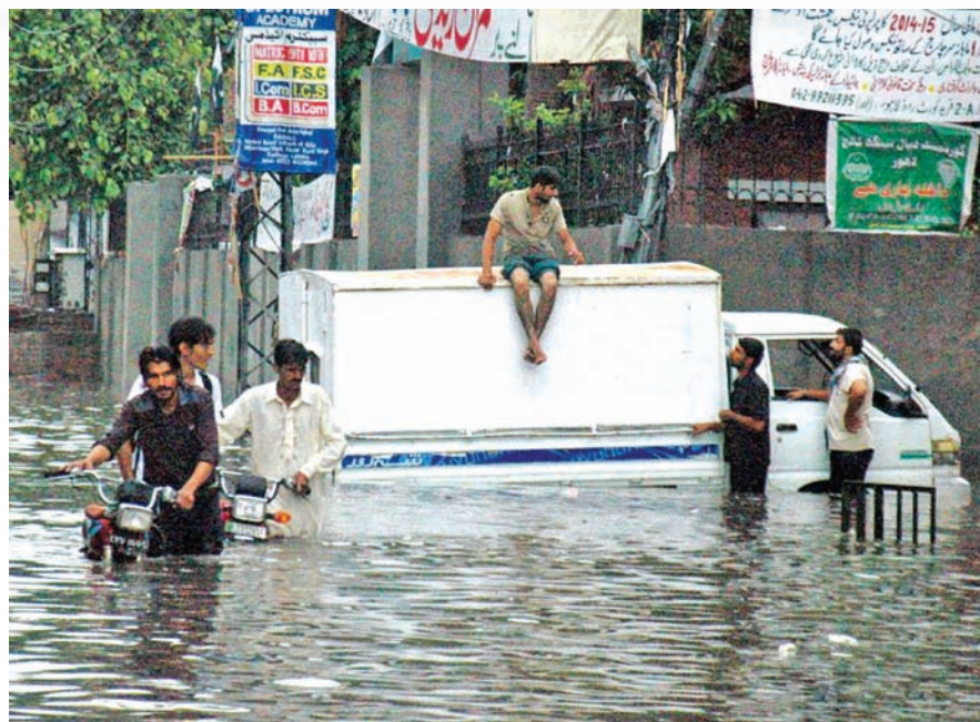
Pakistani men cross a flooded street after heavy rain in eastern Pakistan's Lahore on 1 Sept, 2014.

The team is to train from Tuesday to Thursday at the campus of the Florida Atlantic University, and spend Friday on a familiarization tour of the stadium. —Xinhua