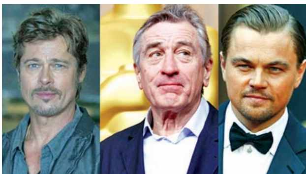
Oscar-winning director Martin Scorsese has recruited Leonardo DiCaprio, Brad Pitt and Robert De Niro to star in a short film for a new resort campaign.

LONDON, 2 Sept—Oscar-winning director Martin Scorsese has recruited Leonardo DiCaprio, Brad Pitt and Robert De Niro to star in a short film for a new resort campaign.