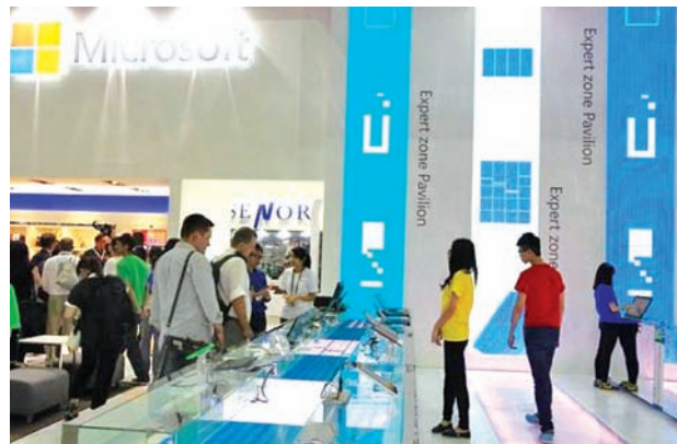
People visit the Microsoft booth during the 2014 Computex exhibition at the TWTC Nangang exhibition hall in Taipei on 3 June, 2014.