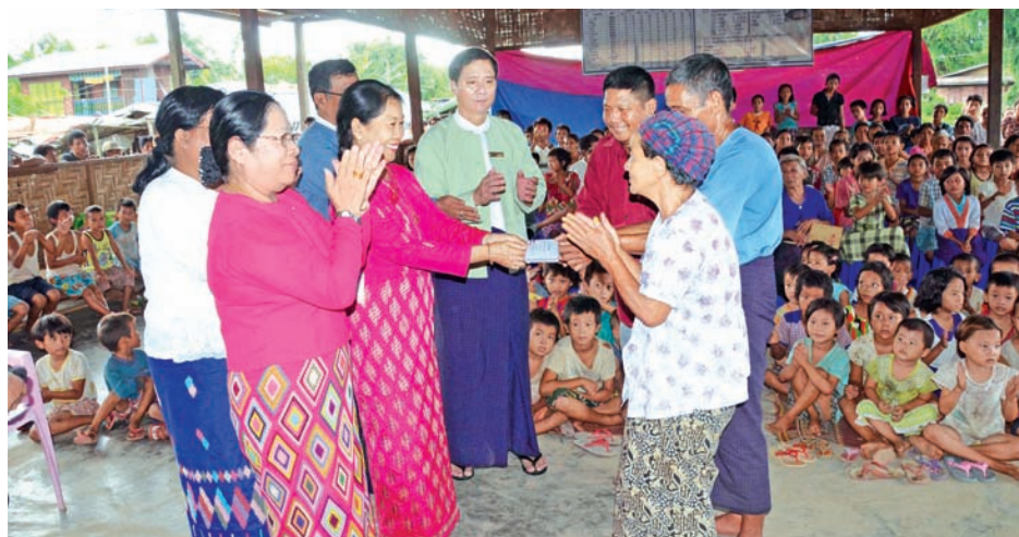
Union Minister Dr Daw Myat Myat Ohn Khin presents assistance to victims of relief camps in Kachin State.

NAY PYI TAW, 2 Sept—Government departments, peace groups and people are to join hands in improving livelihoods of the internally displaced persons in Kachin State where the peace will be made eternally, Union Minister for Social Welfare, Relief and Resettlement Dr Daw Myat Myat Ohn Khin said at the ceremony to provide cash assistance to the IDPs and volunteer organizations on 31 August.