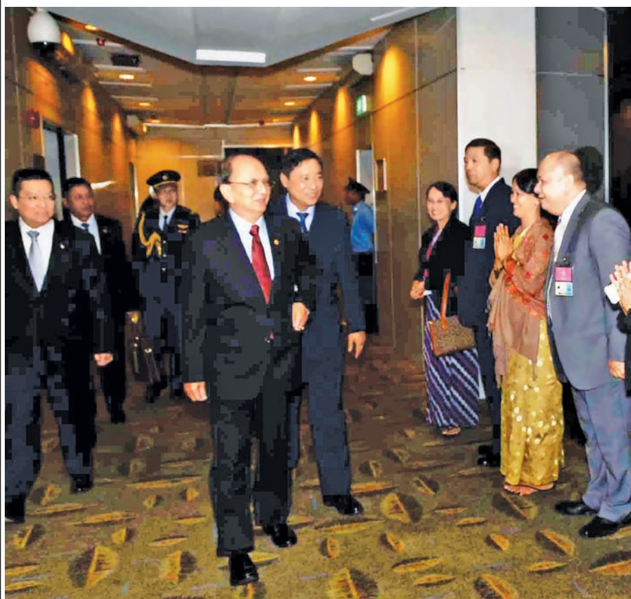
President U Thein Sein and party being welcomed at Changi International Airport of Singapore by Myanmar Ambassador U Htay Aung and officials on 1 September. (News on page 1)—MNA