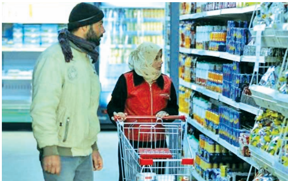
Syrian refugees shop in a hypermarket after receiving their humanitarian aid shopping vouchers at al-Zaatari refugee camp in the Jordanian city of Mafraq, near the border with Syria, on 6 Feb, 2014.

That ended more than a year of aid paralysis caused by Damascus denying permission for UN