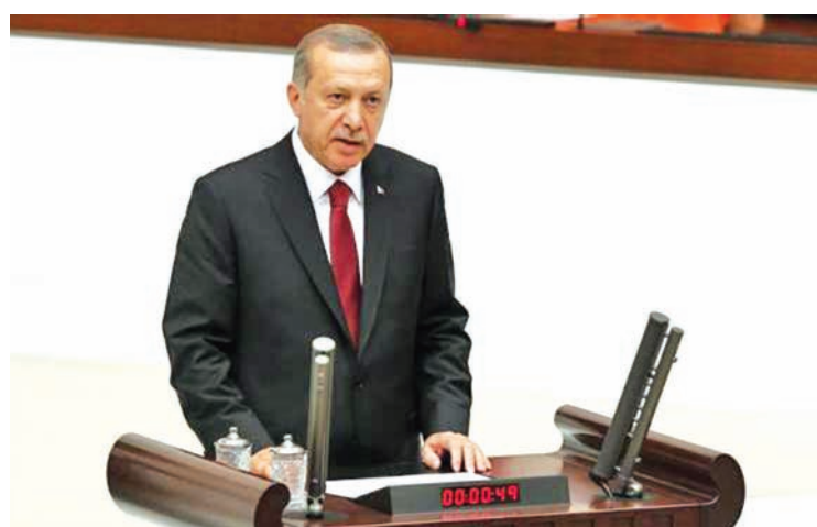
Turkey's new President Tayyip Erdogan attends a swearing in ceremony at the parliament in Ankara on 28 Aug, 2014.

Neither Erdogan nor new Prime Minister Ahmet Davutoglu attended the ceremony, contrary to past practise. Erdogan stormed out of a similar ceremony in May