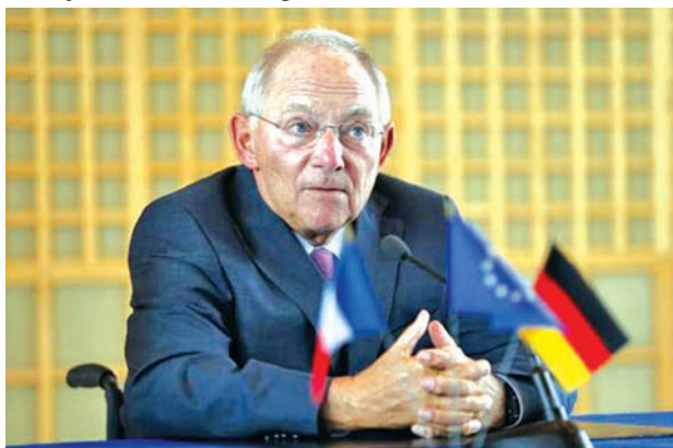
German Finance Minister Wolfgang Schaeuble attends a news conference at the Bercy Finance Ministry in Paris, on 28 Aug. 2014.