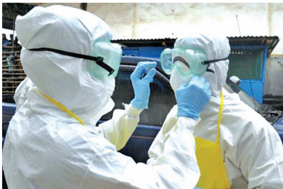
Health workers wearing protective clothing prepare themselves before to carrying an abandoned dead body presenting with Ebola symptoms at Duwala market in Monrovia on 17 Aug. 2014.