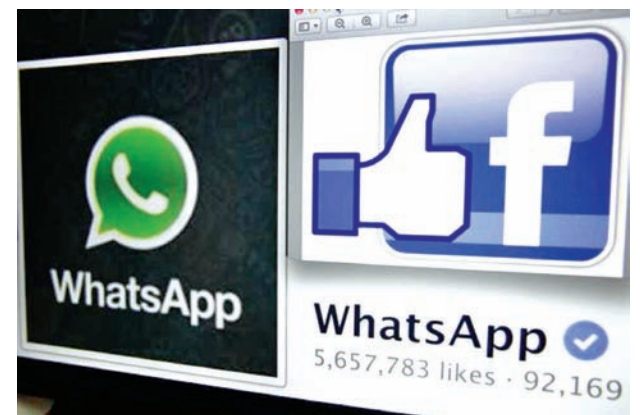
Illustration photo shows "likes" on WhatsApp's Facebook page displayed on a laptop screen in Paris on 20 Feb, 2014.

"If negative, please explain why and what kind of negative impact (for example price increase, deter-