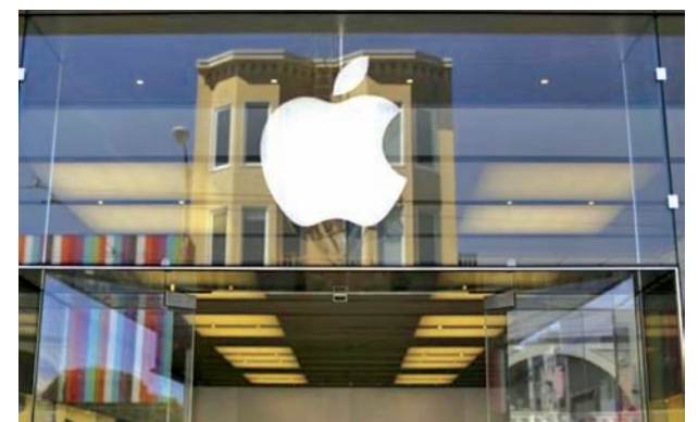
The Apple logo is pictured on the front of a retail store in the Marina neighborhood in San Francisco, California on 23 April, 2014.