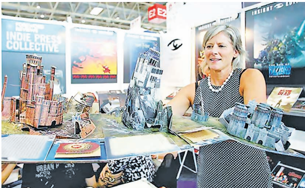
A 3-D book catches visitors' attention at the Beijing International Book Fair.

The book fair owes its success in part to the "going-out" project, in which items are introduced overseas with national support. The going-out aspect of the publishing business exceeded 23 million items and more than $104 million in exports last year, according to administration statistics. —Xinhua