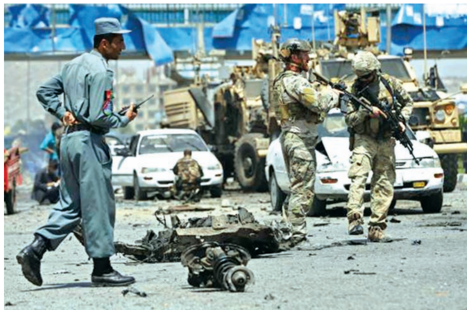
NATO troops investigate at the site of a suicide car bomb attack in Kabul on 10 Aug, 2014.

NATO diplomats were left guessing for weeks about who would represent Afghanistan at the summit. In the absence of a new president, outgoing President Hamid Karzai is staying away, leaving Defense