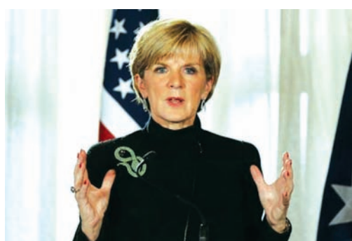
Australian Foreign Minister Julie Bishop speaks during a joint news conference with Australian Defence Minister David Johnston, US Secretary of State John Kerry and US Secretary of Defence Chuck Hagel (not pictured) at the conclusion of the AUSMIN meeting at Admiralty House in Sydney on 12 Aug, 2014.